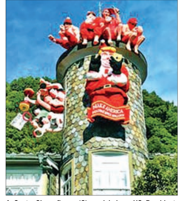
A Santa Claus figure (C) modeled on US Presidentelect Donald Trump playing a game on a smartphone, along with other figures mimicking newsmakers in 2016, decorate "Uroko no le" (House of Fish Scales), a Western-style house museum in the historical Kitano district of Kobe, Hyogo Prefecture, on 25 November 2016.

The figures will remain on display through 25 December. -Kyodo News