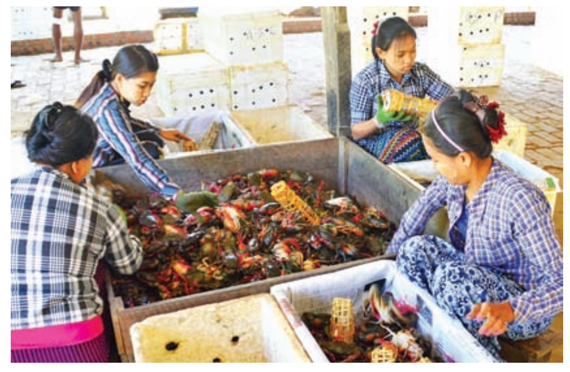
Crabs being picked to transport to Muse.

road killed 30 per cent of total crabs being sent from Mandalay to Muse. A truck is normally loaded with over 100 baskets of crabs weighing 2,600 kilos.