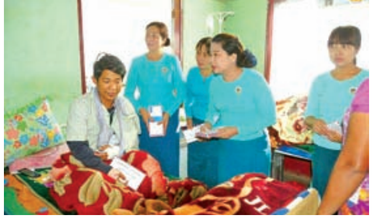
Responsible personnel present cash assistance to a civilian receiving medical care at the hospital.

A ceremony to provide cash for people who have sustained injuries during the fighting in Shan State (North) was held in a ward at Muse Hospital yesterday afternoon, according to the Information Committee of the State Counsellor's Office.