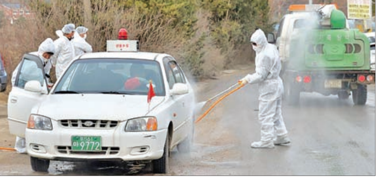
South Korean health officials disinfect a vehicle to prevent spread of bird flu in Pocheon, South Korea, on 23 November

Printed and published at the Global New Light of Myanmar Printing Factory at No.150, Nga Htat Kyee Pagoda Road, Bahan Township, Yangon, by the Global New Light of Myanmar Daily under Printing Permit No. 00510 and Publishing Permit No. 00629.