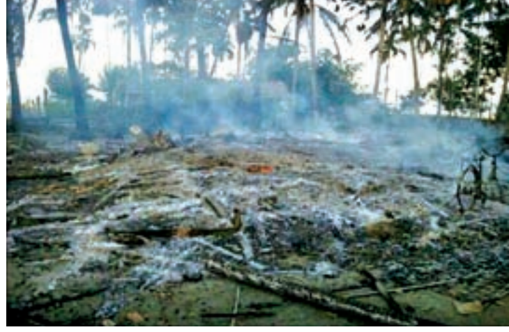
The fire in Norular Village totally destroys a house in the village.

police forces from Norular police outpost called to inform the head of the village named Maujibul Rakaman to collectively extinguish the fire, but no one extinguished the fire. Thanks to timely action to extinguish, the fire did not spread to other houses. The arson destroyed only one human dwelling, it is learnt.—Myanmar News Agency