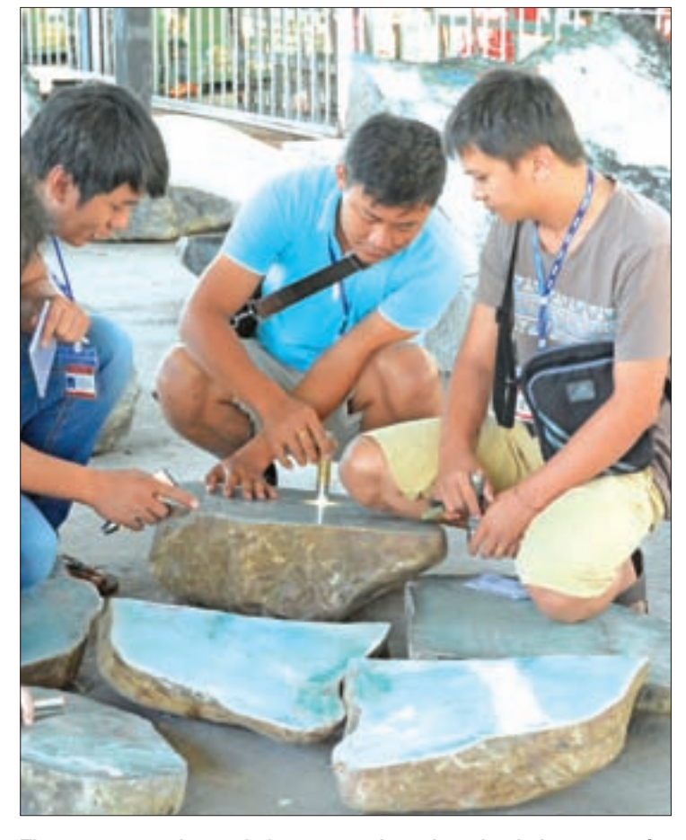
The gems merchants being seen observing the jade stones for appraisal.

The jade lots ranging from No.3601 to No.4800 will continue to be sold on 26th November, it is learnt.— Myanmar News Agency