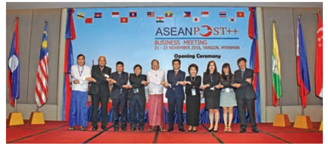
Union Minister U Thant Zin Maung and representatives of ASEAN countries pose for photo.

THE ASEANPOST++ Business Meeting was held at Hotel Novotal in Yangon on Tuesday morning.