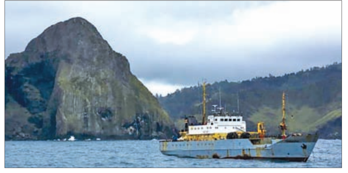
A Russian vessel is seen off the coast of the Southern Kurile Island of Shikotan in 2015.