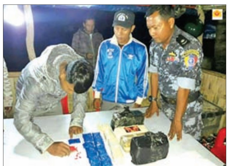
Security forces checking the drugs seized.