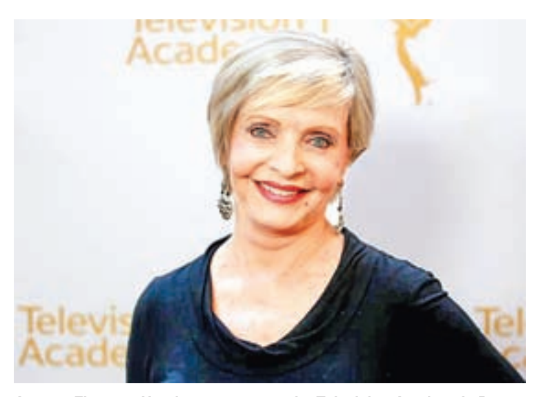
Actress Florence Henderson poses at the Television Academy's Performers Peer Group cocktail reception to celebrate the 66th Primetime Emmy Awards in Beverly Hills, California, in 2014.

But it was the 1969 premier of "The "Brady Bunch," among the first US television shows to focus on a non-traditional family, that made her a household name.