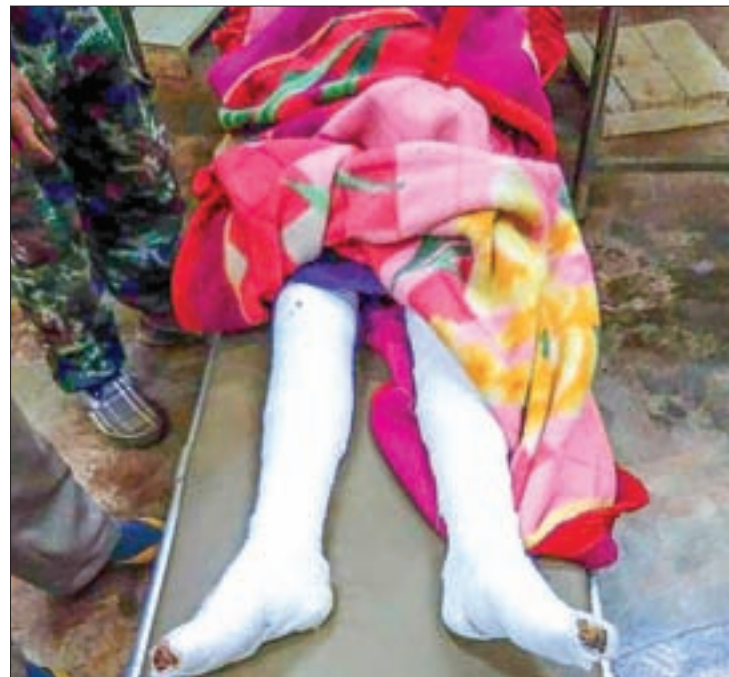
A man wounded in the explosion seen on a stretcher.

Ye Lin Oo succumbed to wounds sustained during the explosion. Those who were wounded continue to be treated in hospital. —Township IPRD