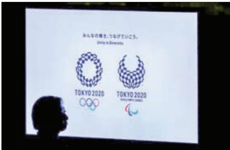
A woman is silhouetted against a monitor showing Tokyo 2020 Olympics and Paralympics emblems during the Olympic and Paralympic flag-raising ceremony at Tokyo Metropolitan Government Building in Tokyo, Japan, on 21 September 2016.