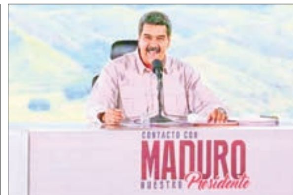
Venezuela's President Nicolas Maduro speaks during his weekly broadcast "En contacto con Maduro" (In contact with Maduro) in La Victoria, Venezuela, on 20 November 2016.

Heredia, the co-founder and president of Humala's Nationalist Party of Peru, was once widely seen as having a bright political future, possibly as president. But she faced constant criticism for playing an influential role in Humala's government, which left office in July with low approval ratings.—Reuters