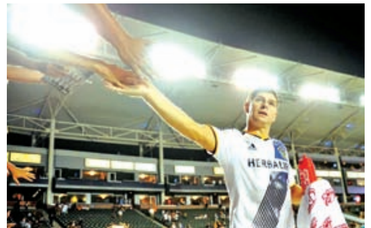
Los Angeles Galaxy midfielder Steven Gerrard.

He has been linked with a return to Anfield in a coaching capacity. —Reuters