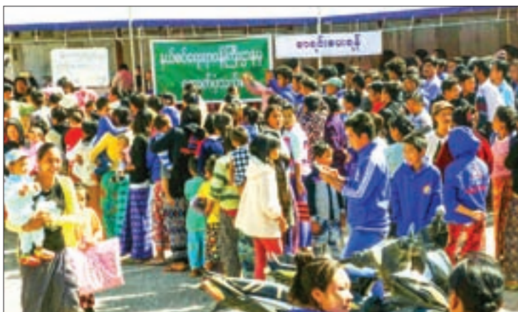
Internally displaced persons gather to collect aids by Ministry of Border Affairs.

The IDPs are taking shelter in Mahawun (North) Monastery, Zetawun Meditation Monastery, Aung Mingalar Monastery, Namkhun Monastery, Homon Baptist Church, Saint Peter’s Church, Gurkha Youth Welfare Association, BEHS (2) and BEMS (4). Healthcare services are also being provided.— Myanmar News Agency