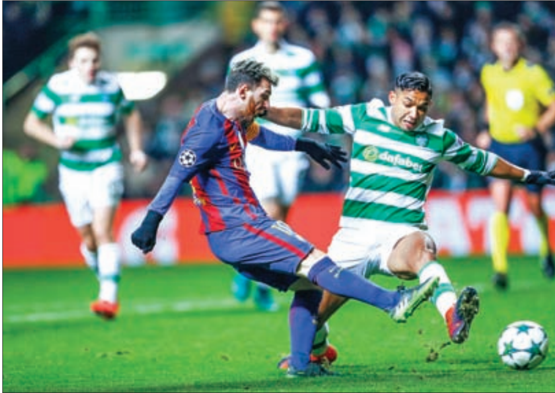
Barcelona's Lionel Messi in action with Celtic's Emilio Izaguirre during UEFA Champions League Group Stage, Group C, at Celtic Park, Glasgow, Scotland, on 23 November 2016.

GLASGOW — The dazzling Lionel Messi returned from illness to score yet another double to help Barcelona ease into the knockout stages of the Champions League for a 13 th successive year with their 2-0 win at Celtic on Wednesday.