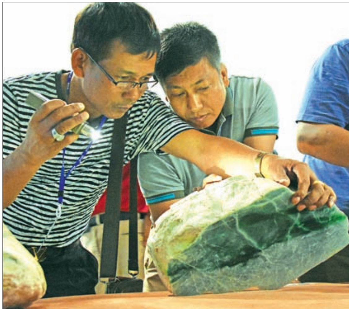
Merchants appraising a jade stone at the Mid-Year Gems and Jewellery Emporium 2016.