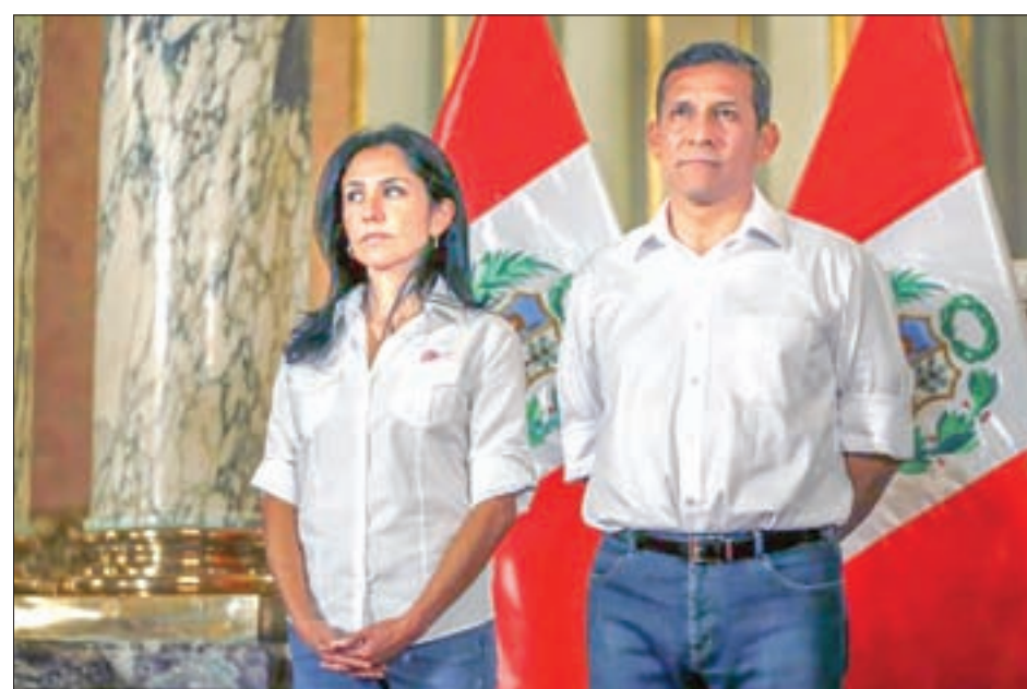
Peru's then President Ollanta Humala (R) and his wife Nadine Heredia attend a ceremony at the Government Palace in Lima, Peru in 2015.

"I have given new tasks to comrade Eulogio Del Pino so that in the next few days he goes to Russia to finish the agreement with Russia, the non-OPEC nations and OPEC," Maduro added.—Reuters