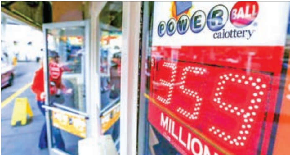
The Powerball jackpot is displayed at an ampm convenience store in Pasadena, California US, on 21 November 2016.

states, the District of Columbia, Puerto Rico and the US Virgin Islands. Players can either buy $2 tickets using their own numbers or have them randomly generated by a computer. If a single winner claims the jackpot on Wednesday’s drawing, they would receive $359 million over 30 years or $219.6 million in a lump sum payment, before taxes. The largest ever lottery prize of $1.6 billion was split between three winning tickets in January. It is one of several games run by the Multi-State Lottery Association, a non-profit owned and operated by member states’ lotteries. The Mega Millions lottery, also offered by the association, produced the country’s second-largest-ever prize, worth $656 million, in a 2012 drawing.—Reuters