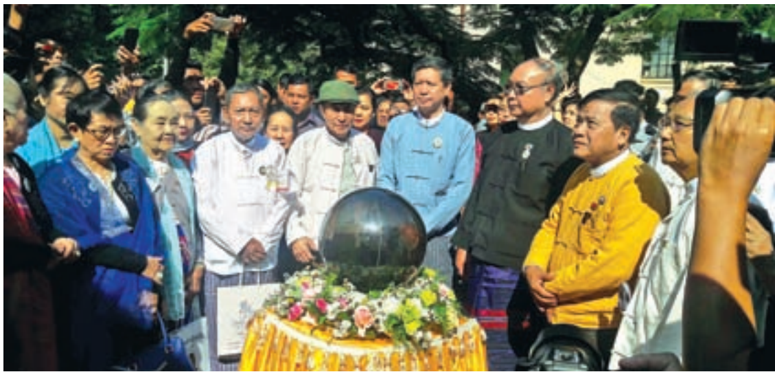
Speaker Mahn Win Khaing Than and Union Minister for Education Dr Myo Thein Gyi attend ceremony to open bronze statue of U Razak outside the Razak Hall of Mandalay University.