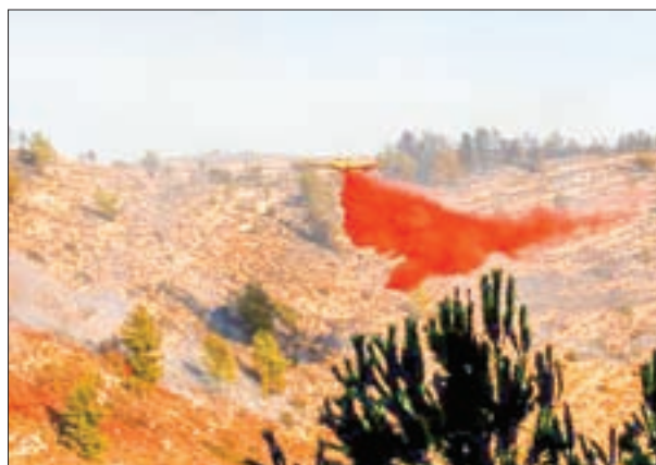
A firefighting plane drops fire retardant during a wildfire, near the communal settlement of Nataf, close to Jerusalem, on 23 November 2016.