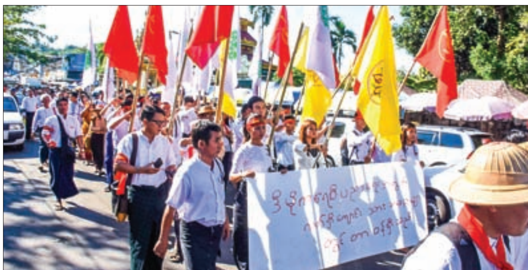
Students march in commemoration of 96th Anniversary National Day.