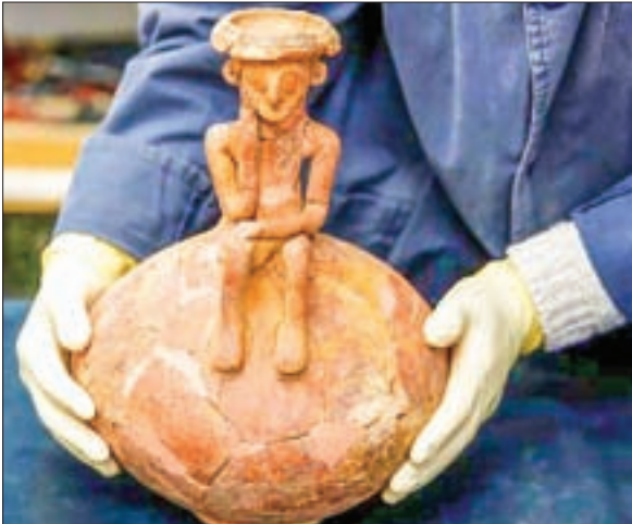
Journalists are shown a 3,800 year-old pottery jug with a rare statuette, discovered during excavation in central Israel, at the Israel Antiquities Authority offices in Jerusalem, on 23 November 2016.

the excavation, which included teenage diggers. The statuette is about 18 cm (7 inches) tall. “One can see that the face of the figure seems to be resting on its hand as if in a state of reflection,” he said. Other vessels and metal items were found such as daggers, arrowheads, an axe head, sheep bones and what are believed to be the bones of a donkey. Itach said the collection seemed to be funeral offerings, likely of an important member of an ancient community. “To the best of my knowledge such a rich funerary assemblage that also includes such a unique pottery vessel has never before been discovered in the country,” he said.—Reuters