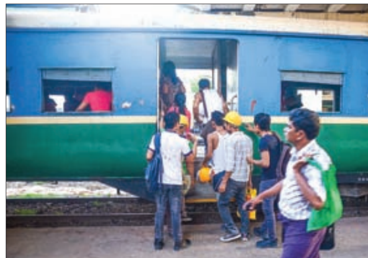
Passengers are getting onto a circular train at a station in Yangon, on 19 November 2016.

Part of the plan has already come to fruition in the form of a new night market by the Yan-