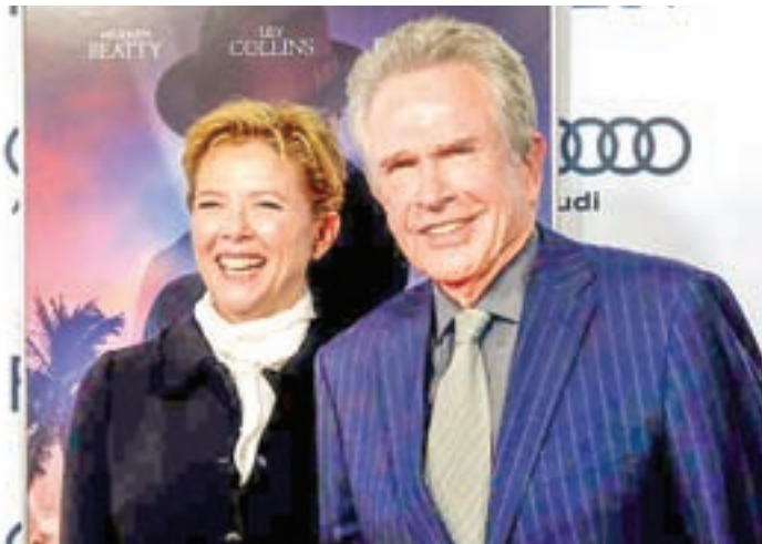
Producer/director Warren Beatty and cast member Annette Bening arrive at the premiere of 'Rules Don't Apply' during the opening night of AFI FEST 2016 in Hollywood, California, US, on 10 November 2016.

Beatty, the Oscar-winning director of "Reds" and star of 1967's "Bonnie and Clyde," has said the "Rules" movie has been on his mind for years.