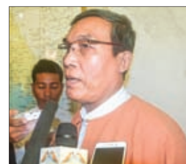
Rakhine State Chief Minister U Nyi Pu.