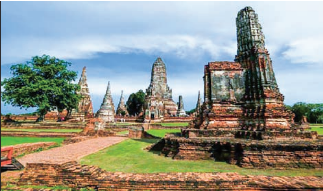
A view shows the ruins of the ancient city of Ayutthaya, Thailand, on 14 July 2016.

“Half the island is protected as a historic park and is also a world heritage site and the eastern half is where a lot of the modern development has taken place,” Montira told Reuters in a telephone interview. Rapid development has fueled concern over the area’s capacity to defend against floods. Devastating floods in Thailand in 2011, which killed more than 900 people and cost billions of dollars, hit Ayutthaya. Dozens of temples were inundated for weeks, although most suffered little damage. “Once the waters receded there didn’t seem to be too much damage,” said Montira. “However, after that we found residual effects for example to mural paintings.” A lack of knowledge about traditional materials used at some sites is another problem that besets Ayutthaya and other heritage sites, including the awe-inspiring Angkor Wat temple complex in neighbouring Cambodia. “An issue we are trying to address now is knowing what the ancient materials used in Ayutthaya were and what the composition of them was,” Montira said. Thailand held an international conference, in collaboration with UNESCO, last month to discuss conservation of brick monuments at the site.—Reuters