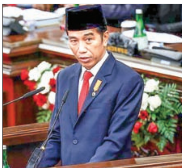
Indonesia's President Joko Widodo delivers a speech in front of parliament members at the House of Representative building in Jakarta, Indonesia, on 16 August 2016.

Indonesia has the world's largest Muslim