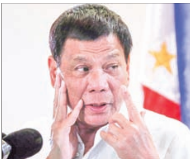
Philippine President Rodrigo Duterte speaks upon his arrival at Davao International Airport in Davao city, Philippines, after returning from a leaders' summit in Peru of the Asia-Pacific Economic Cooperation (APEC), on 23 November 2016.

Duterte, who was swept to office in May by a huge margin on a platform tilted towards the poor, said he had consciously shut pow-