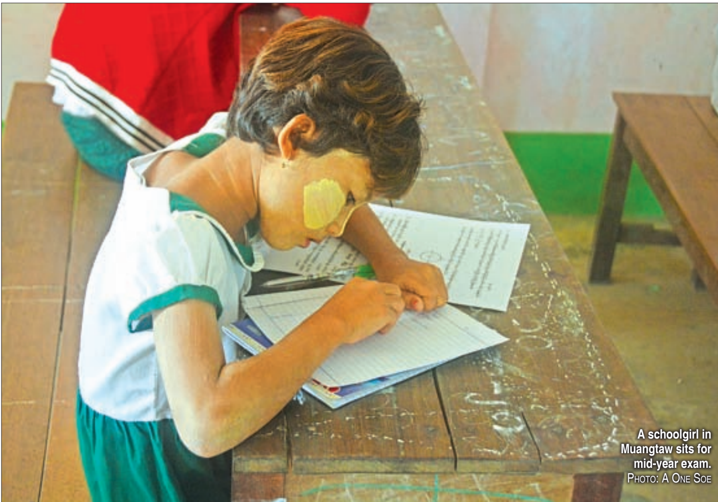
A schoolgirl in Muangdaw sits for mid-year exam.