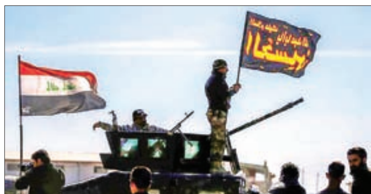
A Shi'ite fighter stands on top of a vehicle at a check point near Bartella, Iraq, on 21 November 2016.

The Iraqi military estimates there are 5,000 to 6,000 insurgents in Mosul facing a 100,000-strong coalition of Iraqi government units, Kurdish peshmerga and Shi'ite militias. Mosul's capture is seen as crucial towards dismantling the caliphate, and Islamic State leader Abu Bakr al-Baghdadi, believed to have withdrawn to a remote area near the Syrian border, has told his fighters there can be no retreat.—Reuters