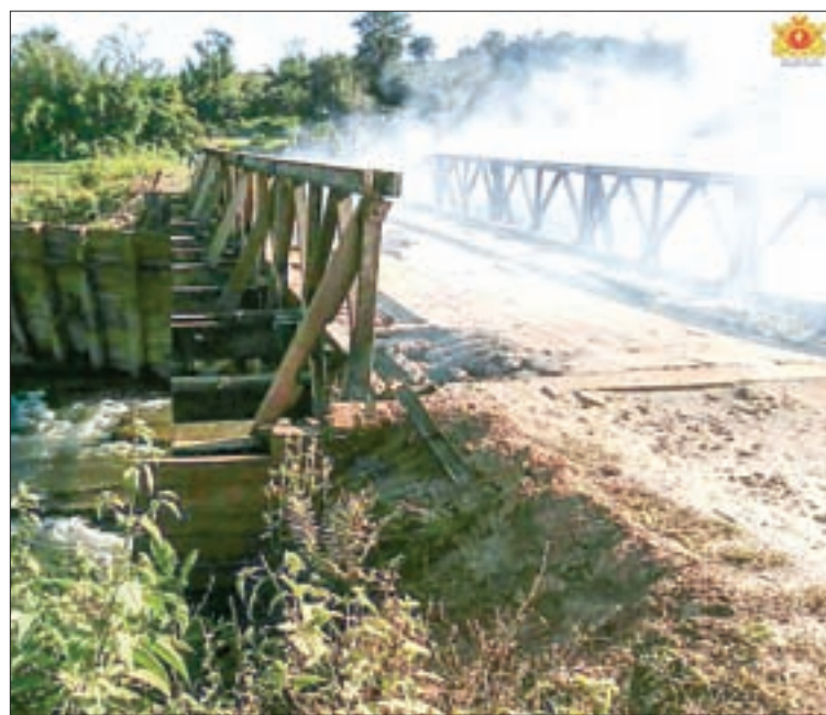
The Maisin Bridge is seen after the attack between RCSS and TNLA.

THE Maisin Bridge was destroyed in fighting yesterday afternoon between the RCSS and TNLA near the village of Maisin in Namtu township, according to the State Counsellor Office's Information Committee.