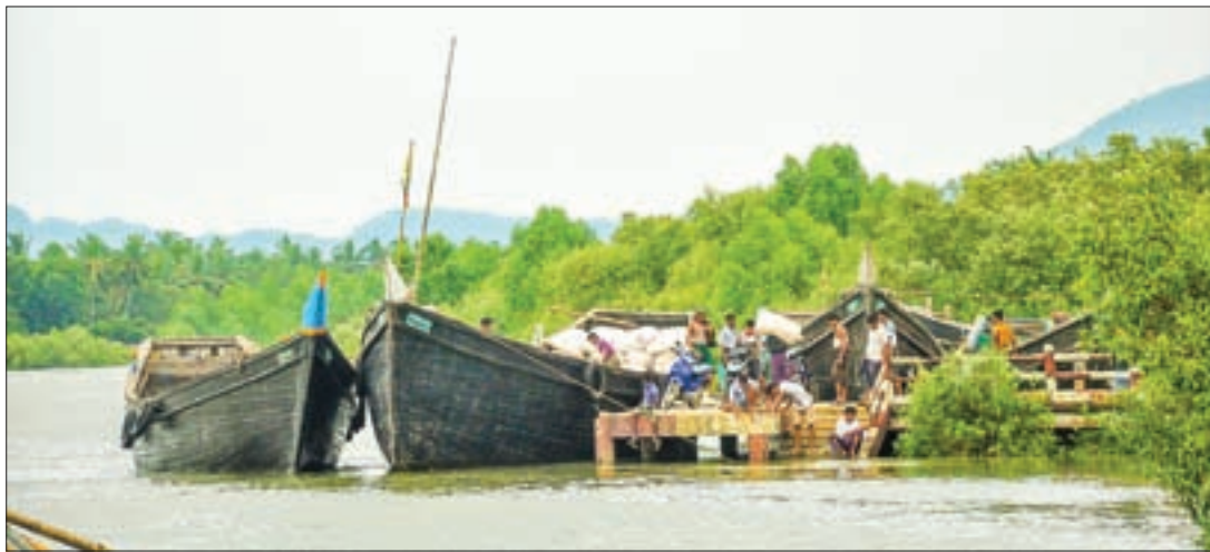
Villagers loading the boats with rice bags for trading.

Maungtaw District is a mountainous region near the Naf River and the Mayu River. The Mayu mountain ranges are Rakhine State’s most recognizable geographical feature, and the district thrives on agriculture, fishing and