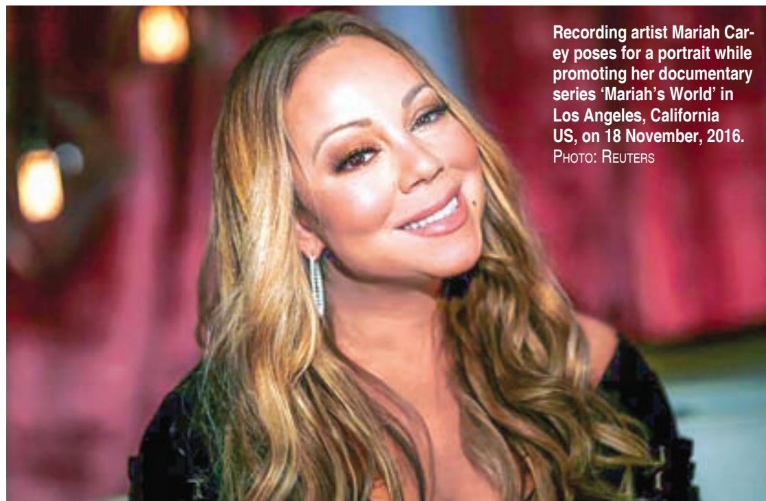
Recording artist Mariah Carey poses for a portrait while promoting her documentary series 'Mariah's World' in Los Angeles, California, US, on 18 November, 2016.