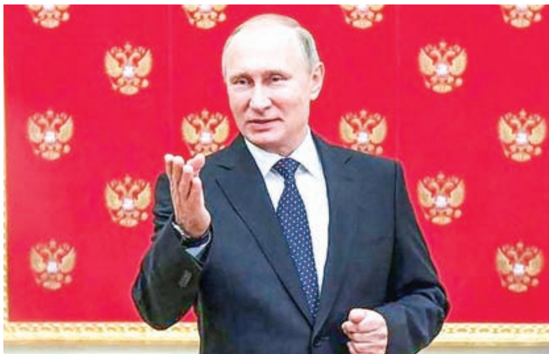
Russian President Vladimir Putin speaks during a meeting with journalists at the Kremlin in Moscow, Russia on 23 November 2016.

STRASBOURG — The European Parliament called on the EU and its states to do more to counter Russian "disinformation and propaganda warfare" on Wednesday, drawing an angry response from President Vladimir Putin.