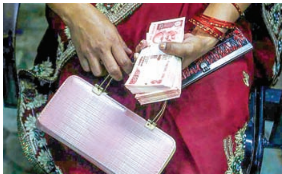
A woman holds 20 Indian rupees banknotes after exchanging them with old high denomination banknotes at a bank in Allahabad, on 13 November 2016.

Since the US election on 8 November, foreign investors have sold a net $1.59 billion from equity markets and $2.02 billion