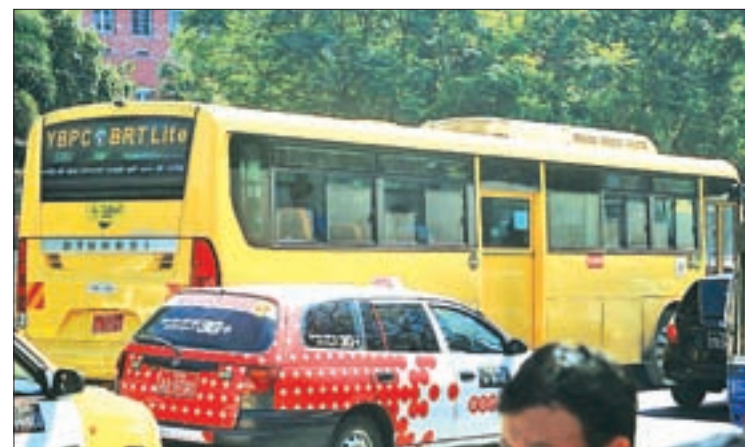
A BRT bus plying in Yangon.

“With BRT we can get a seat. It is more comfortable to ride the bus without a bus conductor”, said Daw Mon Mon, a passenger. Currently, the BRT operates three routes in Yangon from Htaukkyant to 8 Mile junction, plying along Pyay and Kabar Aye Pagoda roads and making a total of 23 stops. — Myitmakha News Agency