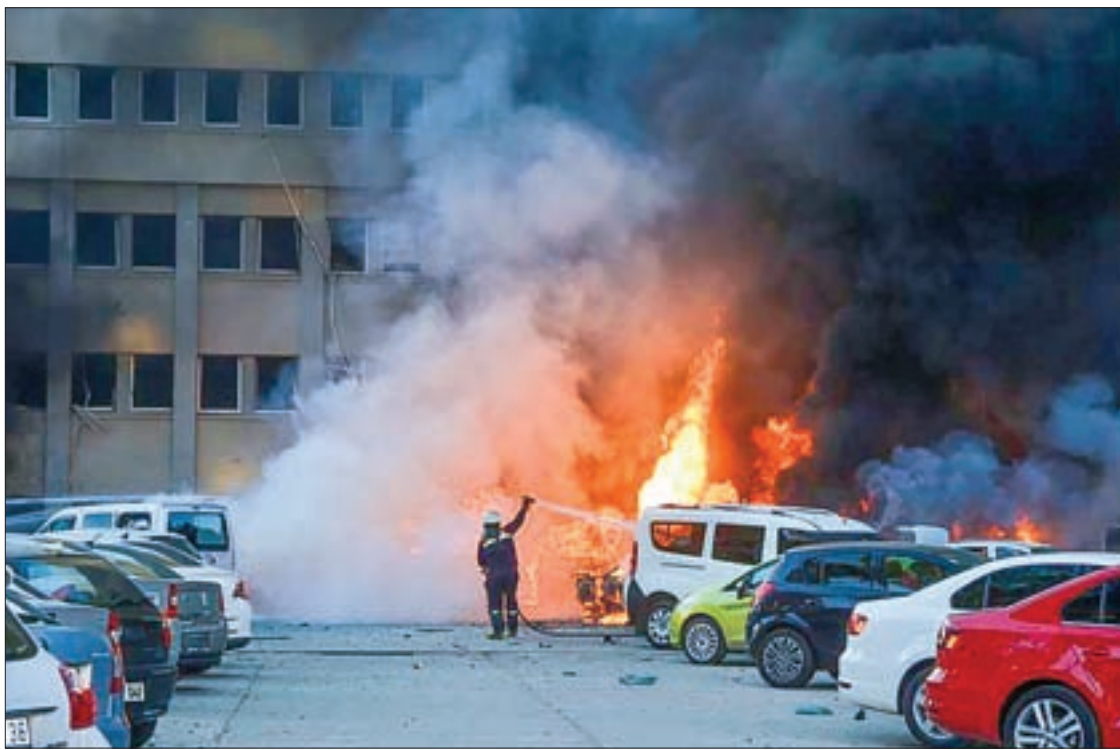
A firefighter tries to extinguish burning vehicles after an explosion outside the governor's office in the southern city of Adana, Turkey, on 24 November 2016.

"Damned terror continues to target our people. We will fight with this terror to the end in the