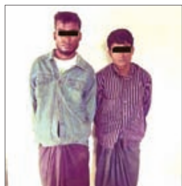
Einu and Eryu are seen.

The suspects will be handed over to border guard police and action will be taken against them according to the law.— MNA