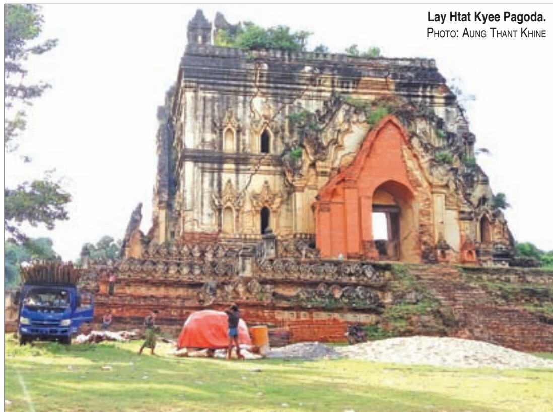
Lay Htat Kyee Pagoda.