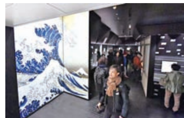
The Sumida Hokusai Museum, dedicated to Katsushika Hokusai (1760-1849), a Japanese ukiyo-e artist best known for his work "The Great Wave off Kanagawa" (shown at the left), opens on 22 November, 2016, in Tokyo's Sumida Ward where he was born and spent almost all of his 90 years of life.

"The Great Wave off Kanagawa," which depicts raging ocean waves in blue and white, is one of Hokusai's woodblock print series "Thirty-six Views of Mount Fuji," or landscape prints showing Japan's highest peak from different locations. The museum features a replica of the artist's studio and exhibits on the process he used to create "nishiki-e" multi-colored woodblock prints, including a high-definition display to appreciate some of his works. Through these displays, visitors will be able to trace the course of his life, the museum said. The museum building was designed by internationally renowned architect Kazuyo Sejima.—Kyodo News