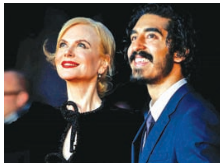
Nicole Kidman poses alongside Dev Patel.

"Stories like this can help generate a dialogue to get these kids off the street and put them in the right homes because there are thousands of people around the world who want to adopt children and don't know how to," he said.—Reuters