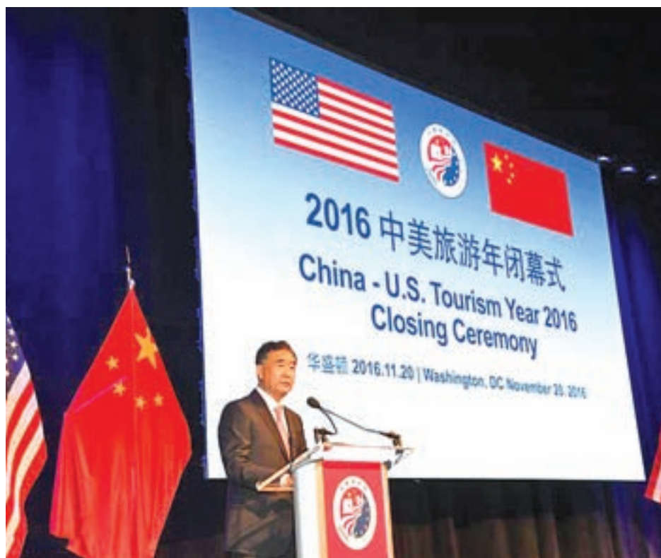
Chinese Vice Premier Wang Yang addresses the China-US Tourism Year 2016 Closing Ceremony in Washington D.C., the United States, on 20 November, 2016. China-US Tourism Year 2016 came to the end on Sunday, with officials from both countries pledging to expand tourism cooperation and enhance friendship.

Chinese Vice Premier Wang Yang said at the closing ceremony that the two sides have organized a series of cultural and people-to-people exchanges