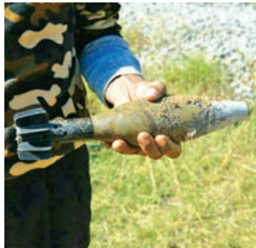
Parts of the handmade bomb are seen after explosion. (L) Unexploded motor round. (R)

A handmade bomb exploded in Muse at 8:45 pm on Monday and there were no injuries, according to the State Counsellor Office's Information Committee.