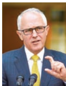
Australian Prime Minister Malcolm Turnbull.

Turnbull has seen his poll numbers slide to their lowest levels since he assumed the leadership in September 2015, and his future as prime minister has been questioned by political commentators as public confidence in the country's fourth leader in