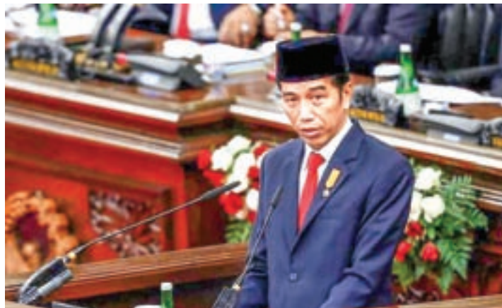
Indonesia's President Joko Widodo delivers a speech in front of parliament members at the House of Representative building in Jakarta, Indonesia, on 16 August 2016.

“I want to emphasise the spirit of pluralism ... and the govern-