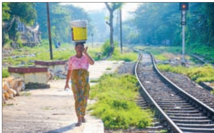
A woman walks alongside the railways which will be repaired at a station in Yangon.

Installation of doors with automatic traffic signal systems at 25 level-crossing and purchase of 66 coaches with diesel-operated engines will be implemented with the loan—Japan ODA loan.