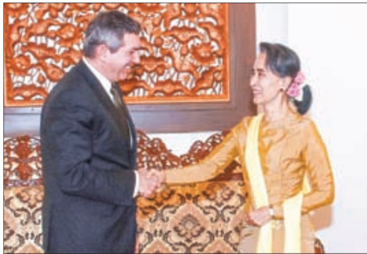
State Counsellor Daw Aung San Suu Kyi receives Mr. Stavros Lambrinidis, EU Special Representative for Human Rights.

STATE Counsellor and Union Minister for Foreign Affairs Daw Aung San Suu Kyi received Mr. Stavros Lambrinidis, EU Special Representative for Human Rights and his delegation at the Ministry of Foreign Affairs in Nay Pyi Taw yesterday.