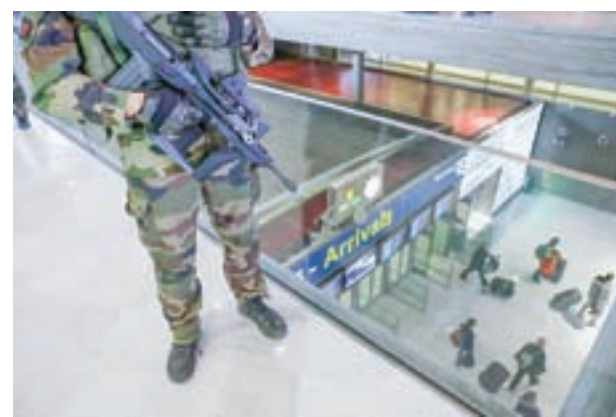
File photo: A French soldier patrols inside the Charles de Gaulle International Airport in Roissy, near Paris, France, on 23 March 2016.

The latest confrontation began Sunday evening, after protesters attempted to remove a truck that had been on the bridge since 27 October, police said. —Reuters