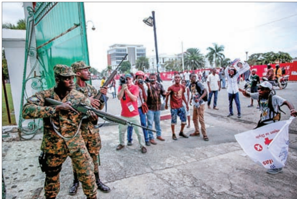
Members of the General Security Unit of the National Palace (USGPN) try to disperse supporters of Fanmi Lavalas political party as they march next to the National Palace of Port-au-Prince, Haiti, on 21 November 2016.

The territorial row over the chain of western Pacific islands, seized by Soviet troops at the end of World War II, has upset diplomatic ties ever since, precluding a formal peace treaty between Tokyo and Moscow.—Reuters