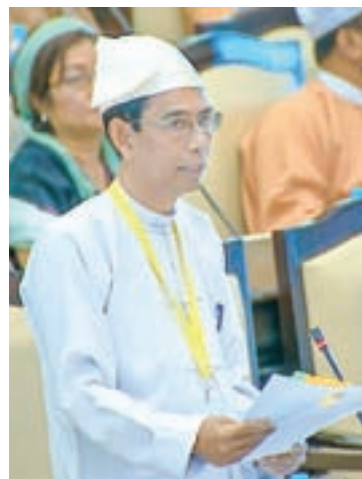
Dr Aung Thu.

AFTER careful scrutiny, the Myanma Agriculture Development Bank disbursed agricultural loans to townships that are less than the targeted amount — only Ks1700 billion out of K1776 billion — originally allotted for this fiscal year, said Dr Aung Thu, Union Minister for Agriculture, Livestock Breeding and Irrigation at Amyotha Hluttaw yesterday.