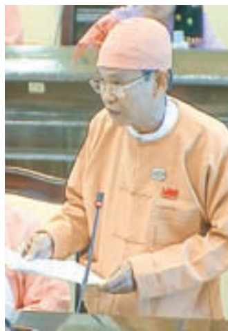
Dr Kyaw Than Tun.

“Myanma Agriculture Development Bank is a state-owned bank with the capital investment of over Ks9billion. As the needed amount to disburse farmers amounted to