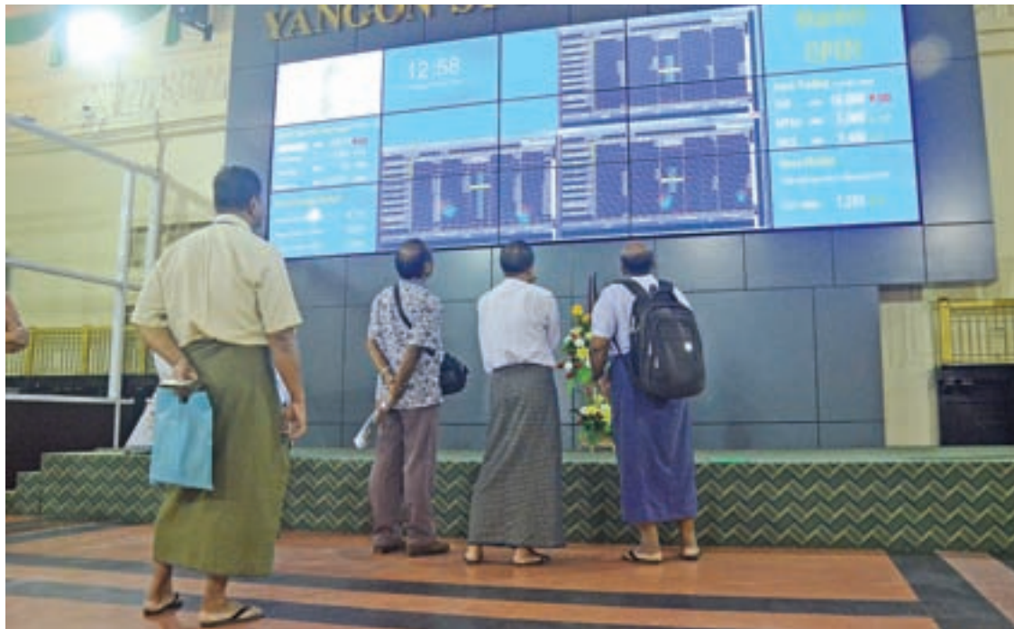
People look at an electronic board showing stock information at YSX in Yangon on 11 Nov.

The Myanmar Mushroom Cultivators and Distributors Association was organized in 2006 under the Myanmar Fruit, Flower and Vegetable Producers and Exporters Association (MFVP).— Myitmakha News Agency