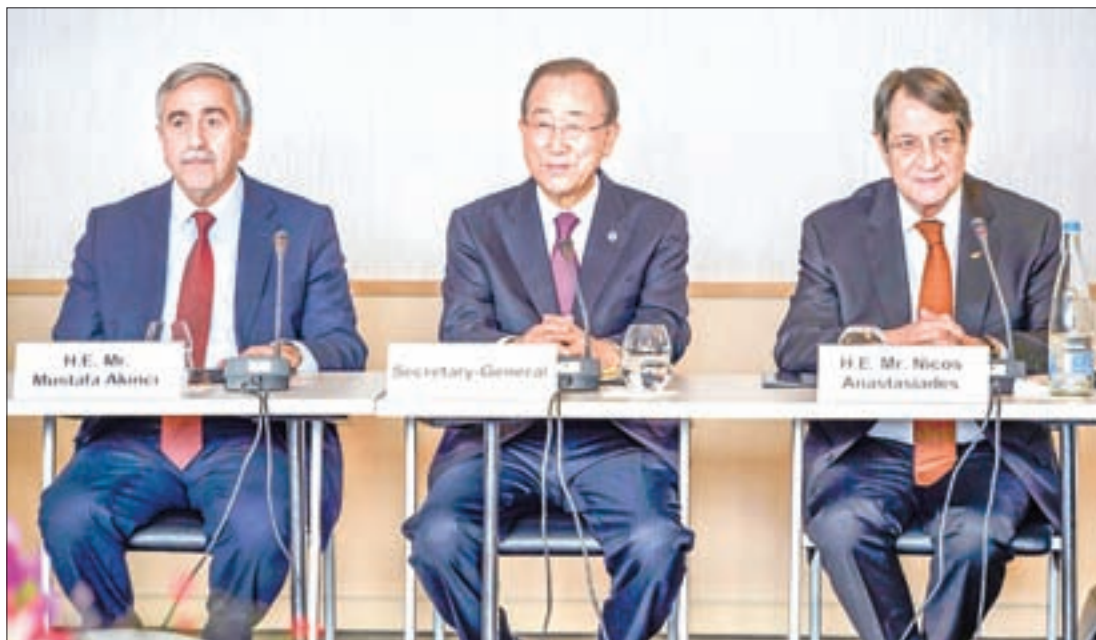
UN Secretary-General Ban Ki-moon (C), Turkish Cypriot leader Mustafa Akinci (L) and Cypriot President Nicos Anastasiades attend the Cyprus reunification talks in the Swiss mountain resort of Mont Pelerin, Switzerland, on 7 November 2016.

Democratically elected after the 2011 uprising, Mursi was overthrown in mid-2013 by Abdel Fattah al-Sisi following mass protests against his rule, and was immediately arrested. He remains in jail on a separate espionage conviction.— Reuters