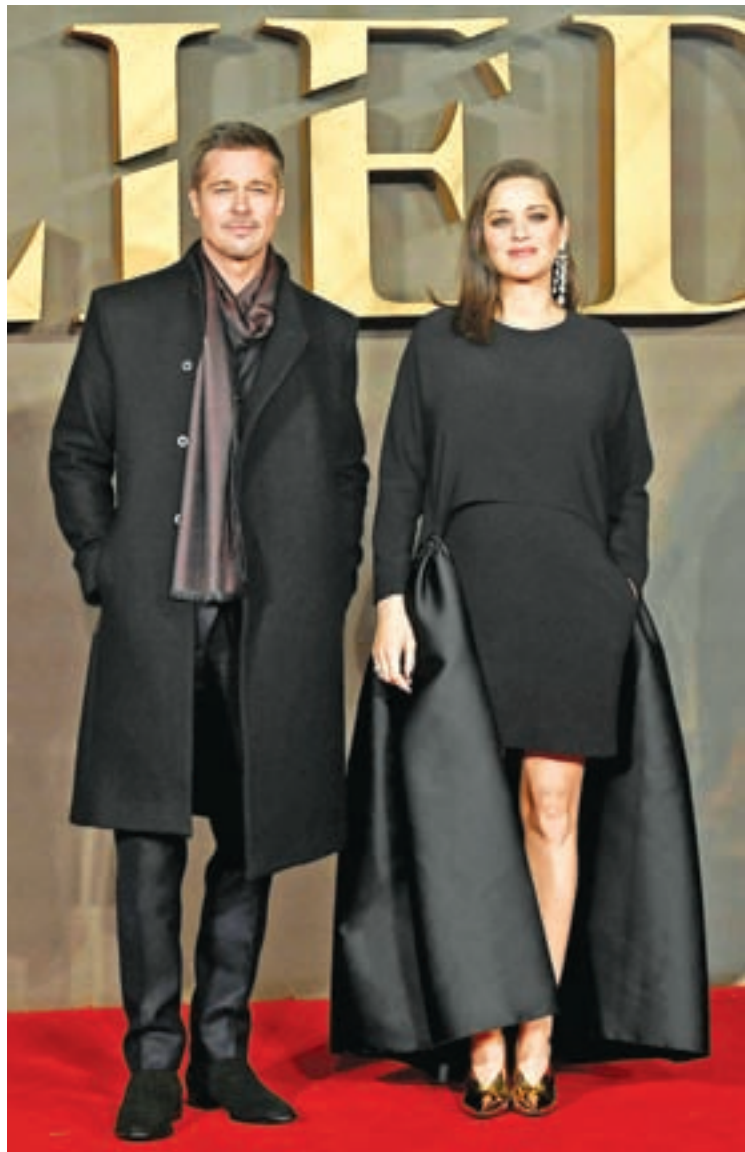
Actors Marion Cotillard and Brad Pitt.

"Allied" hits cinemas worldwide from Wednesday.—Reuters