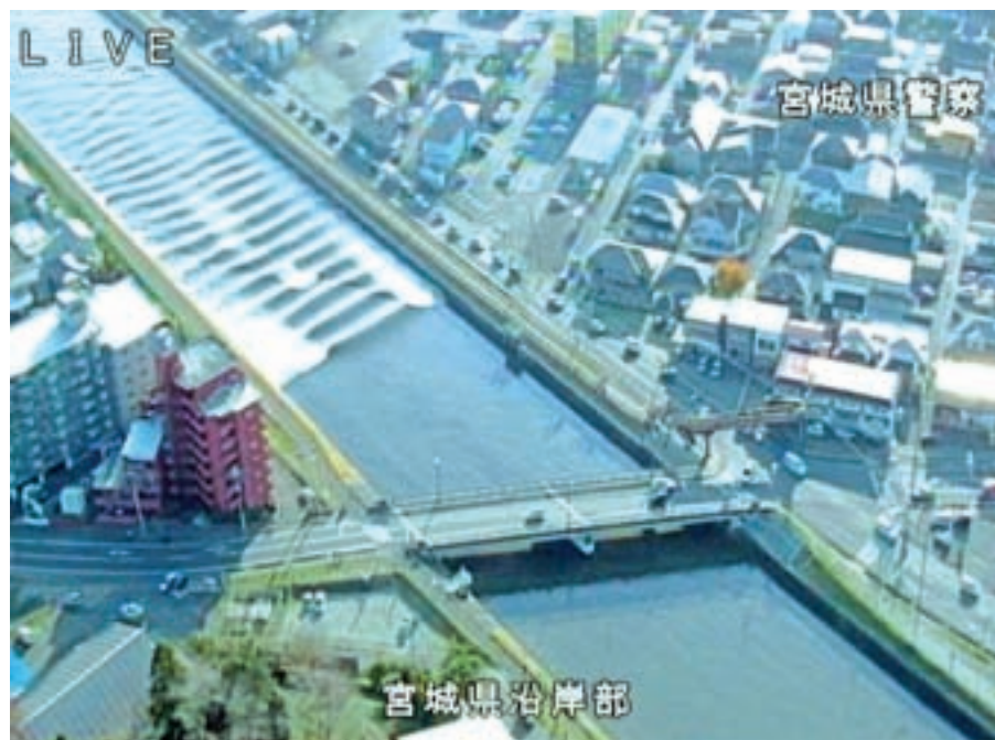
A tidal surge is seen in Sunaoshi River after tsunami advisories were issued following an earthquake in Tagajo, Miyagi prefecture, Japan, on 22 November 2016, in this video grab image released by Miyagi Prefectural Police via Kyodo.

A tsunami measuring 1.4 meters was observed at Sendai port in Miyagi Prefecture, and a 1-meter wave hit the coast near the Fukus-