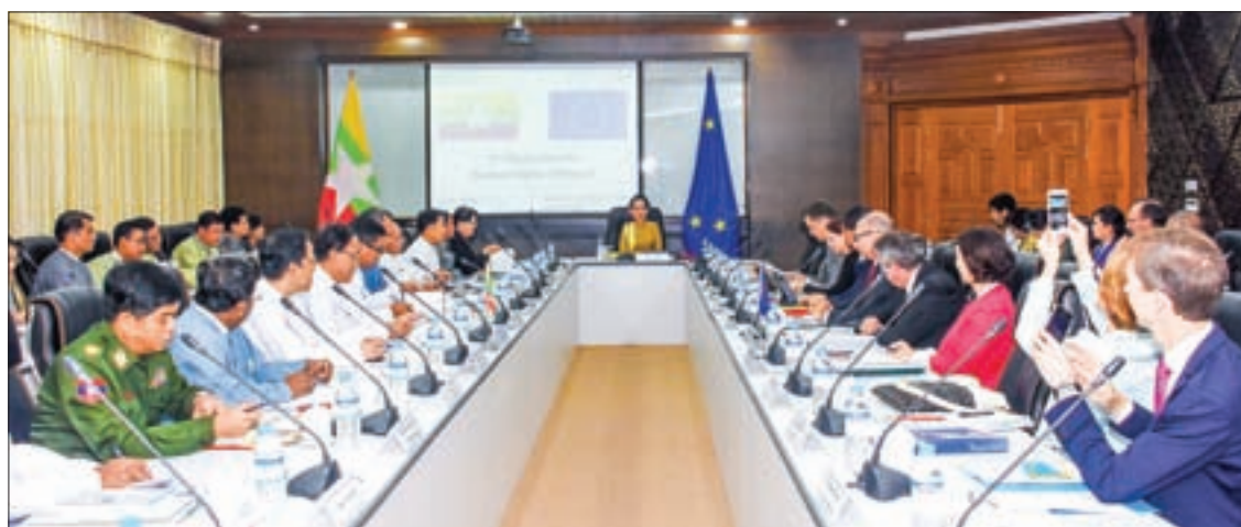
State Counsellor Daw Aung San Suu Kyi addresses the opening ceremony for 3 rd Myanmar-EU Seminar on Human Rights at the office of the ministry of foreign affairs in Nay Pyi Taw.

In the discussion, rights for workers, land rights, matters on bilateral investment contracts and human rights, rights on refugees and illegal migrants, human-trafficking and related cases, the situation in Rakhine State, the rights of minorities in EU countries, religious intolerance and matters on protection from instigations were exchanged.— Myanmar News Agency