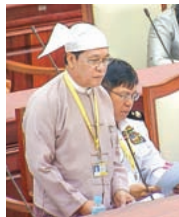
U Thein Swe.

Regarding labour rights including the child labour issue and house helpers, the Union Minister for Labour, Immigration and Population U Thein Swe responded that the government is considering a law to give protection to domestic workers. However, actions can already be taken against child labour and torture under the Section 27 of the Law Amending the Ward or Village-tract Administrative Law and under the Section 65 (A) of the Child Labour law.— Myanmar News Agency