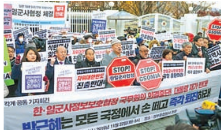
Demonstrators stage a rally in front of government buildings in Seoul on 22 November 2016, against the South Korea-Japan General Security of Military Information Agreement.

In 2012, Japan and South Korea were ready to sign the agreement but Seoul postponed the process at the last minute due to a