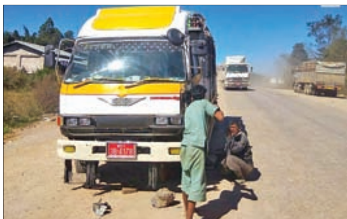
Workers repair the truck which was attacked by KIA, TNLA & MNDAA troops.

A 6-wheeled Hino truck — vehicle No. 3 B/4178 — with a load of watermelons on board bound for Muse from Mandalay was stopped by the coordinated armed group, making the driver and the conductor flee. The lorry was then blown up, it is reported.— Myanmar News Agency