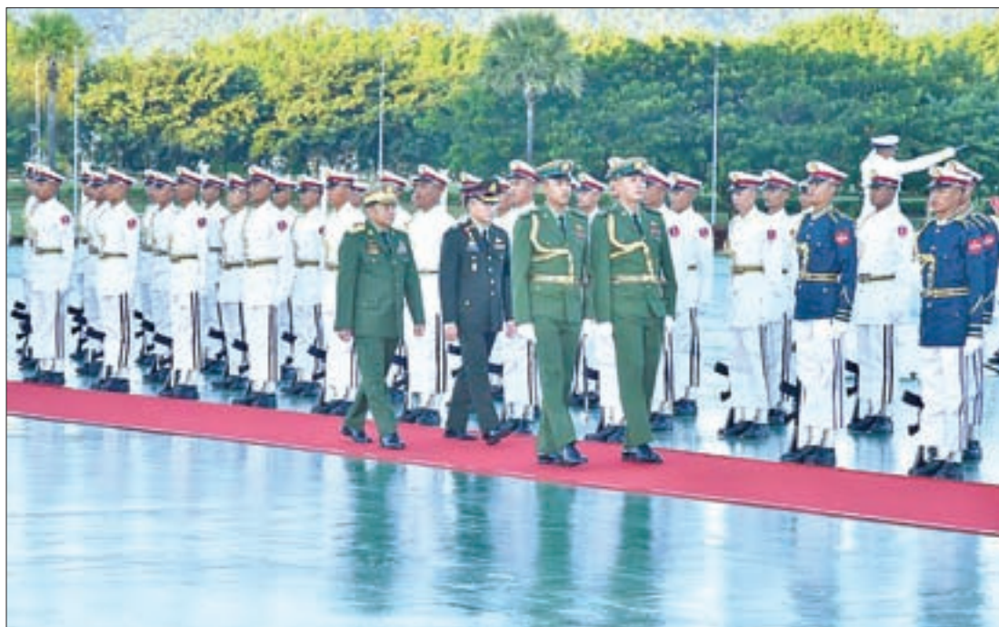
Senior General Min Aung Hlaing and General Surapong Suwana-Adth inspect Guard of Honour.

COMMANDER-IN-CHIEF of Defence Services Senior General Min Aung Hlaing welcomed General Surapong Suwana-Adth, Chief of Defence Forces of Royal Thai Armed Forces, who arrived in Nay Pyi Taw yesterday at the invitation of the Senior General to pay a good will visit to Myanmar and to participate in the 4th High Level Committee Meeting.