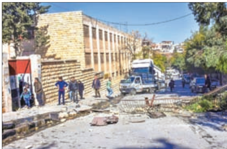
A view shows the damage outside a school after shelling by Syrian rebels on government-held western Aleppo, Syria on 20 November 2016.

The Observatory also documented 16 civilian deaths, including 10 children, and dozens of injuries as a result of rebel shelling of government-held west Aleppo. Air strikes and shelling of east Aleppo last week knocked all the main hospitals in that part of the city out of service, the local health authority and international humanitarian agencies said.— Reuters