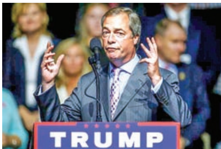
European Parliament Nigel Farage speaks during a Republican presidential nominee Donald Trump campaign rally in Jackson, Mississippi, US, on 24 August 2016.

It is highly unusual in the modern era for leaders to publicly suggest to foreign nations who they would like to see as ambassador.