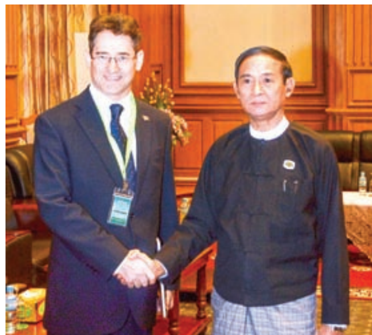
Pyithu Hluttaw Speaker U Win Myint receives Ambassador of the Republic of Chile, EU Special Representative for Human Rights.

During the meeting with the European Union’s Special Representative for Human Rights, they discussed matters on EU’s assistance in rule of law and reform of Myanmar Police Force, matters related to the Election Law, EU’s offer to giving assistance to humanitarian assistance and legislation of the parliament.— Myanmar News Agency