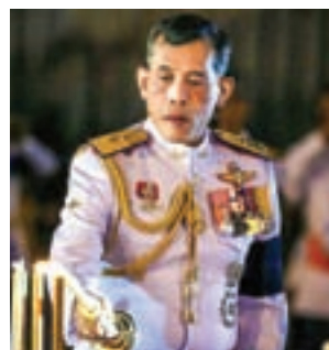
Thailand's Crown Prince Maha Vajiralongkorn.

BANGKOK — Thai lawmakers have been asked not to leave the country next week, the head of parliament said on Tuesday, as a much-touted December date for Crown Prince Maha Vajiralongkorn to ascend the throne draws near.