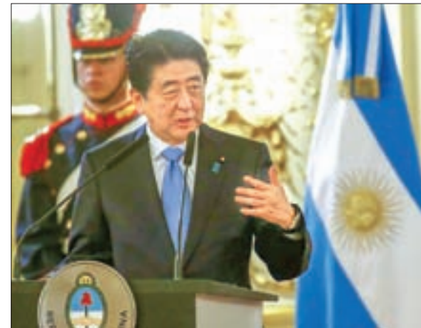
Japanese Prime Minister Shinzo Abe speaks during a joint statement with Argentine President Mauricio Macri at the Casa Rosada Government House, in Buenos Aires, Argentina, on 21 November 2016.

BUENOS AIRES — The Trans-Pacific Partnership (TPP) would be meaningless without US participation, Japan's Prime Minister Shinzo Abe said on Monday as US President-elect Donald Trump said he would withdraw the United States from the pan-Pacific free trade deal.