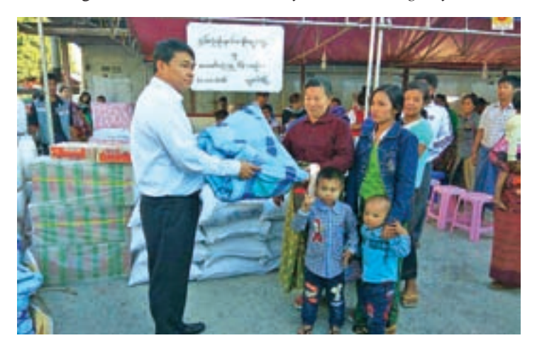
IDPs in Muse receiving aid from authorities.

Temporary clinics have been set up at the relief camps to providing health care to the IDPs.-Myanmar News Agency