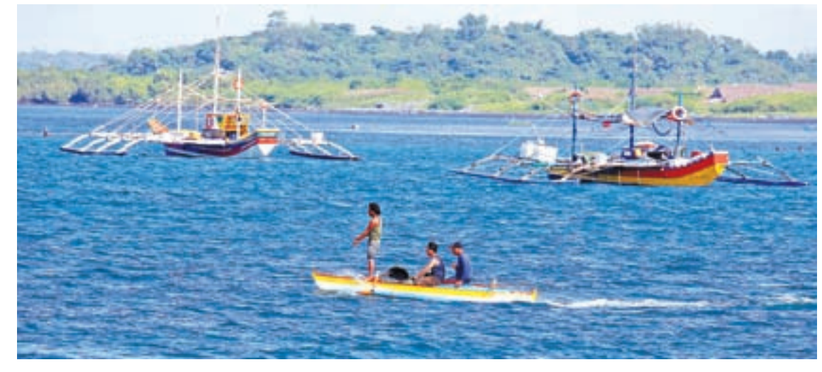
Fishermen ride on a small boat past their big boats as they prepare to fish at disputed Scarborough Shoal, at the coastal village of Cato in Infanta, Pangasinan in the Philippines, on 3 November 2016

The establishment of a protected marine zone, if successful, could provide both countries a face-saving way to break the diplomatic deadlock without making