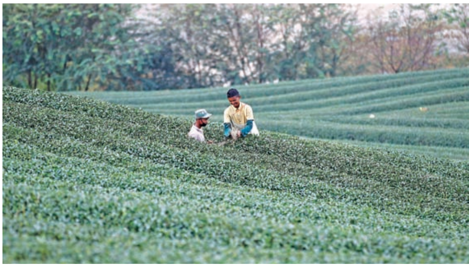
Workers work in a tea leaf field at Mong Mao in ethnic Wa territory in north east Myanmar October 1, 2016.

The MACCS system was launched with the assistance of the Japanese government to ensure the smooth flow of import and export processes. The system is planned to be expanded up to border trade camps, bur only if the system is successful.