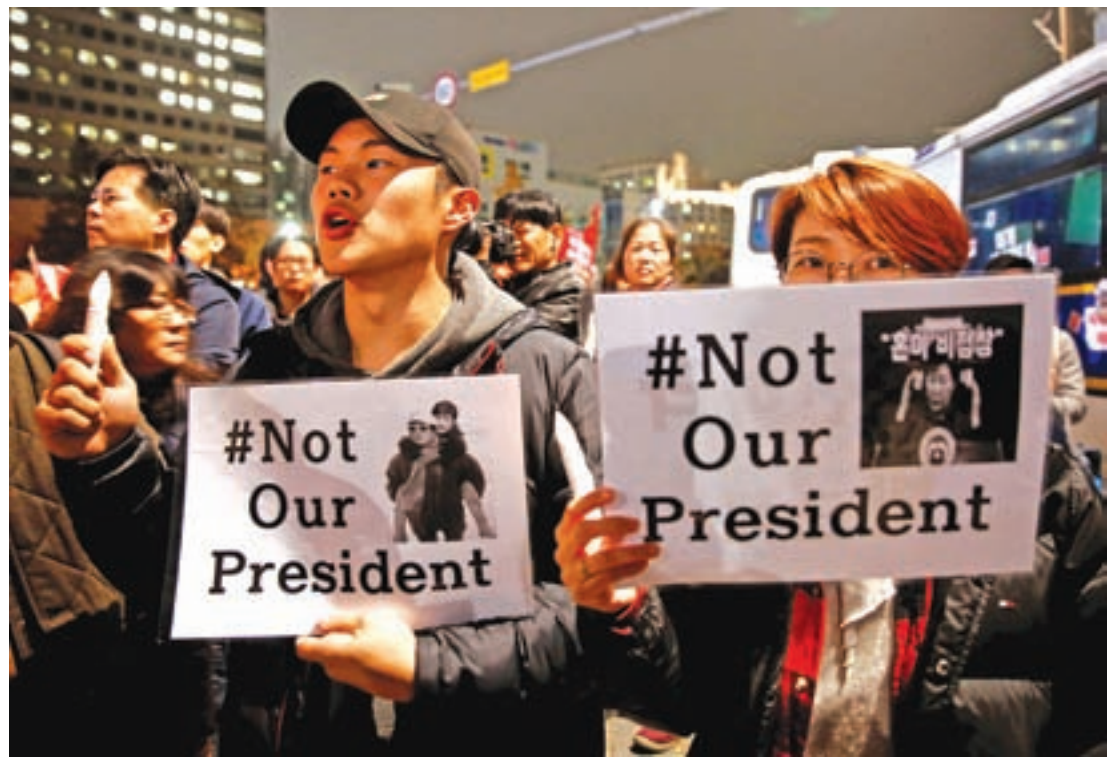
Protesters shout slogans after they are blocked by riot policemen in a road nearby the presidential Blue House during their march calling South Korean President Park Geun-hye to step down in Seoul, South Korea, on 19 November 2016.

The People's Party, with 38 seats in the single-chamber 300-member parliament, has started efforts to remove Park from office and will talk with other parties to get signatures for an impeachment motion, said a party spokes-