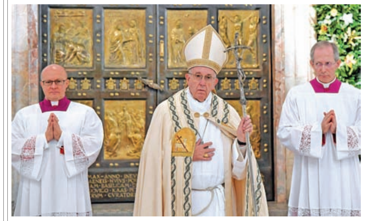
Pope Francis walks after closing the Holy Door to mark the closing of the Catholic Jubilee Year of Mercy at the in Saint Peter's Basilica at the Vatican, on 20 November 2016.