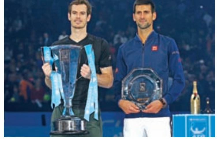
Great Britain's Andy Murray and Serbia's Novak Djokovic with their trophies after the Barclays ATP World Tour Finals, O2 at Arena, London on 20 November 2016.

It was only five months ago that talk of Djokovic becoming the first man since Rod Laver in 1969 to complete a calendar Grand Slam gathered momentum after he won the French Open for the first time to complete a career slam and