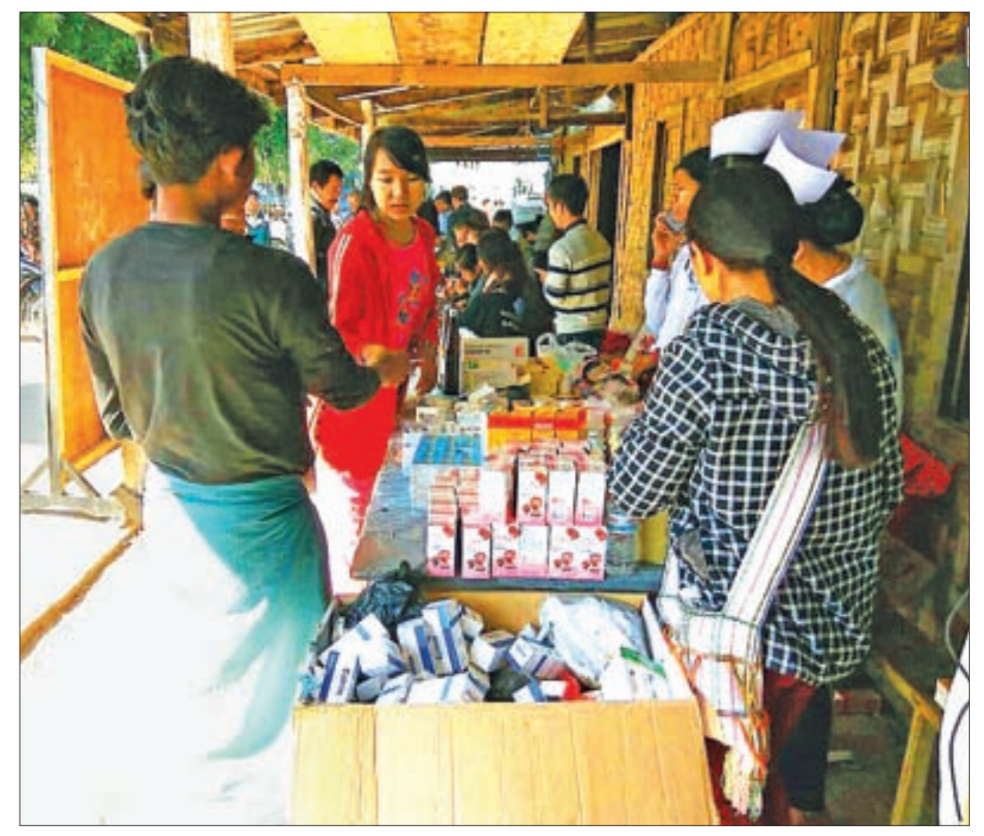
Clinics are set up at five shelters in Muse to provide medical care to IDPs.

The information committee said military outposts, police stations and a trade centre came under surprised attack by armed groups consisting mostly of KIA and TNLA troops, who also used vehicles along the Lashio-Muse Road and threatened to destroy the bridge between Namtu and Manton with explosives. Casualities and