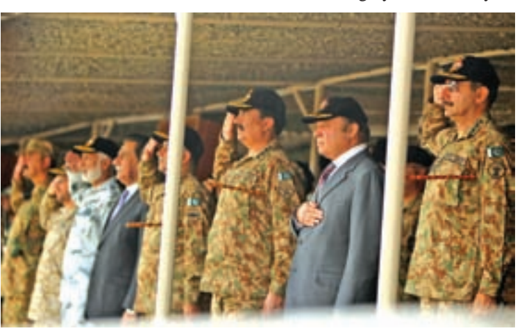
Pakistan's Prime Minister Nawaz Sharif and Army Chief of Staff General Raheel Sharif watch military exercises in Bahawalpure, Pakistan, on 16 November 2016.

With nearly 10,000 US troops in Afghanistan fighting the Afghan Taliban and other militant groups, Washington is losing patience with what it calls Pakistan's failure to hunt down insurgents who launch attacks on Afghanistan from Pakistani territory. Pakistan denies this.—Reuters