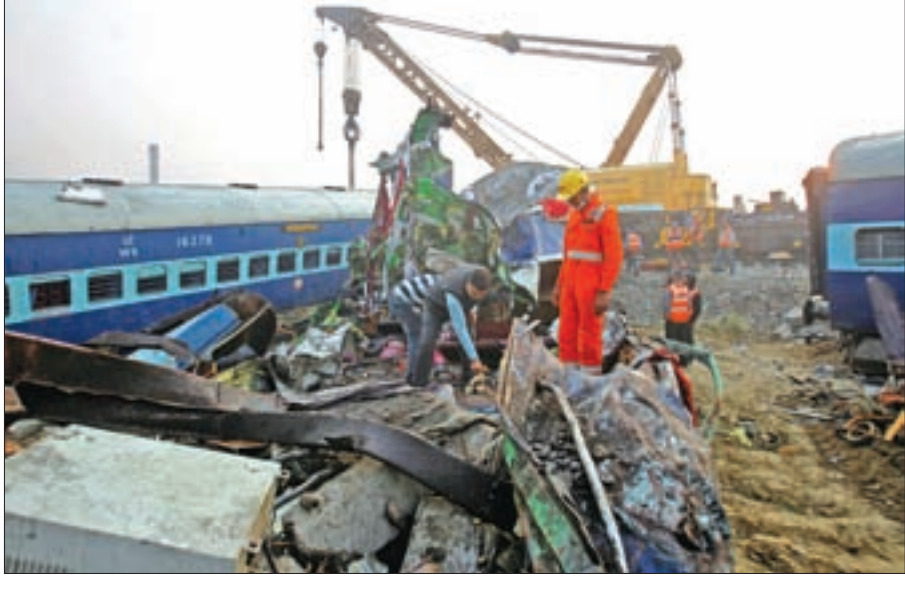
Rescue workers search for survivors at the site of Sunday's train derailment in Pukhrayan, south of Kanpur city, India, on 21 November 2016.

The largely colonial-era railway system, the world's fourth largest, carries about 23 million people every day. But it is saturated and ageing badly.