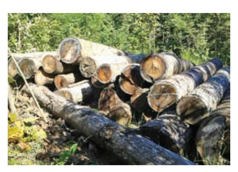
Timber logs seized being seen.

AUTHORITIES from Kawlin township confiscated timber weighing over 100 tonnes from nine illegal saw mills in Kawlin township, Katha district, Sagaing region on 17 and 18 November.