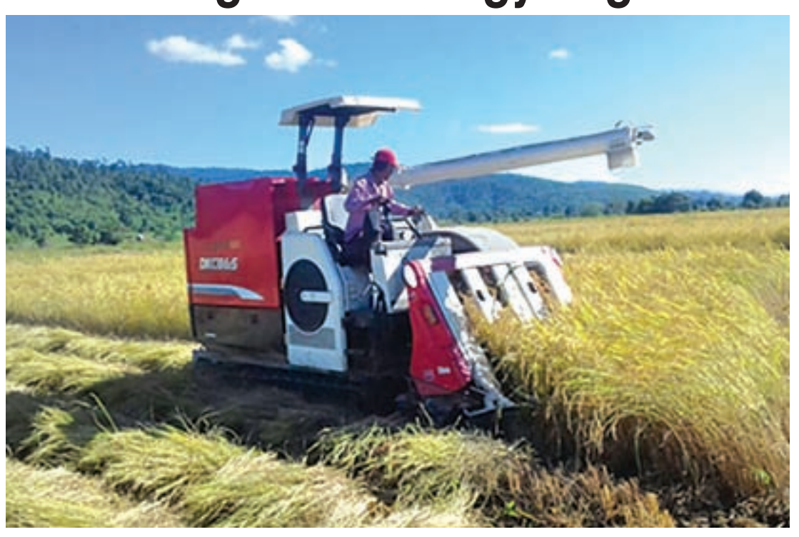
Monsoon paddy harvesting being demonstrated in Htigyaing.