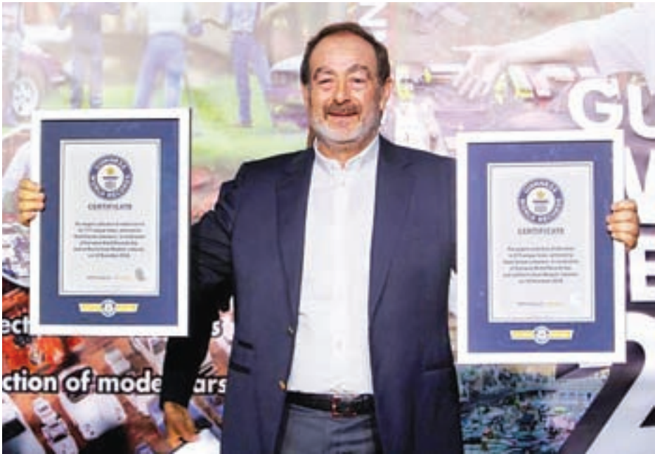
Nabil Karam poses with his Guinness World Record certificates for the largest collection of model cars and the largest collection of dioramas, in celebration of the Guinness World Records Day in Zouk Mosbeh, north of Beirut, Lebanon, 16 November 2016.

In Australia, fitness guru Kayla Itsines led a mammoth exercise class for the titles of “most people performing squats” with 2,201 participants, “most people star jumping” with 2,192, “most people performing lunges” - 2,146 - “most people performing sit-ups” — 2,005, and “most people running in one place” - 2,195. Separately, at a ceremony in Beirut on Wednesday, former Lebanese racing driver Nabil Karam broke his own Guinness World titles when he was awarded two new records for having the largest collection of miniature cars, with 37,777 models, as well as 577 dioramas. —Reuters