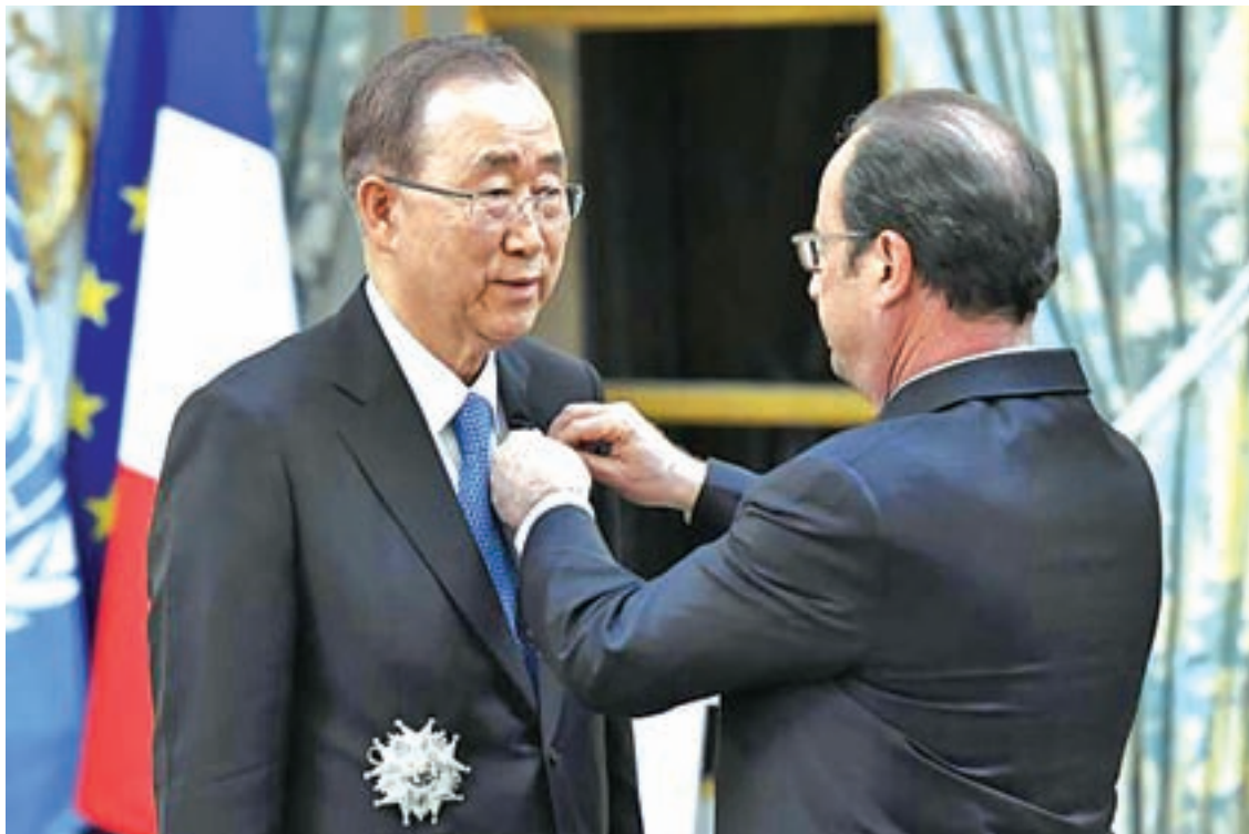
French President Francois Hollande (R) awards the Legion of Honour (Legion d'Honneur) to UN Secretary General Ban Ki-moon at the Elysee Palace in Paris, France, on 17 November 2016.