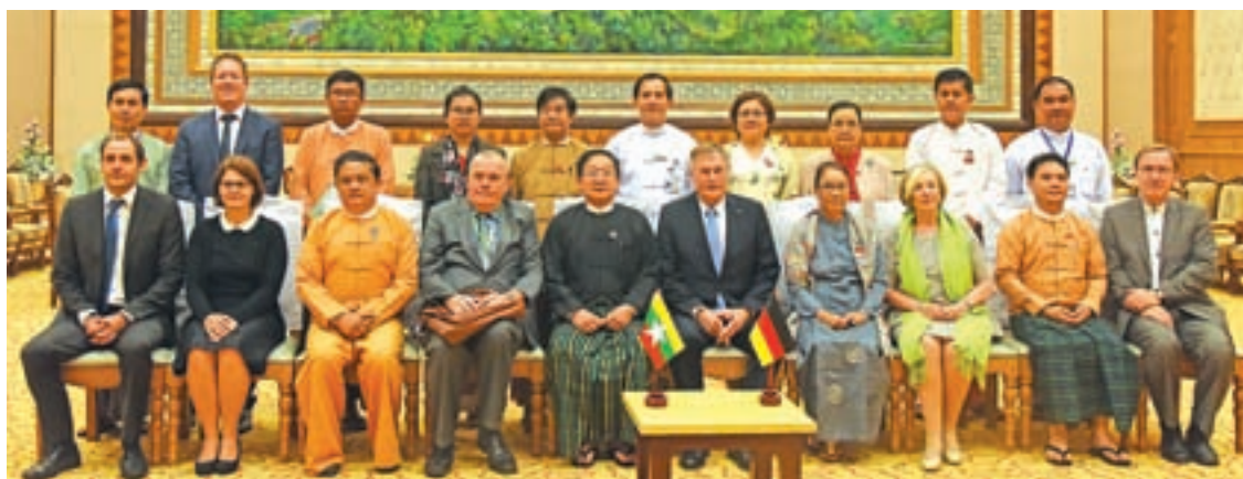
MPs of Pyidaungsu Hluttaw and officials of Hanns Seidel Foundation pose for photo: PHOTO: MNA