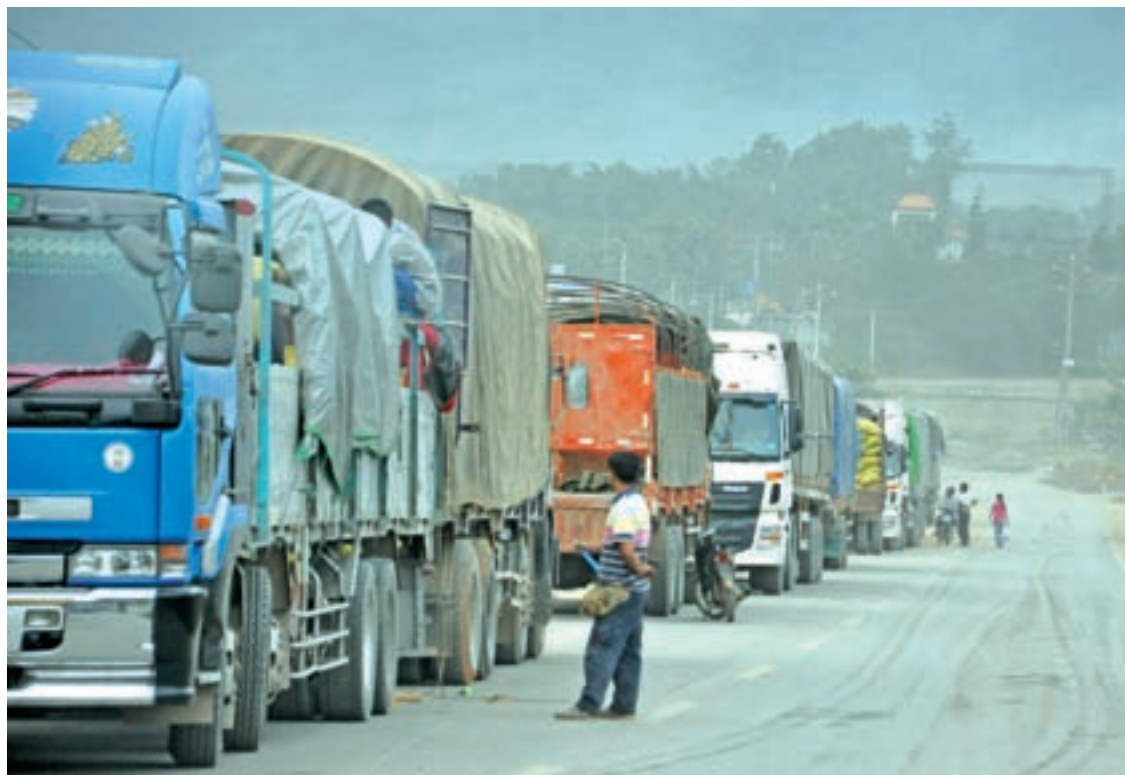
Trucks line up near Muse 105-Mile Trade Zone in northern Shan State recently.

the Muse, Keng Tung and Sittwe border camps declined while those through other border trade camps rose. However, the Muse border trade camp is seen to have the highest trade value of