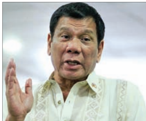
Philippine President Rodrigo Duterte talks to members of his cabinet (not pictured) after arriving from Malaysia, at Davao International airport in Davao city in southern Philippines, on 11 November 2016.

In interviews crammed with expletives, the 71-year-old former mayor spoke warmly of Beijing and Moscow, describing Chinese President Xi Jinping as “a very courteous