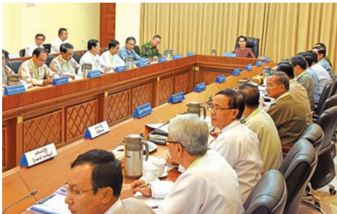
Sate Counsellor Daw Aung San Suu Kyi addresses the third work coordination meeting of the Central Committee for the Implementation of Peace, Stability and Development in Rakhine.

"However, to reinforce the country's police force, the Myanmar Police Force has a plan to recruit new members in the regions and states", he added.— Myanmar News Agency