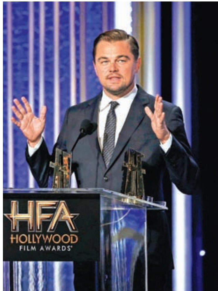
Actor Leonardo DiCaprio accepts the Hollywood Documentary Award for "Before the Flood" at the Hollywood Film Awards in Beverly Hills, California, US, on 6 November 2016.

Fellow Hollywood actor George Clooney visited a sister cafe "Social Bites" in Edinburgh last year.