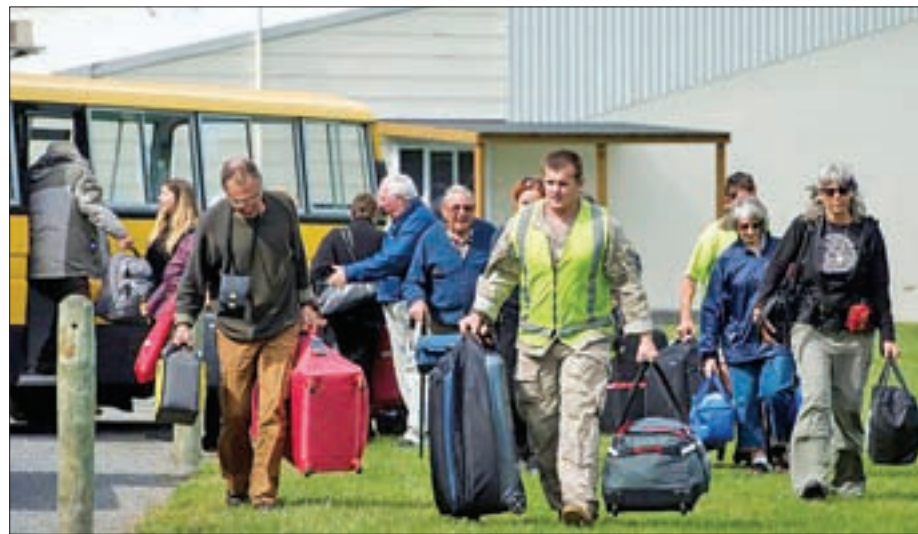
Royal New Zealand Air Force personnel lead those stranded by an earthquake to an NH90 helicopter to evacuate them from Kaikoura on the South Island of New Zealand, on 16 November 2016.

Others have put the bill lower. Prime Minister John Key said earlier this week the damage bill would be about NZ$2 billion ($1.40 billion), although he cautioned that was only an early estimate.—Reuters