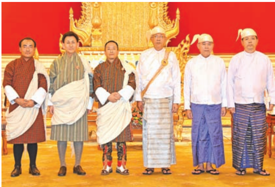
President U Htin Kyaw poses for a documentary photo with Ambassador Mr. Tshewang Chophel Dorji and diplomats of the Kingdom of Bhutan at Presidential Palace in Nay Pyi Taw .

Present on the occasions were Deputy Minister of the Office of the State Counsellor U Khin Maung Tin and Director-General U Ko Ko Naing of the Protocol Department.— Myanmar News Agency