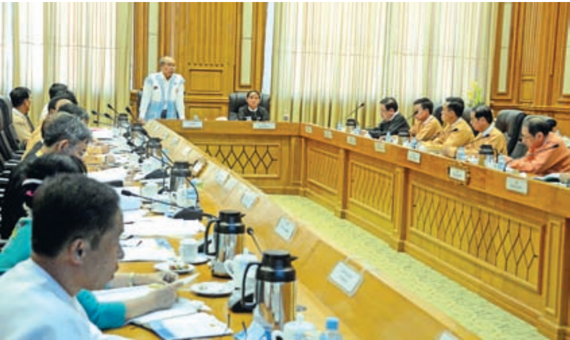
Speaker U Mahn Win Khaing Than speaks at 5/2016 meeting of Myanmar Parliamentary Union.

MYANMAR Parliamentary Union Meeting held its 5/2016 meeting discussing inclusion of organizational set up for region and state Hluttaws in Pyidaungsu Hluttaw. The meeting was opened with remarks by Speaker of Pyidaungsu Hluttaw and Amyotha Hluttaw Mahn Win Khaing Than, who is also the chairman of the