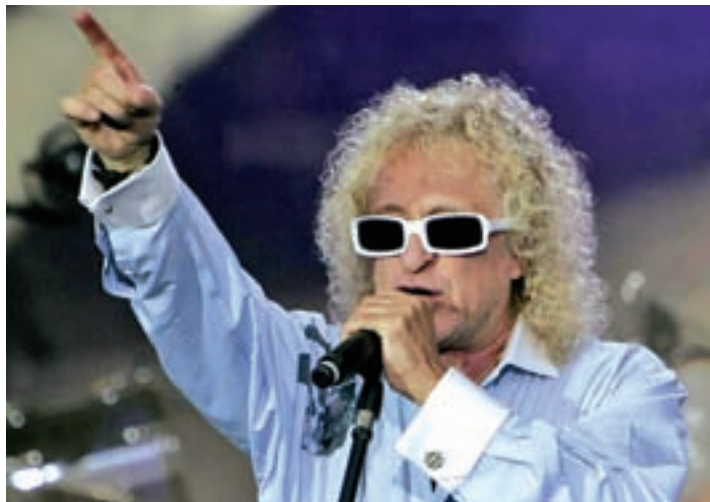
French singer Michel Polnareff.