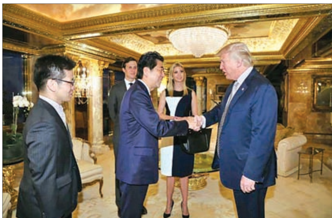
Japan's Prime Minister Shinzo Abe meets with US President-elect Donald Trump (R) at Trump Tower in Manhattan, New York, US, on 17 November 2016.

and received golf-wear in return, Japanese officials said.