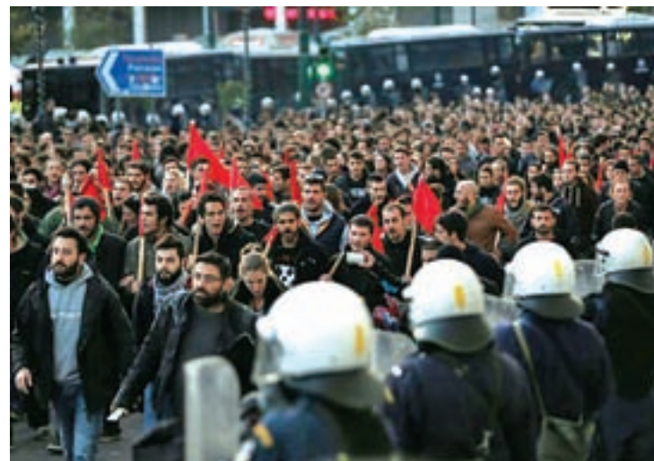
Riot policemen stand guard outside a hotel during a rally marking the 43rd anniversary of a 1973 student uprising against the military dictatorship that was ruling Greece, in Athens, Greece, on 17 November 2016. PHOTO: REUTERS

Many Greeks blame governments since the fall of the junta of driving the country to near-bankruptcy.—Reuters