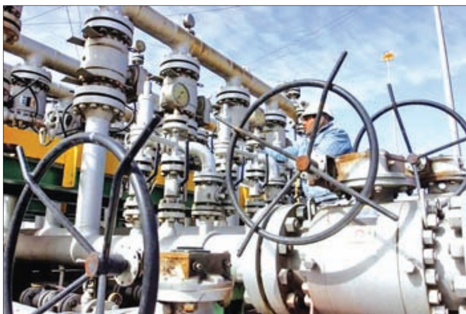
A worker checks the valves at Al-Sheiba oil refinery in the southern Iraq city of Basra, on 26 January 2016.

"Immediately after (an) SOC notice of ... production curtailment, the parties shall agree ... a