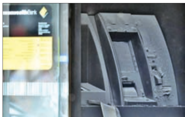
An electronic cash machine is burned at a branch of the Commonwealth Bank after a fire injured customers in Melbourne, Australia, on 18 November 2016.

CBA confirmed the incident in a statement and said the branch will remain closed for the rest of Friday. —Reuters