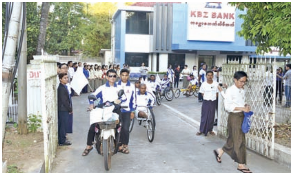
The wheelchair journey is flagged off from Kanbawza Bank's Kamayut Branch.