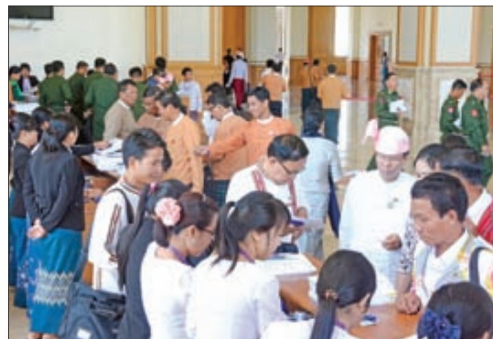
MPs sign in attendance book.

The union minister also responded to a question related to compensation for landowners whose farmland was confiscated for construction of Tamu ring road. In his response, the union minister said that an agreement between authorities and landowners has been reached through negotiations and compensation will be paid as soon as the regional government approves it.— Myanmar News Agency