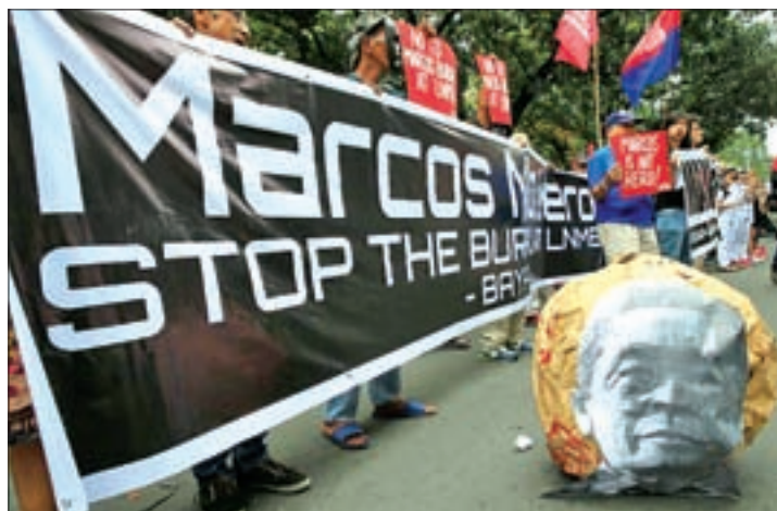
Protesters display a banner and placards denouncing the burial of former Philippine dictator Ferdinand Marcos at the Libingan ng mga Bayani (heroes' cemetery), along a main street in Taft avenue, metro Manila, Philippines on 18 November 2016.

Marcos' eldest daughter, Ilocos Norte Governor Imee Marcos, thanked Duterte for allowing her father, a former soldier and guerrilla leader during