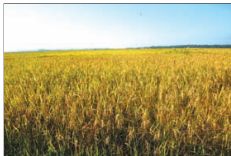
Rice paddy field in Maungtaw.