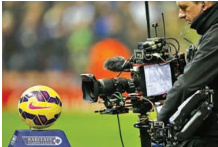
A television camera films the match ball before Liverpool's English Premier League soccer match against Tottenham Hotspur at Anfield in Liverpool, northern England, on 10 February 2015.

The Premier League has not confirmed the deal. PPTV is one of China's largest streaming services and already owns the rights to Spain's La Liga.