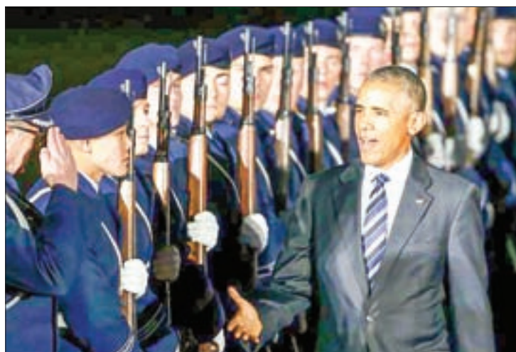
US President Barack Obama arrives at the Tegel airport in Berlin, Germany, on 16 November 2016.

"We're in a really critical situation," said the German official.