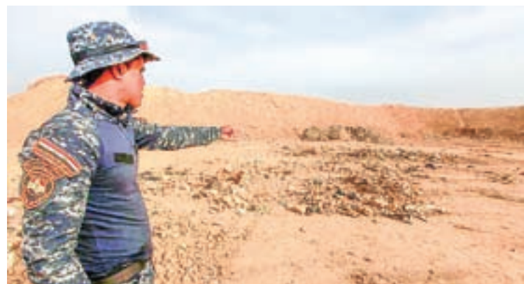
A member of Iraqi security forces gestures towards a mass grave for corpses in the town of Hammam al-Alil which was seized from Islamic State last week, Iraq, on 9 November 2016.

BAGHDAD — Islamic State militants probably killed more than 300 Iraqi former police three weeks ago and buried them in a mass grave near the town of Hammam al-Alil south of Mosul, Human Rights Watch said on Thursday.