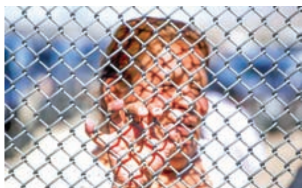
A Mexican migrant talks to a family member through the border fence between Ciudad Juarez and El Paso, United States, after a bi-national Mass in support of migrants in Ciudad Juarez, Mexico, on 15 February 2016.

Correction Notice In this Trademark cautionary notice for NUTRILITE published in this newspaper on 10 November 2016, on page 13, please read as 4/12541/2013 instead of 4/12542/2013.