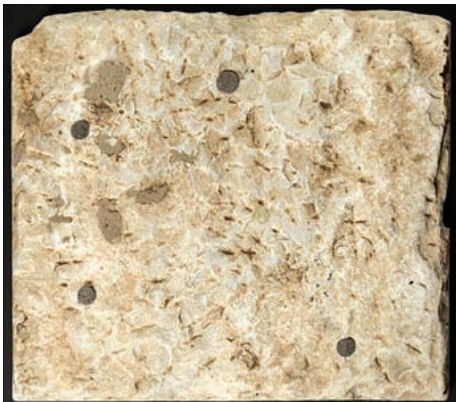
A stone tablet thought to be about 1,500 years old with a, worn-down chiseled inscription of the Ten Commandments is seen in this photo released in Dallas, Texas, US, on 21 October 2016.

It was probably chiseled during the late Roman or Byzantine era, between 300 and 500 A.D., and marked the entrance of an ancient synagogue that was likely destroyed by the