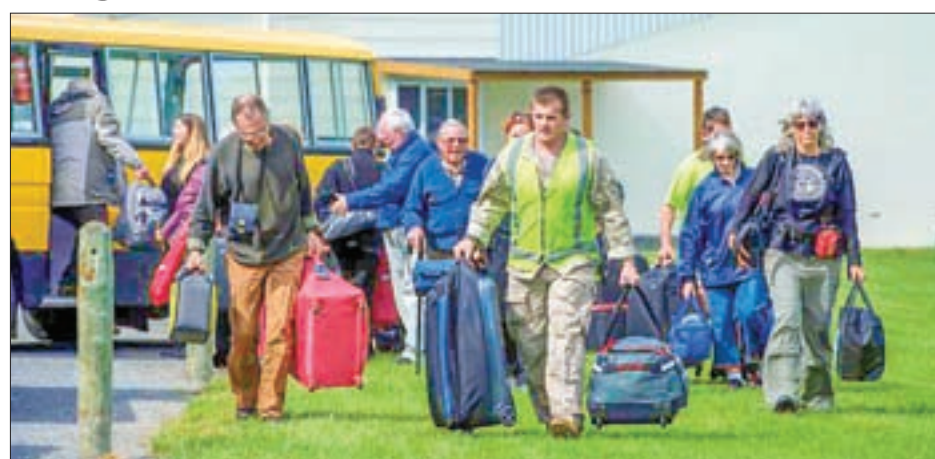
Royal New Zealand Air Force personnel lead those stranded by an earthquake to an NH90 helicopter to evacuate them from Kaikoura on the South Island of New Zealand, on 16 November 2016.

"We are really concerned about the changing weather situation," she told reporters. "It could mean that there's an increased risk