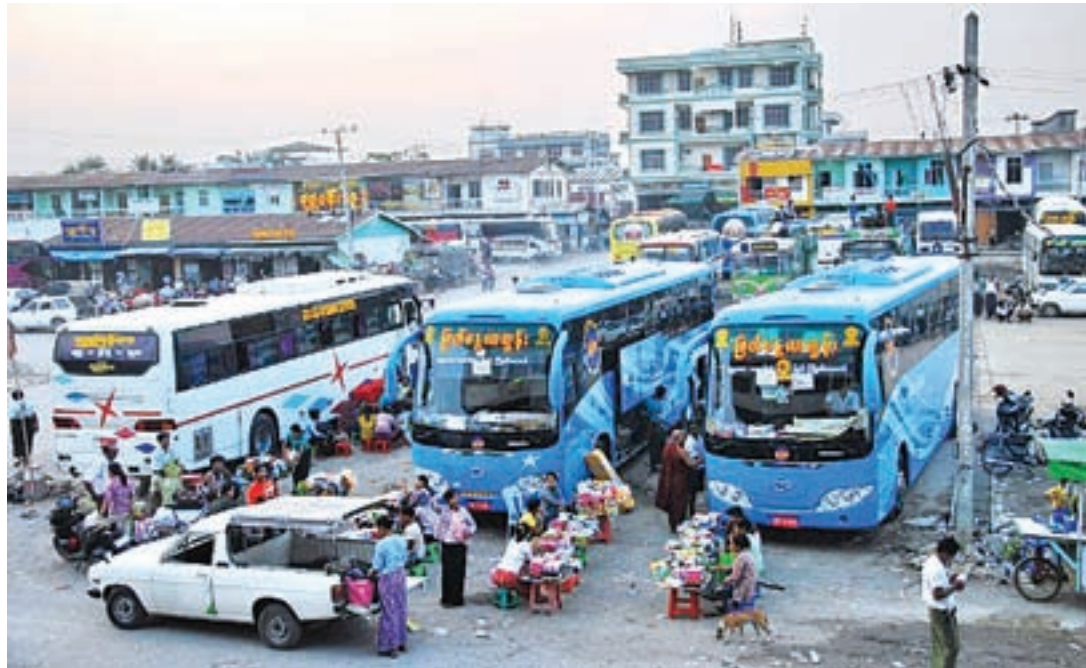
Photo shows Chanmyashwepyi Highway Bus Terminal in Mandalay.

MANDALAY City Development Committee plans to improve the Chanmyashwepyi (Kywesekan) Bus Terminal located about 10 km (8 miles) central Mandalay, before the end of this year.