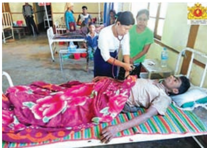
The suspect receives medical check-up from a nurse.