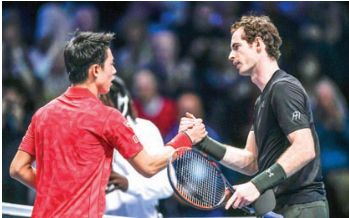
Great Britain's Andy Murray and Japan's Kei Nishikori shake hands after their round robin match during Barclays ATP World Tour Finals at O2 Arena, London, on 16 November 2016.

"I wasn't able to dictate many of the points," Murray