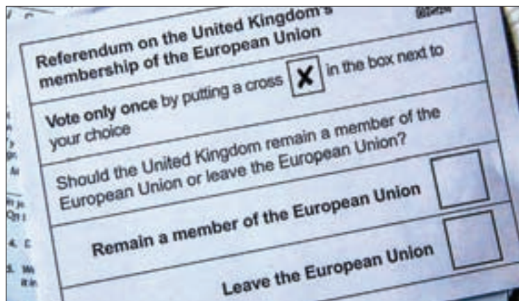
Illustration picture of postal ballot papers 1 June 2016 in London ahead of the 23 June BREXIT referendum when voters will decide whether Britain will remain in the European Union.

The survey also found a majority of Leave voters backed free trade, financial passporting and following EU manufacturing regulations, while a majority of Remain voters supported limiting immigration and introducing customs. Prime Minister Theresa May, who quietly argued to remain in the EU ahead of the vote, has argued that she must implement the wishes of the British people and control immigration while preserving as much access as possible to EU markets. But EU leaders have repeatedly said that access to the EU's single market is contingent on free movement of people. If May is forced to make a choice, the survey has a difficult fact for business: Of those who say they would vote for her ruling Conservative Party at the next election, 60 per cent are against allowing freedom of movement in return for free trade. —Reuters