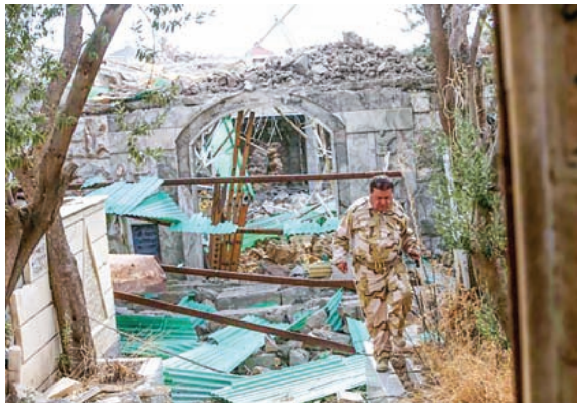
A Yazidi man inspects a temple destroyed by the Islamic State militants in the town of Bashiqa, after it was recaptured from the Islamic State, east of Mosul, Iraq, on 10 November 2016.

Islamic State has killed Muslims and non-Muslims alike, but has been particularly brutal with the Yazidi minority, whose beliefs combine elements of several