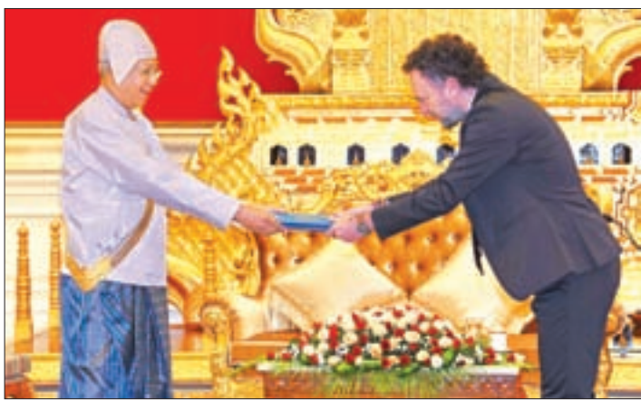
President U Htin Kyaw accepts credentials from Mr Kreso Glavac, the newly-accredited Ambassador of the Republic of Croatia.

Present on the occasion were Minister of State for Foreign Affairs U Kyaw Tin and Director-General U Ko Ko Naing of the Protocol Department.— Myanmar News Agency