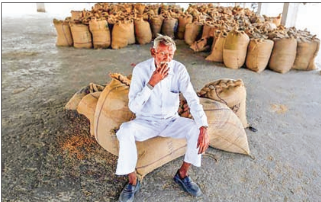
A farmer smokes while sitting on sacks of paddy crops as he waits for customers, one week after the Indian government withdrew the circulation of high denomination banknotes, in Sanand village on the outskirts of Ahmedabad, India, on 15 November 2016.