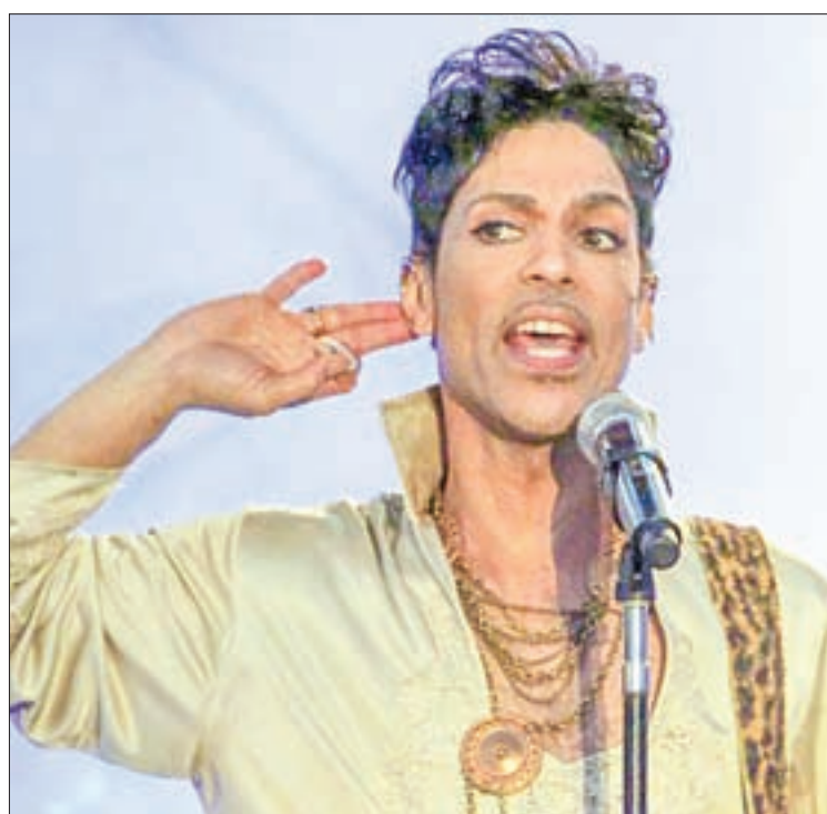
US musician Prince performs at the Hop Farm Festival near Paddock Wood, southern England in 2011. PHOTO: REUTERS

He was also known as fiercely determined to maintain creative control over his music, famously changing his name to an unpronounceable symbol for several years during a bitter contract battle with Warner Bros.—Reuters