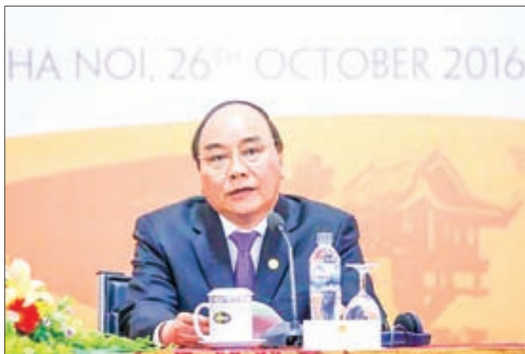
Viet Nam's Prime Minister Nguyen Xuan Phuc speaks during a news conference after the 8 th Cambodia-Laos-Myanmar-Viet Nam Summit (CLMV-8) and the 7 th Ayeyawady-Chao Phraya-Mekong Economic Cooperation Strategy Summit (ACMECS-7) in Hanoi, Viet Nam, on 26 October 2016.

HANOI — Viet Nam will shelve ratification of a US-led Pacific trade accord due to political changes ahead in the United States, but wants to maintain good relations with Washington as much as it does all other countries, its prime minister said on Thursday.