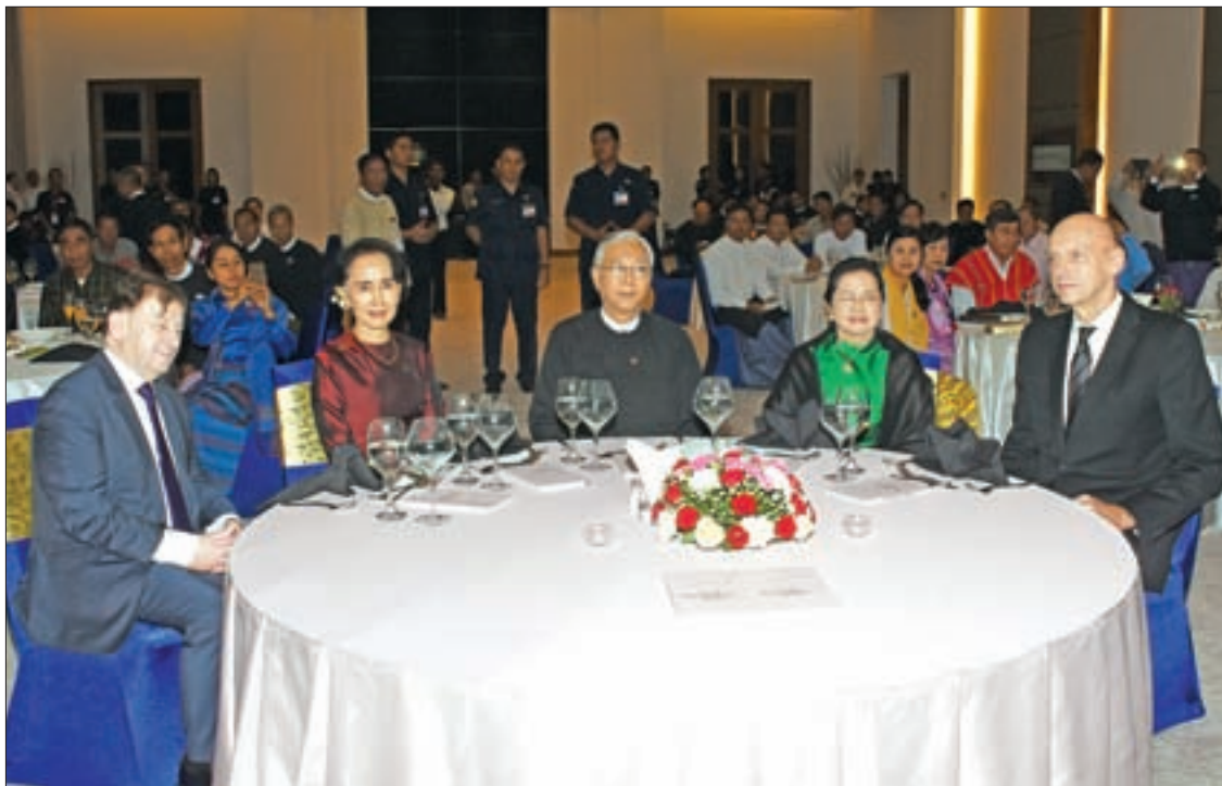
President U Htin Kyaw and wife Daw Su Su Lwin, and State Counsellor Daw Aung San Suu Kyi attend the 80th Anniversary of the birth of the Former Czech President, Mr. Vaclav Havel.

He is considered by some to be one of the most important intellectuals of the 20th century. He passed away on 18 December 2011.— Myanmar News Agency