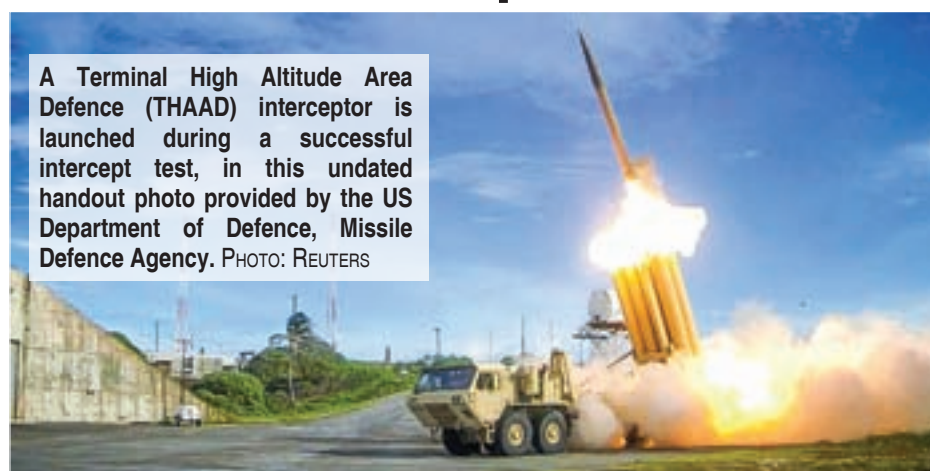
A Terminal High Altitude Area Defence (THAAD) interceptor is launched during a successful intercept test, in this undated handout photo provided by the US Department of Defence, Missile Defence Agency. PHOTO: REUTERS

South Korea and the United States have agreed to deploy a Terminal High Altitude Area Defence (THAAD) anti-missile system to counter missile threats from North Korea. It is expected to be in place within eight to 10 months, the commander of US forces in South Korea said earlier this month. China has argued the planned deployment undermines strategic stability in Northeast Asia, and worries that THAAD's powerful radar provides coverage of