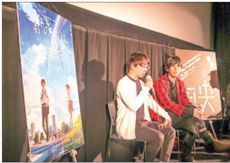
Japanese animation film director Makoto Shinkai (L) and RADWIMP singer Yojiro Noda appear in an event in Tokyo, 27 on October 2016. Shinkai's film "your name." was featured at the Tokyo International Film Festival from 25 October to 3 November.

TOKYO — Having taken Japan by storm, the animated film "your name." continued on its soaring popularity to top the box offices in both Hong Kong and Thailand over the past weekend, the film's distributor Toho Co. said on Wednesday.