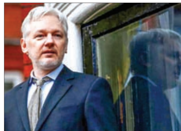
WikiLeaks founder Julian Assange makes a speech from the balcony of the Ecuadorian Embassy, in central London, Britain, on 5 February 2016.