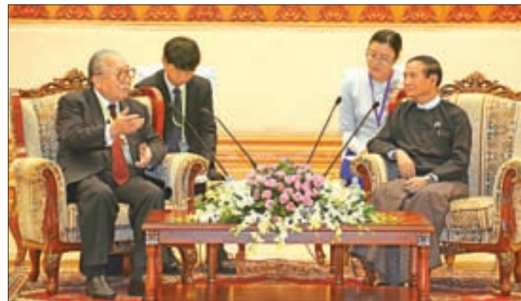
Speaker of Pyithu Hluttaw U Win Myint receives Mr Hideo Watanabe, Chairman of the Japan-Myanmar Friendship Association.

Concerning a question raised by a representative on the use of motorcycles in the satellite towns of Yangon, Deputy Minister U Kyaw Myo of the Ministry of Transport and Communication said that it is too dangerous to use a motorbike in populous cities and the ministry has no plans at present to allow them. He also added that the Yangon Region Government has also announced publicly that they also have no plans to lift the motorcycle ban in the city. —Myanmar News Agency