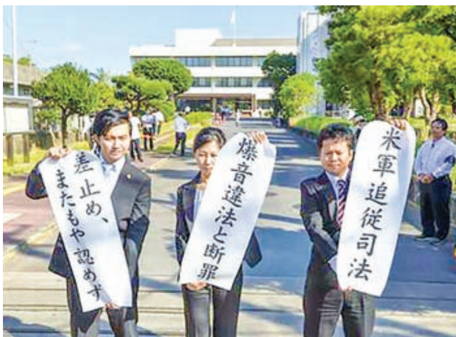
Lawyers representing those seeking a halt to flights at the US Marine Corps Air Station Futenma in Japan's southernmost island prefecture of Okinawa show banners proclaiming the content of a ruling by the Okinawa branch of the Naha District Court on 17 November 2016. While ordering the government to pay damages over aircraft noise around the base, the court rejected the demand for a flight halt.

It dismissed the plaintiffs' request to suspend flights with noise levels exceeding 40 decibels early in the morning and at night as well as 65 decibels at other