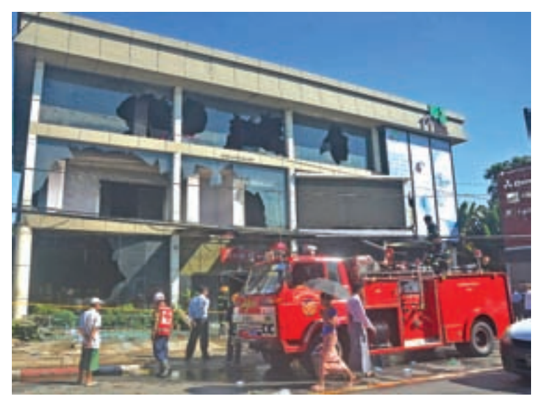
The scene of outbreak of fire in Mayangon.

The fire is the thirteenth in the month of November in the Yangon Region. - Myanmar News Agency