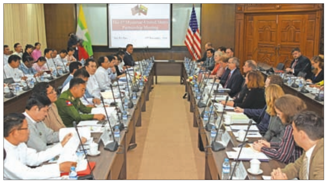
1st US-Myanmar Partnership meeting is in progress at Ministry of Foreign Affairs in Nay Pyi Taw.

During the meeting, both sides discussed matters on the promotion of bilateral relations and cooperation between Myanmar and the US including cooperation in trade and investment sector, health and education sector, tourism sector, combating drugs and human trafficking and capacity building for government officials.— Myanmar News