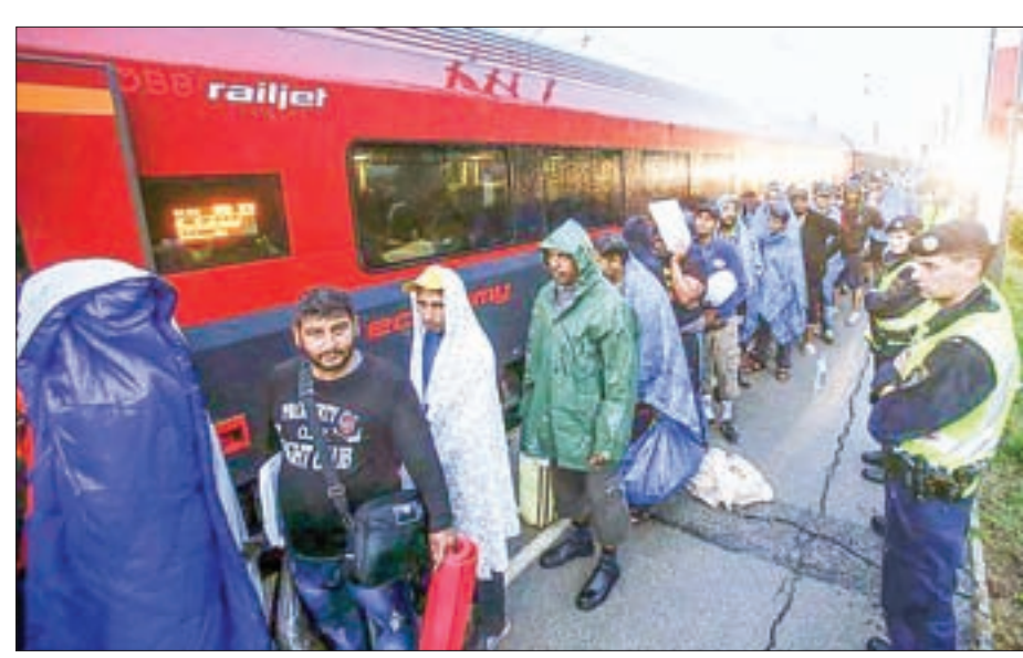
Migrants arrive at the Austrian train station of Nickelsdorf to board trains to Germany, on 5 September, 2015.

The flow of migrants into Austria has slowed