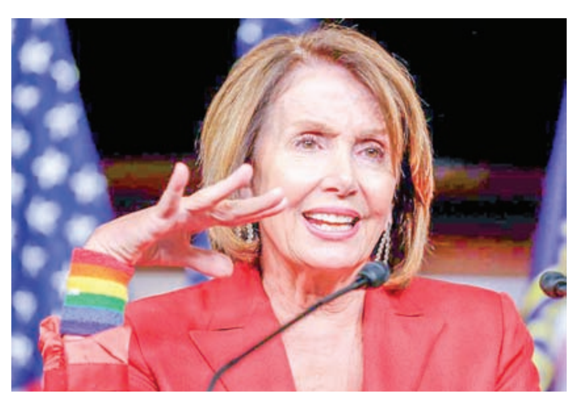
House Minority Leader Nancy Pelosi (D-CA) speaks during a media briefing on Capitol Hill in Washington, US, on 7 July, 2016.

WASHINGTON - Nancy Pelosi may face a challenge to her 14-year-old role as the leading Democrat in the US House of Representatives now that Republicans have captured the White House and maintained their grip on Congress.