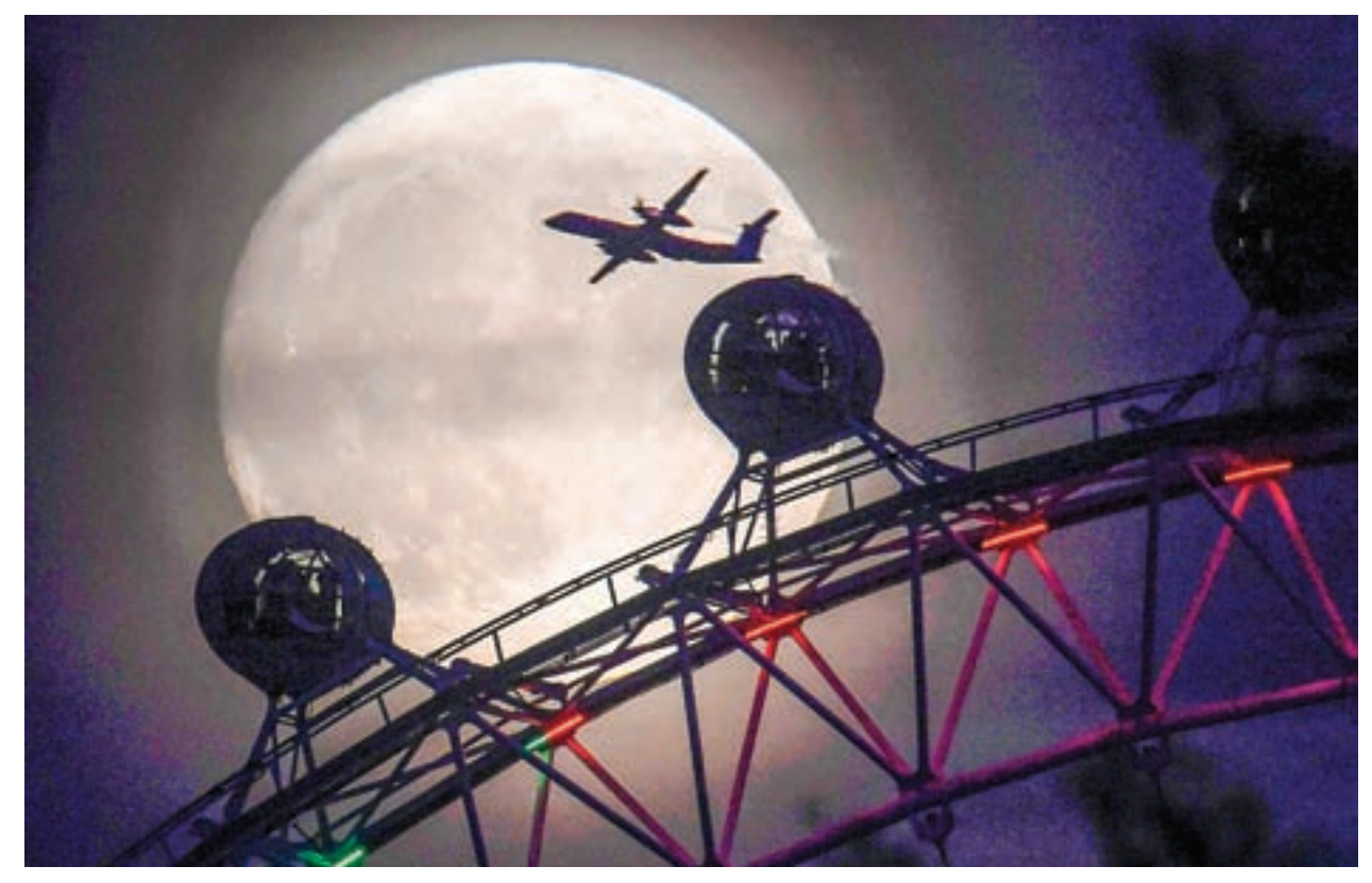
An aeroplane flies past the London Eye wheel, and moon, a day before the 'supermoon' spectacle in London, Britain.

moon. It was so cool to see in person," Iacoi said.