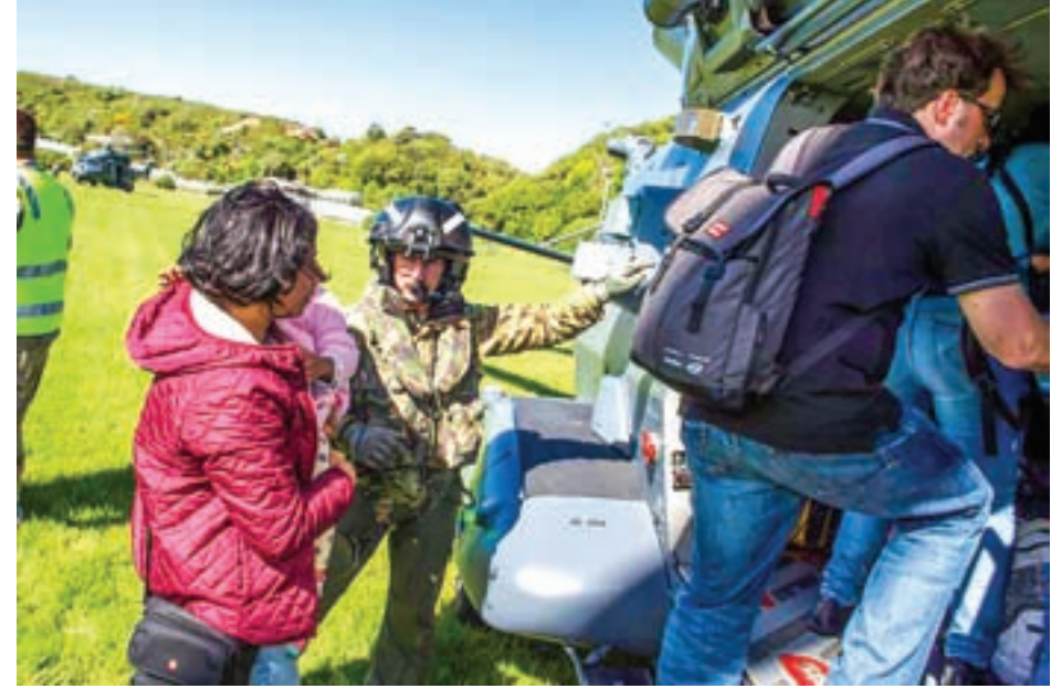
A Royal New Zealand Air Force NH90 helicopter arrives in Kaikoura on the South Island of New Zealand on 15 November, 2016, to evacuate those stranded following the recent earthquakes.

The Red Cross, which used defence force helicopters to bring in emergency generators, satellite communications and water bladders, said water in the town was running out.