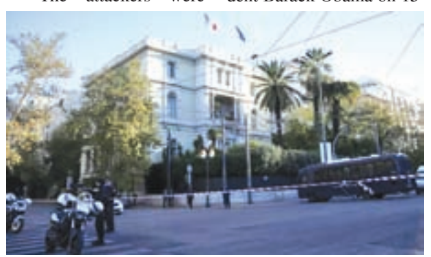
Police stand outside the French embassy, where unidentified attackers threw an explosive device causing a small blast, in Athens, Greece, on 10 November, 2016.

they threw the hand grenade outside the building opposite parliament, in one of Athens's best-guarded areas. The attack occurred less than a week before a planned visit by US President Barack Obama on 15-