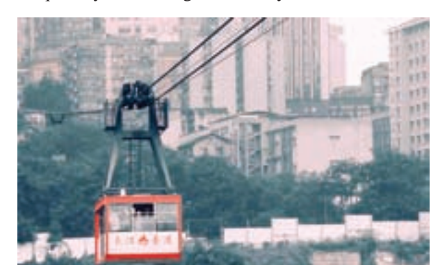
Photo taken by the author shows a cable car crossing the Yangtze River in Chongqing Municipality, southwest China, on 3 November 2016.

(For Detailed Schedule – www.mvanmaritv.com/schedule)