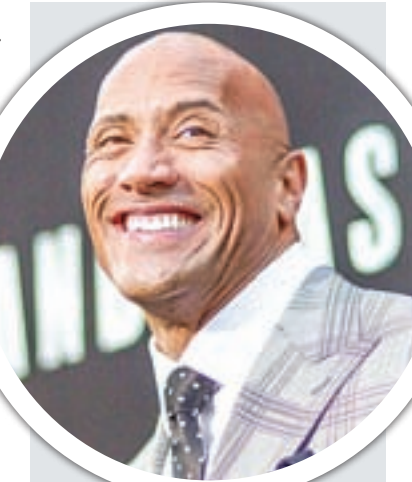
Actor Dwayne Johnson.

son's name has been mentioned in political circles.