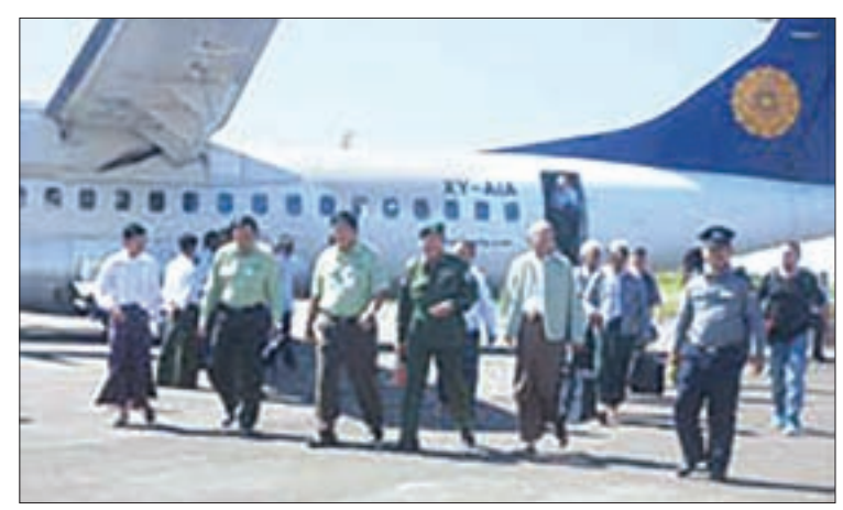
Members of Advisory Commission on Rakhine State arrives Sittwe.