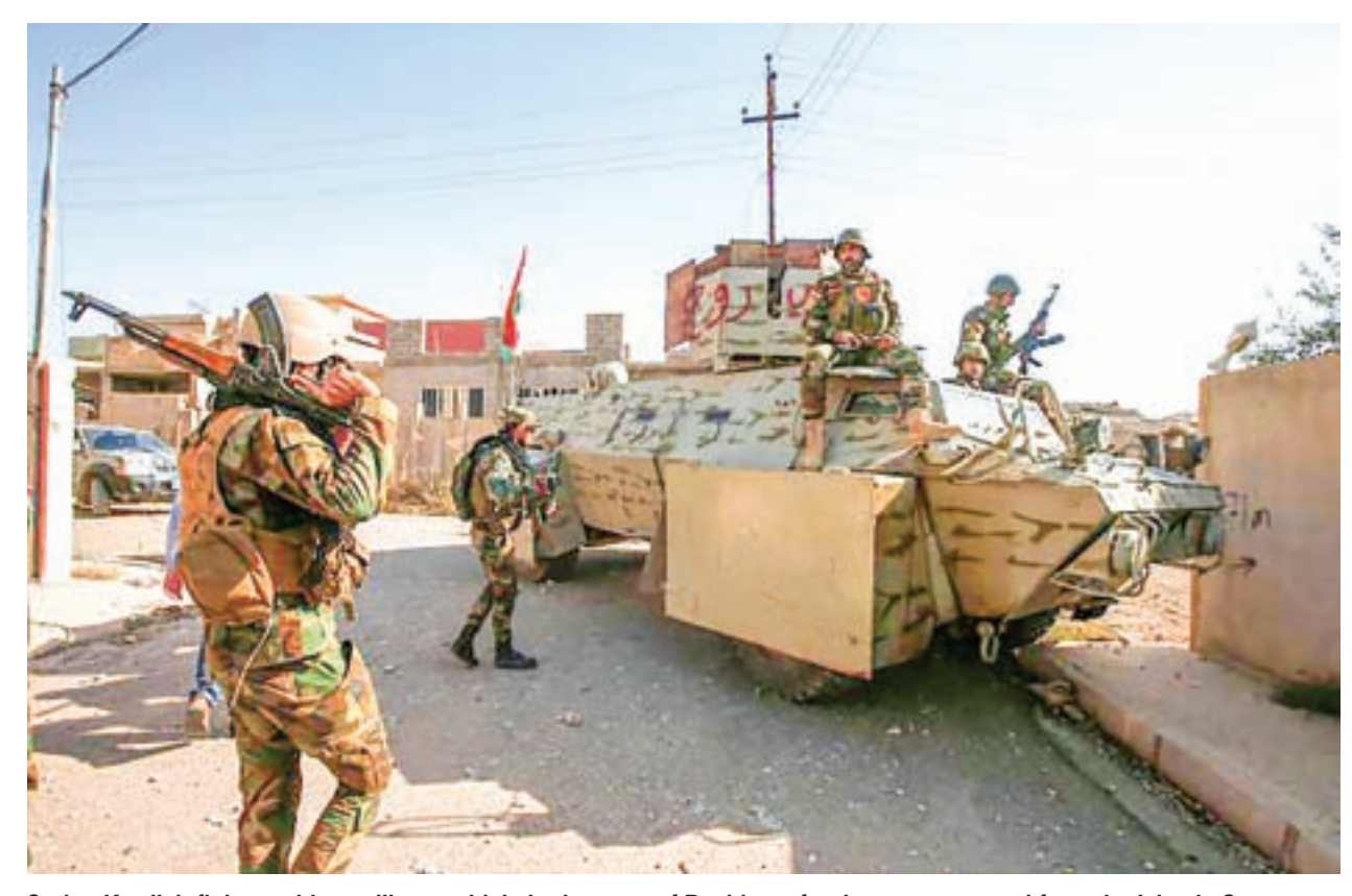
Syrian Kurdish fighters ride a military vehicle in the town of Bashiqa, after it was recaptured from the Islamic State, east of Mosul, Iraq, on 12 November, 2016.