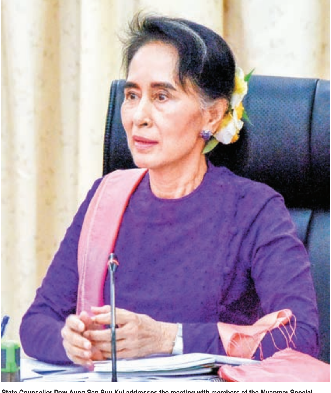
State Counsellor Daw Aung San Suu Kyi addresses the meeting with members of the Myanmar Special Economic Zone in Nay Pyi Taw.