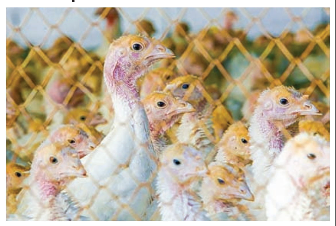
File image of poultry is seen in a cage in the Israeli village of Aviel in 2008.

PARIS — Israel has reported an Hefzi-Bah in the northern disoutbreak of highly contagious H5N8 bird flu virus on a farm, a case likely due to contact with wild birds migrating from Europe, international animal health body OIE said on Monday.