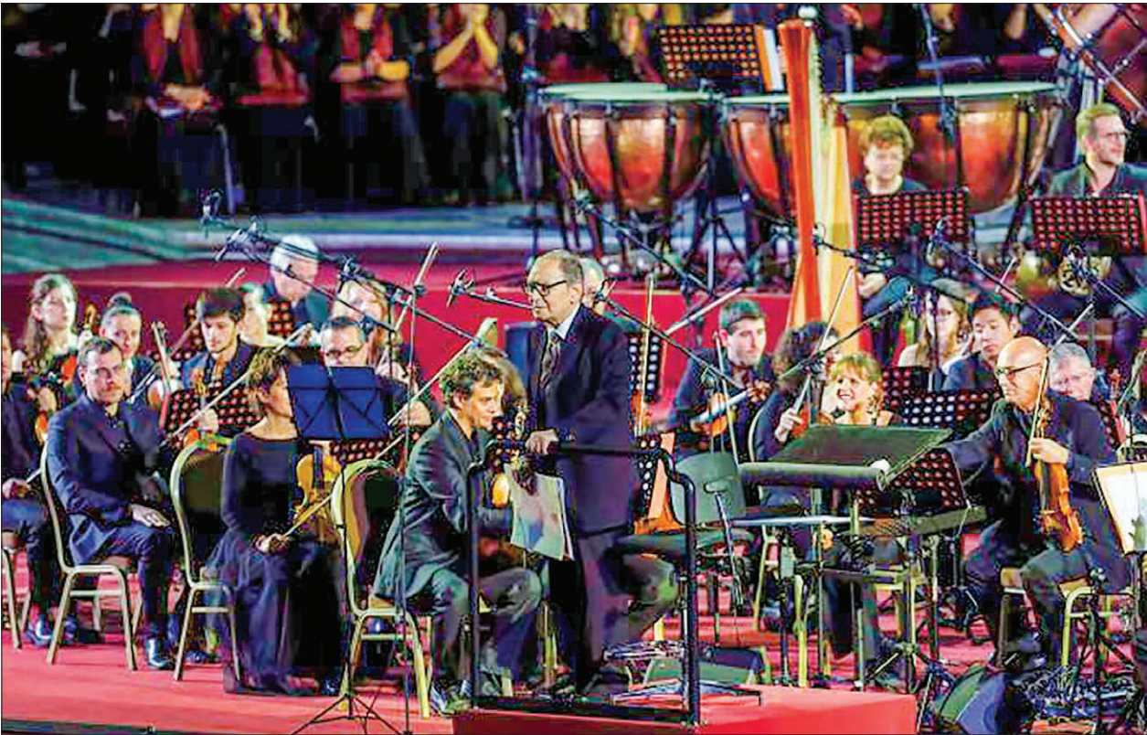
Italian composer Ennio Morricone conducts during a Jubilee concert in Paul VI hall at the Vatican on 12 November, 2016.