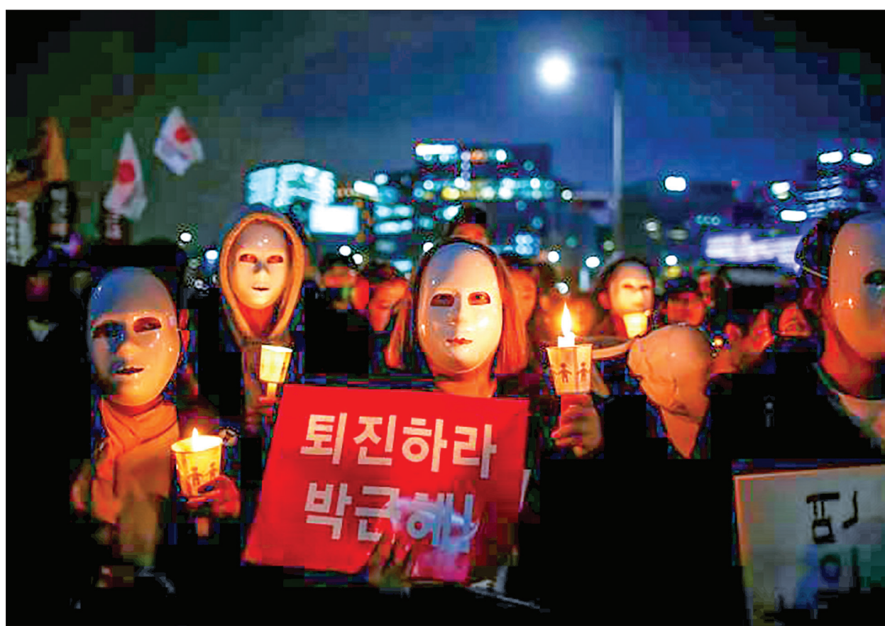
People march toward the Presidential Blue House during a rally calling for President Park Geun-hye to step down in central Seoul, South Korea, on 12 November, 2016. The sign reads: ‘Step down Park Geun-hye.’

Prosecutors have already questioned the de facto head of Samsung Group SAGR.U.L Jay Y.