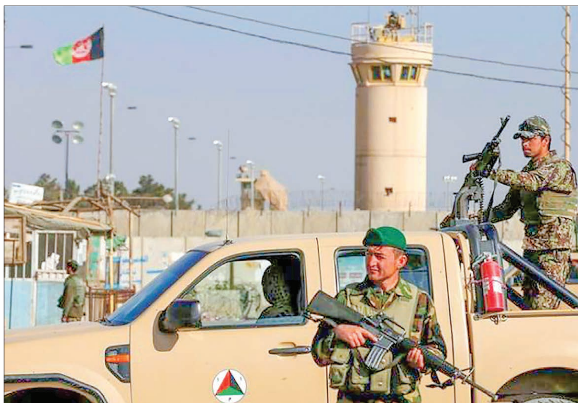
Afghan National Army (ANA) soldiers keep watch outside the Bagram Airfield entrance gate, after an explosion at the NATO air base, north of Kabul, Afghanistan on 12 November, 2016.

The NATO-led Resolute Support mission response teams