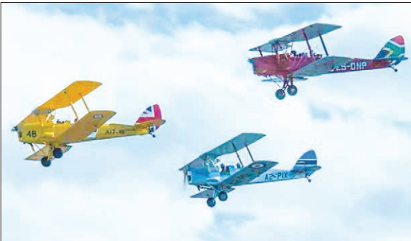
Biplanes representing Britain, Botswana and South Africa fly during the start of the Vintage Air Rally over the airport of Sitia on the island of Crete, Greece, on 11 November, 2016.

ATHENS — Twelve vintage biplanes from the 1920s and 1930s set off from the Greek island of Crete on Saturday bound for South Africa for a 12,800-kilometre (8,000-mile) race never attempted before by so many antique aircraft. The planes are following the route plied by Imperial Airways, a British commercial air transport company that linked Britain's colonies in Africa. The trip is expected to take 35 days and teams are representing 18 countries, including Canada, Ireland, New Zealand, Russia, South Africa, the United States and Britain. They will travel through 10 nations such as Egypt, Botswana, Zanzibar, Zimbabwe and Tanzania and make 37 stops en route before finishing in Cape Town. "Hopefully, we'll all get there and have a massive party when we arrive," said Vintage Air Rally organiser Sam Rutherford. The planes will make a stop at the Giza pyramids in Egypt, the first time a group of aircraft have been allowed to land there in 80 years. The plane flown by Robert Redford in the Oscar-winning film "Out of Africa", which he starred in with Meryl Streep, will join the journey in Kenya. Pilots will be challenged by weather conditions in open cockpits and will sleep in deserts, under the wings of their planes in tents and on riverboats on the Nile.—Reuters