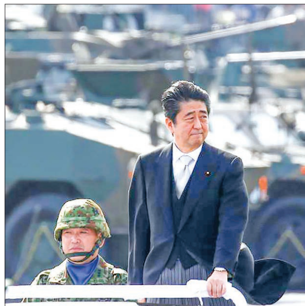
Japanese Prime Minister Shinzo Abe reviews Japanese Self-Defence Forces' (SDF) troops during the annual SDF ceremony at Asaka Base, Japan, On 23 October, 2016.

With Abe set to meet Trump in New York on his way to an Asia-Pacific summit in Peru, Tokyo has been seeking clarity on what direction the Republican political novice wants for bilateral relations after he made comments on the campaign trail that were at odds with longstanding policies.