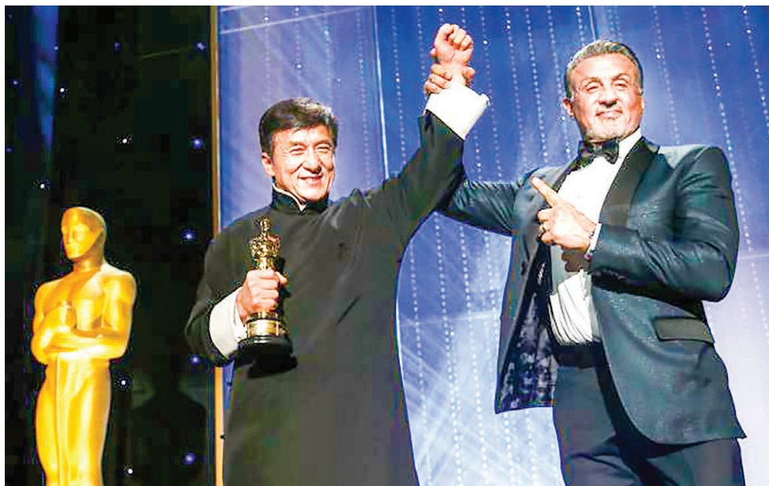
Actor Jackie Chan is congratulated by fellow actor Sylvester Stallone (R) after accepting his Honorary Award at the 8th Annual Governors Awards in Los Angeles, California, US, on 12 November, 2016.

his "Rush Hour" co-star Chris Tucker, actress Michelle Yeoh and Tom Hanks, who referred to him as "Jackie 'Chantastic' Chan."