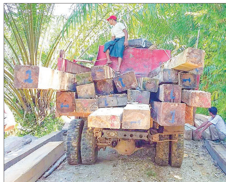
Seized timber are seen on way to a local police station.

The tents were accidentally discovered by a search team for water resources led by District Chairman of the National League for Democracy and an official of Green Network, an NGO. They reported on the discovery to the state Natural Resources and Environmental Conservation Minister. Authorities said that action will be taken against them according to the law.—Kyaw Soe (Kawthoung)