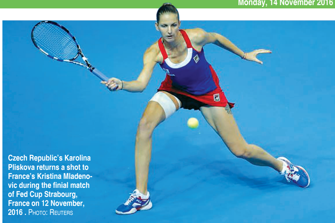
Czech Republic's Karolina Pliskova returns a shot to France's Kristina Mladenovic during the final match of Fed Cup Strasbourg, France on 12 November, 2016.

Pliskova appeared to be cruising toward victory after breezing through the first set but then lost her focus in the second to allow Mladenovic back in the contest.