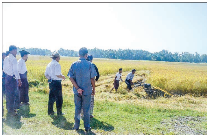
Authorities observe harvesting of rice at Mawrawady Village. PHOTO: MNA

The department has provided two harvesters each to villages in the township, making a total of 40 harvesters.— Myanmar News Agency