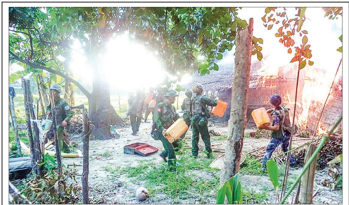
Government troops extinguishing fire at Warpaik Village. (NEWS ON PAGE-1)

The Senior General and party arrived back in Rome at 6 pm local time.—Myanmar News Agency