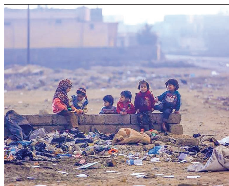
Children gather as smoke rises from oil wells, set ablaze by Islamic State militants before the militants fled the oil-producing region of Qayyara, Iraq, on 12 November, 2016.

The CTS special forces spearheading the advance into Mosul are part of a 100,000-strong force of army, security forces, Kurdish