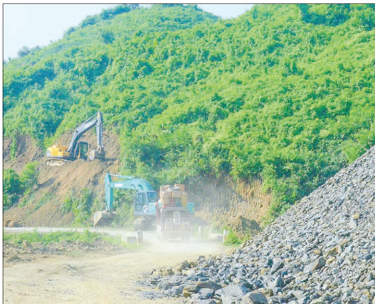
Buthidaung-Maungtaw road being upgraded recently.

"We never closed the tunnels but almost all vehicles are using the round road," U Zaw Min said.