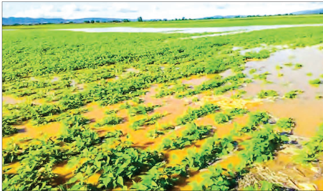
Groundnut plantation are submerged in Katha, Sagaing Region.

MORE THAN 200 acres of bean and pulse plantations in Katha District in Sagaing Region were destroyed by floods caused by torrential rain in first week of this month, local growers say.