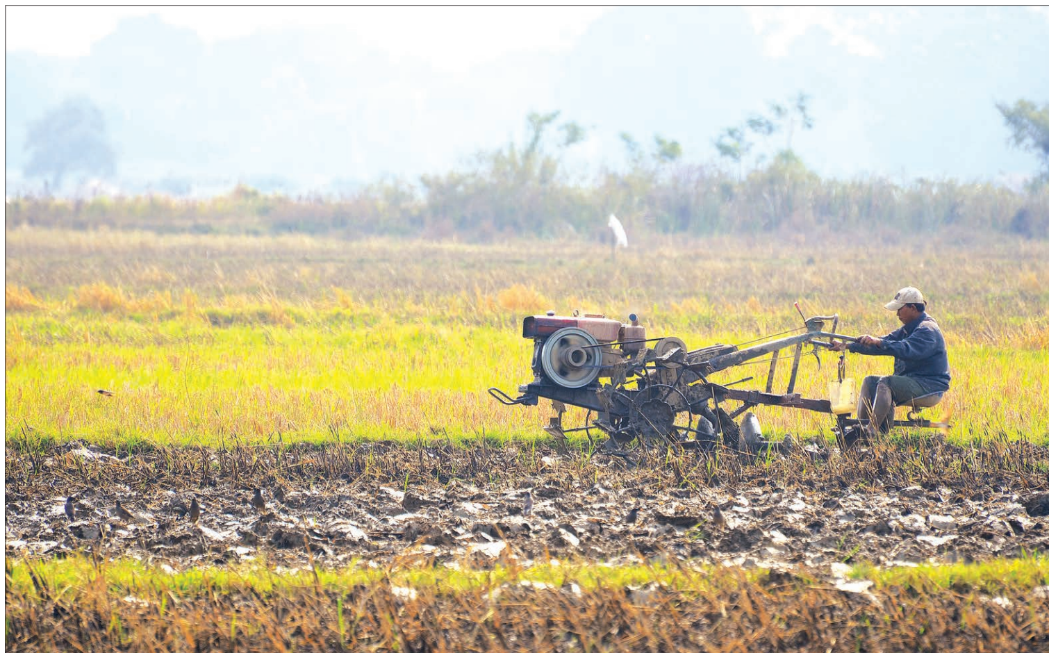
A farmer being seen ploughing on a field in Zigon, Bago Region.

Only 12.5 per cent of the total volume of rice from Myanmar flows into foreign market. Local consumption is found to be the major market. The decrease in production in 2015 and 2016 was attributed to flooding for two straight years, plus the high cost of input materials: fertiliser and pesticides. The high production cost resulted in an increase in price. The volume of rice exports in the 2015-2016 fiscal year slumped by 296,656 metric tonnes, whereas that of broken rice slumped by 50,687 metric tonnes when com-