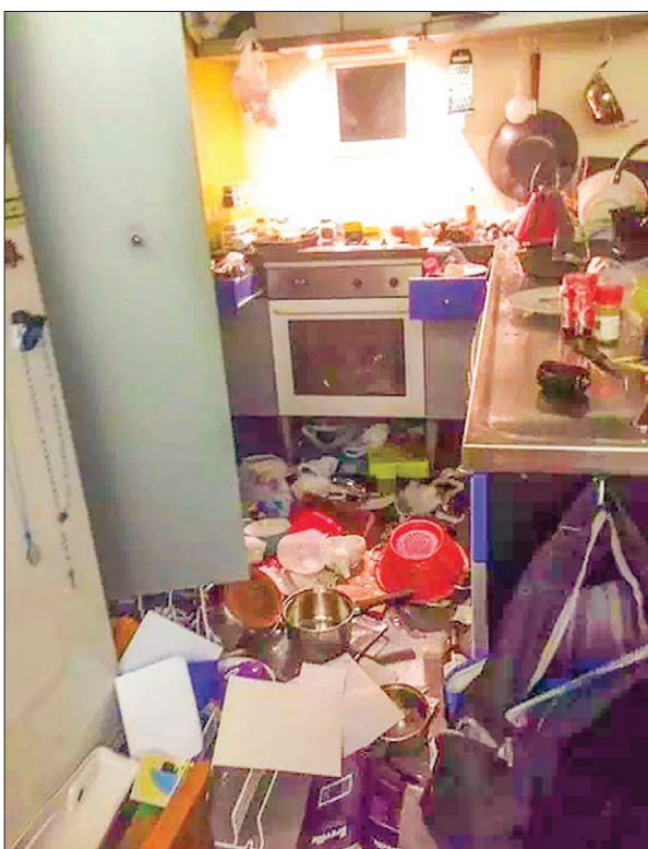
Photo taken on 14 November 2016 (local time) shows a kitchen of a house in Wellington, New Zealand. A major earthquake rocked South Island of New Zealand in the wee hours of Monday, followed by a series of strong aftershocks and a tsunami warning.

Residents in Wellington said glass had fallen from buildings into the streets and hotels and