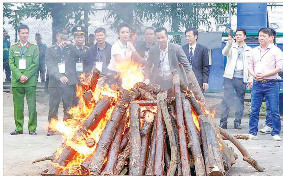
Seized elephant ivory and rhino horns are destroyed by Vietnamese authorities in Hanoi on 12 November, 2016.

HANOI — Viet Nam destroyed nearly 2.2 tonnes of seized elephant ivory and 70 kg of rhino horns on Saturday, in one of its strongest moves yet to stop illegal wildlife trafficking.