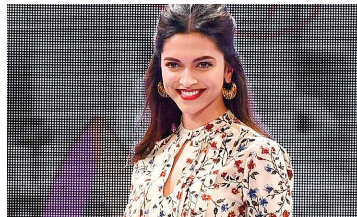
Deepika Padukone.

MUMBAI — Bollywood stars Shahid Kapoor, Deepika Padukone, Kareena Kapoor Khan and Taapsee Pannu have welcomed the government's move to scrap Rs 500 and 1000 notes.