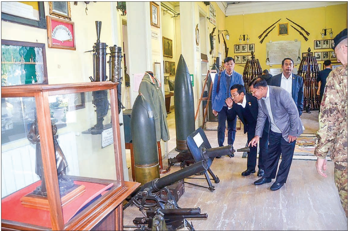
Senior General Min Aung Hlaing visits the historical museum of Granatieri in Rome.