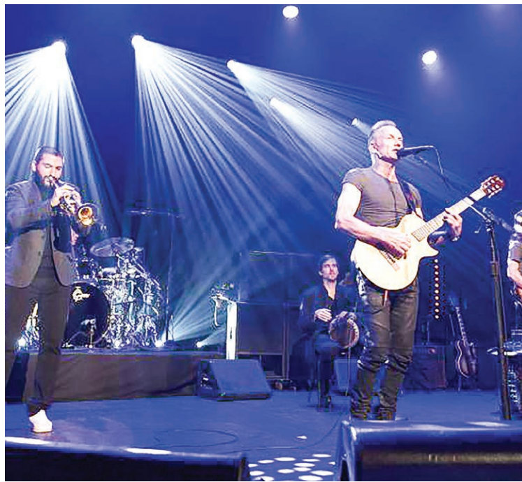
Musician Sting performs at the Bataclan concert hall in Paris, France, on 12 November, 2016, one year after the deadly Paris attacks.

PARIS — Rock star Sting headlined a concert in Paris' Bataclan music hall on Saturday to mark the venue's reopening a year after three Islamist militants gunned down 90 revelers in France's bloodiest terror attack.