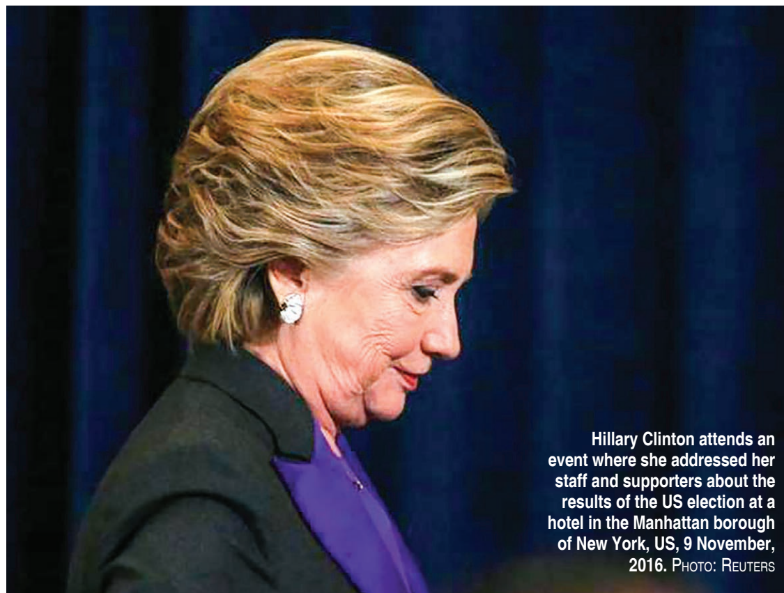
Hillary Clinton attends an event where she addressed her staff and supporters about the results of the US election at a hotel in the Manhattan borough of New York, US, 9 November, 2016.