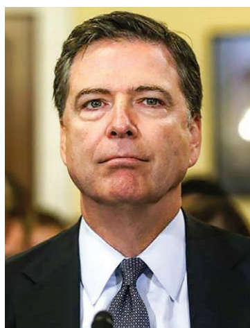
FBI Director James Comey testifies before a House Homeland Security Committee hearing on Capitol Hill in Washington, US on 14 July, 2016.

Comey sent a letter to Congress only days before the election announcing that he was reinstating an investigation into whether Clinton mishandled classified information when she used a private email server while secretary of state from 2009 to 2012.