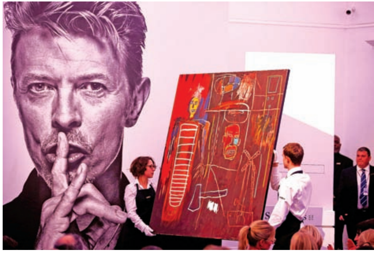
Jean-Michel Basquiat's 'Air Power', owned by the late David Bowie, is removed from a plinth after selling for £6,200,000 at the 'Bowie/Collector' auction, at Sotheby's in London, Britain on 10 November 2016.

Service exports, despite an increase in tourism, were down $1.3 billion. While tourism is becoming increasingly important, receipts from healthcare and other professional workers sent overseas still make up the bulk of Cuban services.—Reuters