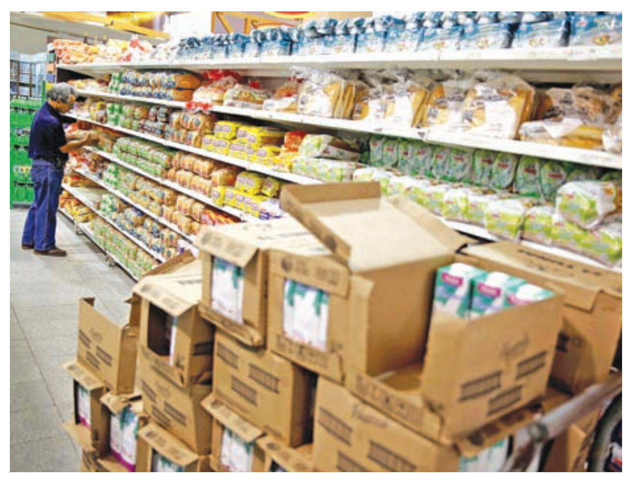
A man looks for groceries and goods at a supermarket in Caracas, Venezuela, on 11 November, 2016.

EU lawmakers are currently working on reforms of the market that will reduce the share of free carbon permits handed out after 2020 as part of an effort to fix the oversupply in the system and boost prices.-Reuters