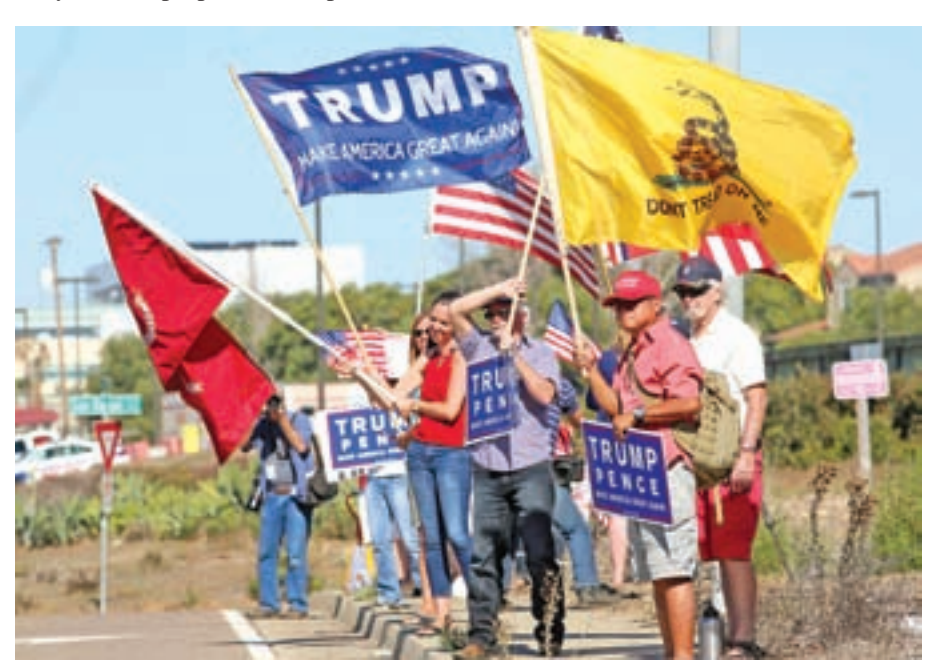
Demonstrators hold signs in support of President elect Donald Trump outside of Camp Pendleton in Oceanside, California, US, 11 on November 2016.