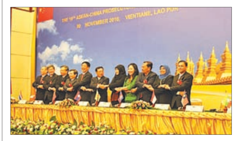
Prosecutors-General from ASEAN countries and China pose for a group photograph in ASEAN way at 10th ASEAN-China Prosecutors-General Conference. in Vientiane, Laos.

At the conference, the representatives of the China and ASE-AN member states signed the joint statement, agreeing to do further boosting their joint efforts through bilateral and multilateral cooperation mechanisms to tackle transnational crime.— Myanmar News Agency