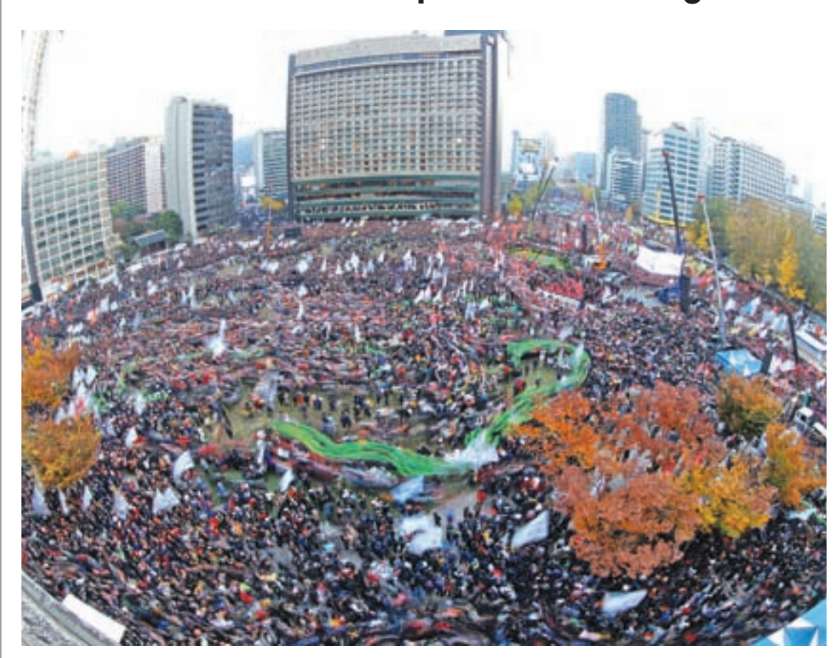
South Koreans march with candlelight towards the presidential house during a protest against South Korean President Park Geun-Hye on a main street in Seoul, South Korea, on 12 November 2016.

SEOUL — Hundreds of thousands of South Koreans are expected to march in Seoul, the capital city of South Korea, on Saturday night over a scandal involving President Park Geun-hye's longtime confidante and former key aides.