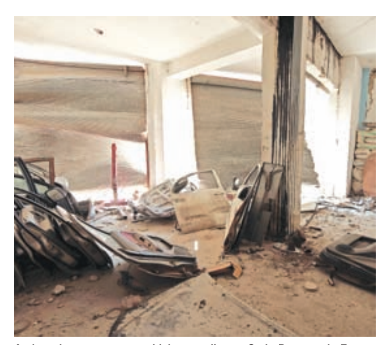
A view shows car parts, which according to Syria Democratic Forces fighters were used by Islamic State militants to prepare car bombs, at a workshop in Manbij, Syria.

AMSTERDAM — The executive body of the global chemical weapons watchdog voted on Friday to condemn the use of banned toxic agents by the Syrian government and by the militant group Islamic State, a source who took part in China, Sudan and Iran. There the closed session said.