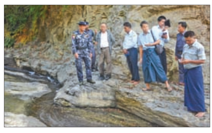
Minister U Aung Kyaw Zan inspects erosion of the river bank in Maungtaw Township.

Later, the minister and party inspected Maungtaw-Taungpyo-