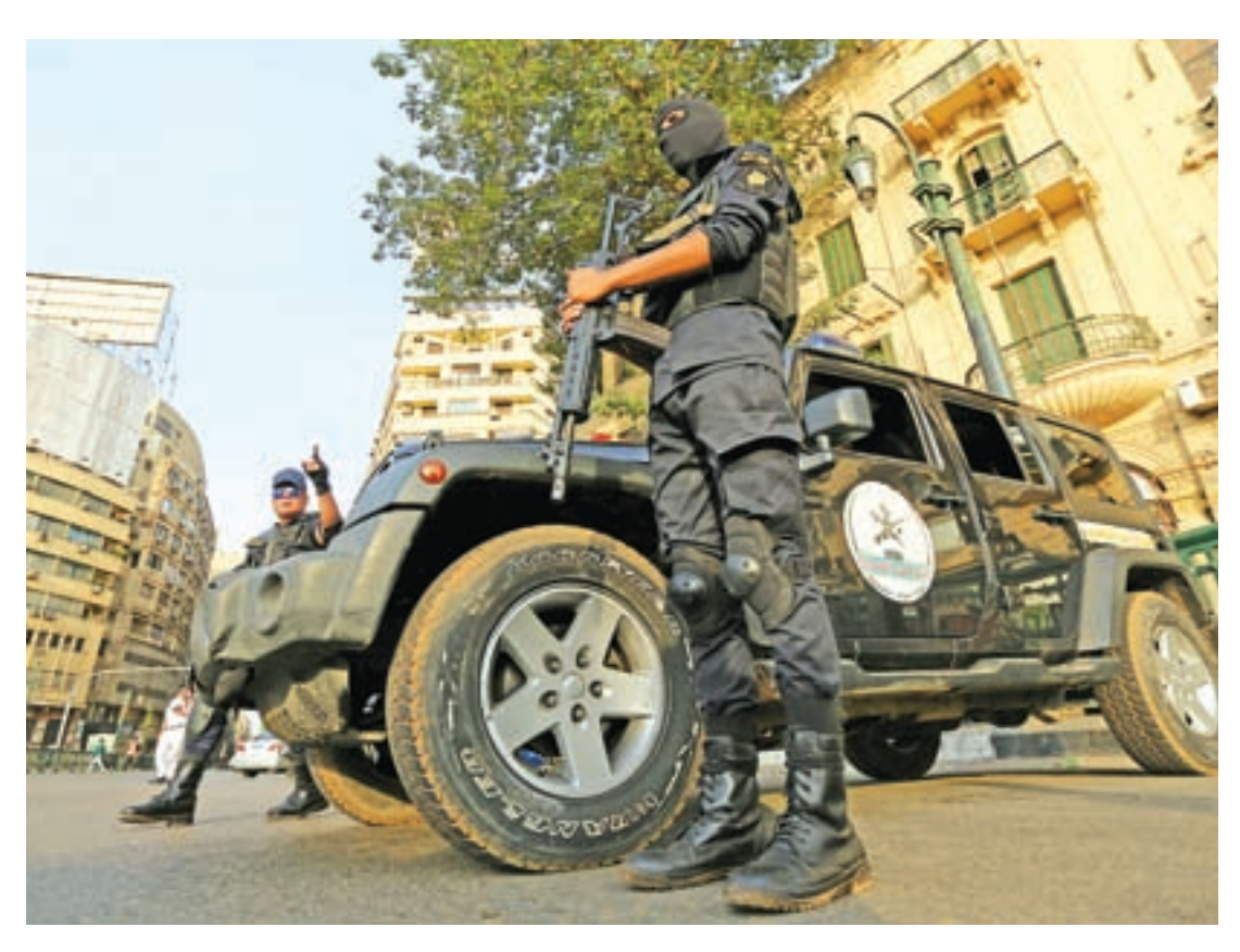
Members of security forces secure Tahrir Square in Cairo, Egypt, on 11 November 2016.

The calls to protest began in August, but gained traction on social media last week after Egypt raised fuel prices and floated its currency - a move welcomed by bankers but condemned by ordinary people as the latest blow to their diminish-