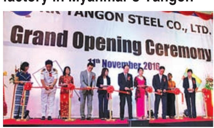
Officials of Japanese iron and steel trader R&K Trading Co. attend a ceremony in Yangon, Myanmar's largest city, on Nov. 11, 2016 to inaugurate a state-of-the-art steel factory.

YANGON — Japanese iron and steel trader R&K Trading Co. inaugurated a 1.5 billion yen ($14 million) state-of-the-art steel factory in Yangon, Myanmar's largest city, on Friday.