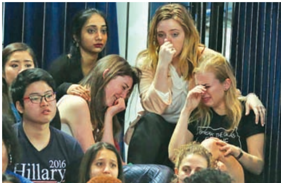
Supporters of Hillary Clinton react at her election night rally in Manhattan.