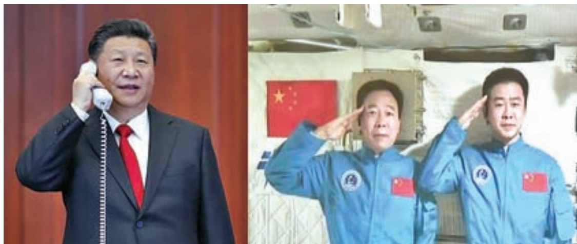
Combination photo taken on 9 November 2016 shows Chinese President Xi Jinping (L) talks with the two astronauts, Jing Haipeng and Chen Dong, in the space lab Tiangong-2, at the command centre of China's manned space program in Beijing, capital of China. PHOTO: XINHUA

Before the talk, Jing and Chen carried out an in-orbit maintenance test using man-robotics coordination, the first ever such test in space. — Xinhua