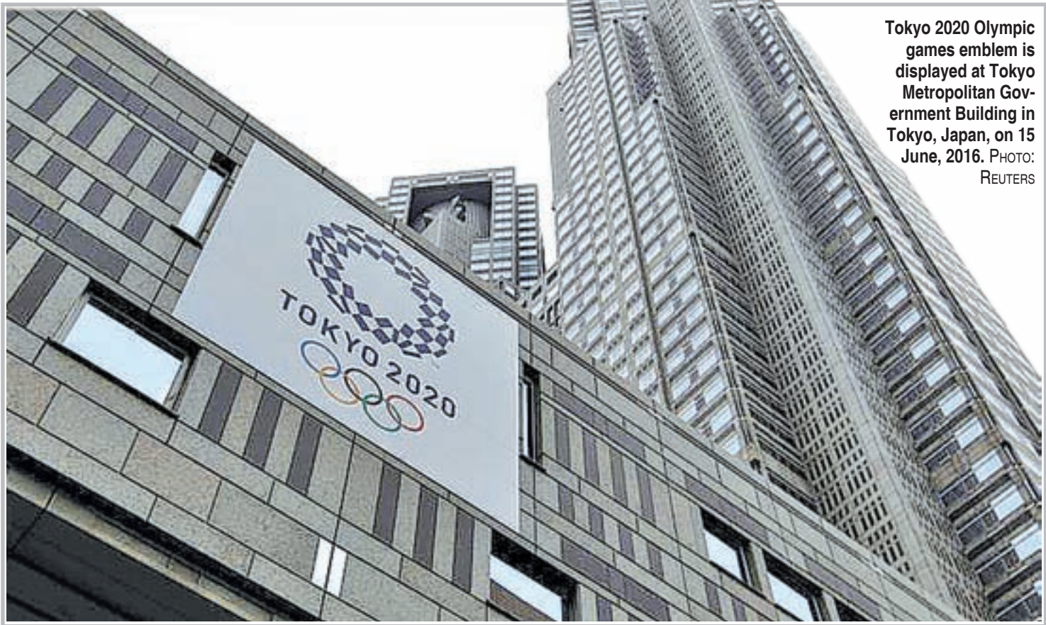
Tokyo 2020 Olympic games emblem is displayed at Tokyo Metropolitan Government Building in Tokyo, Japan, on 15 June, 2016.

"Sometimes a manager needs to be a psychologist as well, and also to be a counsellor because you can't treat everybody in the team (the same), every manager must know that. Every player in a team is different." Smalling has missed several United matches with a foot injury but took a pain-killing injection to play against Chelsea last month, according to British media reports. Shaw, who recently returned following a 10-month injury layoff, has had a mixed start to the campaign and lost his place in the starting line-up after Mourinho publicly criticised the 21-year-old following United's loss at Watford in September. "It's a short-term career and we're all human beings. I think that's what management these days has to be," Taylor added. "I'm not talking about being soft, I'm talking about being understanding because to even get to the top in football you have got to succeed as not so many actually make it in the game."—Reuters