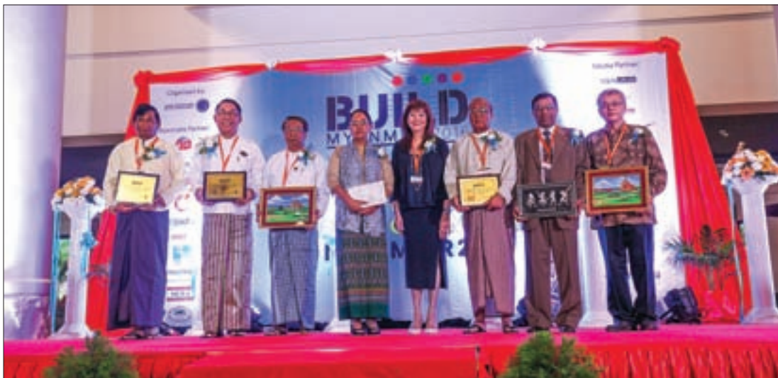
Attendees of a Build Myanmar conference posing for a group photograph.

BUILD Myanmar launched the inaugural event for infrastructure development, building and construction yesterday.