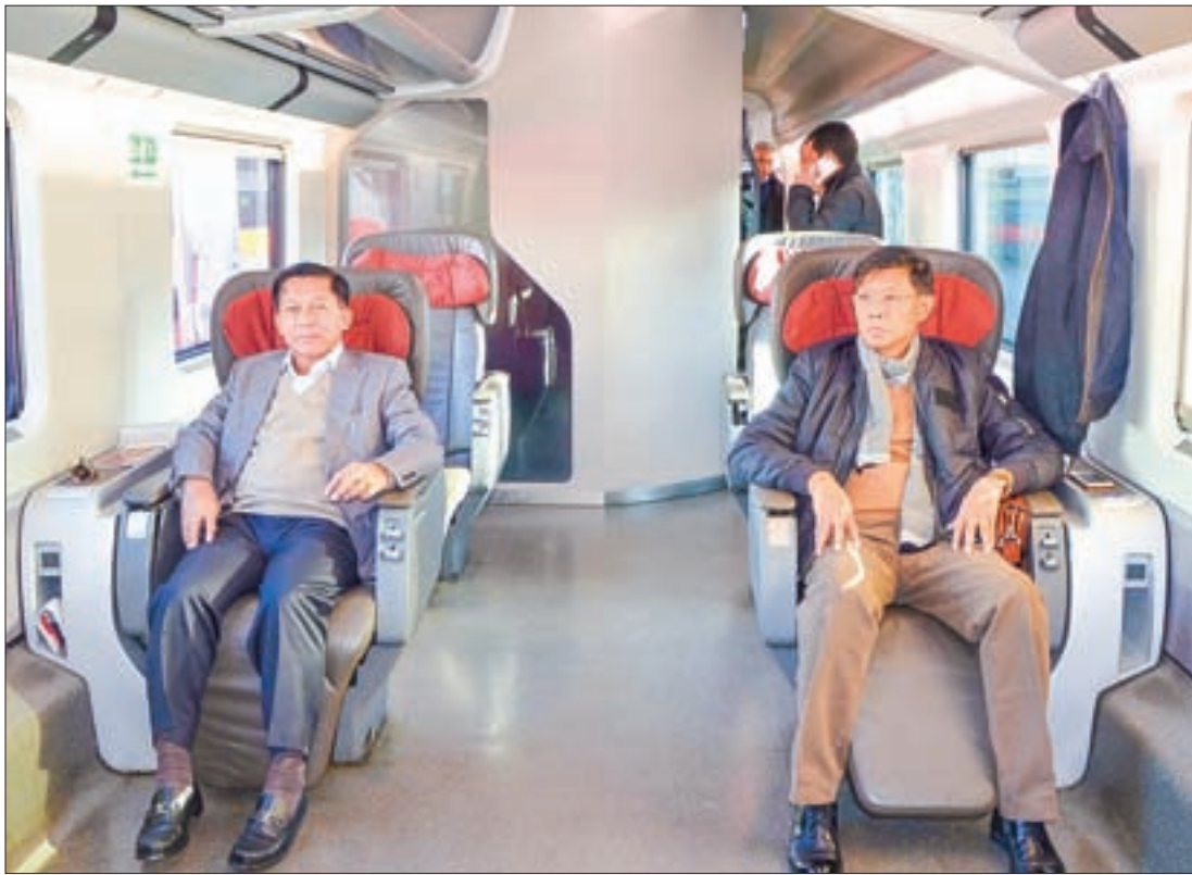
Senior General Min Aung Hlaing being seen on a special express train to Florence.

SENIOR General Min Aung Hlaing and party, currently in Venice, Italy, on a friendly visit, left Venice for Florence in the afternoon of November 9 in a special express train, arriving