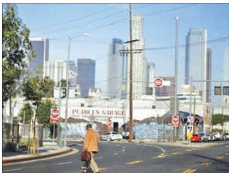
A man crosses the road in downtown Los Angeles, California, in 2015.

ing closely with President-elect Trump and his Administration across the federal government to deliver a 'New Games for a new Era' that will benefit and inspire the entire Olympic movement in 2024."