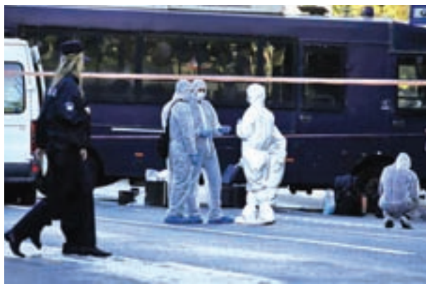
Forensics experts search for evidence outside the French embassy, where unidentified attackers threw an explosive device causing a small blast, in Athens, Greece, on 10 November 2016.

“Hate trumps love, I guess,” a supporter in the ballroom on Wednesday said, flipping the phrase Clinton had used to close her rallies.—Reuters