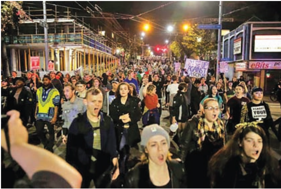
People march in protest to the election of Republican Donald Trump as President of the United States in Seattle, Washington, US, on 9 November, 2016.

CHICAGO/NEW YORK — Demonstrators marched in cities across the United States on Wednesday to protest against Republican Donald Trump's surprise presidential election win, blasting his campaign rhetoric about immigrants, Muslims and other groups.