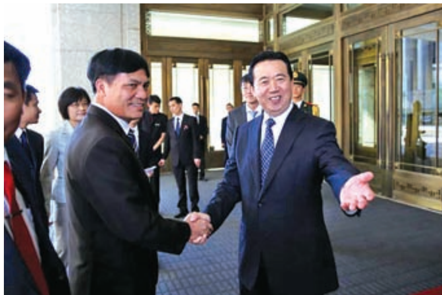
Meng Hongwei (R), Chinese Vice Public Security Minister, shakes hands with Nguyen Quang Dam, the commandant of the Viet Nam Coast Guard, in Beijing, China, on 26 August 2016.

BEIJING — Global police cooperation agency Interpol elected a senior Chinese public security official as president, Chinese state media said on Thursday, in what could be a boost to Beijing's domestic anti-graft crackdown.