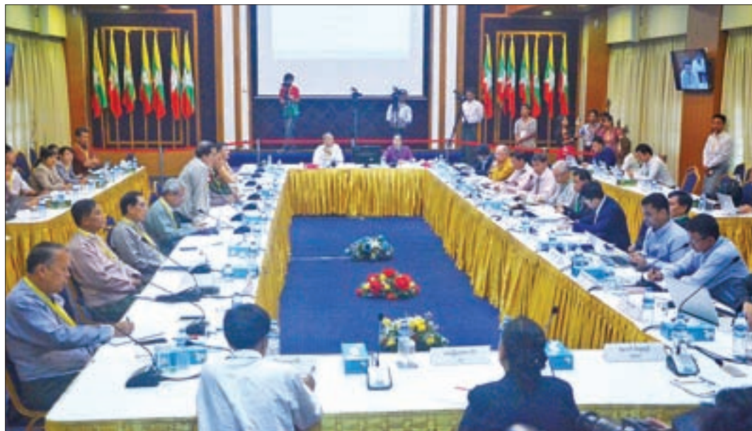
The meeting between Peace Commission and United Nationalities Federal Council in progress.