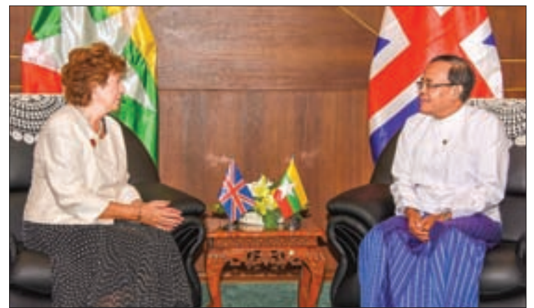
U Kyaw Tin, Minister of State for Foreign Affairs receives Rt Hon Baroness Anelay, Minister of State of United Kingdom.

At the meeting, they exchanged views on the promotion of bilateral relations and cooperation between Myanmar and the United Kingdom. —Myanmar News Agency