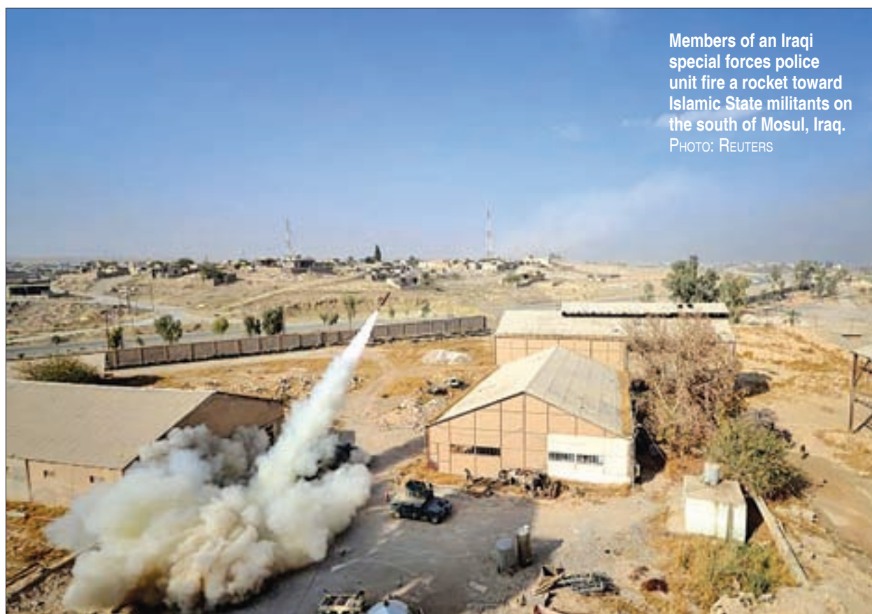
Members of an Iraqi special forces police unit fire a rocket toward Islamic State militants on the south of Mosul, Iraq.

Even that small foothold is proving hard to maintain, however, with waves of counter attacks by jihadist units including snipers and suicide bombers who use a network of tunnels stretching for miles (km) under the city.