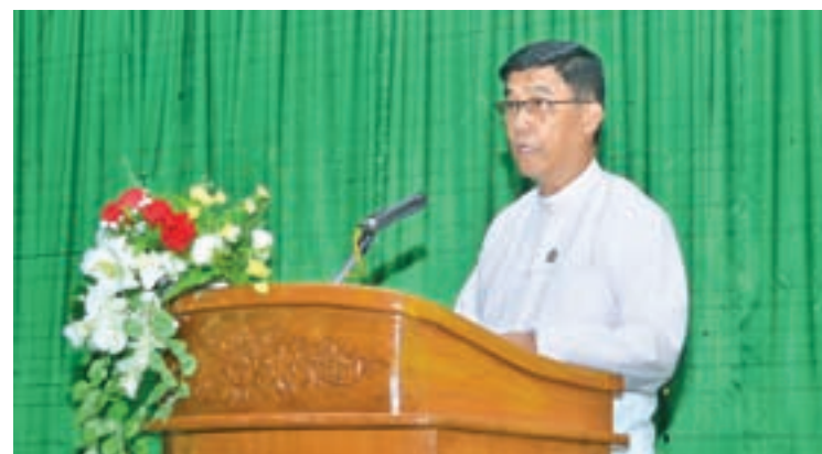
U Aung Myo Myint, the director-general of PPD and chairman of the committee for organizing the festival.

"The celebration of the festival is aimed at promoting friendship and respect among the brethren groups", said U Aung Myo Myint, the director-general of PPD and chairman of the committee for organizing the festival said. "Books written by national races will be put on sale, whereas publication of some which were not yet published will be imple-