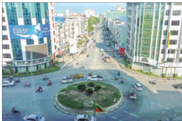
A roundabout where a CCTV camera will be installed.

The authorities monitor downtown Mandalay with the aid of CCTV at the Police Command Centre (PCC) 24 hours a day.