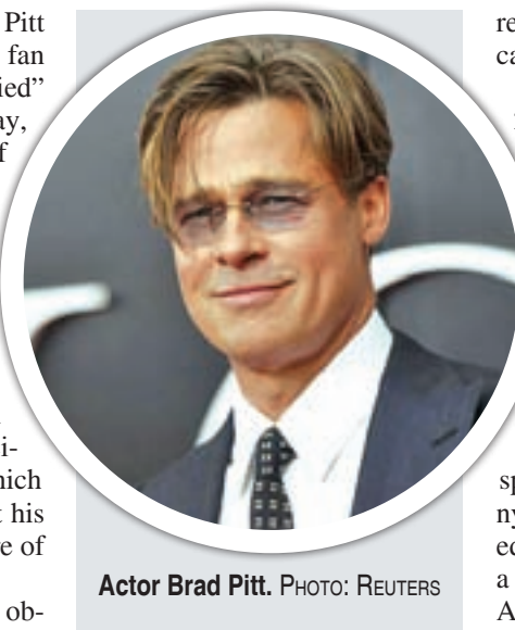
Actor Brad Pitt.

"I don't know much about the espionage world and what it took to get behind enemy lines and to plant your characters, so that was really interesting," Pitt