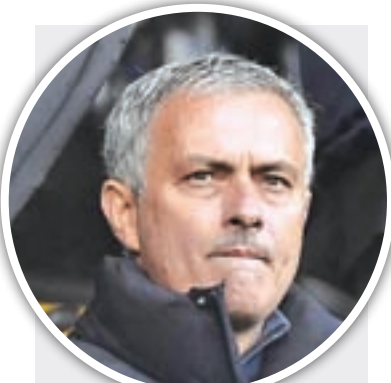
Manchester United manager Jose Mourinho.

Mourinho condemned Shaw and Smalling over the pair's apparent unwillingness to play through the pain barrier in Sunday's Premier League win over Swansea City, saying they were not "brave" enough to feature.