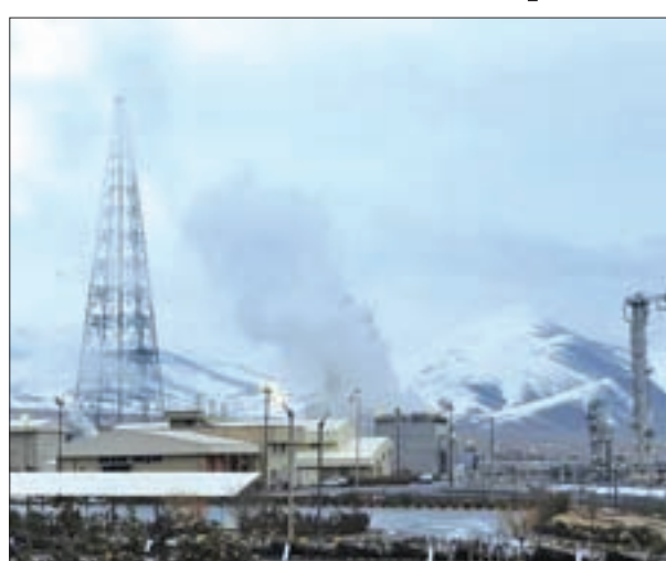
A general view of the Arak heavy-water project, 190 km (120 miles) southwest of Tehran in 2011.

"On 2 November 2016, the director general expressed concerns related to Iran's stock of heavy water to the vice president