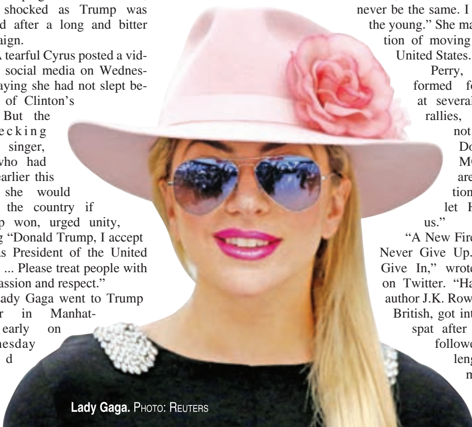
Lady Gaga.

"A New Fire Is Lit. We Never Give Up. We never Give In," wrote Madonna on Twitter. "Harry Potter" author J.K. Rowling, who is British, got into a Twitter spat after urging her followers to challenge "racism, misogyny and hatred."— Reuters