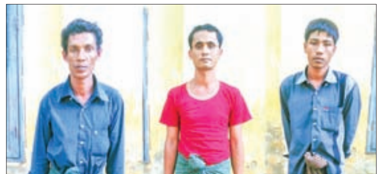
Three of the suspects arrested near Kyikanpyin Village.

All of those suspects and the confiscated evidence were handed over to Alal Thangyaw Area Police Station and Kyikanpyin Border Guard Control Station for legal action under the law. — Myanmar News Agency