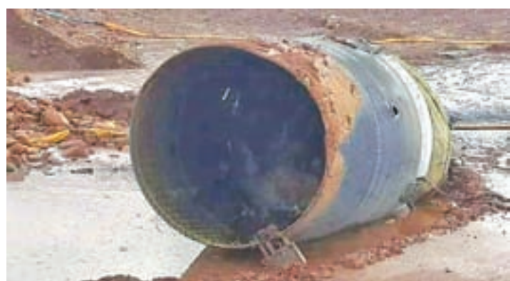
The photo posted on social media shows a metal cylinder at Hmawsizar Village in Hpakant Township.

The metal objects are assumed to be part of a satellite or the engine parts of a plane or missile, authorities said. China's Xinhua News Agency at 11:11am yesterday announced that the country had recently launched a satellite. It could not be confirmed whether the launch of the satellite and the metal objects found in Kachin State were related.— Myawady