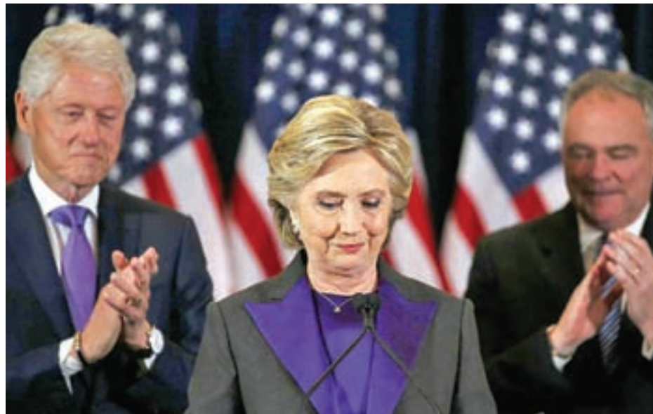
Hillary Clinton, accompanied by her husband former US President Bill Clinton (L) and running mate Senator Tim Kaine, addresses her staff and supporters about the results of the US election at a hotel in New York, on 9 November 2016.

As staffers and supporters filed into the ballroom, there were tears,