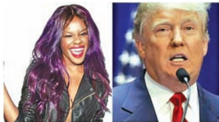
Rapper Azealia Banks & Donald Trump.