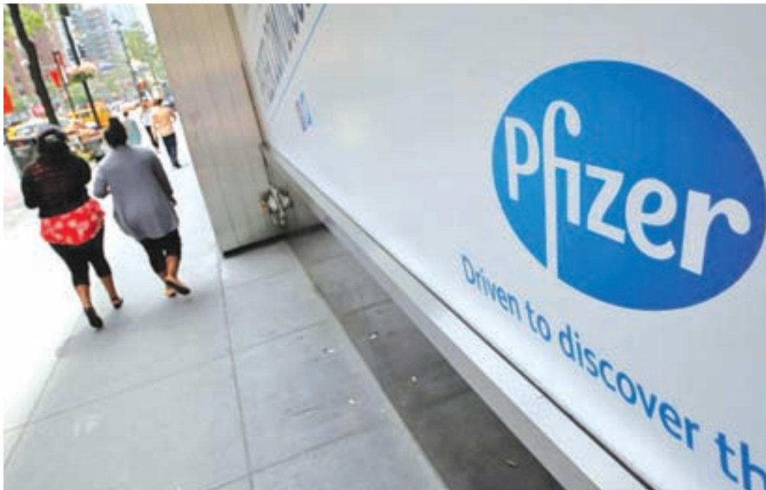
The Pfizer logo is seen at their world headquarters in Manhattan, New York, US, on 1 August 2016.