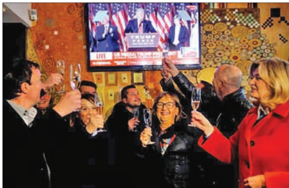
Residents celebrate during the election in Melania Trump's hometown of Sevnica, Slovenia.