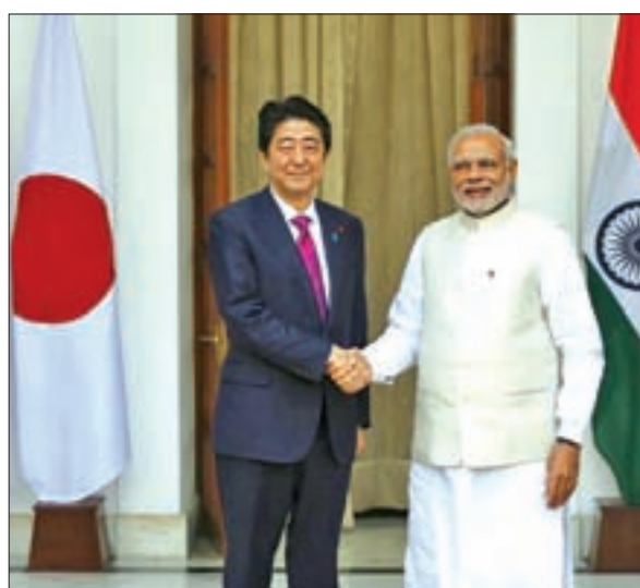
Japan's Prime Minister Shinzo Abe (L) shakes hands with his Indian counterpart Narendra Modi during a photo opportunity ahead of their meeting at Hyderabad House in New Delhi, on 12 December 2015.

agreed in principle in New Delhi last December to conclude the civil nuclear cooperation pact.