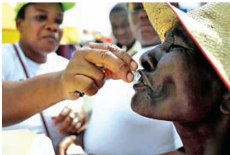
A woman receives an oral cholera vaccine in a street of Les Cayes, Haiti, on 8 November 2016.