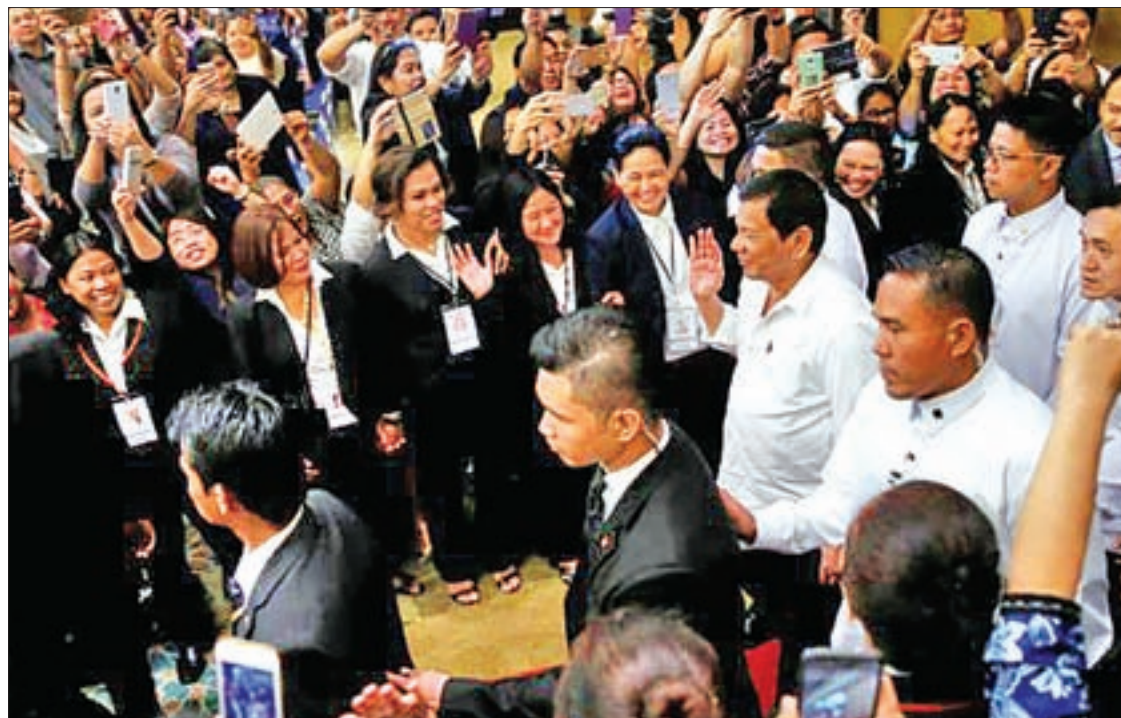
Philippines President Rodrigo Duterte arrives to meet with the Filipino community during his official visit in Kuala Lumpur, Malaysia, on 9 November 2016.

anti-establishment platform and struck a chord among ordinary Filipinos with his promises to fix what he called a broken country.