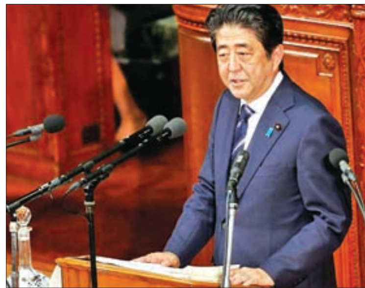
Japanese Prime Minister Shinzo Abe in Tokyo, Japan, on 26 September 2016.

"I very much look forward to closely cooperating with you to further strengthen the bond of the