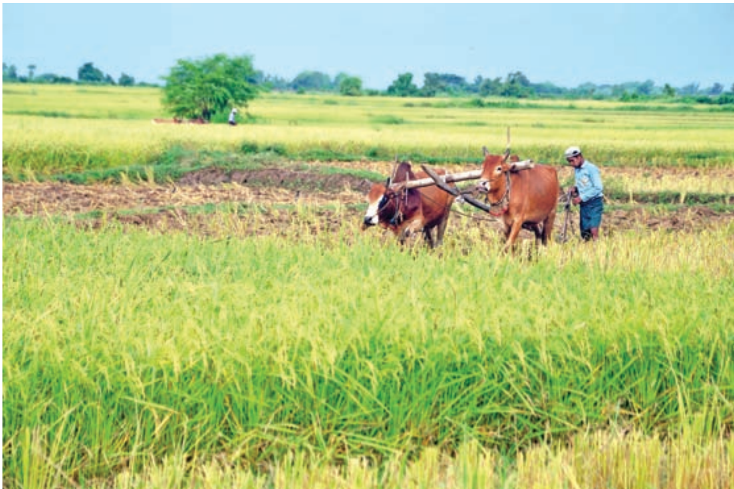
A farmer ploughing traditionally on a field in Padigon, Bago Region.

The apartments will be sold by lot. The applicants must have (Pyithu Hluttaw) Lower House representative's letter of recommendation or Regional Hluttaw representative's letter of recommendation. The decision will also be made based on household income. The applicant's monthly salary must be at least 4 to 5 lakhs on average and they must be able to purchase in four installments with bank loans. There are a total of 560 apartments in 14 five-storey buildings that have been constructed on an 7.67-acre plot of land. A ground floor apartment is being sold for K22.30 million.— Aung Thant Khaing