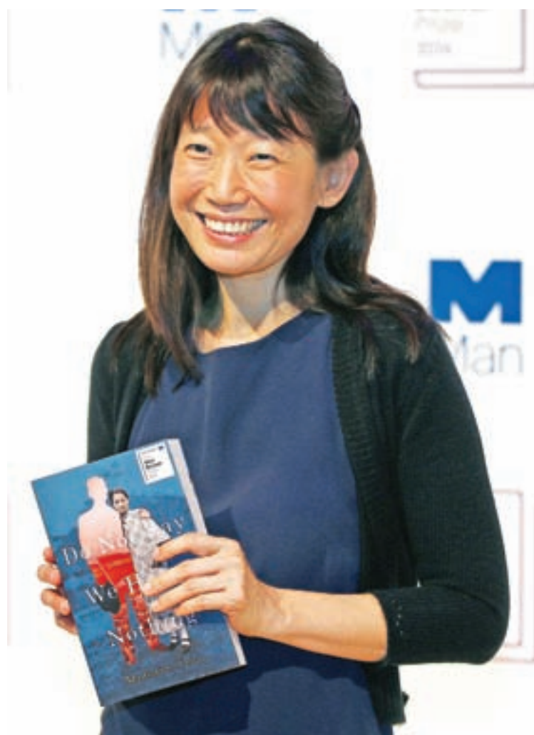
Author Madeleine Thien poses for photographs during a photo-call in London for the six Man Booker shortlisted fiction authors, on the eve of the prize giving in London, Britain, on 24 October.

The book had also been nominated for the Booker Prize, but last month lost out to American Paul Beatty's "The Sellout", a biting satire on race relations in the United States.—Reuters