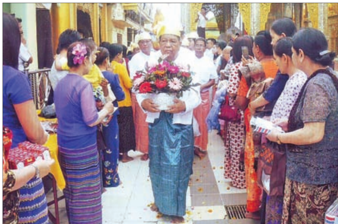
Opening ceremony of 2,605 th Buddha Pujaniya Festival of Layhsudadpyaw Shwe San Daw Pagoda in progress.

THE opening ceremony of the 2,605th Buddha Pujaniya Festival of Layhsudadpyaw Shwe San Daw Pagoda took place at the pagoda in Pyay yesterday.