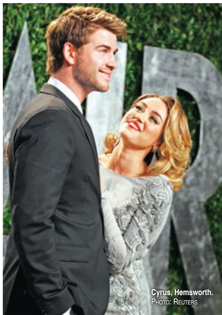
Cyrus, Hemsworth.