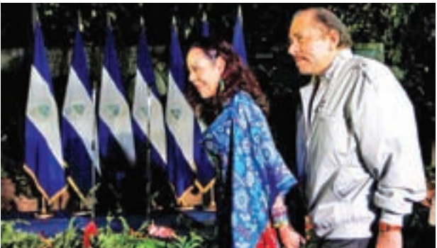
Daniel Ortega, Nicaragua’s current president and presidential candidate from the ruling Sandinista National Liberation Front, holds hands with his wife and vice presidential candidate Rosario Murillo after casting their vote at a polling station during Nicaragua’s presidential election in Managua, on 6 November 2016.