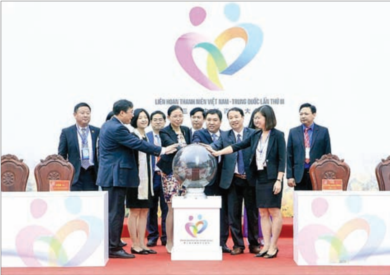
Photo taken on 7 November 2016 shows the launching ceremony of the third China-Viet Nam Youth Festival at the Huu Nghi International Border Gate in Lang Son Province, Viet Nam.