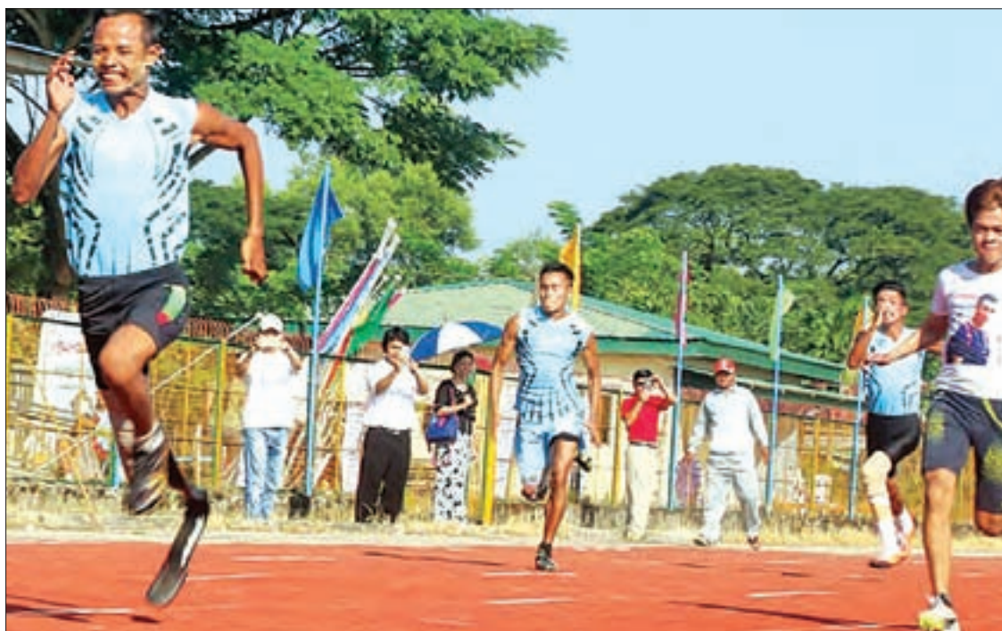
Athletes participating in 28 th national para-sport competition.

According to the 2014 nationwide census, the disabled population accounts for more than 2.3 million (about 4.6 per cent) of the country's total population of over 51 million.