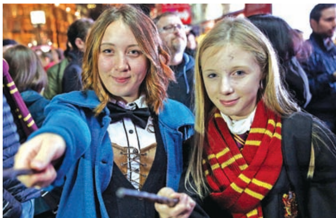
People gather for a global fan event to preview the film "Fantastic Beasts and Where to Find Them" at Cineworld IMAX at Leicester Square in London, Britain, on 13 October 2016.

"It was really lovely to hear about his genius in her imagination," he added. Warner Bros' "Fantastic Beasts" begins with newspaper headlines documenting the growing power of a dark wizard named Gellert Grindelwald and fear and unrest among the magical community. It echoes the rise of the dark wizard Voldemort in Rowling's Potter stories.—Reuters