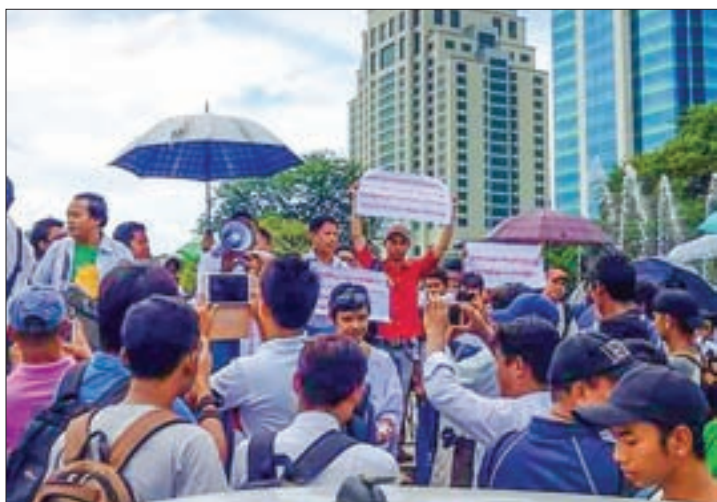
Sailors protesting the Department of Marine Administration seen in front of the City Hall at downtown Yangon.