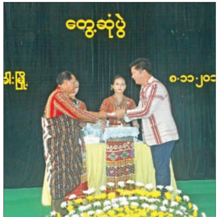
Vice President handing over exercise books for students in Chin State during his visit.

The vice president said all national races need to take part