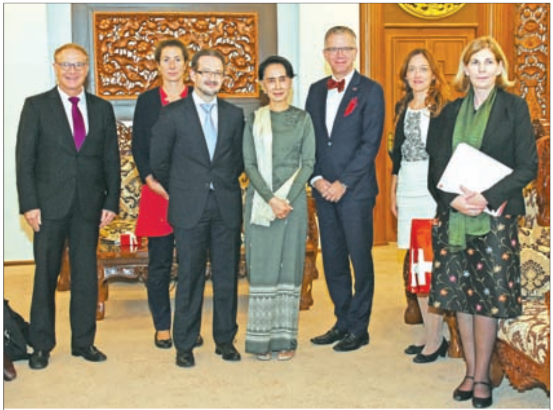
State Counsellor Daw Aung San Suu Kyi receives Assistant State Secretary for Asia Pacific of the Federal Department of Foreign Affairs of the Swiss Confederation.