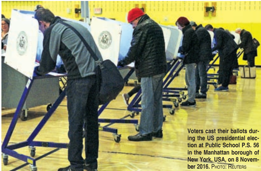
Voters cast their ballots during the US presidential election at Public School P.S. 56 in the Manhattan borough of New York, USA, on 8 November 2016.

NEW YORK — Democrat Hillary Clinton and Republican Donald Trump face the judgment of the voters on Tuesday as millions of Americans turn out on Election Day to pick the next US president and end a bruising campaign that polls said favoured Clinton.