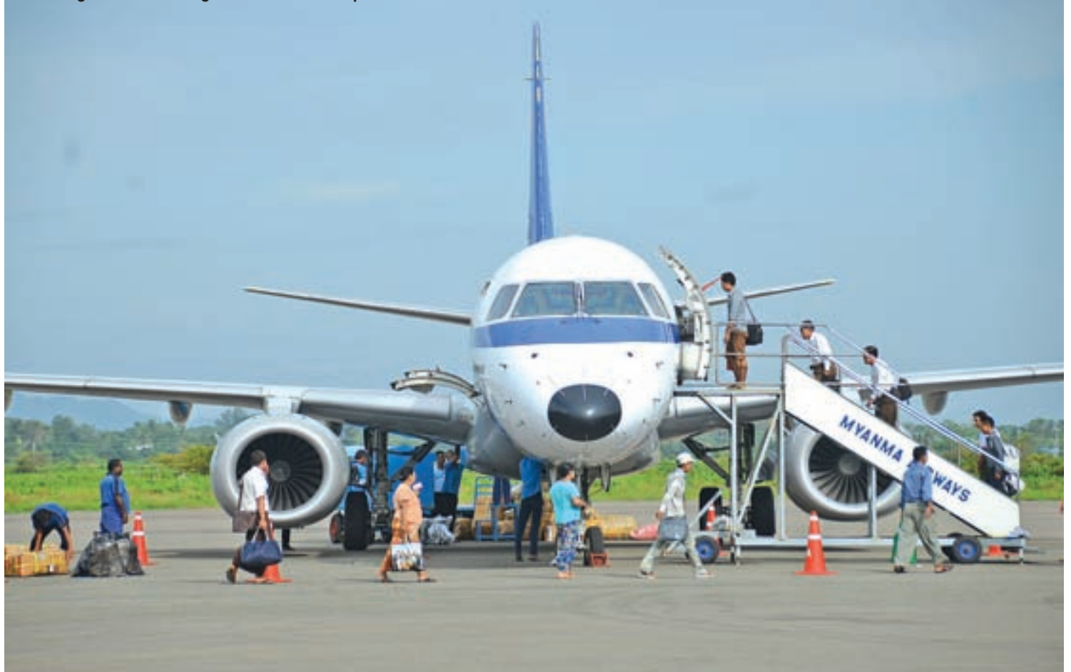
Passengers seen at Yangon International Airport.

Besides Suzuki, there are three other foreign car manufacturing companies which will establish auto manufacturing factories in Myanmar, according to an announcement released by Myanmar Investment Commission (MIC).—200