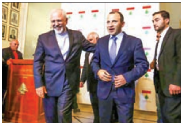
Iran's Foreign Minister Mohammad Javad Zarif (L) walks with Lebanese Foreign Minister Gebran Bassil in Beirut, Lebanon on 7 November, 2016.

The empty presidency was a symptom of an underlying political struggle between rival factions in Lebanon, which has been made worse by the war in neighbouring Syria. It has paralysed decision-making, economic development and basic services, and raised fears for the country's stability. The deal to appoint