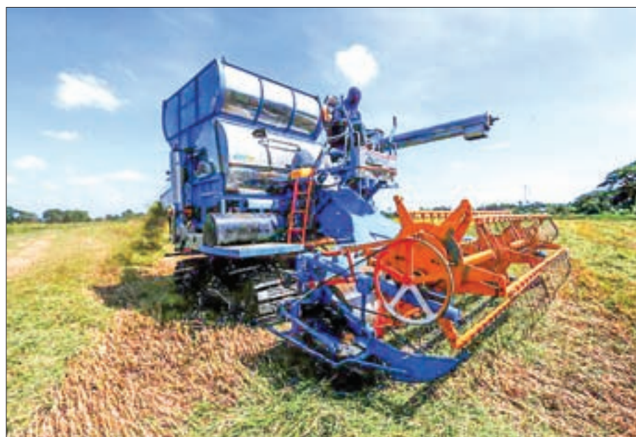
A farmer harvests a rice field in Suphan Buri Province, north of Bangkok, Thailand on 2 November, 2016.