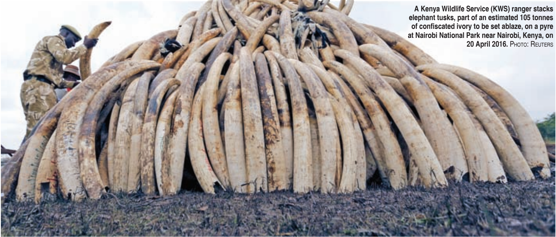
A Kenya Wildlife Service (KWS) ranger stacks elephant tusks, part of an estimated 105 tonnes of confiscated ivory to be set ablaze, on a pyre at Nairobi National Park near Nairobi, Kenya, on 20 April 2016.