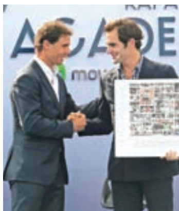
Switzerland's Roger Federer holds a gift given by Spain's Rafael Nadal on 19 October 2016.

"But it will be an emotional challenge for him to come back next year."—Reuters