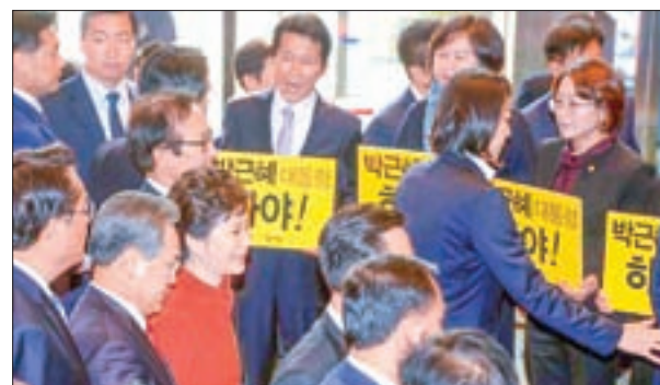
South Korean President Park Geun-hye (in red) walks past members of the minor opposition Justice Party at the National Assembly in Seoul, South Korea, on 8 November, 2016.

SEOUL — South Korean President Park Geun-hye said on Tuesday she will withdraw her nominee for prime minister if parliament recommends a candidate and is willing to let the new premier control the cabinet, seeking to defuse a crisis rocking her presidency.