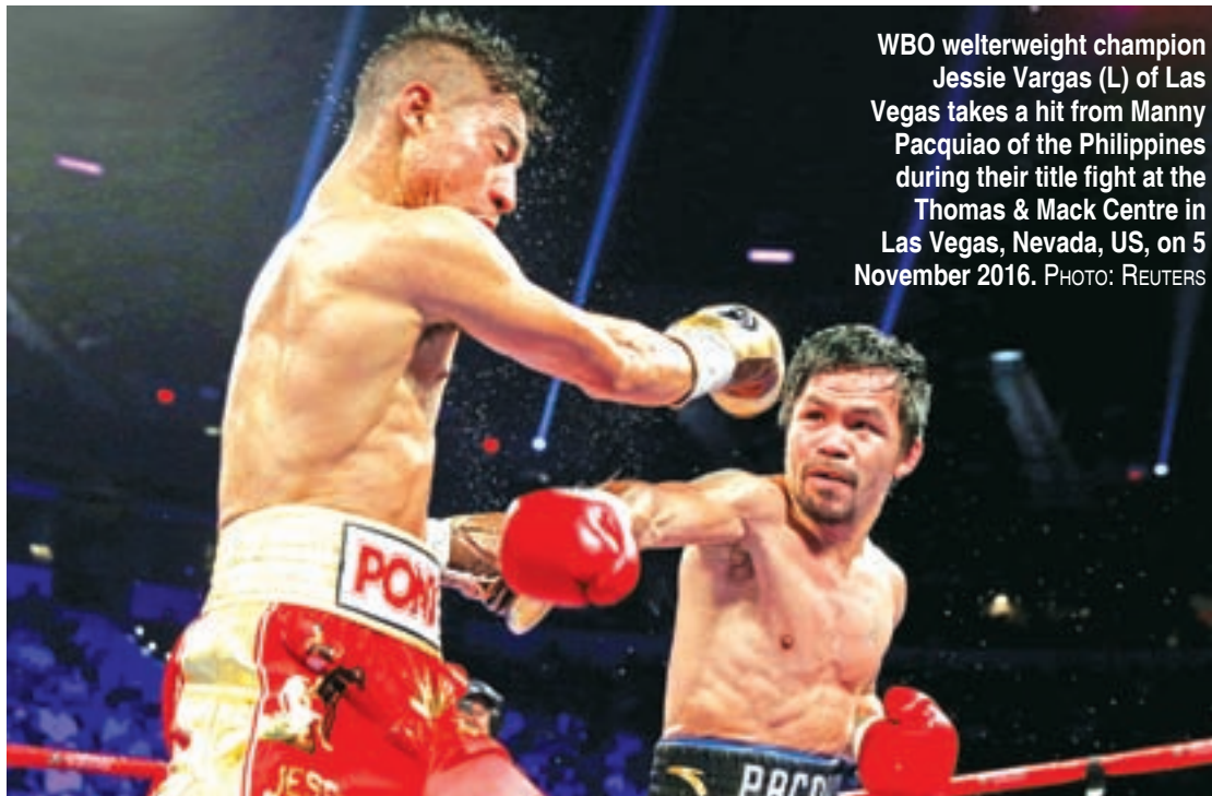
WBO welterweight champion Jessie Vargas (L) of Las Vegas takes a hit from Manny Pacquiao of the Philippines during their title fight at the Thomas & Mack Centre in Las Vegas, Nevada, US, on 5 November 2016.