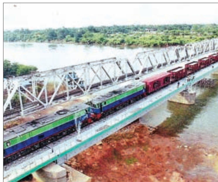
A train is seen on the Mandalay-Myitkyina Road.