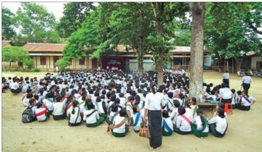
Students from a school receiving assistance from a French education foundation being seen.