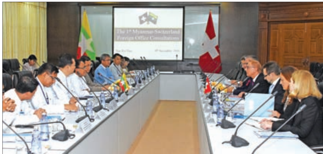
Officials of Myanmar and Switzerland discuss at the first Myanmar-Switzerland Foreign Office Consultations.

THE 1 st Myanmar-Switzerland Foreign Office Consultations was held in Nay Pyi Taw yesterday, focusing matters on promotion of bilateral relations and cooperation in various sectors of economy, investment, education and culture.