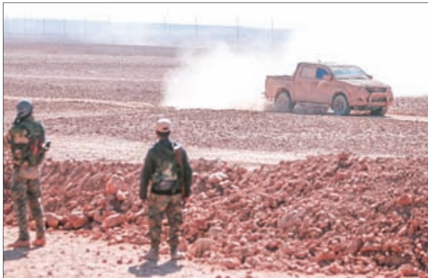
Syrian Democratic Forces (SDF) fighters stand near a vehicle camouflaged with mud, north of Raqqa city, Syria on 7 November 2016.

The attack, named "Euphrates Anger" so far