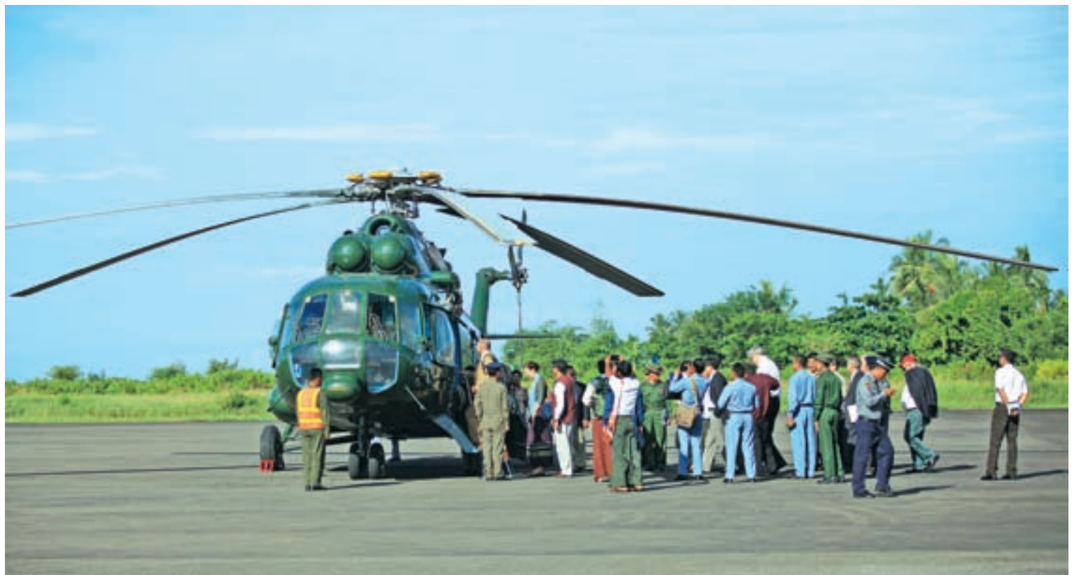
Senior diplomats from the U.N., United States, China, Britain, the European Union and India board a helicopter in Sittwe to visit the troubled villages in the Maung-taw area in northern Rakhine State in Myanmar on 2 November 2016.

Also on Monday, the UN Office for the Coordination of Humanitarian Affairs (OCHA) said in a statement that the World Food Programme has been granted permission to deliver aid to four villages.