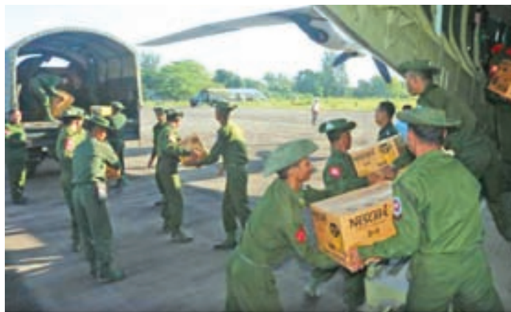
Service personnel of the Tatmadaw are loading the plane with aid donated by the people across Myanmar for the people in northern Rakhine on 8 November 2016.

“This is the first time humanitarian access has been granted to the affected areas of Maung-taw Township since the violence that erupted on 9 October,” the statement said.