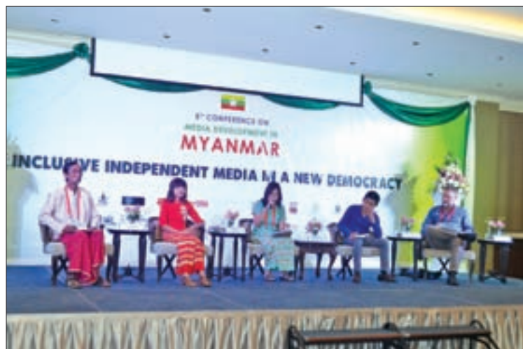
Media personnel discussing at the second day of the 5th Conference on Myanmar Media Development under the title of “Inclusive Independent Media in A New Democracy.”

THE second day fifth media development forum was held at the Chatrium Hotel yesterday morning.