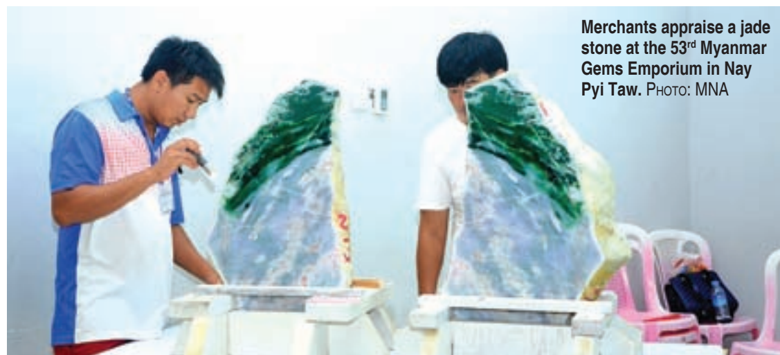
Merchants appraise a jade stone at the 53 rd Myanmar Gems Emporium in Nay Pyi Taw.

Ministry of Natural Resource and Environmental Conservation is drawing up plans to be able to produce finished gems from the raw stones.—Myitmakha News agency