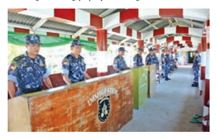
POE, pass of entry and exit being monitored properly in Maungtaw District, Rakhine State.

The in-charge of marine border guard said, "Our main