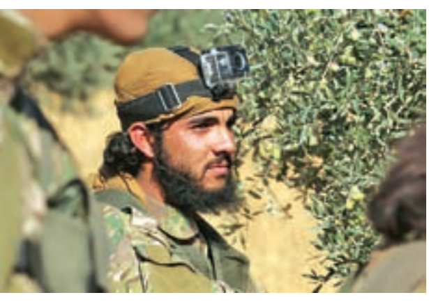
A rebel fighter with a camera attached to his head stands near an olive tree, western Aleppo city, Syria, on 3 November 2016.

ed by Reuters seemed resigned to the resumption in bombing, which killed hundreds of people in late September and early October as the government and its Russian allies abandoned a ceasefire to launch their assault on the biggest urban area in opposition hands.