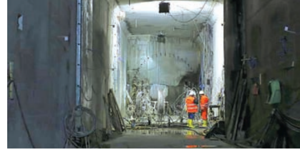
Workers are seen at the site of a metro railway tunnel under construction at the 'Roma Metropolitane' (Rome's underground) near St Giovanni Basilica in Rome, Italy, on 11 April 2016.

The designers chose a costly, heavy-duty train system, expecting that the route would carry up to 600,000 passengers a day. At present,