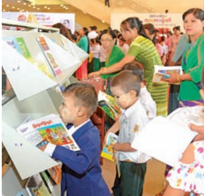
Children enjoy the Children's Literature Festival together with teachers.