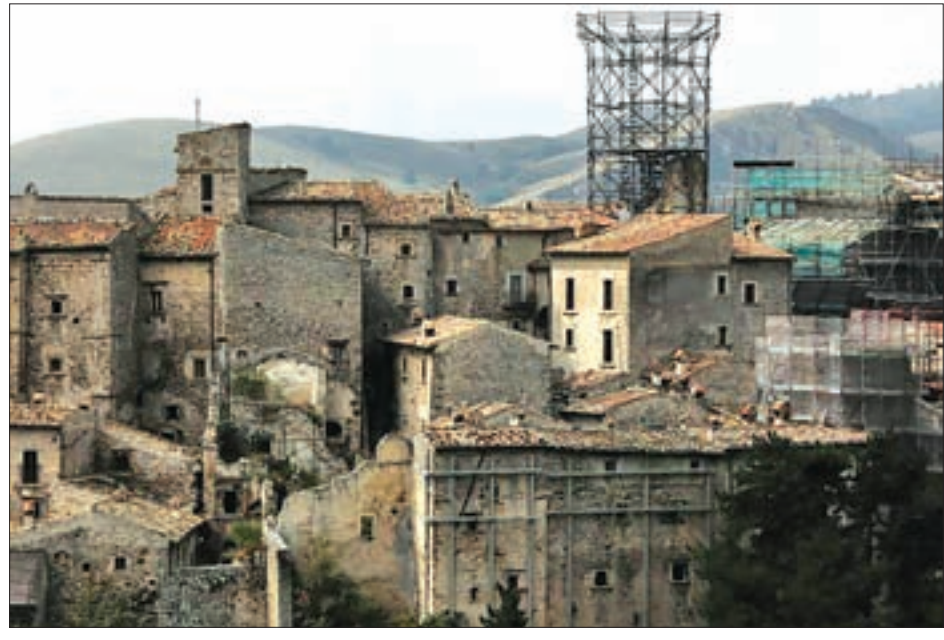
Metal frames support what is left of a medieval tower, as works are in progress to reconstruct it after it collapsed in the 2009 earthquake, in Santo Stefano di Sessanio in in the province of L'Aquila in Abruzzo, inside the national park of the Gran Sasso e Monti della Laga, Italy, on 22 September 2016.

"People love coming to this region," said resident Amelia, who owns a bed and breakfast and offers cooking classes to tourists. "We are working hard on opening it to the world." —Reuters