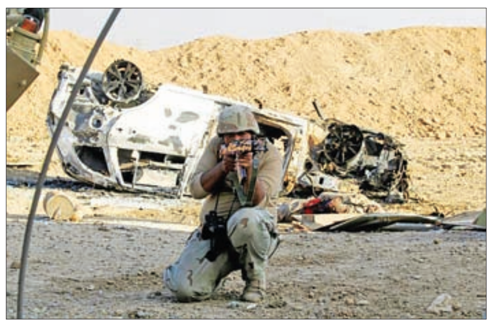
An Iraqi soldier aims his rifle during a battle with Islamic State, at the front line in the Intisar district of eastern Mosul.

A military statement said security forces had raised the Iraqi flag over a government building in the town, but did not say whether it was fully under their control. The army and