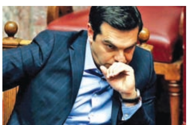
Greek Prime Minister Alexis Tsipras.

To appease the creditors who have accused Greece of foot-dragging in selling state assets, Tsipras replaced Energy Minister Panos Skourletis, who has openly opposed some privatisations, with George Stathakis, currently the economy minister. Skourletis was moved to the Inte-