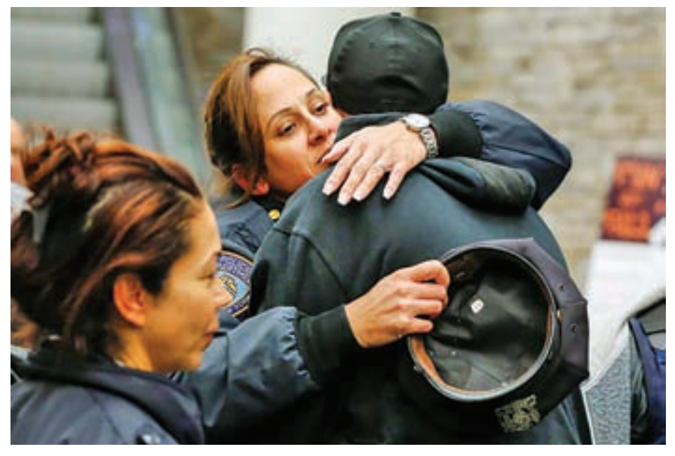
New York Police officers arrive at the Jacobi Medical Centre after a police officer was fatally shot and another wounded in the Bronx by a heavily armed robbery suspect, in New York, US, on 4 November 2016.