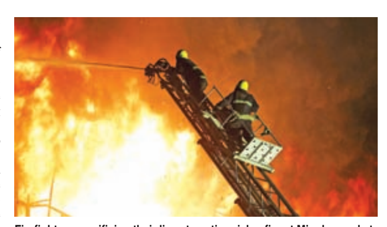
Firefighters sacrificing their lives to extinguish a fire at Minglar market in Yangon on 9 January 2016.

The compensation is paid depending on the amount of the losses in each case. The compensation value for Comprehensive Motor Insurance has doubled as of August.