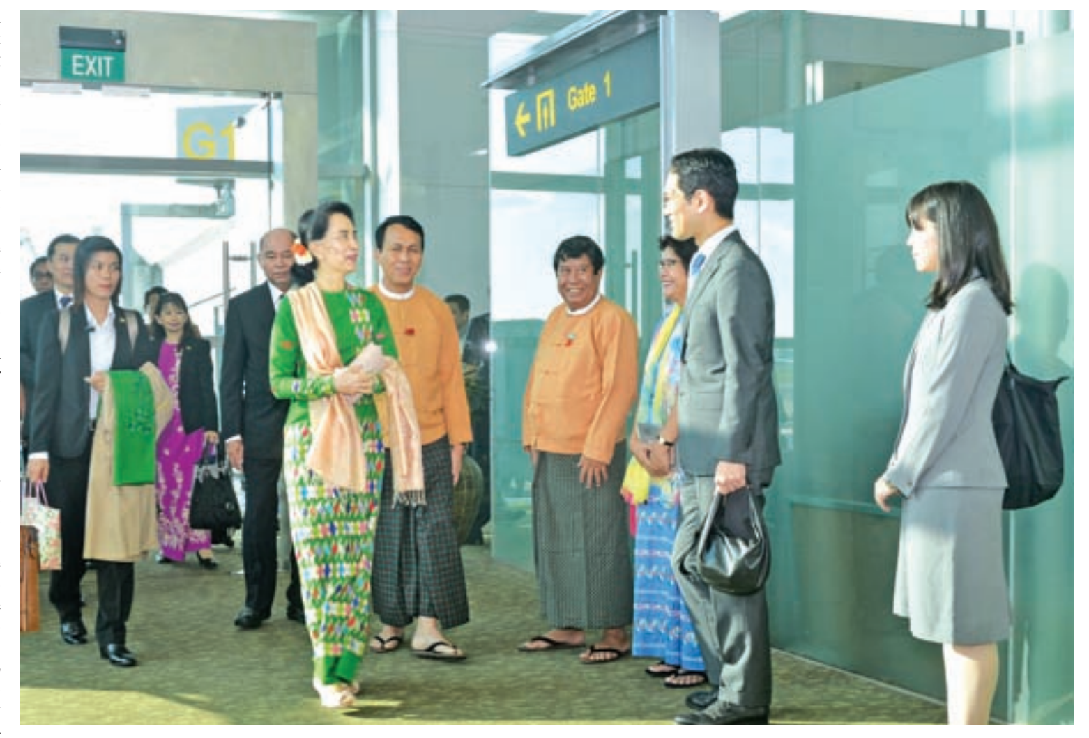
State Counsellor Daw Aung San Suu Kyi being welcomed back at Yangon International Airport.

During the visit, the Japanese government pledged to give assistance to Myanmar and the State Counsellor invited Japanese companies to invest in Myanmar. Daw Aung San Suu Kyi and Mr Shinzo Abe also exchanged views on promoting relations between the new generations of the two countries.-Myanmar News Agency