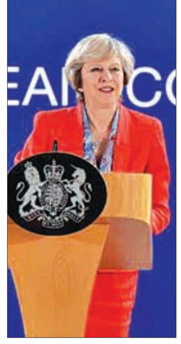
Britain's Prime Minister Theresa May holds a news conference after the EU summit in Brussels, Belgium, on 21 October 2016.

Parliament is unlikely to defy the referendum vote by blocking Brexit. But if — as one