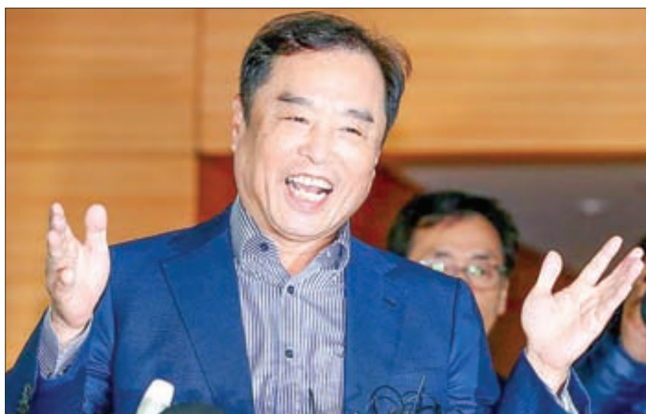
Kim Byong-joon, a nominee for South Korea's Prime Minister, speaks during a news conference in Seoul, South Korea, on 2 November 2016.

Kim Byong-joon, a senior presidential secretary during former president Roh Moo-hyun's administration, is expected to replace Hwang Kyo-ahn as prime minister. The prime minister's role in South Korea is largely administrative and requires parliamentary