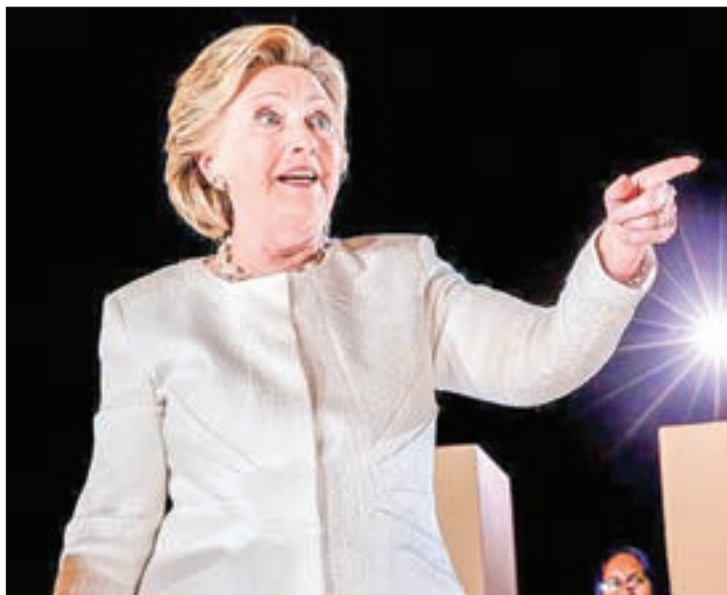
US Democratic presidential nominee Hillary Clinton walks offstage at a campaign rally in Sanford, Florida, US 1 November 2016.

Several states, including those cited by Trump, have a process to allow voters who cast early ballots to change their votes, either by