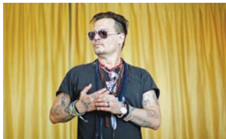
Johnny Depp of the band Hollywood Vampires attends a charitable event with Starkey Hearing Foundation in Lisbon, Portugal on 27 May 2016.

Rowling's seven-book "Harry Potter" series sold more than 450 million copies worldwide, and the film franchise, which ended in 2011 with "Harry Potter and the Deathly Hallows: Part 2," took in more than $7 billion at the global box office. Depp leads Disney's hit franchise "Pirates of the Caribbean," in which he plays Captain Jack Sparrow, and "Alice in Wonderland," in which he plays the Mad Hatter. He is known for often playing eccentric, unpredictable and off-kilter characters. —Reuters