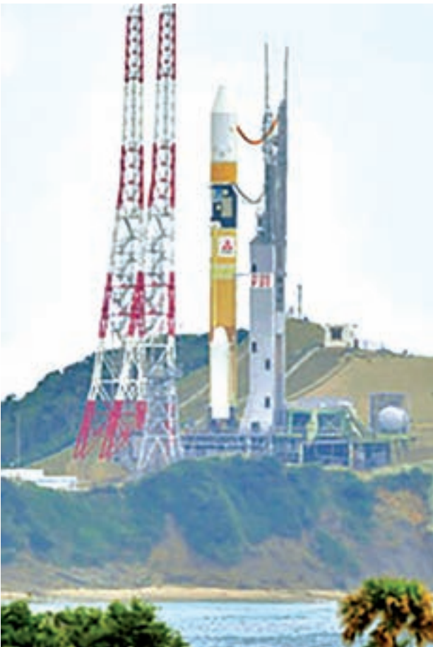
An H-2A rocket carrying the Japan Meteorological Agency’s new weather satellite “Himawari-9” waits for lift off from the Tanegashima Space Centre in Kagoshima Prefecture on 2 November 2016.

The 31 st H-2A rocket was launched by Mitsubishi Heavy Industries Ltd., the maker of the rocket. The space agency farmed out the launch in 2007 to Mitsubishi Heavy to reduce costs by introducing private-sector know-how and boost Japan’s international competitiveness in the space business.—Kyodo News