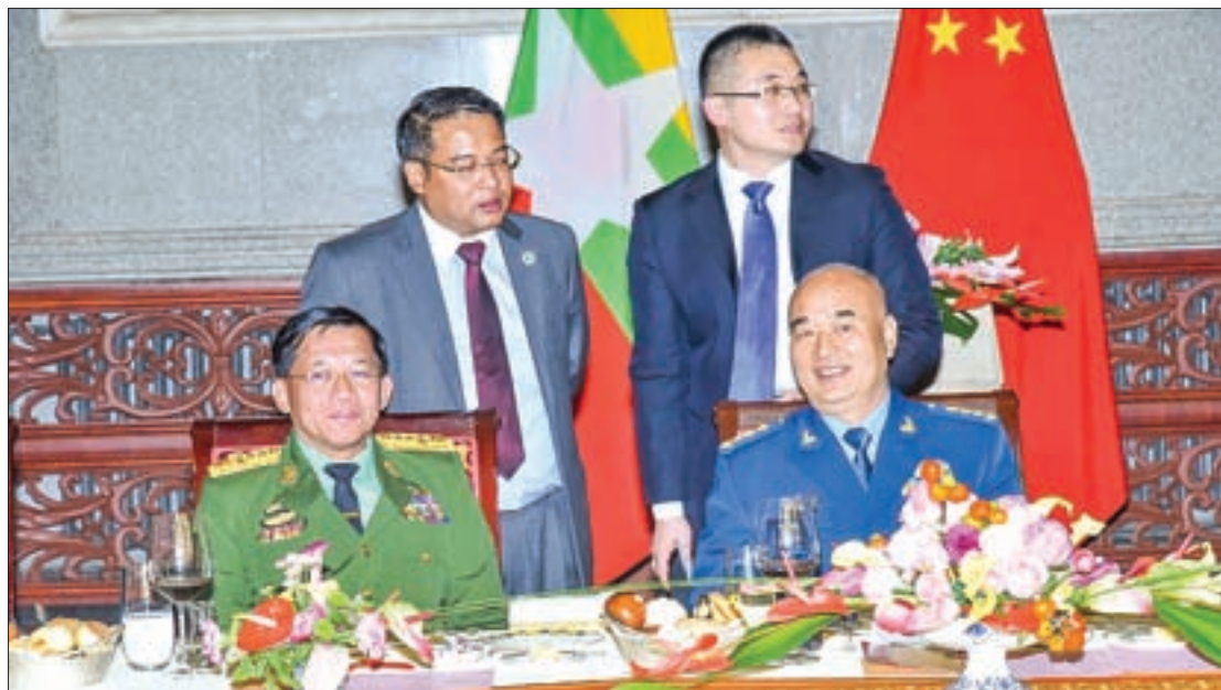
Senior General Min Aung Hlaing with Gen. Xu Qiliang, Vice Chairman of the central military commission.

COMMANDER-IN-CHIEF of Defence Services Senior General Min Aung Hlaing, who has been on a goodwill visit to People's Republic of China, met Gen. Xu Qiliang, Vice Chairman of the Central Military Commission, at Diaoyutai State Guesthouse on 1 November.