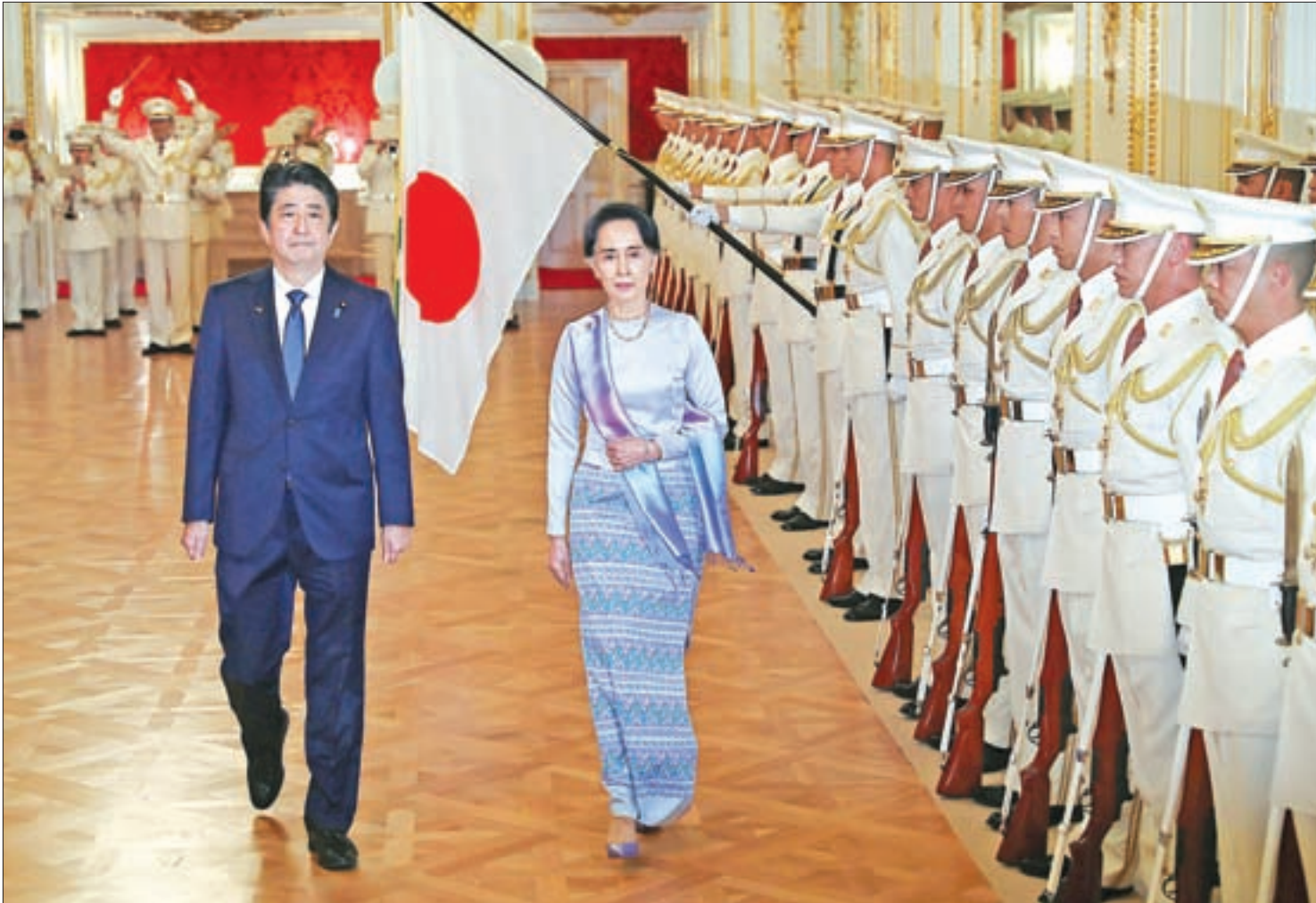
State Counsellor Daw Aung San Suu Kyi, accompanied by Japan's Prime Minister Shinzo Abe, inspects the guard of honor before their meeting at the state guest house in Tokyo, Japan 2 November 2016.