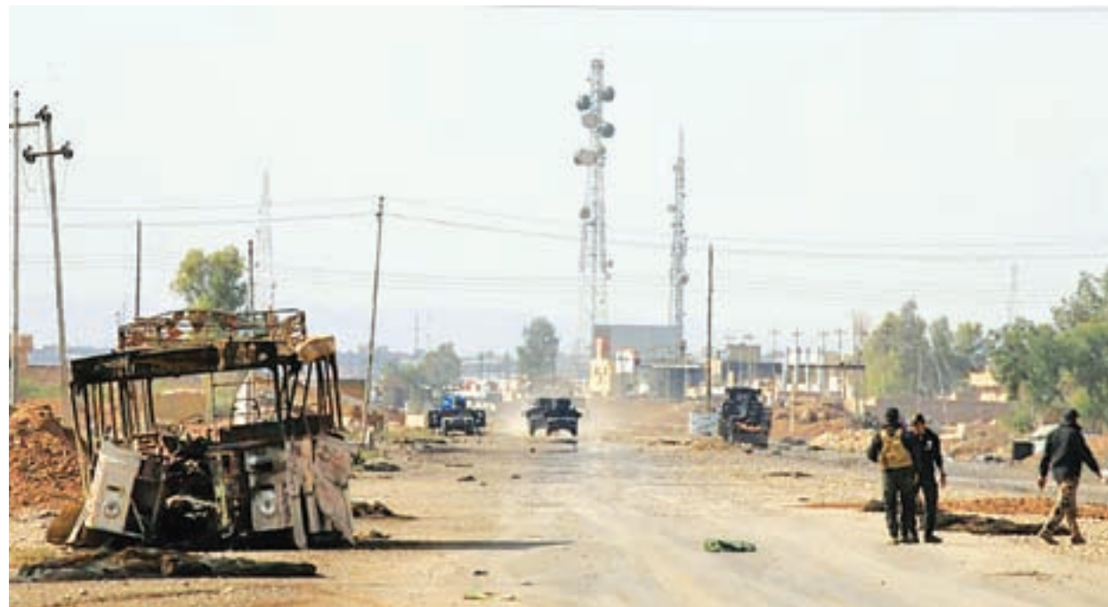
Iraqi special forces take part in an operation against Islamic State militants in Kokjali, west of Mosul, Iraq, on 2 November 2016.

Paul Mashatile, chairman of ANC's Gauteng province which includes Pretoria and the economic hub of Johannesburg, said his group would take part in the marches, even without the blessing of the national party.—Reuters