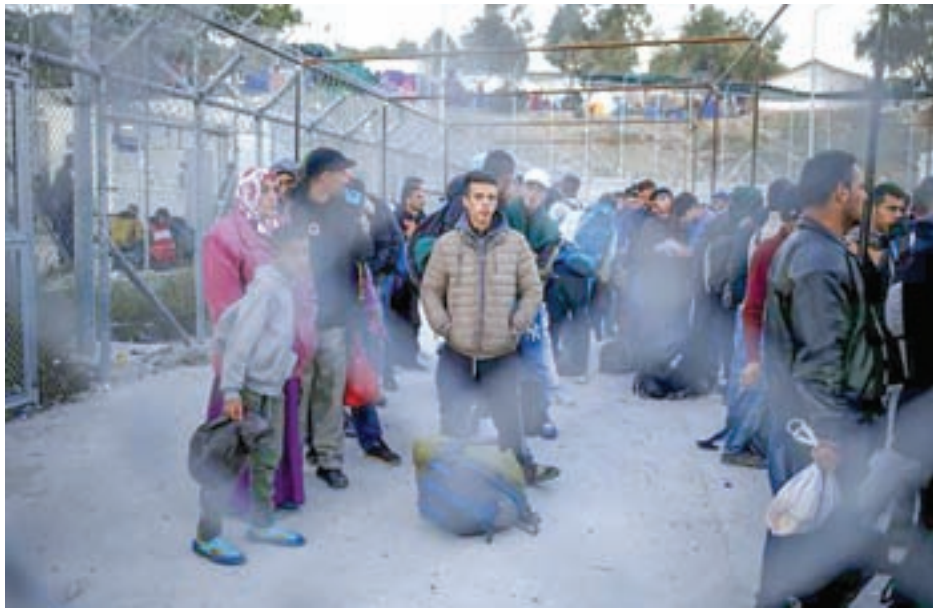
Refugees and migrants wait to be registered at the Moria refugee camp on the Greek island of Lesbos, on 5 November 2015.

At around the same time, Balkan countries along the land route north closed their borders, so that migrants who once poured