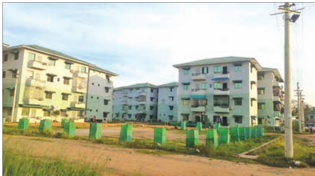
Photo shows Thirimingala affordable housing for staffers built during the term of the previous government.

THE Urban and Housing Development Department under the Ministry of Construction plans to implement a new housing project in Mon State estimated to build about 2,000 new units.