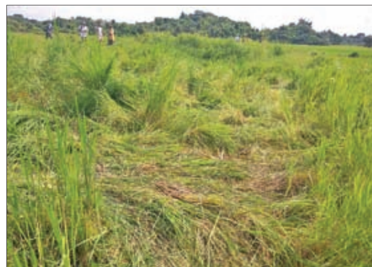
Paddy fields near Ngwe Saung Beach destroyed by the wild elephants.