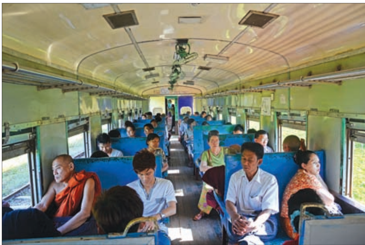
Passengers are taking a circular train in Yangon.

The investment businesses are given priority to effectuate the development in regions and states. A proposal to set the investment zone is submitted to the region and state government.