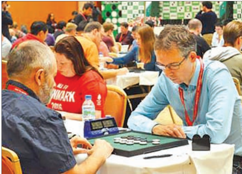
Players compete in the World Othello Championship in the eastern Japan city of Mito, the birthplace of the board game, on 2 November 2016, its opening day.

MITO (Japan) — The World Othello Championship began in the eastern Japan city of Mito on Wednesday, bringing the premier competition of the board game back to its birthplace for only the second time.