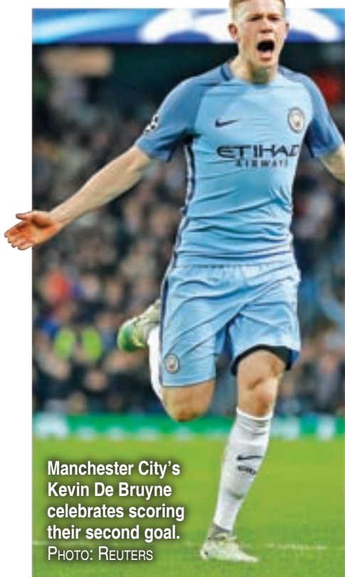
Manchester City's Kevin De Bruyne celebrates scoring their second goal.