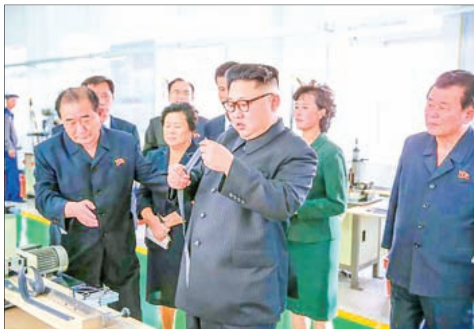
North Korean leader Kim Jong Un provides field guidance to the Mangyongdae Revolutionary Site Souvenir Factory in this undated photo released by North Korea's Korean Central News Agency (KCNA) in Pyongyang, on 7 October 2016.

The failed launch was the eighth attempt in seven months by North Korea