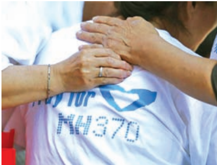
Family members of passengers on board the missing Malaysia Airlines Flight MH370 comfort a crying woman as they gather to pray at Yonghegong Lama Temple in Beijing on 8 September 2014, on the six-month anniversary of the disappearance of the plane.

The 28-page report contains new end-of-flight and drift simulations that suggests experts