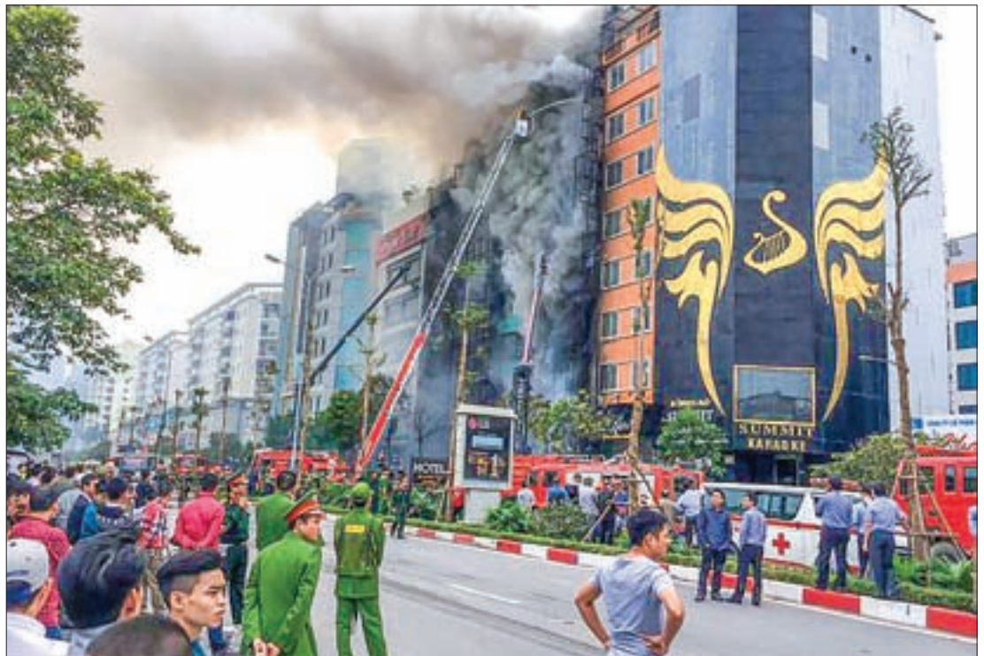
Firefighters work after a fire broke out at a karaoke lounge in Hanoi, Viet Nam on 1 November 2016.

Nevertheless, Duterte ordered an inspection of all companies shortly after assuming office on 30 June, warning that any company that would not end short-term contracts risked closure.—Reuters