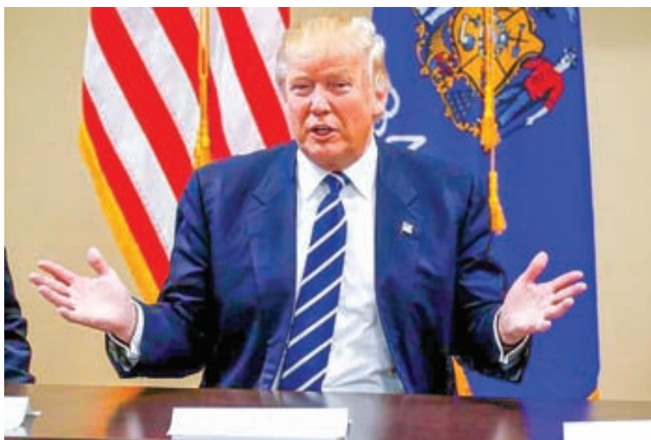
Republican presidential nominee Donald Trump.

The 130 million reais ($40 million) investment by the two small funds in the hotel's developer "required investigation" due to its size, structure and high level of risk, Anselmo Lopes, a federal prosecutor in Brasilia, said in the document dated 21 October that opened the inquiry. Lopes said the pension fund for state IT firm Serpro and the Igeprev fund for employees of Tocantins state invested the money in the developer, LSH Barra Empreendimentos Imobiliários SA, which built the Trump Hotel Rio de Janeiro.