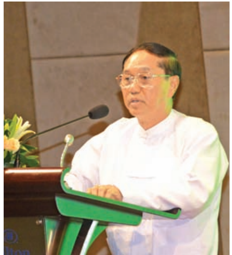
Vice President U Myint Swe delivers an address at the meeting with development partners for enhancement of the trade sector in Nay Pyi Taw on 2nd November, 2016.