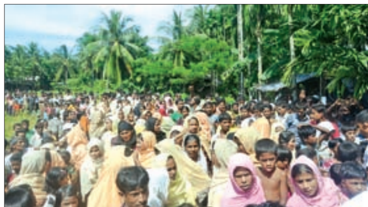
Islam community gather to meet with diplomats at Kyikanpyin Village.

During the trip, authorities hoped to expose the truth behind accusations of human rights violations during area clearance operations by members of the Tatmadaw and police force.— Myanmar News Agency