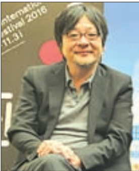
Japanese animation film director Mamoru Hosoda is interviewed in Tokyo, on 27 October 2016.

“With computer graphics, things have become one-dimensional, and this is very boring... What happens is that the pictures