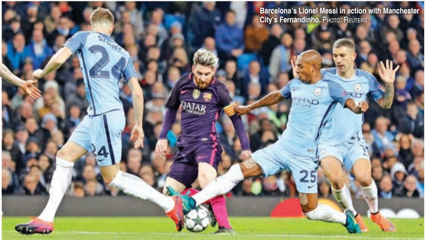
Barcelona's Lionel Messi in action with Manchester City's Fernandinho.