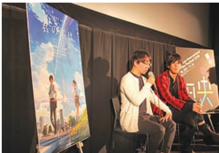
Japanese animation film director Makoto Shinkai (L) and RADWIMPS singer Yojiro Noda appear in an event in Tokyo on 27 October, 2016. Shinkai's film "your name." was featured at the Tokyo International Film Festival from 25 October to 3 November.

TOKYO — There seems to be no stopping the soaring popularity of Japanese animated film "your name." directed by Makoto Shinkai, as the body-swapping fantasy continues to attract fans at home and abroad.