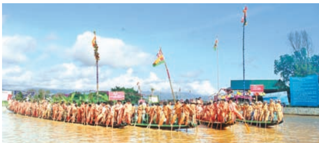
Intha ethnic people prepare for boat racing at the ceremony to mark the first Intha National Day.

The messages of the Pyithu Hluttaw Speaker and the minister for ethnic affairs were read out at the ceremony by Hluttaw representatives.— Maung Maung Than(Taunggyi)