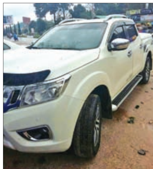
The car used in the attempted murder.

Local police filed charges against him under sections 307/323 of the Penal Code.—Myitmakha News Agency