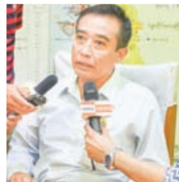
Agriculture, Livestock, Forestry and Mining Minister U Kyaw Lwin.

es in fear were permitted to stay at camps and provided food and other needs.