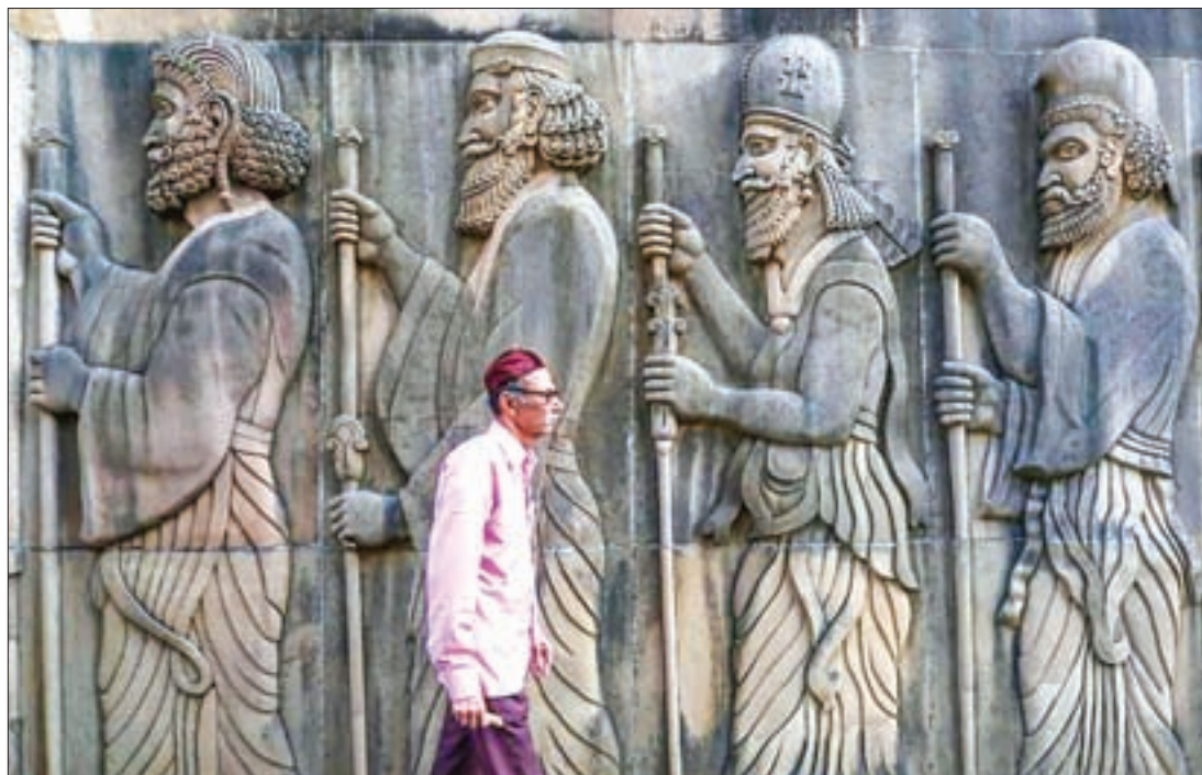
A Parsi man walks past a wall of a Parsi fire temple featuring huge carvings of ancient priests in Mumbai, India, on 30 October 2016.