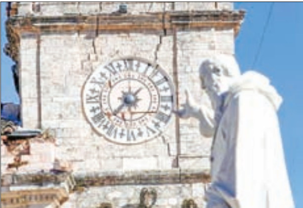
The clock of the damaged town hall tower is seen in the ancient city of Norcia following an earthquake in central Italy, on 31 October 2016.

Italy’s civil protection authority said more than 4,500 people had been