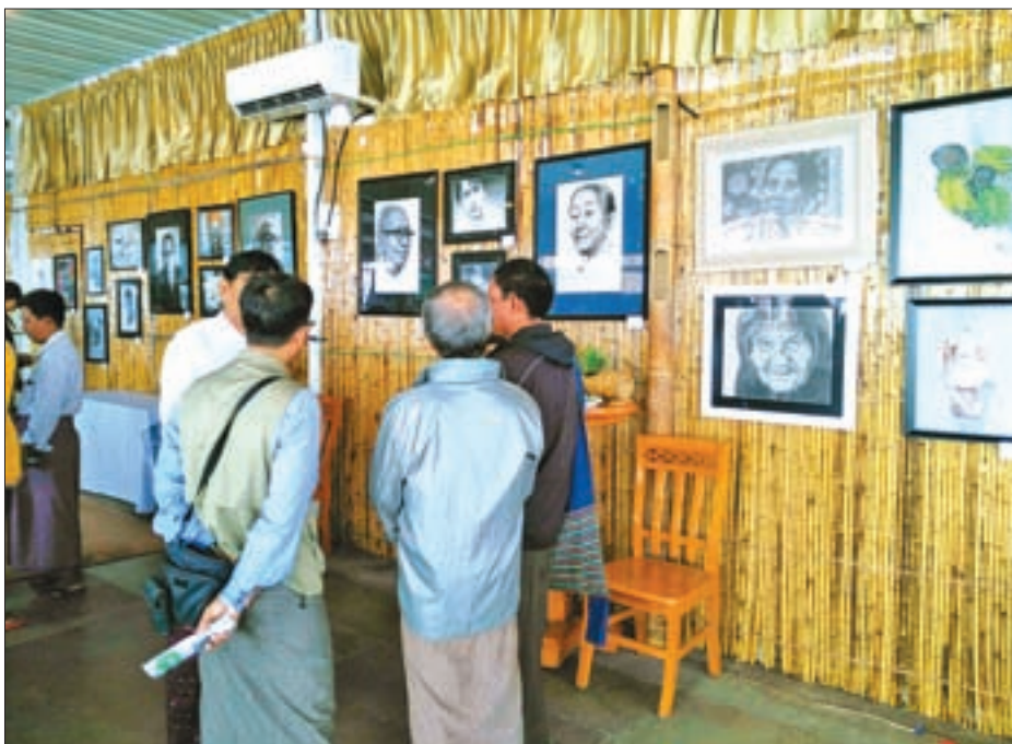
Visitors at the art exhibition "A Bag of a Mad" in Mandalay.