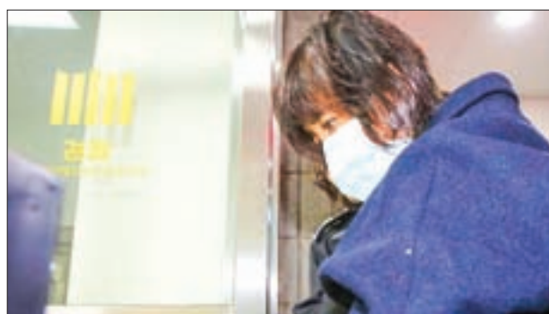
Choi Soon-sil arrives for questioning at a prosecutor's office in Seoul, South Korea, on 1 November 2016.

Choi, 60, arrived at the prosecutor's office on Tuesday morning in handcuffs and a surgical mask and wearing a dark coat, escorted by correctional officers. A prosecution official and