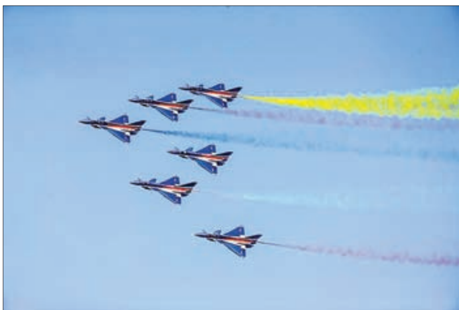
China's J-10 fighter jets perform during an air show, the 11 th China International Aviation and Aerospace Exhibition in Zhuhai, Guangdong Province, China, on 1 November 2016.

Experts say China has been refining designs for the J-20, first glimpsed by planespotters in 2010, in the hope of narrowing a