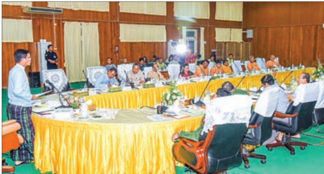
Vice President U Henry Van Thio addresses the meeting of Central Committee on Confiscated Farmlands and Other Lands.

Plots of land in Nay Pyi Taw Council Area, states and regions confiscated by ministries, individuals and organizations for now-stalled projects are to be handed over to the Central Committee on Confiscated Farmlands and Other Lands in accordance with land management laws, rules and regulations for the interest of the country and local people, Vice President U Henry Van Thio said at Meeting 2/2016 of the Central Committee yesterday.