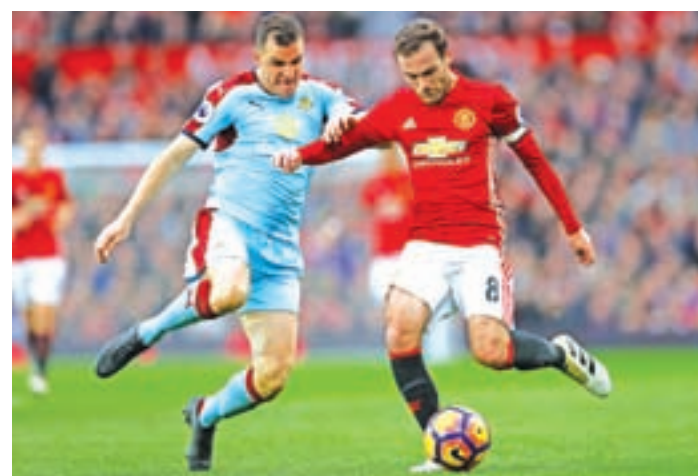
Manchester United's Juan Mata in action with Burnley's Dean Marney during Premier League at Old Trafford, on 29 October.

"But we didn't have any conversations. I have said this before and I will say it again — it is a professional relationship. That is it."—Reuters