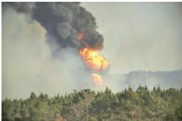
Flames shoot into the sky from a gas line explosion in western Shelby County, Alabama, US, on 31 October 2016.