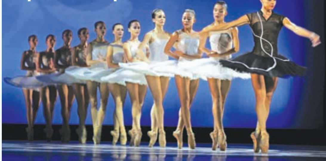
Dancers perform during the opening of the 25 th International Ballet Festival of Havana, in Havana, on 28 October 2016.

HAVANA — A woman in a floaty dress wrestles a minotaur who reflects her inner demons in “Errand into the Maze”, one of the Martha Graham Dance Company works that made its Cuban premiere this weekend to thunderous applause at the Havana ballet festival.