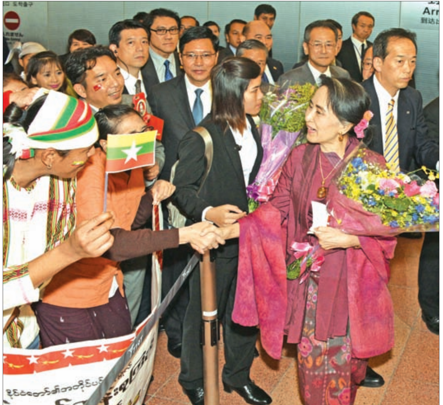
State Counsellor Daw Aung San Suu Kyi is welcomed by Myanmar nationals in Tokyo, Japan.

Japan's offers of assistance to Myanmar come against a background of rivalry with China for economic and political in-