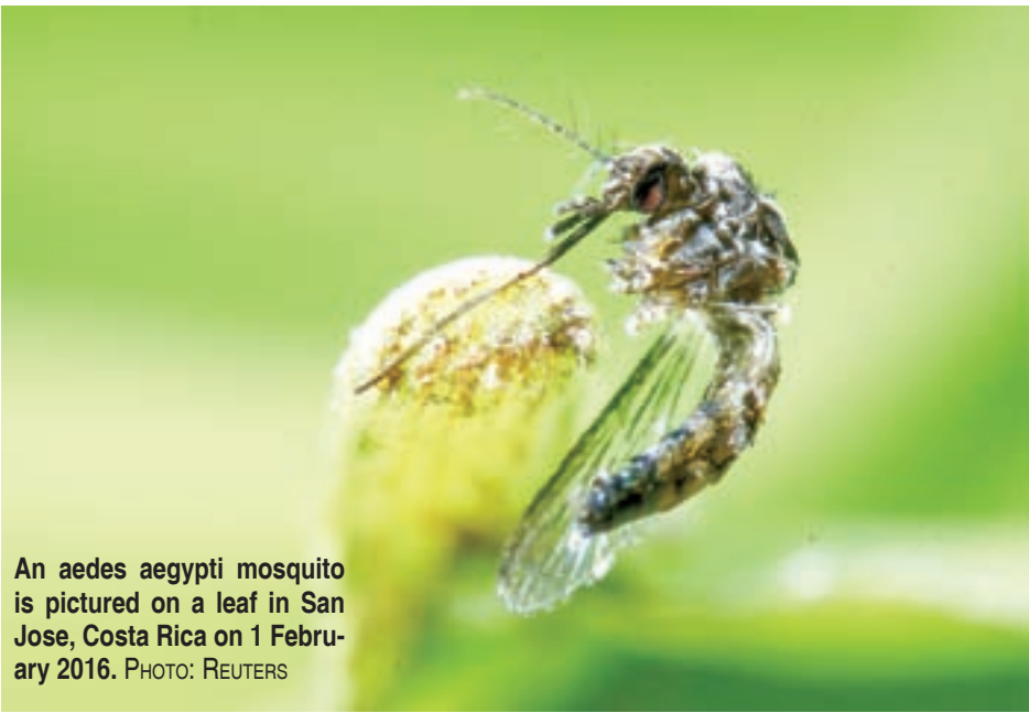
An aedes aegypti mosquito is pictured on a leaf in San Jose, Costa Rica on 1 Febru-ary 2016.

nant women have been shown to cause microceph-aly, a severe birth defect in which the head and brain are undersized, as well as other brain abnormalities.