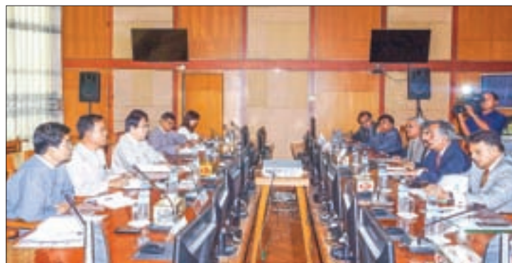
Union Minister for Information Dr Pe Myint receiving a delegation from the Pakistan National Management College.