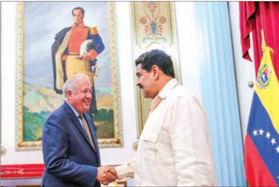
Venezuela’s President Nicolas Maduro (R) shakes hands with US diplomat Thomas Shannon in Caracas, Venezuela, on 31 October 2016.

“I had a good conversation with Thomas Shannon.