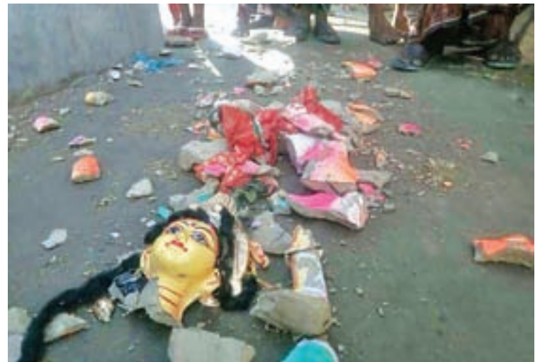
The photo posted on social media shows debris from a Hindu Temple vandalised by mobs.