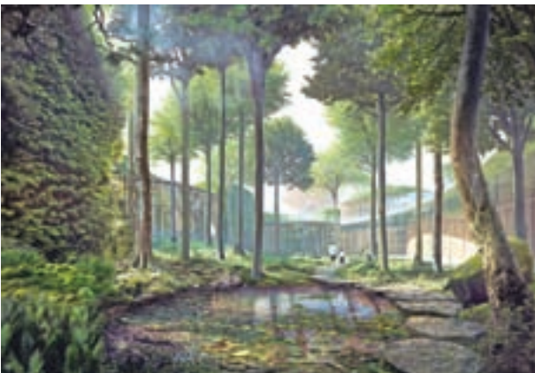
A new Hans Christian Andersen Museum in Odense is seen in an undated artist’s rendering released by Odense City Museums in Odense, Denmark.