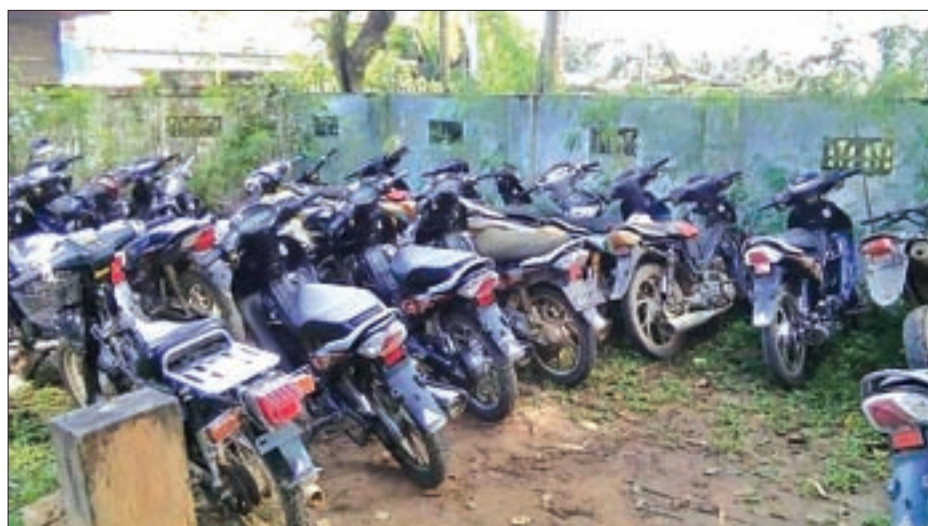
The motorcycles seized as court exhibits being seen.