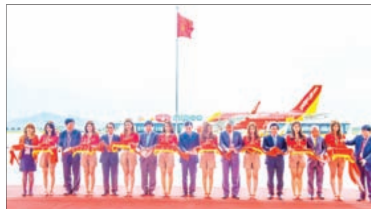
Vietjet formally launching two new routes from Hanoi to Taipei and Hue.

VIETJET, the fastest growing Vietnamese airline, has launched two new routes from Hanoi to Taipei and Hue to meet the increasing travel demands of individuals and tourists whilst boosting the region's trade and integration.