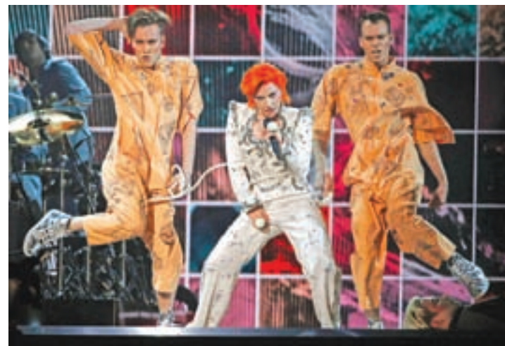
Lady Gaga is tied with a rope as she performs a medley of songs as a tribute to the late David Bowie at the 58 th Grammy Awards in Los Angeles, California on 15 February 2016.

Last week’s chart-topper, Kings of Leon’s “WALLS,” dropped to No.20 this week.—Reuters