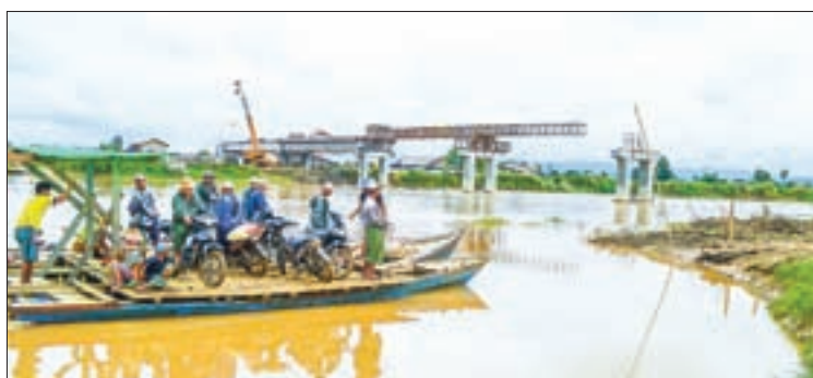
New Maeza bridge under construction in Indaw Township, Sagaing Region being seen.