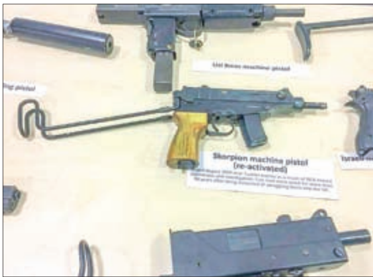
Illegal guns seized by police in Britain are displayed at the National Crime Agency headquarters in London, Britain, on 31 October, 2016.