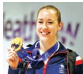
Olympic skeleton champion Lizzy Yarnold.

"I'll leave it open. But I want the IBSF to make a decision that defends the true values of clean sport."