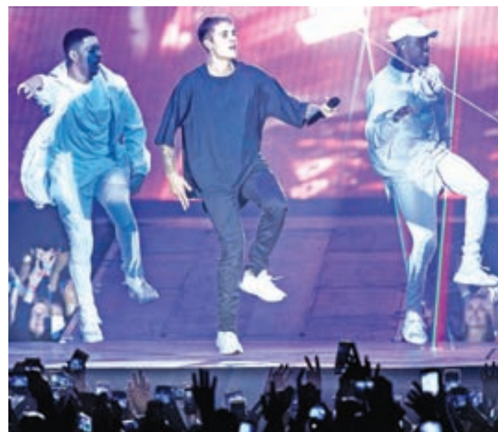
Singer Justin Bieber performs on stage in Telia Parken Stadium in Copenhagen, Denmark on 2 October 2016.

“There’s going to be times when I get upset, going to be times when I get angry, there’s times when I’m going to be frustrated, but I’m always going to be myself on this stage ... All I was simply doing was wanting people to listen; to kind of hear me out a little bit,” Bieber said, also posting his address to social media.—Reuters