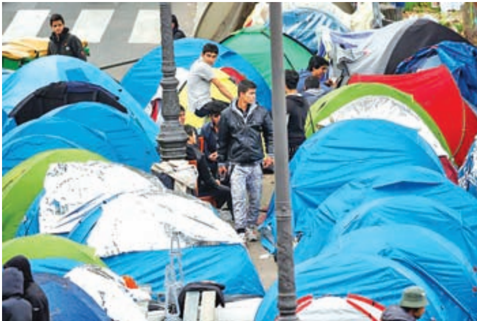
Migrants stand near their tents at a makeshift migrant camp on a street near the metro stations of Jaures and Stalingrad in Paris.

A Reuters journalist at the scene said a digger moved in to clear a small part of the camp, a sprawl of tents, mattresses, blankets and the meager belongings of migrants who come mostly from war-torn countries such as Afghanistan.