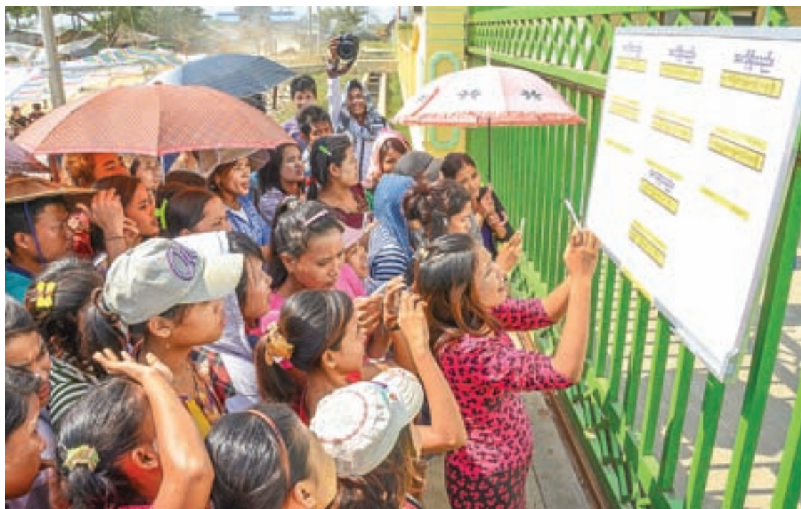
Applicants look at job offers displayed on a board of a garment factory in Hlinethaya, Yangon.

The permitted enterprises are Ocean Muse Fisheries, Swel Hein Group Company, Golden Myanmar-Tai Company, Rui-Ning (Myanmar) Garment Company, Dongyi (Myanmar) Company, Uteeli Garment (Myanmar) Company Limited, Myanmar Solamoda Garments Company (Factory-2), One of Front Company, Dishang Fashion (Myanmar) Company, Mahar Hpa An Production Company, United Precise Company, Huawei Technologies (Yangon) Company, KMA-Suzue Logistics Myanmar, Fiber link Myanmar Company, Convalt Energy (Myanmar)