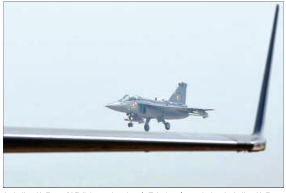
An Indian Air Force (IAF) light combat aircraft 'Tejas' performs during the Indian Air Force Day celebrations at the Hindon Air Force Station on the outskirts of New Delhi, India, on 8 October 2016.

But Prime Minister Narendra Modi's adminis -tration wants any further military planes to be built in India with an Indian partner to kickstart a domestic aircraft industry, and end an expensive addiction to imports.