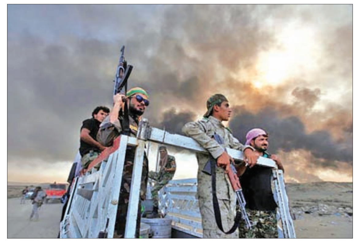
Iraqi pro-government forces are seen in Qayyara.

The PMF officially reports to the Shi'ite-led government of Prime Minister Haider al-Abadi who on 17 October announced the that in previous campaigns, the start of an offensive targeting Mo-