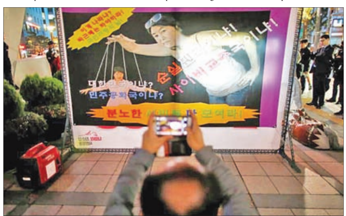
A man takes photographs of a satirical banner of South Korean President Park Geun-hye and Choi Soon-sil during a protest denouncing President Park Geun-hye over a recent influence-peddling scandal in central Seoul, South Korea, on 27 October 2016.

early months of her presidency has done little to deflect demands that the president reveal the full extent of her ties with Choi and whether Choi gained favours from the relationship.—Reuters