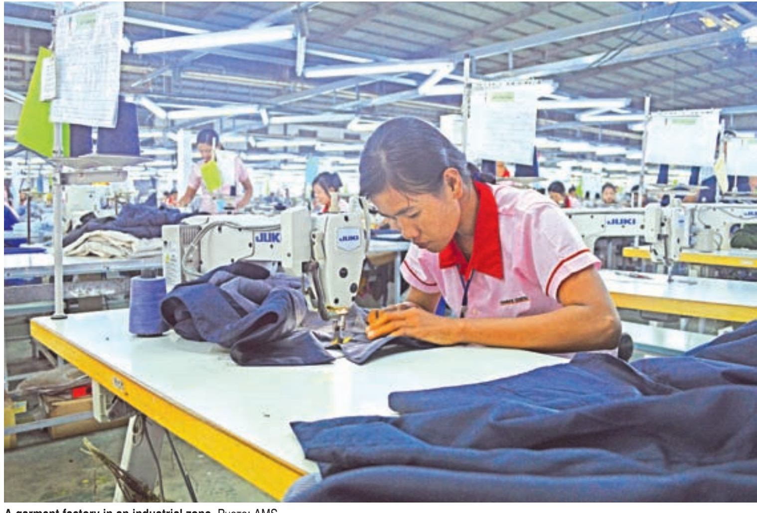
A garment factory in an industrial zone.

After Myanmar is restored to the Generalized System of Preference (GSP) from the EU, the country will receive a growing number of orders. -Ko Htet