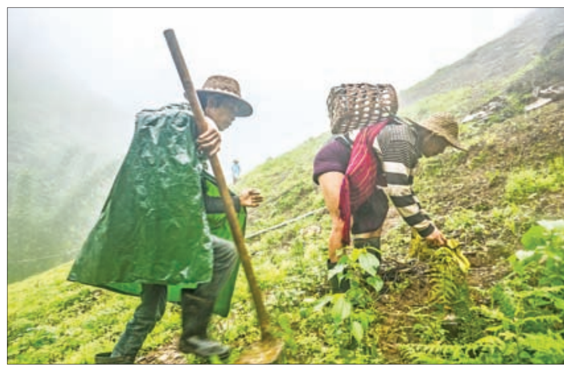
Farmers clear a steeply inclined field to ready it for planting poppy. The number of small-scale poppy farms in Shan State such as this one have increased over the past few years.

A recent report by the United Nations Office on Drugs and Crime (UNODC) estimates Myanmar had 55,000 hectares of