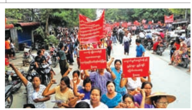
Jade dealers peacefully participating in the demonstration.