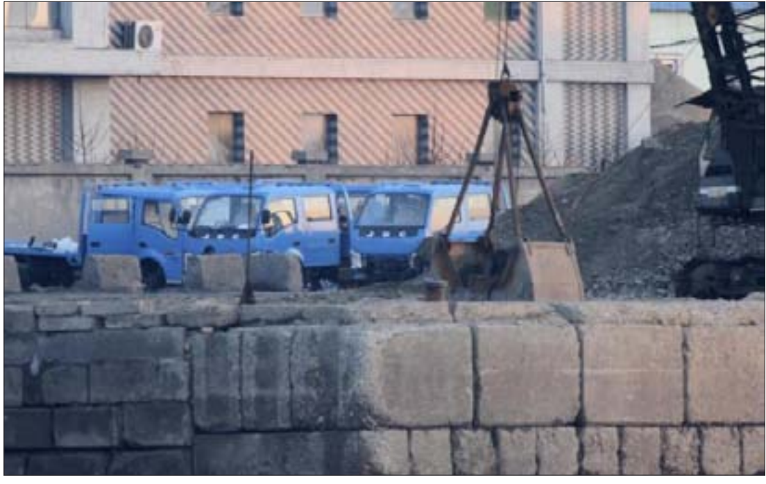
Trucks are parked next to a pile of coal on the bank of the Yalu River in Sinuiju, opposite the Chinese border city of Dandong, on 14 March 2016.

"The plain language of 2270 makes it very clear that the export of coal, or the importation of coal if you are China, is prohibited unless you can demonstrate that the transaction in question goes to the livelihood of the North Korean people," Blinken said in Beijing after visits to Japan and South Korea.