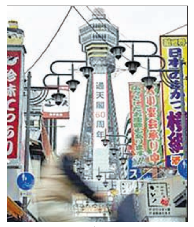
A banner to celebrate the 60th anniversary of the opening of Tsutenkaku tower, a much-loved landmark in the western Japan city of Osaka, is hoisted at the 108-metre tower, on 28 October 2016.

The operator unveiled a 60th anniversary memorial song while a restaurant at a nearby train station started offering a curry udon noodle dish that is a one-500th model of the tower. The special wheat flour noodle dish is 20 centimetres high as it uses "chikuwa" tube-like food made of fish paste and Japanese quail eggs to create a miniature tower standing in a bowl of noodles. — Kyodo News