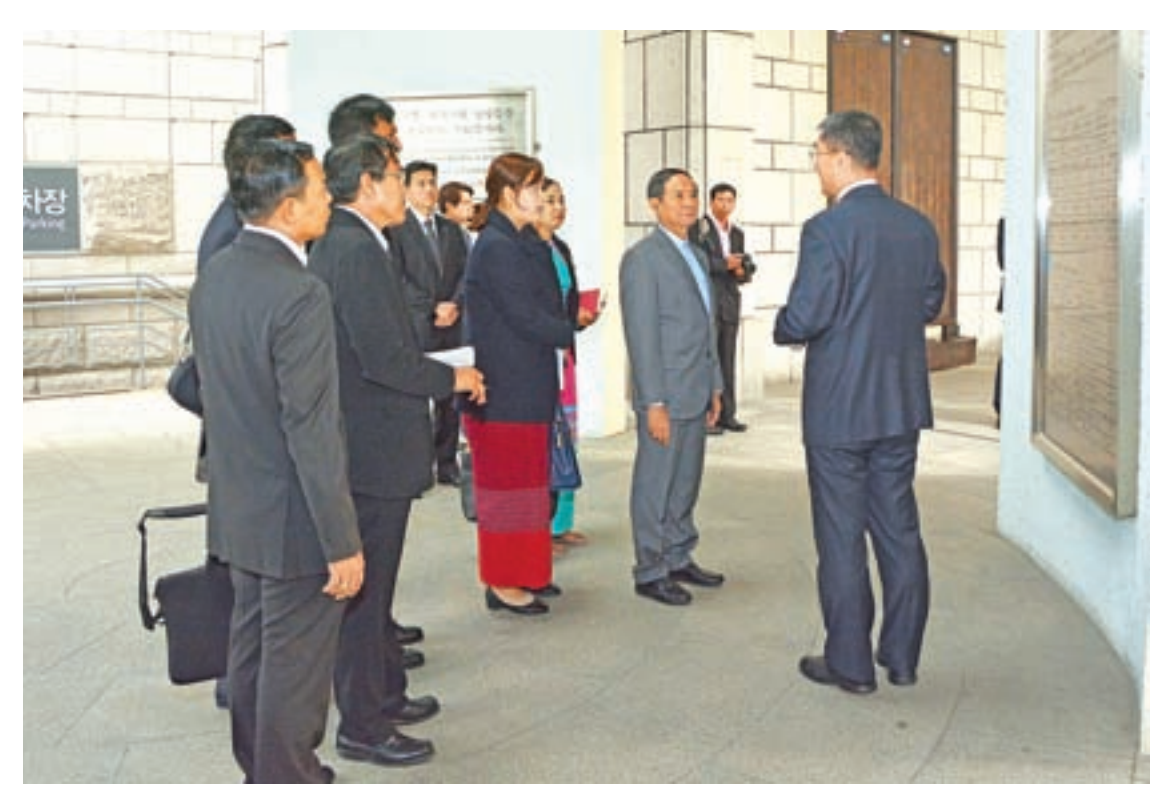
Pyithu Hluttaw Speaker U Win Myint being briefed about the museum.