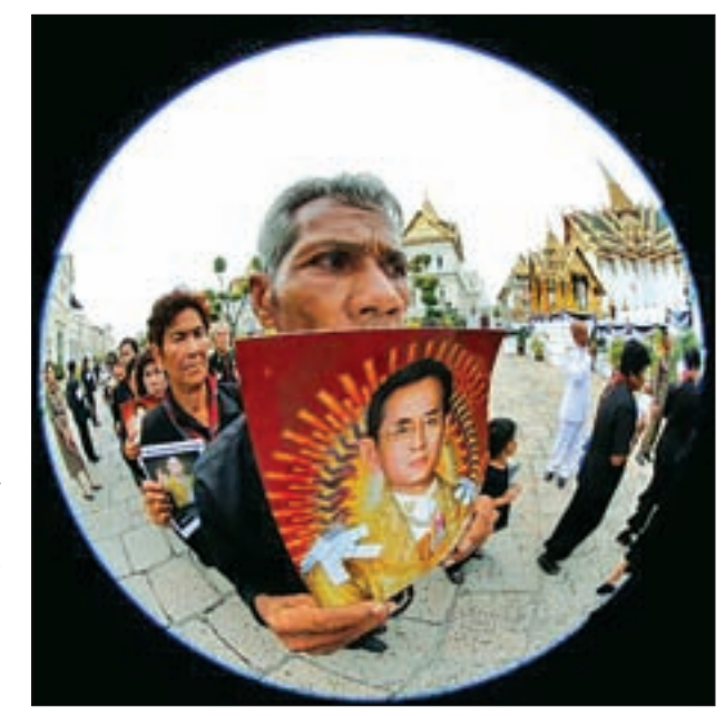
Mourners line up to get into the Throne Hall at the Grand Palace for the first time to pay respects in front of the golden urn of Thailand's late King Bhumibol Adulyadej in Bangkok, Thailand, on 29 October 2016.

Crown Prince Maha Vajiralongkorn, 64, is the king's designated successor, but junta chief Prayuth Chan-ocha told the country hours after the king's