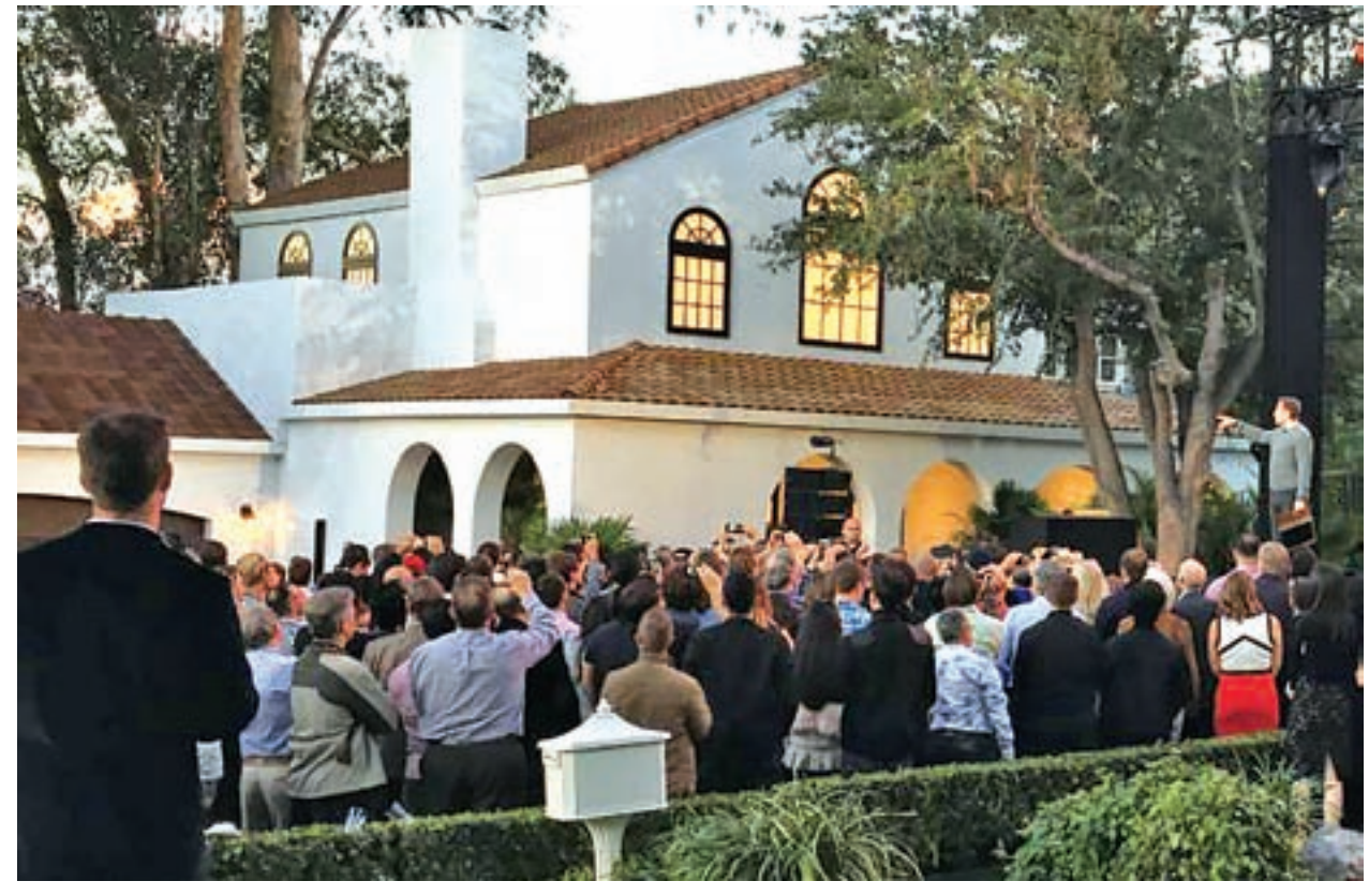
Tesla's electric car, Powerwall and solar roof are shown by Tesla Motors Inc Chief Executive Elon Musk (R), unveiling new energy products aimed at illustrating the benefits of combining his electric car and battery maker with solar installer SolarCity Corp, in Los Angeles, California, US, on 28 October 2016.

Musk refused to answer a reporter's question about how Tesla's balance sheet would accommodate the acquisition of SolarCity. By incorporating solar modules into rooftops, Tesla is hoping to succeed with a solar technology that to date