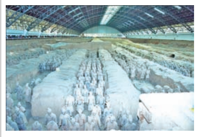
Terracotta warriors statues are seen at the site museum in Xian.

In the afternoon, the delegation went to Xian and visited the terracotta warriors of Qin Shi Huang, the first Emperor of China.—Myanmar News Agency