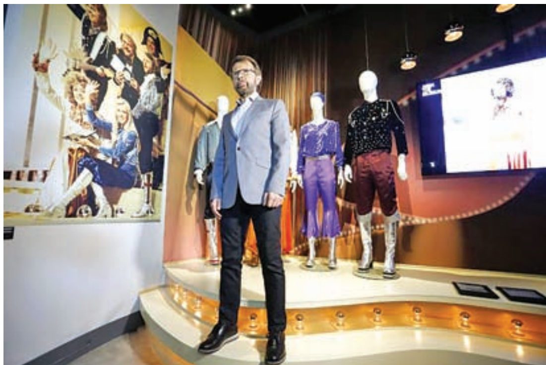
Former ABBA member Bjorn Ulvaeus poses in front of an exhibit at the new ‘ABBA - The Museum’ in Stockholm, Sweden in 2013.