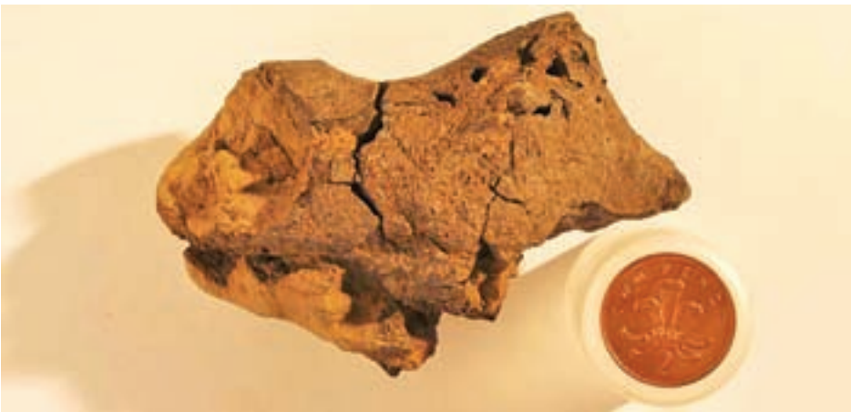
A handout photograph shows what scientists have identified as the first known example of fossilised brain tissue from a dinosaur, and say it resembles the brains of modern-day crocodiles and birds, released in London, Britain, on 27 October 2016.

"The chances of preserving brain tissue are incredibly small, so the dis-