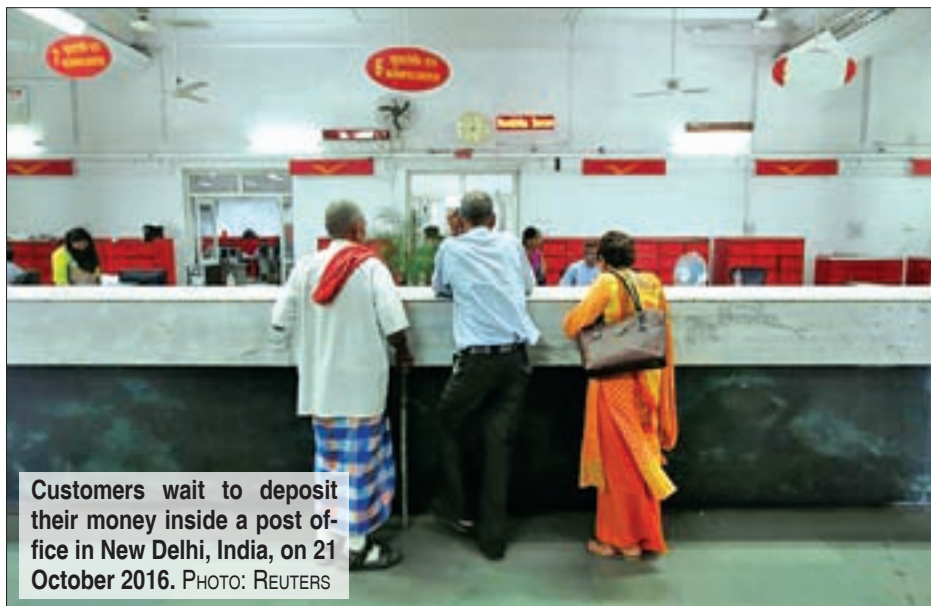
Customers wait to deposit their money inside a post office in New Delhi, India, on 21 October 2016.

It's a worry for Prime Minister Narendra Modi who aspires to achieve economic growth rates of 8-9 per cent — much higher than the current 7.1 per