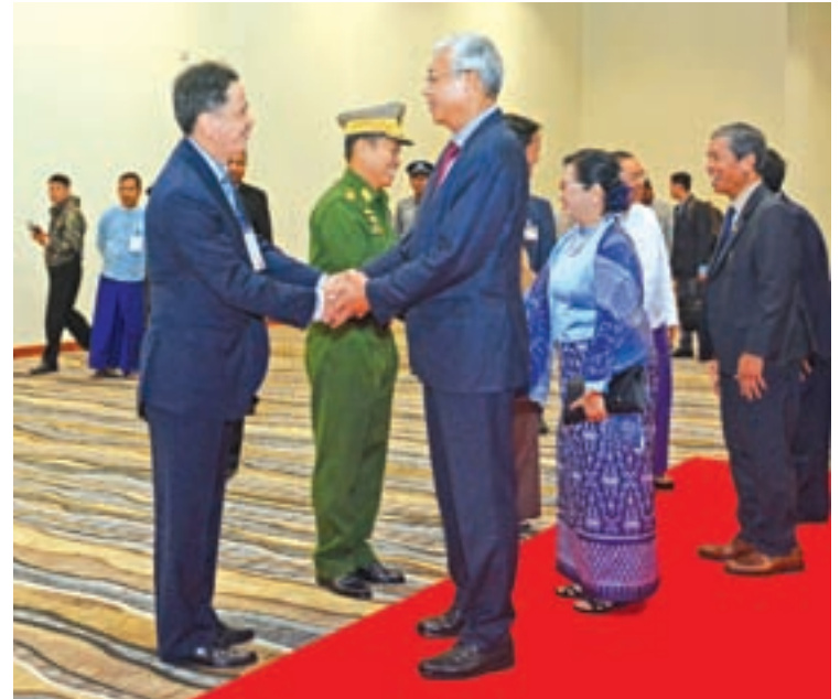
President U Htin Kyaw and wife Daw Su Su Lwin being welcomed at the Nay Pyi Taw International Airport.

During their stay in Hanoi, President U Htin Kyaw and wife Daw Su Su Lwin visited Ho Chi Minh House in Hanoi yesterday morning. During his visit to the traditional stilt house where Ho Chi Minh lived from 1958 to 1969