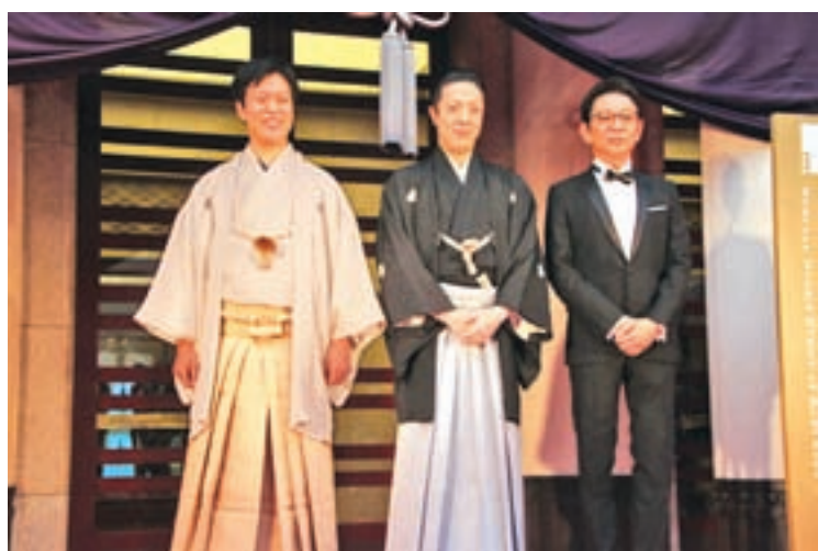
(From L) “Benshi” silent film narrator Ichiro Kataoka, kabuki actor Onoe Kikunosuke and TV personality Ichiro Furutachi pose in front of Kabukiza Theatre in Tokyo, where they performed in an event in collaboration with the Tokyo International Film Festival, on 27 October 2016. PHOTO: KYODO NEWS

Ichiro Furutachi, a well-known Japanese TV personality, also gave a more contemporary take in his performance as a guest “benshi” narrator for another silent film, “Blood’s Up at Takata-no-Baba.”— Kyodo News