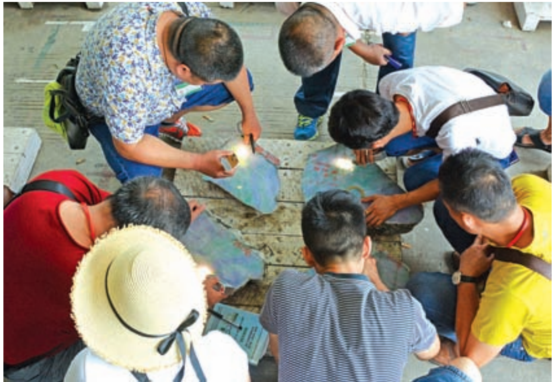
Merchants appraising jade stones at the 53rd Myanmar Gems Emporium in Nay Pyi Taw.

Over the past six months this year, the export value between Myanmar and foreign trade partners reached about $13 billion including over $5.5 billion from export sector and over $7.3 billion from import sector.— Ki Ki