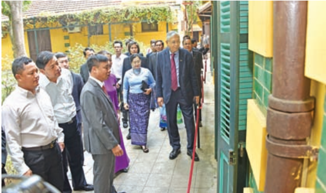
President U Htin Kyaw and wife Daw Su Su Lwin visit Ho Chi Minh House in Hanoi, Viet Nam.

A Myanmar delegation led by President U Htin Kyaw arrived back in Nay Pyi Taw yesterday concluding the three-day visit to Viet Nam.