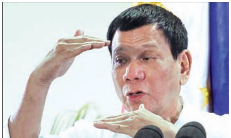
Philippine President Rodrigo Duterte gestures while answering questions during a news conference upon his arrival from a state visit in Japan at the Davao International Airport in Davao city, Philippines, on 27 October 2016.

Duterte, a former outspoken city mayor, emerged as a brash, crass, alternative candidate in a May election which he