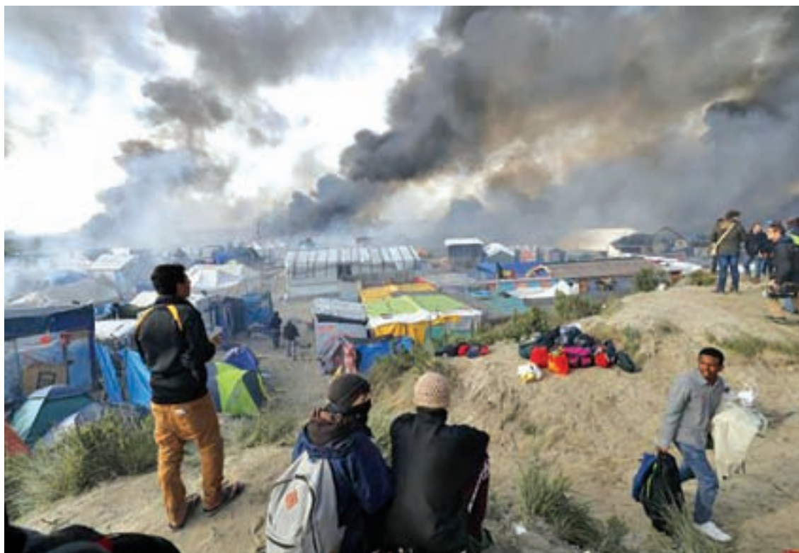
Smoke rises the sky as migrants and journalists look at burning makeshift shelters and tents in the ‘Jungle’ on the third day of their evacuation and transfer to reception centers in France, as part of the dismantlement of the camp in Calais, France.

Thousands of migrants had until this week been camped near Calais in the hope of making the