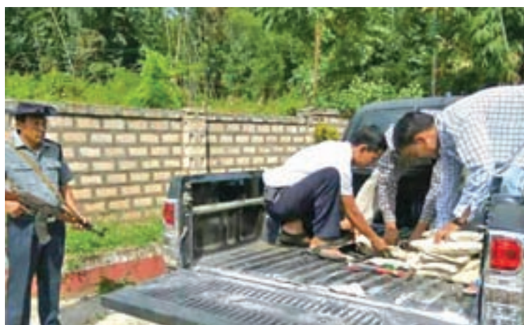
Authorities discover opium speciosa in Hsenwi.

LOCAL police arrested two drug traffickers after they were discovered in possession of a cache of opium speciosa worth over Ks600 million on Wednesday, according to a police report.