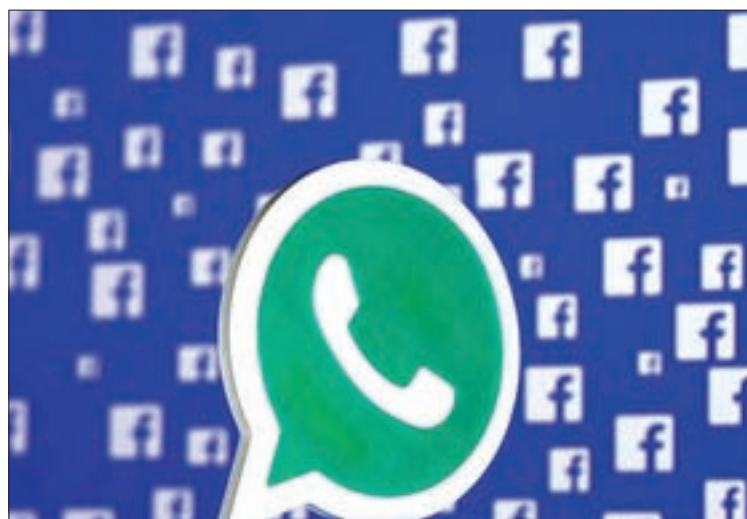
A 3D printed Whatsapp logo is seen in front of a displayed stock graph on 28 April 2016.

Apple has steadily upgraded components to the MacBook Pro, but the overall form has changed little, and PC Week described the unit being replaced as a "fossil" which had not had a major design change since 2013.—Reuters