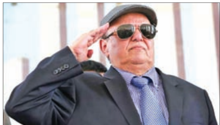
Yemen's President Abd-Rabbu Mansour Hadi salutes during a visit to the country's northern province of Marib, on 10 July 2016.

Some civilians fleeing Mosul have used the roads to the west to escape to Qamishli, in Kurdish-controlled northern Syria. —Reuters