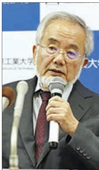
Nobel Prize laureate Yoshinori Osumi attends a press conference in Tokyo, on 25 October 2016, after being named as one of this year's Order of Culture recipients.