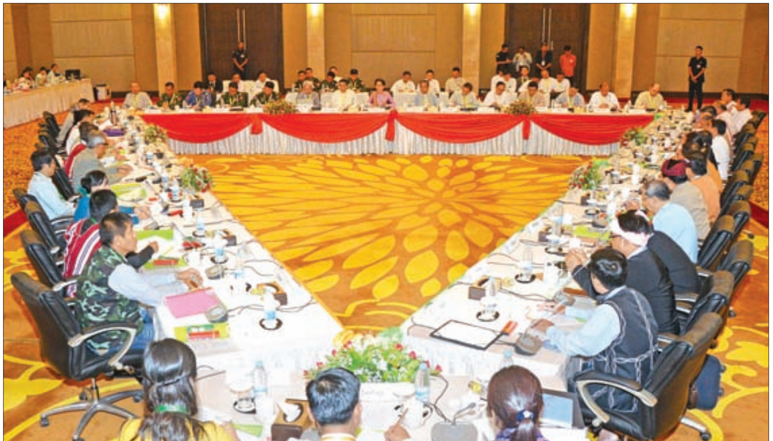
State Counsellor Daw Aung San Suu Kyi addresses the meeting of the Union Peace Dialogue Joint Committee.

The state counsellor said that national level dialogues are intended for all stakeholders, as there are many ethnic groups in Myanmar. Defining that inclusiveness means participation of those who can represent all.