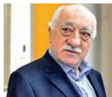
US based cleric Fethullah Gulen at his home in Saylorsburg, Pennsylvania, US, on 29 July 2016.