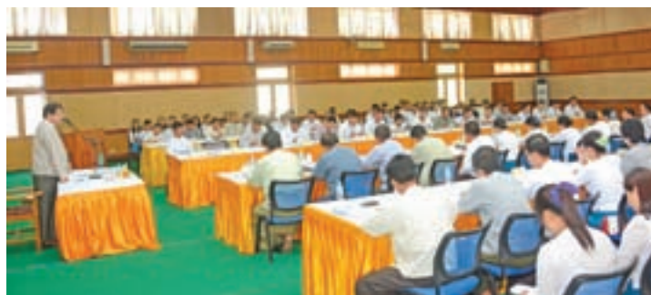
Union Minister for Information Dr Pe Myint addressing the meeting with IPRD's Divisional Heads.

He also stressed the need for the IPRD to hold meetings, discussions and talk shows and to conveniently accommodate guests in department-owned buildings in co-operation with nationwide vil-