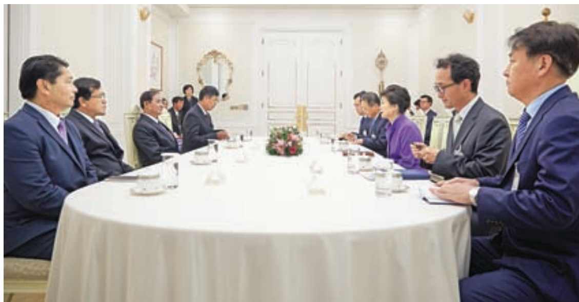
Speaker U Win Myint meeting with South Korean President Park Geun-hye.