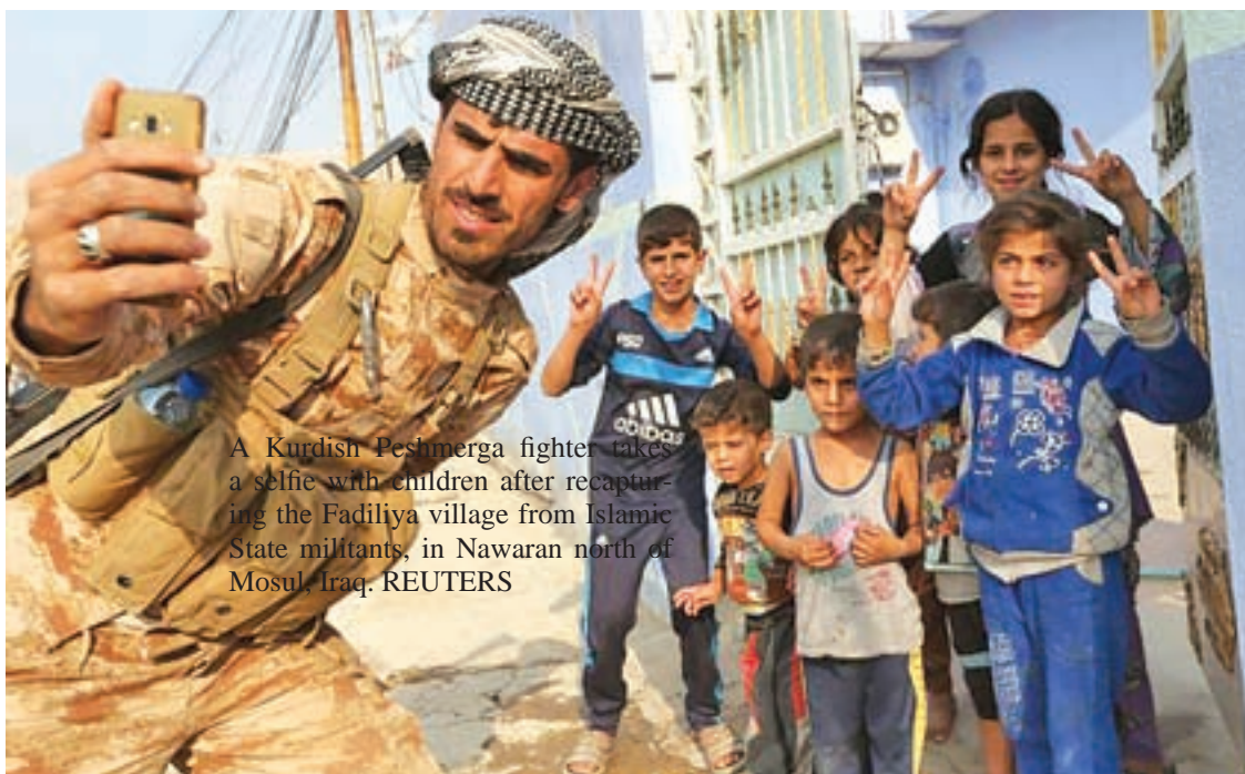
A Kurdish Peshmerga fighter takes a selfie with children after recapturing the Fadiliya village from Islamic State militants, in Nawaran north of Mosul, Iraq.