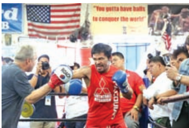
Boxer Manny Pacquiao of The Philippines works out in advance of his WBO welterweight bout against Jessie Vargas, in Los Angeles, California, US, on 29 October.

"I do not underestimate Jessie Vargas," Pacquiao, 37, told reporters after beginning his training camp in Los Angeles this week under the watchful eye of his Hall of Famer trainer Freddie Roach at the Wild Card Boxing Club.