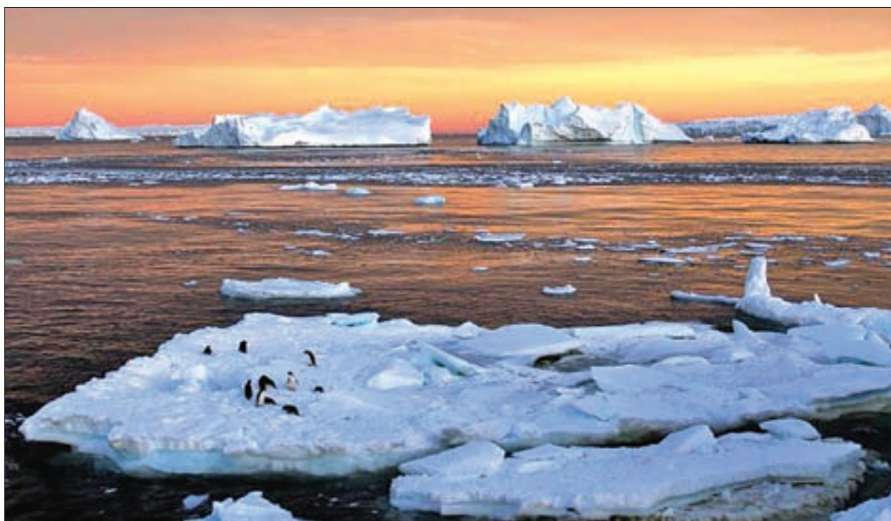
Adelle penguins stand atop ice near the French station at Dumont d'Urville in East Antarctica, in 2010.

Russia agreed to the proposal, after blocking conservation proposals on five previous occasions.