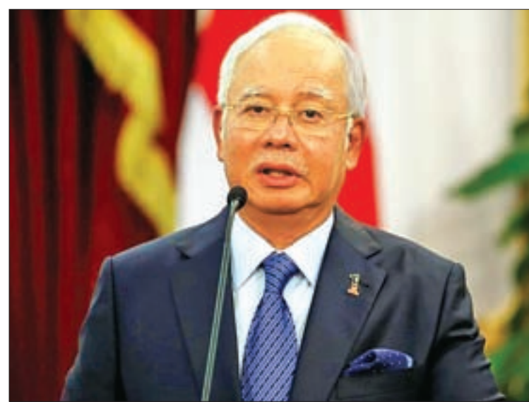
Malaysia's Prime Minister Najib Razak.

The lawsuits allege over $3.5 billion was misappropriated from 1MDB, some of which ended up