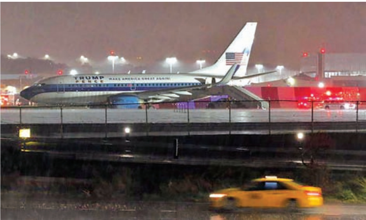
A campaign plane carrying US Republican vice presidential nominee Mike Pence rests after it skidded off the runway after landing in the rain at LaGuardia Airport in New York, US, on 27 October 2016.