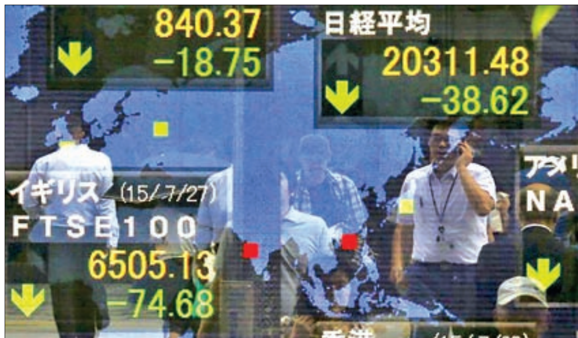
People are reflected in a board showing market indices in Tokyo in 2015.

In a week marked by deep slides in prices of US and euro zone debt, the benchmark 10-year Treasury yield US10YT=RR