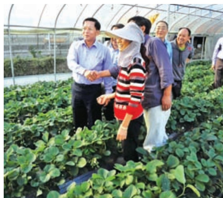
Senior General Min Aung Hlaing visits the agricultural firm in Guo Lin Village, Xi Shan.