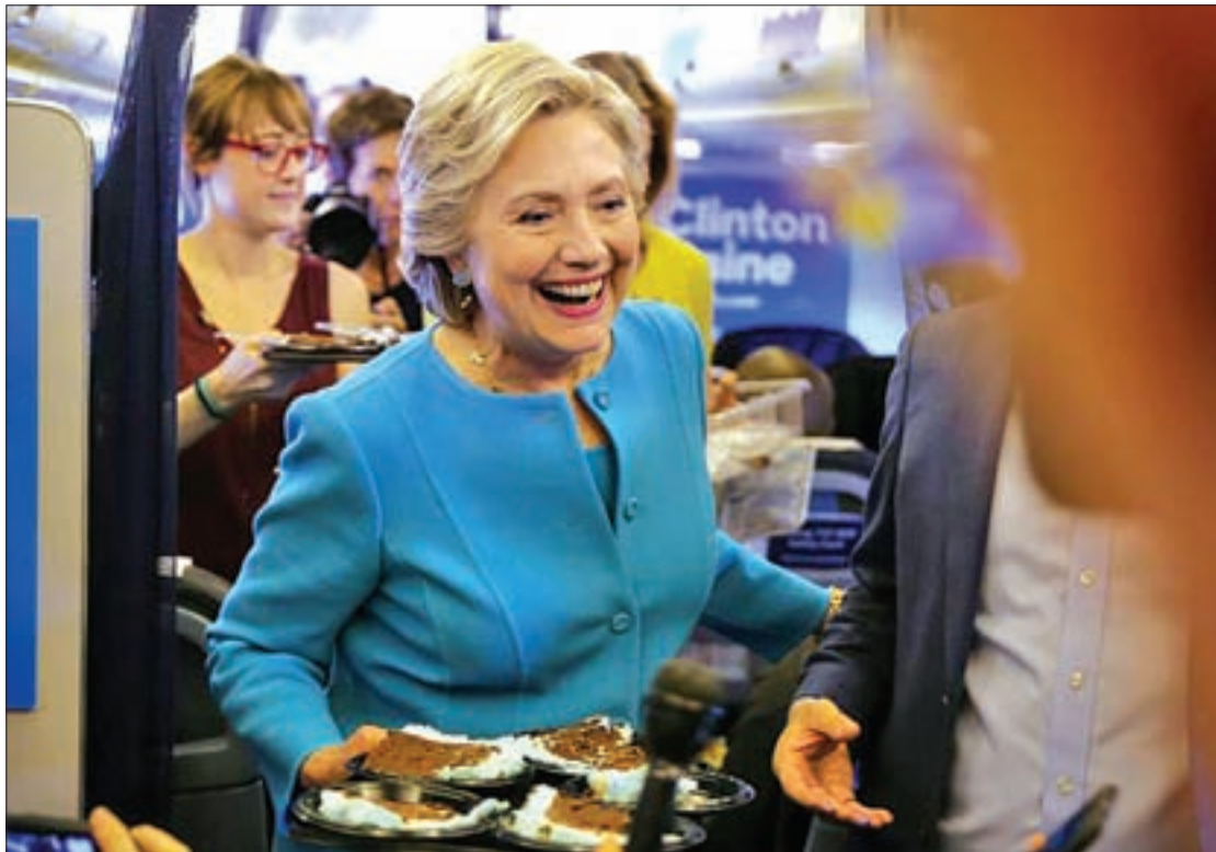
Democratic US presidential nominee Hillary Clinton brings birthday cake to members of the media, as she turns 69, inside her campaign plane en route to New York, US, on 26 October 2016.