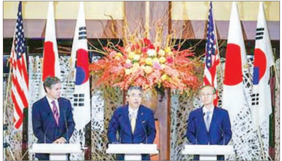
(From L) US Deputy Secretary of State Antony Blinken, Japanese Vice Foreign Minister Shinsuke Sugiyama and South Korea’s First Vice Foreign Minister Lim Sung Nam attend a joint press conference following talks in Tokyo, on 27 October 2016.

At the press conference, Sugiyama said Japan will “sincerely respond” to the announcement from a South Korean official earlier