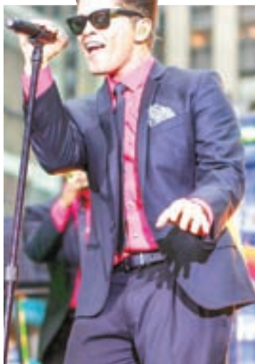
Bruno Mars.

The 31-year-old singer said he would love to perform the tune with Adele. “I don’t know what she’s waiting on, man.”—PTI