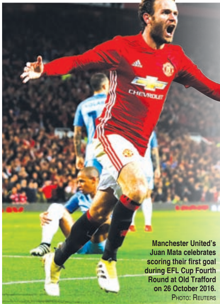
Manchester United's Juan Mata celebrates scoring their first goal during EFL Cup Fourth Round at Old Trafford on 26 October 2016.