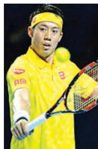
Kei Nishikori of Japan faces off against Paolo Lorenzi of Italy during a Swiss Indoors second round match in Basel, on 26 October 2016.

He is seeking his second title of the season, having won at the Memphis Open in February.—Kyodo News