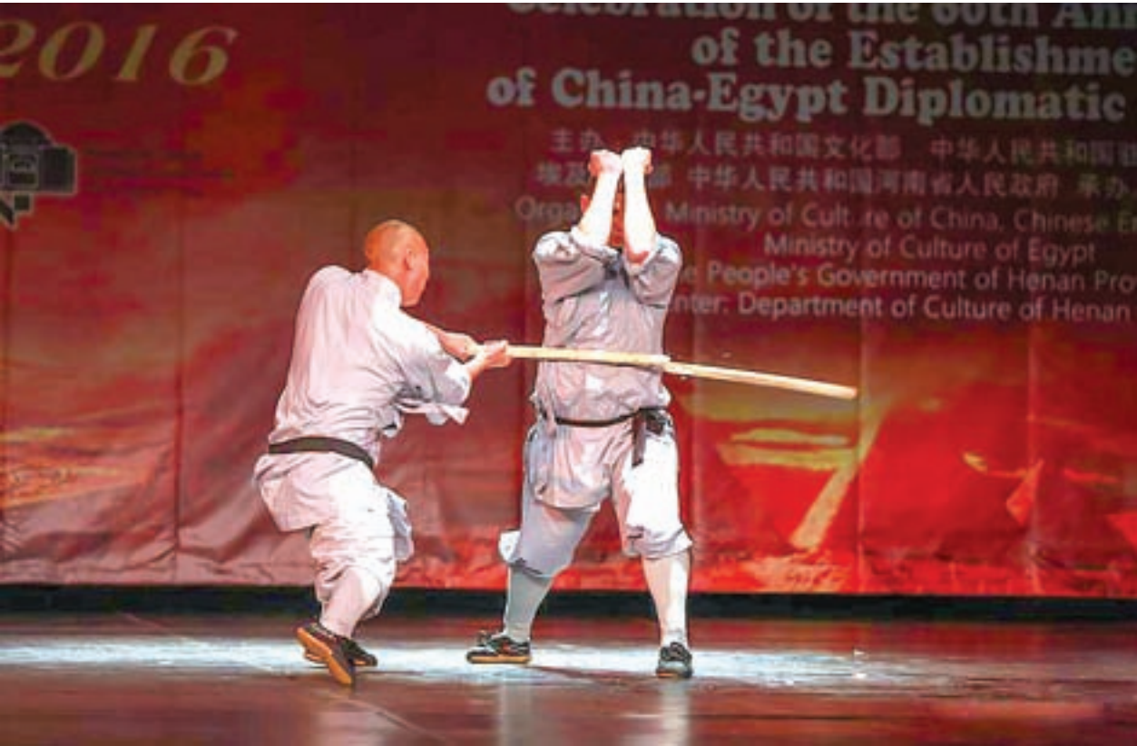
Buddhist monks from China’s Shaolin Temple perform Kung Fu during a show in Cairo, Egypt, on 25 October 2016. The show is part of the 2016 China-Egypt Culture Year jointly launched by Egypt and China to mark the 60 th anniversary of the establishment of their diplomatic relations.