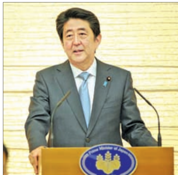
Japan Prime Minister Shinzo Abe.

Japanese prime ministers are elected by par-