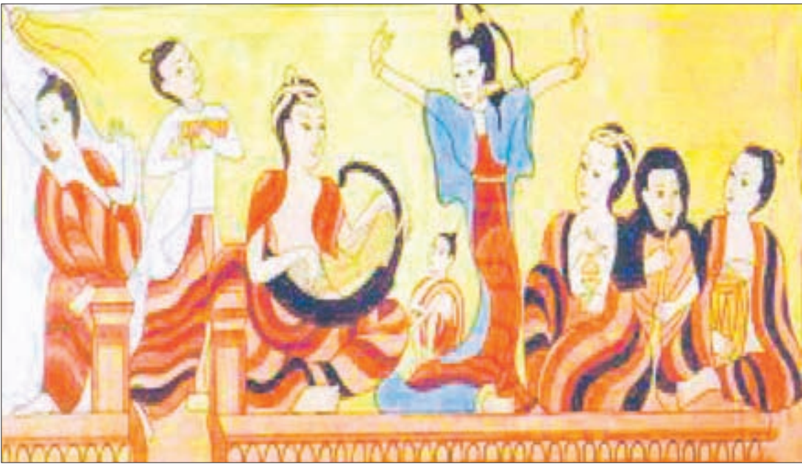
A fresco depicting an Anyeint dance group on the wall of a temple in old Bagan.

Literary evidences tell us performance of Anyeint time as early