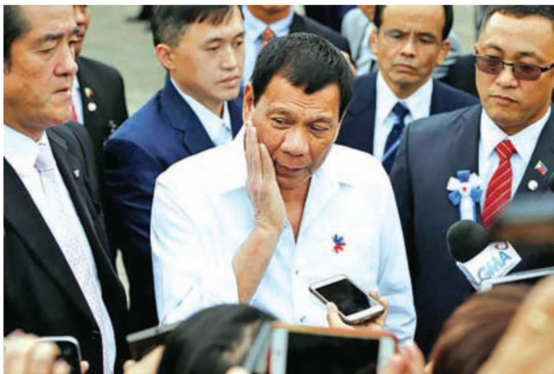
Philippine President Rodrigo Duterte (C) speaks to the media after his inspection at Japan Coast Guard base in Yokohama, south of Tokyo, Japan, on 27 October 2016.

“Joint exercise with Japan in general terms is not a problem. Stationing of Japanese troops was not discussed and with the