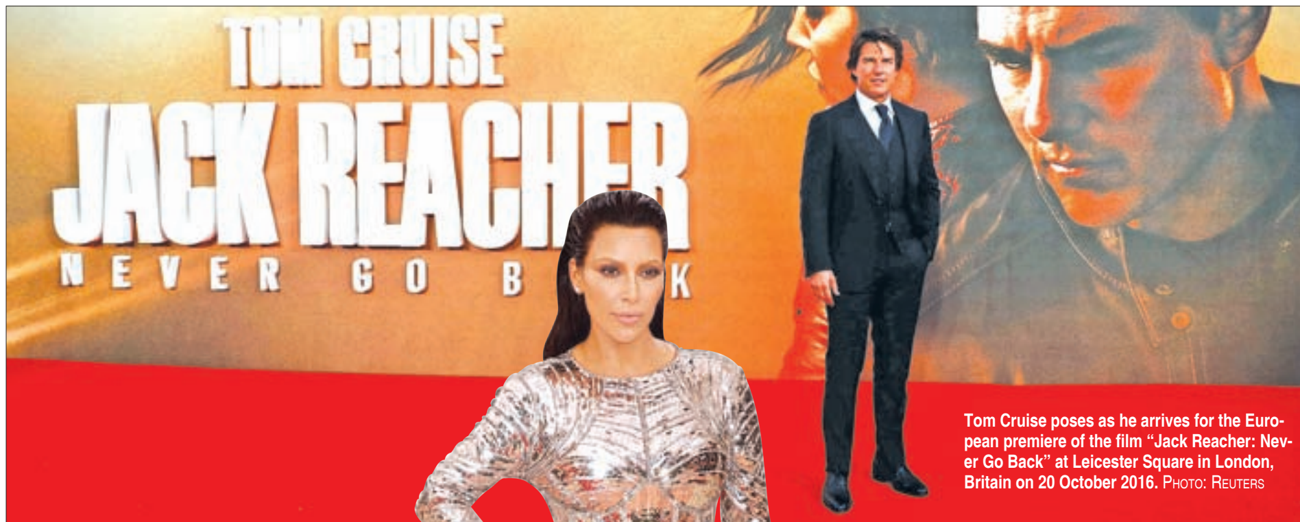
Tom Cruise poses as he arrives for the European premiere of the film “Jack Reacher: Never Go Back” at Leicester Square in London, Britain on 20 October 2016.

1990, while he was still trying to make it as a global star. The actor is one of the highest-ranking Scientologists has been hailed by leaders of the faith as the “chosen one” who will spread the word of the religion.—PTI