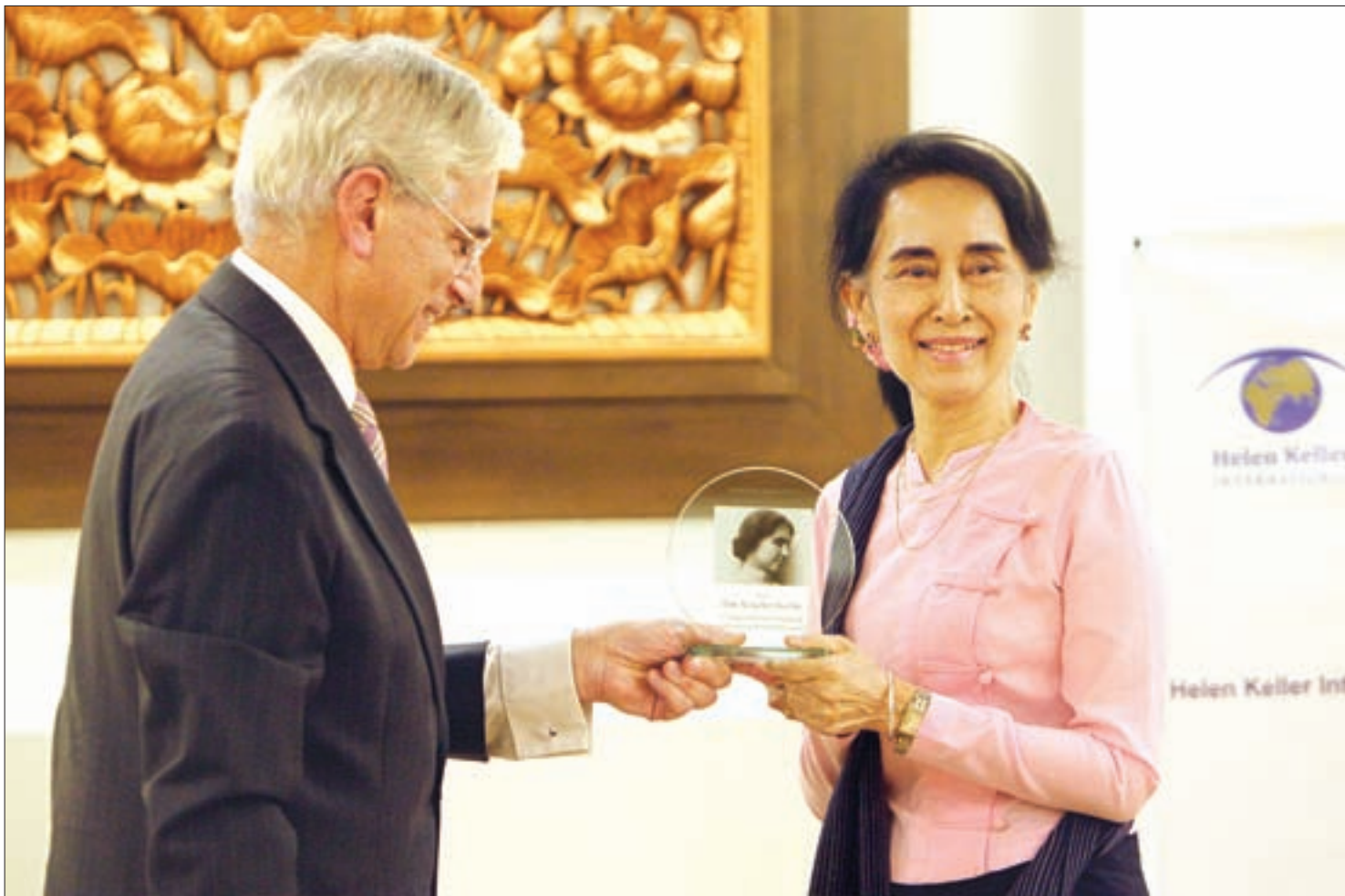
State Counsellor Daw Aung San Suu Kyi accepts the Helen Keller International Humanitarian Award 2016.