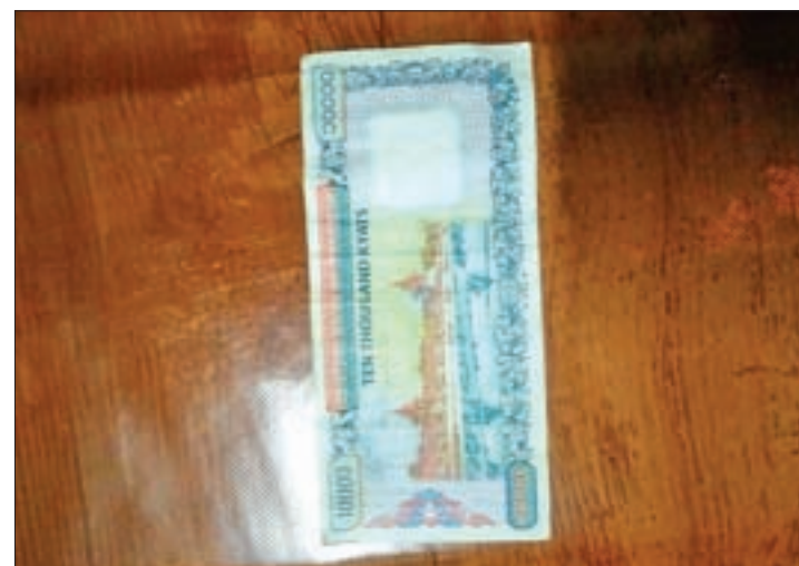
A K 10,000 counterfeit note.

Currently, police members put forth concerted efforts to arrest the owner of the fake notes