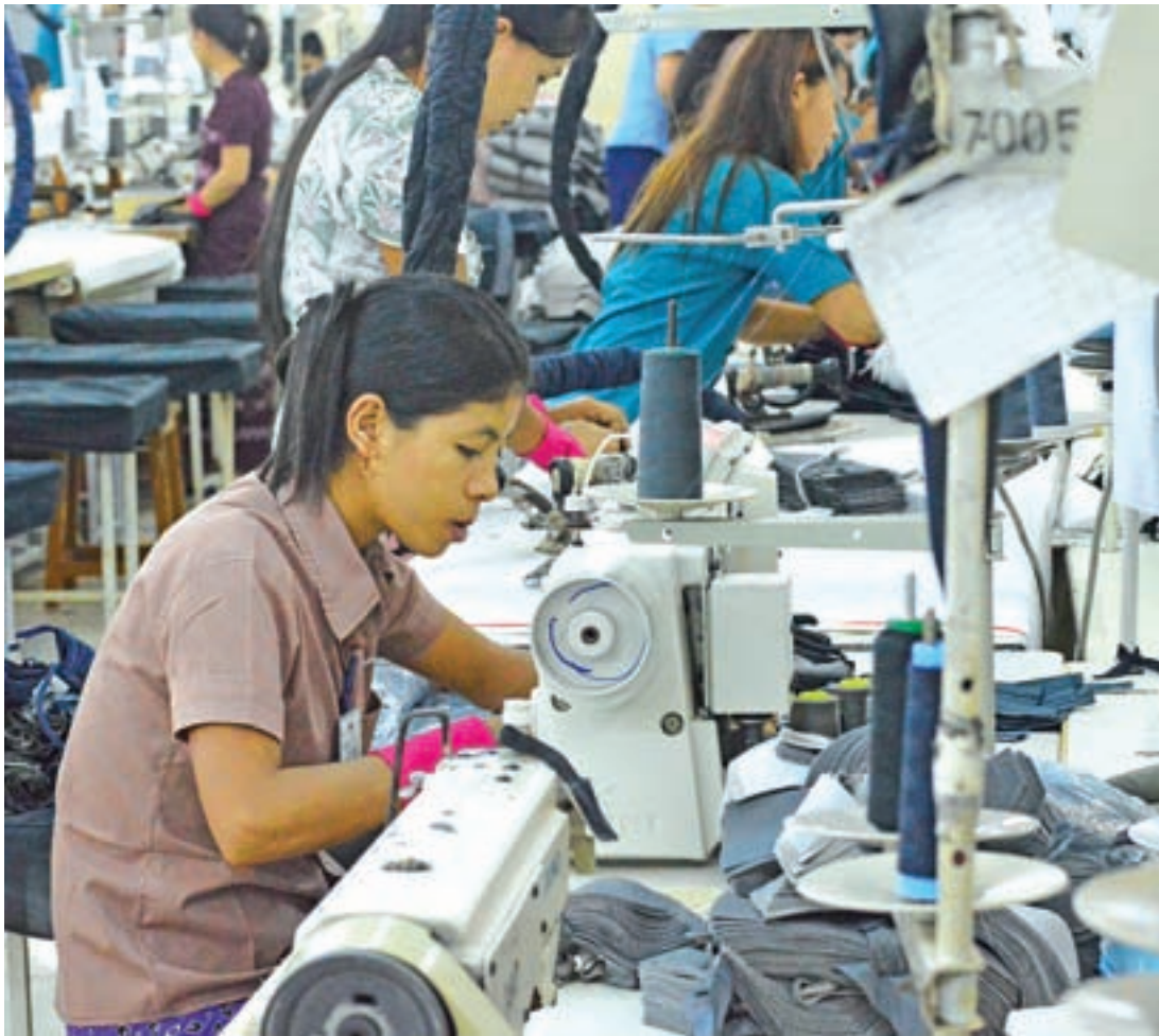
Workers seen on the production line of a garment factory in Yangon.

Myanmar's garment sector is expected to earn US$2billion in this fiscal year 2016-2017.—200