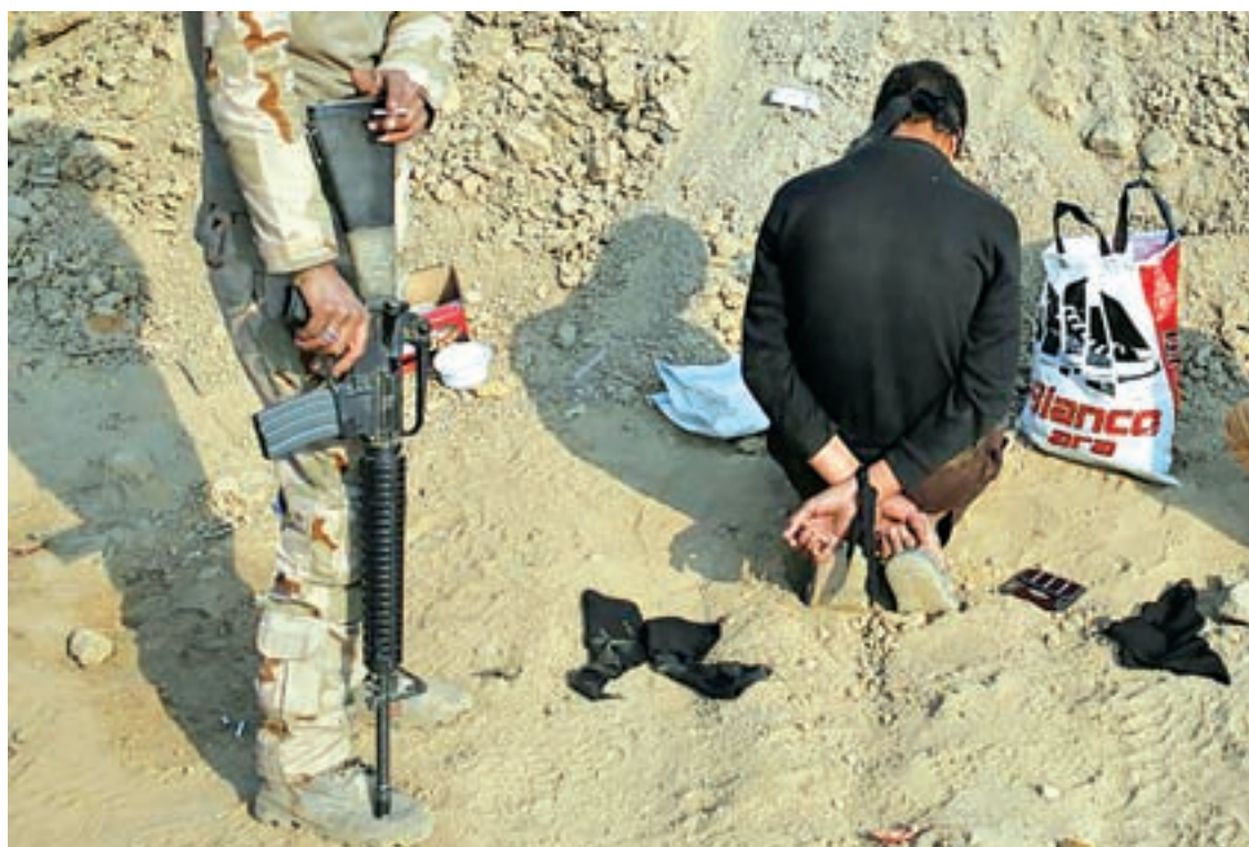
An Iraqi soldier stands next to a detained man accused of being an Islamic State fighter, at a check point in Qayyara, south of Mosul, Iraq, on 27 October 2016.

US Defence Secretary Ash Carter said on Tuesday an attack on Raqqa, Islamic State's main stronghold in Syria, would start while the battle of Mosul is still unfolding. It was the first official suggestion that US-backed forces in both countries could soon mount simultaneous operations to crush the self-proclaimed caliphate once and for all.—Reuters