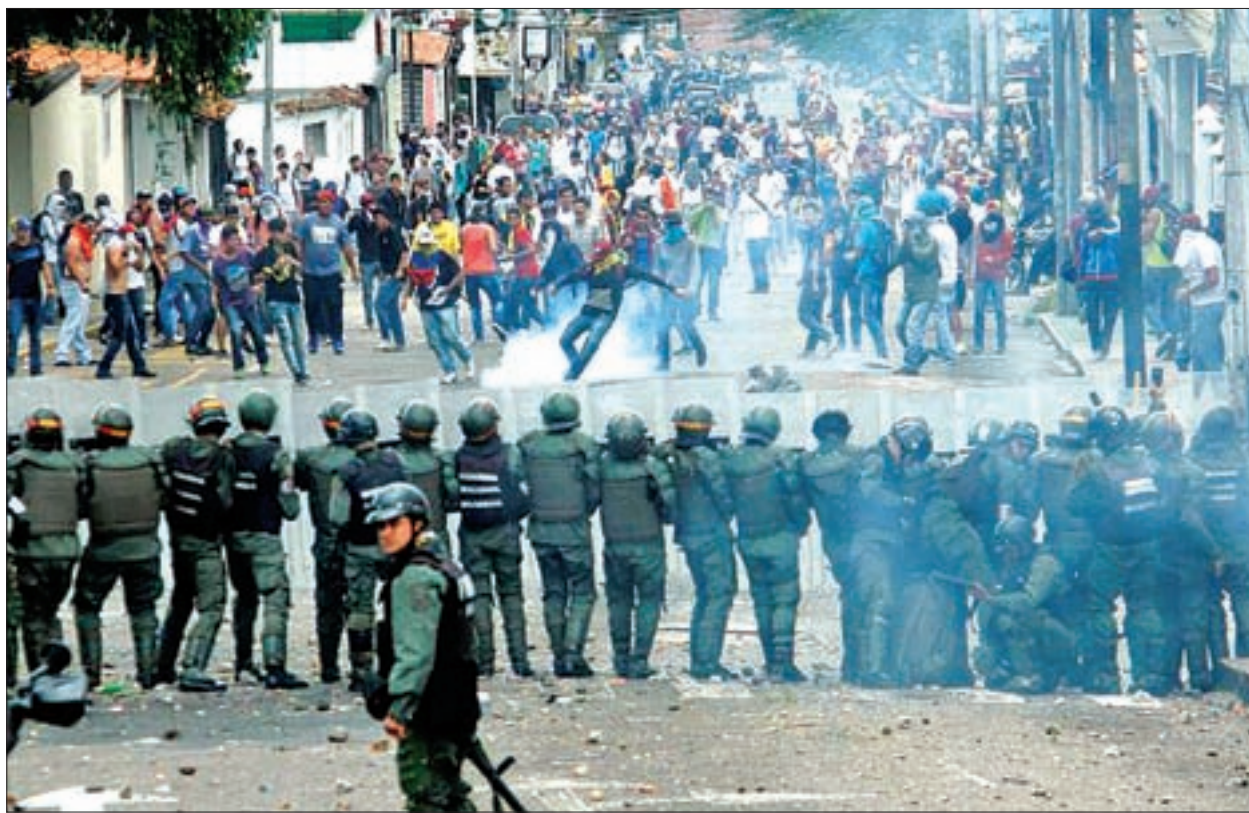
Demonstrators clash with members of Venezuelan National Guard during a rally demanding a referendum to remove Venezuela's President Nicolas Maduro in San Cristobal, Venezuela, on 26 October 2016.

After launching a political trial against Maduro on Tuesday in the National Assembly, the opposition coalition held nationwide marches dubbed "Takeover of Venezuela" on Wednesday.