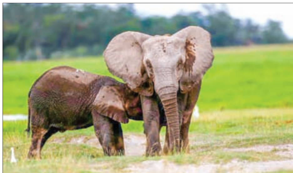
An elephant breastfeeds its young one at the Amboseli National Park, southeast of Kenya's capital Nairobi, on 25 April 2016.

OSLO — Worldwide populations of mammals, birds, fish, amphibians and reptiles have plunged by almost 60 per cent since 1970 as human activities overwhelm the environment, the WWF conservation group said on Thursday.