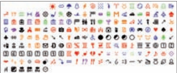
The set of 176 original emoji characters which have been donated to the Museum of Modern Art in New York City are seen in an undated handout image.

The 12 x 12 pixel images of hearts, arrows and hand gestures were the blueprint for the emojis widely used today, and they expanded the ways to communicate using the limited screen space available on devices of