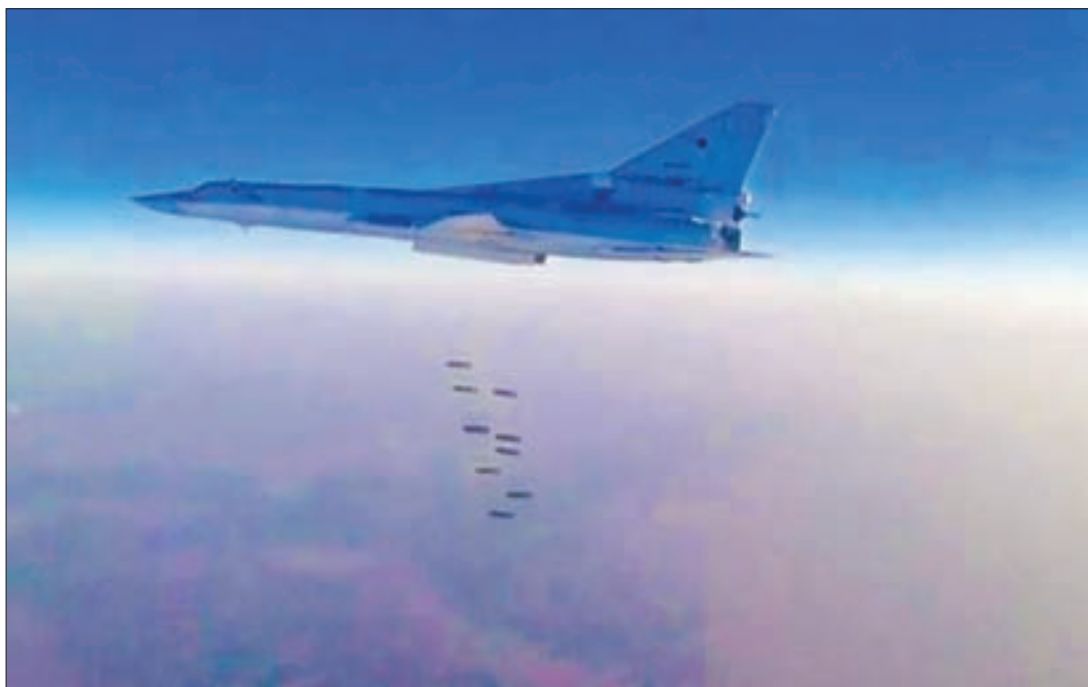
A still image taken from a video footage and released by Russia's Defence Ministry, on 14 August 2016, shows a Russian Tu-22M3 bomber dropping off bombs near what the ministry said is the city of Deir ez-Zor, Syria.

Obama “noted the need for close coordination” between the two countries to apply sustained pressure on Islamic State in Syria, the White House said in a statement. The two leaders also agreed on the importance of denying Kurdish PKK militants a safe haven in northern Iraq, it added. —Reuters