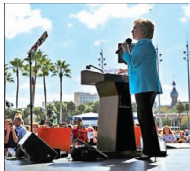
Democratic US presidential nominee Hillary Clinton speaks at a campaign rally in Tampa Florida, US on 26 October 2016.

Despite the growing pessimism, Trump, who trails Clinton in national opinion polls, still enjoys overwhelming support from members of his party. Some 79 per cent of likely Republican voters said they would vote