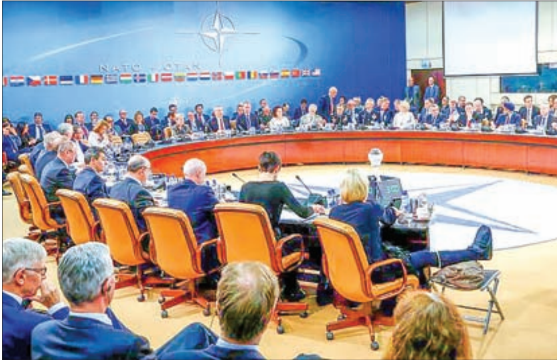
NATO defence ministers attend a meeting at the Alliance headquarters in Brussels, Belgium, on 26 October 2016.