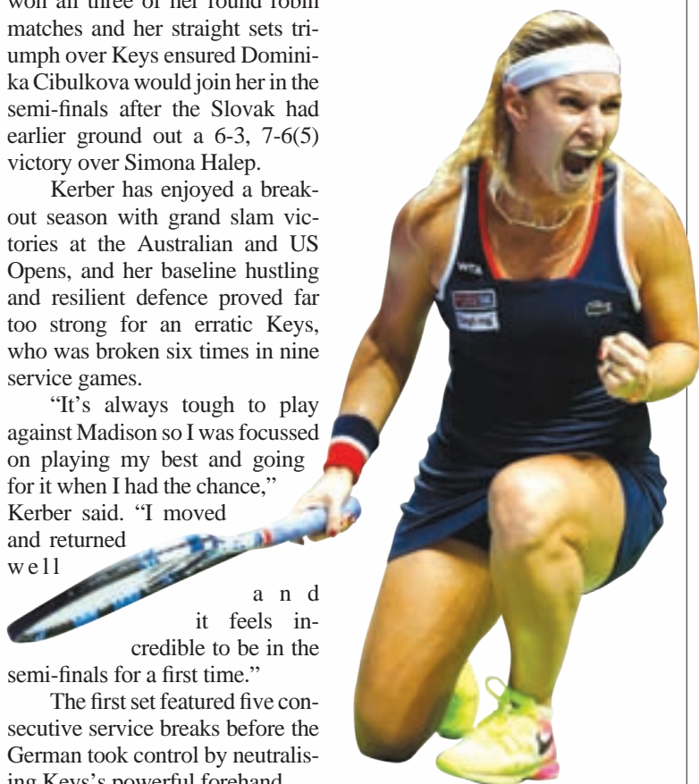
Dominika Cibulkova of Slovakia celebrates after defeating Simona Halep of Romania at Singapore Indoor Stadium, Singapore, on 27 October 2016.

The American's high-risk aggressive game is vulnerable against a defensive master like Kerber but after hitting too many unforced errors in the first set, Keys found her range at the start of the second to open a 2-0 lead with an early break.—Reuters