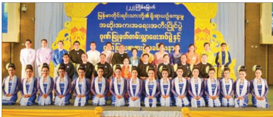
Vice President U Henry Van Thio seen posing for a group photo.

Then, he added that the government organizes the ethnic traditional performing arts com-