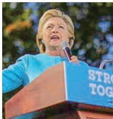
Democratic US presidential nominee Hillary Clinton.

Trump reiterated his position during a rally on Monday in St. Augustine, Florida, where he also urged supporters to vote early and declared his campaign was winning the election.