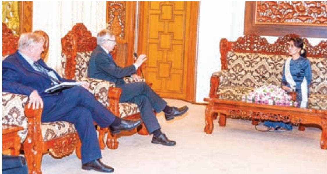
State Counsellor Daw Aung San Suu Kyi holds talks with Mr. Kjell Magne Bondevik, former Prime Minister of Norway and the Founder and President of the Oslo Center for Peace and Human Rights.

THE State Counsellor and the Union Minister for Foreign Affairs Daw Aung San Suu Kyi received Mr. Kjell Magne Bondevik, former Prime Minister of Norway and the Founder and President of the Oslo Center for Peace and Human Rights, yesterday at the Ministry of Foreign Affairs in Nay Pyi Taw.