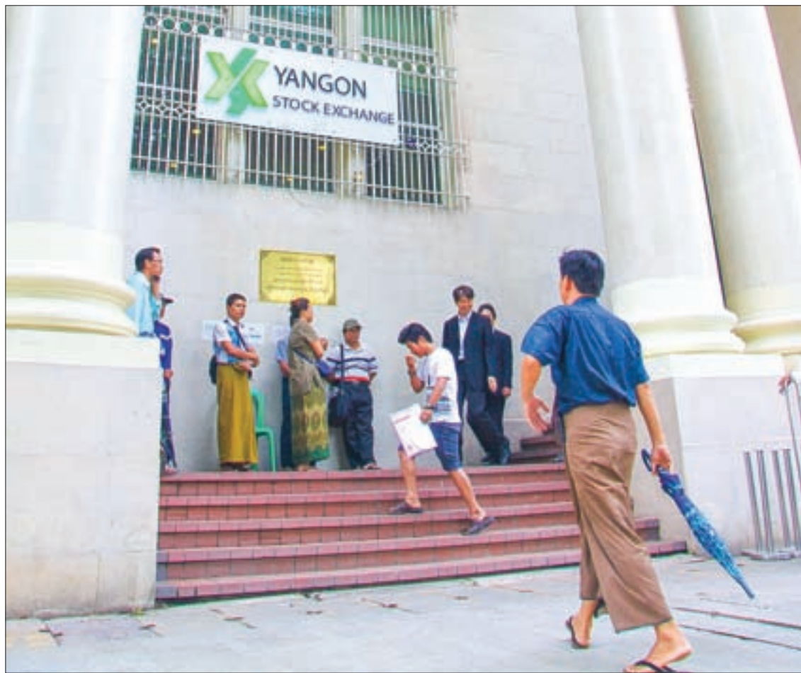
People seen outside Yangon Stock Exchange (YSX) in Yangon.

The split of MTSH's stock is aimed at boosting the share trading volume at YSX. The price of MTSH's share was Ks49,000 per share on 25th October, whereas the shares of First Myanmar Investment (FMI) is trading at Ks17,000 and that of Myanmar Citizens Bank, at Ks9,100, it is learnt from YSX.— Ko Htet