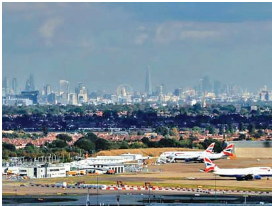
A British Airways planes are parked at Heathrow Airport near London, Britain on 11 October, 2016.

LONDON — Prime Minister Theresa May is set to end decades of indecision by backing the expansion of Britain and Europe's busiest airport, Heathrow, finally kickstarting a project made more pressing by the vote to leave the EU.