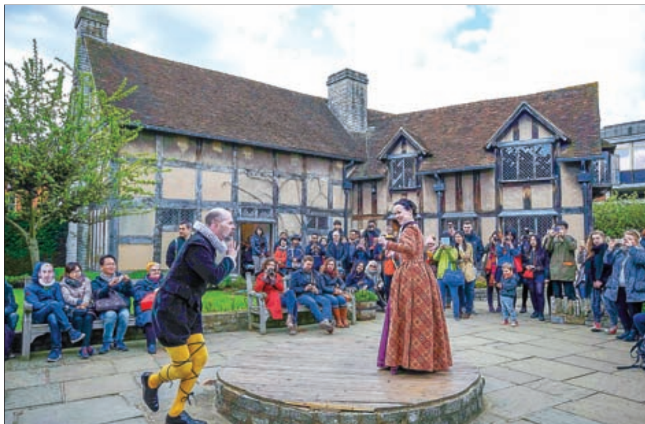
Tourists watch actors perform at the house where William Shakespeare was born during celebrations to mark the 400 th anniversary of the playwright's death in Stratford-upon-Avon, Britain, on 23 April 2016.

"That kind of Big Data was never available until very recently," he said.