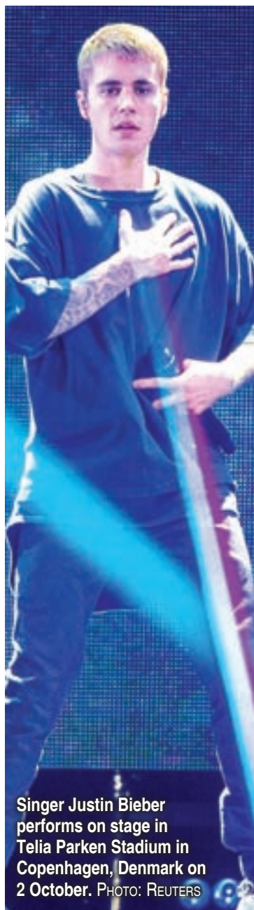
Singer Justin Bieber performs on stage in Telia Parken Stadium in Copenhagen, Denmark on 2 October.