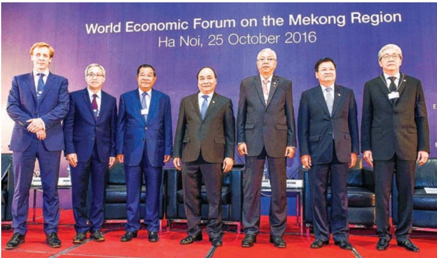
President U Htin Kyaw poses for a documentary photo with the leaders of the countries in Mekong Region.

PRESIDENT of the Republic of the Union of Myanmar U Htin Kyaw delivered a speech at the World Economic Forum on the Mekong Region held at the National Convention Centre in Ha-noi, Viet Nam, yesterday afternoon.