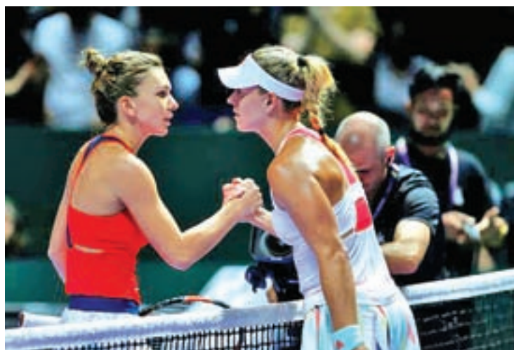
Angelique Kerber of Germany (R) is congratulated by Simona Halep of Romania during Singapore WTA Finals Round Robin Singles at Singapore Indoor Stadium, Singapore, on 25 October 2016.

"I'm feeling very, very good here and it's just great to win my