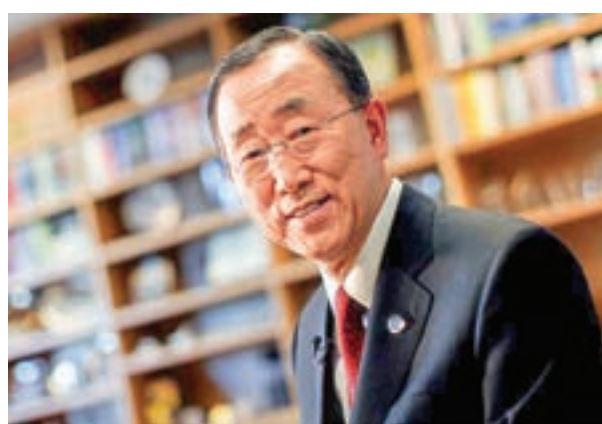
United Nations Secretary-General Ban Ki-moon is seen during an interview with Reuters at UN headquarters in New York, in 2010.

With the pride Koreans take in him as "president of the world" and absence thus far of strong competition, opinion polls show Ban as the front-runner for the election next year.