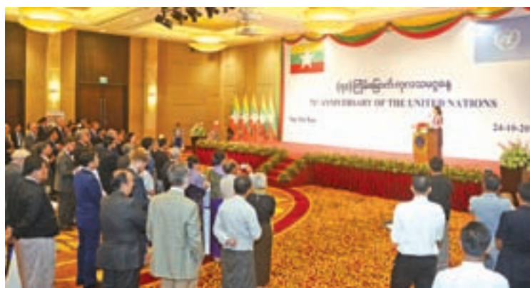
Daw Aung San Suu Kyi delivers remarks at the ceremony to celebrate the 71st Anniversary of the United Nations.

phase of my relationship with the UN started about 30 years ago, when I was leading the opposition party, the National League for Democracy. It was a different sort of relationship from the past one --- but extremely interesting. It gave me a different view of the