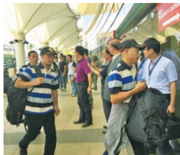
Chinese crew members (wearing caps) freed by Somali pirates arrive at the airport before heading home, in Nairobi, Kenya, on 24 October 2016. Nine out of the ten Chinese crew members freed by Somali pirates took a flight home on Monday from the Kenyan capital Nairobi, accompanied by officials sent from Beijing.

The Chinese government has expressed thanks to "all the organisations and people involved in the rescue operation," and its condolences to the families of the deceased crew members.—Xinhua