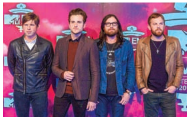
US rock band Kings of Leon.

LOS ANGELES — Kings of Leon debuted at the top of the weekly US Billboard 200 chart on Monday with "WALLS," the first chart-topping record for the Nashville rockers.