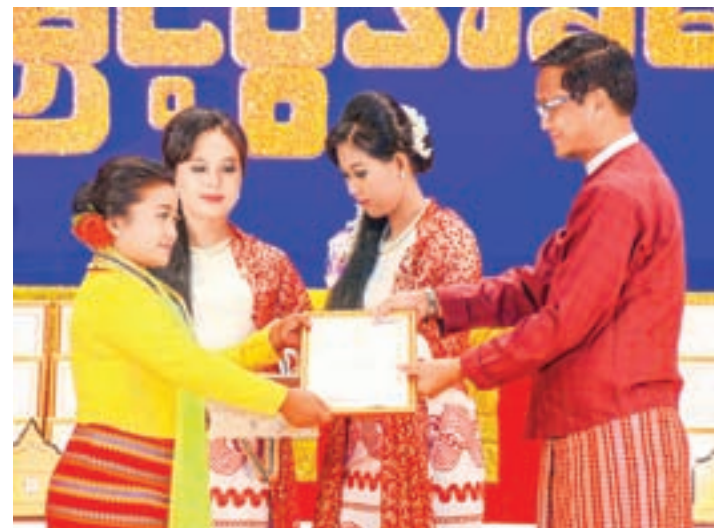
Vice President U Henry Van Thio presents prize to a winner of the 22nd Myanmar Ethnic Traditional Performing Arts Contest.

"These are our national heritages. Youths across the nation are responsible to pass the legacy to their younger generations. A country's future belongs to its honest and ebullient youths," said U Henry Van Thio. Prizes were conferred respectively by U Henry Van Thio, Union Minister Thura U Aung Ko, Union Election Commission chairman U Hla Thein, Lt Gen Kyaw Swe, Union Ministers U Thant Zin Maung, Dr Win Myat Aye and other dignitaries.— MNA