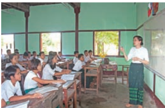
School children listening to the lecture of a teacher at a school in Sittway, Rakhine State.