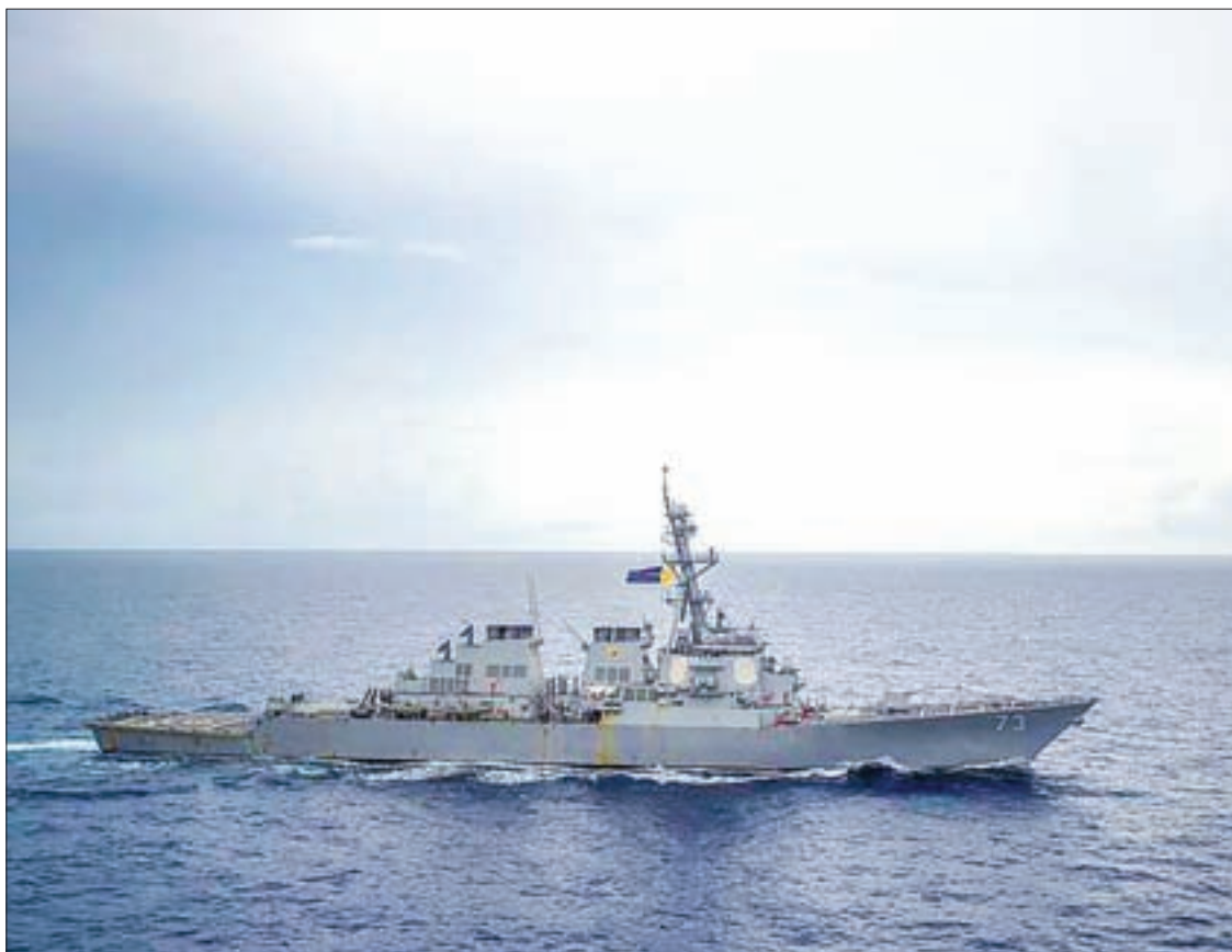
Guided-missile destroyer USS Decatur (DDG 73) operates in the South China Sea as part of the Bonhomme Richard Expeditionary Strike Group (ESG) in the South China Sea on 13 October 2016.