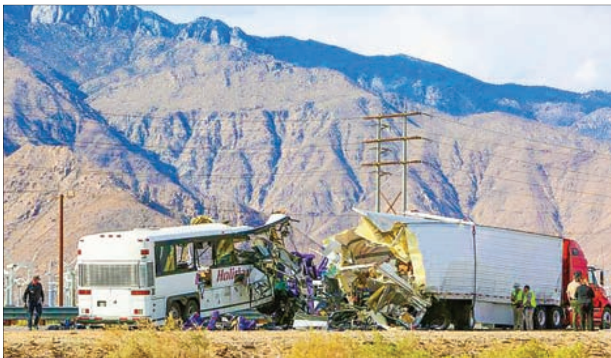
Investigators confer at the scene of a mass casualty bus crash on the westbound Interstate 10 freeway near Palm Springs, California.