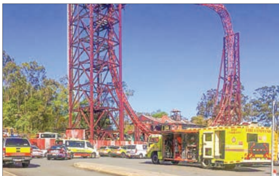
Emergency services vehicles can be seen outside the Dreamworld theme park at Coomera on the Gold Coast, Australia, on 25 October, 2016 after a number of people were reported killed on a ride at Australia's biggest theme park.

Shares in park owner and operator, Ardent Leisure Group, dropped 7 per cent in the final hour of trade after the incident, having spent most of the