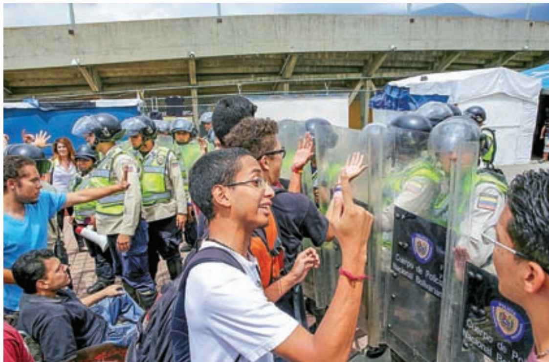
Demonstrators shout slogans in front of riot police during a student rally demanding a referendum to remove Venezuela's President Nicolas Maduro in Caracas, Venezuela on 24 October, 2016.

The opposition was pushing to remove Maduro in a referendum this year as Venezuela undergoes a major economic crisis that has food running short and inflation destroying incomes. But the government nixed the signature drive last week, and a furious