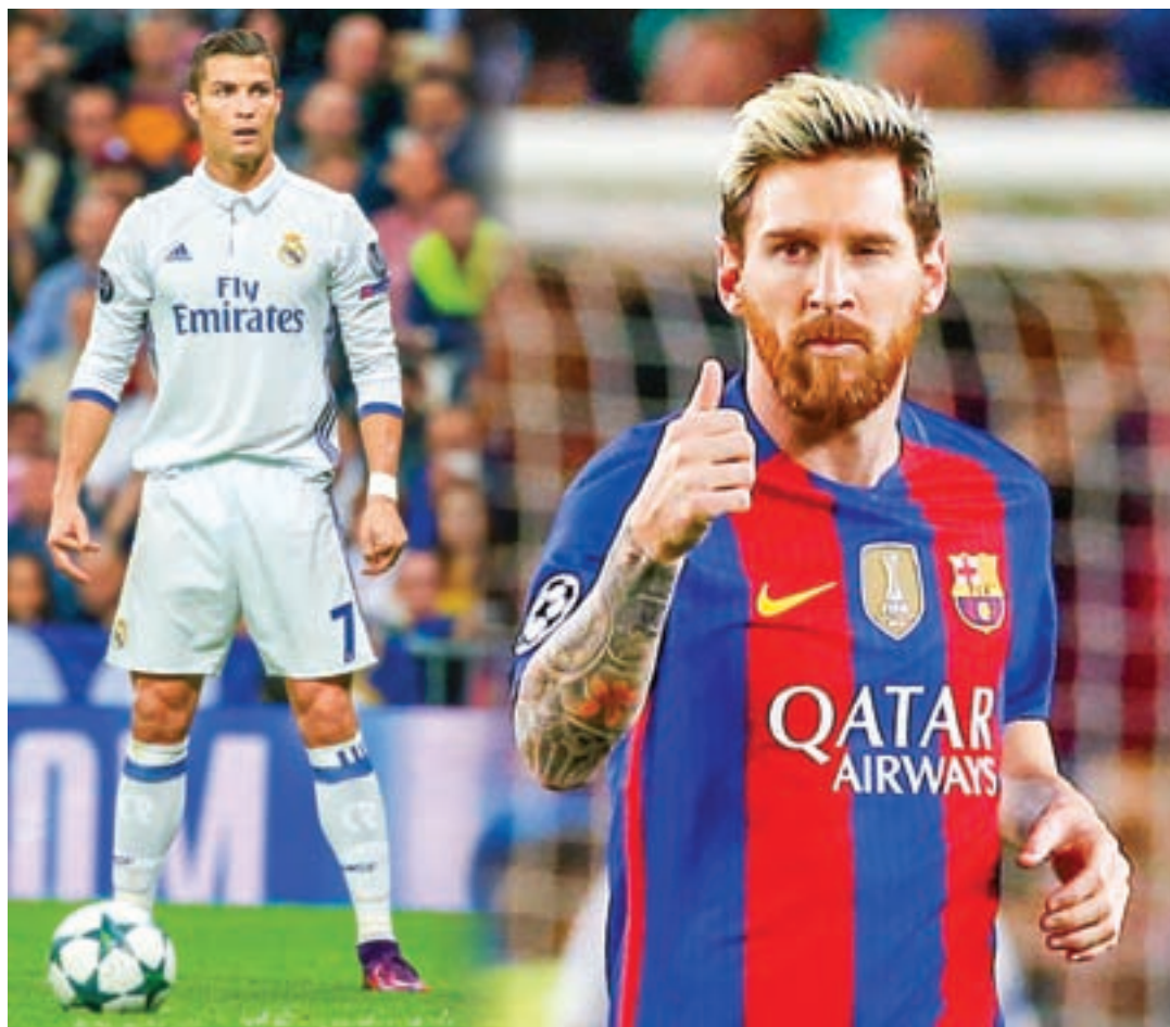
Real Madrid's Cristiano Ronaldo and Barcelona's Lionel Messi.

Dortmund's Gabon striker Pierre-Emerick Aubameyang are the only players on the list who hail from outside Europe or South America.