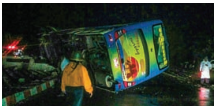
Overturned bus express being seen.

charged under Sections 337/338 of the Penal Code by Paylaypin Police Station.