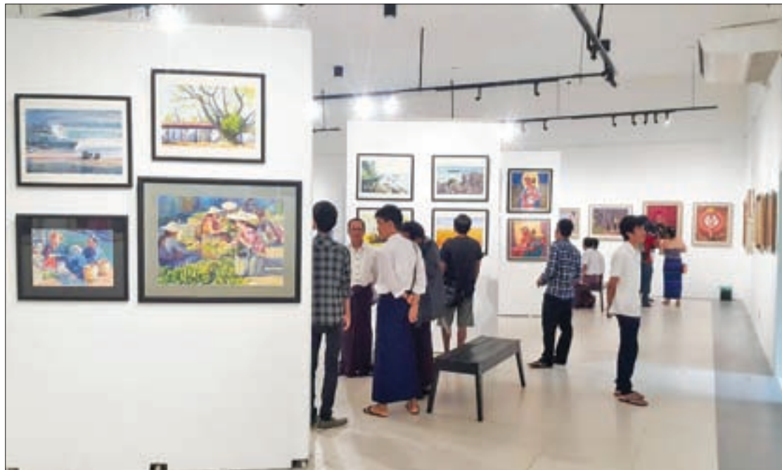
Arts Exhibition by NUCFA teachers in Yangon Public Square.

TEACHERS of the Painting Department of the National University of Culture and Fine Arts (NUCFA) (Yangon) organized an Arts Exhibition titled "Spectrum of the Origin of the River" at the Yangon Gallery in Public Square in Yangon on 22 October.