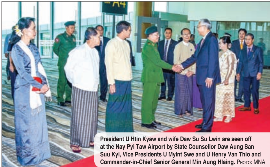
President U Htin Kyaw and wife Daw Su Su Lwin are seen off at the Nay Pyi Taw Airport by State Counsellor Daw Aung San Suu Kyi, Vice Presidents U Myint Swe and U Henry Van Thio and Commander-in-Chief Senior General Min Aung Hlaing.

PRESIDENT U Htin Kyaw and wife Daw Su Su Lwin on Tuesday left Nay Pyi Taw for Hanoi, the capital of Socialist Republic of Viet Nam, to start his state visit to the Southeast Asian country.