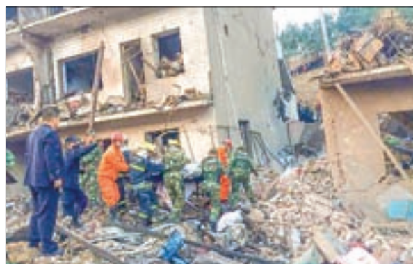
Rescue workers search at site after an explosion hit a town in Fugu county, Shaanxi Province, China, on 24 October, 2016. PHOTO: REUTERS

Pictures carried by state media showed rescuers digging through the rubble of low rise buildings, though searches for the incident on Chinese social media were blocked on Tuesday.—Reuters