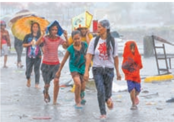
Survivors walk towards the evacuation centre to get relief goods after super Typhoon Haiyan battered Tacloban city, central Philippines on 10 November 2013. disaster may have the unintended effect of separating people not just from their homes but from their neighbours—and both may speed up cognitive decline among vulnerable people.” The study was published online by the US journal Proceedings of the National Academy of Sciences. The Harvard Chan researchers, working with

WASHINGTON — Dementia should be considered a health risk for elderly survivors of natural disasters, a new study led by Harvard University researchers suggested Monday. It found the number of elderly people with symptoms of dementia tripled after the 2011 tsunami in Japan, with those who were uprooted from damaged or destroyed homes and who lost touch with their neighbours at most risk. “In the aftermath of disasters, most people focus on mental health issues like PTSD (post-traumatic stress disorder),” Hiroyuki Hikichi, research fellow at Harvard T.H. Chan School of Public Health and lead author of the study, said in a statement. “But our study suggests that cognitive decline is also an important issue. It appears that relocation to a temporary shelter after a