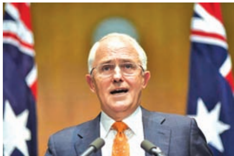
Australian Prime Minister Malcolm Turnbull speaks to the media during a news conference at Parliament House in Canberra, Australia, on 8 May 2016.

SYDNEY — Support for Australian Prime Minister Malcolm Turnbull is at its lowest level since his election last year, according to an opinion poll on Tuesday, fuelling speculation of more political upheaval in a country that has seen four leaders in six years.