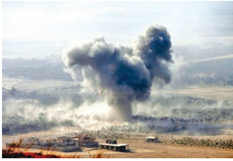
Smoke rises at Islamic State militants' positions in the town of Naweran, near Mosul, Iraq, on 23 October 2016.

Reuters television footage from Nawran, a town near Bashiqa, showed Kurdish fighters using a heavy mortar, a machine gun