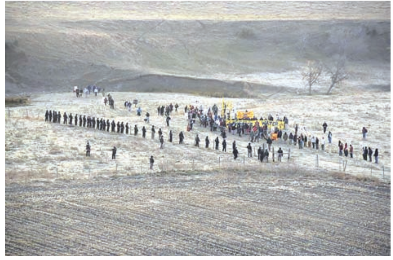
Protesters are confronted by police near a pipeline being built by a group of companies led by Energy Transfer Partners LP at a construction site in North Dakota, on 22 October 2016.

Later, around 300 protesters marched toward pipeline construction equipment and tried to breach a police line keeping them from the equipment, the sheriff's department said.