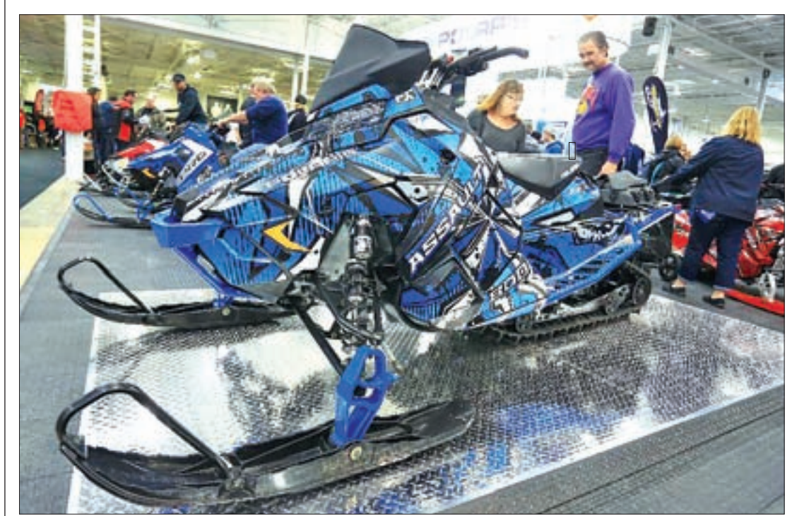
Visitors watch snowmobiles during the 2016 Toronto International Snowmobile, ATV& Powersports Show in Toronto, Canada, on 22 October 2016. As one ofthe largest Snowmobile, ATV & Powersports Shows in the world, this three-day show which kicked off on Friday is expected to drawtens of thousands of recreational powersports enthusiasts.