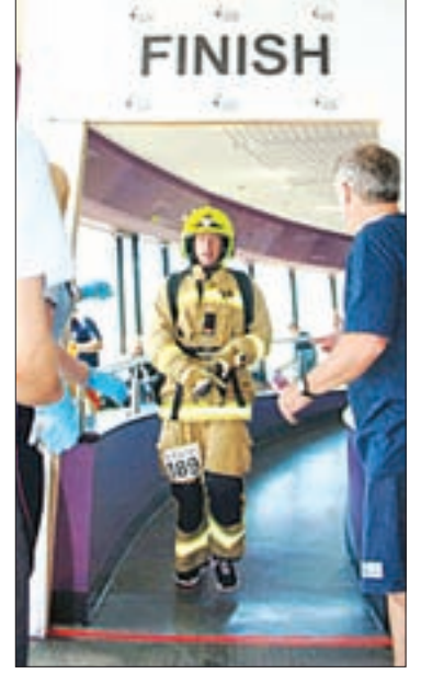
A firefighter crosses the finish line after climbing all 1,504 stairs of the iconic Sydney Tower Eye during an event in Sydney on 23 October 2016. Photo: Kyodo News

Sydney Tower is the city's tallest structure, measuring 309 metres from the bottom to the tip of the spire.—Kyodo News