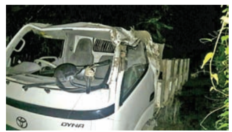
The car is seen after the accident.

A Toyota Dyna truck carrying 13 passengers overturned on the Yangon-Mandalay Expressway on early Sunday morning, killing