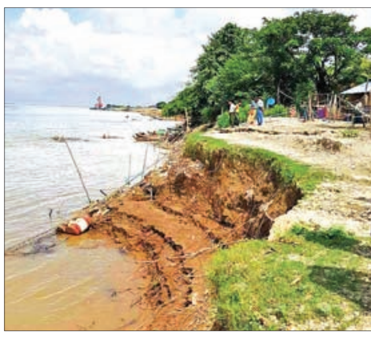
Erosion is seen on the bank of the Ayeyawady River in Ngazun Township.

A portion of the bank 350 feet in length and about 130 feet in breadth at its widest section eroded inwards 5 feet due to changing currents. As a result, houses up to 75 feet away from the collapsed bank will have to