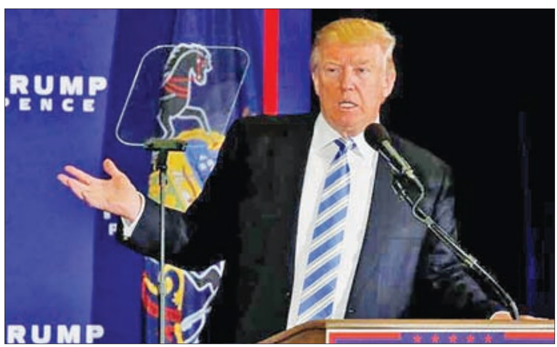
Republican US presidential nominee Donald Trump delivers remarks at a campaign event in Gettysburg, Pennsylvania, US on 22 October 2016.

GETTSYBURG (Pa.) — US Republican presidential candidate Donald Trump promised on Saturday to foil a proposed deal for AT&T to buy Time Warner if he wins the 8 November election, arguing it was an example of a "power structure" rigged against both him and voters.