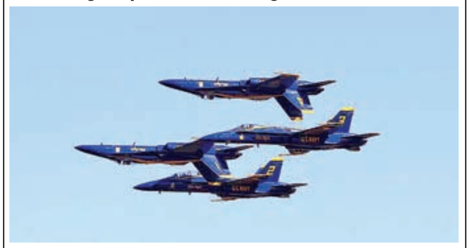
A formation of US Navy Blue Angles performs during the Houston Airshow at Ellington Airport of Houston, the United States, on 22 October 2016.