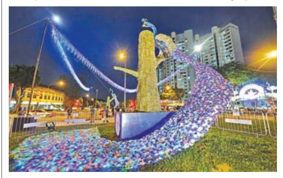
Photo taken on 22 October 2016 shows decorative lights for the upcoming Deepavali Festival, or Festival of Lights, at Serangoon Road in Singapore's Little India.