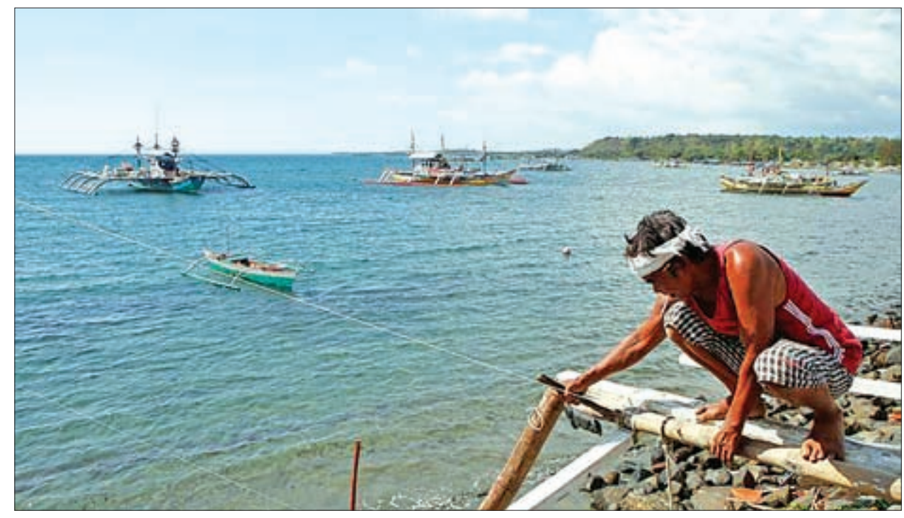
A fisherman repairs his boat overlooking fishing boats that fish in the disputed Scarborough Shoal in the South China Sea, at Masinloc, Zambales, in the Philippines on 22 April 2015.

with ties to the leadership told Reuters last week China would consider giving Philippine fishermen conditional access to disputed waters in the South China Sea after a meeting between the presidents of the two countries.