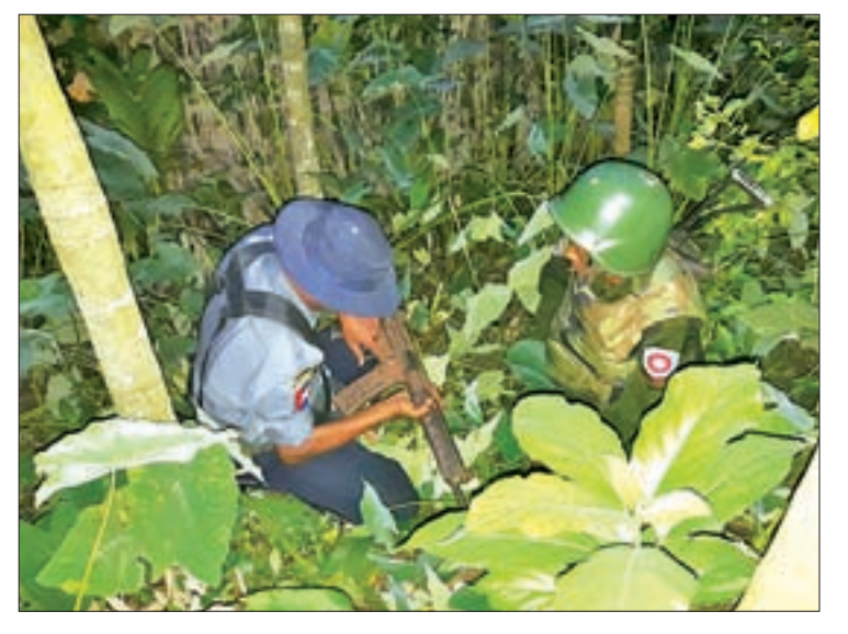
Service personnel check the weapon hidden by violent attackers in Maungtaw Township.

Members of the Tatmadaw and the Border Guard Police are continuing their operations to hunt down the violent attackers who ambushed border police outposts on nine October during which nine policemen were killed.