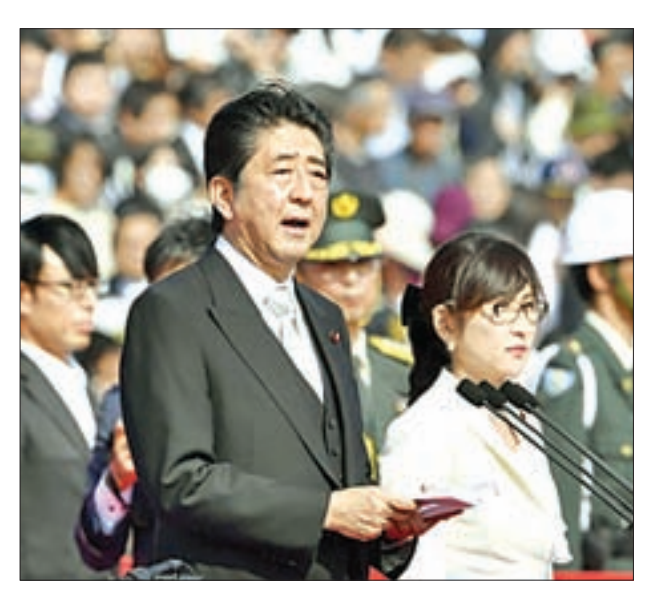
Japanese Prime Minister Shinzo Abe.

TOKYO - Prime Minister Shinzo Abe on Sunday pitched new overseas duties to be given to members of the Self-Defence Forces under his administration's security legislation as he spoke at a troop review at an SDF base in Tokyo.