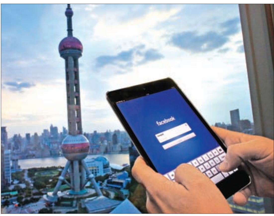
In this photo illustration, a man holds an iPad with a Facebook application in an office building at the Pudong financial district in Shanghai.