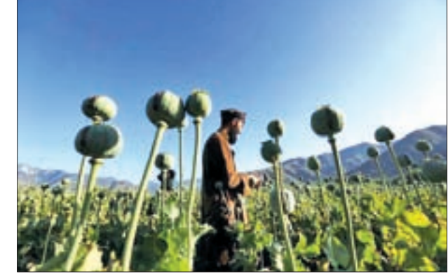
An Afghan man works on a poppy field in Nangarhar province, Afghanistan on 20 April 2016.