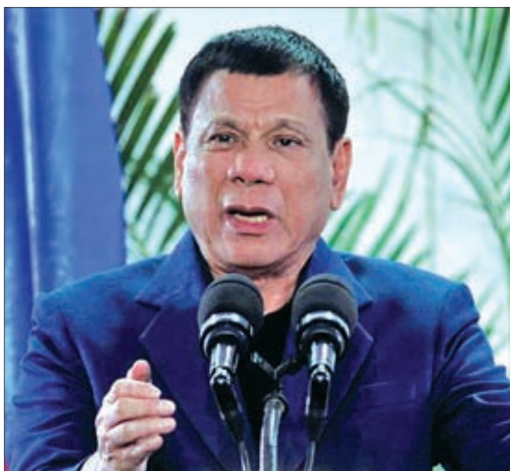
Philippine President Rodrigo Duterte interacts with reporters during a news conference upon his arrival from a four-day state visit in China at the Davao International Airport in Davao city, Philippines on 21 October 2016.

Prior to Duterte taking office in late June, China was a bitter rival of the Philippines, and Ma-