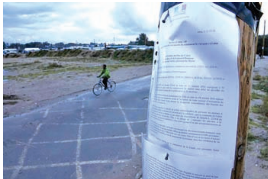
The French prefect document announces the dismantling of the makeshift camp called the 'Jungle', in Calais, France, on 21 October 2016.