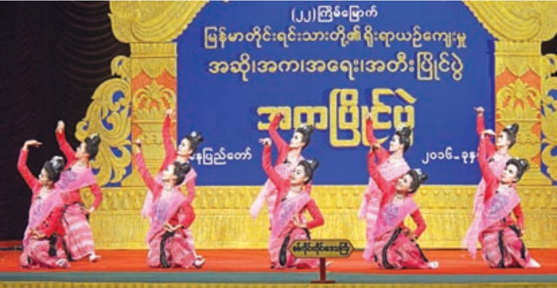
Contestants from Sagaing Region participating in group dancing contest in the 22nd Myanmar Ethnic Traditional Performing Arts Competitions in Nay Pyi Taw on 22nd October, 2016.

WHILE Students from the Department of Zoology of the Maubin University were being trained in the field for conservation on 20 October, they found a young Sarus Crane ( Grus antigone ) tied with a rope acting on a tip-off by a local villager. The trainees rescued the young Sarus Crane at the site.— Naing Lin (WCS)