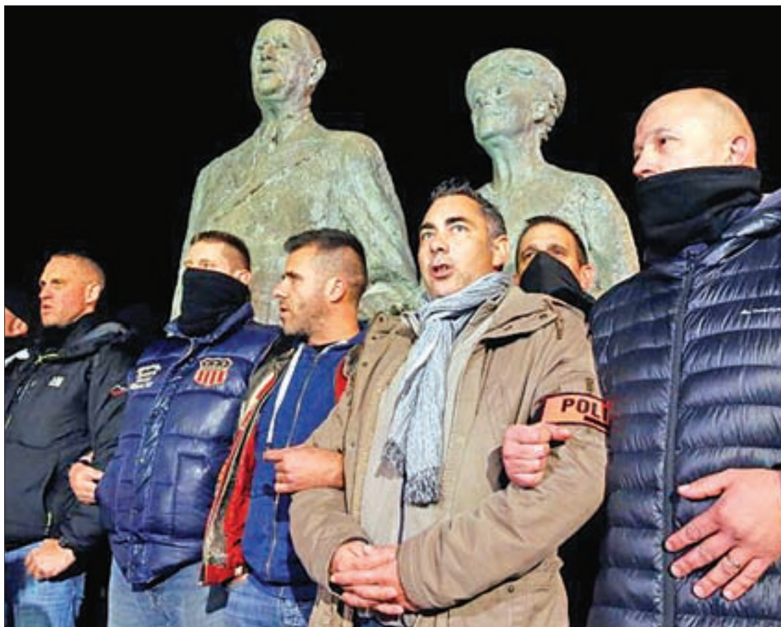
French plainclothes policemen gather singing the French national anthem in front of the statue of Charles de Gaulle and his wife, during an unauthorised protest against anti-police violence in Calais, France, late on 21 October 2016.