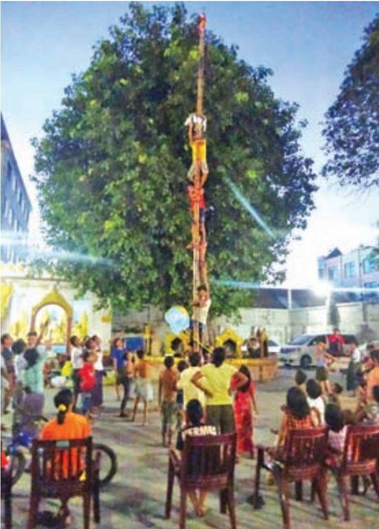
The greased bamboo pole being climbed by a team.

pery pole competition. There was also a greased bamboo pole climbing competition. The Mandalay Myoma Musical band performed at the event.