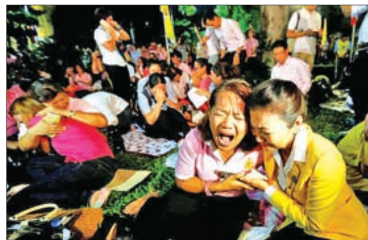
People weep after an announcement that Thailand’s King Bhumibol Adulyadej has died, at the Siriraj hospital in Bangkok, Thailand, on 13 October 2016.

Since the king died, people from across Thailand have flocked to the gilded Grand Palace to pay homage to the only king most of them have ever known, who is lying in state there.—Reuters