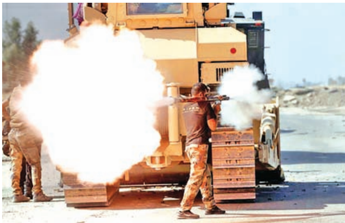
An Iraqi special forces soldier fires an RPG during clashes with Islamic States fighters in Bartella, east of Mosul, Iraq, on 20 October 2016.

Carter signaled during a visit to Ankara on Friday his support for a possible Turkish role in the campaign and said there was an agreement in principle between Baghdad and Ankara — potentially ending a source of tension.—Reuters