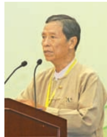
U Kyaw Win.

According to the Union Minister, there is still a lot to do to provide healthcare services for the entire 52 million people