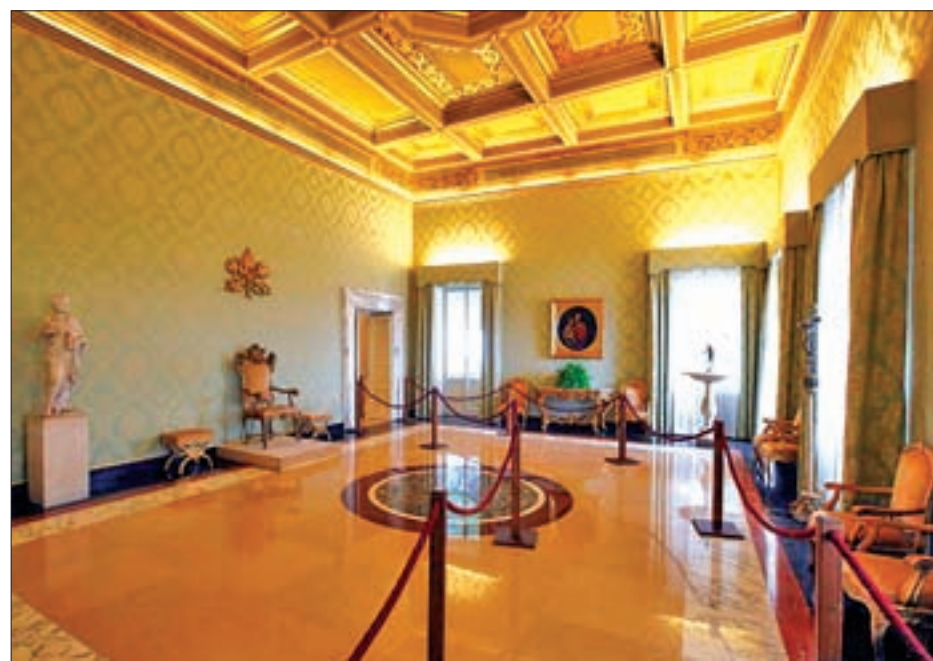
A view of Pope's apartment in Castel Gandolfo, near Rome, Italy, on 21 October 2016.

At 55 hectares, the residence, which includes several buildings, elaborate Renaissance-style gardens, a forest and a working dairy farm, is larger than Vatican City.—Reuters