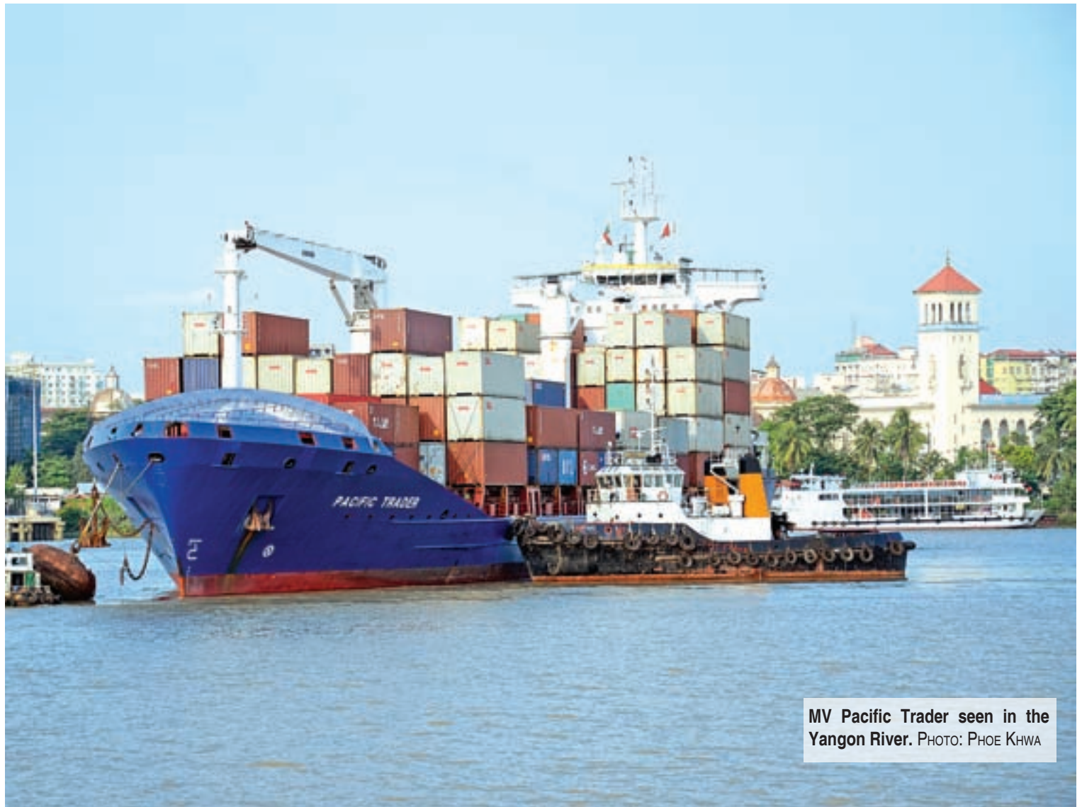
MV Pacific Trader seen in the Yangon River.

The values of exports as of 14 October this fiscal year is US$3,752.392 million via normal trade and US$2,322.776 million via border trade while import values during that similar period are US$6,502.904 million through sea trade and US$1,467.524million through border trade.— Mon Mon