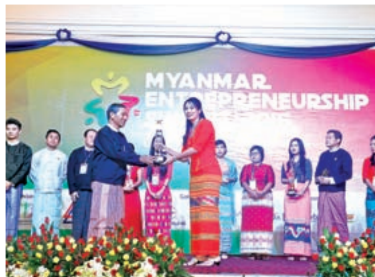
Union Minister for Planning and Finance U Kyaw Win presents award to a winner 1st Myanmar Entrepreneurship Summit 2016.

A total for categories of prizes were awarded to youths at the summit, it was learnt.—Thant Zin Win