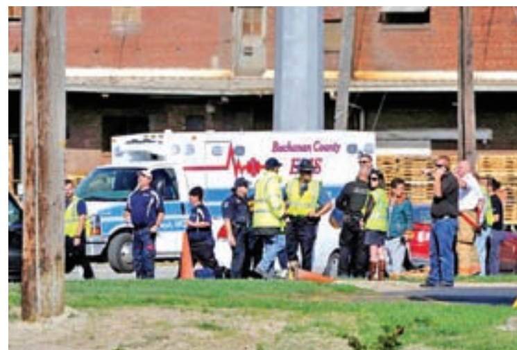
Firefighters and other officials congregate in an evacuated area where a chemical spill near a MGP Ingredients plant caused a toxic cloud that injured dozens of people and forced an evacuation in downtown Atchison, Kansas, US, on 21 October 2016.

"MGP Ingredients has reported the event to the EPA and