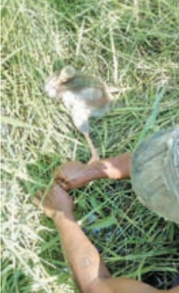
The Sarus Crane. Photo: Naing Lin (WCS)

WHILE Students from the Department of Zoology of the Maubin University were being trained in the field for conservation on 20 October, they found a young Sarus Crane ( Grus antigone ) tied with a rope acting on a tip-off by a local villager. The trainees rescued the young Sarus Crane at the site.— Naing Lin (WCS)