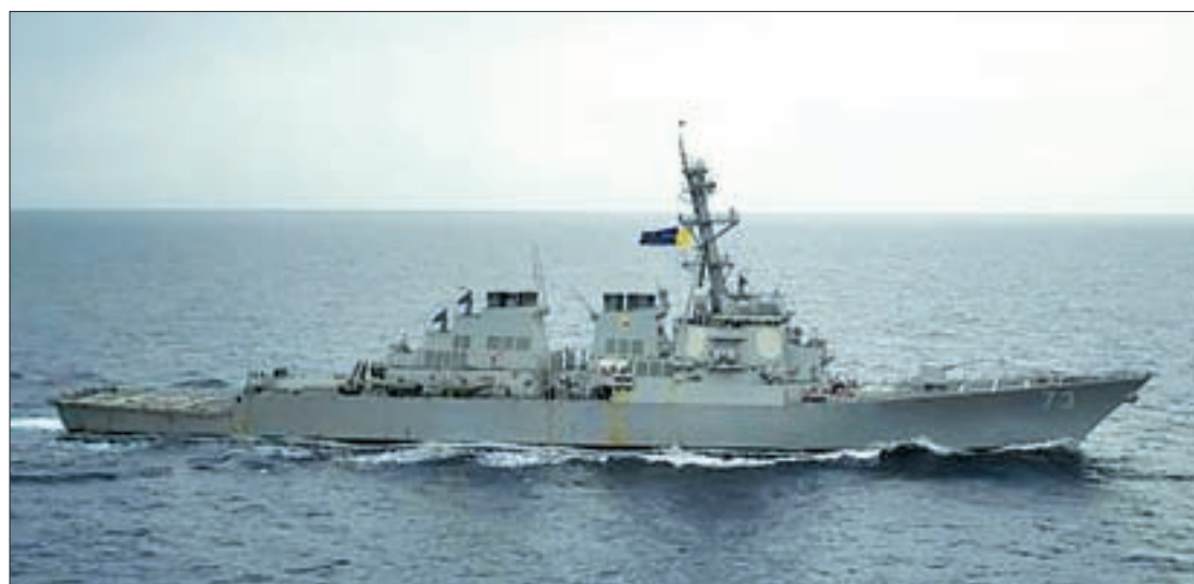
Guided-missile destroyer USS Decatur (DDG 73) operates in the South China Sea as part of the Bonhomme Richard Expeditionary Strike Group (ESG) in the South China Sea.

WASHINGTON — A US navy destroyer sailed near islands claimed by China in the South China Sea on Friday, drawing a warning from Chinese warships to leave the area.