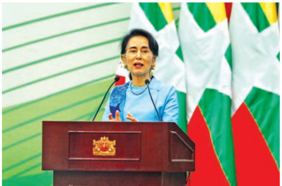
State Counsellor Daw Aung San Suu Kyi speaking at the meeting.

Regarding economic policy, the government have already laid down 12-point policy since July. Since then, the new government