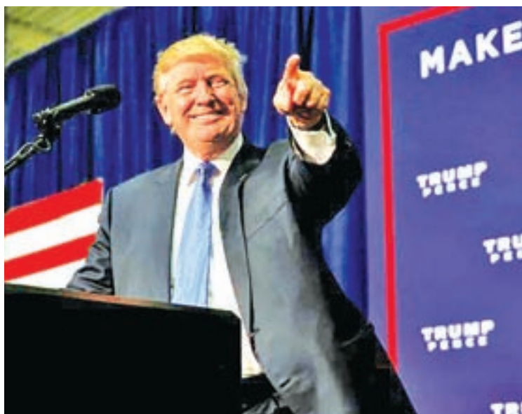
Republican US presidential nominee Donald Trump holds a campaign rally in Fletcher, North Carolina, US, on 21 October 2016.

"I think this site is fitting in terms of understanding a positive vision for the Republican party," an aide said.