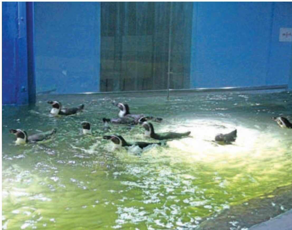
Humboldt Penguins seen swimming.

9 HUMBOLDT Penguins [Spheniscus Humboldti] (4 males and 5 females) to be shown to the public in Nay Pyi Taw Zoological Garden arrived at the Yangon International Airport on Thursday via Narita Airport, Japan.