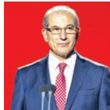
Organisation for the Prohibition of Chemical Weapons’ (OPCW) Director General Ahmet Uzumcu.

Syria agreed to destroy its chemical weapons in 2013 under a deal brokered by Moscow and Washington. The Security Council backed that deal with a resolution that said in the event of non-compliance, “including unauthorized