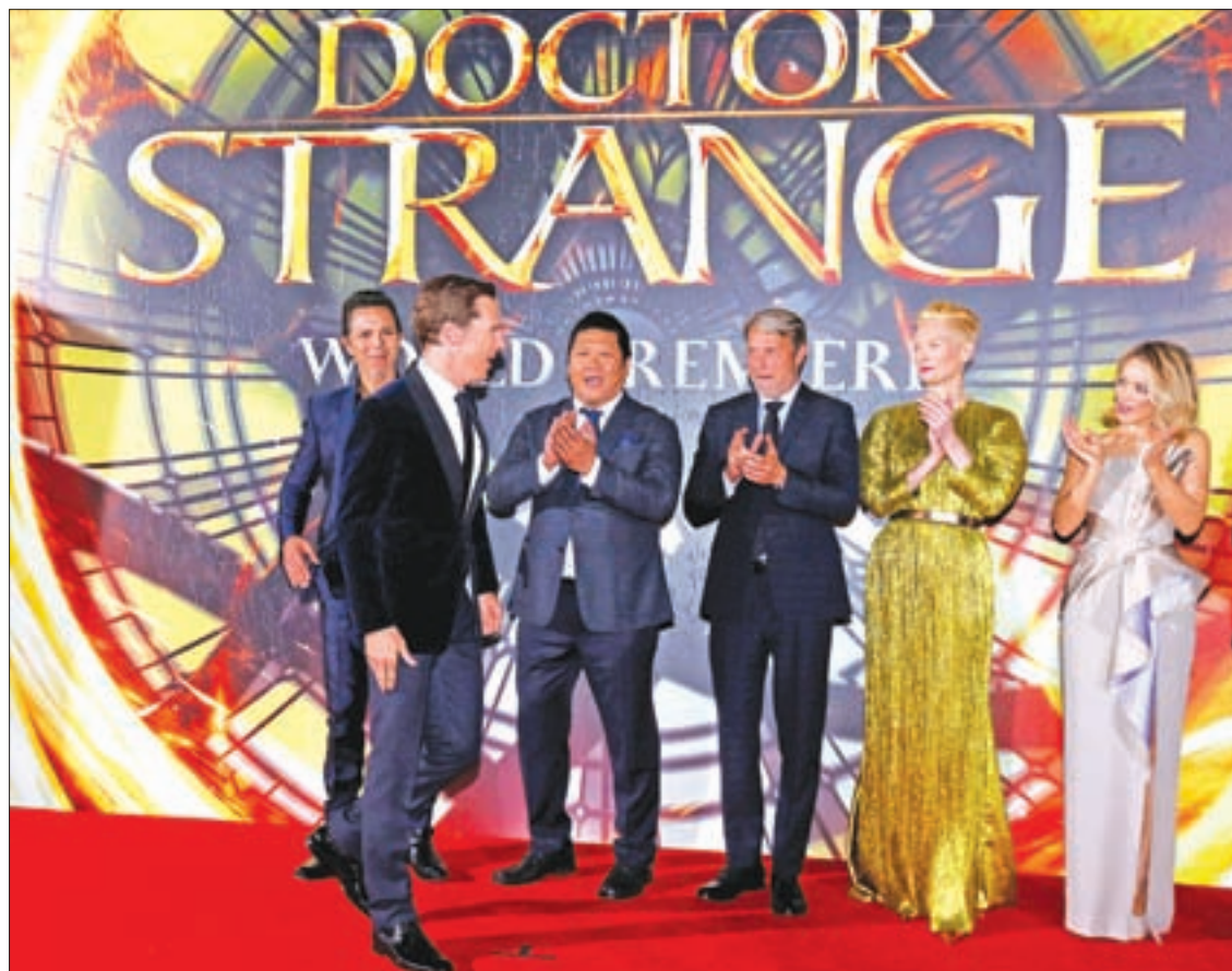
Cast member Benedict Cumberbatch (2nd L) walks by co-stars (L-R) Benjamin Bratt, Benedict Wong, Mads Mikkelsen, Tilda Swinton and Rachel McAdams at the premiere of "Doctor Strange" in Hollywood, California US, on 20 October 2016.

LOS ANGELES — British heart-throb Benedict Cumberbatch loved his close encounter with special effects when he swapped his Sherlock Holmes deerstalker for a superhero cape in his latest movie outing, "Doctor Strange".