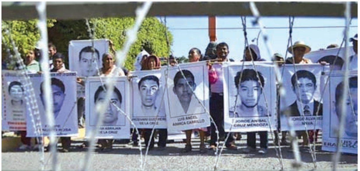
Relatives hold up pictures of some of the 43 missing students of Ayotzinapa College Raul Isidro Burgos during a protest outside at the 27 th Infantry Battalion, in Iguala, southern Mexican state of Guerrero, on 18 December 2014.

news conference. According to the government's initial findings, the 43 were abducted by corrupt police in Iguala and handed over to a drug cartel, which mistook them for members of a rival gang. Then, the government said, they were murdered, incinerated and ground up, and their remains dumped in a nearby river. So far, the remains of only one of the 43 students have been definitively identified. The parents of the missing are still pressuring the government hard for answers. A group of international experts who reviewed the evidence sharply criticized the government's version of events, helping to dent the credibility of President Enrique Peña Nieto.—Reuters