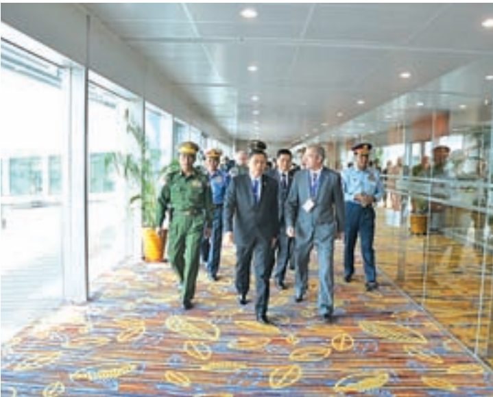
Military delegation being seen upon arrival back from Russia.

A Myanmar delegation led by Deputy Commander-in-Chief of Defence Services Commander-in-Chief (Army) Vice Senior General Soe Win arrived back after paying a visit to Russia. The delegation visited the Scientific Production Cooperation (REKOD) in Moscow, Russia, Friday. The delegation also visited the Myanmar Monastery in Moscow and presented of-