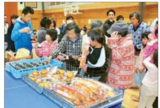
People sheltering in a gymnasium receive food for breakfast in Kurayoshi in the western Japan prefecture of Tottori on 22 October 2016, a day after a strong earthquake with a magnitude of 6.6 hit the area.

Of the houses damaged in Tottori, three were destroyed in the town of