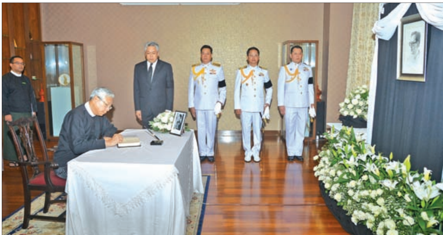
President U Htin Kyaw signing the book of condolence for Thai King Bhumibol Adulyadej at the Embassy of Thailand in Yangon.

After signing the condolence book, President U Htin Kyaw cordially greeted the Thai ambassador and wife and officials.—GNLM