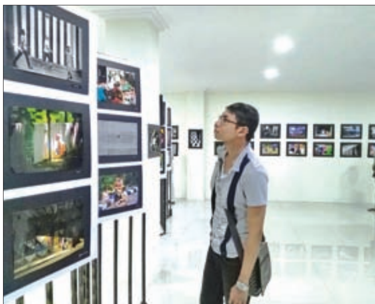
The photo exhibition called “Street Photography”.

The event lasts for three days, from 16 to 18 October.— Maung Pyi Thu (Mandalay)