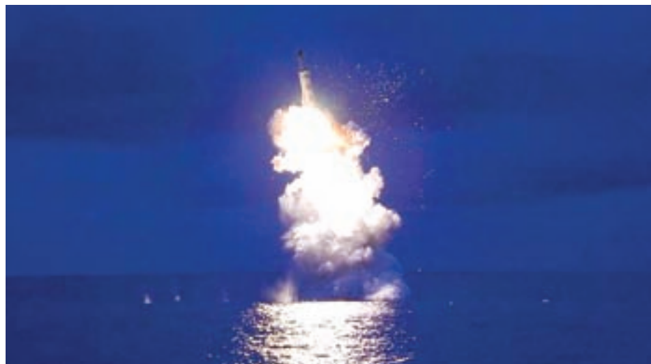
A test-fire of strategic submarine-launched ballistic missile is seen in this undated photo released by North Korea's Korean Central News Agency (KCNA) in Pyongyang, on 25 August, 2016.

"They are continuing with an aggressive test schedule that involves, at least this time, demonstrating new operational capabilities. That increases the probability of individual tests failing, but it means they will learn more with each test," he wrote.—Reuters