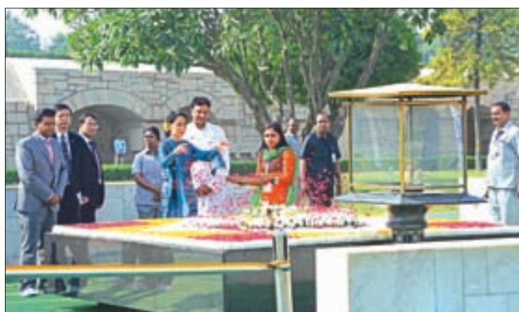
Daw Aung San Suu Kyi paying tribute to Mahatma Gandhi at Raj Ghat in New Delhi.