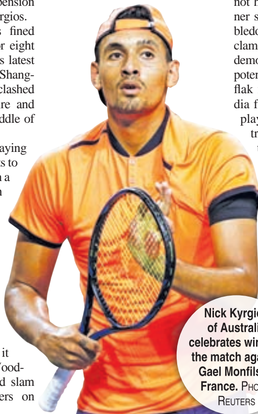
Nick Kyrgios of Australia celebrates winning the match against Gael Monfils of France.

Kyrgios promptly withdrew himself from consideration for Rio, leaving Australia without their top medal hope in the tournament.—Reuters