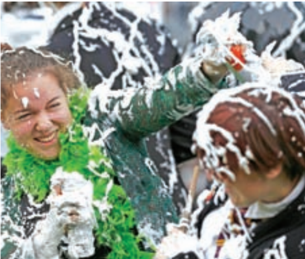
Students from St Andrews University are covered in foam as they take part in the traditional ‘Raisin Weekend’ in the Lower College Lawn, at St Andrews in Scotland, Britain on 17 October, 2016. The weekend, which begins on Sunday, involves rituals for new students, culminating in a foam fight on Monday morning.

they are adopted by older students for mentoring. Several weeks into the first term, the university holds its annual “Raisin Weekend”, during which the academic parents hold parties for the new students. The weekend culminates in “Raisin Monday”, when they dress the new students in costumes and send them into the university main’s lawn for a shaving foam fight.—Reuters