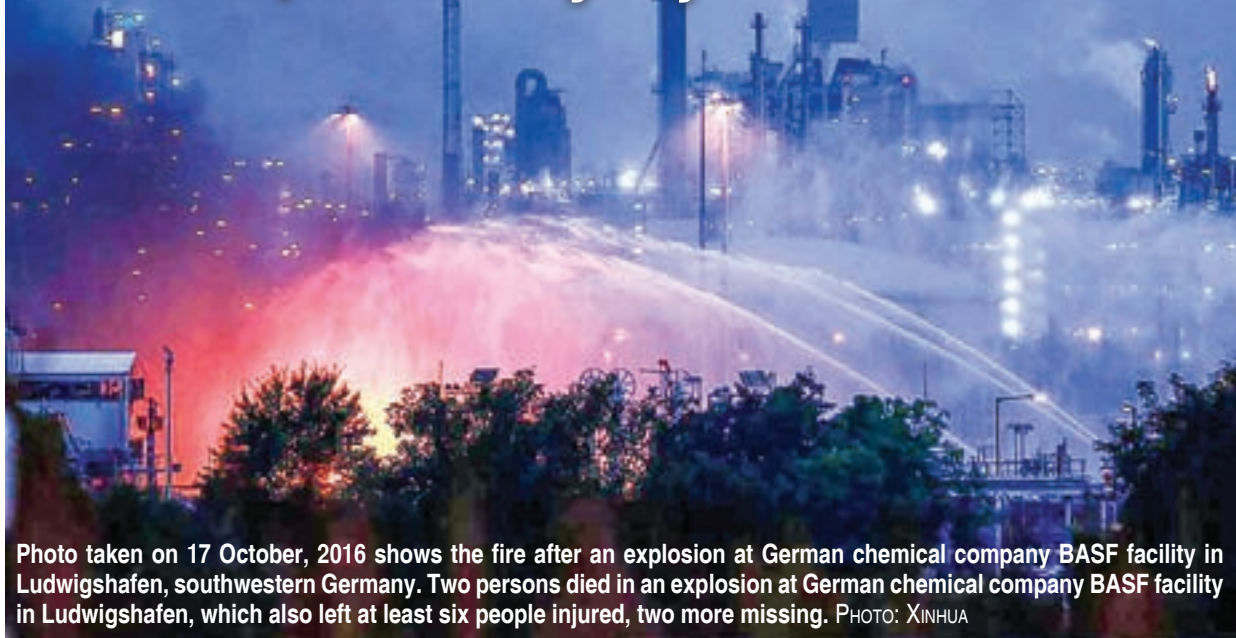
Photo taken on 17 October, 2016 shows the fire after an explosion at German chemical company BASF facility in Ludwigshafen, southwestern Germany. Two persons died in an explosion at German chemical company BASF facility in Ludwigshafen, which also left at least six people injured, two more missing.

LUDWIGSHAFEN, (Germany) — An explosion at a facility of German chemical company BASF in Ludwigshafen, Germany on Monday killed two people, seriously injured six others and left two more missing, the company said.