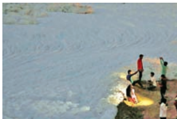
People get their picture taken in front of the foam covering the polluted Yamuna river in New Delhi, India, on 11 October 2016.

The rising public sector finance could help mobilise $33 billion in private sector finance by 2020 to reach the $100 billion goal, it said.—Reuters