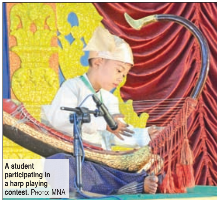
A student participating in a harp playing contest.

The competitions include contests of song, dance, composition, music and play at different stages such as professional, amateur, higher education and basic education levels. —Myanmar News Agency