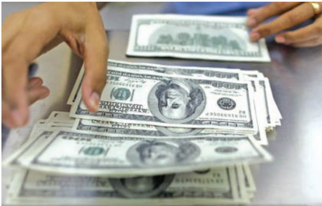
US dollars being counted at a money changer in Yangon.

The government gave a green light to car importers in October, 2011. Five stages have to be passed to allow the cars to be claimed and unloaded at the ports.—200