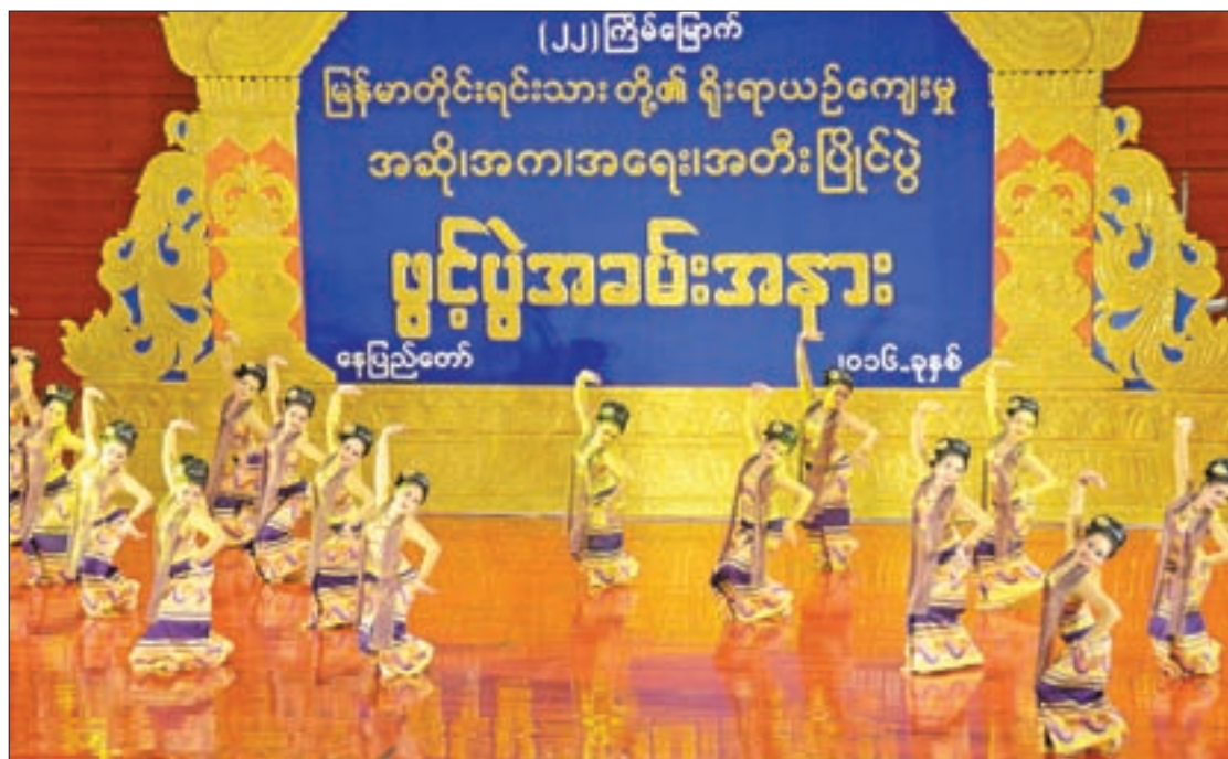
Artistes performing at the Myanmar Ethnic Traditional Performing Arts Competition.

Speaking on the occasion in his capacity as the Chairman of the leading committee for hold-