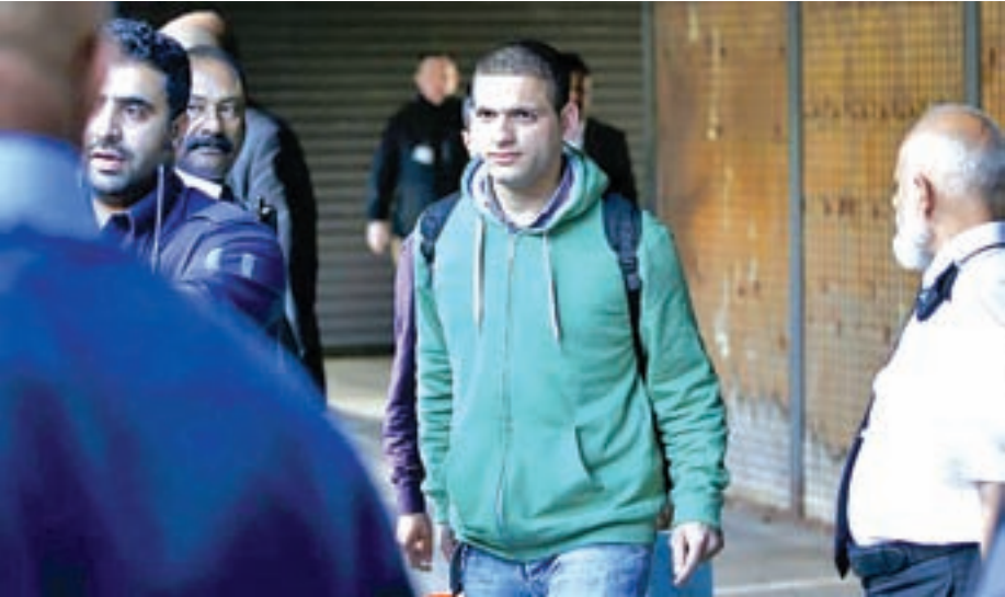
UK Border Force staff escorts some of the the first group of unaccompanied minors from the Jungle migrant camp in Calais to be brought to Britain after they were processed at an immigration centre in Croydon, south London, on 17 October 2016.

LONDON — A first busload of children arrived in Britain on Monday from the “Jungle” camp near the French port of Calais as the British government started to act on its commitment to take in unaccompanied migrant children before the camp is destroyed. The fate of children staying in the Jungle, a squalid camp where up to 10,000 people fleeing war or poverty in the Middle East and Africa have converged seeking ways to cross to Britain, has been a political problem for the British government. Religious leaders, refugee rights campaign groups and opposition parties have accused the government of dragging its heels on helping to move unaccompanied children out of the camp, which France has said it will soon demolish. The French and British interior ministers, Bernard Cazeneuve and Amber Rudd, agreed in talks on 10 October to speed up the process of moving children eligible to go to Britain out of the Jungle. Fourteen children, the first whose cases have been processed, arrived by bus in Croydon, south London, to be reunited with relatives already living in Britain. Faith leaders and aid workers were on hand to welcome and assist them. —Reuters