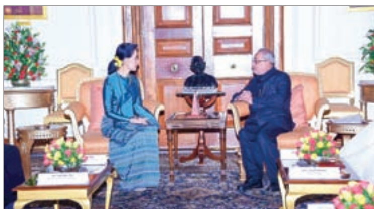
Daw Aung San Suu Kyi calls on Indian President Pranab Mukherjee.

She called on Indian President Pranab Mukherjee at noon yesterday at the Rashtrapati Bhavan and exchanged views on the democratic transition in Myanmar and experiences of India after gaining independence. Following the meeting, the President of India hosted a luncheon in honour of the State Counsellor. Before the call on the Indian President, the State Counsellor met with Minister of External Affairs Sushma Swaraj and discussed subjects to be talked about during her visit.—GNLM