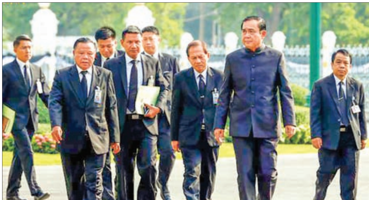
Thailand's Prime Minister Prayuth Chan-ocha is dressed in black as he arrives at a weekly cabinet meeting at Government House in Bangkok, Thailand, on 18 October, 2016.

BANGKOK — Thailand must observe at least 15 days of mourning for King Bhumibol Adulyadej before his successor can ascend the throne, Prime Minister Prayuth Chan-ocha said on Tuesday.