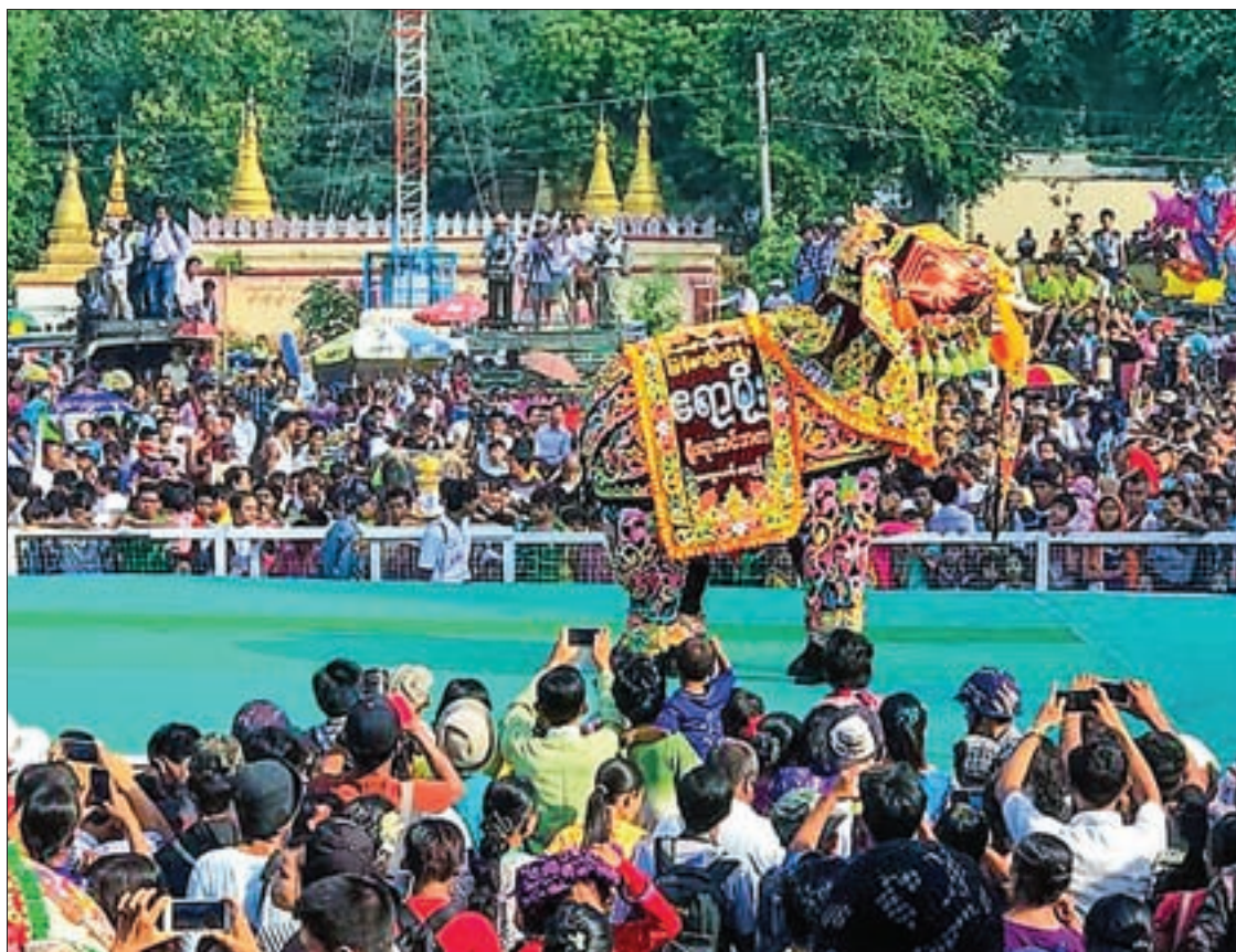
A dummy elephant seen dancing in the presence of spectators.

Anawrahta obtained several Buddhist relics on a trip to China. Upon his return to Myanmar (Burma), he decided to build