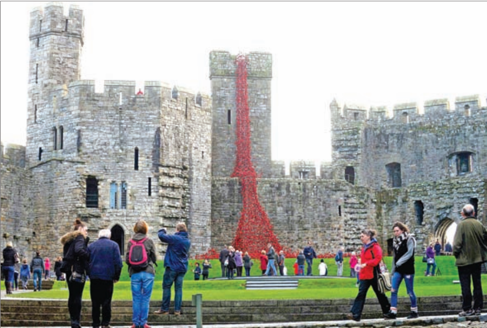
The poppy sculpture ‘Weeping Window’, a cascade of thousands of handmade ceramic poppies by artist Paul Cummins and designer Tom Piper on display at Caernarfon Castle, Wales, on 17 October 2016.