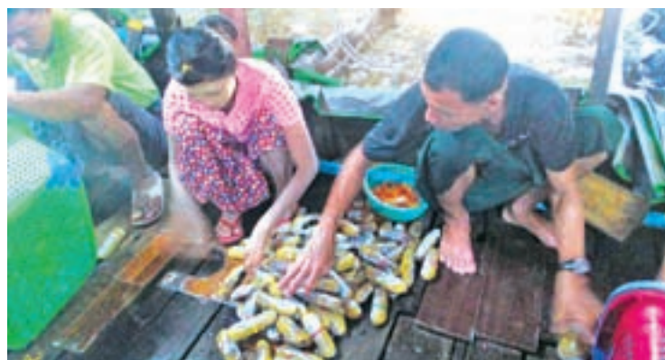
Workers sort mussels in Kyaukphyu, Rakhine.

The export price of mussels at Yangon market is Ks5,000 per kilo for the small mussels and Ks8,000 per kilo for the large mussels. The mussels are exported to China through the Yangon market or directly from Kyaukphyu market, it is learnt.— Myitmakha News Agency