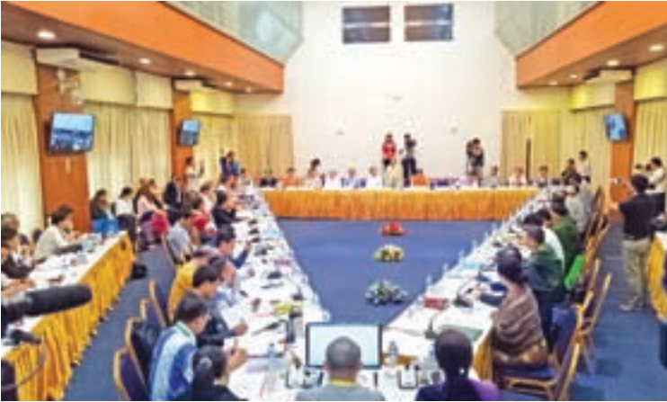
DPN participating in Framework Review for Political Dialogues.