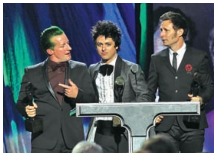
Members of the band Green Day react as they are inducted during the 2015 Rock and Roll Hall of Fame Induction Ceremony in Cleveland, Ohio on 18 April 2015.

Last week's chart-topper, Knowles' "A Seat at the Table,"