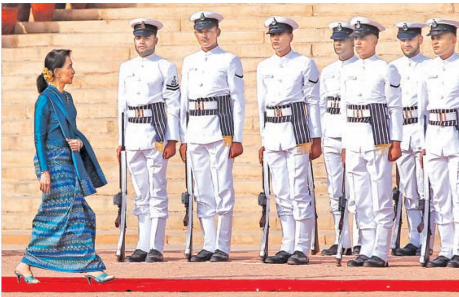
State Counsellor Daw Aung San Suu Kyi inspecting the guard of honour during her ceremonial reception at the forecourt of India's Rashtrapati Bhavan presidential palace in New Delhi, India, on 18 October 2016.

State Counsellor receives ceremonial welcome in New Delhi