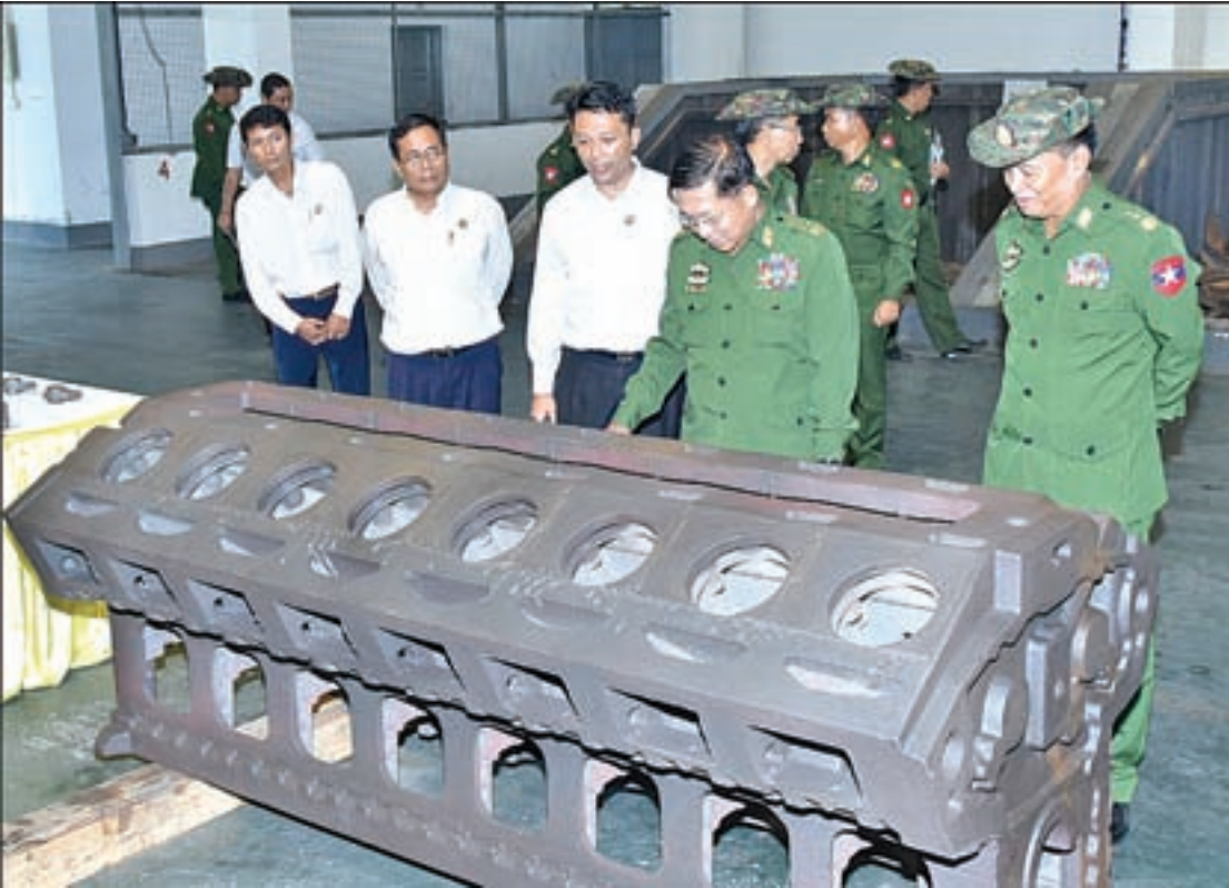
Senior General Min Aung Hlaing inspecting a heavy industrial factory in Thagaya Industrial Zone in Yedashe Township.

COMMANDER-IN-CHIEF of Defence Services Senior General Min Aung Hlaing inspected heavy industrial factories in Thagaya Industrial Zone in Yedashe Township yesterday. On his inspection tour, the Senior General acknowledged the better quality of the products produced by the factories in the zone, calling for a step-by-step process—small scale, medium scale and large scale -- to eventually bring factories into full operation. During the tour, the Senior General visited No 14 Heavy Industry, which produces diesel engines, No 15 Heavy Industry, which produces machinery including bulldozers and No 26 Heavy Industry, which produces hydro turbines, generators and boilers. Factories in Thagaya Industrial Zone are currently operating with foreign technology after signing agreements with various foreign companies.— Myawady