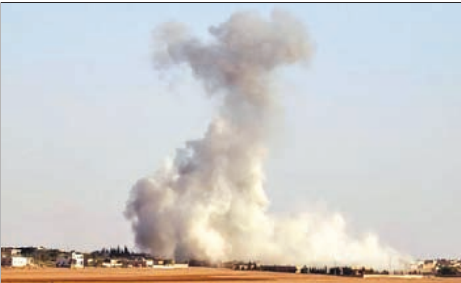
Smoke rises from airstrikes on Guzhe village, northern Aleppo countryside, Syria on 17 October 2016.

ANKARA — United States-led coalition warplanes killed 20 Islamic State militants in Syria over the last 24 hours, the Turkish military said on Tuesday, nearly two months into a Turkey-backed rebel operation to drive the jihadists away from the border. Turkey pushed on with the Syrian operation as Iraqi forces launched a US-backed offensive to expel Islamic State (IS) from the northern Iraqi city of Mosul. The 11 coalition air strikes in Syria targeted the areas of Kar Kalbayn, Ghuz, Hassajik and Tiltanah and destroyed two IS defensive positions and three vehicles, the army statement. Separately, Turkish warplanes also carried out air strikes and destroyed several IS targets, it said. Since the Turkey-backed operation, dubbed ‘Euphrates Shield’, was launched on 24 August, the rebel forces have seized control of some 1,240 square kilometres (479 square miles) territory from the jihadists, according to the statement. Ankara says thousands of Turkey-trained forces are also participating in the assault to push IS out of Mosul, despite a row with Baghdad over the presence of Turkish forces in Iraq. —Reuters