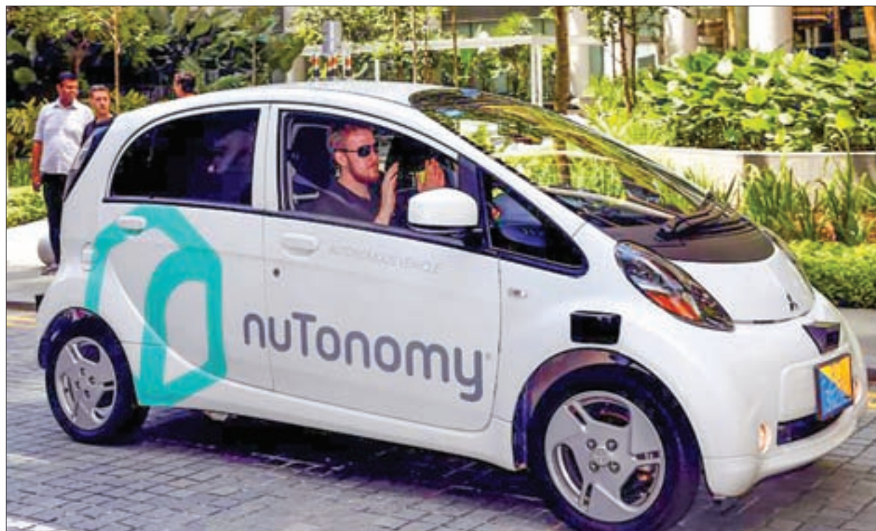
A safety driver puts up his hands as his driverless car navigates a road in Singapore, on 23 September 2016.

SINGAPORE — A self-driving car being tested on Singapore public roads collided with a lorry on Tuesday, the city-state's transport regulator said, adding that no one was hurt.