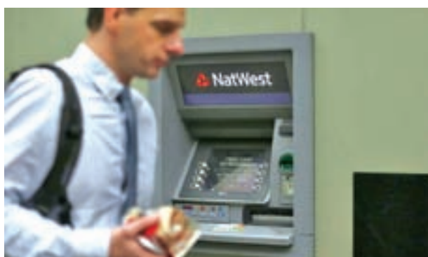
A man walks past a cash machine outside a NatWest bank in London in 2013.

Western critics dismiss RT, whose British