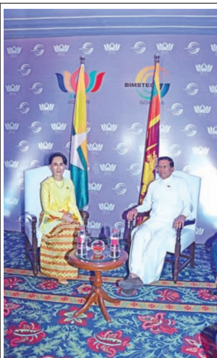
State Counsellor Daw Aung San Suu Kyi holding talks with Sri Lankan President Mr Maithritala Sirisena in Goa, India, on 16th October, 2016.