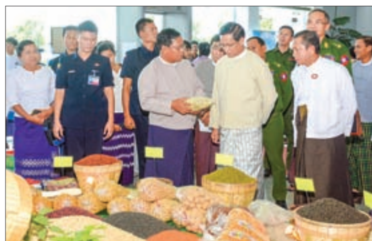
Vice President U Henry Van Thio visiting the booth displaying food at the ceremony to mark the World Food Day 2016.

U Henry Van Thio also pledged to work for harmonious