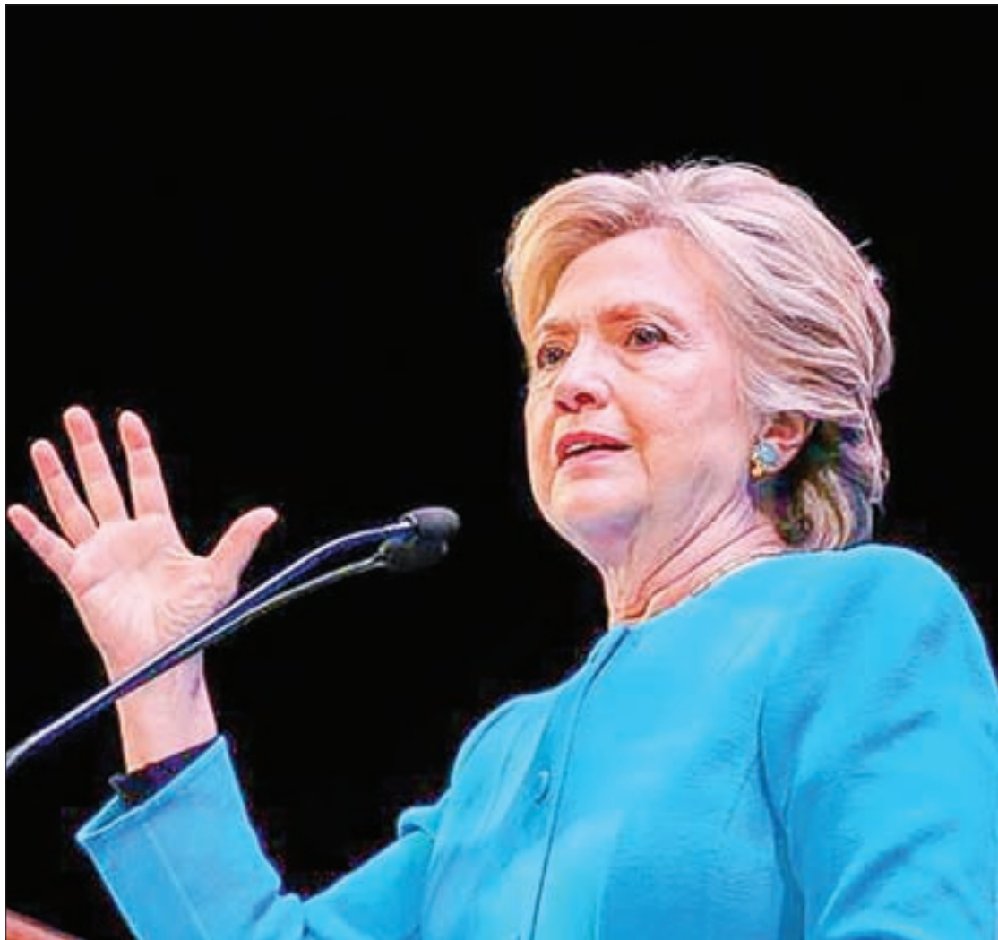
US Democratic presidential nominee Hillary Clinton speaks at a fundraiser in Seattle, Washington, US, on 14 October 2016.