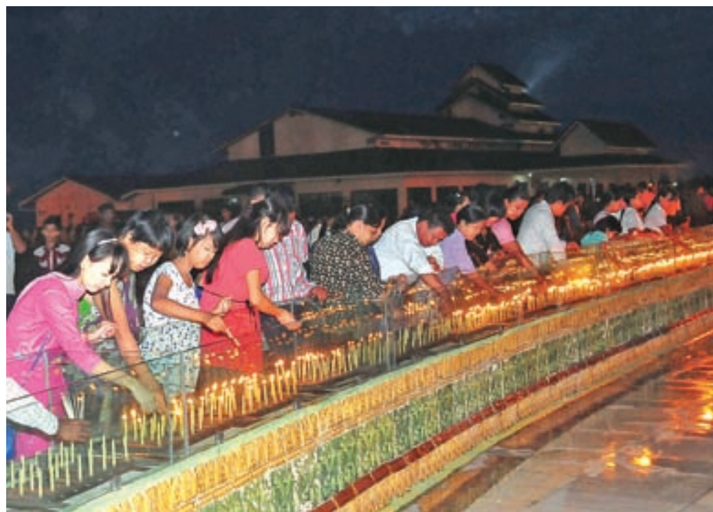
Buddhist devotees light candles at the Shwedagon Pagoda marking the Thadingyut Festival. The Shwedagon Pagoda is crowded with pilgrims on the Full Moon Day of Thadingyut.