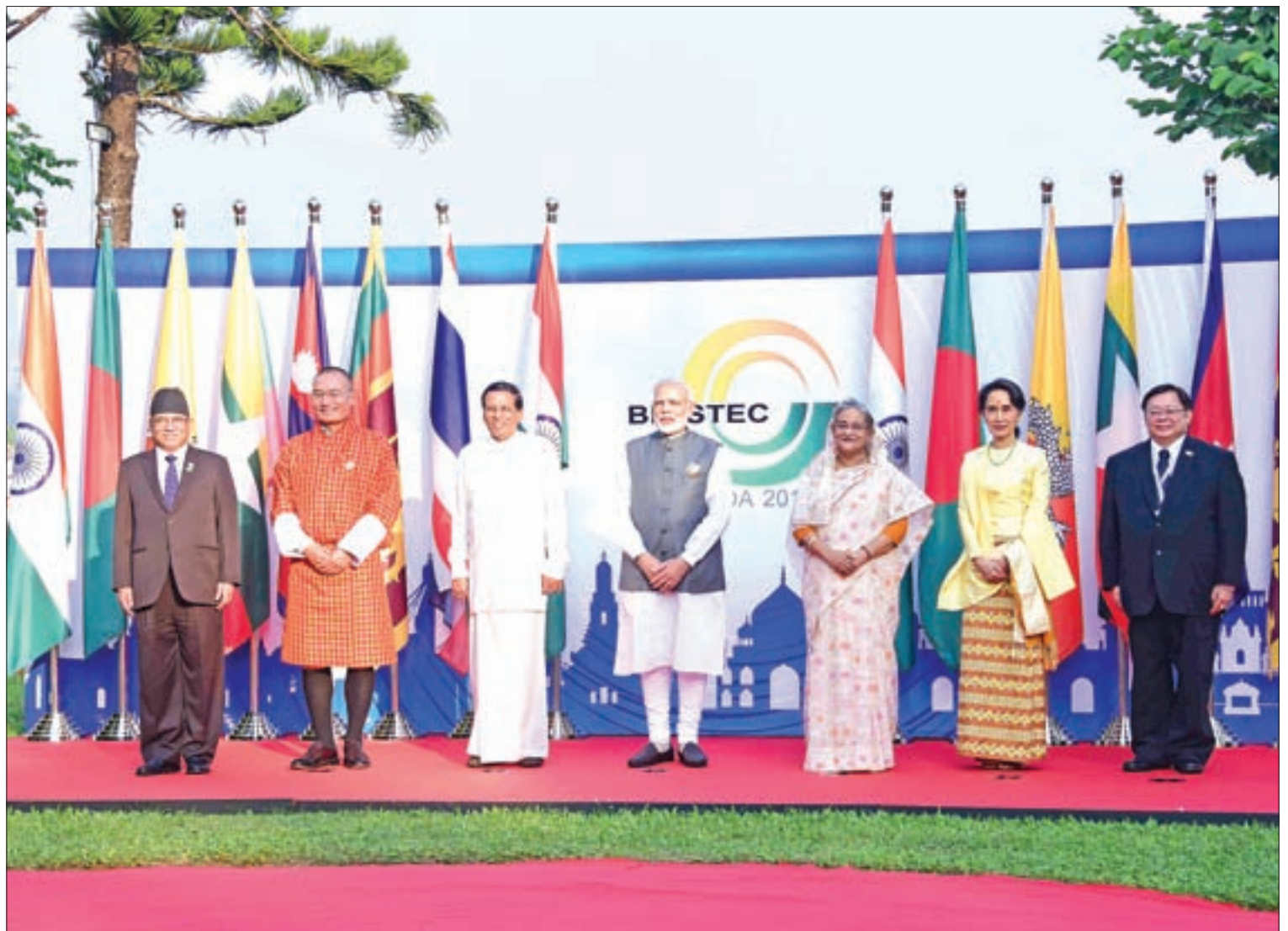
See page 3 >> State Counsellor Daw Aung San Suu Kyi poses for photo together with other leaders of BIMSTEC countries in Goa, India.

After the BIMSTEC meeting, the State Counsellor attended the BRICS and Leaders' Outreach Summit at Hotel Leela Lawns. Brazil, Russia, India, China and South Africa, five major emerging national economies, make up BRICS, an acronym for the organization formed in 2009 that uses the first letters of the country's names.