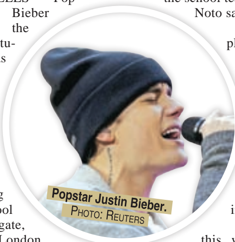
Popstar Justin Bieber.

"He was very down to earth and could have been another pupil, just enjoying himself, and spent about half an hour with us. He asked me to go in goal for a few penalties — and turned out to be pretty good," he continued.—PTI