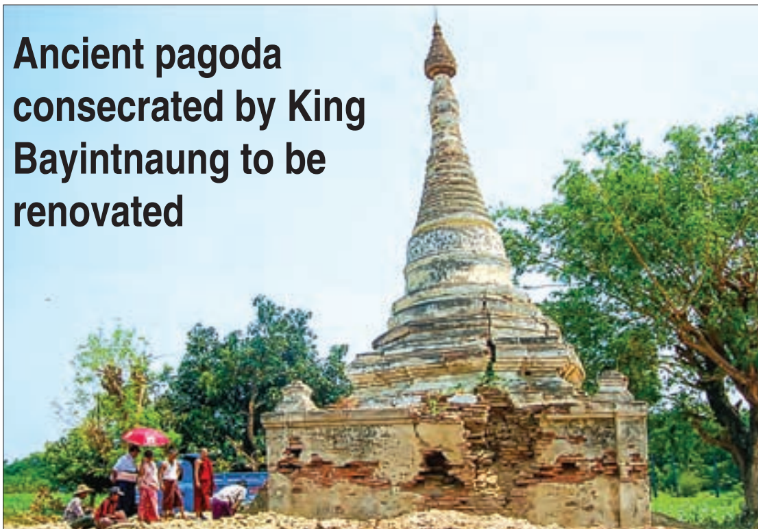
Ancient pagoda consecrated by King Bayintnaung being seen.

LOCATED in Yesagyo Township in Magway Region, an ancient pagoda consecrated by Bayintnaung, King of Toungoo Dynasty of Myanmar from 1550 to 1581, will be renovated as quickly as possible, locals say.