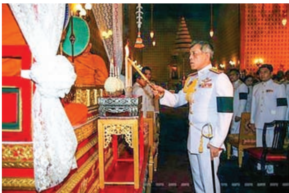
Thailand's Crown Prince Maha Vajiralongkorn takes part in a ceremony honouring the late King Bhumibol Adulyadej at the Grand Palace in Bangkok, Thailand, on 15 October 2016.

The government has not set a date for the royal cremation but a deputy prime minister said the prince had asked that it be held after a year of mourning, and the