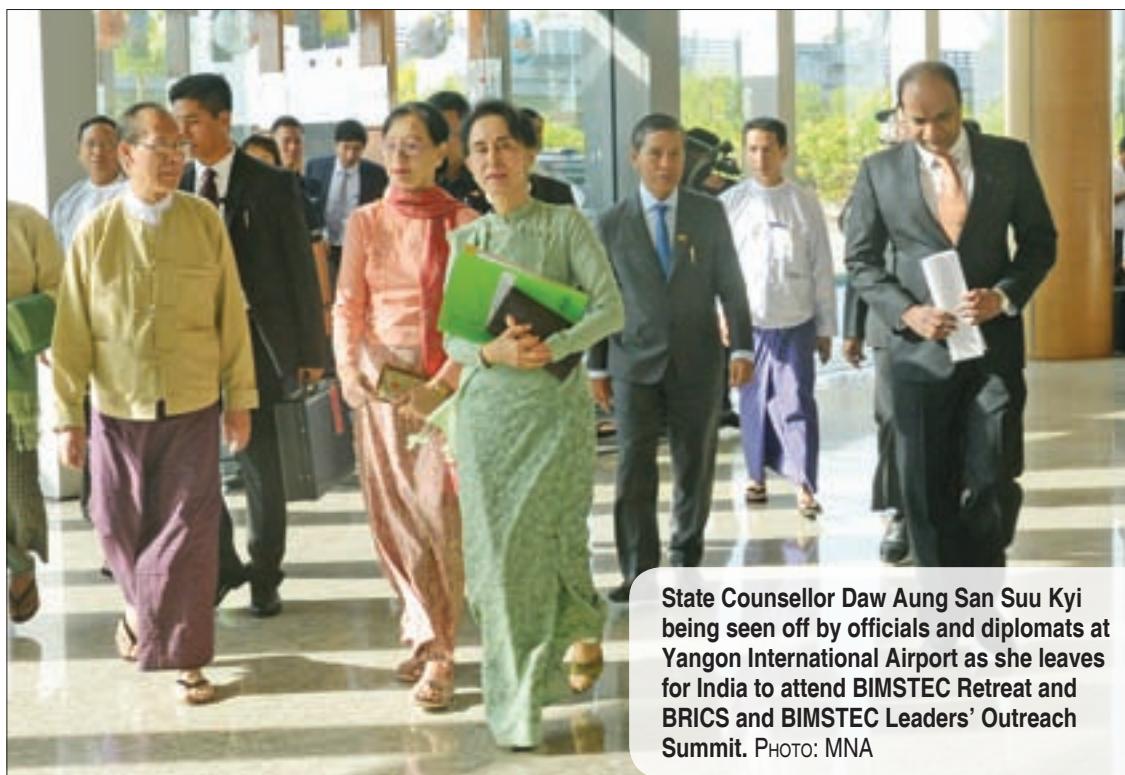
State Counsellor Daw Aung San Suu Kyi being seen off by officials and diplomats at Yangon International Airport as she leaves for India to attend BIMSTEC Retreat and BRICS and BIMSTEC Leaders' Outreach Summit.