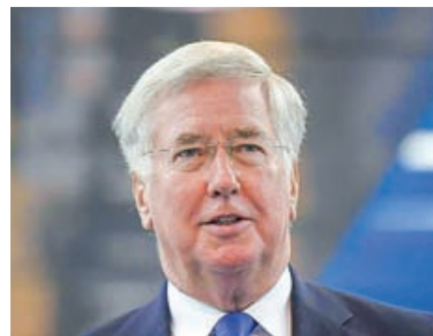
British Defence Secretary Michael Fallon arrives at the annual Conservative Party Conference in Birmingham, Britain, on 4 October 2016.

“Our training will help Tunisian forces strength-