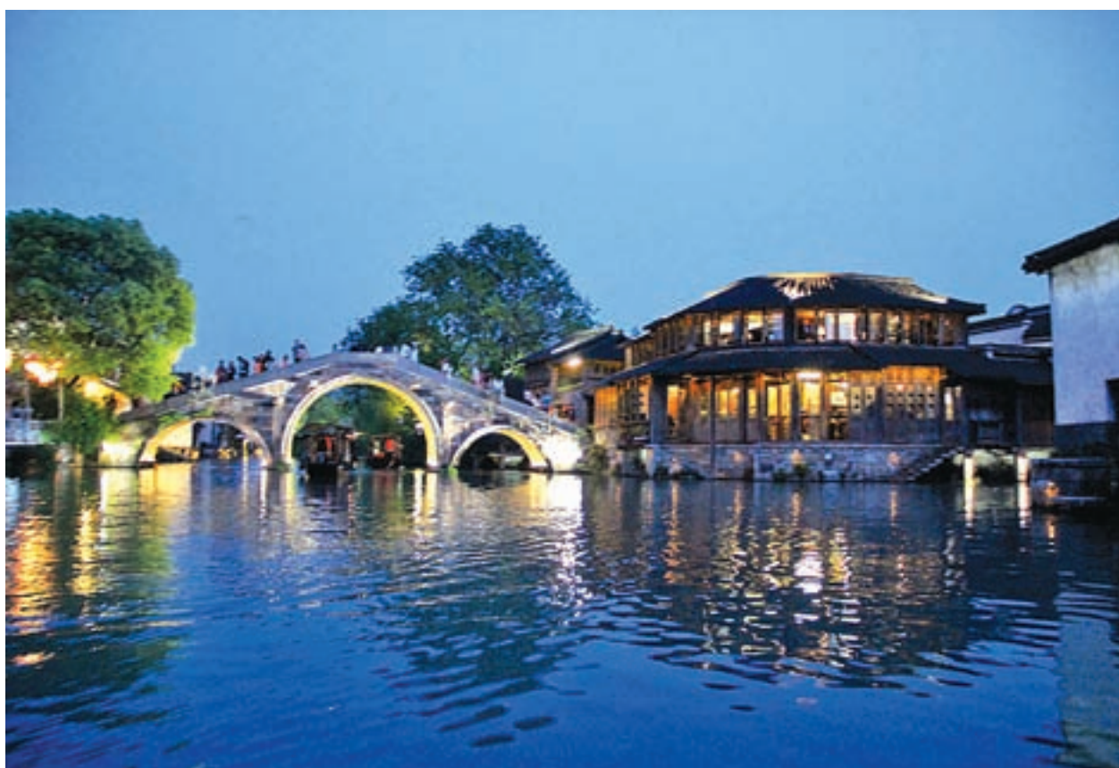
Photo taken by the author shows scenery in Wuzhen, east China's Zhejiang Province.

Meanwhile, Wuzhen itself has drawn worldwide attentions in recent years, due to its hosting of the World Internet Conference, an event participated by guests from over one hundred countries and regions.—Xinhua