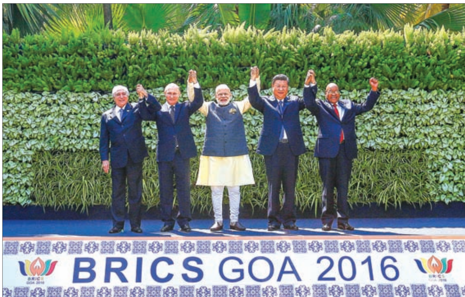
(L-R) Brazil’s President Michel Temer, Russian President Vladimir Putin, Indian Prime Minister Narendra Modi, Chinese President Xi Jinping and South African President Jacob Zuma pose for a group picture during BRICS (Brazil, Russia, India, China and South Africa) Summit in Benaulim, in the western state of Goa, India, on 16 October 2016.

Modi’s posturing overshadowed the gathering of leaders of a group originally set up to boost economic cooperation. It followed a productive bilateral summit with President Vladimir