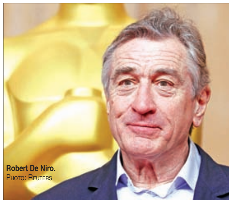
Robert De Niro.

The 73-year-old actor-producer will be honoured by the Film Society at a springtime gala featuring notable guests and presenters as well as movie and interview footage drawn from De Niro's career.