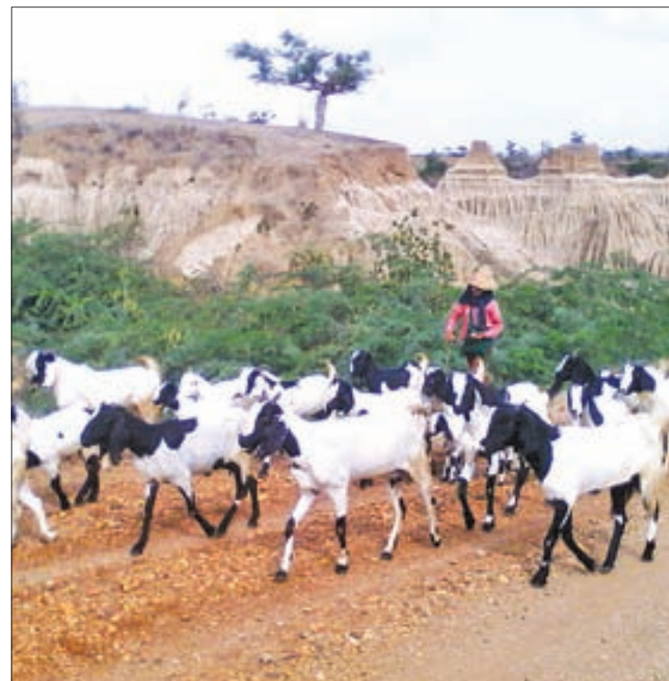
A woman driving goats to grazing land in central Myanmar.