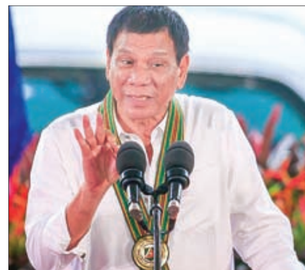
Philippines President Rodrigo Duterte gestures as he delivers a speech to the members of the Philippine Army during a visit at the army headquarters in Taguig city, metro Manila, Philippines, on 4 October 2016.

While he continues to chastise and hurl abuse at Washington for expressing concern about his bloody war on drugs, he insists his strategic gambit is about