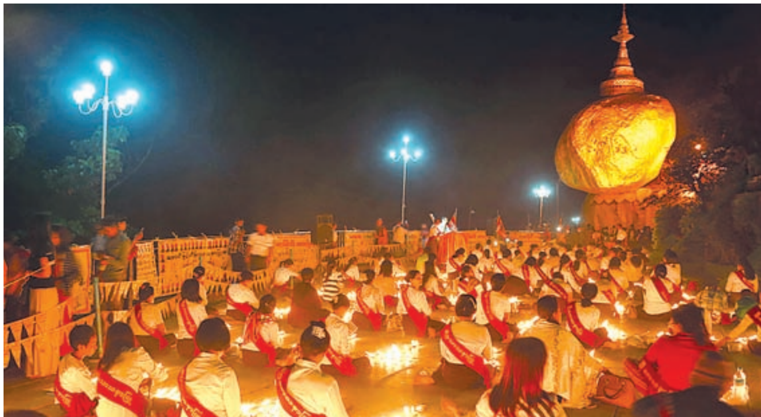
Buddhist devotees recite religious verses at Kyaikhtiyo Pagoda in Thaton, Mon State.

During festival days, Buddhists usually go to pagodas and monasteries to pay homage to the monks and offer alms and offerings.— Kay Khaing