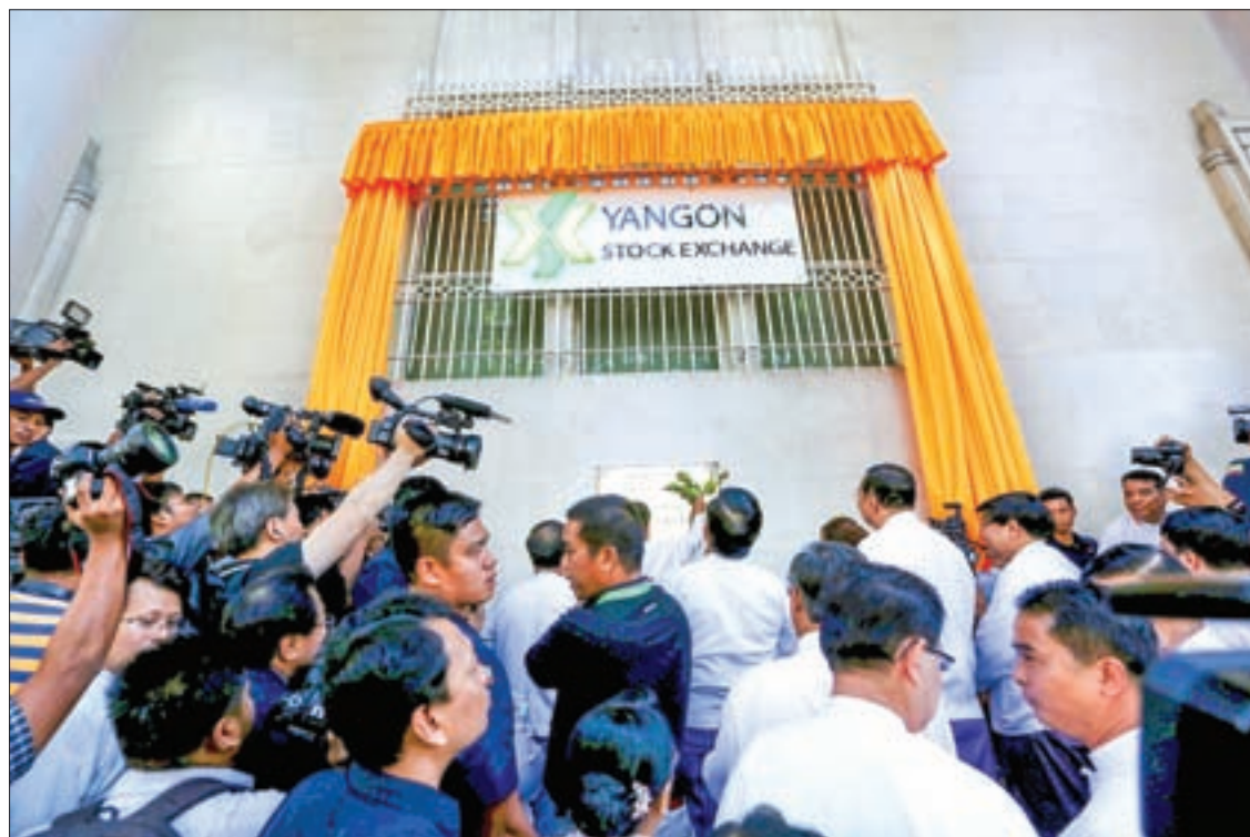
Officials and journalists gather outside the Yangon Stock Exchange at the opening ceremony of YSX.