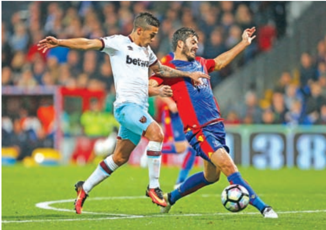
Crystal Palace's James Tomkins in action with West Ham United's Manuel Lanzini.

LONDON — West Ham United midfielder Manuel Lanzini is playing a key role in his team's recovery from a poor start to the Premier League and hopes his form will earn him a chance to play for Argentina.