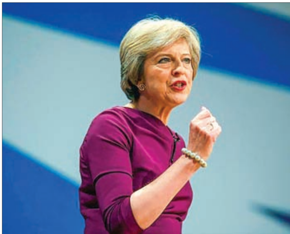
Britain's Prime Minister Theresa May gives her speech on the final day of the annual Conservative Party Conference in Birmingham, Britain, on 5 October 2016.