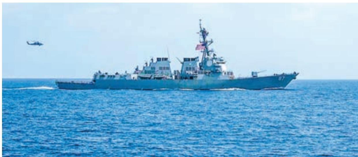
The US Navy guided-missile destroyer USS Mason conducts divisional tactic maneuvers as part of a Commander, Task Force 55, exercise in the Gulf of Oman on 10 September 2016.