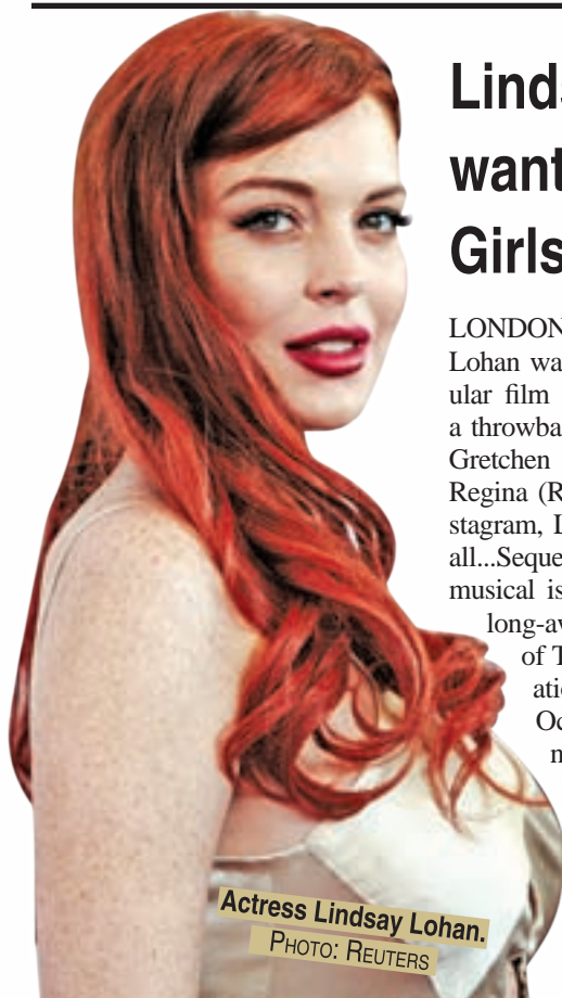
Actress Lindsay Lohan.