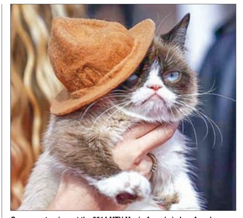
Grumpy cat arrives at the 2014 MTV Movie Awards in Los Angeles, California in 2014.

As news of the robbery spread, West abruptly ended a performance in New York less than an hour into his set on Sunday night.—Reuters