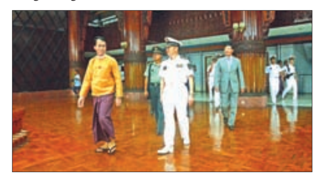
Chief Minister U Phyo Min Thein conducts Chinese navy delegation around the parliament.

During the visit, officers of the Chinese naval fleet met with Myanmar military leaders and participated in sports events with Myanmar Tatmadaw soldiers.