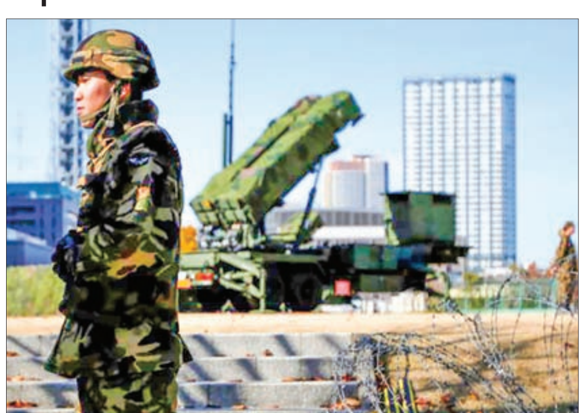
Members of the Japan Self-Defence Forces stand guard near Patriot Advanced Capability-3 (PAC-3) land-to-air missiles, deployed at the Defence Ministry in Tokyo, Japan, on 7 December 2012.