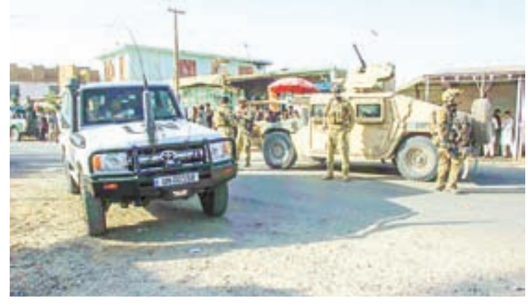
Afghan security forces keep watch in front of their armoured vehicle in Kunduz city, Afghanistan on 4 October 2016.