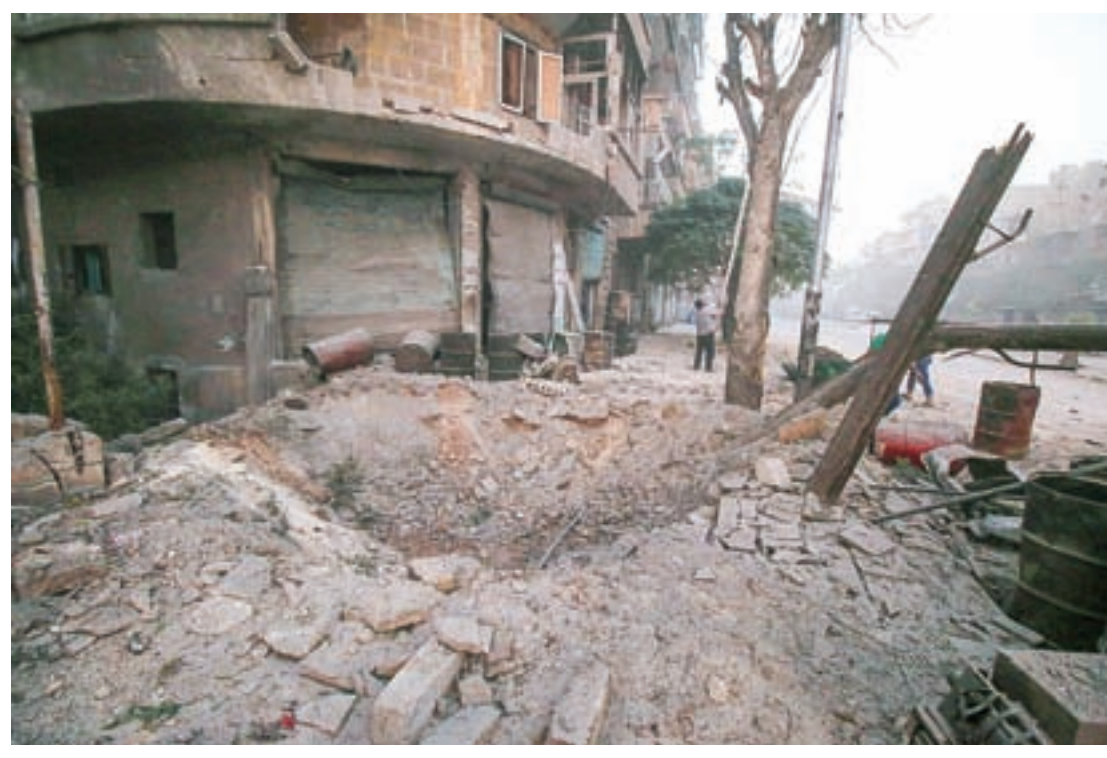
A man inspects damage near a hole in the ground after airstrikes on the rebel held al-Ansari neighbourhood of Aleppo, Syria on 2 October 2016.

In the northeastern city of Hasaka, a bomb killed at least 20 people at a Kurdish wedding, according to a Kurdish militia and a