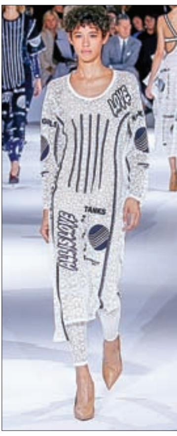
Models present creations by British designer Stella McCartney as part of her Spring/Summer 2017 women's ready-to-wear collection during Fashion Week in Paris, France on 3 October 2016.