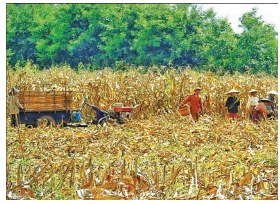
A maize plantation in a village near border with China.

The total volume of exported corn between 10 and 16 September was 14,879 tonnes worth US$3.48 million. Myanmar growers export corn via Muse, Lwejai, Chin Shwe Haw and Kan Pait Tee trade camps.-Aung Thant Khine