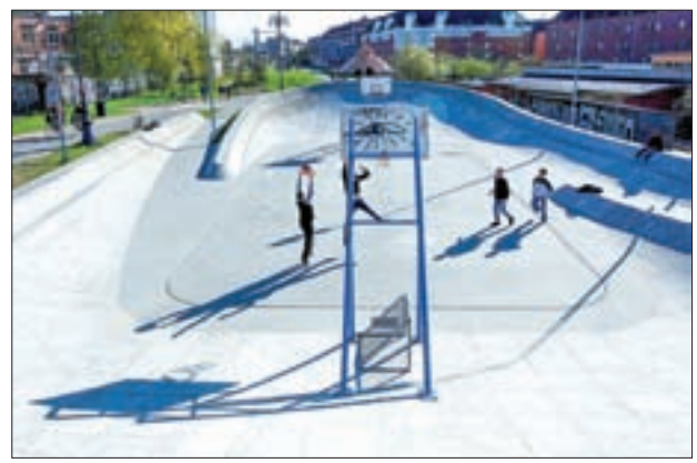
People play basketball at Superkilen park in Copenhagen, Denmark on 22 April 2016.

Superkilen, a series of public spaces in a deprived immigrant area of the Danish capital Copenhagen,