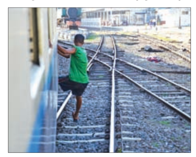
A train arriving Yangon Station.

Yangon circular train will cost US$301.29 billion, which will come from the government budget and from a loan from Japan, according to the Myanma Railway (MR).