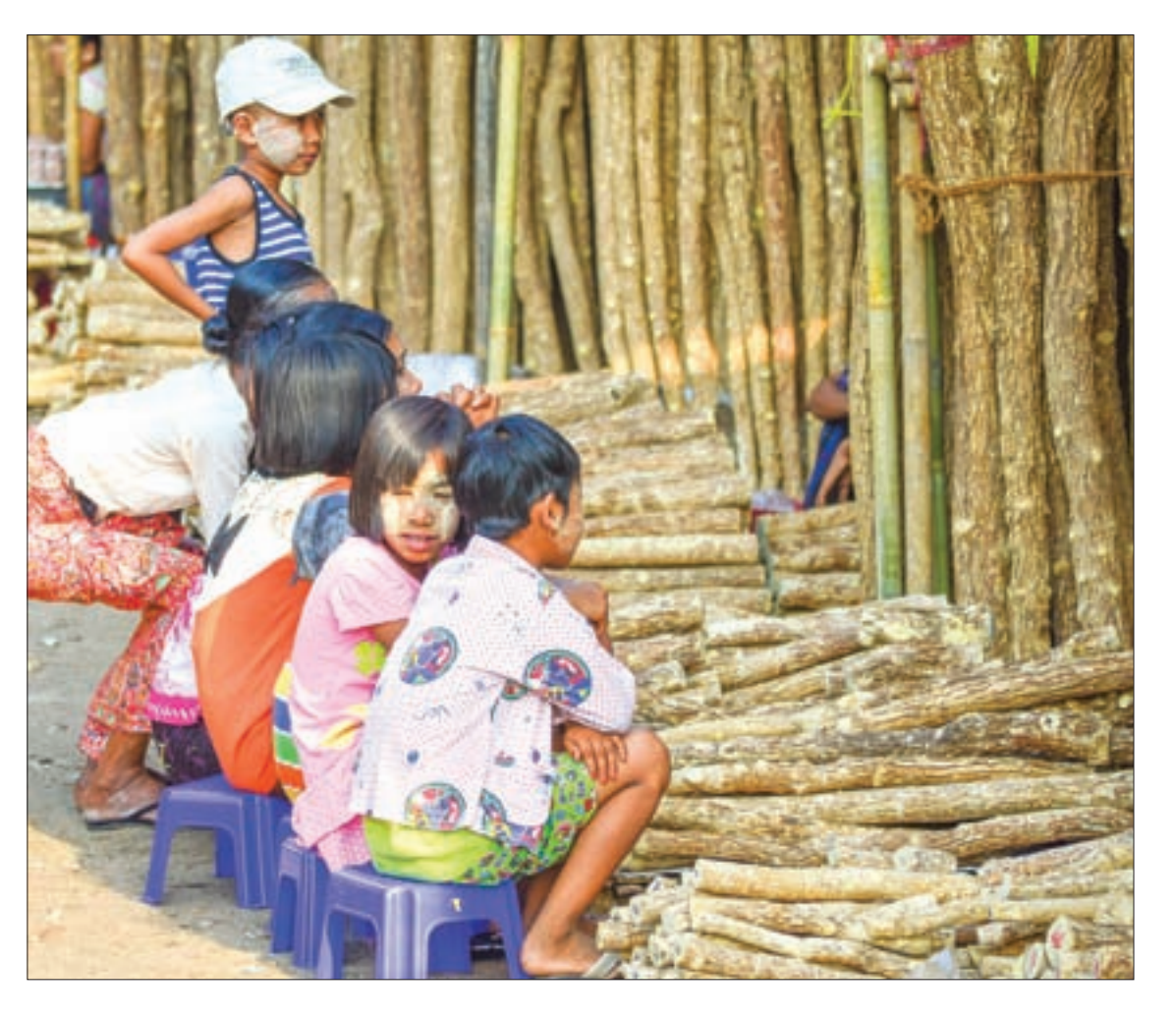
Customers evaluate Thanaka barks at a shop in Bago.

A story about the State Bank of India in yesterday's issue incorrectly referred to the new office to be located in Yangon as a "representative office". The correct term should be "branch office". The accompanying photo contained a similar mistake. Also, the caption incorrectly referred to the bank as the State Bank of Myanmar. The correct name is the State Bank of India. H.E B. Shyam Charge d' affaires of the Embassy of India in Yangon graced the occasion.—Ed