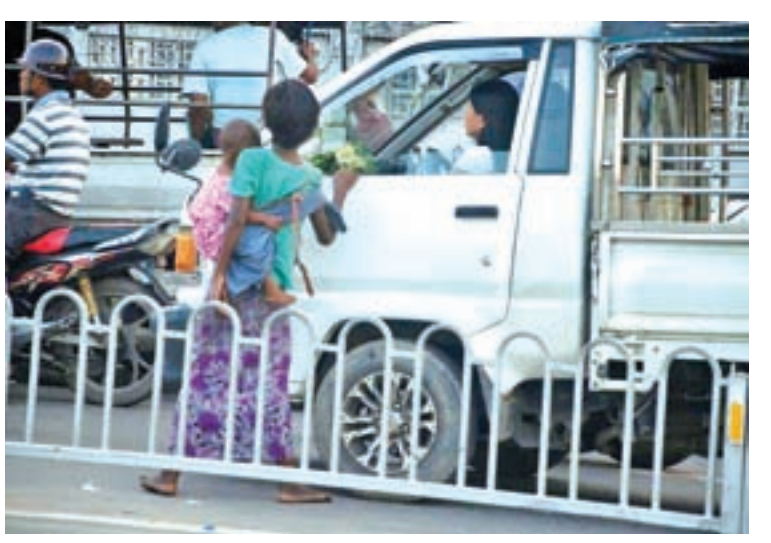
A beggar with a baby trying to solicit donating.

The arrested people include two adults and five children. Police admitted that they were unable to arrest people suspect-