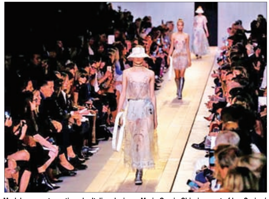
Models present creations by Italian designer Maria Grazia Chiuri as part of her Spring/ Summer 2017 women's ready-to-wear collection for fashion house Dior during Fashion Week in Paris, France, on 30 September 2016.

According to some analysts, Millennials already represent around half of luxury buyers today.