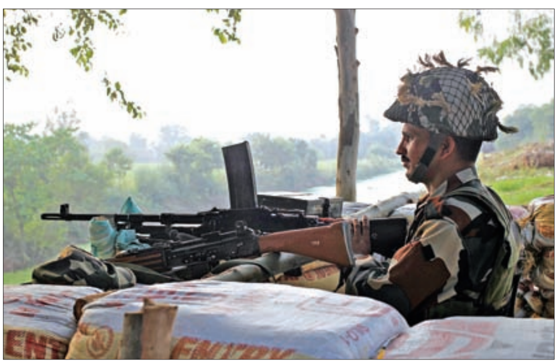
An Indian army soldier keeps guard from a bunker near the border with Pakistan in Abdullian, southwest of Jammu, on 30 September 2016.

The two countries have fought two of their three wars since independence from Britain in 1947 over Kashmir. Both claim the former princely state in full.—Reuters