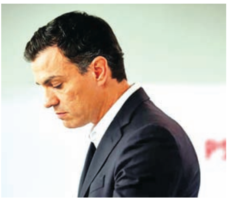
Spain's Socialist party (PSOE) leader Pedro Sanchez reacts as he addresses the media at his party's headquarters in Madrid, Spain, on 30 September 2016.

"If the party assembly decides that it is necessary to opt for the abstention, I cannot administer a decision that I do not share," he said.