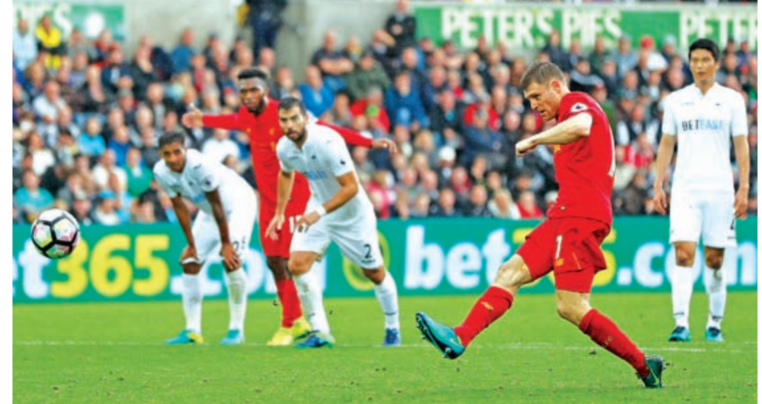
Liverpool's James Milner scores their second goal from the penalty spot during Premier League at Liberty Stadium, on 1 October 2016.

back in the area by Angel Rangel, Milner stepped up to coolly sidefoot down the middle of the goal as Liverpool continued their excellent start to the season with a fourth successive league win.—Reuters