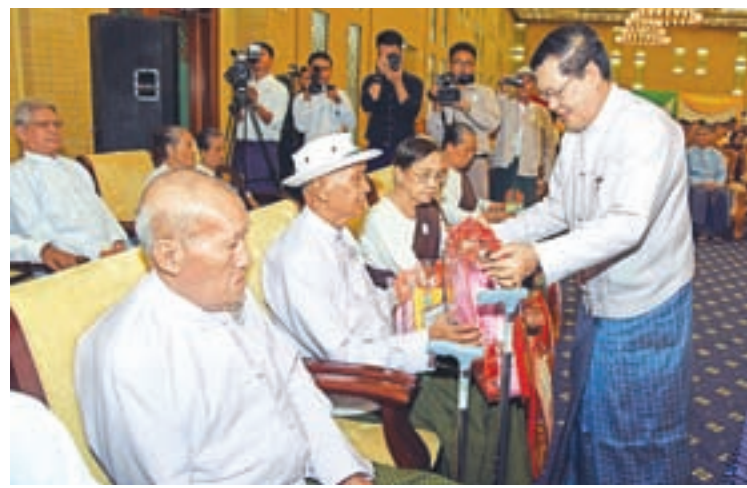
Minister U Thein Swe presenting honorarium to an elderly person.

of UNDP, UNICEF, UNODC, ICRC and OHCHER workshops are being conducted." he went on to say. In the evening, Lt-Gen Kyaw Swe, Union Minister for Home Affairs, conferred award of honours for valor on two award recipients' family members and two officers for ideal awards. Then, Deputy Minister Maj-Gen Aung Soe gave four other awards.--Myanmar News Agency