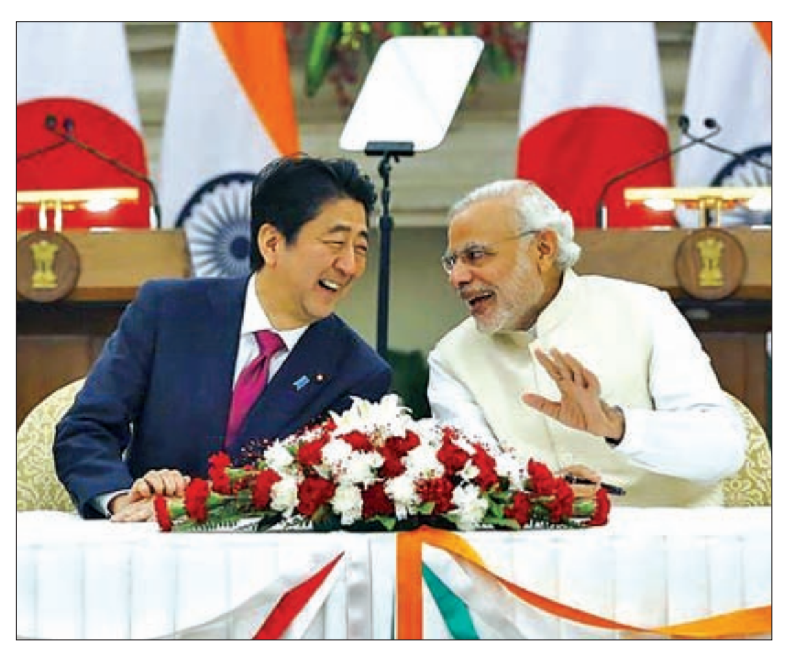
Japan's Prime Minister Shinzo Abe and Narendra Modi shares a moment during a signing of agreement at Hyderabad House in New Delhi, in 2015.