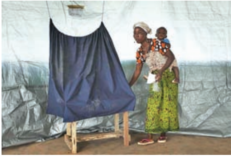
A Liberian woman casts her ballot during presidential elections at Klay town just outside the capital Monrovia in 2011.

"The allotted seats will always be flagged by men when it comes