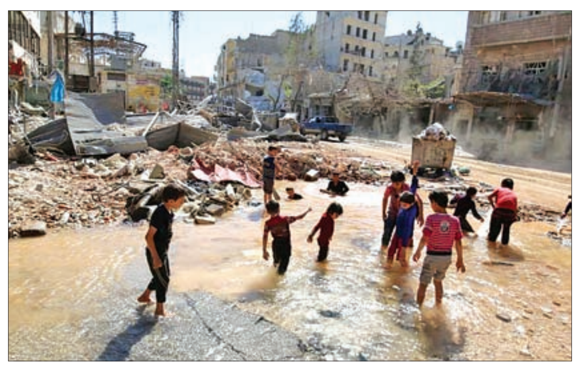
Children play with water from a burst water pipe at a site hit yesterday by an air strike in Aleppo's rebel-controlled al-Mashad neighbourhood, Syria, on 30 September 2016.

Lavrov criticised Washington's failure to separate moderate rebel groups from those the Russians call terrorists, which had allowed forces led by the group formerly known as the Nusra front to violate the US-Russian