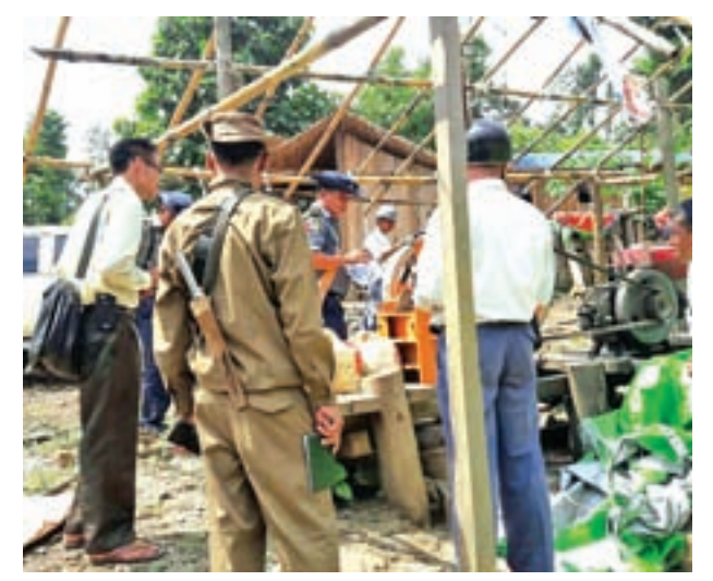
Authorities inspecting the gold mining site.

Local police from Wuntho Myoma police station have filed charges against both suspects under section 30(B) of the Mining Act.— Maung Chit Lin