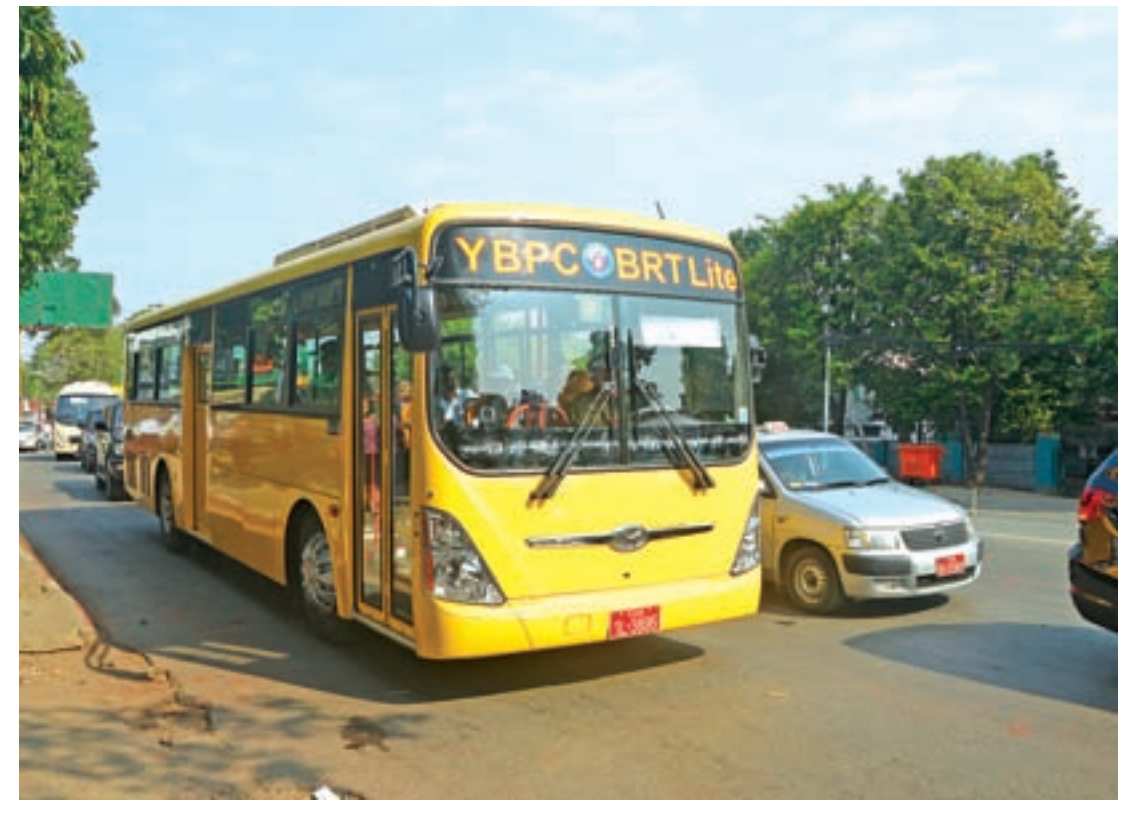
A BRT Lite from Yangon Public Bus Line Co Ltd. PHOTO: 200

The Yangon public bus line company plans to sell 5000 shares (Ks100,000 worth) to the public. Currently, the company sold an equity amounting to Ks 2.4 billion. The company will begin to sell the remaining shares on November 4.— 200