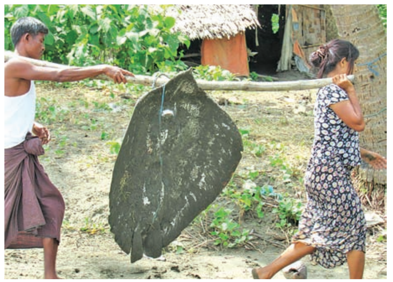
A ray-finned fish being carried.

RAKHINE fishermen caught rayfinned fish weighing 30- 100 visses each in great numbers off the Rakhine coast in September, according to