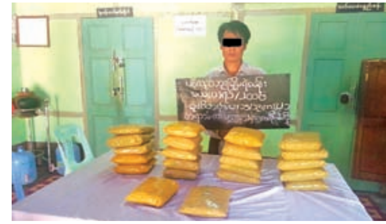
U Tin Shwe.

Acting on a tip-off, police stopped and searched one U Tin Shwe from Tazun village and found black opium weighing 3.4 kilograms. The suspect has been charged under the Narcotic Drugs and Psychotropic Substances Law .- Myo Lwin (Pinlebu)