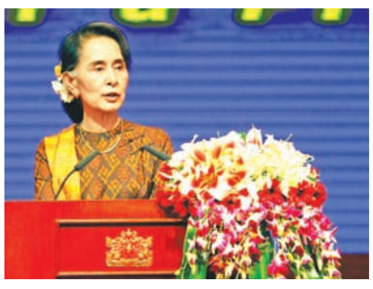
State Counsellor Daw Aung San Suu Kyi.

ASEAN itself aspires to be a rules-based, people-oriented and people-centred community. Rules-based is extremely important particularly for members of parliaments. Law makers cannot be law breakers. They must know the rules and procedures all the parliaments and theirselves and also the law of the land that they may truly be representative of the legislative brunch of democratic governments. And at a national level it is arguably the institution of Parliament that best embodies the principle of ruled-based people-oriented and people-centred. That is why the strong partnership between AIPA and ASEAN over many years has proven so valuable, morally and practically. For it is through the ongoing scrutiny and support of legislators that our countries have been able to ratify