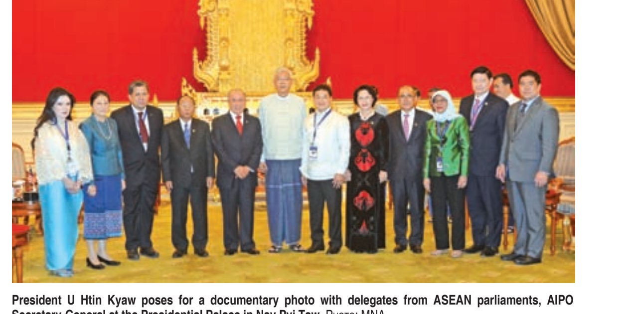
Secretary-General at the Presidential Palace in Nay Pyi Taw.