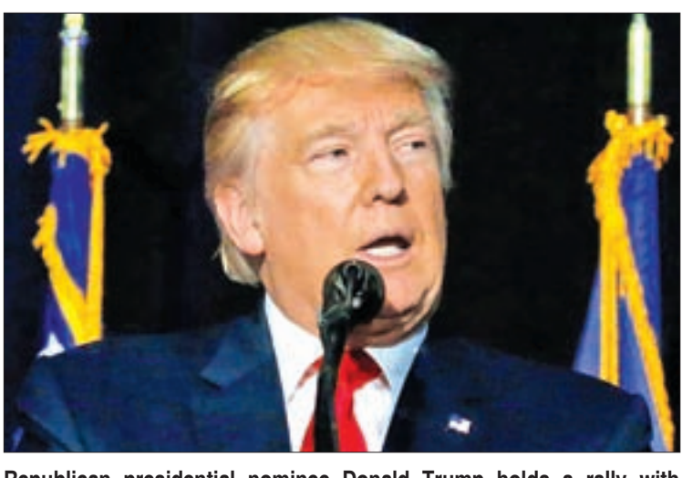
Republican presidential nominee Donald Trump holds a rally with supporters in Bedford, New Hampshire, US, on 29 September 2016.

"The efforts that Trump is making to get into the Cuba market, putting his business interests ahead of the laws of the United States ... shows that he puts his personal and business interests ahead of the laws and the values and the policies of the United States of America," Clinton said.— Reuters