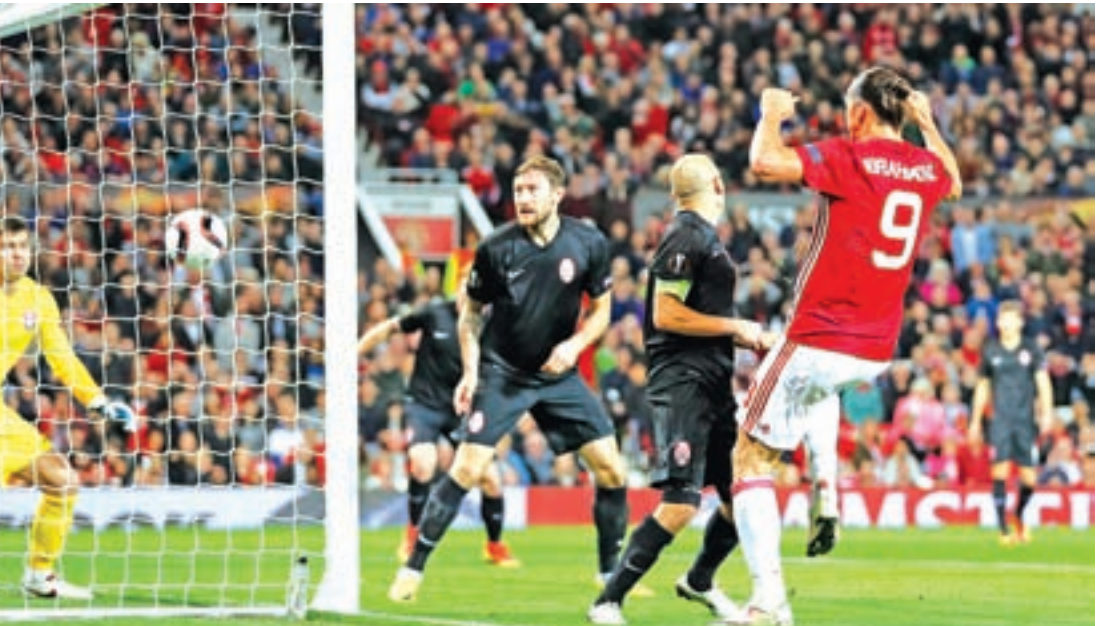
Manchester United's Zlatan Ibrahimovic scores their first goal against FC Zorya Luhansk during UEFA Europa League Group Stage, Group A at Old Trafford, Manchester, England, on 29 September. PHOTO: REUTERS

Striker Divock Origi is a doubt for the clash against Swansea after he picked up a minor knee injury.-Reuters