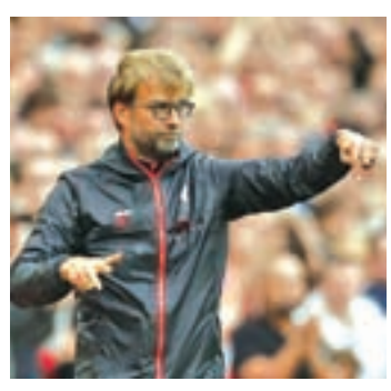
Liverpool manager Juergen Klopp.

plan and different options in their style of play, good defending.