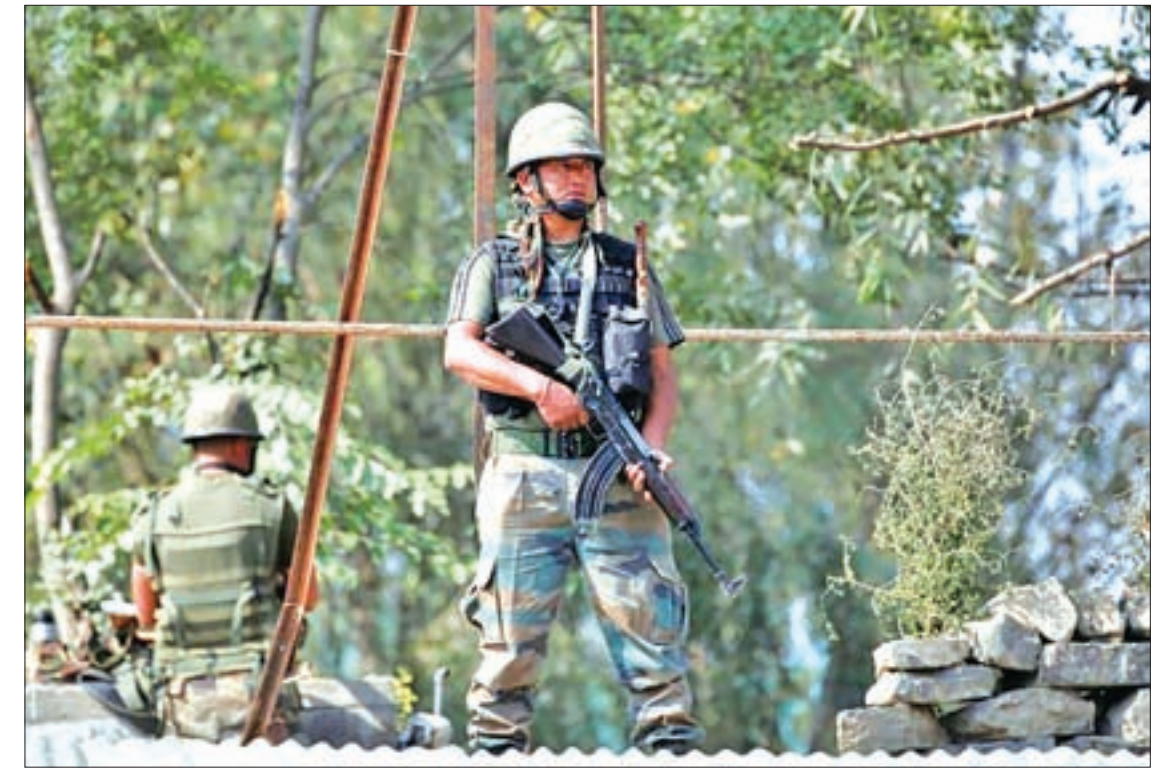
Indian army soldiers keep guard on top of a shop along a highway on the outskirts of Srinagar, on 29 September 2016.

It added that the country was ready "to counter any aggressive Indian designs," but gave no fur-