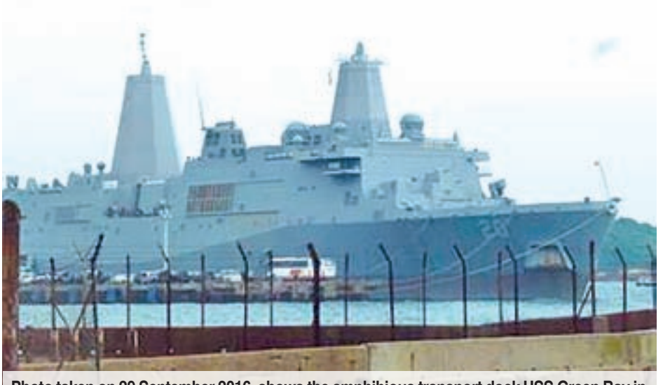
Photo taken on 29 September 2016, shows the amphibious transport dock USS Green Bay in Hong Kong. Two US Navy ships made a port call there the same day, the first such visit since China turned a US aircraft carrier away from visiting the territory in April.

China turned down the port call request shortly after US Defence Secretary Ashton Carter had visited the Stennis with his Philippine counterpart as the carrier sailed near the main