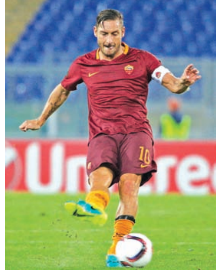
Roma's Francesco Totti in action During UEFA Europa League Group Stage, Group E at Olympic Stadium, Rome, Italy, on 29 September 2016.