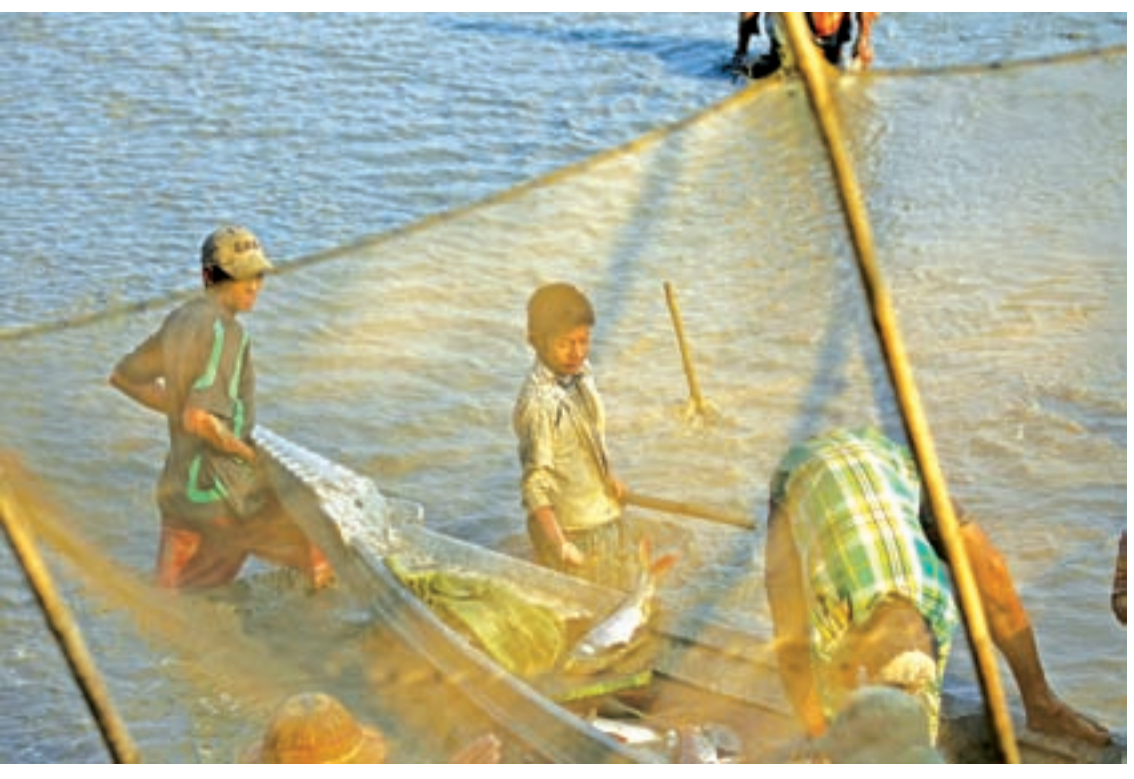
Workers work at a fish farm in Htantabin township, outside Yangon.

Myanmar's weather is favourable for fish and prawn farming. Additionally, Myanmar is rich in aquatic resource when compared to neighboring countries such as Thailand and Vietnam. There are around 400,000 acres of fish and prawn farms, it is learnt from the Fisheries Department. However, the volume of the products produced is 10-12 times less than that of Thailand and Viet Nam. The fisheries export sector annually earns around US$500 million. The target of the fisheries export is to fetch US$700 million.—200