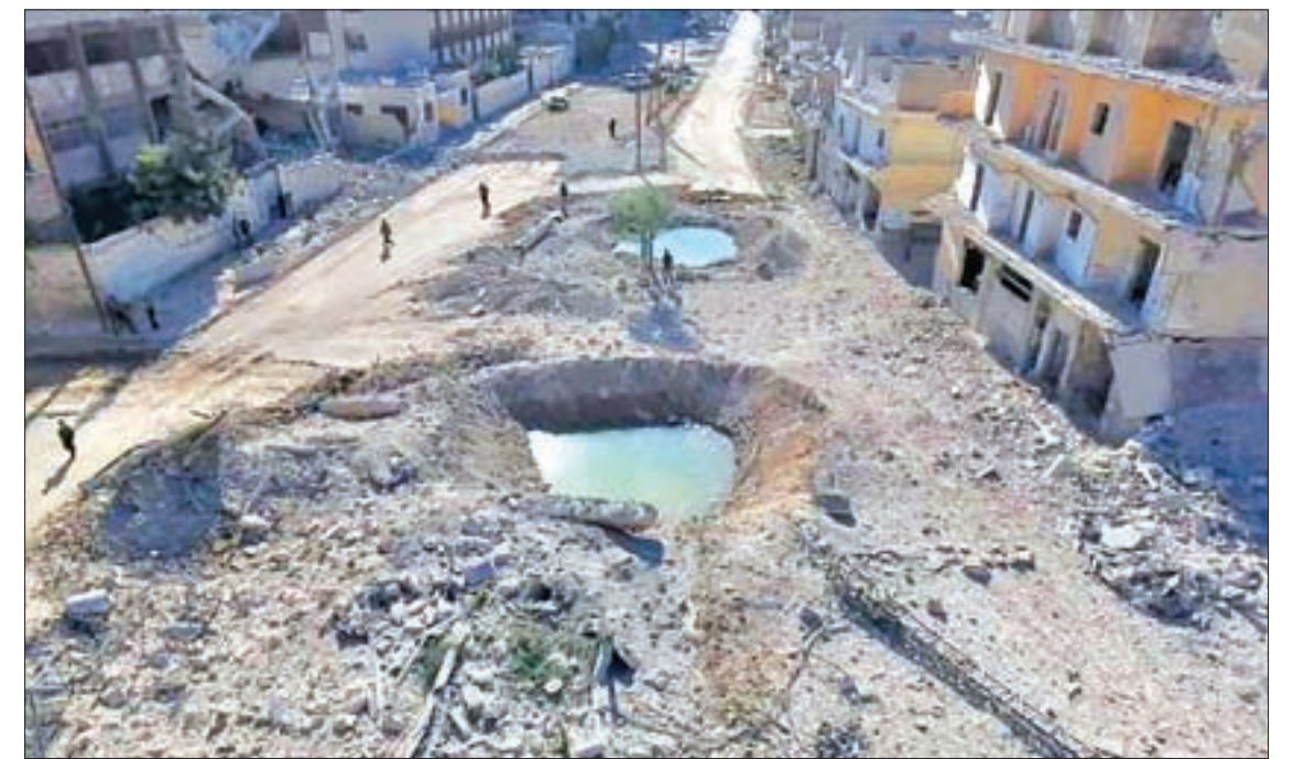
People stand near craters and damaged buildings in a rebel-held area of Aleppo, Syria, on 27 September 2016.

But a senior rebel source denied that the government had captured the Kindi Hospital area, saying the battles were ongoing.—Reuters