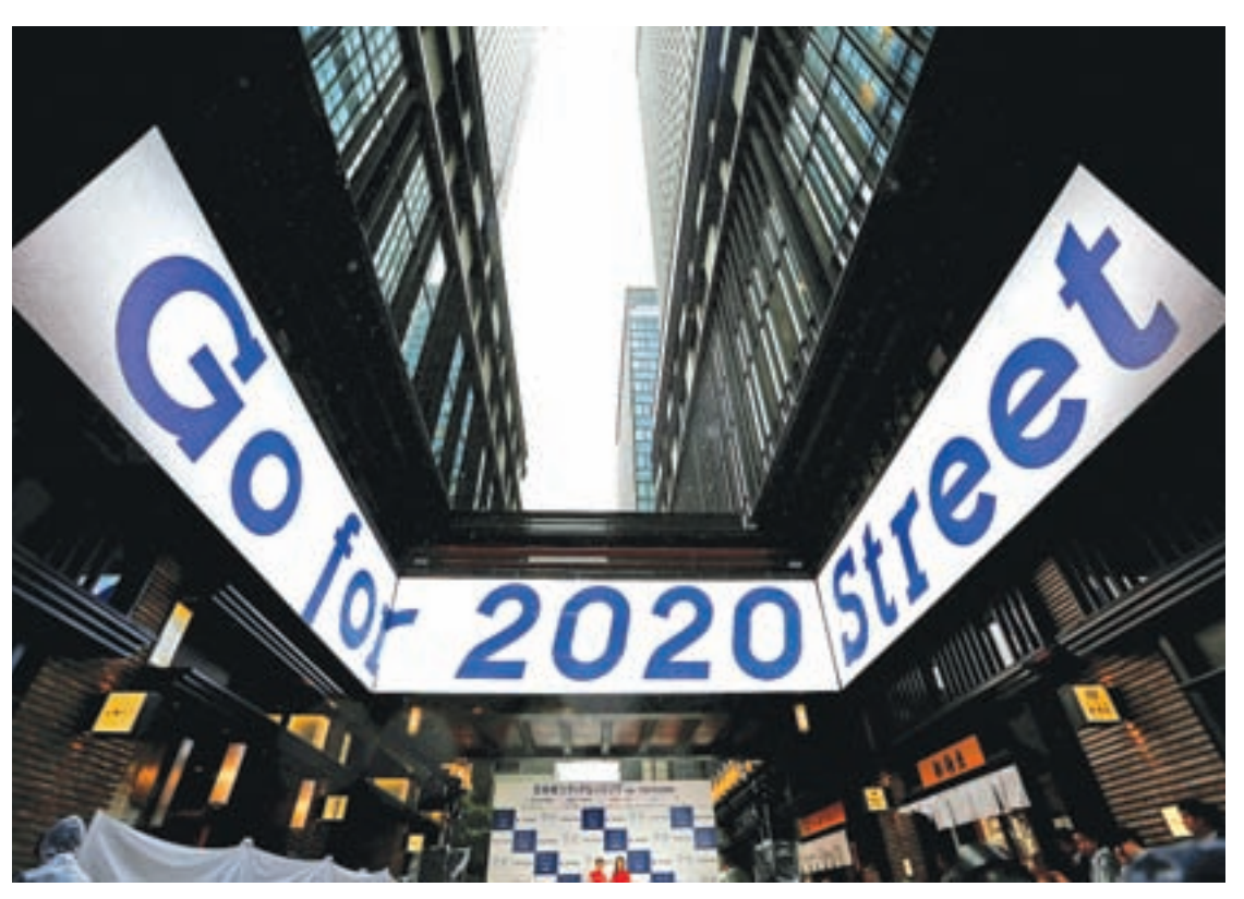
The opening celemony of the Tokyo 2020 Olympics and Paralympics promotional event "Go for 2020 Street" in Tokyo's Nihonbashi shopping and business district, Japan, on 20 September 2016.