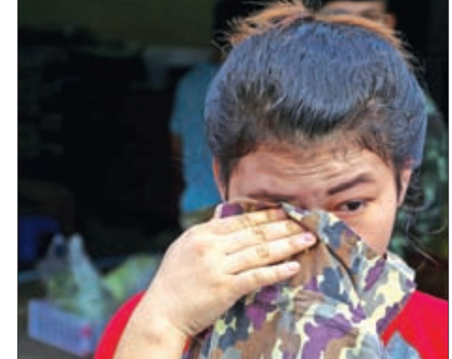
A migrant worker cries during a crack down on illegal migrant workers at a market in Bangkok, Thailand, on 27 September 2016.

The raids have targeted fresh markets, restaurants, supermarkets and shop-