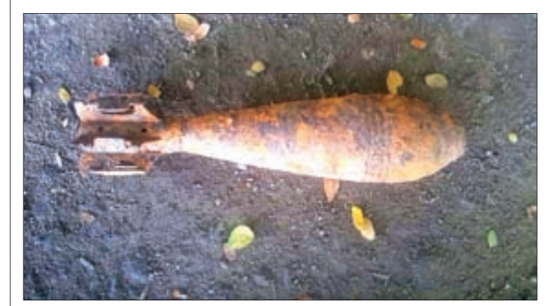
An aged hand grenade.

Police handed over the hand grenade to the No-2 military training school for safe destruction.— Tin Soe Lwin