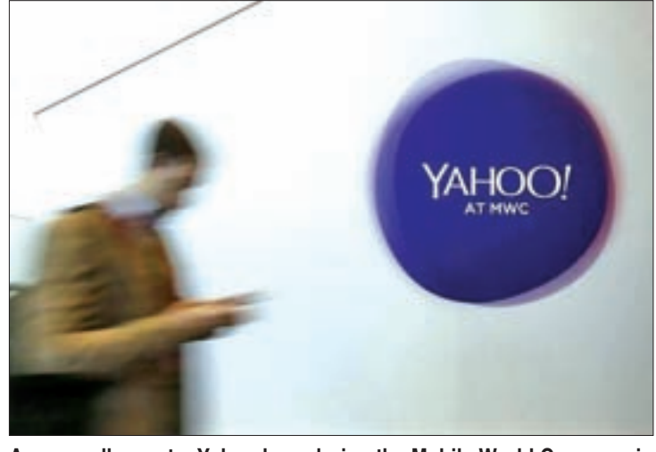
A man walks past a Yahoo logo during the Mobile World Congress in Barcelona, Spain, on 24 February 2016.

The task is made especially challenging by the fact that criminal hackers sometimes provide information to government intelligence agencies or offer their services for hire, making it hard to know who the ultimate mas-