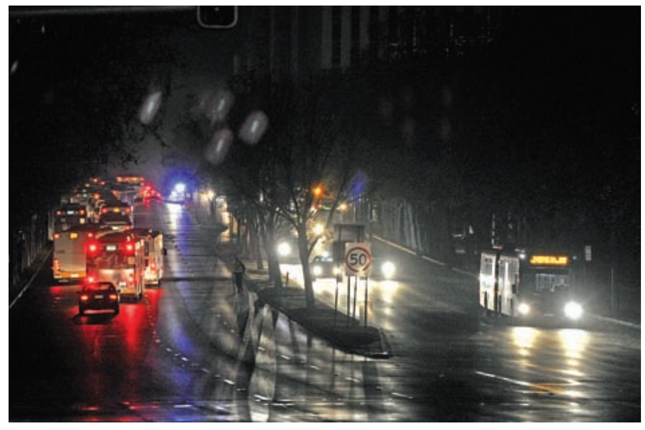
Cars and buses drive in the central business district (CBD) of Adelaide after severe storms and thousands of lightning strikes knocked out power to the entire state of South Australia, on 28 September 2016.

Coal-fired power plants dominate the country's power sector resulting in Australia being one of