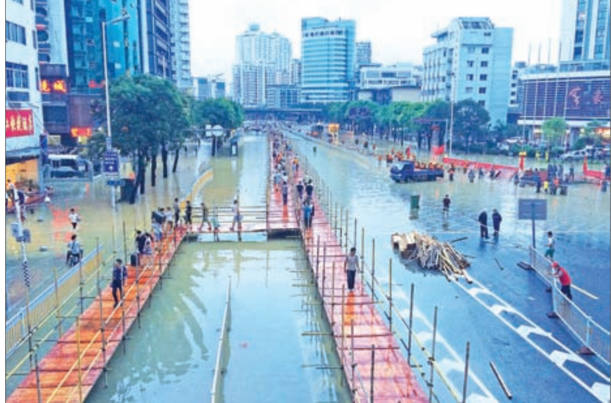
People walk on makeshift walking paths along a flooded street as Typhoon Megi hits Fuzhou, Fujian Province, China, on 28 September 2016. Photo: Reuters

Megi had already killed four people and injured more than 523 in Taiwan since it had roared in from the Pacific Ocean.-Reuters