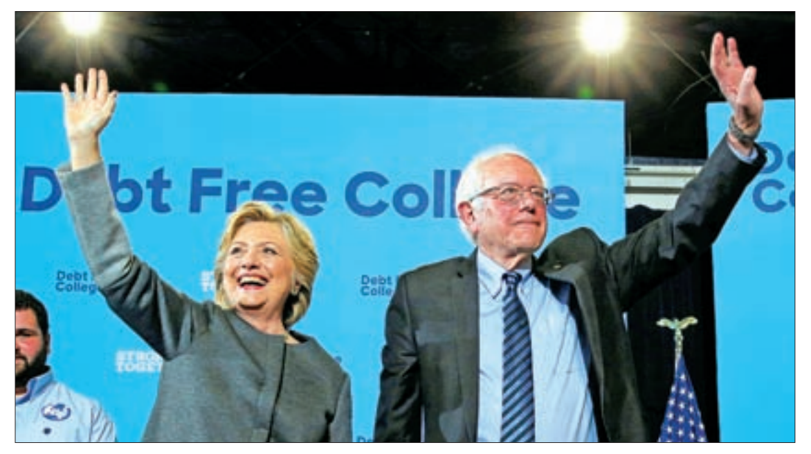
US Democratic presidential nominee Hillary Clinton and US Senator Bernie Sanders take the stage to talk about college affordability during a campaign event at the University of New Hampshire in Durham, New Hampshire, United States, on 28 September 2016.

The poll has a credibility interval, a measure of accuracy, of 3 percentage points for the entire sample and the sample of likely voters. It has a credibility interval of 4 percentage points for the likely voters who watched the debate.— Reuters