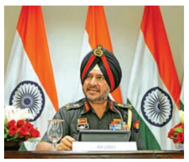
Indian army's director general of military operations Lt General Ranbir Singh speaks during a media briefing in New Delhi, India, on 29 September 2016.

Australia wants to double its large-scale renewable energy generation to 33,000 gigawatt hours by 2020, which means solar, wind and hydro-electricity would have to make up nearly a quarter of power generation by then. —Reuters