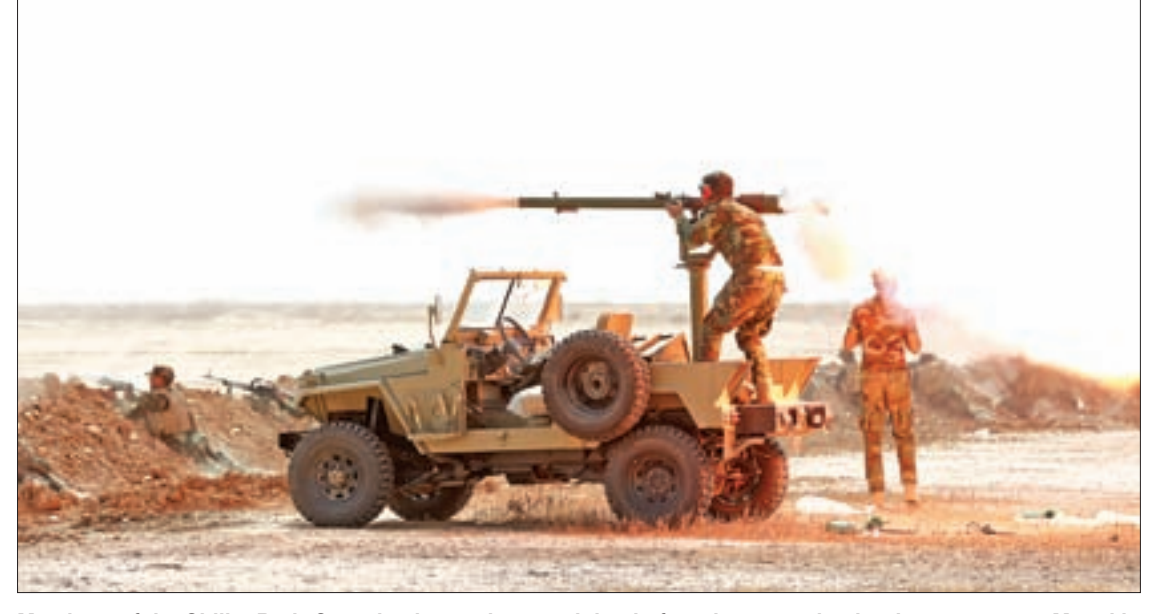
Members of the Shi'ite Badr Organisation undergo training before the upcoming battle to recapture Mosul in Diyala Province, Iraq, on 27 September 2016.

"Mosul will be the last of the very large cities that needs to be recaptured, but they'll need to continue to consolidate control over the whole city," he added, leaving the door open for US forces to re-