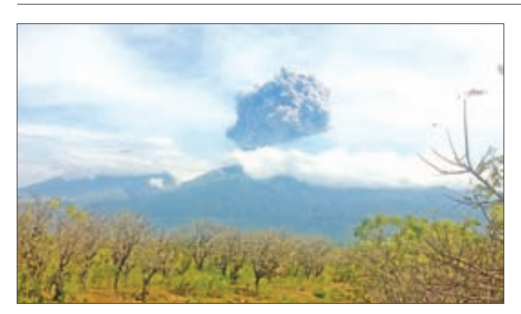
Mount Barujari, located inside Mount Rinjani volcano, is seen erupting from Bayan District, North Lombok, Indonesia, on 27 September 2016.