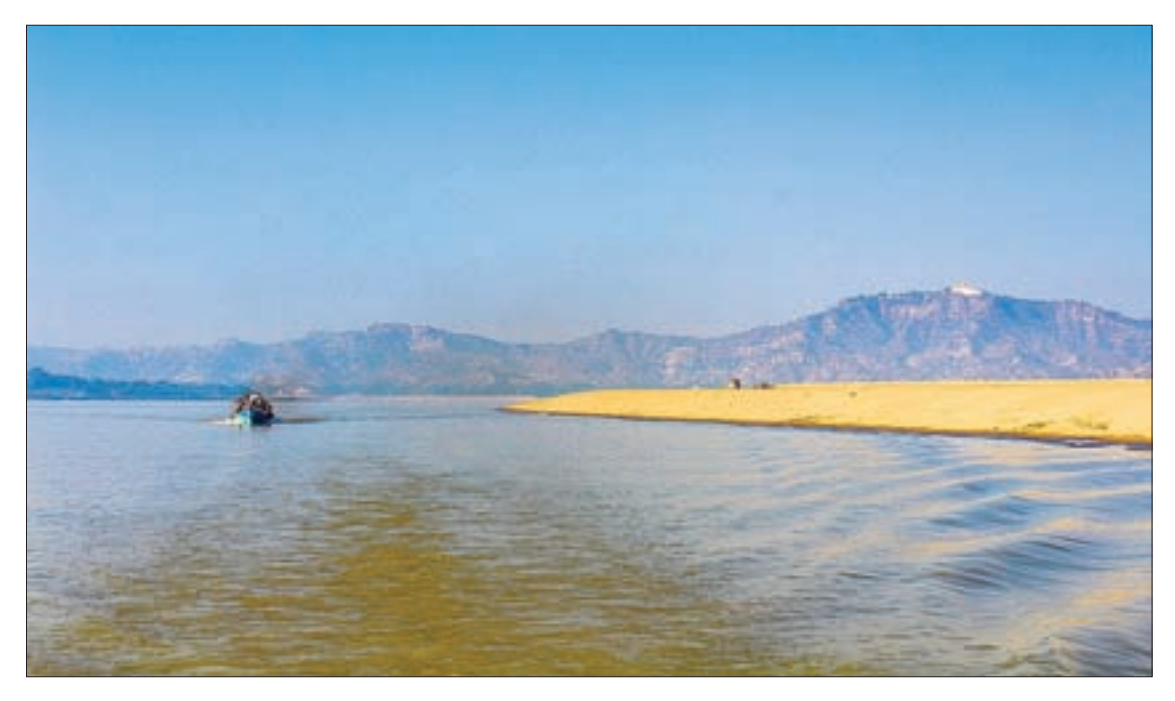
A boat carrying passengers is running past a sandbank in the Ayeyawady River.

These efforts will not only achieve better and cleaner water flow but will also protect endangered species living in the rivers and reverse the effects of pollution, in cooperation with international countries.— 200