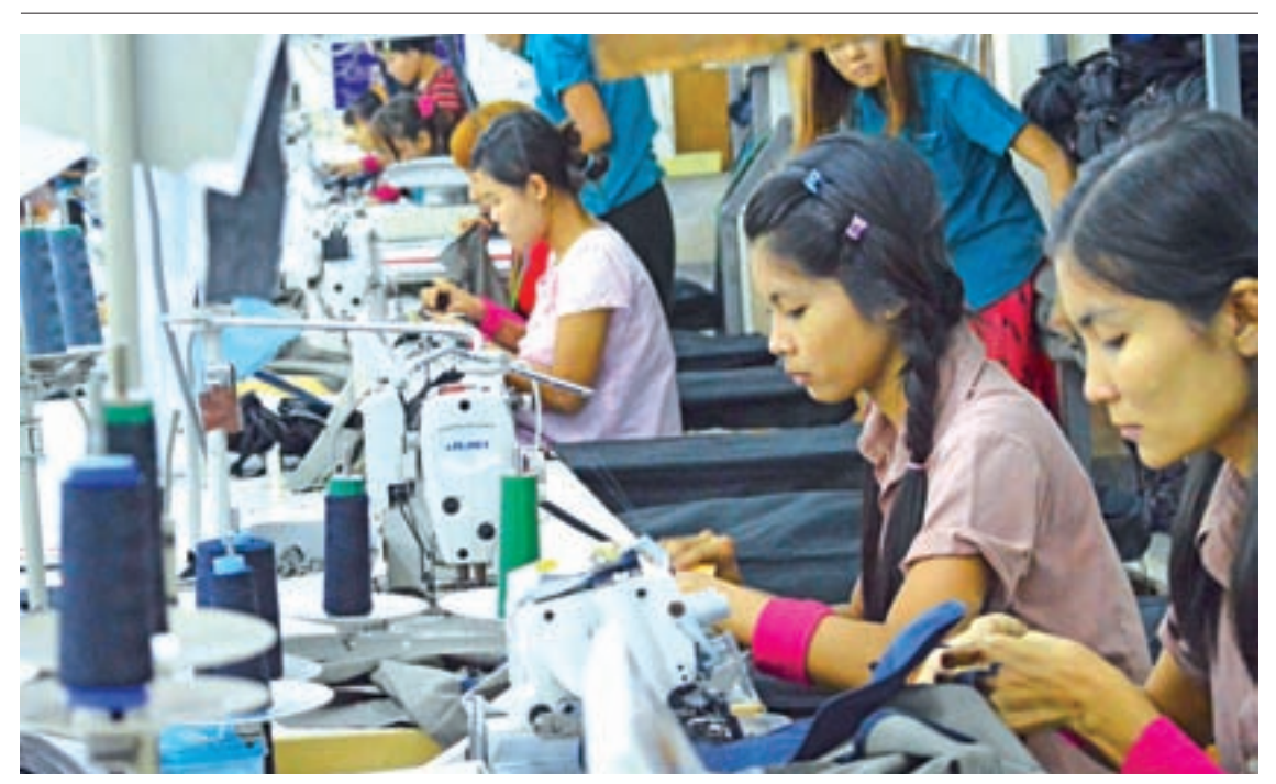
Employees work at a production line of a garment factory in Mingaladon.

Myanmar Energy Sector Development Public Company Limited was organized with 52 companies on 1st January, 2013 to be engaged in import, export, distribution and selling of fuel