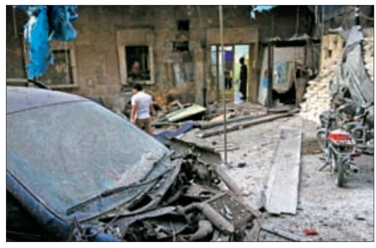
A man inspects the damage outside a field hospital after an airstrike in the rebel-held al-Maadi neighbourhood of Aleppo, Syria, on 28 September 2016.

"These thinly disguised invitations to use terrorism as a weapon against Russia show the political depths the current US administration has stooped to in its approach to the Middle East and specifically to Syria." US officials said on