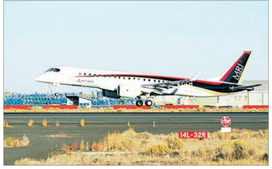
The Mitsubishi Regional Jet arrives at Grant County International Airport in Moses Lake, Washington, on 28 September 2016, for flight tests. The first domestically produced Japanese commercial passenger jet has been mired in a series of development delays.

The jetliner, which seats 70 to 90 passengers, is intended for short- to medium-haul flights. It sports a slim body design that reduces air resistance, helping it consume around 20 per cent less