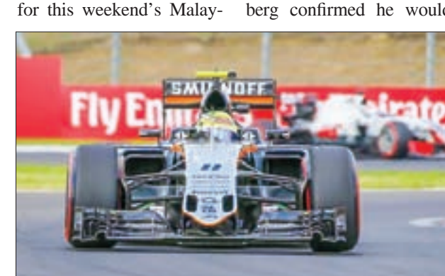
Force India's Sergio Perez during practice during Hungarian Grand Prix 2016, Hungaroring, Hungary on 22 July 2016.

Apple does not allow users to modify their iPhones. Modification can increase the risk of infection with computer viruses, experts say. —Kyodo News