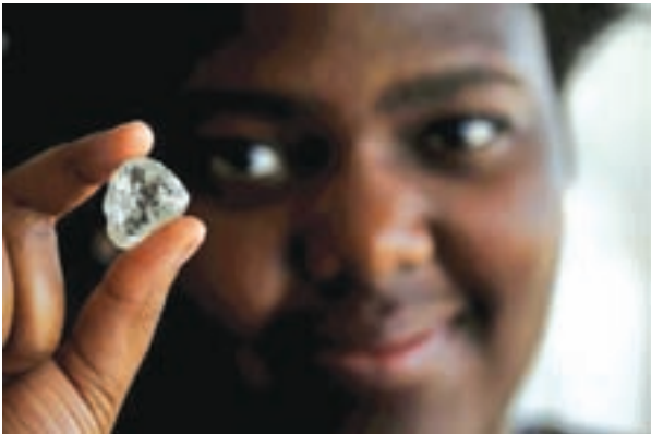
A visitor holds a diamond during a visit to the De Beers Global Sightholder Sales (GSS) in Gaborone, Botswana on 24 November, 2015.