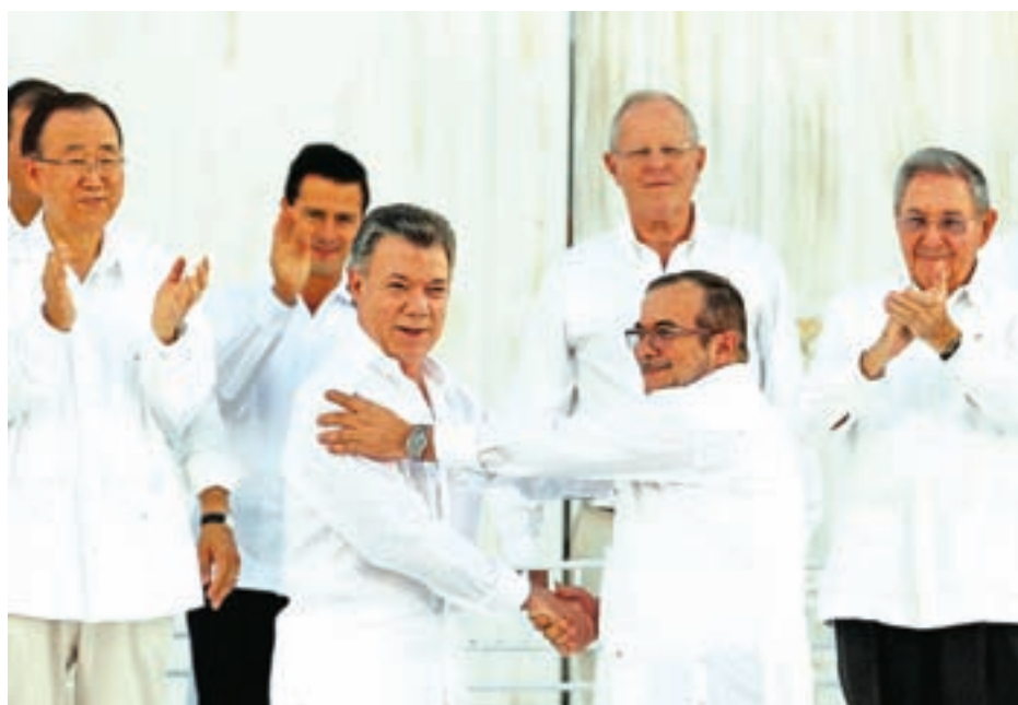
Colombian President Juan Manuel Santos (L) and Marxist rebel leader Rodrigo Londono (R), better known by the nom de guerre Timochenko, shake hands after signing an accord ending a half-century war that killed a quarter of a million people in Cartagena, Colombia on 26 September 2016.

"The horrible night of violence that has covered us with its shadow for more than half a century is over," Santos said through tears. "We open our hearts to a new dawn, to a brilliant sun full of possibilities that has