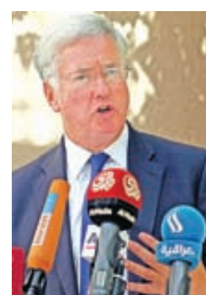
Britain's Defence Secretary Michael Fallon speaks during a press conference at the British embassy in Baghdad, Iraq, on 21 September.

"We are going to continue to oppose any idea of an EU army or EU army