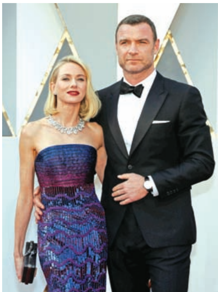
Actors Naomi Watts and husband Liev Schreiber.

Schreiber will also star on Broadway in "Les Liaisons Dangereuses," opening next month, in which he plays a promiscuous Frenchman.