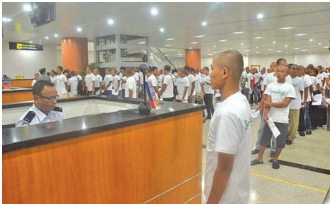
Workers receive immigration checks on their arrival at Yangon International Airport.

THE ninth batch of detained Myanmar citizens in Malaysia arrived back to Yangon yesterday via chartered flight.