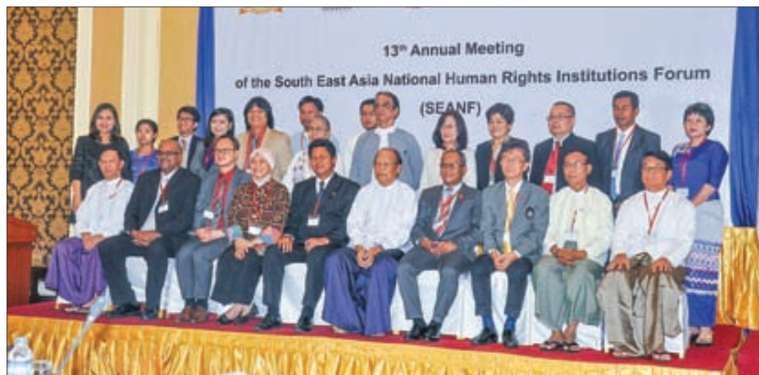
Participants in the 13th Annual Meeting of the South East Asia National Human Rights Institutions Forum pose for documentary photos before the meeting in Nay Pyi Taw.

At the end of the meeting the Myanmar National Human Rights Commission, which is the current chair of the SEANF, will hand over the chairmanship to the Philippines.— Myanmar News Agency