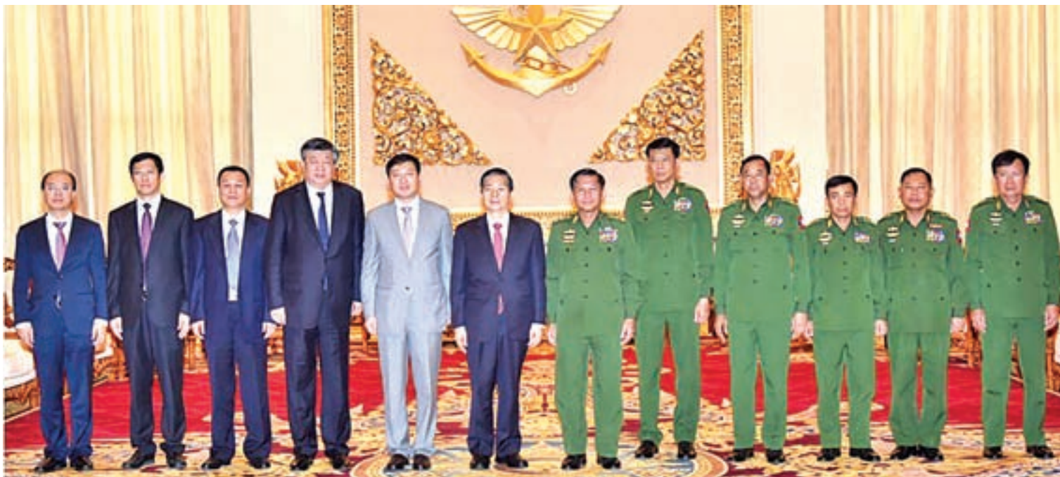
Senior General Min Aung Hlaing, Chinese Public Security Minister and officials posing for a group photo.

At the meeting the two representatives discussed matters related to fighting against narcotic drug production and trafficking, prevention of terrorism, prevention of illegal business in border areas damaging environmental conservation and bilateral cooperation including exchange of information for security and the rule of law for both countries. — Myanmar News Agency