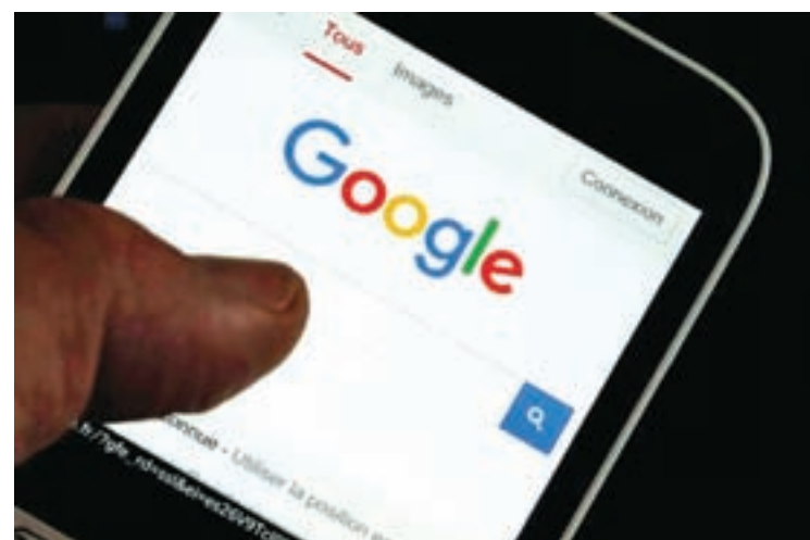
A man holds his smartphone which displays the Google home page, in this picture illustration taken in Bordeaux, Southwestern France, on 22 August, 2016.

South Korea, colonized by Japan from 1910-1945, has raised concerns over Japan's move to amend its Constitution, with the particular source of concern being Article 9, which "renounces" Japan's right to wage war.—Kyodo News