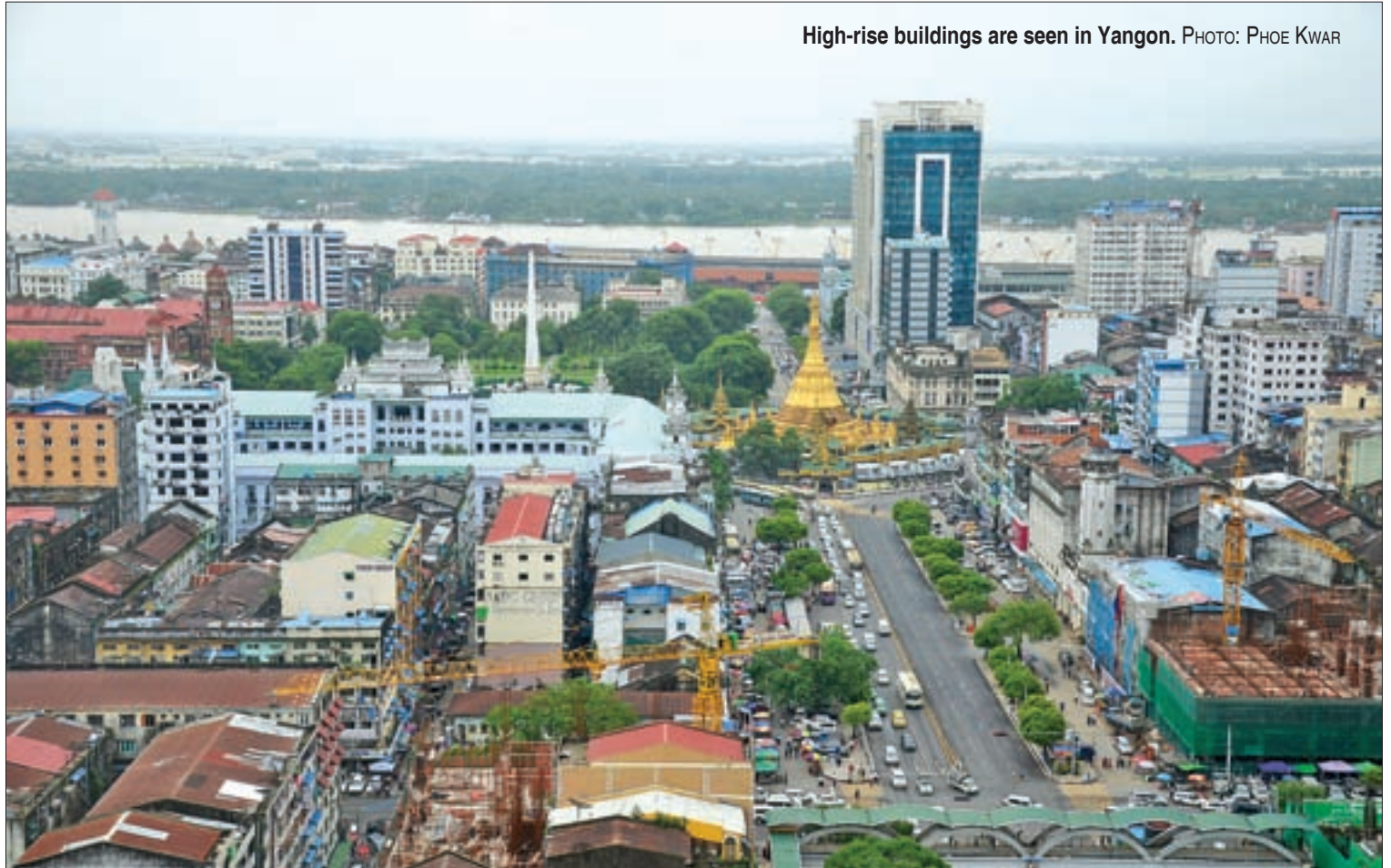
High-rise buildings are seen in Yangon.

Any building construction in Yangon will have to be in compliance with the zoning law after it is approved by the Yangon Regional Hluttaw.—200