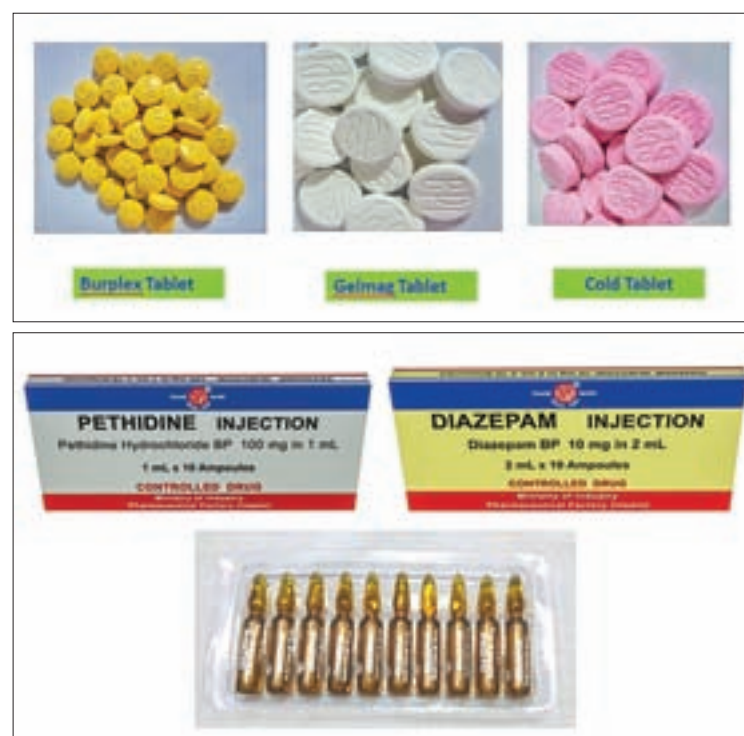
Tablets and injections produced by MPF.

The seizure of the fake drugs and materials amounted to K2.807 billion and 14 suspects that include seven possible sellers and distributors, four manufacturers, two fake label makers and one person who stored expired medicines were arrested, said officials. The seized fake and expired drugs will be destroyed in the presence of the media, added the officials.— Myanmar News Agency