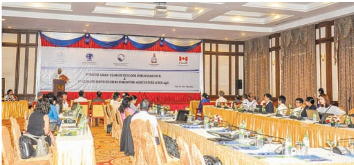
The Climate Outlook Forum and Climate Services Users Forum for Agriculture in progress.

THE ninth South Asian Climate Outlook Forum (SASCOF 9) was held in conjunction with Climate Services Users Forum for Agriculture (CSUF-Ag2) in Nay Pyi Taw yesterday, with an opening address by Deputy Minister for Transport and Communications U Kyaw Myo.