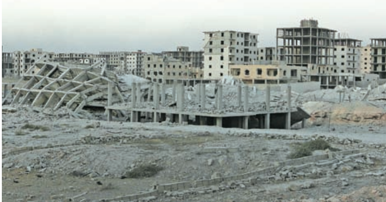
Damaged buildings are seen in the 1070 Apartment Project area in southwestern Aleppo, Syria on 5 August.