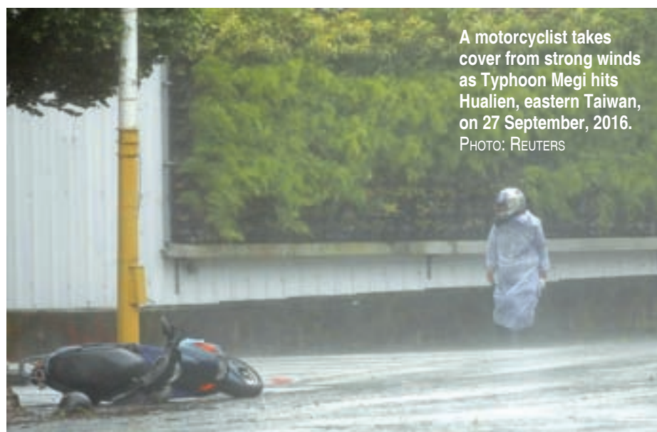
A motorcyclist takes cover from strong winds as Typhoon Megi hits Hualien, eastern Taiwan, on 27 September, 2016.

Television footage showed people, who ig-