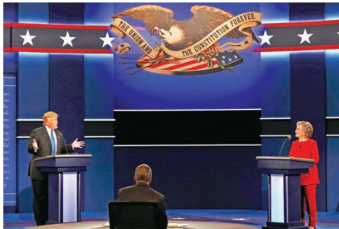
Republican US presidential nominee Donald Trump speaks as Democratic US presidential nominee Hillary Clinton listens during their first presidential debate at Hofstra University in Hempstead, New York, US, on 26 September, 2016.

Trump suggested her disavowal of a trade deal with Asian countries was insincere. Her handling of a nuclear deal with Iran and Islamic State militancy were disasters, he argued. Trump said Clinton had spent her "entire adult life" fighting the Islamic State, a group that has existed for less than a decade. —Reuters