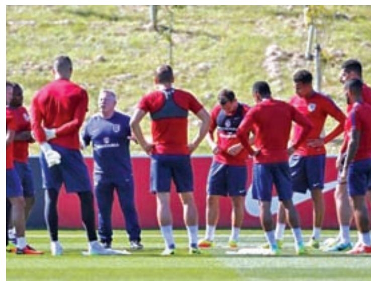
England assistant manager Sammy Lee talks to the players during training at St. George's Park, on 30 August 2016.

"My analogy is this: would people who invest in vineyards and orchards not make wine or pick the fruit?—Reuters