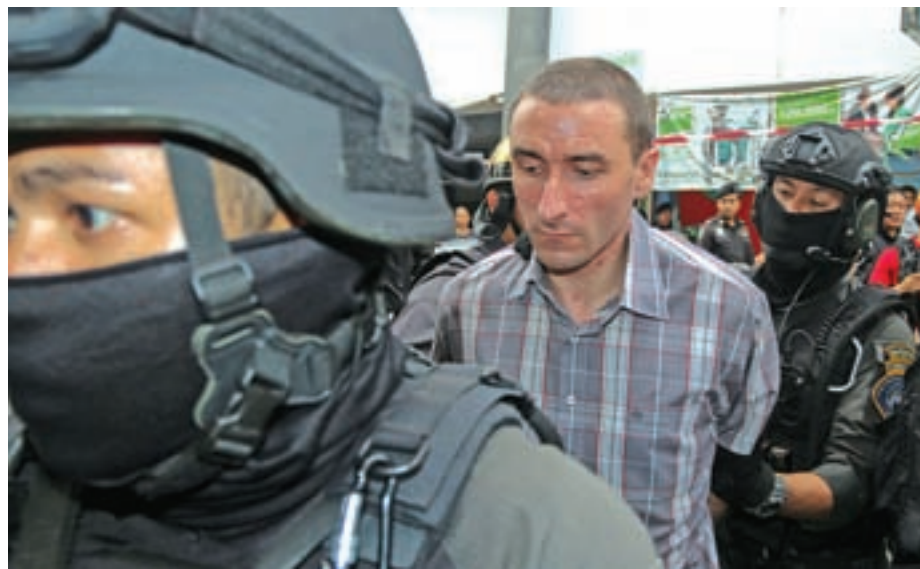
A foreign member of a suspected passport forgery gang is escorted by police officers after a raid in Bangkok, Thailand, on 23 September 2016.

BANGKOK — Three foreign members of a suspected passport forgery gang charged with concealing a dead body in a freezer are Americans, police said on Tuesday.