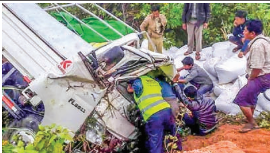
Somnidriving plunges car into a roadside ditch: A car plunged into a roadside ditch when one Kyaw Win Thin, 25, drove in sleep. The car was en route from Mandalay to Muse. The accident took place just beyond an OHC toll gate near Mile Post 8/0 on Myoshaung Lan in Lashio. The driver is from Taungtha Township.