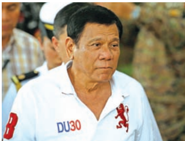
Philippine President Rodrigo Duterte arrives at the military's Camp Tecson to talk to soldiers in San Miguel, Bulacan in northern Philippines on 15 September 2016.

An arbitration court in The Hague in July invalidated Chi-