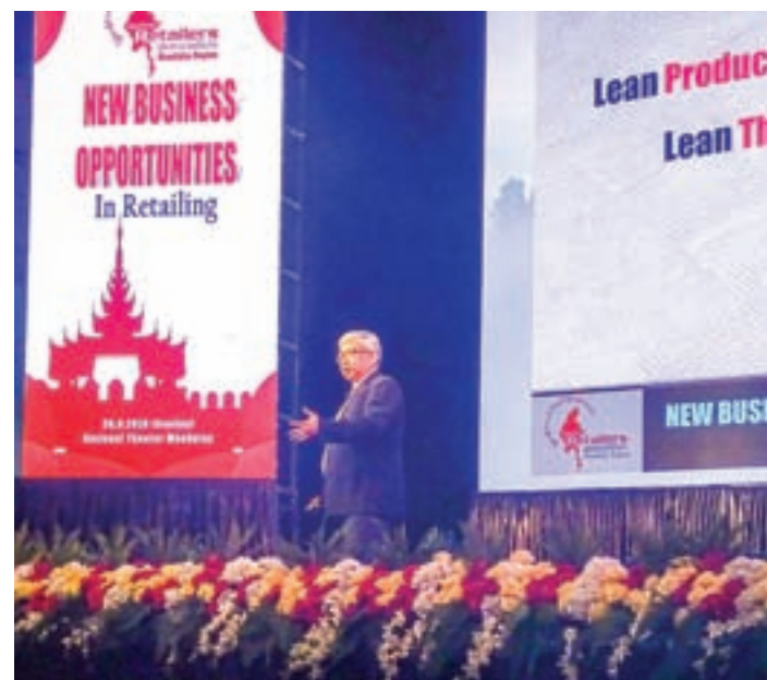
Myanmar Retailer Association of Mandalay annual meeting and economics talk in progress.