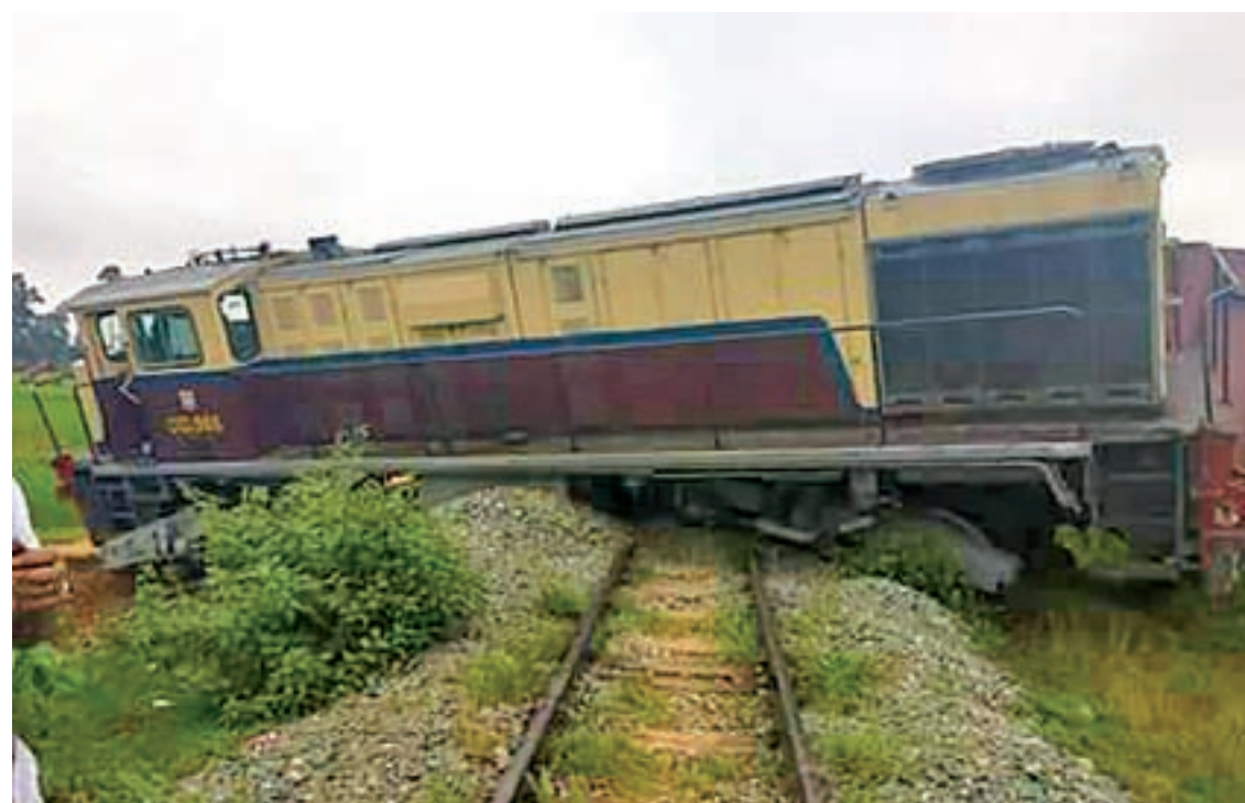
The cargo train being seen after derailment.

Engineers are investigating the accident to determine the cause of the accident.— Maung Chit Lin