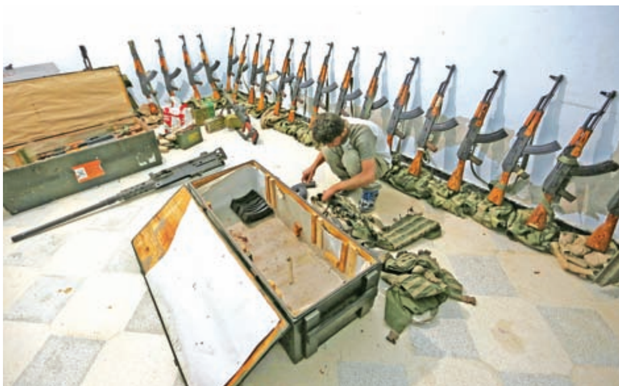
A rebel fighter of 'Al-Sultan Murad' brigade arranges weapons inside a warehouse in the northern Syrian rebel-controlled town of al-Rai, in Aleppo Governorate, Syria, on 26 September 2016.

On Monday, medical supplies were running out in rebel-held eastern Aleppo, with victims pouring into barely functioning hospitals as Russia and its Syrian ally President Bashar al-Assad ignored Western pleas to stop the bombing.