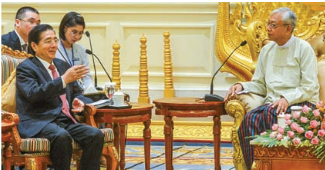
President U Htin Kyaw holds talks with Chinese Public Security Minister Mr Guo Shenkun.

Mr Guo Shenkun also conveyed the message of Chinese President Xi Jinping to President U Htin Kyaw to visit China. Also present at the meeting were Union Ministers Lt-Gen Kyaw Swe, Lt-Gen Sein Win and officials. — Myanmar News Agency