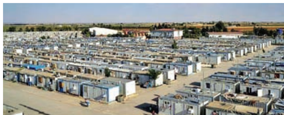
A general view of the Harran refugee camp is seen in the Sanliurfa province, Turkey, on 6 June 2016.

More than a million migrants entered the European Union after crossing from Turkey to Greece by boat last year. Since Turkey agreed to