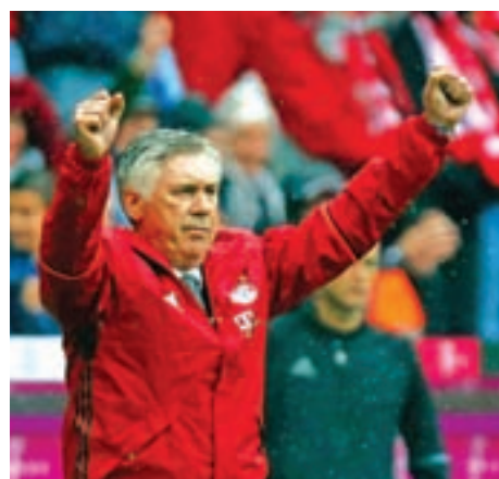
Bayern Munich's coach Carlo Ancelotti.

"The base has been here since the team won the triple (Bundesliga, German Cup and Champions League in 2013)," Alonso said, "There's a very important nucleus in the team and everyone who comes to the team works alongside that core.—Reuters