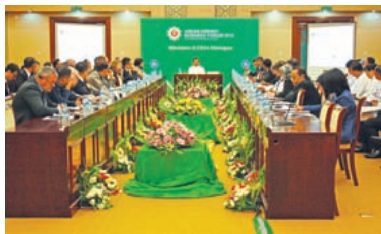
ASEAN Energy Business Forum 2016 in progress.

“Developing a more balanced and reliable energy mix is crucial for Myanmar’s socio-economic development and we see a lot of potential for coal’s ability to improve the country’s energy