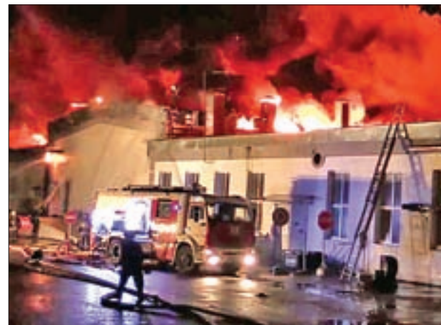
A still image, taken from video footage and released by the Russian Emergencies Ministry on 23 September 2016, shows a warehouse containing plastic materials on fire in Moscow, Russia.

The fire was extinguished at 05:23 pm local time (1323 GMT) on Thursday, according to the ministry.—Xinhua