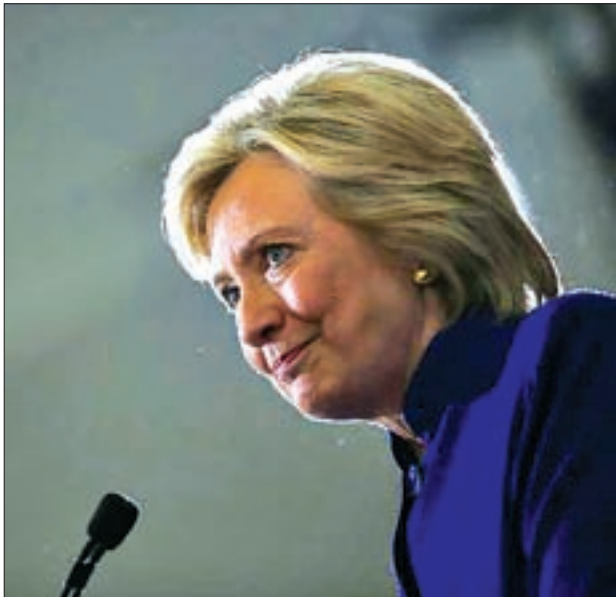
US Democratic presidential candidate Hillary Clinton speaks during a campaign event at the Frontline Outreach and Youth Center in Orlando, US, on 21 September 2016.

Republican presidential nominee Donald Trump, a wealthy real estate developer, wants to eliminate the estate tax. Clinton’s proposal prompted criticism from conservatives ahead of her first debate with Trump on Monday night at Hofstra University in Hempstead, New York.—Reuters