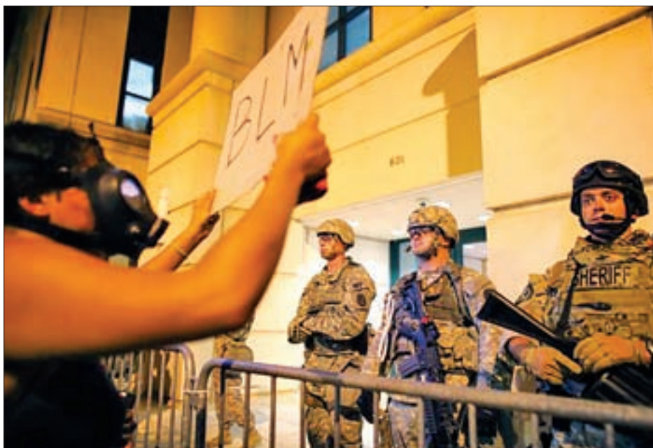
A protester holds up a sign towards US military personnel at the police station during another night of protests over the police shooting of Keith Scott in Charlotte, North Carolina, US, on 22 September 2016.

A protester shot on Wednesday died on Thurs-