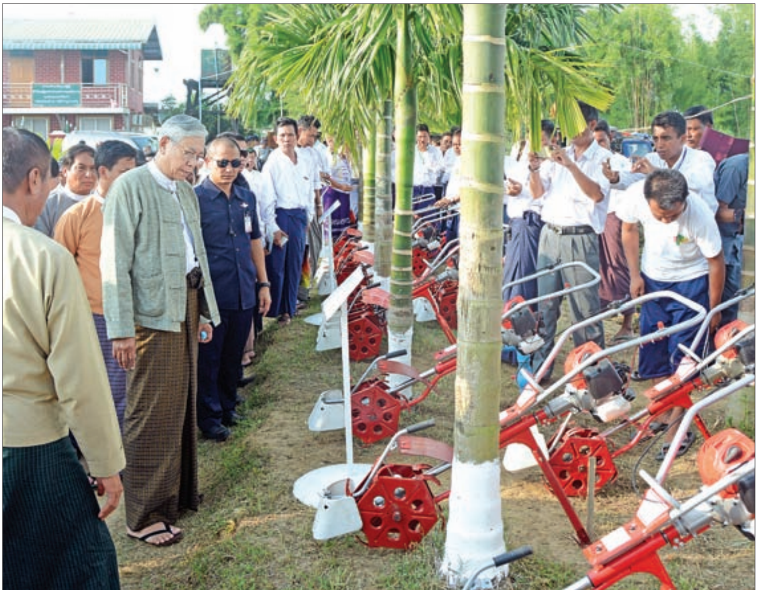
President U Htin Kyaw inspects farming implements during his visit to the 200-acre integrated farm in Toungoo.

After the meeting, the President observed SRI-oriented model farmlands and farming implements.— Myanmar News Agency