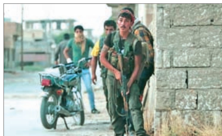
Kurdish fighters from the People's Protection Units (YPG) carry their weapons as they take positions in the northeastern city of Hasaka, Syria, on 20 August 2016.

Kilis was struck on Thursday by three rockets, fired from Islamic State-controlled territory in Syria,