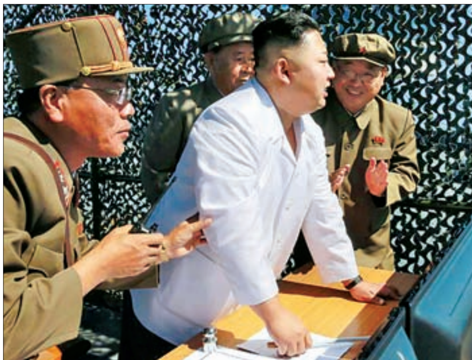
North Korean leader Kim Jung Un supervises a demonstration of a new rocket engine for the geo-stationary satellite at the Sohae Space Centre in this undated photo released by North Korea's Korean Central News Agency (KCNA) in Pyongyang, on 20 September 2016.

ridiculing the authority of the General Assembly and the Security Council,” he said.