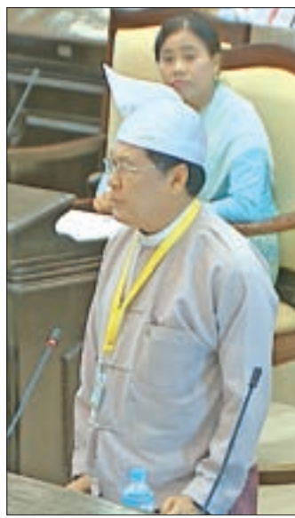
U Thein Swe. PHOTO: MNA