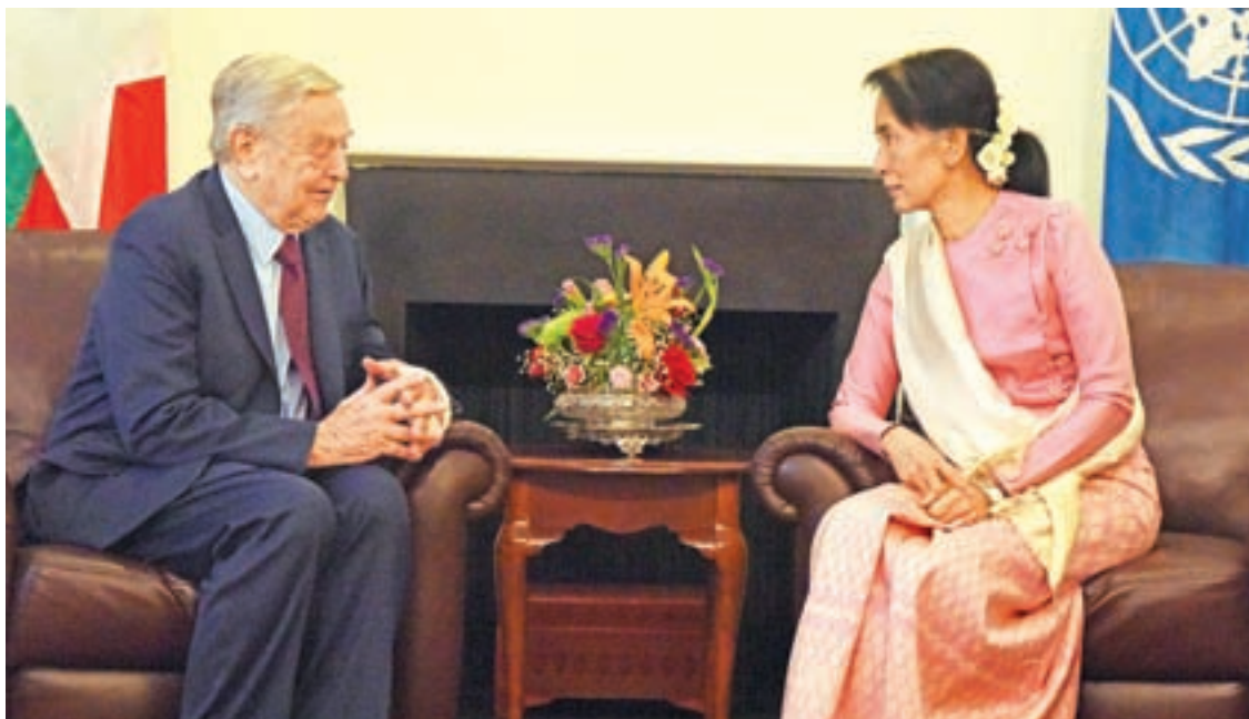
State Counsellor Daw Aung San Suu Kyi holds talks with Mr George Soros, Founder and Chairman of the Open Society Foundation.

The State Counsellor gave an interview to CNN's Fareed Zakaria, GPS Editorial Producer, in New York, on Thursday.— Myanmar News Agency