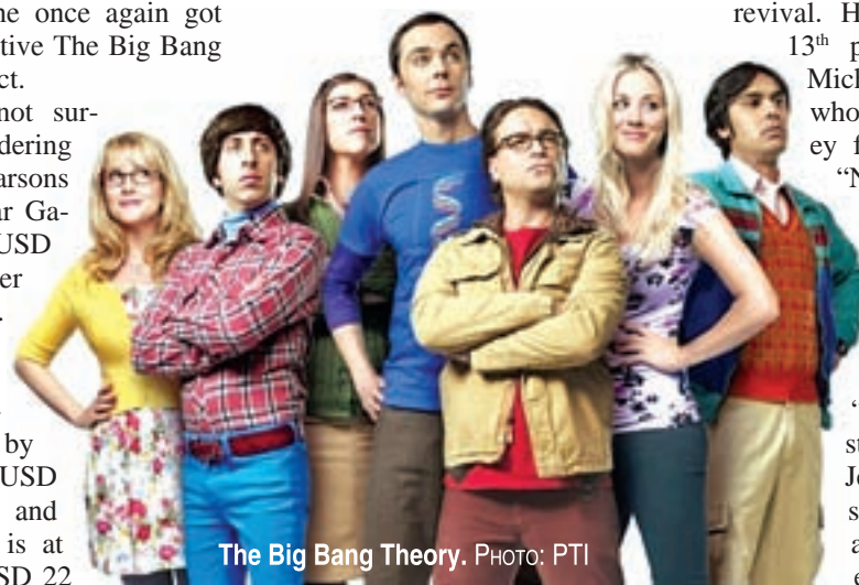
The Big Bang Theory.

revival. He is tied in the 13 th place along with Michael Weatherly, who earned the money from his stint on “NCIS”. He recently left the show to headline a new CBS series, “Bull”. Other names in the top 15 include “Modern Family” stars Ty Burrell, Jesse Tyler Ferguson, Ed O’Neill and Eric Stonestreet.— PTI