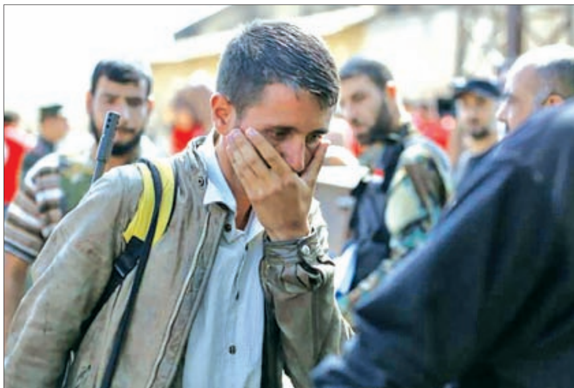
A rebel fighter reacts while walking next to Syrian Army soldiers prior to evacuating the besieged Waer district in the central Syrian city of Homs, after a local agreement reached between rebels and Syria's army, Syria, on 22 September 2016.

nounced the new offensive and quoted the army's military headquarters in Aleppo urging civilians in eastern parts of the city to avoid areas where "terrorists" were located and said it had prepared exit points for those who want to flee, including rebels.