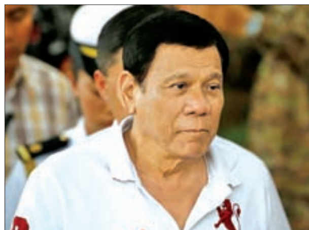
Philippine President Rodrigo Duterte arrives at the military's Camp Tecson to talk to soldiers in San Miguel, Bulacan in northern Philippines, on 15 September 2016.

Philippine relations with Japan are warm but those with China have long been frosty over territorial wrangles in the South China Sea. Duterte has repeatedly said conflict was pointless and he wants to get along and do business with Beijing. Some analysts believe Duterte’s uncharacteristic verbal restraint towards China, in contrast to his stinging