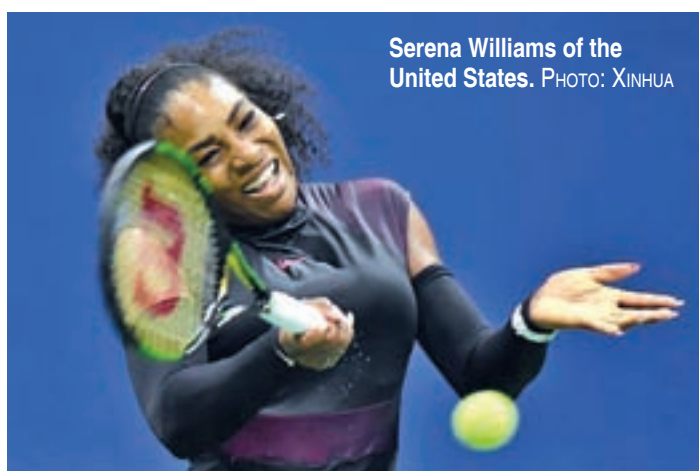
Serena Williams of the United States.

tournaments this year, the fewest she has played in a season since returning from injury in 2011. She has won two titles out of Rome and Wimbledon and finished as runner-up three times, losing to Angelique Kerber at the Australian Open, to Victoria Azarenka at Indian Wells and to Garbine Muguruza at Roland Garros.