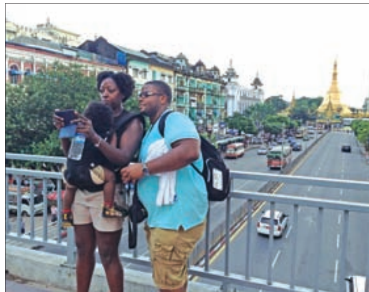
A tourist family seen in downtown Yangon.

Under the existing law, anyone who carries out the travel services without permission from the Ministry of Hotels and Tourism shall face up to a K50,000 fine or a three-year jail term or both.