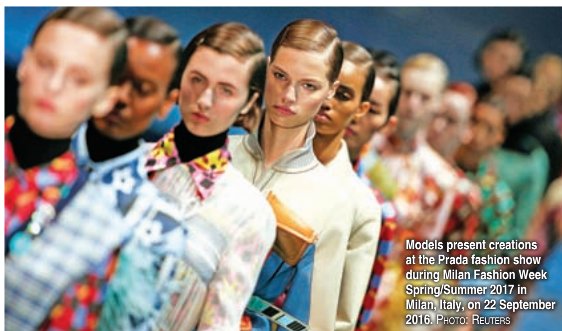
Models present creations at the Prada fashion show during Milan Fashion Week Spring/Summer 2017 in Milan, Italy, on 22 September 2016.

Prada has said it is now trying to turn itself around by putting out more accessible products and slimming down its extensive retail network. Milan fashion week continues until Monday. Karl Lagerfeld’s collection for Fendi and creations from Moschino were also on show on Thursday.— Reuters