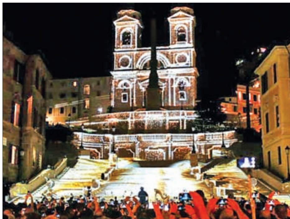
People take picture during a ceremony to mark the restoration of Rome's famed Spanish Steps in Rome, Italy, on 22 September, 2016.