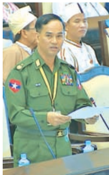
Maj-Gen Aung Soe.

In connection with the handover of the ancient objects, Deputy Minister Maj-Gen Aung Soe said 13 Rakhine ancient silver coins were transferred to the National Museum in Nay Pyi Taw; a Japanese sword is being kept at the Department of Archaeological Research and National Museum in Sittwe; a pair of gold earrings, a gold hand chain and foreign currency is being kept at the Central Bank of Myanmar and five plots of land have been confiscated as public revenue.— Myanmar News Agency