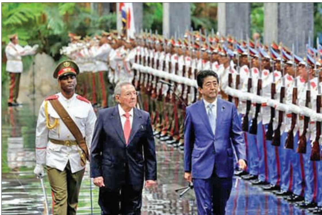
Cuba's President Raul Castro (C) and Japan's Prime Minister Shinzo Abe (R) review the honour guard during an official reception ceremony at Havana's Revolution Palace, Cuba, on 22 September 2016.

sumption of diplomatic relations between Cuba and the United States last year following a 54-year freeze has prompted other countries to boost relations with Havana.