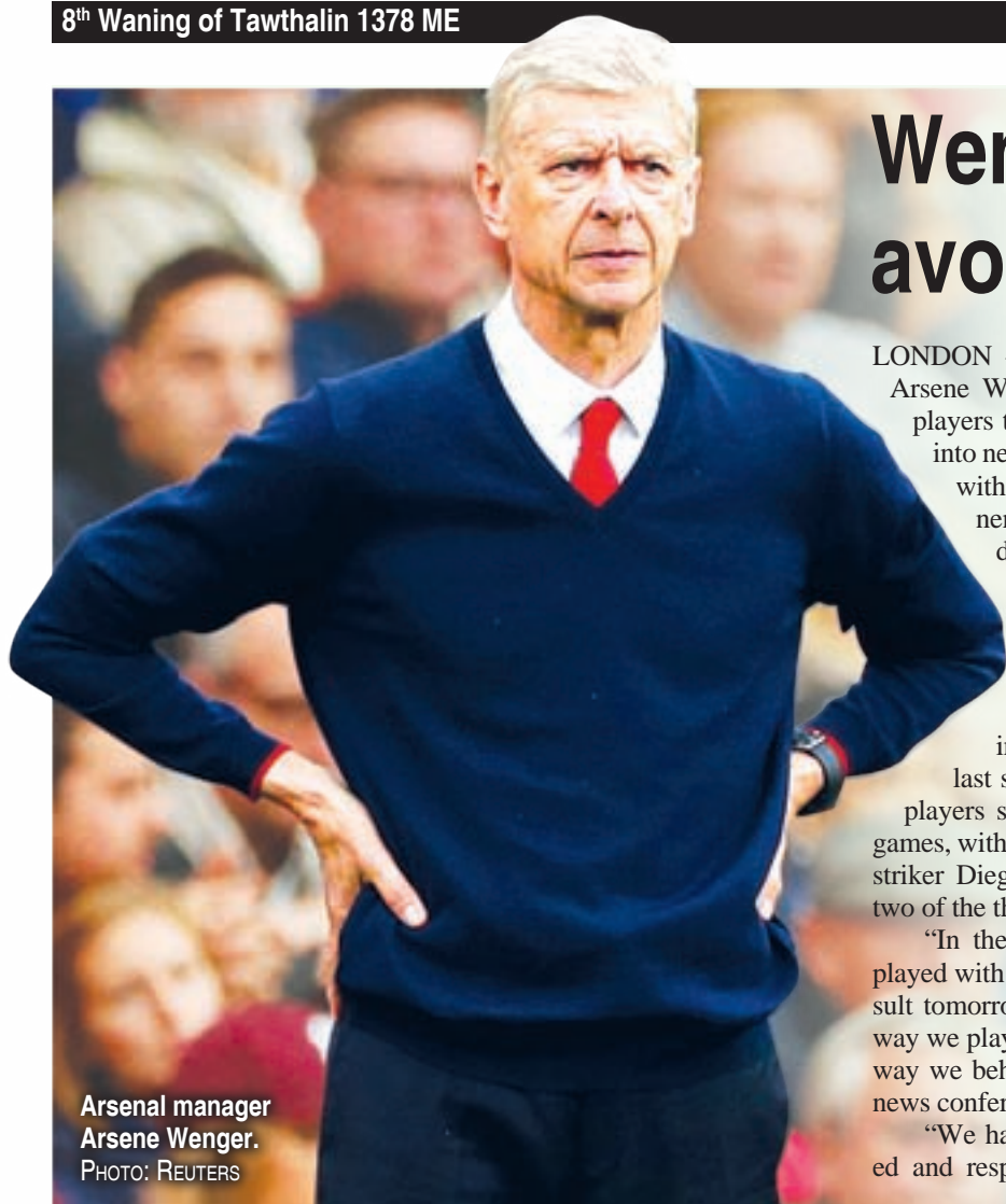
Arsenal manager Arsene Wenger.