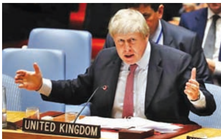
British Foreign Secretary Boris Johnson speaks at a meeting of the United Nations Security Council to address the situation in the Middle East during the General Assembly for the 71st session of the UN General Assembly at UN headquarters in New York, US, on 21 September 2016.

"You invoke Article 50 in the early part of next year. You have two years to pull it off. I don't actu-