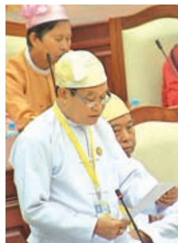
Dr Myint Htway. PHOTO: MNA