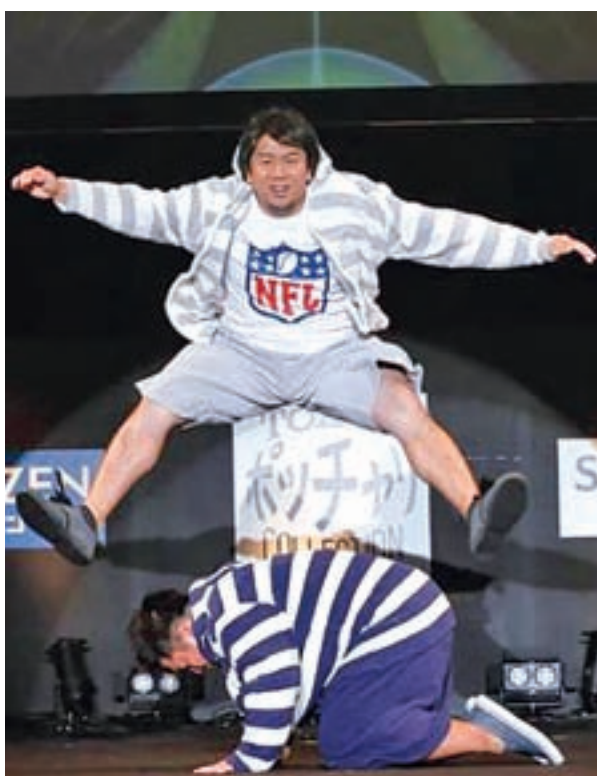
Models pose on the runway during Tokyo Pochari collection, Japan's first fashion show for plump men in Tokyo.

Thursday's event attracted more than 100 people, who were invited to disclose their weight for a discount on a new range of ready-to-wear plus size clothing items, but organisers said the