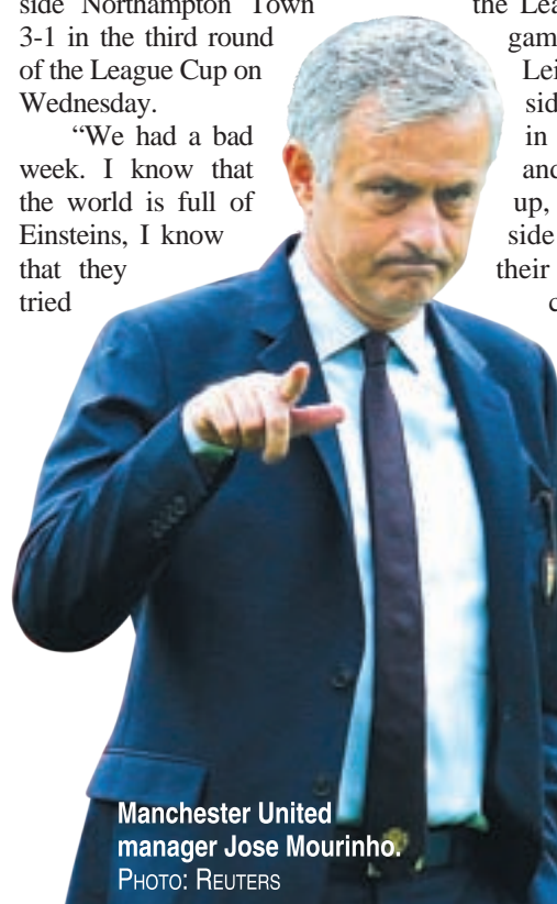
Manchester United manager Jose Mourinho.

"If the fans have been disappointed with the last week, I understand completely but I am sure they will be behind the team like they always are." —Reuters