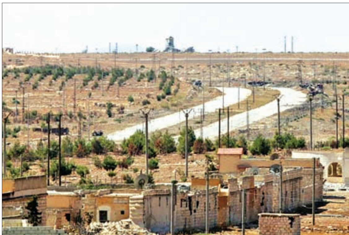
A general view shows Castello road in Aleppo, Syria, on 16 September 2016.