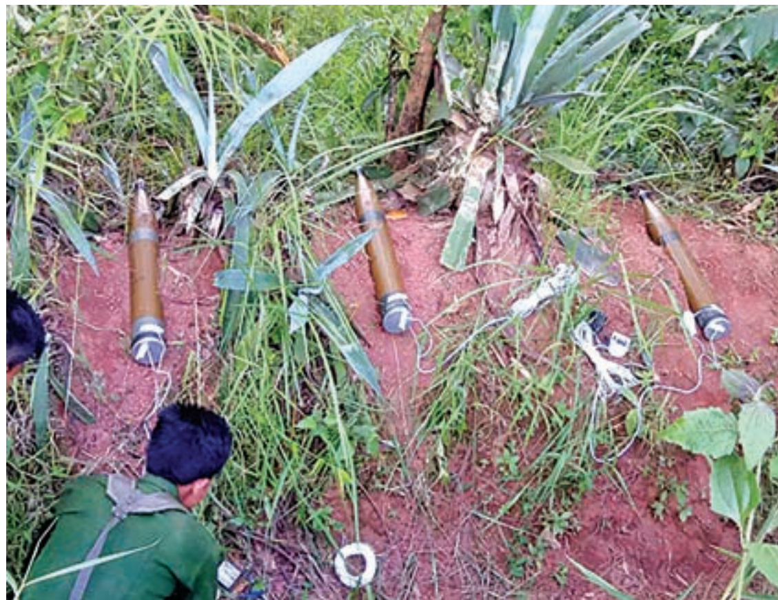
The 107 mm rocket launchers seen.

Local security troops are patrolling the area.—Myawady