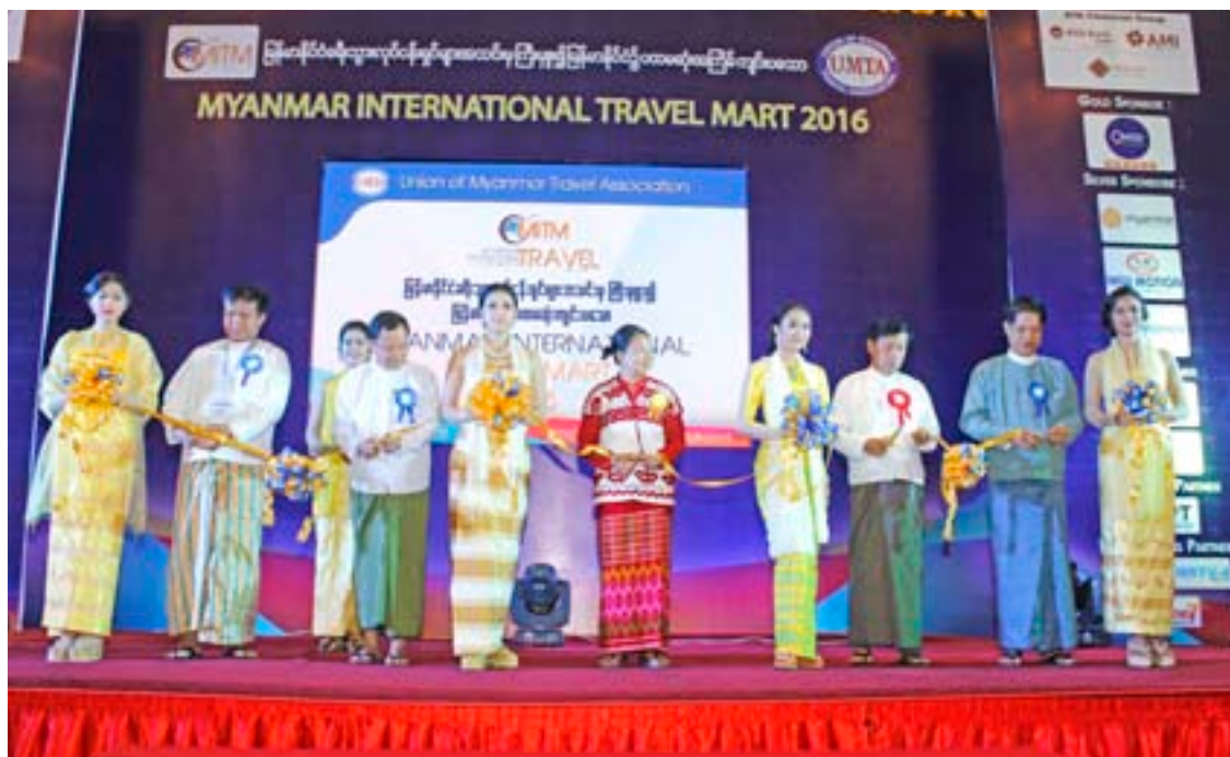
Opening ceremony of Myanmar International Travel Mart 2016 being formally opened.