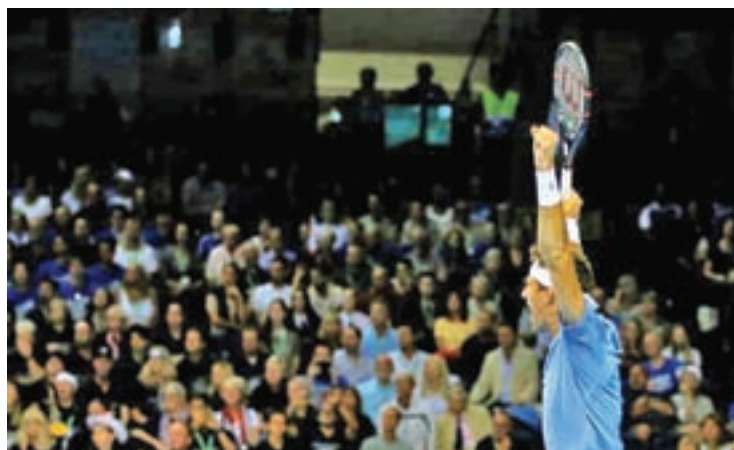
Argentina's Juan Martin del Potro celebrates after winning his match against Great Britain's Andy Murray during Davis Cup Semi Final at Emirates Arena, Glasgow, Scotland, on 16 September 2016.

was missing..." Britain's day went from bad to worse in Glasgow as Guido Pella then beat Kyle Edmund 6-7(5) 6-4, 6-3, 6-2 in the second singles. Friday's defeats mean the hosts have to win the three remaining rubbers if they are to reach the final for the second year running. — Reuters