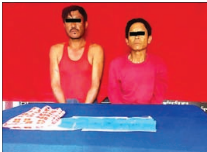
Criminal suspects seen together with the drugs seized.

And, police from Moemeik Myoma police station seized heroin weighing 58.2 grams from the home of one Daung Haung in Arr Than village, Moemeik town. Police have filed charg-