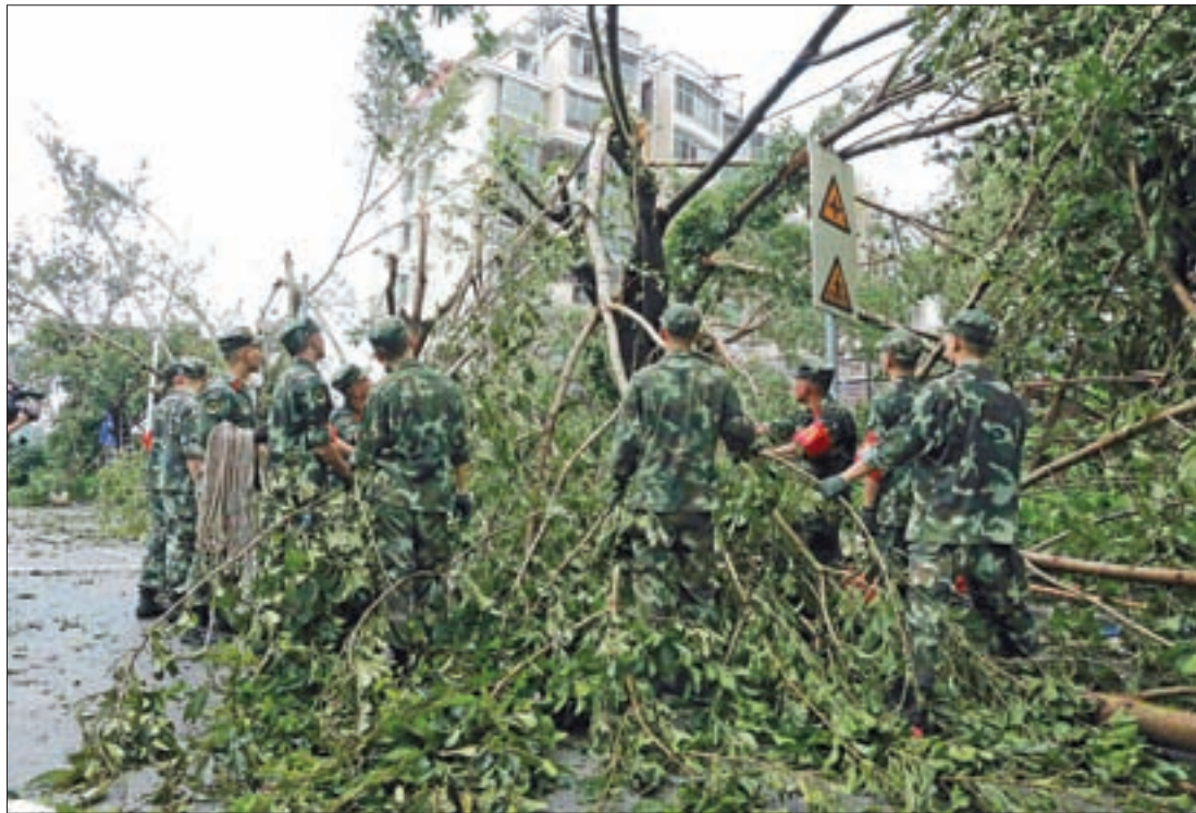
Paramilitary policemen remove toppled trees after Typhoon Meranti swept through Xiamen, Fujian province, China, on 15 September 2016.

Waves as high as 3.8 metres are likely in those coastal provinces and ships are advised to stay clear of the area, said China’s National Marine Envi-