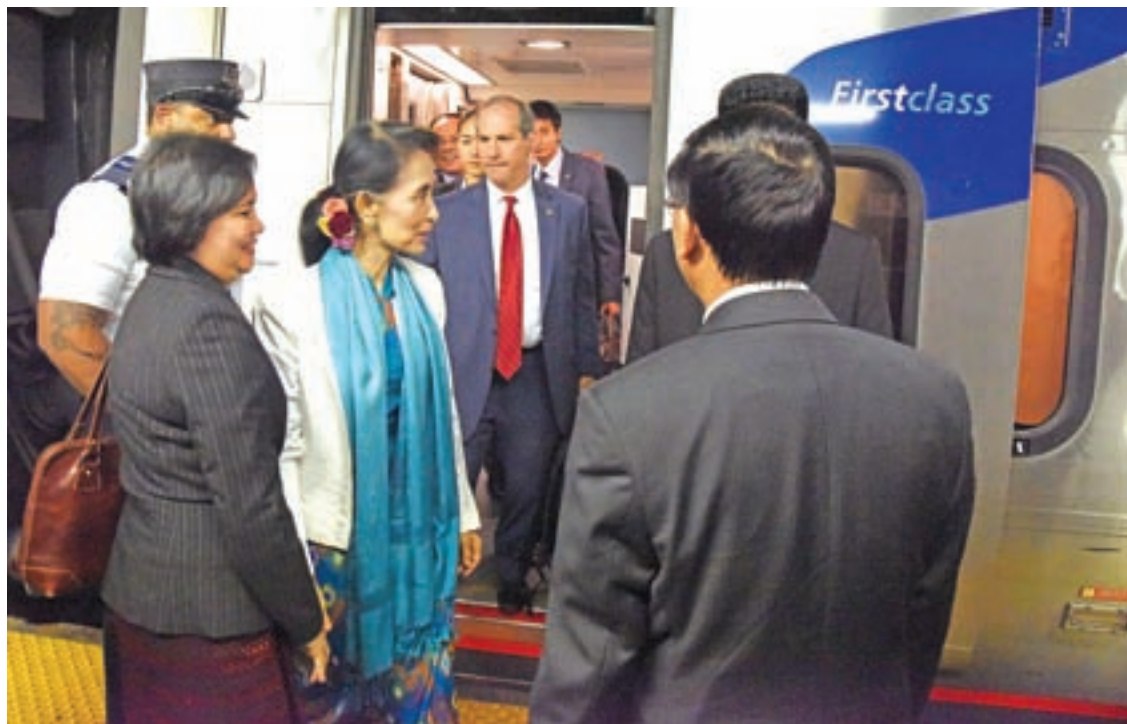
State Counsellor being welcomed upon arrival in New York.

STATE Counsellor Daw Aung San Suu Kyi arrived New York by train at 3.45pm after leaving Washington at 12.55pm, officials