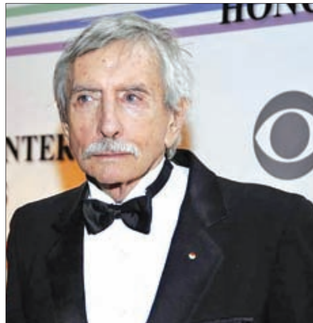
Edward Albee arrives on the red carpet for the Kennedy Center Honours at the Kennedy Center in Washington in 2010.

“Art should expand the boundaries of the form and, simultaneously, it should change our perceptions,” he told his biographer. “I despise restful art.”—Reuters