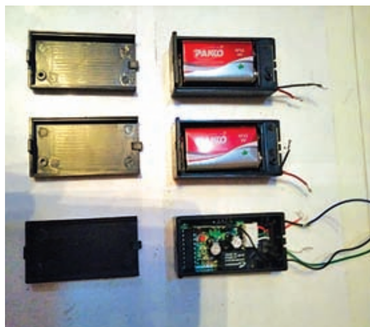
Time control devices linked to 207 mm launcher rockets.