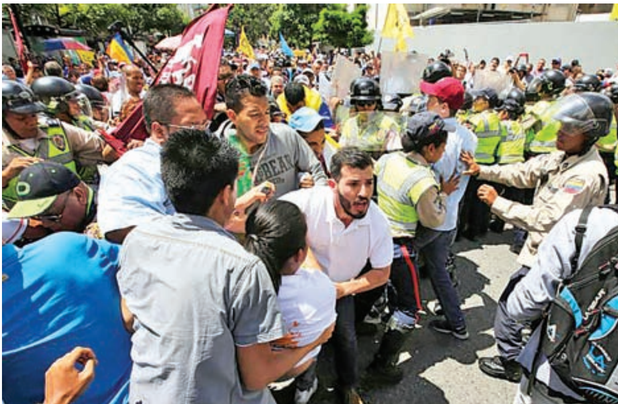
Supporters of Venezuela's opposition face police officers who are blocking a street, as they take part in a rally to demand a referendum to remove Venezuela's President Nicolas Maduro, in Caracas, Venezuela, on 16 September 2016.

The election board said a meeting to organise the next stage of the referendum process — the collection of 20 per cent of voter signatures, or about 4 million — was postponed to Monday because of