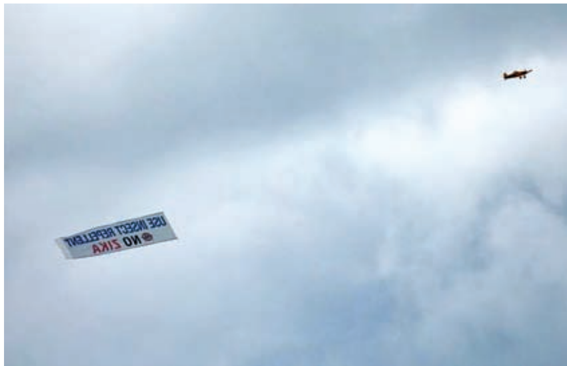
An airplane carrying a banner asking people to use insect repellent to avoid the Zika virus, flies over Miami, Florida, US, on 13 September 2016.

MIAMI — State officials in Florida on Friday tripled the active Zika transmission zone in the trendy seaside community of Miami Beach after five new cases of the mosquito-borne virus believed to cause a severe birth defect were identified in the area.