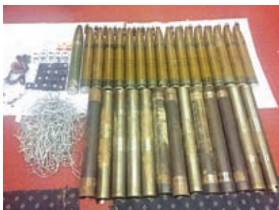
Ammunition seized.