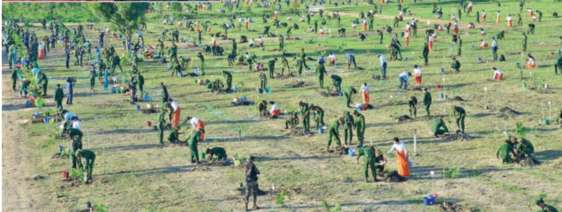
The tree planting ceremony in progress. PHOTO: MNA

Similar ceremonies took place at respective military commands the same day with the families of the commands planting 384,045 trees of various kinds.— Myanmar News Agency