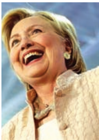
US Democratic presidential nominee Hillary Clinton holds a rally at John Marshall High School in Cleveland, Ohio, US, on 17 August 2016.

Overall, Americans appear to be relatively uninspired by their choices for president with less than eight weeks to go before the election. One out of every five likely voters said they do not support Clinton or Trump for president. In comparison, about one out of every 10 likely voters wouldn't support