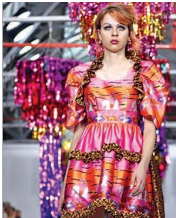
A model presents a creation at the Ryan Lo catwalk show during London Fashion Week Spring/Summer 2017 in London, Britain, on 16 September 2016.

While the September shows have usually been associated with solely womenswear, labels like Burberry will present collections both for women and men this fashion week. Burberry will also offer catwalk items immediately for purchase after its show.—Reuters