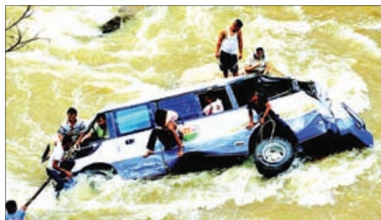
The vehicle seen plunged into the creek.

TWO passengers were killed after their vehicle dived into the Nam Lon creek near Sai Lay village, Mongphyat township, Shan (East) on