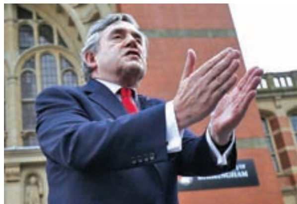
Former British Prime Minister Gordon Brown speaks at a rally at Birmingham University in Birmingham, Britain, on 22 June 2016.

a "ticking time-bomb of discontent" among young people deprived of education and opportunities which would leave them "prey to extremist factions determined to exploit their discontent".