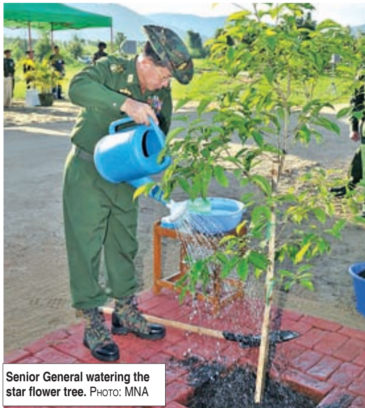
Senior General watering the star flower tree.