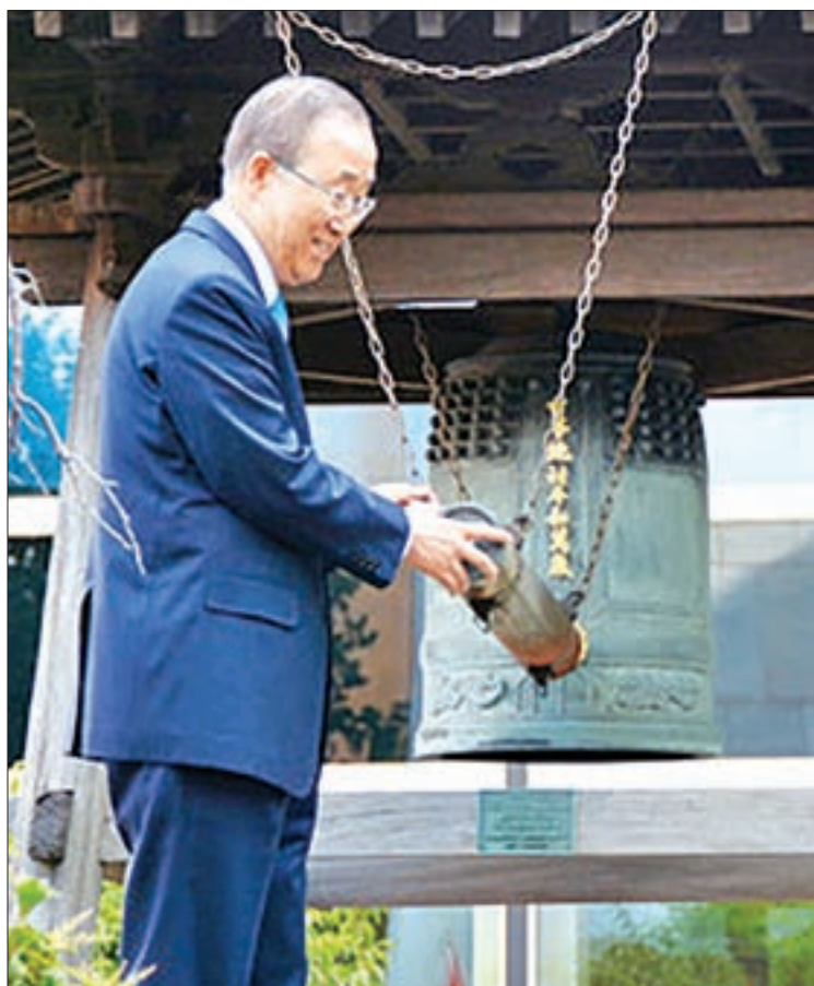
United Nations Secretary General Ban Ki-moon rings the peace bell at the UN headquarters in New York on 16 September 2016, five days before the International Day of Peace, during an event to seek peaceful solutions to conflicts around the world.

The 115-kilogram bell is cast with coins collected from more than 60 countries and a gold coin gifted by the bishop of Rome. —Kyodo News