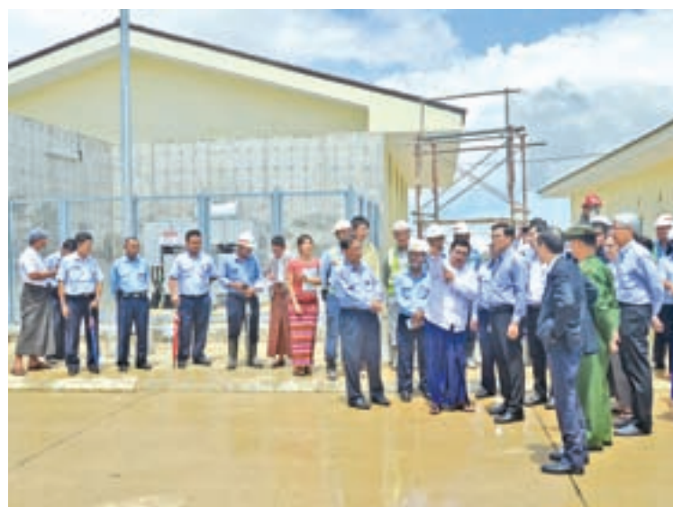
VP being briefed in Thilawa SEZ.

MYANMAR Special Economic Zone Central Body Chairman Vice President U Henry Van Thio went on an inspection tour of the Thilawa SEZ in Thanlyin township, Yangon, yesterday.