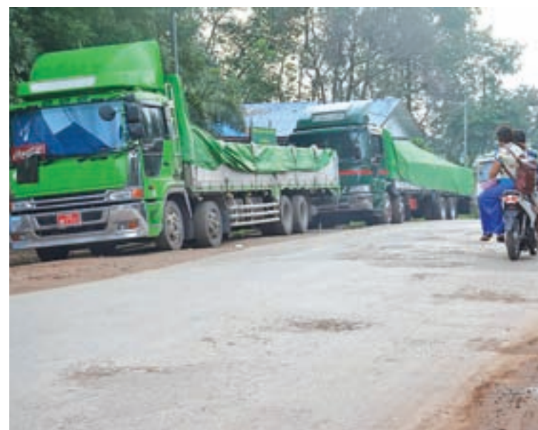
Container lorries being seen to be parked on the road.

Records show that 390 container lorries from across Myanmar entered into Mawlamyine during the rainy-season month of August alone, with over a thousand container lorries expected to park up in the Mon State capital during the coming dry seasons.—Myitmakha News Agency