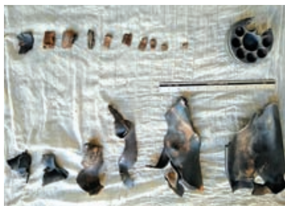
Scraps of rocket launchers.