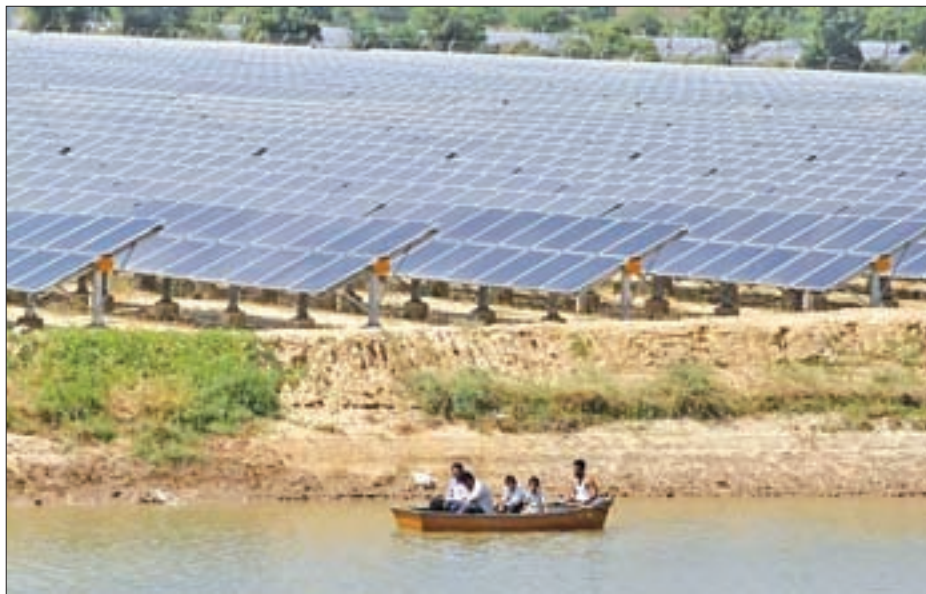
Security personnel sit in a boat as they patrol the premises of a newly inaugurated solar farm at Gunthawada village in Banaskantha District in Gujarat in 2011.

The appeal ruling came just days after India launched a WTO complaint against subsidies for the solar industry in eight US states.