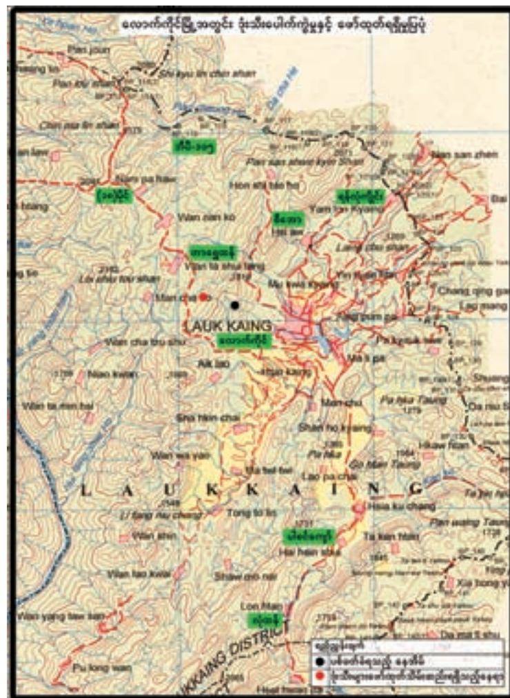
Map showing the location of explosion.