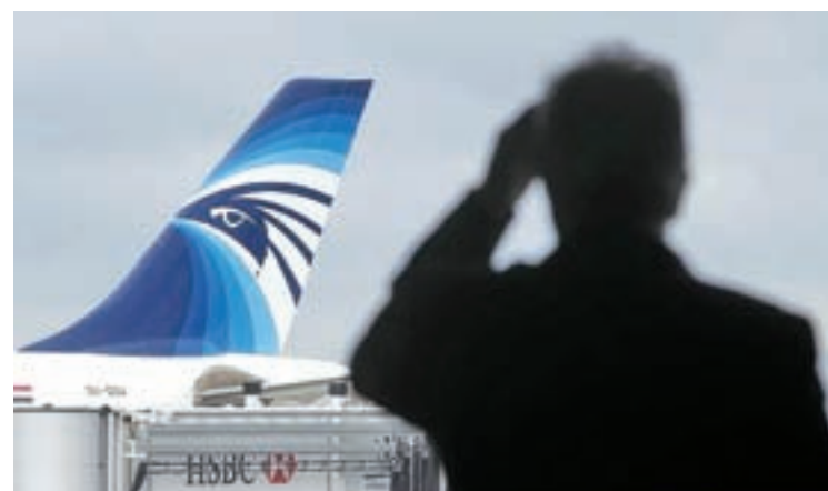
The EgyptAir plane scheduled to make the following flight from Paris to Cairo, after flight MS804 disappeared from radar, taxis on the tarmac at Charles de Gaulle airport in Paris, France, on 19 May 2016.

Earlier analysis of the plane's flight data recorder showed there had been smoke in the lavatory and avionics bay, while recovered wreckage from the jet's front section showed signs of high-temperature damage and soot.—Reuters