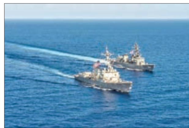
Arleigh Burke-class guided-missile destroyer USS Mustin (DDG 89) transits in formation with Japan Maritime Self-Defence Force ship JS Kirisame (DD 104) during bilateral training in South China Sea in 2015.

"Japan, for its part, will increase its engagement in the South China Sea through, for example, Maritime Self-Defence Force joint training cruises with the US Navy and bilateral and multilateral exercises with regional na-