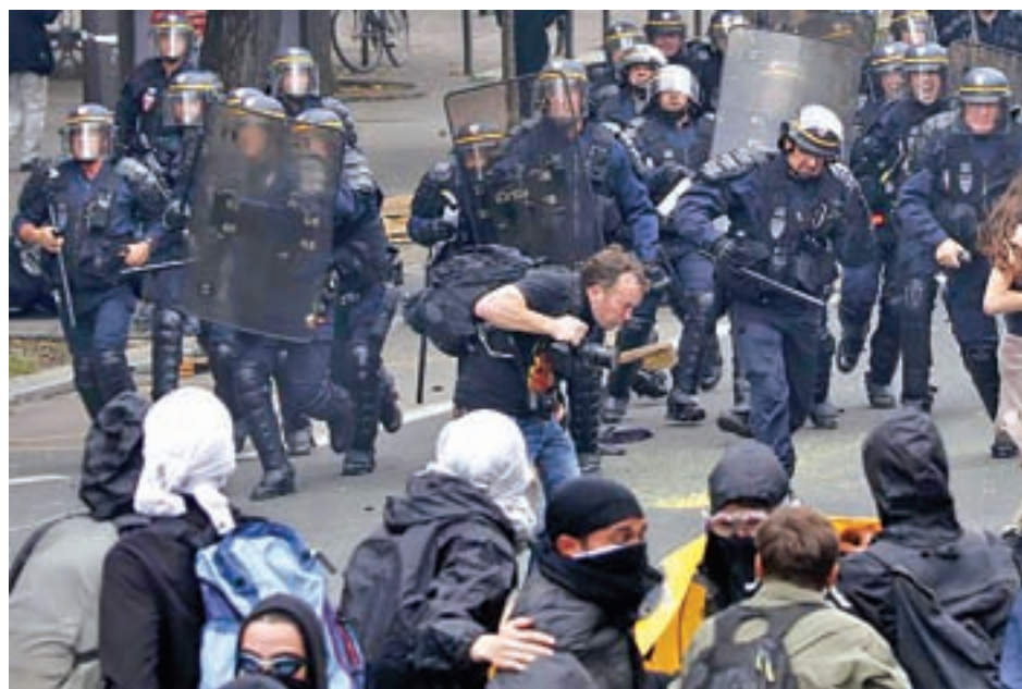
Demonstrators clash with French riot police during a march in Paris, France, to demonstrate against the new French labour law, on 15 September 2016.

Seven months from a presidential election, Mailly said that the unions would not let Socialist