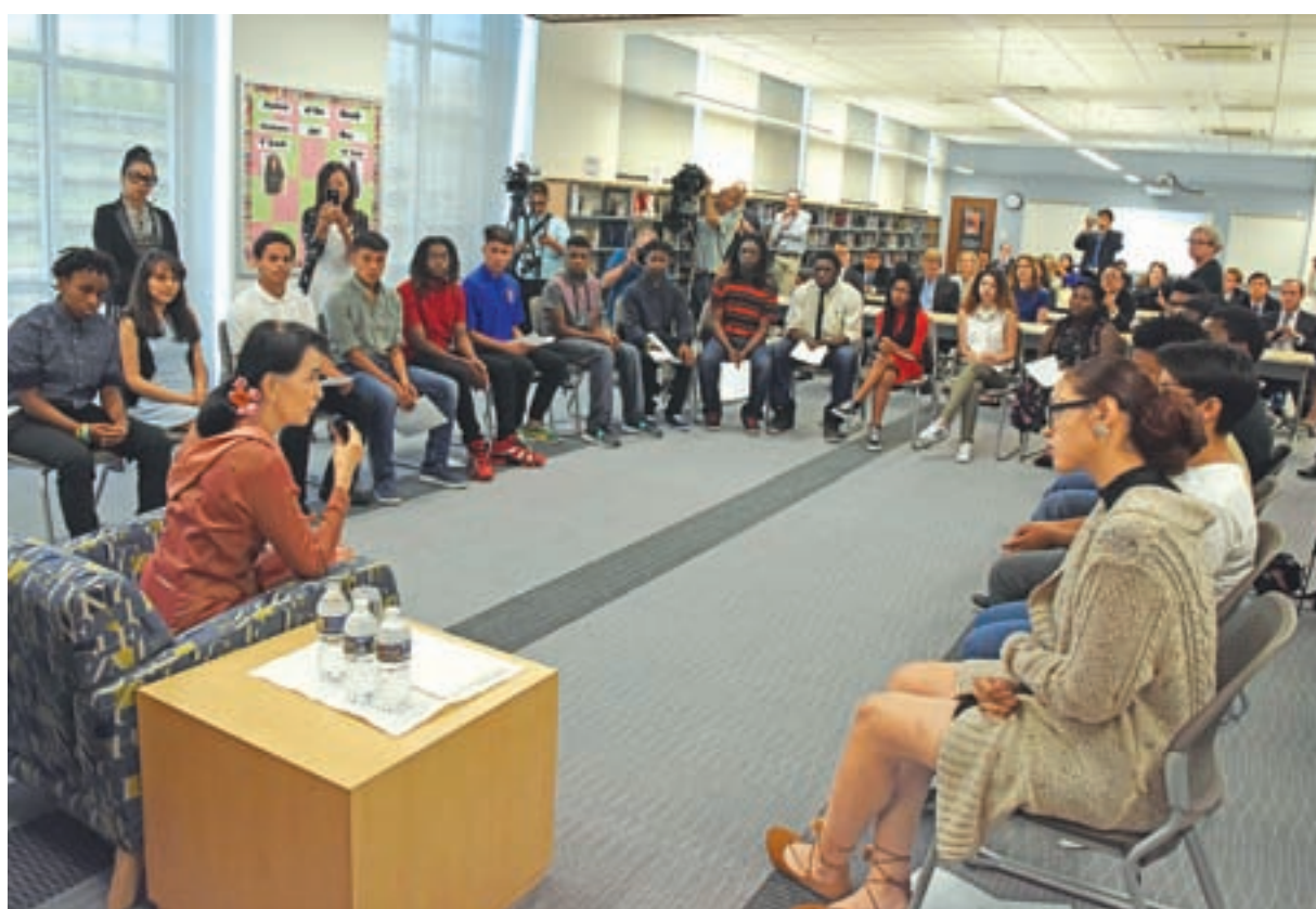
State Counsellor Daw Aung San Suu Kyi speaks to students in a round-table discussion on a visit to Roosevelt High School in Washington, US, 15 September 2016. PHOTO: MNA

Because of accommodation barriers, the training school can only accept around 40 students per course per year. Students with high marks top the priority lists for acceptance.— Myitmakha News Agency