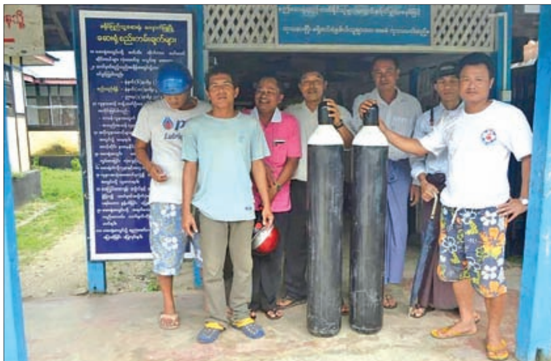
Donors seen together with Oxygen cylinders.