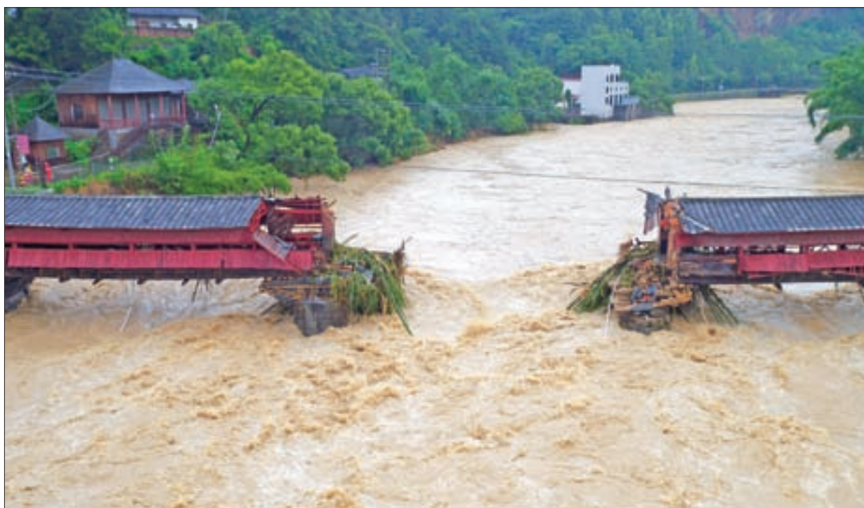
An ancient bridge is seen collapsed as typhoon Meranti hits southeast China, in Yongchun, Fujian Province, China, on 15 September 2016.

The typhoon killed one person and injured 38 on Taiwan where people