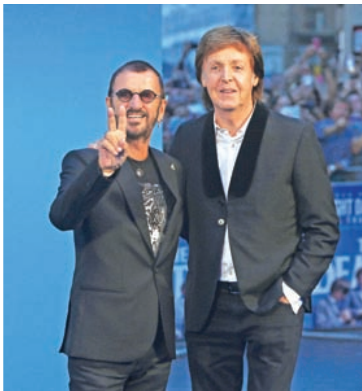
Former Beatles Ringo Starr (L) and Paul McCartney attend the world premiere of 'The Beatles: Eight Days a Week - The Touring Years' in London, Britain, on 15 September 2016.

"We started off as four mates in a great little band and we kept playing and playing and all this stuff happened," McCartney said.