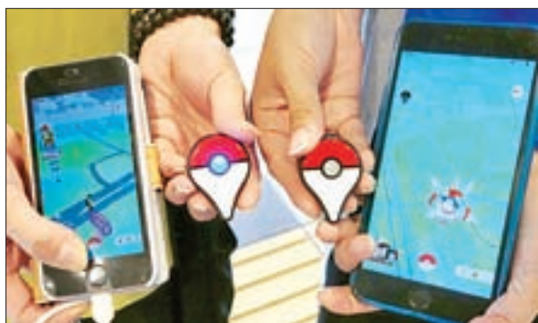
People hold up the Pokemon Go Plus wearable accessory (C) for the hit augmented reality smartphone game in the western Japan city of Osaka, on 16 September 2016, when sales started in Japan. The accessory vibrates and lights up when a “Pokemon Go” virtual creature is nearby, freeing players of the need to stare at their smartphone screens.

Pokemon Go Plus, a small device made by Nintendo Co. which users can wear on their wrists, will notify Pokemon Go players of the appearance of pokemons by flashing light and vibrations, freeing them from gazing at the game screen all the time.— Kyodo News