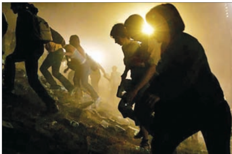
Revellers climb a steep slope to leave the Circus Maximus after watching a concert by British band Genesis in downtown Rome in 2007.