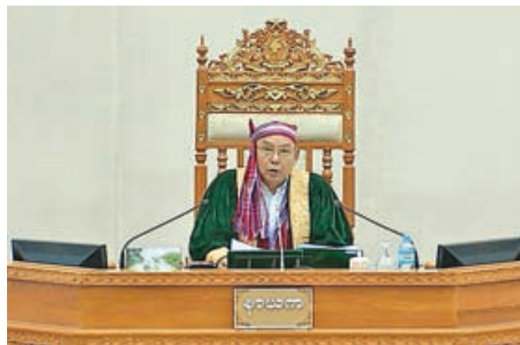
Pyidaungsu Hluttaw Speaker Mahn Win Khaing Than.

MPs also discussed loans to be taken from the Asian Development Bank and the French Development Agency.— Myanmar News Agency