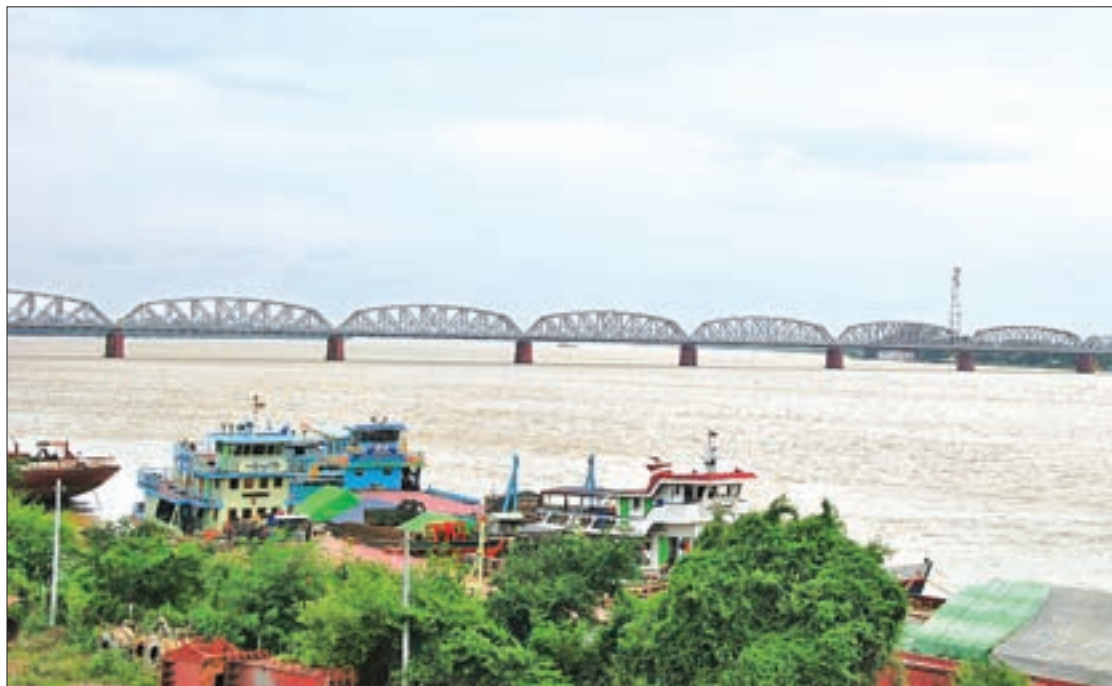
Ayeyawady Bridge (Yadanabon) being seen 1,000 ft away from the boats.