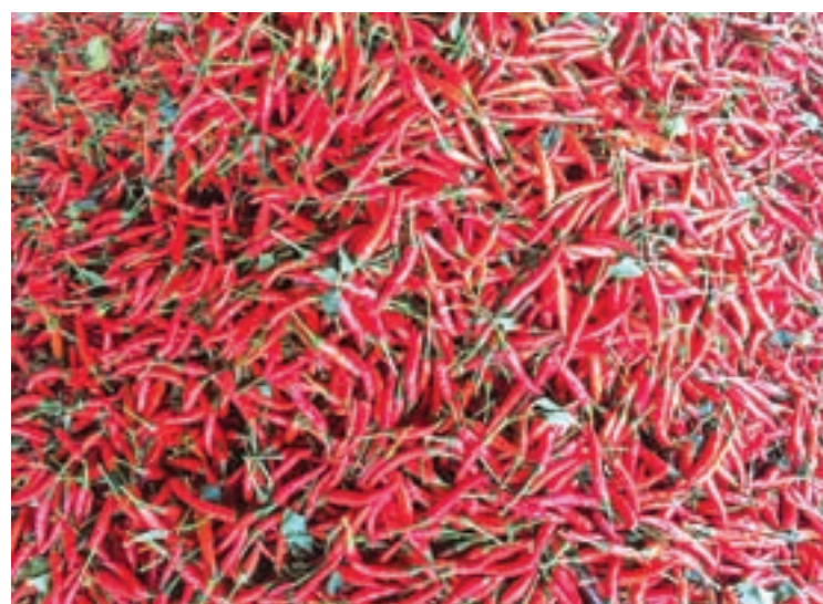
Myanmar's organic chillies.

Citing difficulties in educating each chili farmer on organic cultivation methods, the Pioneer Star Company began its operations small, partnering with a select-few regional farmers to experiment cultivation on a test plot of land. —Myitmakha News Agency