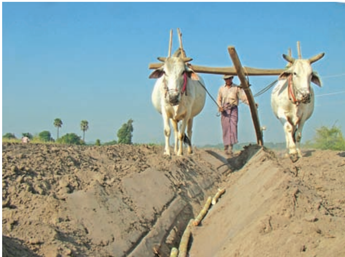
A farmer plants sugarcane traditionally at a farm near Nay Pyi Taw.

eyawady Bank. Sixty per cent of the shops are already sold out, officials added. Muse is situated in Northern Shan State on the Shweli River. This construction project is being jointly implemented by the Shan State government and New Starlight Company. The whole project comprises six zones, with zones one through three designated as commercial and zones four through six designated as residential. The project is being carried out on 294.789 acres of land.—200