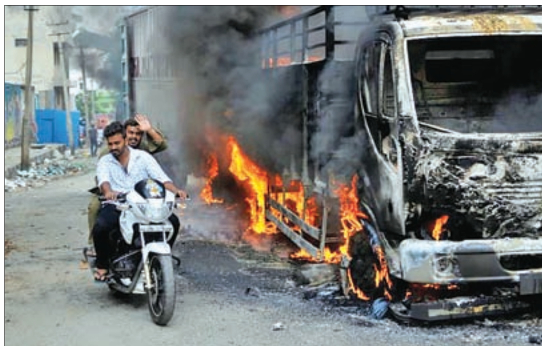
Men ride a motorcycle past a lorry in Bengaluru, which was set on fire by protesters after India's Supreme Court ordered Karnataka state to release 12,000 cubic feet of water per second every day from the Cauvery river to neighbouring Tamil Nadu, India, on 12 September 2016.