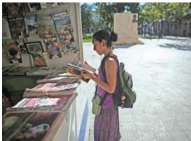
A woman buys a local magazine at a kiosk in Havana, Cuba, on 15 September 2016.

Jimenez says his grandfather worked as a guard for revolutionary icon Ernesto "Che" Guevara. He does not con-