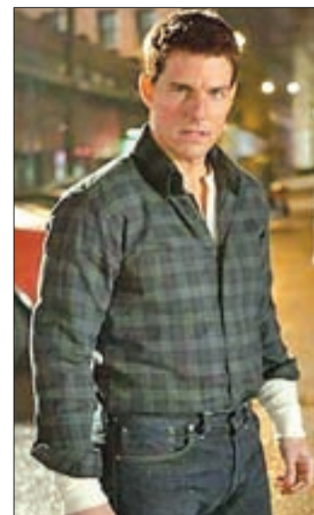
Tom Cruise.