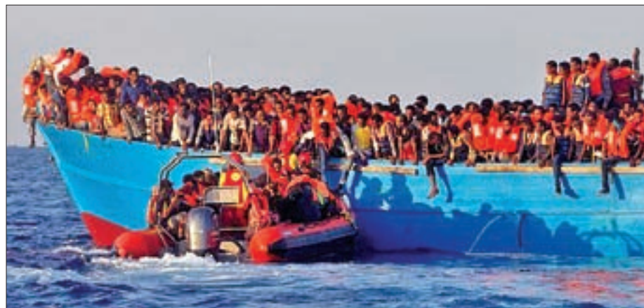
A rescue boat of the Spanish NGO Proactiva approaches an overcrowded wooden vessel with migrants from Eritrea, off the Libyan coast in Mediterranean Sea, on 29 August 2016.

Johnson was in Italy for talks about Britain's decision to abandon the European Union.—Reuters