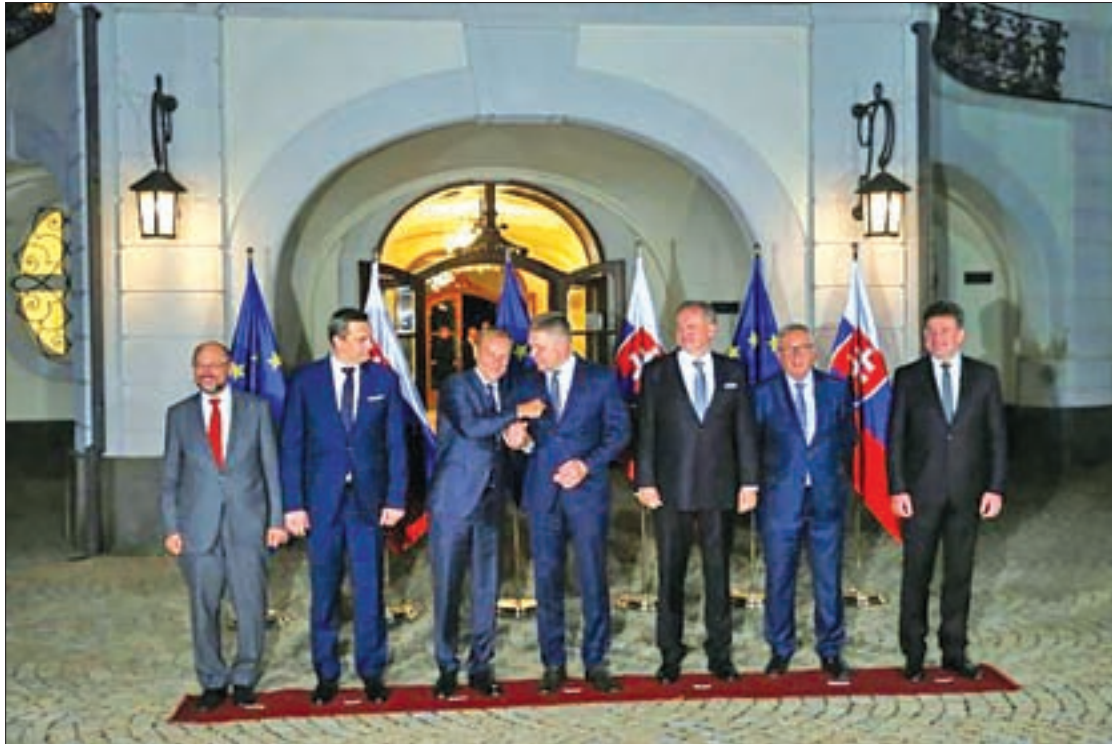
European Council President Donald Tusk (3 rd L), European Commission President Jean-Claude Juncker (2 nd R) and European Parliament President Martin Schulz (L) pose for a group photo with Slovakia's Prime Minister Robert Fico (C), Slovakia's President Andrej Kiska (3 rd R) and Speaker of the Slovakia's National Council Andrej Danko (2 nd L) at the Government office ahead of the upcoming European Union summit—the first one since Britain voted to quit—in Bratislava, Slovakia, on 15 September, 2016.