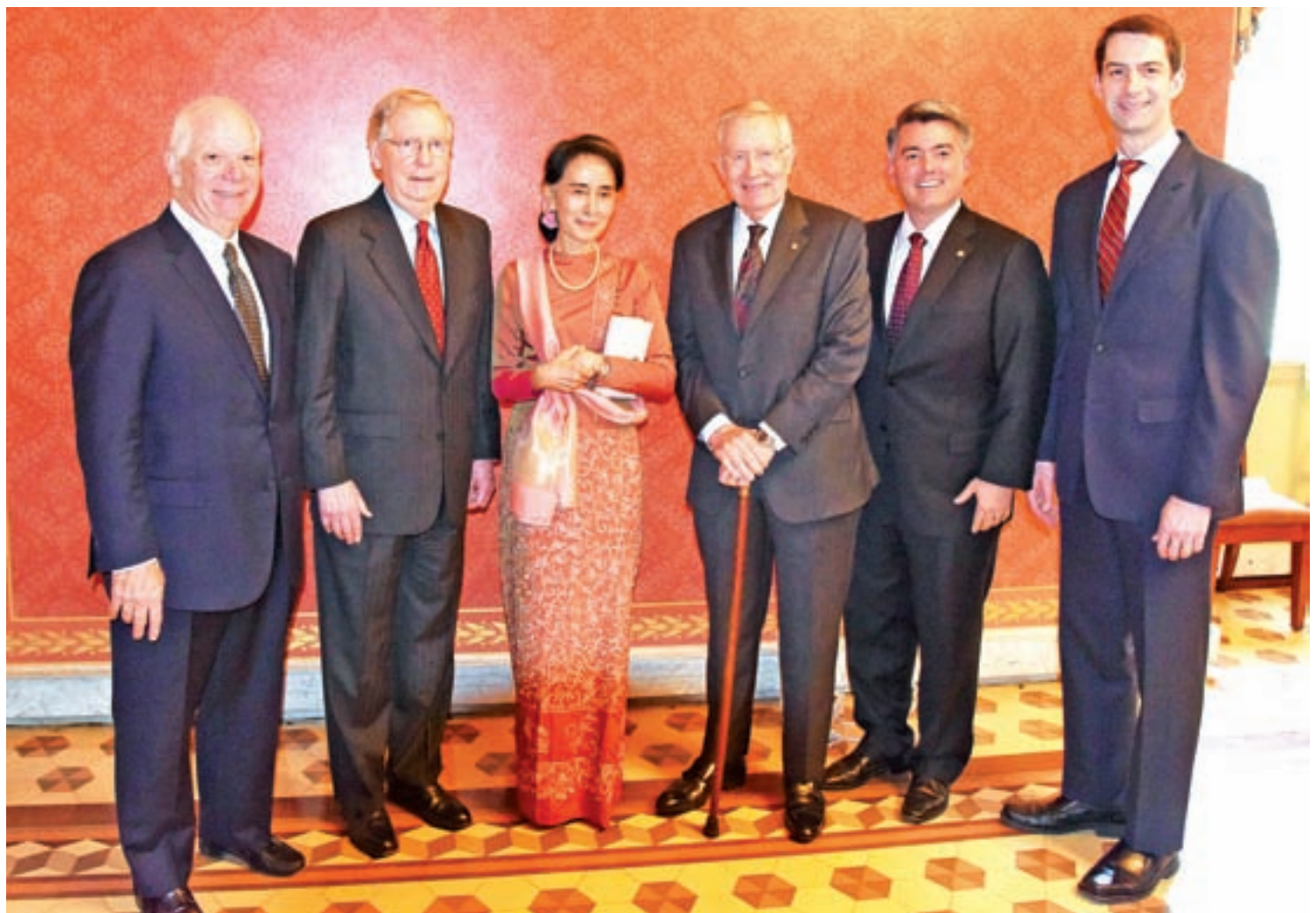
State Counsellor poses for a documentary photo with Senate Majority Leader Senator Mitch McConnell and party.

US investment in Myanmar reached over 248 million US dollars as of August this year.— GNLM