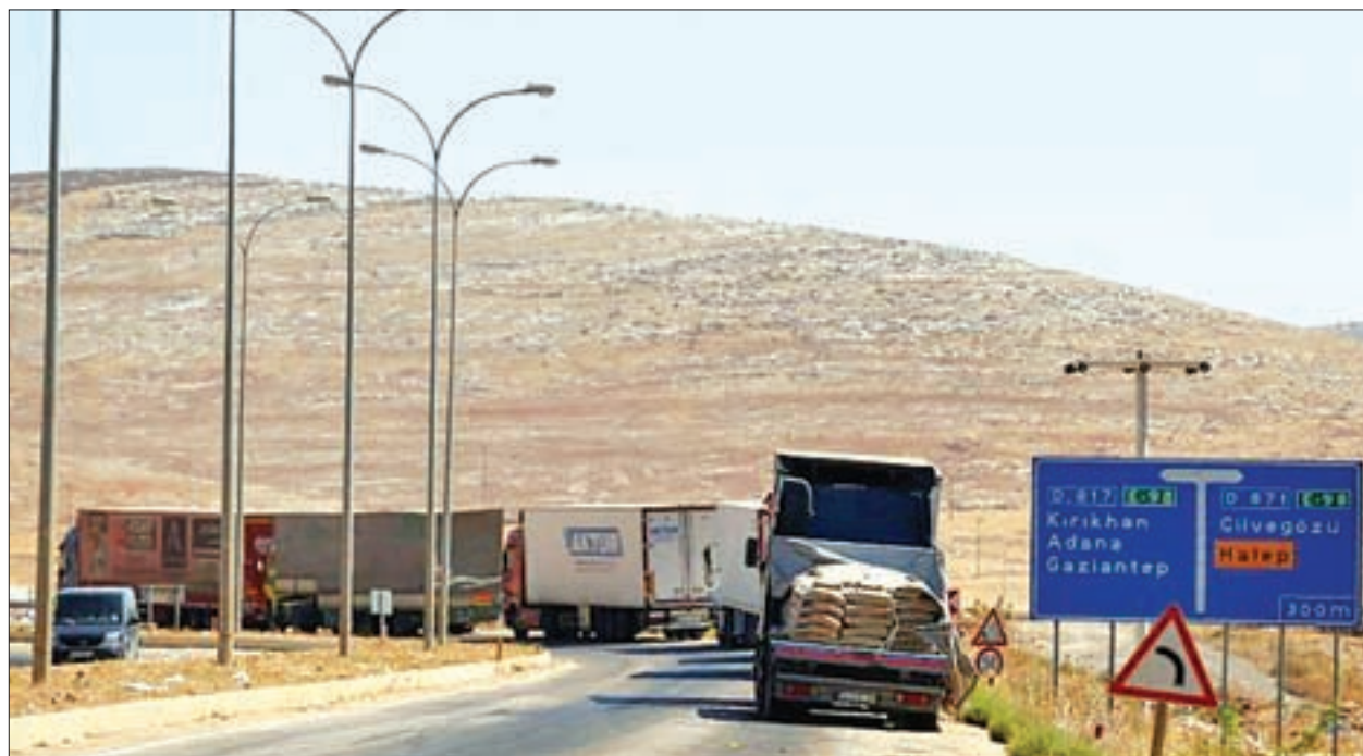
Commercial Turkish trucks wait to cross to Syria near the Cilvegözü border gate, located opposite the Syrian commercial crossing point Bab al-Hawa in Reyhanli, Hatay Province, Turkey, on 16 September 2016.

About 300,000 people are thought to be living in eastern Aleppo, while more than one million live in the government-controlled western half of the city. —Reuters