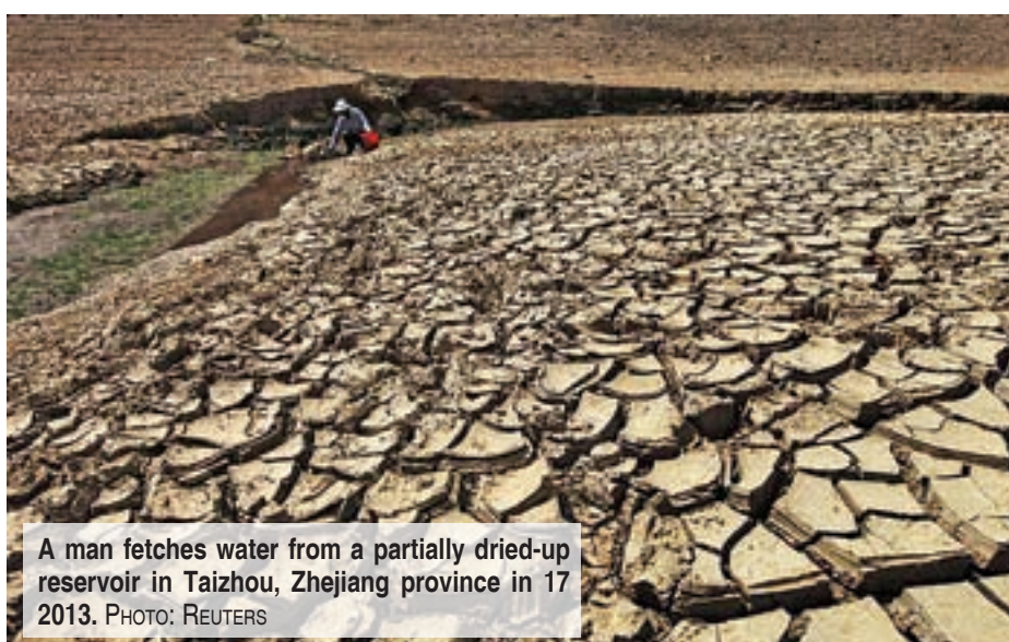
A man fetches water from a partially dried-up reservoir in Taizhou, Zhejiang province in 17 2013.

The EU's reversal from being the key broker clinching the deal, Juncker said in his annual State of the Un-