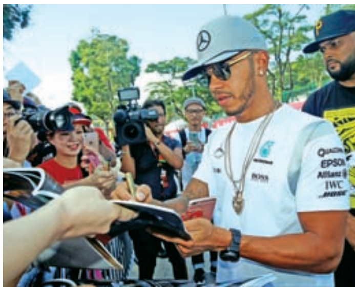
Mercedes Formula One driver Lewis Hamilton of Britain arrives at the paddock, Singapore Grand Prix at Marina Bay, Singapore, on 16 September 2016.

midity to Malaysia but you're surrounded by just the city and a lot of concrete so it's the one race I feel where you open your visor to get some air and you're not getting any reward for that," the Australian said.