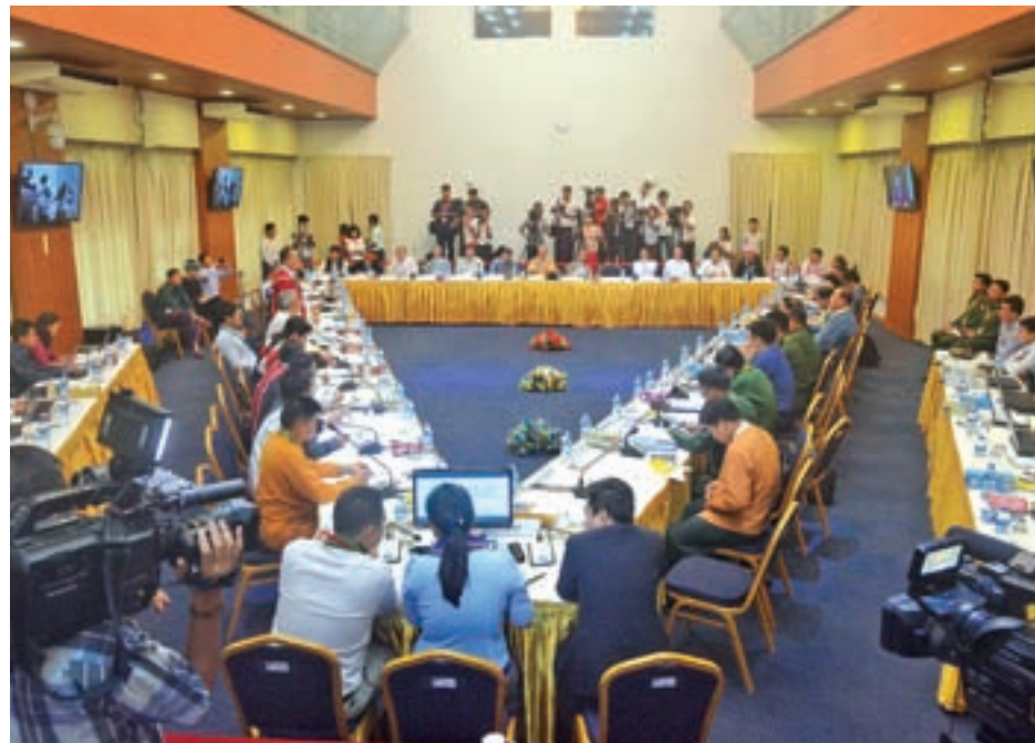
Peace makers discuss at 5th meeting on reviewing the framework for political dialogues.

The participants of the meeting reached an agreement for the chapter 4 of the Nationwide Ceasefire