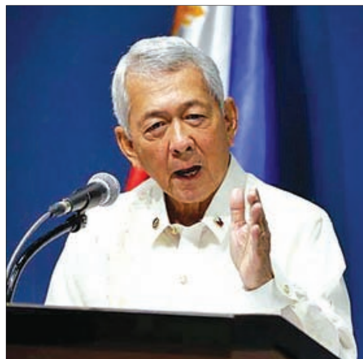
Philippines Foreign Affairs Secretary Perfecto Yasay speaks during a news conference at the Department of Foreign Affairs in Pasay city Metro Manila, Philippines on 27 July 2016.

timony in the Philippines senate earlier in the day from a self-confessed hit man who said Duterte issued assassination orders while mayor of a city where activists say hundreds of summary executions took place.