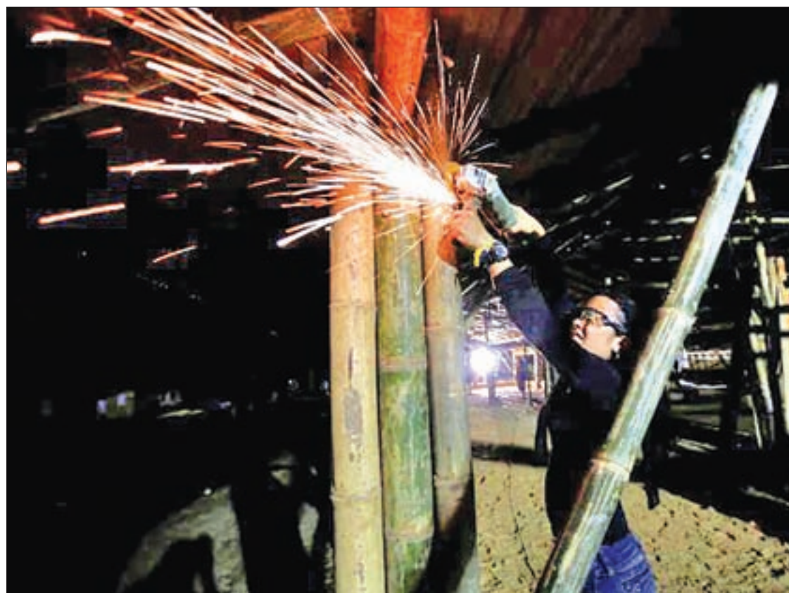
A Colombian from the Revolutionary Armed Forces of Colombia (FARC) works at a house to prepare accommodation for an upcoming congress ratifying a peace deal with the government, near El Diamante in Yari Plains, Colombia, on 8 September 2016.

Fighters accustomed to bombing raids were laying bricks and lashing together bamboo stalks for roofing when Reuters visited the site before the official opening of the conference.