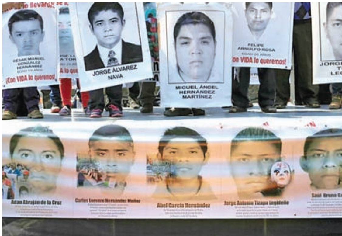
Relatives hold up posters during a rally in support of missing students from Ayotzinapa Teacher Training College, at the National Autonomous University of Mexico (UNAM) in Mexico City, on 19 February 2015.

The probe is now putting greater stress on determining whether students could have been brought to a variety of places after they were abducted, rather than a single location.—Reuters