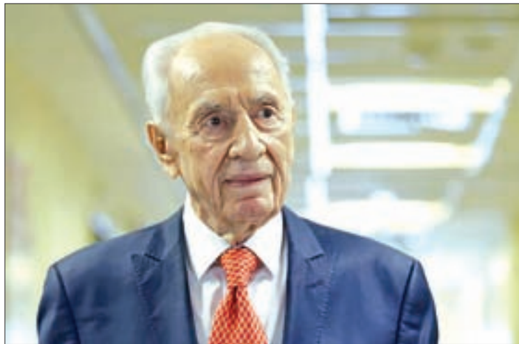
Former Israeli President Shimon Peres delivers a statement to the media as he is discharged from a hospital near Tel Aviv, on 19 January 2016.