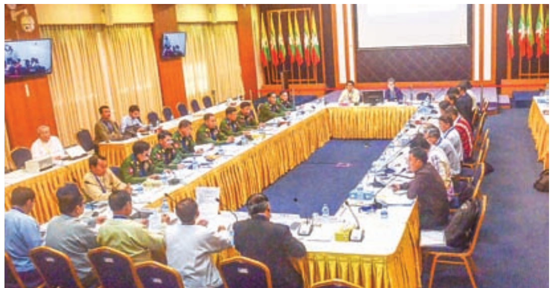
JMC-U meeting being held at NRCP in Yangon.