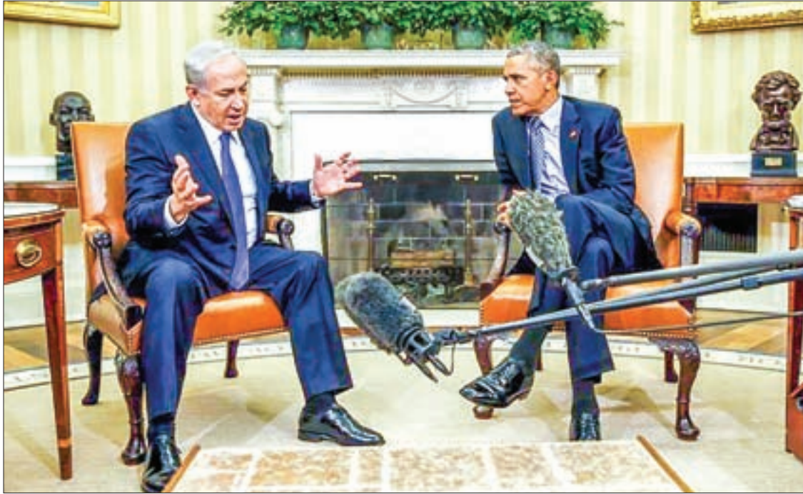
US President Barack Obama meets with Israeli Prime Minister Benjamin Netanyahu in the Oval office of the White House in Washington, on 9 November 2015.