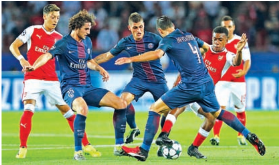
Arsenal's players in action with Paris Saint-Germain's players during UEFA Champions League Group Stage, Group A at Parc des Princes, Paris, France, on 13 September 2016.

French champions PSG, who took only one point from their last two Ligue 1 games, next travel to Ludogorets while Arsenal will host Basel on 28 September. Basel and Ludogorets also drew 1-1. "For a home game we would have preferred all three points especially since we played much better. We wasted chances but we played