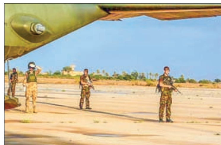
British soldiers stand guard during the visit of defence secretary Liam Fox at Misrata airport 200km (124.2 miles) east of Tripoli on 8 October, 2011.

"Our lack of understanding of the institutional capacity of the country stymied Libya's progress in establishing security on the ground and absorbing financial and other resources from the international community," Blunt said.—Reuters