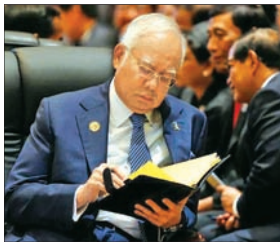
Malaysian Prime Minister Najib Abdul Razak attends the ASEAN-US Summit in Vientiane, Laos, on 8 September 2016.

September 2009 to invest in strategic property and energy projects.