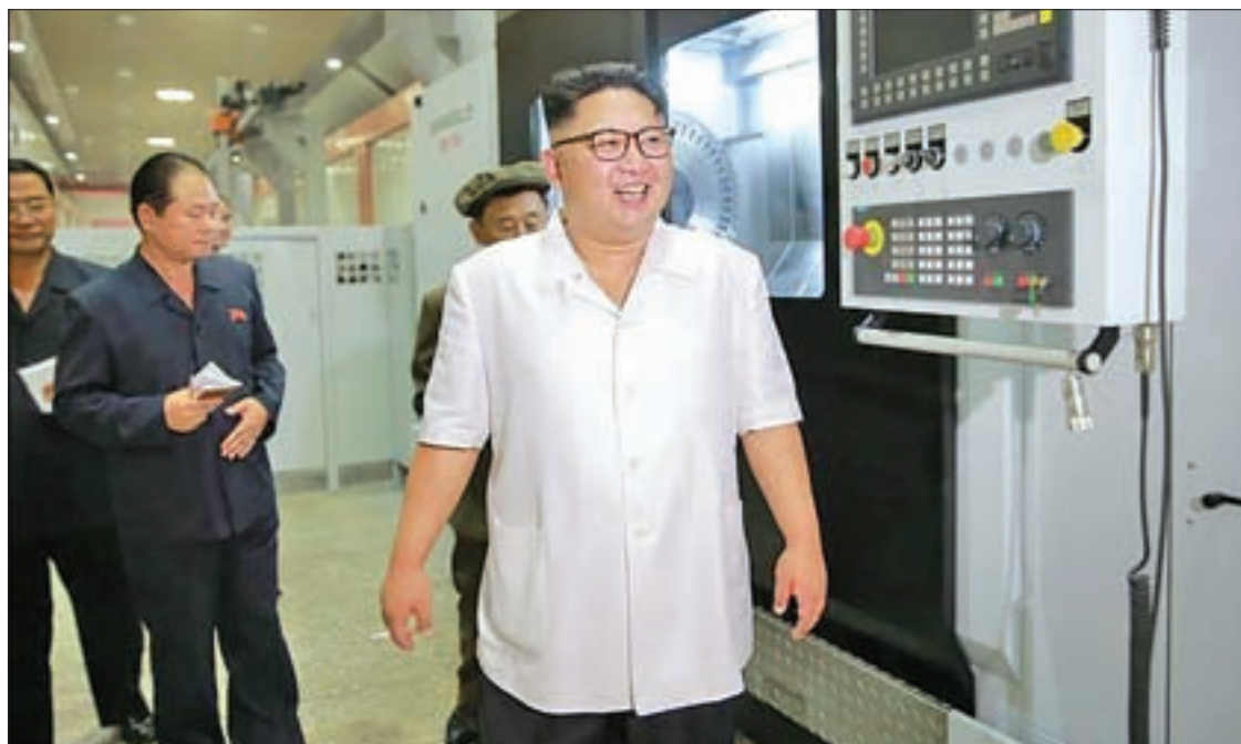
North Korean leader Kim Jong Un gives field guidance to the 18 January General Machine Plant in this undated photo released by North Korea's Korean Central News Agency (KCNA) in Pyongyang on 10 August, 2016.