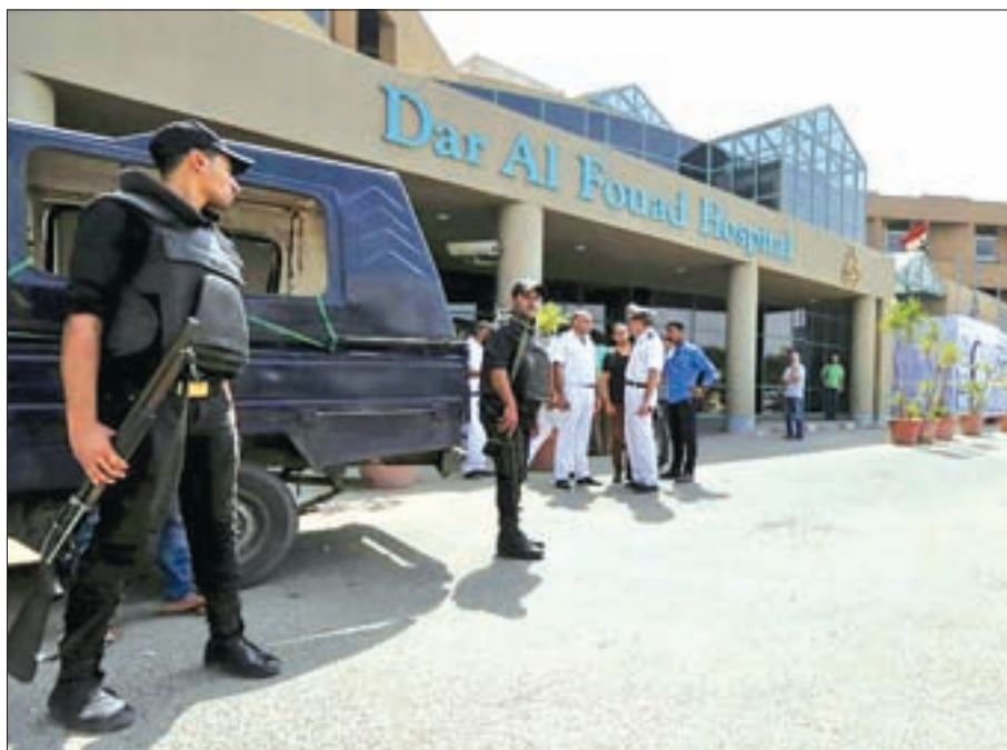
Egyptian police personnel stand guard outside Dar Al Fouad Hospital, where injured tourists who were mistakenly targeted in a military operation "chasing terrorist elements" are recovering, in Cairo, Egypt in 2015.

The federation is a union of local tourism chambers of commerce. It