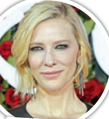
Actress Cate Blanchett.

Among those listed by the actors in the film are a wallet, an army service record, a high school certificate, a mobile phone, house keys and a na-