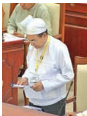
U Ohn Win.

MYANMAR Timber Enterprise will carry out logging by itself and will not allow private companies to fell and take trees from Myanmar forests, Union Minister U Ohn Win told the Pyithu Hluttaw yesterday.