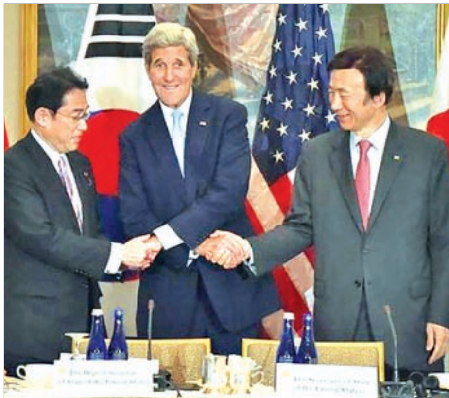
US Secretary of State John Kerry shakes hands with Japan's Foreign Minister Fumio Kishida (L) and South Korea's Foreign Minister Yun Byung-se before a meeting at the Lotte New York Palace hotel in Manhattan, New York in 2015.

China is North Korea's most important diplomatic and trade partner and refuses to cut the country off completely, fearing it could collapse.