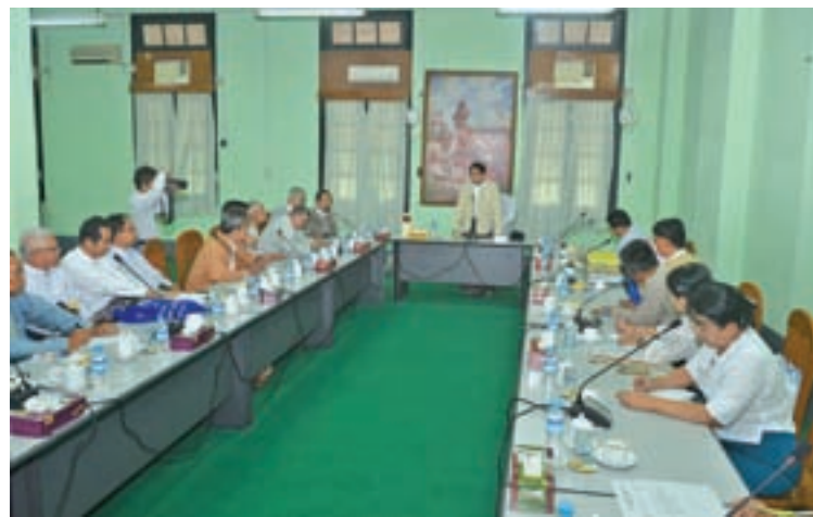
Union Minister for Information Dr Pe Myint delivering the uncluding remarks at the meeting to republish encyclopedias.

Those present made suggestions on the process of republishing Myanmar encyclopedias. This was followed by concluding remarks by the Union minister. Also present at the meeting were officials of the Ministry of Information, literati and other experts.—Myanmar News Agency