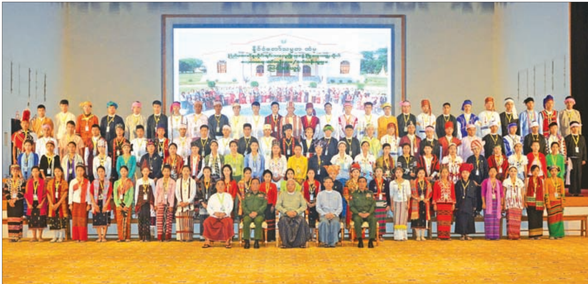
President U Htin Kyaw poses for documentary photos together with students from the University for the Development of National Races.