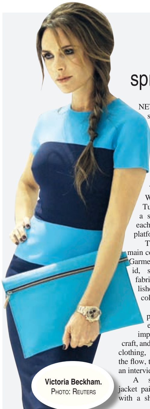
Victoria Beckham.