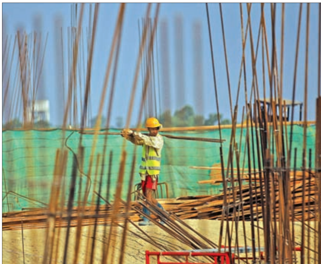
A man works at the site of the Thilawa Special Economic Zone project outside Yangon in 2015.

12 new industries, including a garment factory and an auto parts factory, have commenced operation in the Thilawan Special Economic Zone.— Min Thu