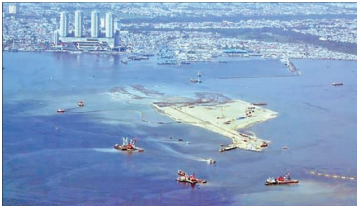
An aerial view of land reclamation in Jakarta Bay, Indonesia, on 14 April 2016.

Xi has also made rooting out deeply entrenched corruption in the military a top priority. Dozens of senior officers have been investigated and jailed.—Reuters