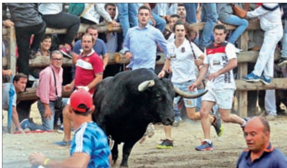
Revellers run in front of a bull, named ‘Pelado’ during the Toro de la Pena, formerly known as Toro de la Vega (Bull of the Plain) festival, in Tordesillas, Spain, on 13 September 2016.

Regional authorities said in May that the festival could no longer culminate with the hunters slaying the bull. Animal rights groups claimed the ruling as a victory in a country still known