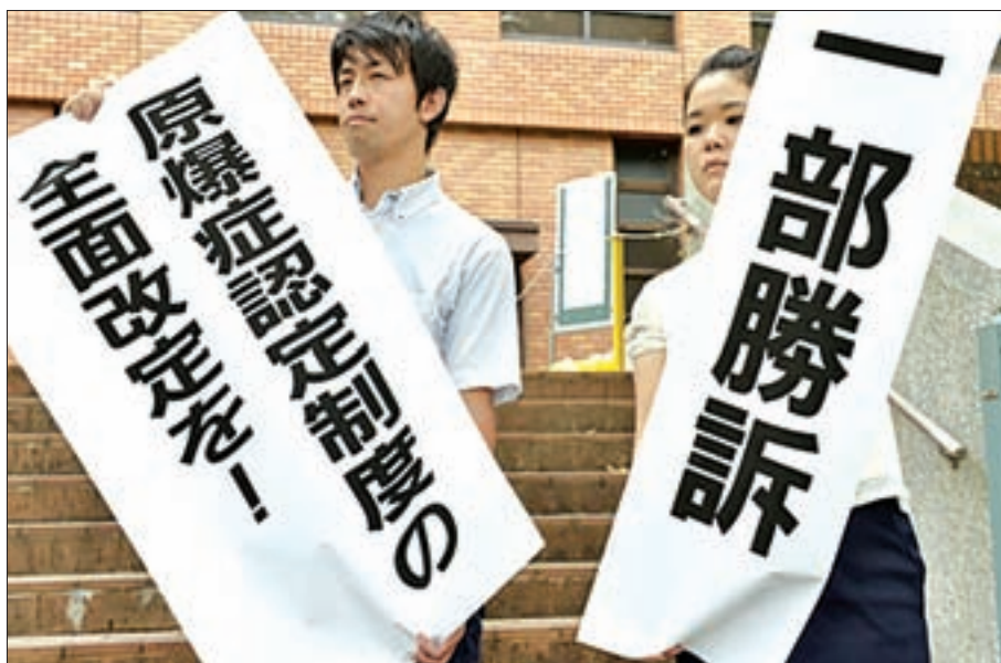
Lawyers for plaintiffs hold banners in front of the Nagoya District Court in the central Japan city on 14 September 2016, after the court recognised two men exposed to the atomic bombing of Hiroshima as suffering from radiation diseases, overturning the government's rejection of their bid to be certified under standards eased in recent years. The court, however, dismissed similar claims made by two women who were exposed to the Nagasaki atomic bomb.