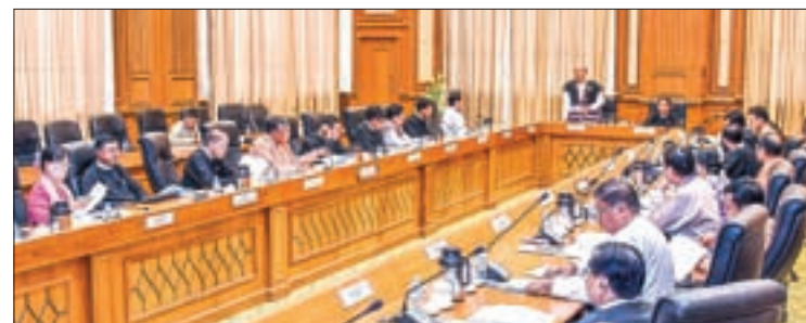
Speakers of Pyithu Hluttaw and Amyotha Hluttaw chair the Myanmar Parliamentary Union meeting (4/2016).

The meeting came to end with an agreement to set the Pyidaungsu Hluttaw Office as the central office of region/state Hluttaw Offices.— Myanmar News Agency