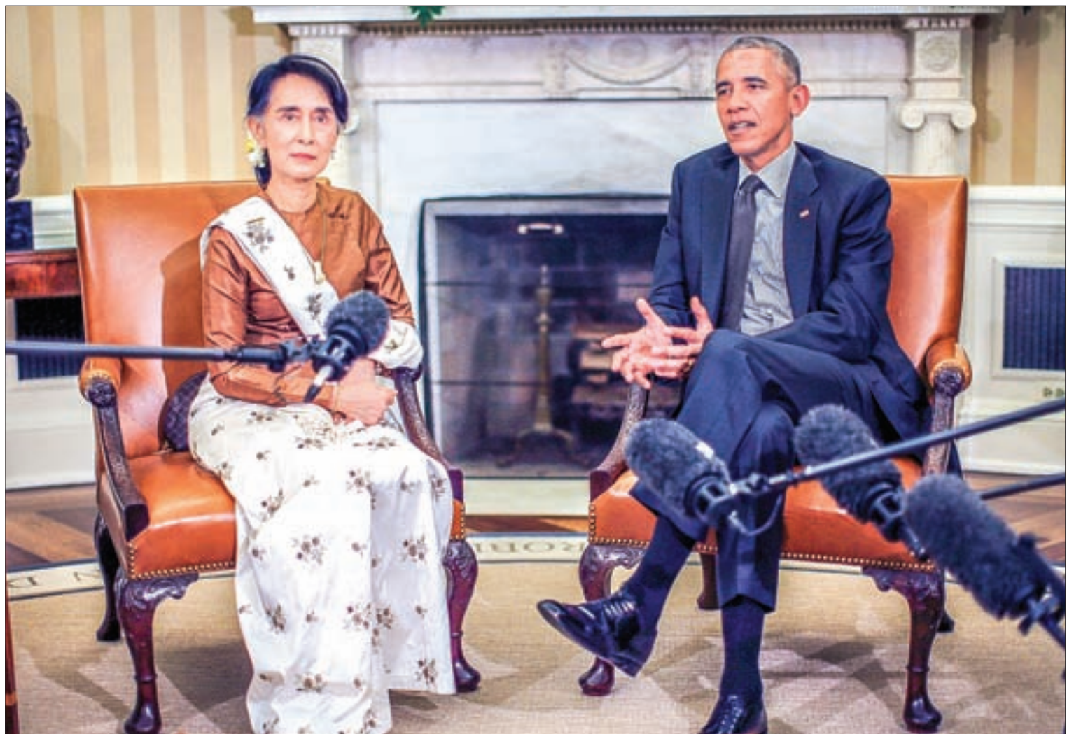
State Counsellor Daw Aung San Suu Kyi meets with US President Barack Obama at the Oval Office of the White House in Washington, DC, US September 14, 2016.

Blair House has served as the home away from home for visiting chiefs of state, heads of govern-