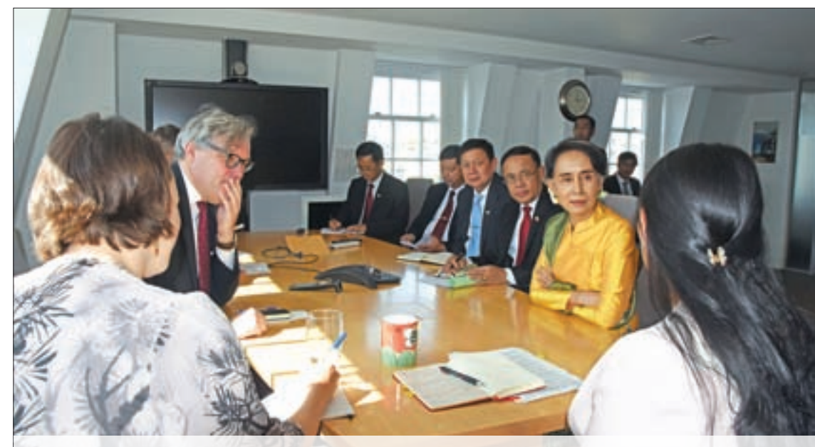
State Counsellor Daw Aung San Suu Kyi holds talks with Ms Priti Patel, the Secretary of State for International Development.

The Myanmar delegation led by the State Counsellor left London for Washington at 5.20 pm local time.—Myanmar News