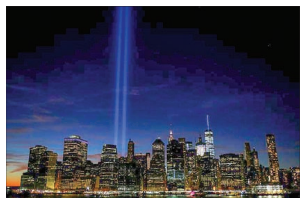
The Tribute in Light shines on the 15th anniversary of the 9/11 attacks in Manhattan, New York, US, on 11 September, 2016.

However, it was not clear when the vote would take place. The Senate sent the bill to Obama on Monday night, giving him a 10-day window to veto the measure that would end on 23 September. The Senate has been aiming to leave Washington as soon as this week, before that deadline, and the House next week, and lawmakers would not be in Washington again until after the 8 November elections. Under the Constitution, Obama has 10 days to veto the bill before it automatically becomes law. The Constitution also allows a "pocket veto," in which the president can defeat a bill just by holding onto it until Congress is out of session. -Reuters