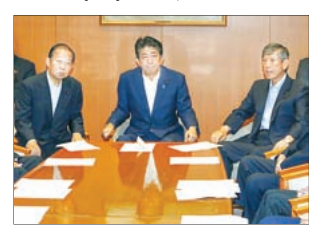
Japanese Prime Minister Shinzo Abe (C) attends a meeting of Liberal Democratic Party executives in Tokyo on 13 September 2016, alongside the party's secretary general Toshihiro Nikai (L) and vice president Masahiko Komura.

Earlier in the day, Abe told a meeting of Liberal Democratic Party executives that "the government and ruling parties will come together and do all that we can to deal with this disaster."-Kyodo News