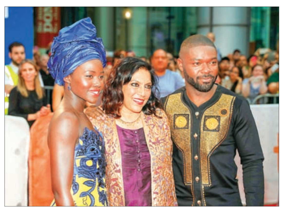
Actress Lupita Nyong'o (L) and David Oyelow (R) stand with director Mira Nair as they arrives on the red carpet for the film "Queen of Katwe" arrive on the red carpet for the film "Queen of Katwe" during the 41st Toronto International Film Festival (TIFF), in Toronto, Canada, on 10 September 2016.