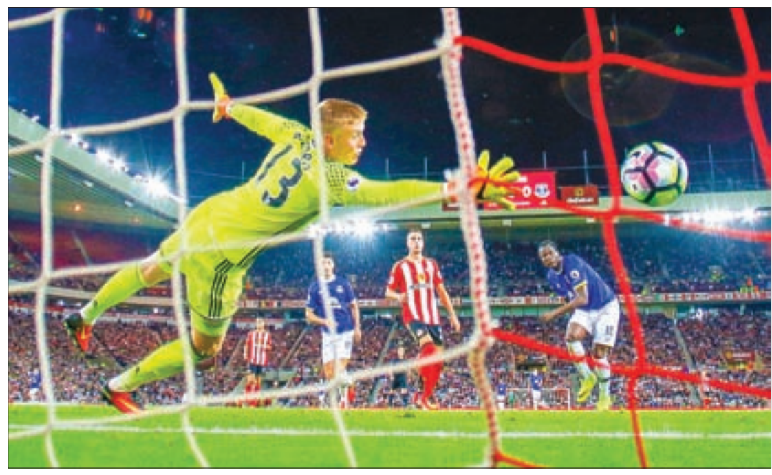
Everton's Romelu Lukaku scores their first goal during Premier League at Stadium of Light, on 12 September 2016.

It looked like it might be another night of frustration for Lukaku as he snatched at a couple of chances but after the break he proved unstoppable, powering home two far-post headers from the right and then the left in the