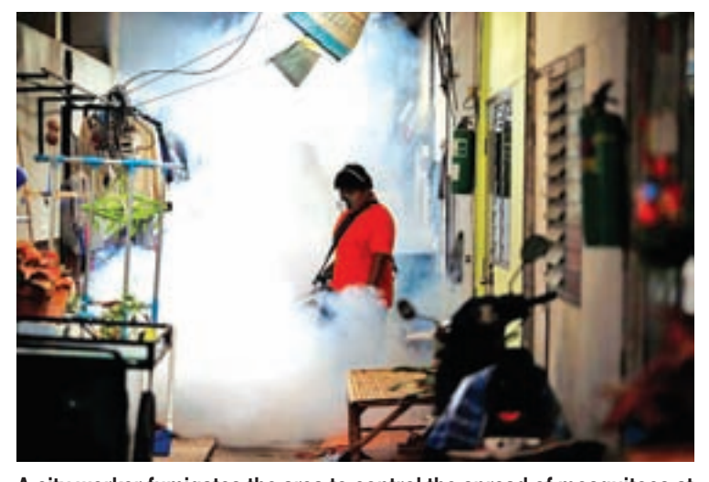
A city worker fumigates the area to control the spread of mosquitoes at a university in Bangkok, Thailand, on 13 September 2016.

since January, the health ministry said on Tuesday, making it a country with one of the highest numbers of confirmed cases in the region.