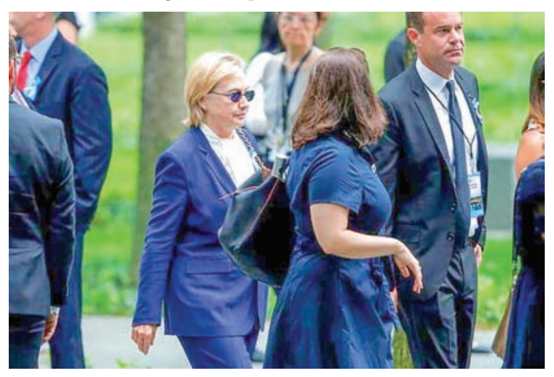
US Democratic presidential candidate Hillary Clinton arrives for ceremonies to mark the 15th anniversary of the 11 September attacks at the National 9/11 Memorial in New York, New York, United States on 11 September, 2016.

WASHINGTON — Democrat Hillary Clinton said on Monday she could resume presidential campaigning in a couple of days after a bout of pneumonia that she initially had not believed was "that big a deal."