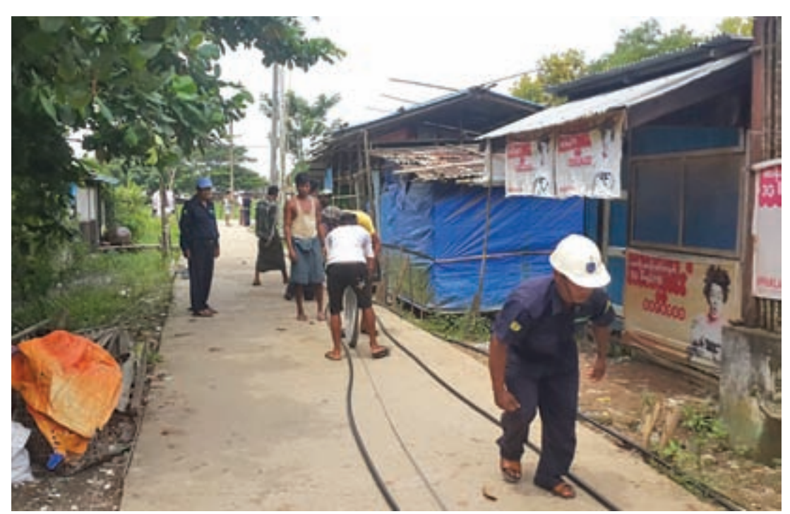
Electric power lines are being changed.

YANGON Dala Township, an the installment of six 200 KV A U Aung Kyaw Moe, electricity underdeveloped quarter of the transformers. city located across the Yangon River, is to receive the distribution of 1.2MW of electricity this 2016-17 fiscal year, the township's office of electrical engineers has told Myitmakha News Agency.