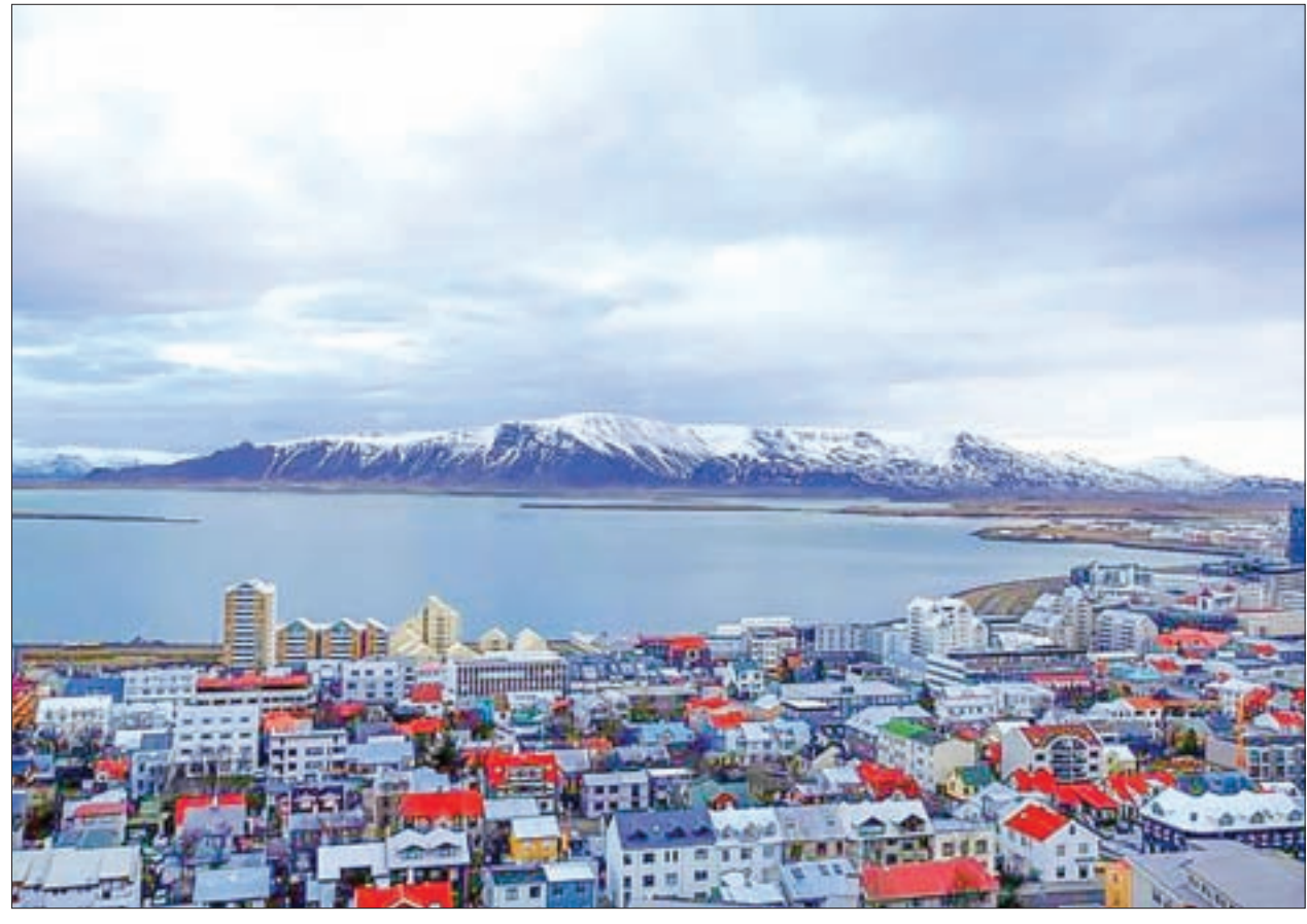
A general view shows the city of Reykjavik seen from Hallgrimskirkja church on 13 February 2013.

several measures to achieve by 2040, including both the target, with promises to mandate the green emphasis in all of the city's oper-