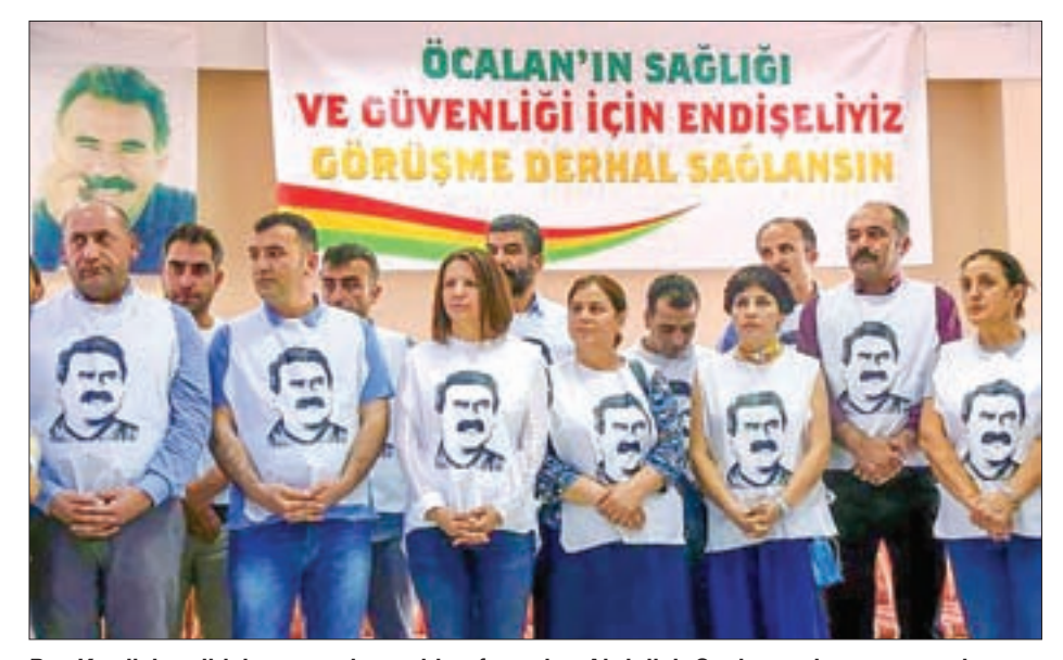
Pro-Kurdish politicians wearing t-shirts featuring Abdullah Ocalan gather to start a hunger strike to demand the right to visit the jailed PKK militant leader Ocalan, in Diyarbakir, Turkey, on 5 September 2016.

In the latest violence, suspected Kurdistan Workers Party (PKK) militants set off a car bomb on Monday near government offices in the city of Van, wounding