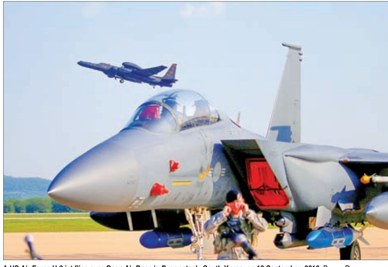
A US Air Force U-2 jet flies over Osan Air Base in Pyeongtaek, South Korea, on 13 September, 2016.

"At present, we must work hard to prevent the situation on the peninsula