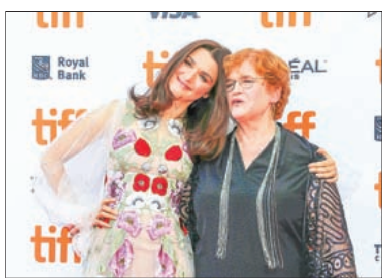
Actress Rachel Weisz and Deborah E. Lipstadt.

'Denial' is due to open in US movie theaters on 30 September.— Reuters