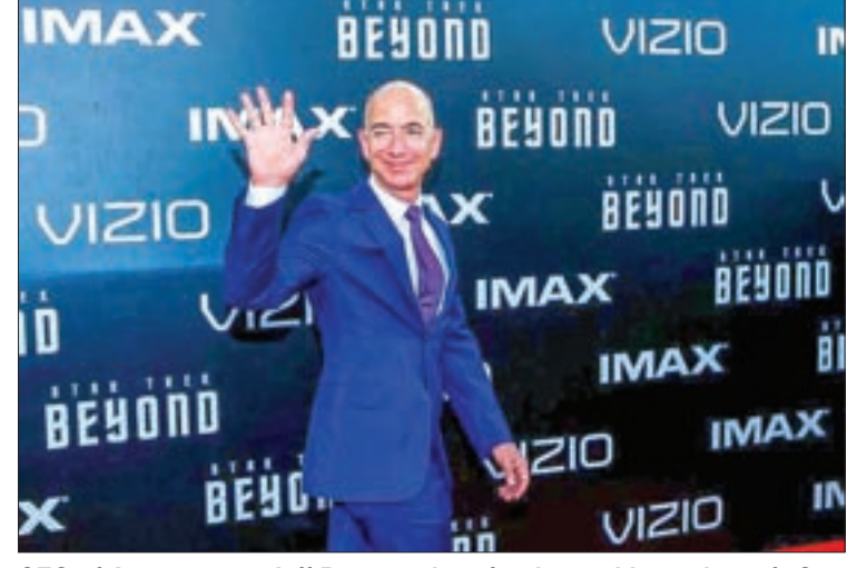
CEO of Amazon.com Jeff Bezos arrives for the world premiere of "Star Trek Beyond" at Comic Con in San Diego, California US, on 20 July 2016.

Blue Origin also intends to sell the BE-4 to United Launch Alliance for its new Vulcan rocket.