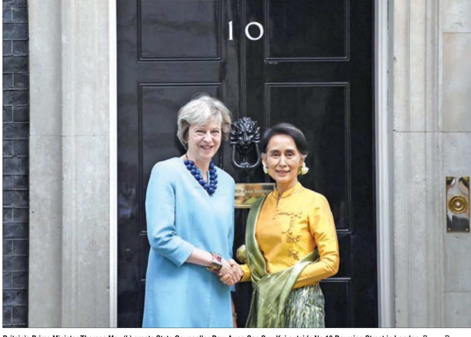
Britain's Prime Minister Theresa May (L) greets State Counsellor Daw Aung San Suu Kyi outside No 10 Downing Street in London.