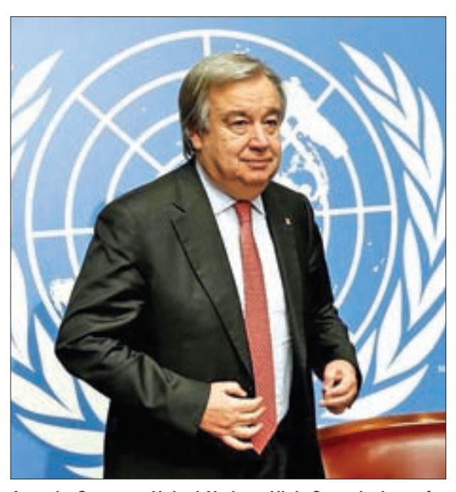
Antonio Guterres, United Nations High Commissioner for Refugees (UNHCR), arrives for a news conference at the United Nations in Geneva, Switzerland on 18 December 2015.

UNITED NATIONS — Former Portuguese Prime Minister Antonio Guterres still leads the race to become the next United Na-