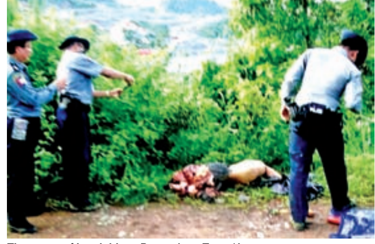
The scene of bomb blast.

"That person used plastic bottles to make bombs, but not systematically. Four mines did not blast. Maybe, their gunpowder was wet in the rain," a police officer said.