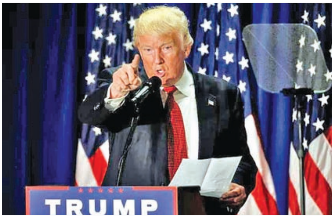
Republican presidential nominee Donald Trump speaks at the Cleveland Arts and Social Sciences Academy in Cleveland, Ohio, US, on 8 September 2016.