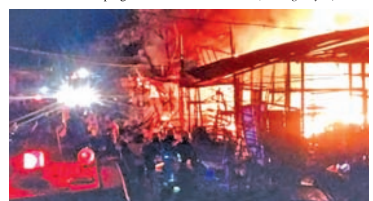
The scene of the outbreak of fire on Hlaingthaya.

The fire was put out with the help of 25 fire engines at around 5:53 am. Most of the shops within the market were destroyed. Police have taken action against Ma Aye Htwe alias Ma Aye Htay.— Than Htike (Hlaingthayar)