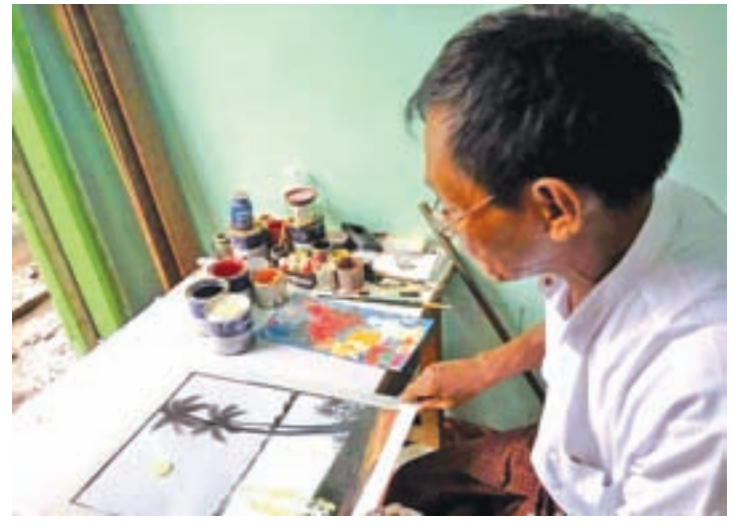
The one and only mirror painting artist.

A mirror picture is currently selling for around US$ 33 for a 10x14 inch frame for tourists