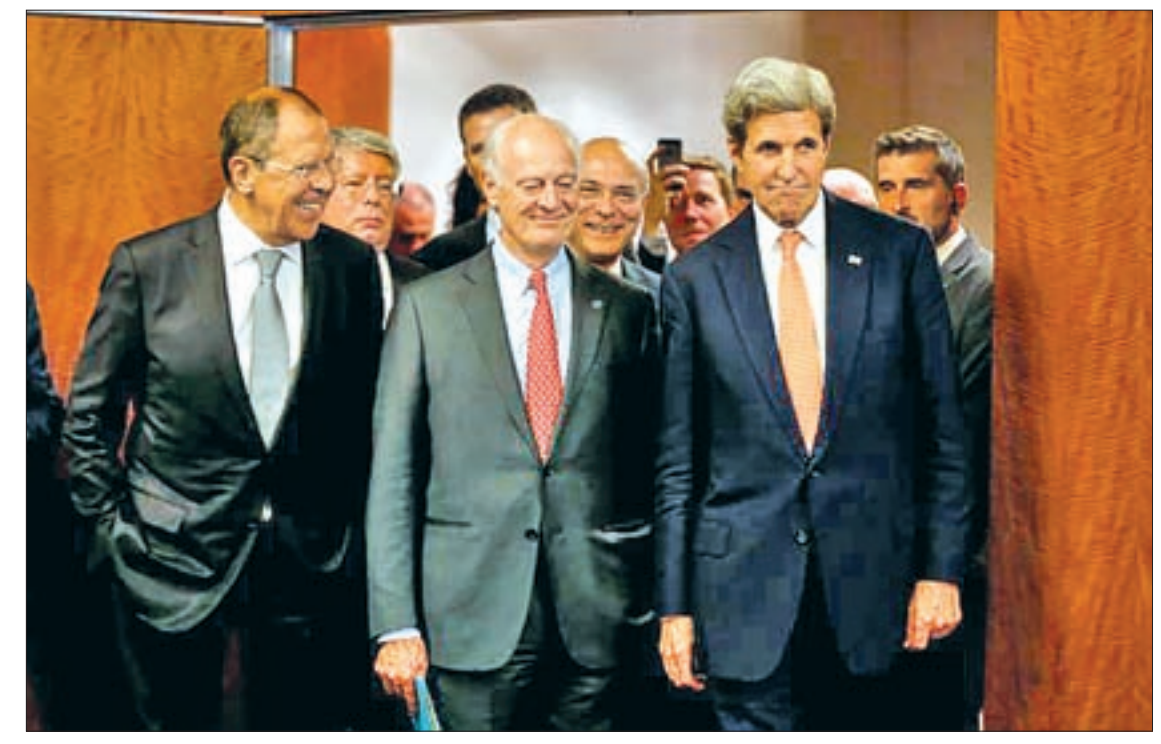
US Secretary of State John Kerry, UN Special Envoy Staffan de Mistura (C) and Russian Foreign Minister Sergei Lavrov arrive for a press conference following their meeting in Geneva, Switzerland where they discussed the crisis in Syria, on 9 September 2016.

"This all creates the necessary conditions for resumption of