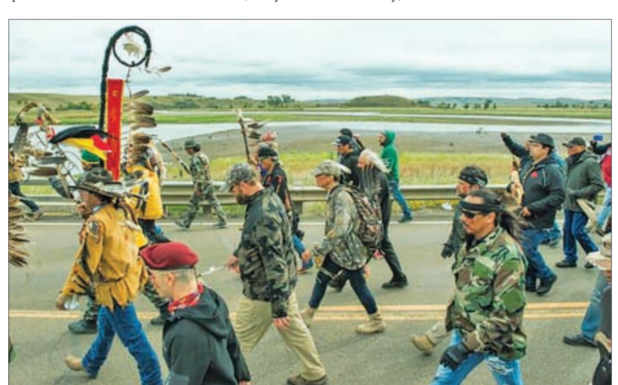
Protesters demonstrate against the Energy Transfer Partners' Dakota Access oil pipeline near the Standing Rock Sioux reservation in Cannon Ball, North Dakota, US, on 9 September 2016.