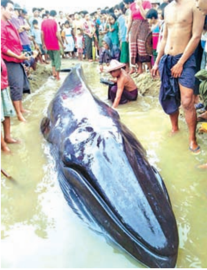
The whale being sent back to the sea. Photo: 200

According to researchers, whales beach themselves when they have become disoriented, sick or confused by the use of man-made sonar which may interfere with the animal's brainwaves or the use of its echolocation.—200