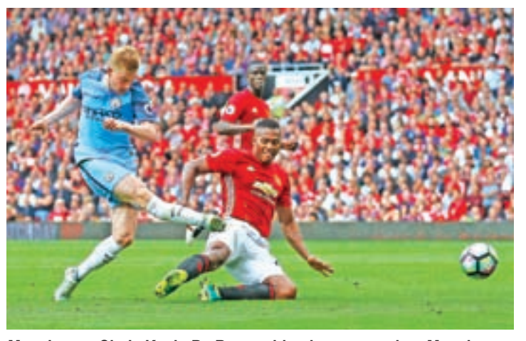
Manchester City's Kevin De Bruyne hits the post against Manchester United during Premier League at Old Trafford, on 10 September 2016.

With his side being outpassed and outclassed in a one-sided first half, Zlatan Ibrahimovic brought United back into the match just before the break after a mistake by City's new goalkeeper Claudio Bravo.