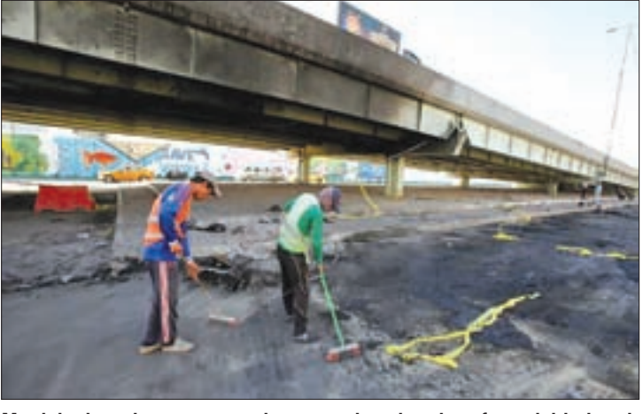
Municipal workers sweeps the ground at the site of a suicide bomb attack at Nakheel Mall across from the oil ministry, in Baghdad, in Iraq, on 10 September 2016.

The UK based Observatory for Human Rights which tracks violence across Syria said jets believed to be either Syrian or Russian also hit rebel-held towns in the northern Aleppo countryside including Anadan and Hreitan along important insurgent supply routes. The monitor confirmed reports by residents and activists in rebel-held eastern Aleppo who said Syrian army helicopters dropped barrel bombs on residential civilian areas in several districts.—Reuters