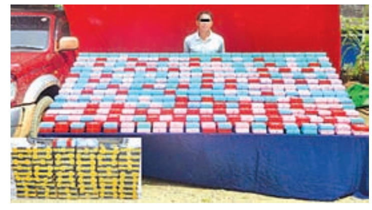
La Zein Thu Rain.

On the same day in Thazi township, police seized 48,160 yaba pills from a vehicle being driven by one Myint Kyaw Thu with Tin Win on board near the railway station of Kwe Tat Sun village, Thazi township.