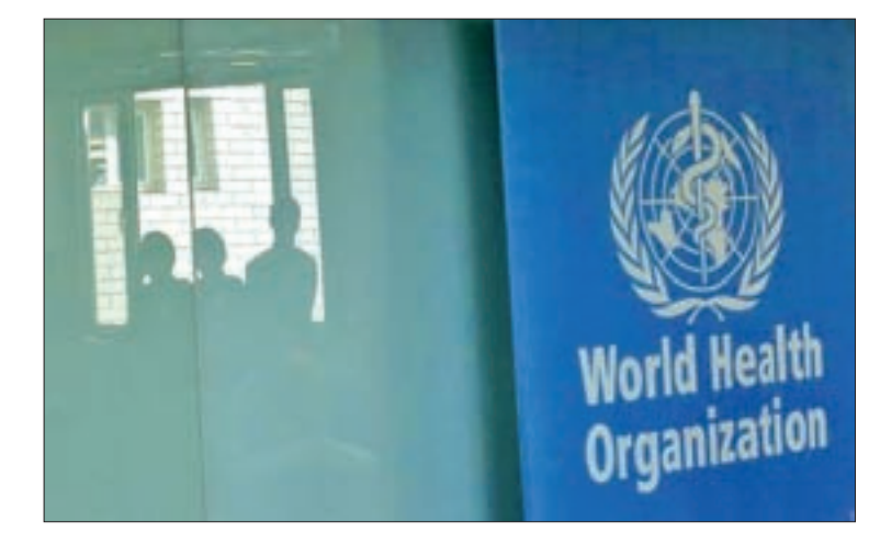
Shadows of journalists are reflected on a wall next to WHO's logo at a news conference in Beijing, China, on 29 March 2016.

Aid workers welcomed the move, citing the Ebola crisis in West Africa in 2013-15, as an