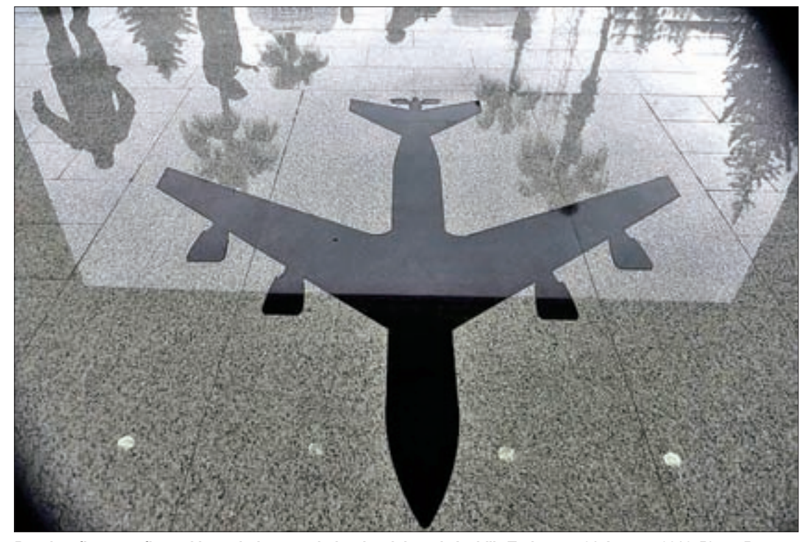
People reflect on a floor with an airplane symbol at the air base in Incirlik, Turkey, on 21 January 2016.

Steinmeier said he hoped that the phase of "talking past each other" would now be replaced by more direct dialogue between Ankara and Berlin and the rest of the EU.—Reuters