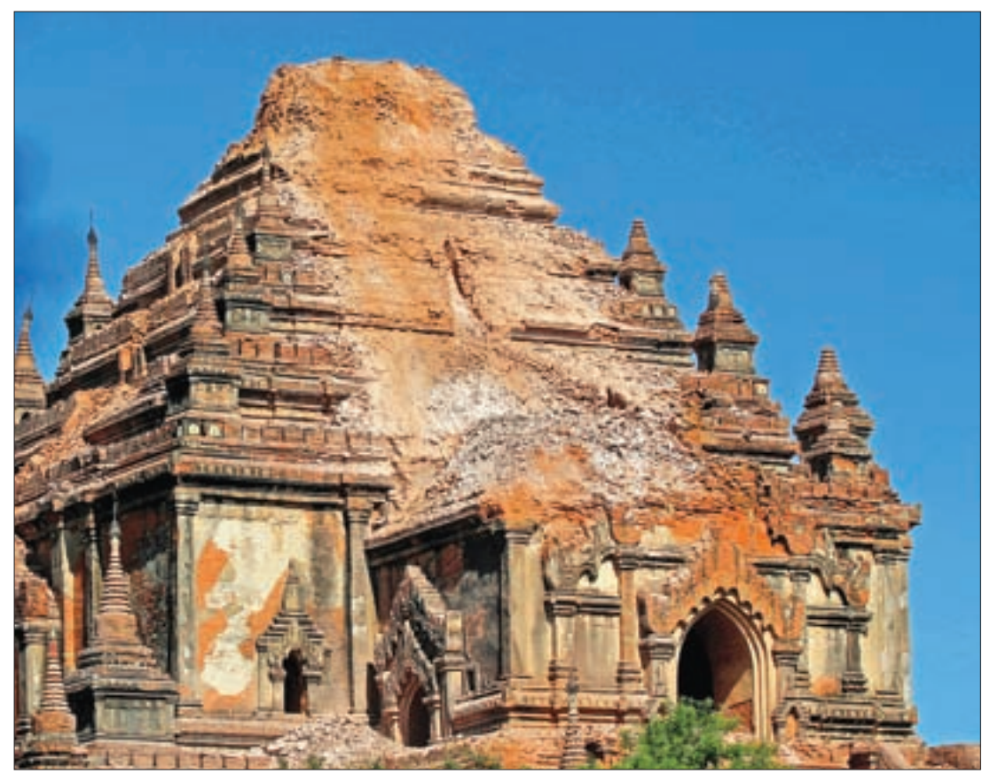
A pagoda in Bagan struck by the recent earthquake.