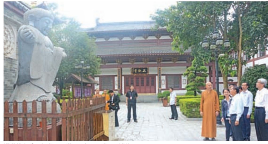
VP U Myint Swe in Jiangsu Mountain area.