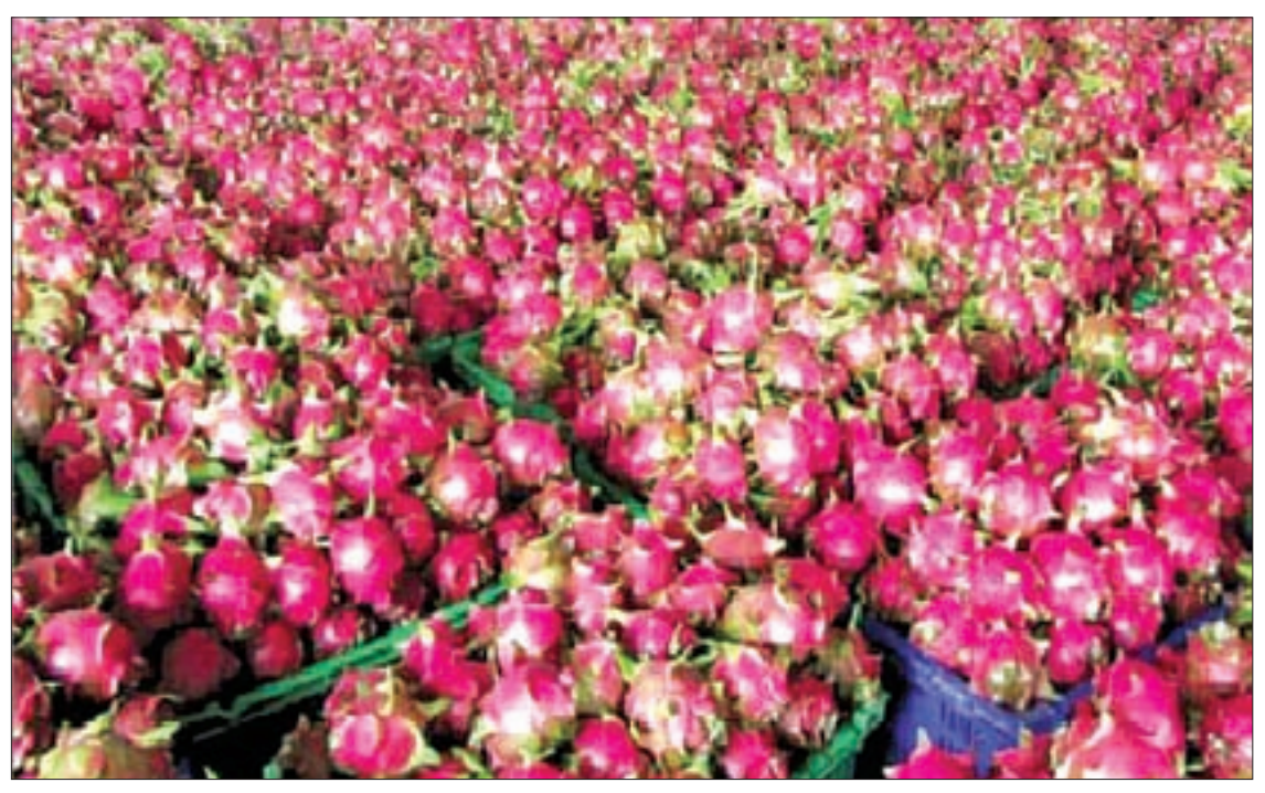
Dragon Fruit.