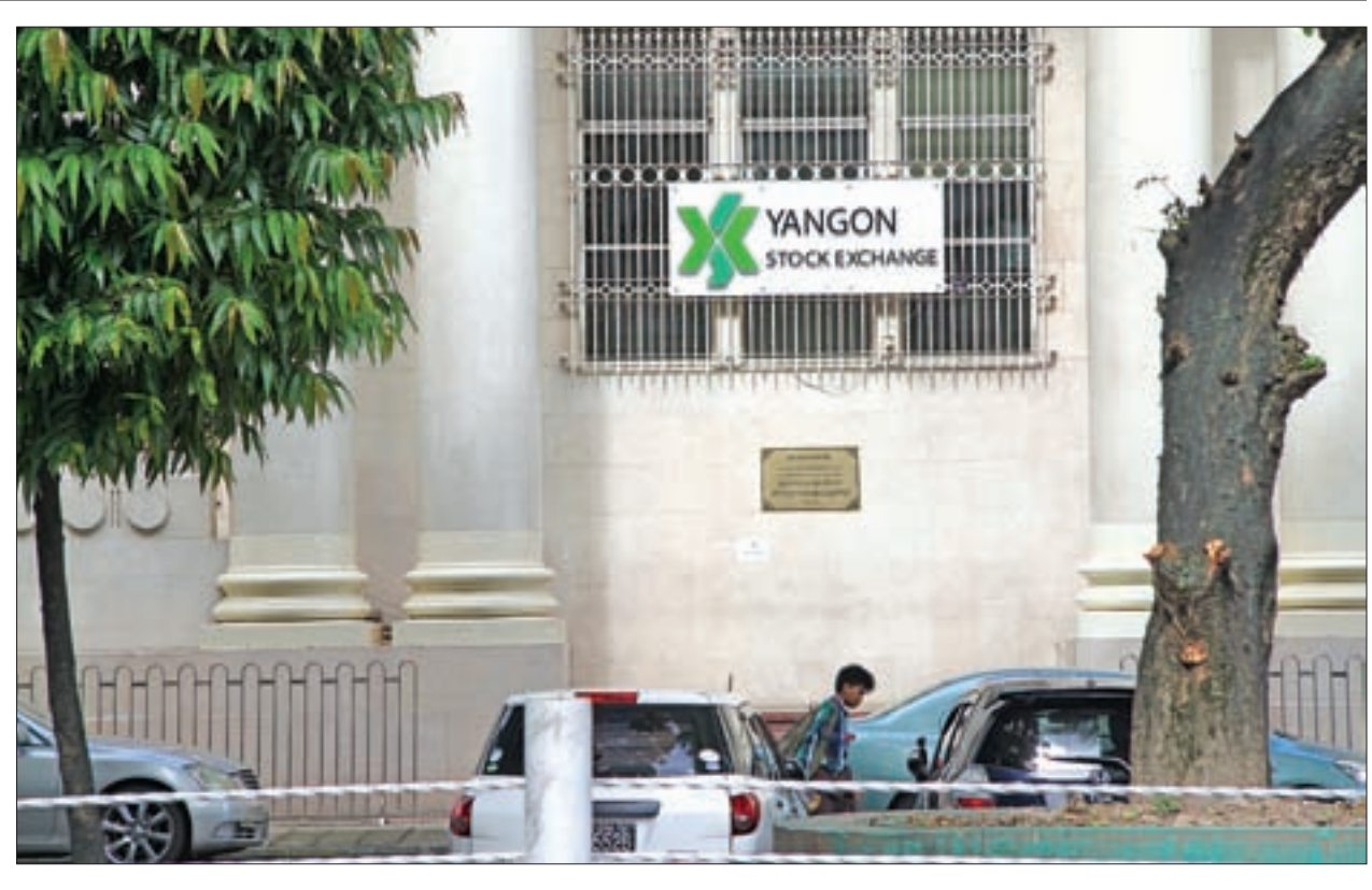
A boy walks outside the Yangon Stock Exchange.

This plant will create 500 jobs and the production by the plant is expected to be able to provide crop protection products for 3 million farming families.—Ko Htet