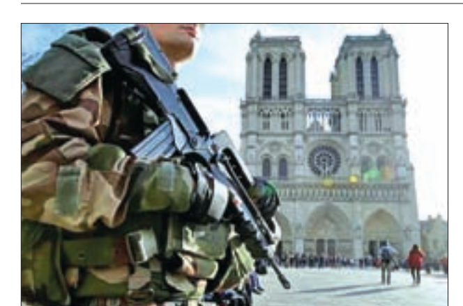
An armed French soldier patrols in front of Notre Dame Cathedral in Paris, France in 2015.

He said there were no casualties, but some media reported two people were wounded.—Reuters