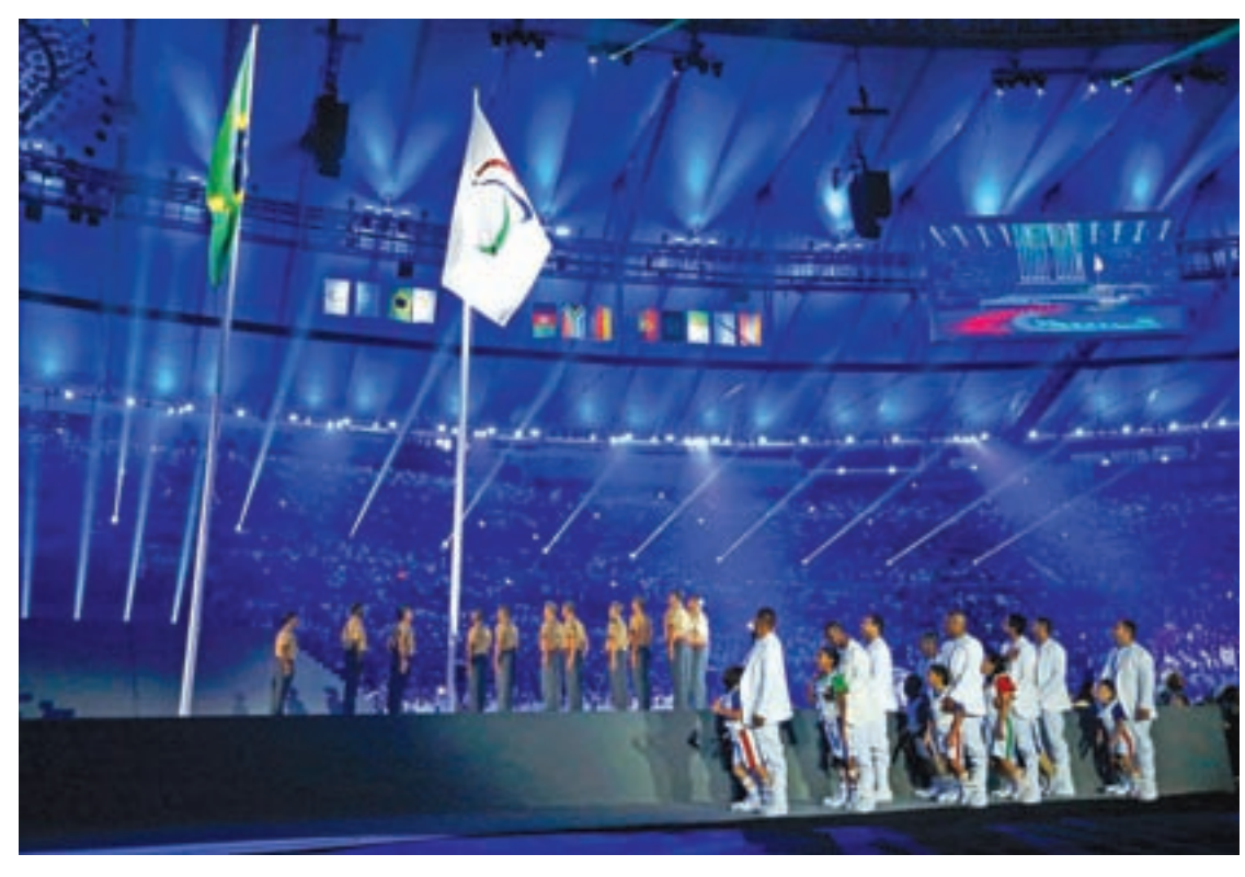
The Brazilian (L) and Paralympic flags are raised during the opening ceremony of 2016 Rio Paralympics at Maracana in Rio de Janeiro, Brazil, on 7 September 2016.

faced major challenges of late, Paralympians will switch your focus from perceived limitations to a world full of possibility and