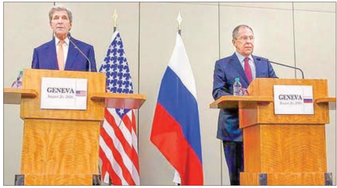
US Secretary of State John Kerry and Russian Foreign Minister Sergei Lavrov attend a news conference after a meeting on Syria in Geneva, Switzerland, on 26 August 2016.

Kerry has long expressed frustration with the lack of progress on