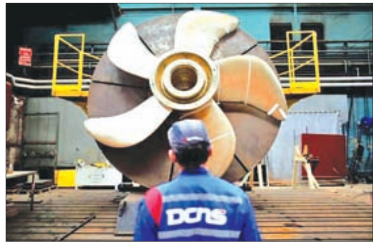
An employee looks at the propeller of a Scorpene submarine at the industrial site of the naval defence company and shipbuilder DCNS in La Montagne near Nantes, France, on 26 April 2016.

DCNS has said that the leak, which covered details of the Scorpene-class model and not the