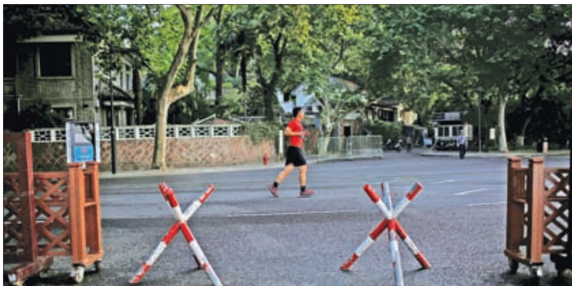
Security personnel run at the West Lake after the police closed the lake before G20 Summit in Hangzhou, Zhejiang Province, China, on 3 September 2016.

The king has been treated for various ailments over the past year at Bangkok’s Siriraj Hospital and was last seen in public on 11 January, when he spent several hours visiting his palace in the Thai capital.