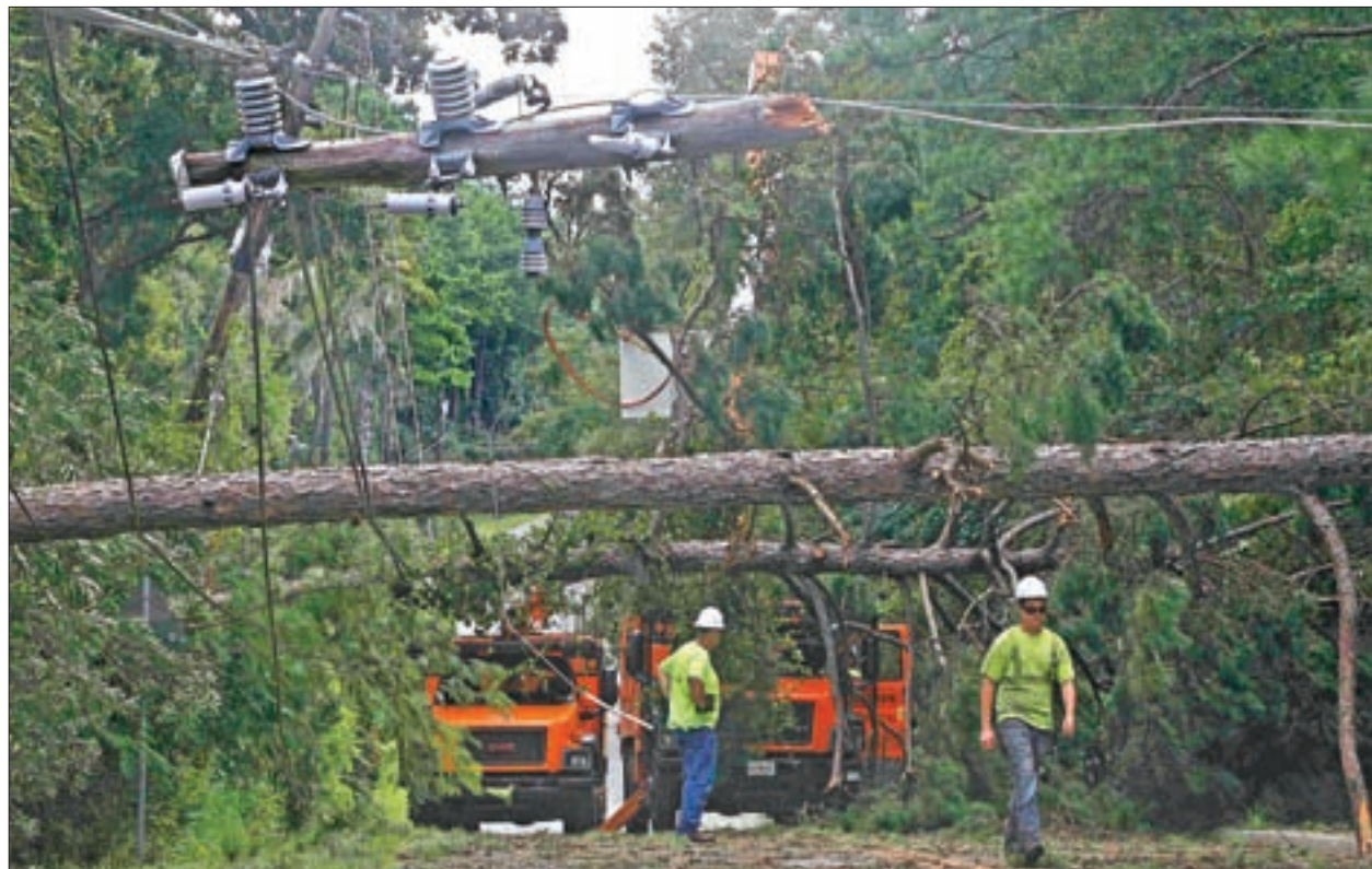
Workers remove downed trees during cleanup operations in the aftermath of Hurricane Hermine in Tallahassee, Florida, on 2 September 2016.

tained winds had weakened to 50 mph (80 kph), the tempest headed to the Atlantic seaboard along a path inhabited by tens