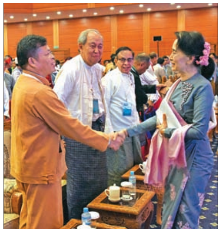
The photos show State Counsellor Daw Aung San Suu Kyi greeting the attendees of the Union Peace Conference — 21st Century Panglong.