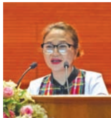
Lal Hmar Ngaik Zwal Ei.