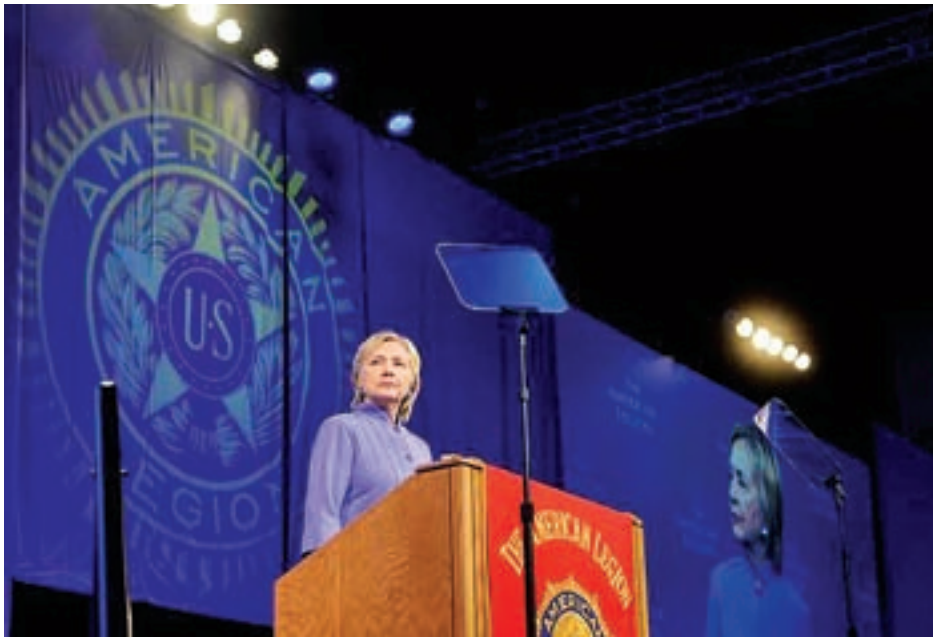
Democratic presidential nominee Hillary Clinton addresses the National Convention of the American Legion in Cincinnati, Ohio, US, on 31 August 2016.

Besides the 11-page interview summary, the FBI also released other details of its investigation into her use of an unauthorized private email system while running the State Department, in which it concluded she mishandled classified information but not in a way that