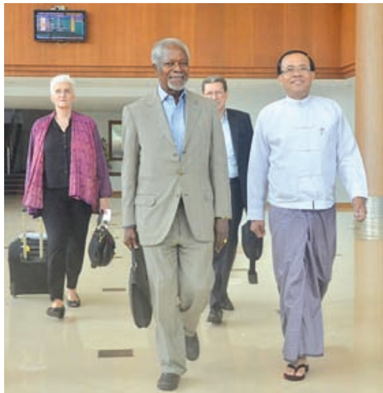
UN former Secretary-General welcomed by Minister of State for Foreign Affairs U Kyaw Tin.

Mr. Kofi Atta Annan and party will visit Rakhine State and the capital Nay Pyi Taw during the official trip. They will leave Yangon on 9 September. — Myanmar News Agency