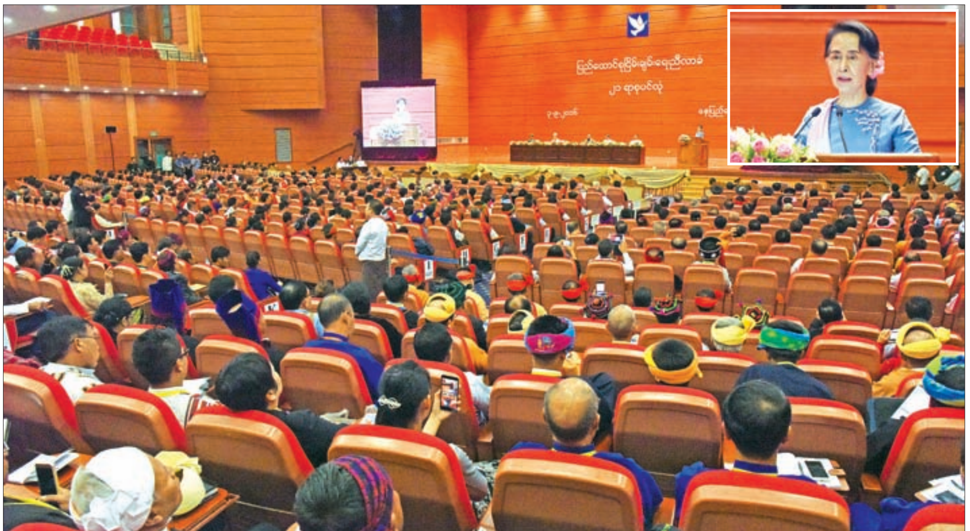
State Counsellor Daw Aung San Suu Kyi expressing her words of thanks to the stakeholders at the 21st Century Panglong Conference.

STATE Counsellor Daw Aung San Suu Kyi expressed her words of thanks to the stakeholders at the 21st Century Panglong Conference, also known as the Union Peace Conference, which came to a successful conclusion yesterday.