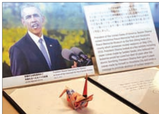
Photo taken on 3 September, 2016, shows a paper crane made by US President Barack Obama during his historic visit to Hiroshima in May, which went on display at the Nagasaki Atomic Bomb Museum in Nagasaki, the second Japanese city devastated by a US atomic bomb.

NAGASAKI — A paper crane made by US President Barack Obama during his historic visit to Hiroshima in May went on display Saturday in Nagasaki, the second Japanese city hit by US atomic bombing.