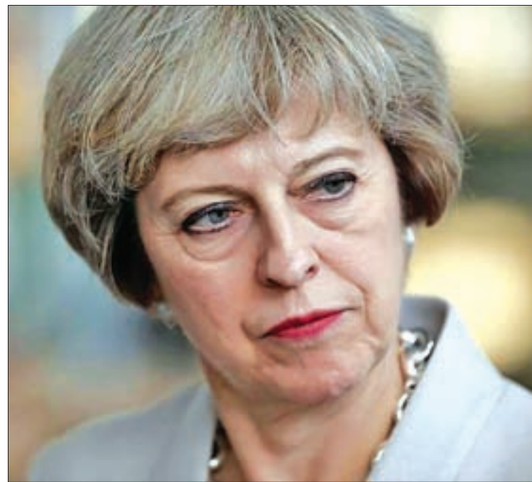
Britain's Prime Minister Theresa May visits a joinery factory in London, Britain, on 3 August 2016.

LONDON — British Prime Minister Theresa May said on Saturday Sino-British relations were in a golden era but made no mention of a looming row with Beijing over her suspension of a partly Chinese-funded nuclear power station deal.