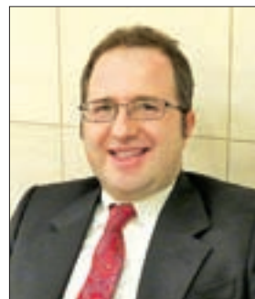
Leon Malazogu, Kosovo's incoming ambassador to Japan, speaks with Kyodo News in Tokyo on 2 September, 2016.

The country can now freely export to the European Union, a few hours away by road, under an agreement that came into force