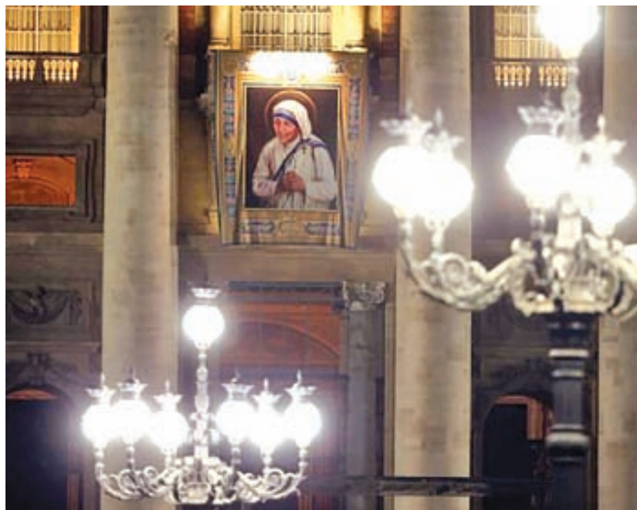
A tapestry picturing Mother Teresa hangs from the central balcony of St. Peter's Basilica at the Vatican, on 1 September 2016.

"She was a woman whose huge contribution cannot be described in words," another Skopje resident, Sotjmen Nasteski, said. "She taught us modesty, humanity." —Reuters