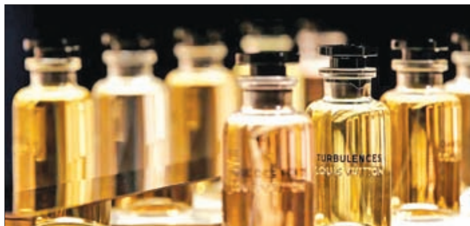
The new collection of bottles of perfume is seen as Louis Vuitton launches seven fragrances created by perfumer Jacques Cavallier, in Paris, France, on 2 September 2016.