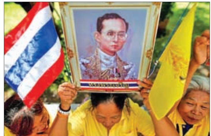
A well-wisher holds a picture of Thailand’s King Bhumibol Adulyadej at the Siriraj hospital where he is residing, in Bangkok, Thailand, on 9 June 2016.

Over the weekend, policemen conducted security checks on streets while men identifying themselves as volunteer security guards patrolled. Two volunteers told Reuters journalists they were not allowed to film in residential areas.—Reuters