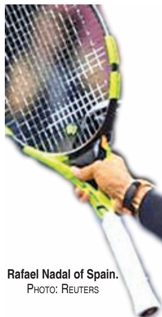
Rafael Nadal of Spain.

NEW YORK — Fourth seed Rafa Nadal showed he is healthy and ready to challenge for a third US Open title as he rolled into the last 16 at Flushing Meadows on Friday with a fist-pumping 6-1, 6-4, 6-2 win over Russian Andrey Kuznetsov.