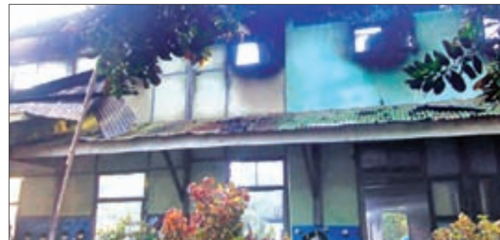
The school seen after outbreak of fire.