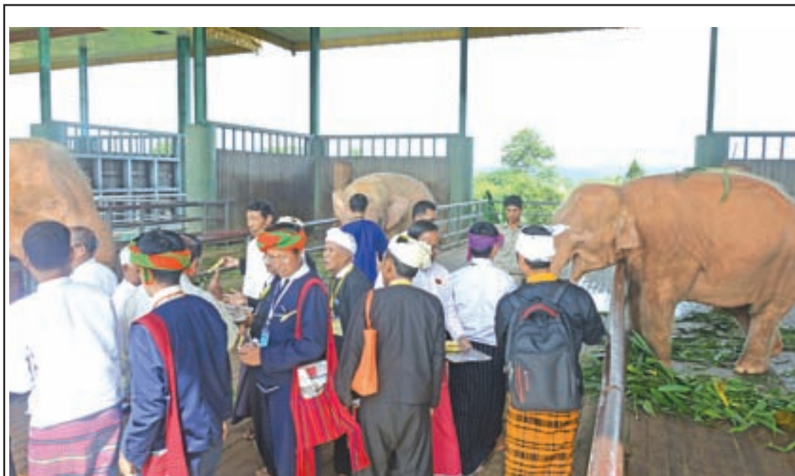
UPC attends going on a after the conclusion of the conference.

After the press briefing, the joint committee continued to hold its third meeting attended by 15 people from the government's group, 15 from EAO and 13 from political parties' group. — Myanmar News Agency