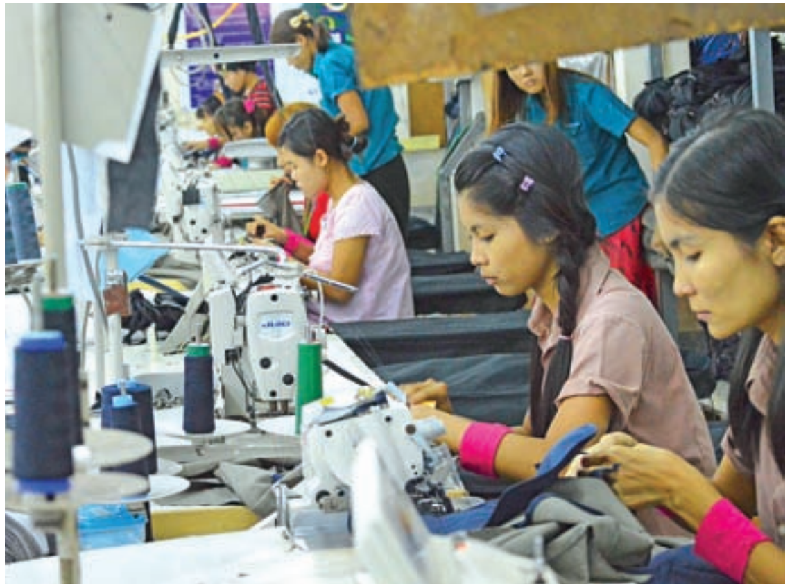
Employees sew the clothes at a garment factory in Mingaladon Industrial Zone in Yangon.

MYANMAR Investment Commission has granted permission for the establishment of five garment factories in Yangon's industrial zones which are expected to create more than 6,000 local job opportunities.