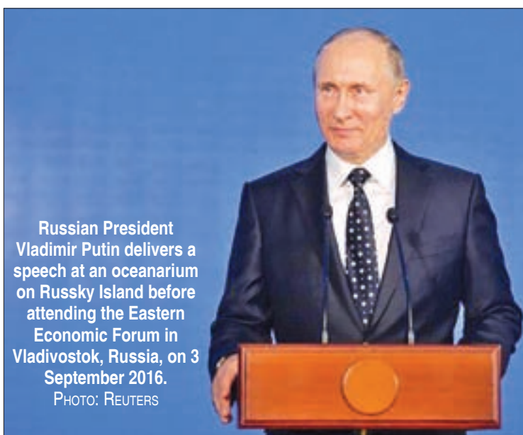
Russian President Vladimir Putin delivers a speech at an oceanarium on Russky Island before attending the Eastern Economic Forum in Vladivostok, Russia, on 3 September 2016.

"In order for Pyongyang to take the decision to abandon its nuclear programme, it is important to give it a strong unified message," Park told the forum in