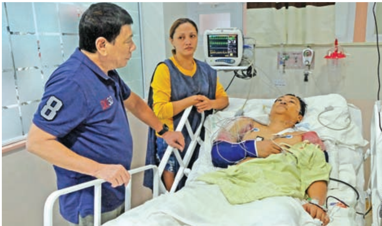
President Rodrigo Duterte talks to the wounded victims of an explosion during his visit of a hospital in Davao city, Philippines, on 3 September 2016.

Defence Secretary Delfin Lorenzana said Abu Sayyaf would have good reason to retaliate and he had placed the military on high alert for possible attacks elsewhere.—Reuters