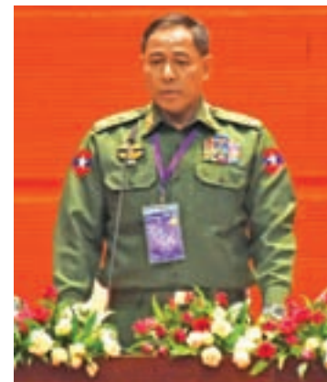
Lt-Gen Yar Pyae.

U Khet Htein Nan, an ethnic representative, called ceasefire the top priority as continued fighting