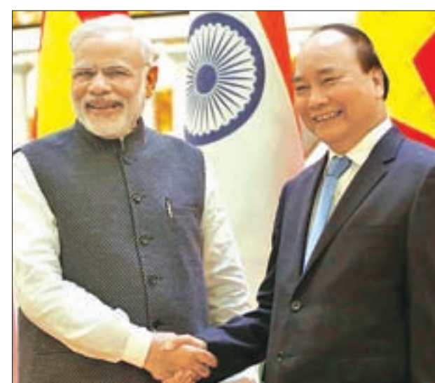
India's Prime Minister Narendra Modi poses for a photo with his Vietnamese counterpart Nguyen Xuan Phuc at the Government office in Hanoi, Viet Nam, on 3 September 2016.

The offer comes after a surge of almost 700 per cent in Viet Nam's defence procurements as of 2015, according to the Stockholm International Peace Research Institute think-tank, which tracks the arm trade over five-year periods.