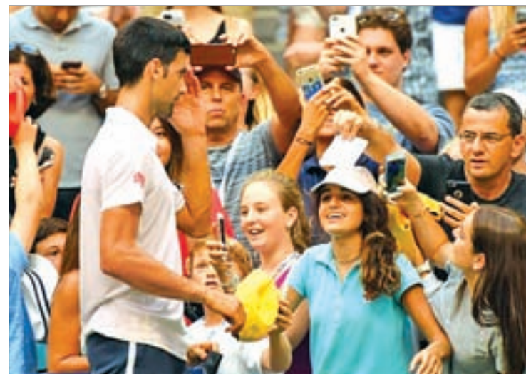
Novak Djokovic of Serbia reacts after playing Mikhail Youzhny of Russia on day five of the 2016 US Open tennis tournament at USTA Billie Jean King National Tennis Centre, New York, on 2 September 2016.

"I'm not too concerned about my game itself. I've worked hard last couple days. Health-wise, I feel much better than I did at the beginning of the tournament," he said. "I'm confident that everything is going in the right direction." — Reuters