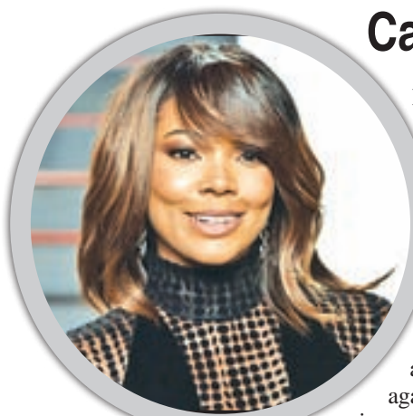
Gabrielle Union.

LOS ANGELES — Birth of a Nation actress Gabrielle Union says the film is important for her but she cannot take rape allegations on its director and her co-star Nate Parker lightly.