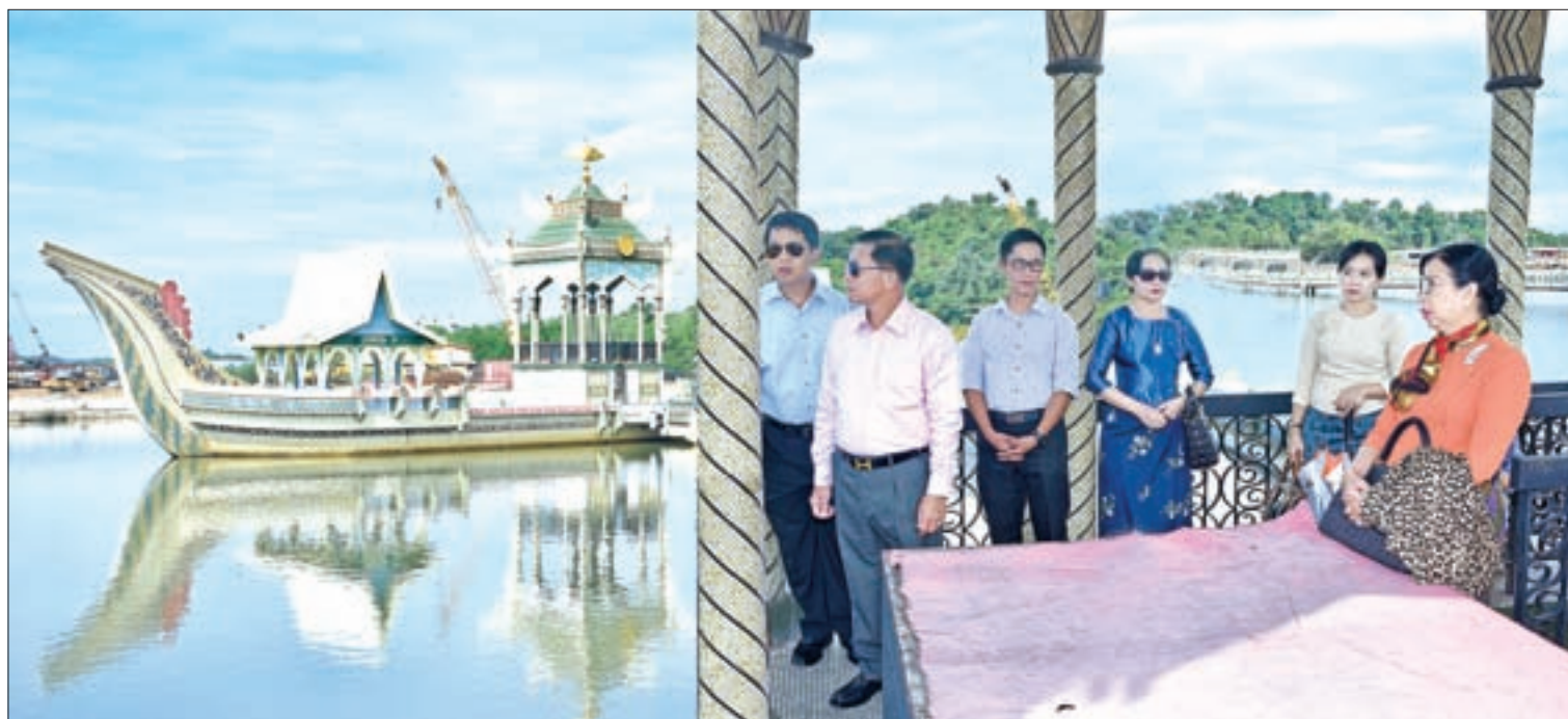
Senior General Min Aung Hlaing and wife Daw Kyu Kyu Hla visiting around in Brunei.

Daw Kyu Kyu Hla, wife of Senior General Min Aung Hlaing has also paid a courtesy call on the Queen of Brunei at the palace.— Myanmar News Agency