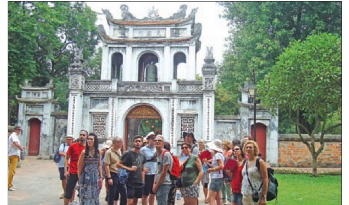
Tourists are being seen in front of the Temple of Literature.

Vietnamese cuisine has various kinds of food which are delicious. 'Pho Ga' (chicken noodle soup) and 'Pho Bo' (Beef noodle soup) are the most famous cuisine. There are diverse dishes including chicken, beef, fish and seafood. Nowadays,