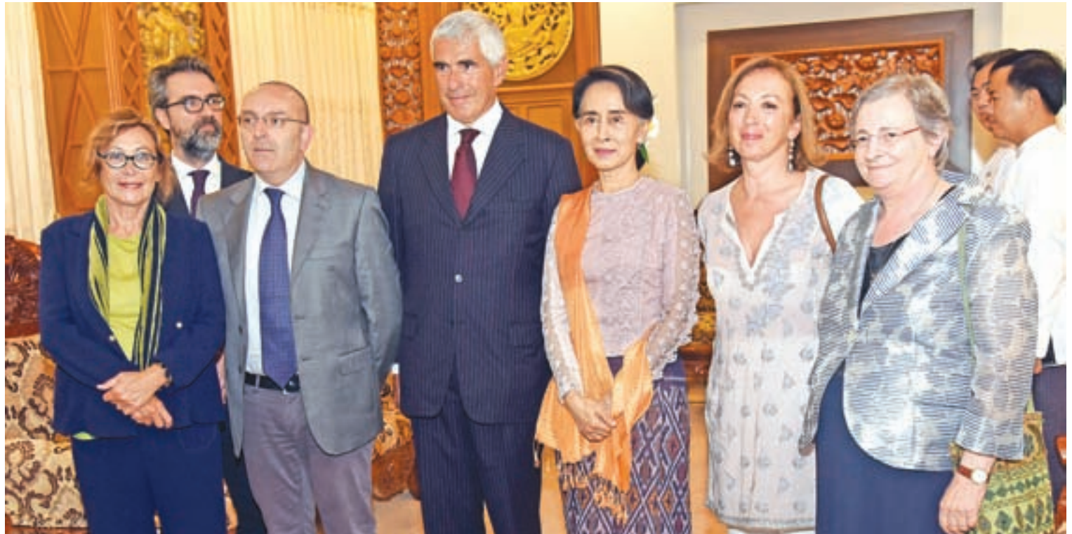
Daw Aung San Suu Kyi receives Chairperson of the Italian Senate's Standing Committee on Foreign Affairs Mr. Pier Ferdinando Casini.

The two representatives discussed matters relating to the country's peace and reform processes and further relations and promoting cooperation between the two countries.— Myanmar News Agency