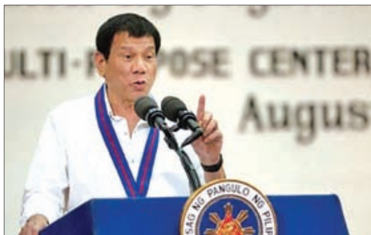
Philippine President Rodrigo Duterte gestures while delivering a speech during the 115th Police Service Anniversary at the Philippine National Police (PNP) headquarters in Quezon city, metro Manila, Philippines, on 17 August 2016.