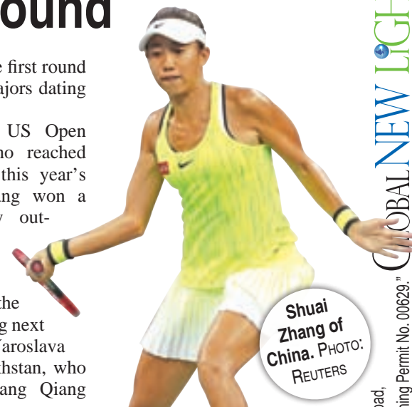
Shuai Zhang of China.

Against 2011 US Open winner Stosur, who reached the semi-finals at this year's French Open, Zhang won a baseline battle by outmanoeuvring the Australian, forcing her into 27 errors, including 20 from the forehand side. Zhang next faces 52 nd -ranked Yaroslava Shvedova of Kazakhstan, who routed China's Wang Qiang 6-0, 6-1. — Reuters