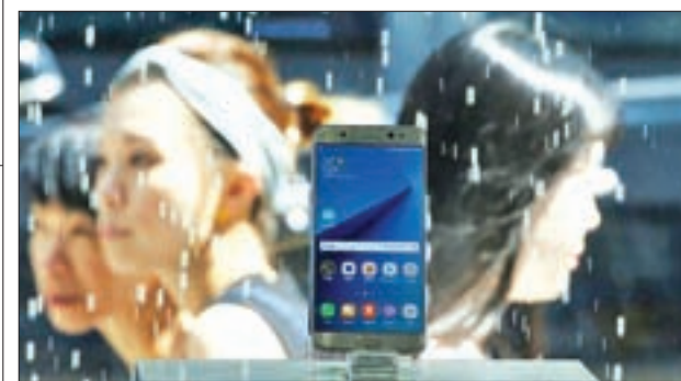
A Samsung Electronics' Galaxy Note 7 new smartphone is displayed at its store in Seoul, South Korea, on 2 September 2016.

The scale of the recall is unprecedented for Samsung, which prides itself on its manufacturing prowess. While recalls in the smartphone industry do happen, including for rival Apple Inc (AAPL.O), the nature of the problem for the Galaxy Note 7 is a serious blow to Samsung's reputation, analysts said.— Reuters