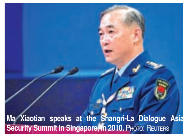
Ma Xiaotian speaks at the Shangri-La Dialogue Asia Security Summit in Singapore, in 2010.

China’s foreign ministry said on Friday China was open to a meeting with Duterte during the summit in Laos, and would also welcome him to visit China at an early date.—Reuters