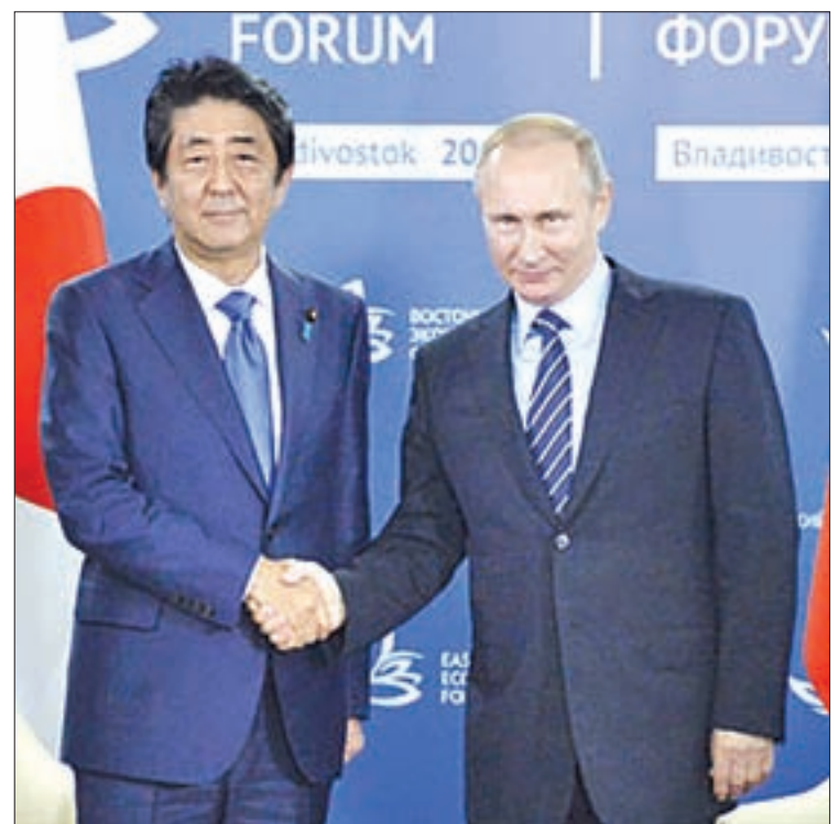
Japanese Prime Minister Shinzo Abe (L) meets with Russian President Vladimir Putin in the Russian Far East port city of Vladivostok, on 2 September 2016. The leaders meeting saw them focus on economic cooperation and a decades-old territorial dispute.

Russia says the territorial and peace treaty issues are not directly connected and that it took control of the isles legiti-