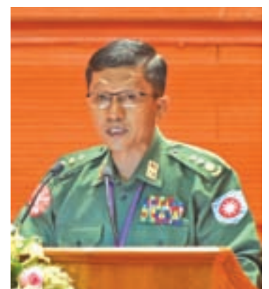
Col Min Oo.

He pointed out that every nation of the world has only one army, that the Tatmadaw is only