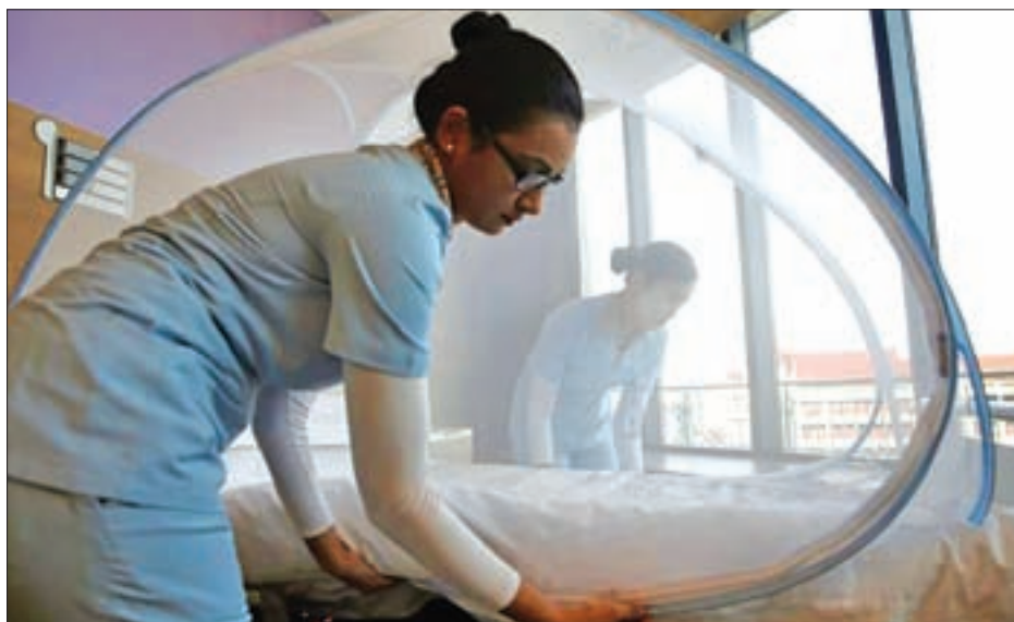
Nurses set up a mosquito tent over a hospital bed, as part of a precautionary protocol for patients who are infected by Zika, to show the media at Farrer Park Hospital in Singapore, on 2 September 2016.

Race promoters have said preparations were going according to plan.—Reuters