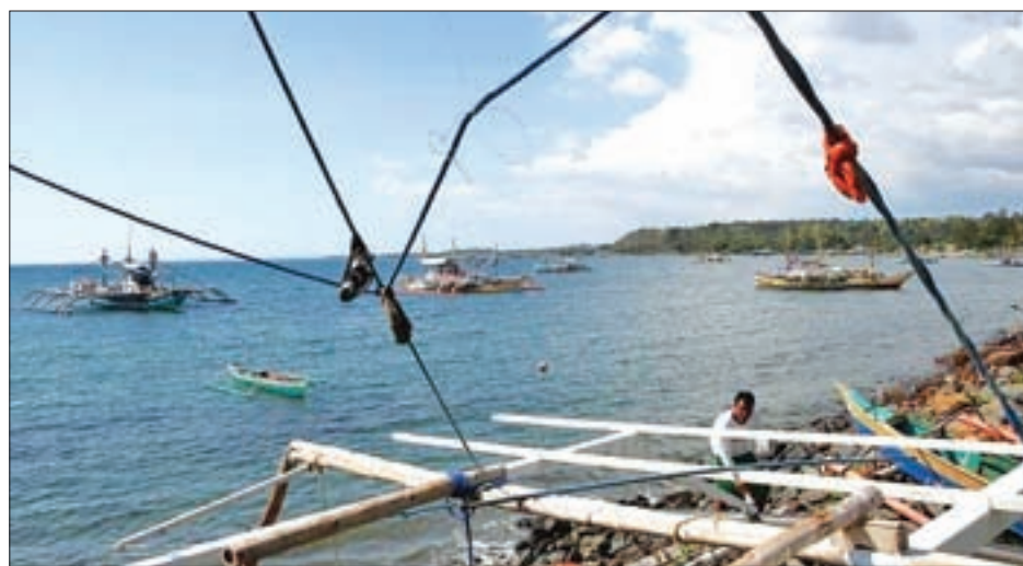
A fisherman repairs his boat overlooking fishing boats that fish in the disputed Scarborough Shoal in the South China Sea, at Masinloc, Zambales, in the Philippines in 2015.