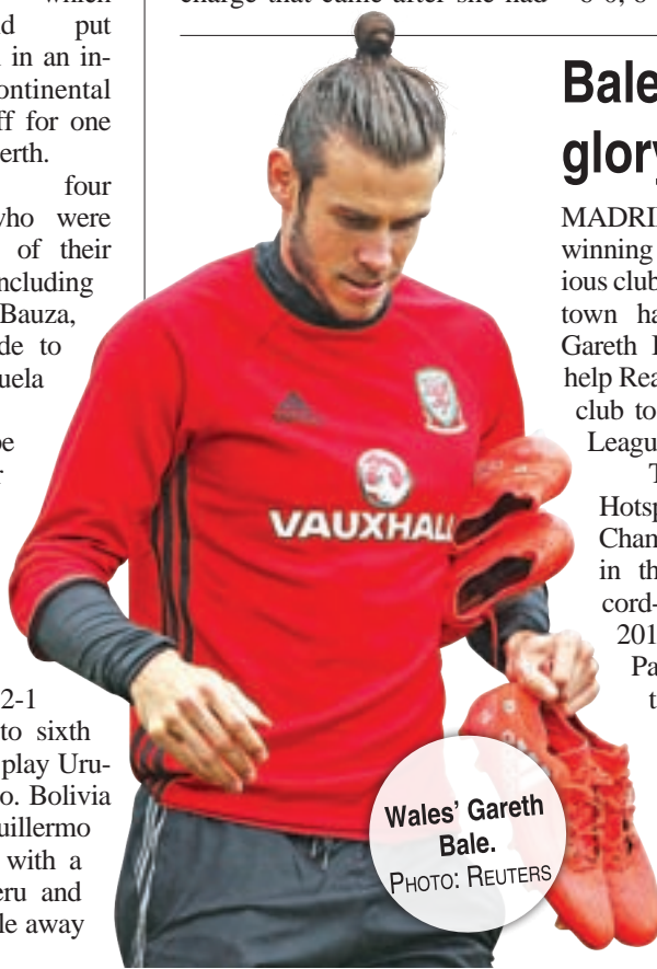
Wales' Gareth Bale. PHOTO: REUTERS

English Premier League clubs spent a staggering 1.165 billion pounds ($1.55 billion) on new recruits during the close season but Bale felt the massive outlay will not necessarily translate into success on the continental stage. — Reuters