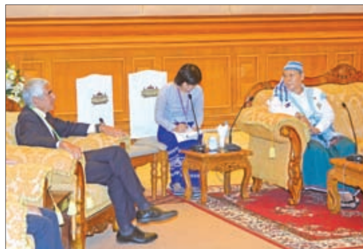
Mahn Win Khaing Than receiving Mr Pier Ferdinando Casini.