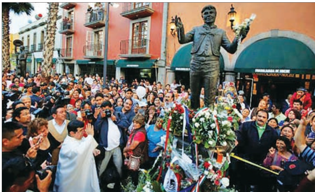
A Catholic priest blesses the statue of late Mexican singer Juan Gabriel during a mass in his honor in Plaza Garibaldi, in Mexico City, Mexico, 30 August 2016.