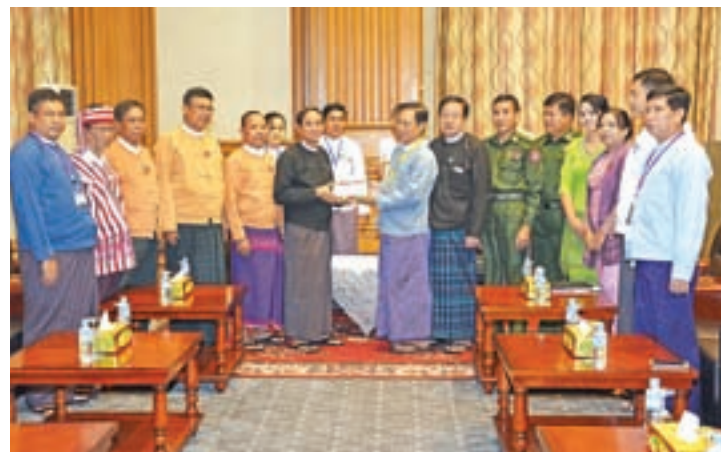
U Win Myint handing over the donation.

Also present at the cash donation ceremony were Deputy Pyithu Hluttaw speaker U T Khun Myat, Pyithu Hluttaw representatives, Defence Services personnel Pyithu Hluttaw representatives and officials of the Pyithu Hluttaw Office.— Myanmar News Agency