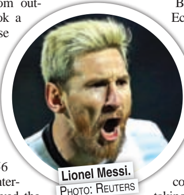
Lionel Messi.

Brazil's Tite will be looking to confirm their improvement at home against Colombia, who beat Venezuela 2-0. Paraguay, under new coach Francisco Arce, upset Copa America holders Chile 2-1 in Asuncion to climb to sixth also with 12 points and play Uruguay next in Montevideo. Bolivia gave their new coach Guillermo Hoyos a winning start with a 2-0 home win over Peru and face seventh-placed Chile away next. — Reuters