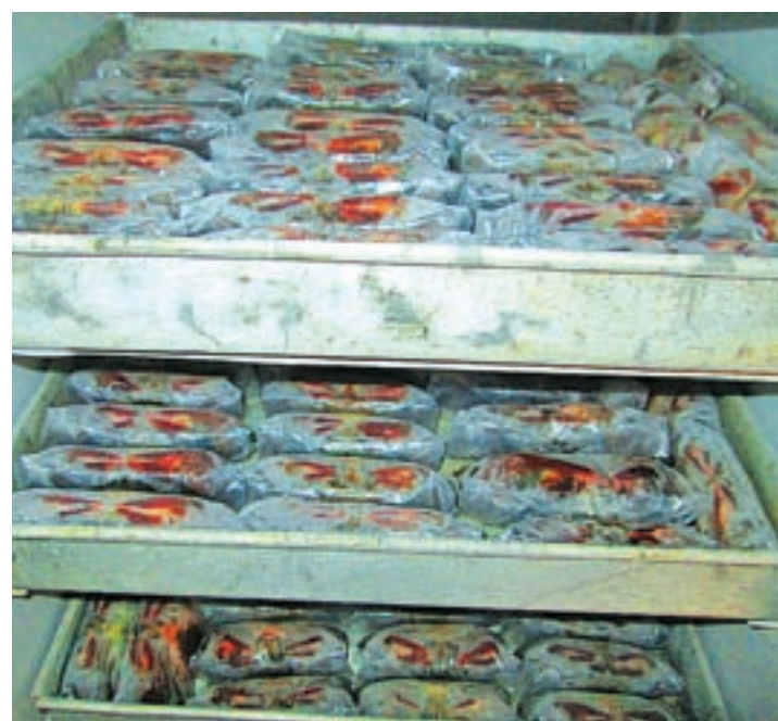
Packed Soft-shell crab.

It reportedly takes between 45 - 50 days to turn hard-shell crabs into those with a soft shell. A kilo of soft-shell crabs are exported to the international market for US$5-10, while last year saw exporters able to sell the same quantity for between US$12-13.—Myitmakha News Agency