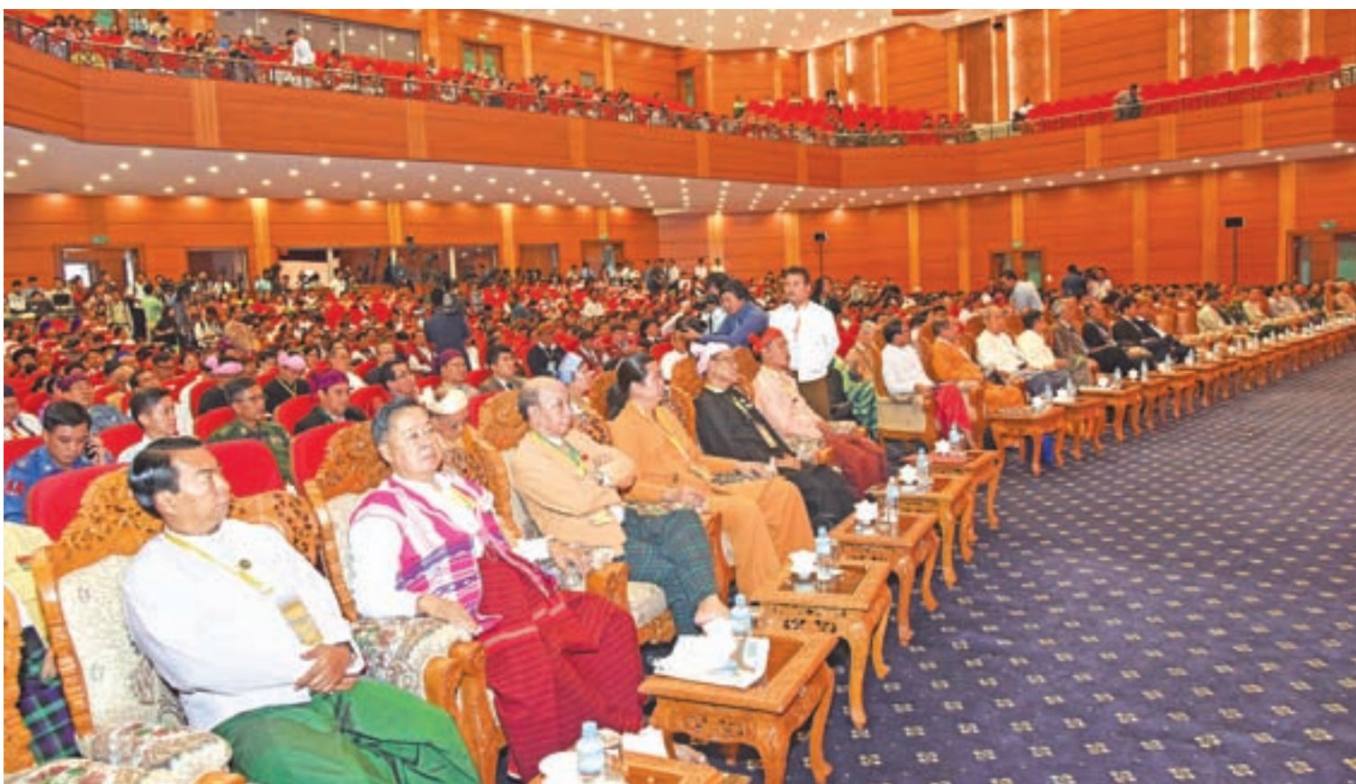
Representatives listen to discussion at the Union Peace Conference—21st Century Panglong.

T HE Union Peace Conference (UPC)—21st Century Panglong continued into its third day session at MICC-2 in Nay Pyi Taw yesterday with political party representative U Thu Wai, government representative Union Minister Dr Win Myat Aye, Tatmadaw representative Lt-Gen Tin Maung Win, indigenous armed organisations representative Bao Khe and Hluttaw representative U N Hton Kha Naw San as members of the panel