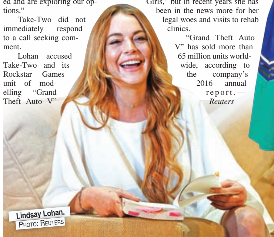
Lindsay Lohan.

"Grand Theft Auto V" has sold more than 65 million units worldwide, according to the company's 2016 annual report.—Reuters