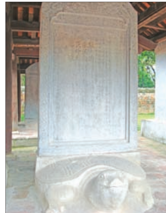
Stone tablet mounted on the back of a tortoise at Temple of Literature.

is a high-end residential area housing a large population of expatriates. And then many other kinds of districts are located in Hanoi. There have a large number of universities, including the National University's main campus and Hanoi University of Education. The Museum of Ethnology, one