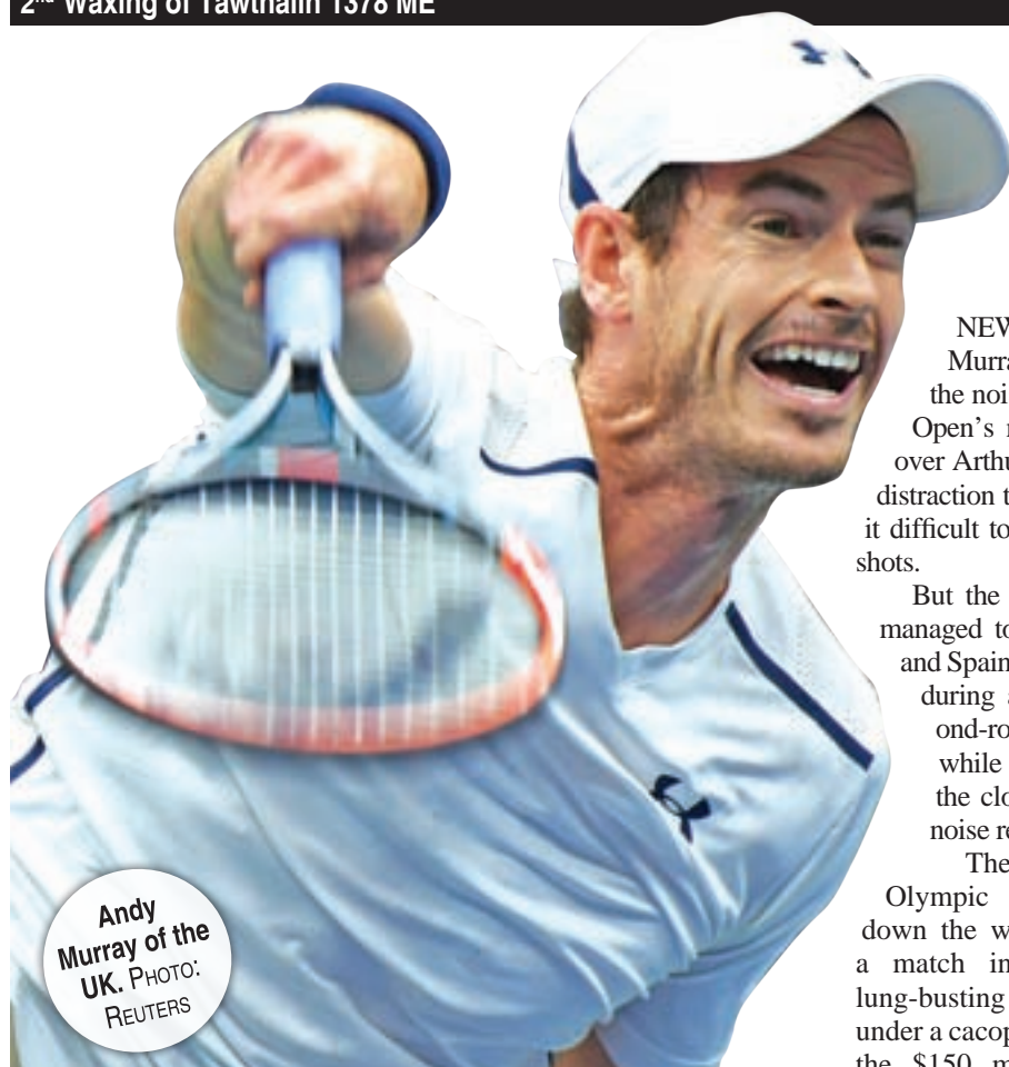
Andy Murray of the UK.