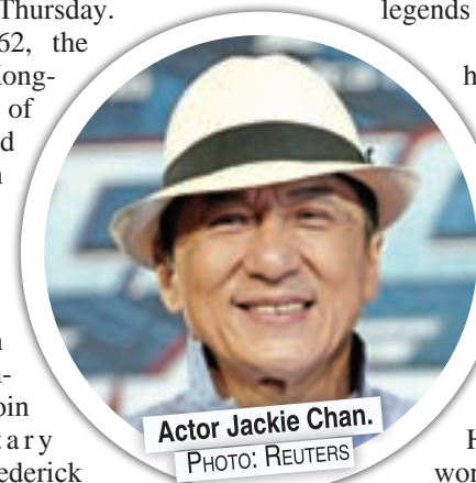
Actor Jackie Chan.

In August, he was ranked the second-highest paid actor in the world by Forbes with estimated 2016 earnings of $61 million, just below "Fast and Furious" star Dwayne Johnson.