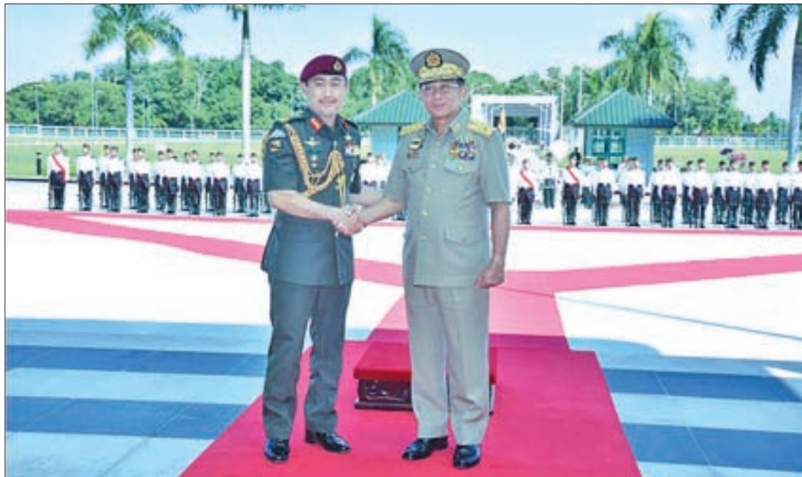
Senior General being seen at the ceremony to receive Honour Guard.