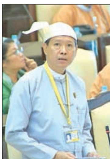
Dr Myo Thein Gyi.

A question and answer session followed with Union Minister for Education Dr Myo Thein Gyi answering a question regarding the construction of a