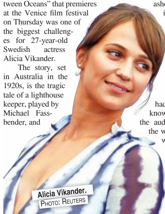
Alicia Vikander.

Vikander said she was nervous to work with Fassbender, who she described as "one of the most brilliant actors out there", but the energy she brought to the movie impressed.—Reuters