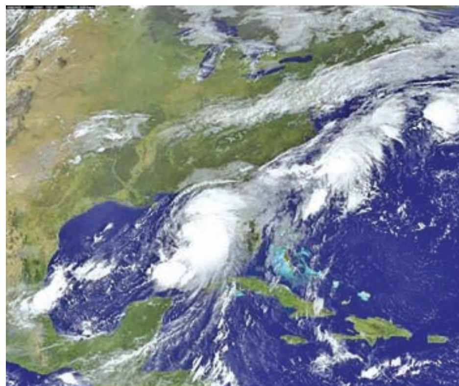
Tropical Storm Hermine is shown over the Gulf of Mexico in this GOES East satellite image captured, on 1 September 2016.

The National Weather Service issued several tornado warnings and watches for communities throughout northern Florida