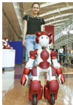
Developed by Hitachi Ltd., humanoid robot EMIEW3 guides a woman, who plays the role of a passenger, during a demonstration at Haneda airport in Tokyo, on 2 September 2016.