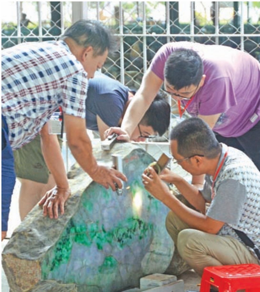
Merchants appraise a jade stone at the 53rd Myanmar Gems Emporium in Nay Pyi Taw.

Over the 2015-2016 fiscal year, raw jade worth US$305.779 million was exported to China via the Muse border 115 mile camp. The export of raw jade from April to July in the 2016-2017 fiscal year amounted to US$ 53.016 million with an export volume of 475.096 tonnes.