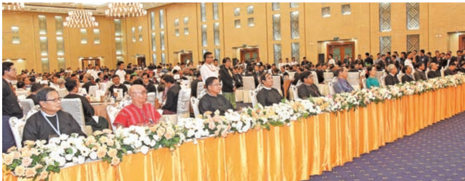
Attendees to Union Peace Conference—21st Century Panglong enjoy performance of artistes at the dinner.

During the dinner, a cultural troupe from Mongla Region in Shan State and artistes from the Fine Art Department performed songs and dances.— Myanmar News Agency