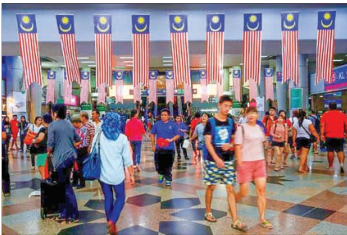
Commuters walk through the hallway of KL Sentral train station in Kuala Lumpur, Malaysia on 27 August 2016.

Authorities in Muslim-majority Malaysia have been on high alert since Islamic State-linked militants carried out an armed attack in the capital of neighbouring Indonesia in January.