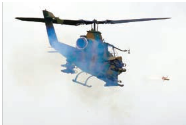
A Japanese Ground Self-Defence Force AH-1S helicopter fires anti-tank missile during an annual training session near Mount Fuji at Higashifuji training field in Gotemba, west of Tokyo, on 25 August 2016.

The United States has said the North's claim that it had miniaturized a warhead had to be taken as a credible threat.—Reuters