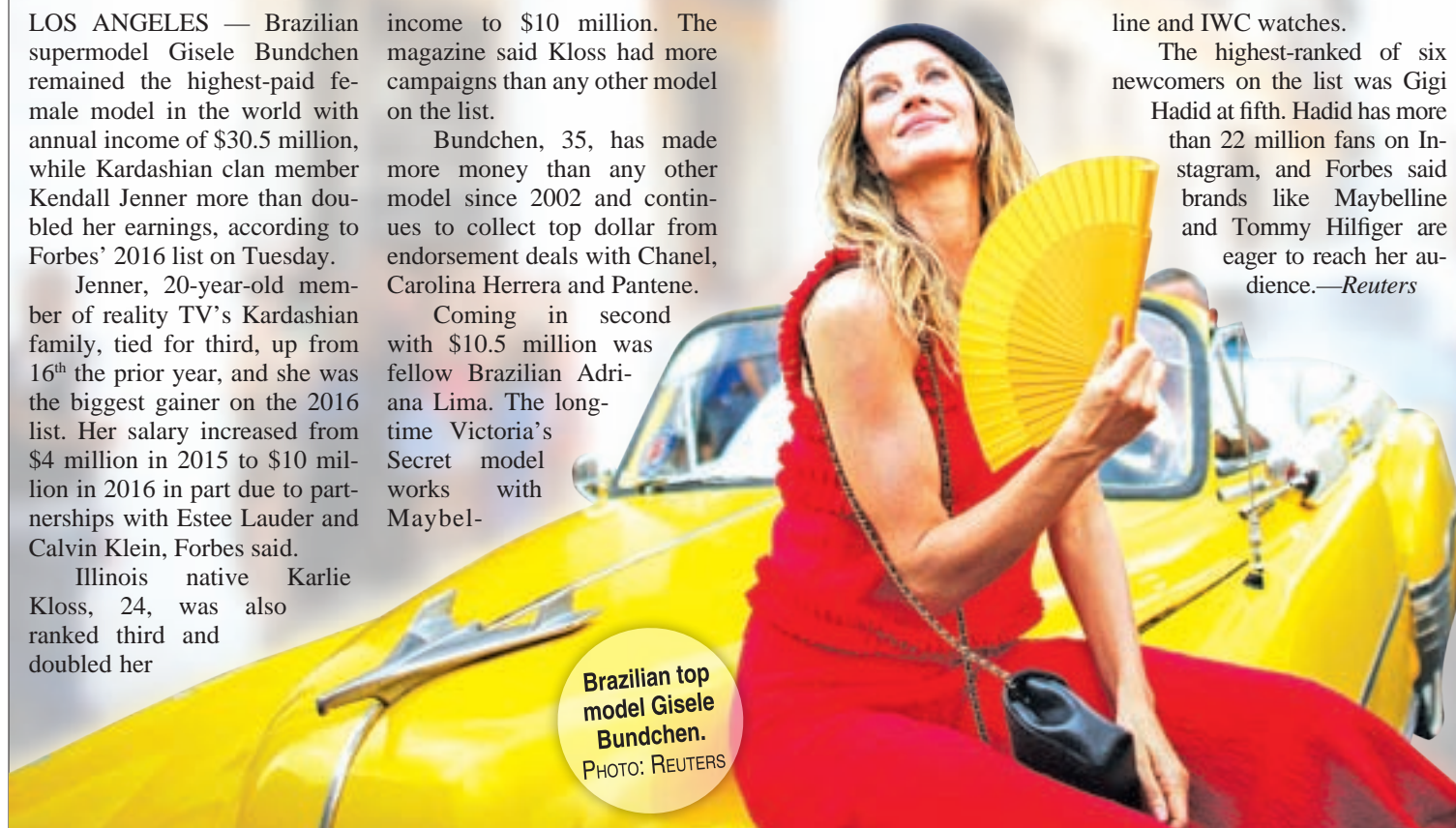
Brazilian top model Gisele Bundchen.

The highest-ranked of six newcomers on the list was Gigi Hadid at fifth. Hadid has more than 22 million fans on Instagram, and Forbes said brands like Maybelline and Tommy Hilfiger are eager to reach her audience.—Reuters