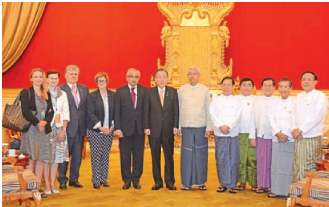
President U Htin Kyaw, United Nations Secretary-General Mr Ban Ki-moon, diplomats and Ministers pose for a group photo at president's residence in Nay Pyi Taw.

PRESIDENT U Htin Kyaw met United Nations Secretary-General Mr Ban Ki-moon at his residence in Nay Pyi Taw yesterday.