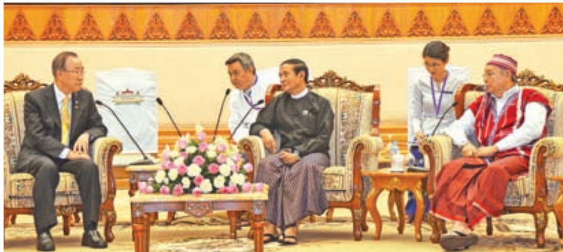
Pyithu Hluttaw Speaker U Win Myint and Amyotha Hluttaw Speaker Mahn Win Khaing Than receive Secretary-General of the United Nations Mr. Ban Ki-moon.

PYITHU HLUTTAW Speaker U Win Myint and Amyotha Hluttaw Speaker Mahn Win Khaing Than received Secretary-General of the United Nations Mr. Ban Ki-