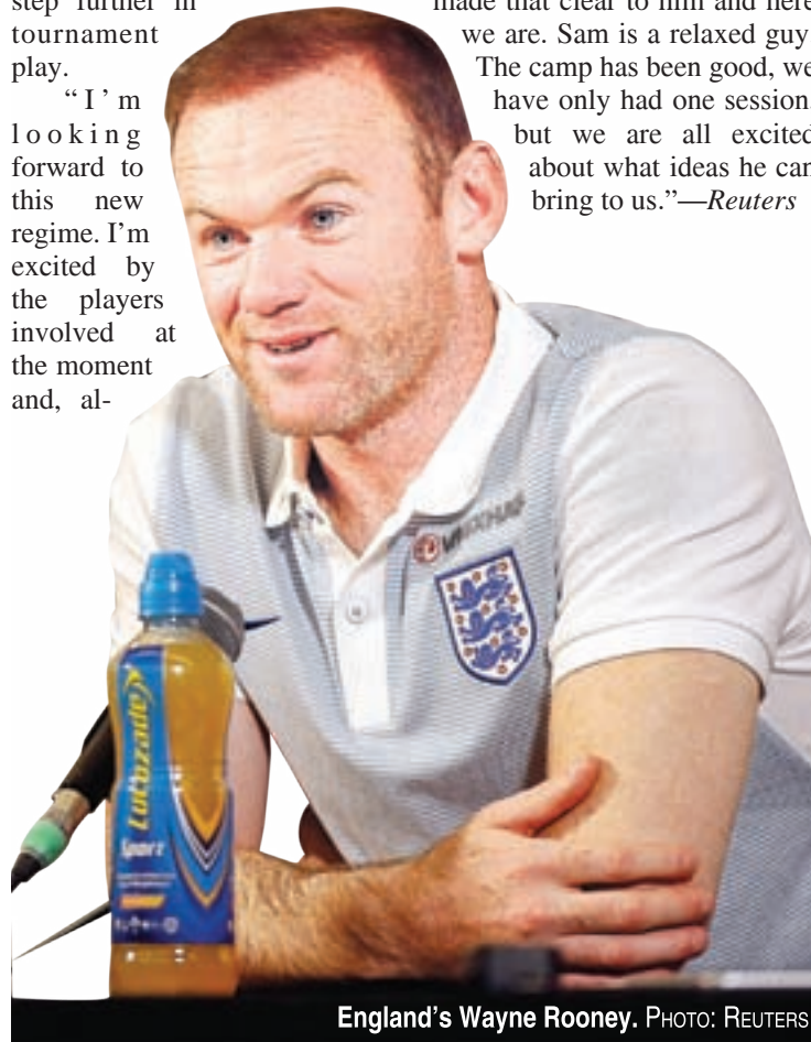
England's Wayne Rooney.

but we are all excited about what ideas he can bring to us."—Reuters