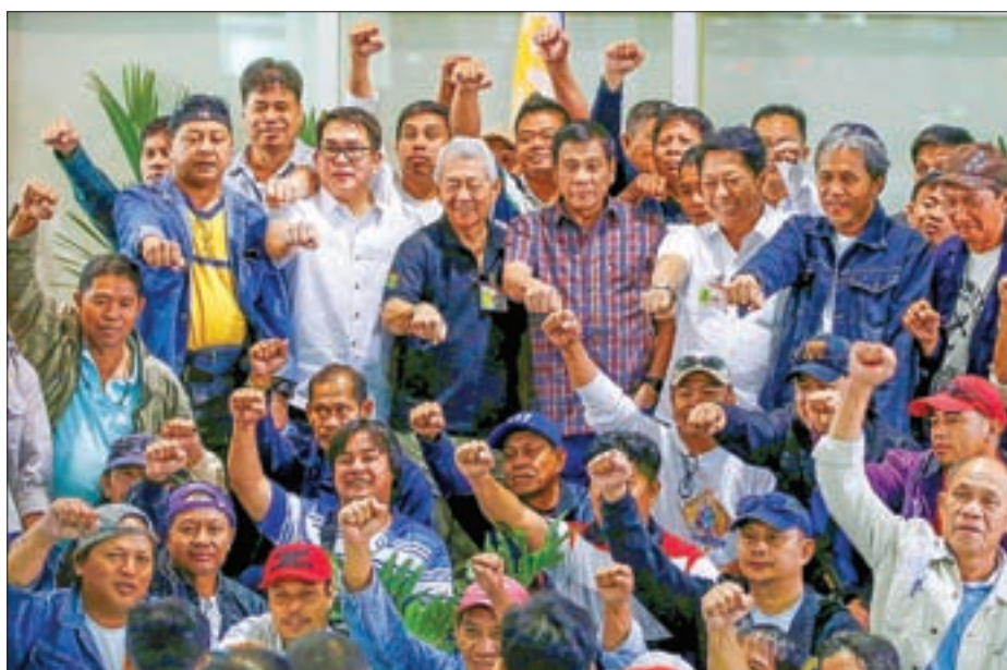
Overseas Filipino workers who were repatriated by the Philippine government from Saudi Arabia, pose with Philippine President Rodrigo Duterte after arriving at the Ninoy Aquino International Airport in Manila, Philippines, on 31 August 2016.

"Avoid drugs at all cost because it could cost your