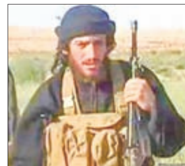
IS spokesman and head of external operations Abu Muhammad al-Adnani is pictured in this undated handout photo, courtesy the US Department of State.

A US counter-terrorism official who monitors Islamic State said Adnani's death would hurt the militants "in the area that increasingly concerns us as the group loses more and more of its caliphate and its financial base