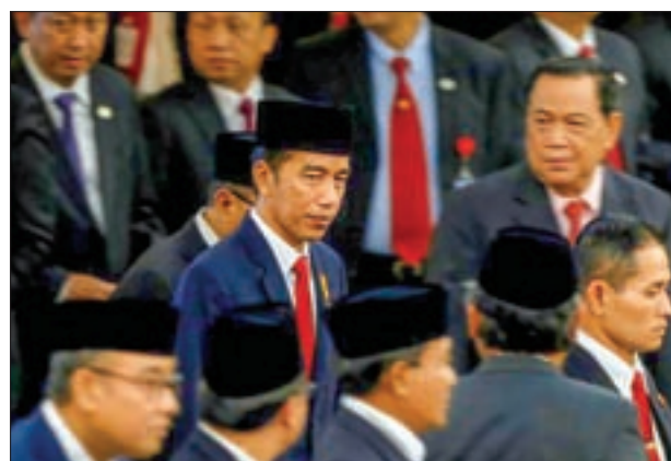
Indonesia's President Joko Widodo (C) walks between parliament members as he arrives at the House of Representatives building in Jakarta, Indonesia, on 16 August 2016.

Instead, he has concentrated on building alliances to bolster his authority, an echo of former strongman Suharto, whose mastery of political dealmaking kept