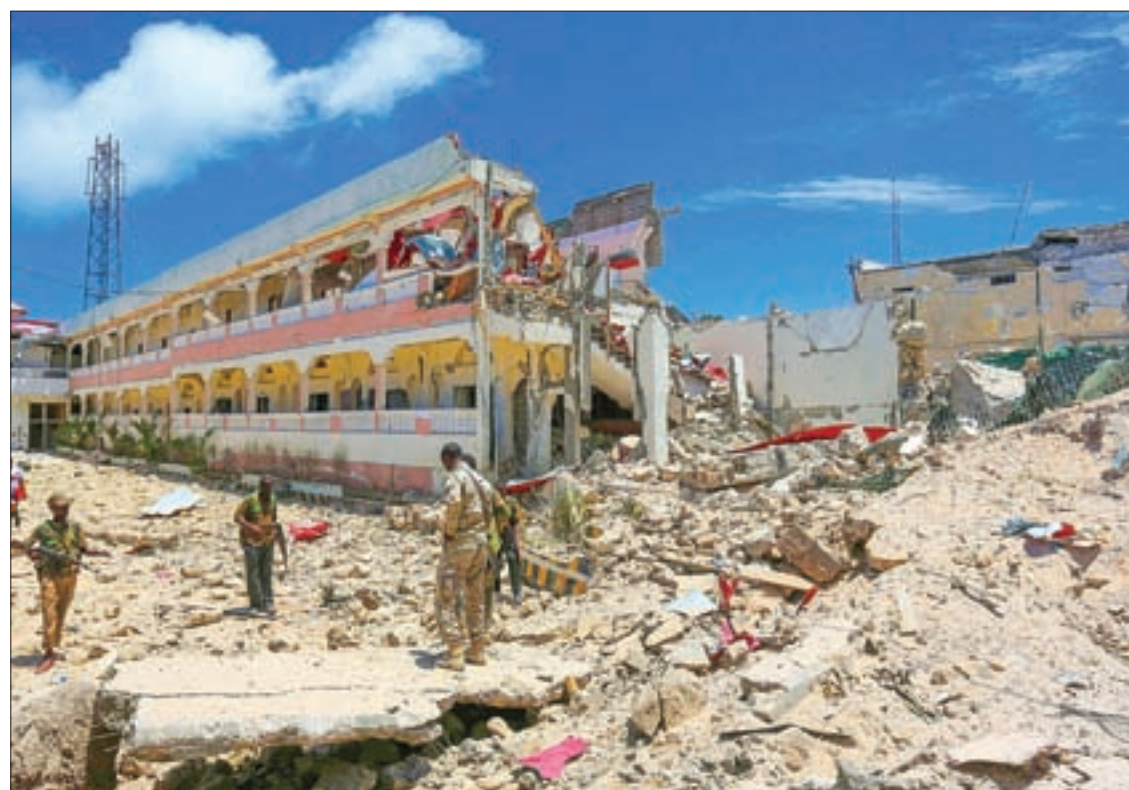
Security forces stand at the SYL hotel that was partly destroyed following a car bomb claimed by al Shabaab Islamist militants outside the president's palace in the Somali capital of Mogadishu, on 30 August 2016.

... and turns to mounting and inspiring more attacks in Europe, Southeast Asia and elsewhere". —Reuters