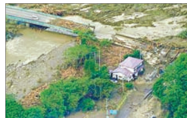
Photo taken from a Kyodo News airplane on 31 August, 2016, shows a destroyed bridge in Iwaizumi, Iwate Prefecture in northeastern Japan, following heavy rains brought by typhoon Lionrock. Iwate was one of the hardest-hit areas in the devastating March 2011 tsunami.

adjacent to the building where the dead bodies were found nearby, some 70 to 80 people are being airlifted by helicopter to safety, a local social welfare council said, adding nobody is in a serious condition. In Iwaizumi, three residents were rescued by the country's Self Defence Forces after being stranded by flooding in the central part of the town that severed road access.—Kyodo News