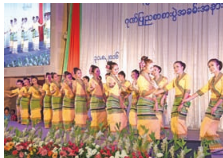
Artistes entertain the attendees to Union Peace Conference.