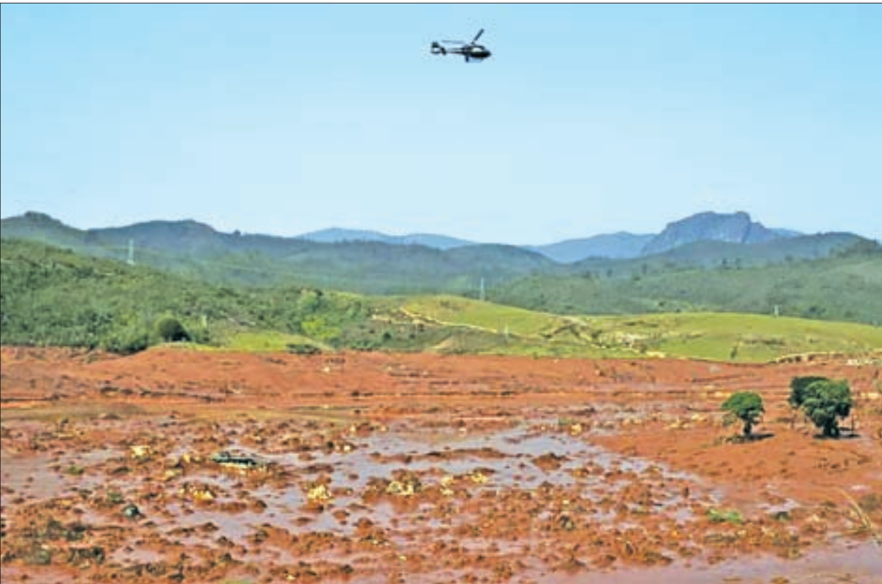
A helicopter flies over the Bento Rodrigues District, covered with mud after a dam owned by Vale SA and BHP Billiton Ltd burst in Mariana, Brazil, in 2015.