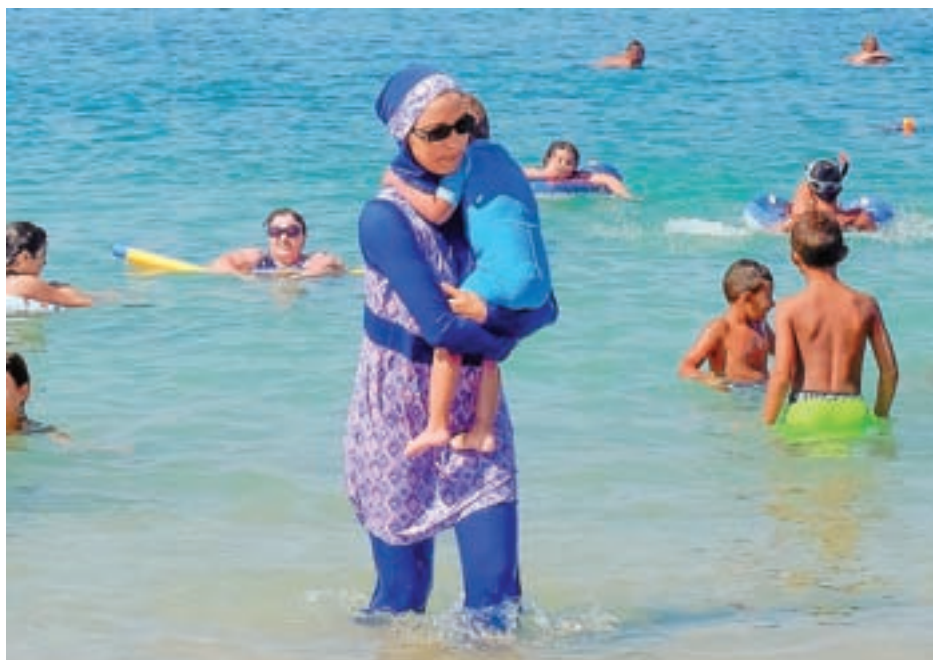
A woman wearing a burkini walks in the water on 27 August 2016 on a beach in Marseille, France, the day after the country’s highest administrative court suspended a ban on full-body burkini swimsuits that has outraged Muslims and opened divisions within the government, pending a definitive ruling.

“We call on the authorities in all the other French seaside towns and resorts that have adopted similar bans to take note of the Conseil d’Etat’s ruling that the ban constitutes a grave and illegal breach of