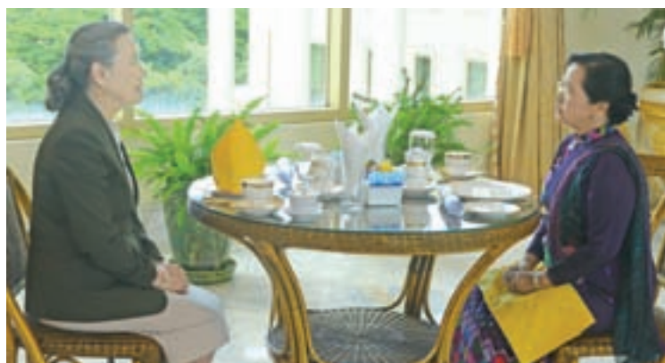
President's wife discusses with wife of UN Secretary-General.

DAW SU SU LWIN, wife of President U Htin Kyaw, met Mrs Ban Soon-taek, wife of United Nations Secretary General Ban Ki-moon, at the Presidential Palace in Nay Pyi Taw yesterday afternoon.