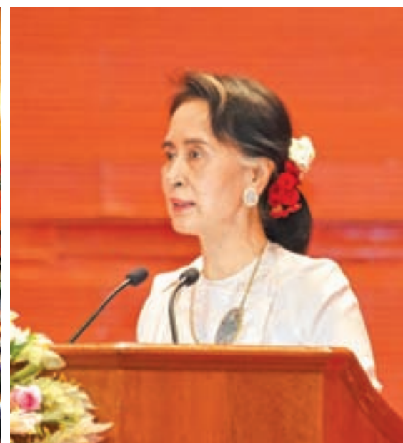
State Counsellor Daw Aung San Suu Kyi addresses the opening ceremony of the Union Peace Conference—21st Century Panglong.

Since its inception it has been the aim of the National League for Democracy to hold political negotiations based on the Panglong spirit and the principle of finding solutions through the guarantee of equal rights, mutual respect and mutual confidence between all ethnic nationalities. The government that emerged after the 2015