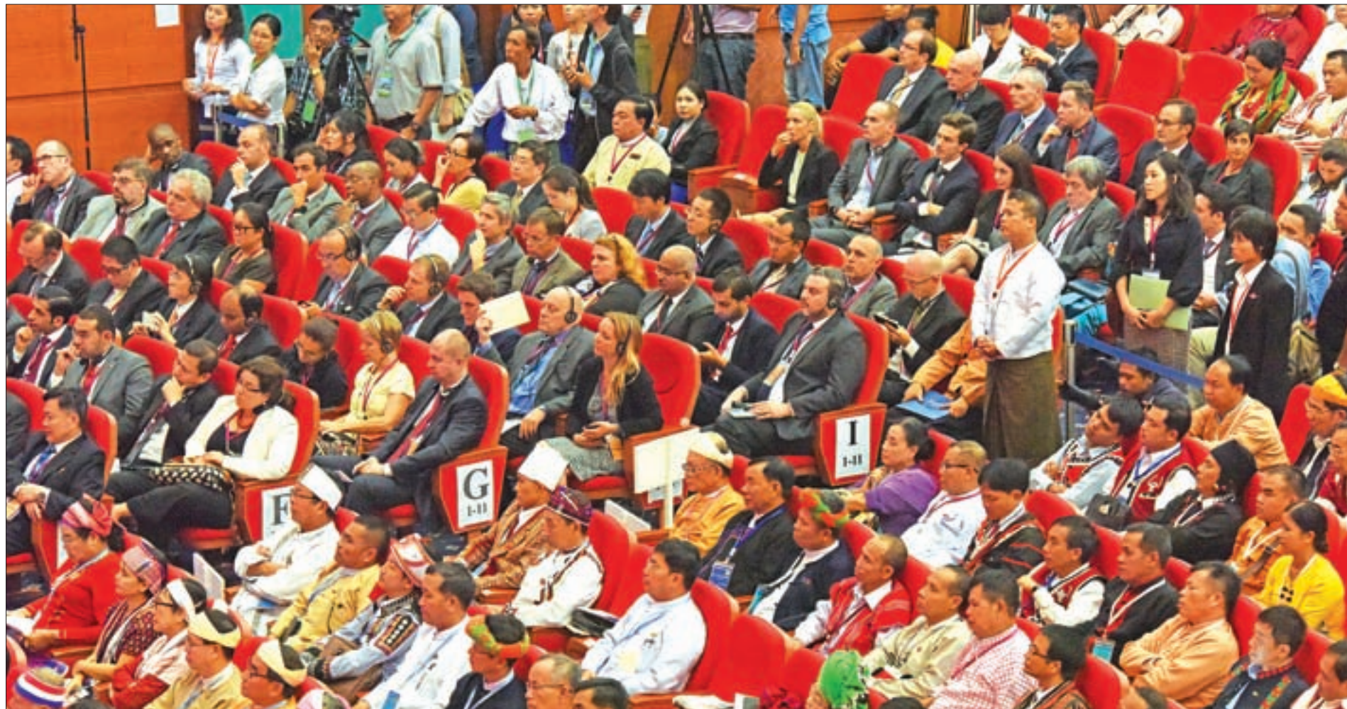
Ethnic representatives and diplomats attend the Union Peace Conference—21st Century Panglong in Nay Pyi Taw.

T HE Union Peace Conference—21st Century Panglong commenced yesterday at the Myanmar International Convention Centre—2 in Nay Pyi Taw, with an opening address by Preparatory Committee Chairman Dr Tin Myo Win, who chaired the event.