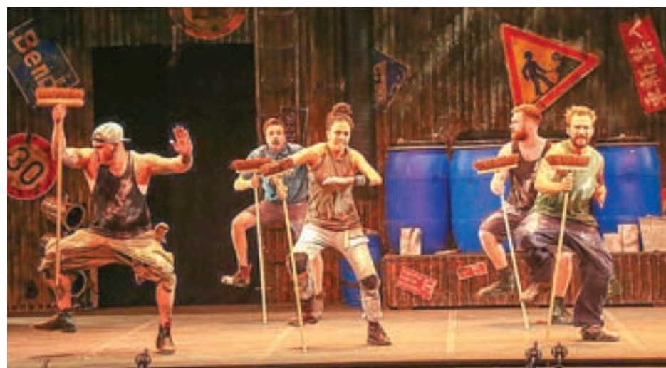
“Stomp out loud” is performed in Beijing, capital of China, on 24 August 2016.

Founded in 1991, STOMP stands out with its unique style and skill that combine movement with