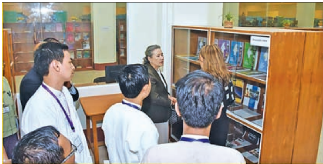
Mrs. Ban Soon-taek observing library, learning centre.

MRS. Ban Soon-taek, wife of the Secretary-General of the United Nations, visited the Hluttaw Library and learning centre at the