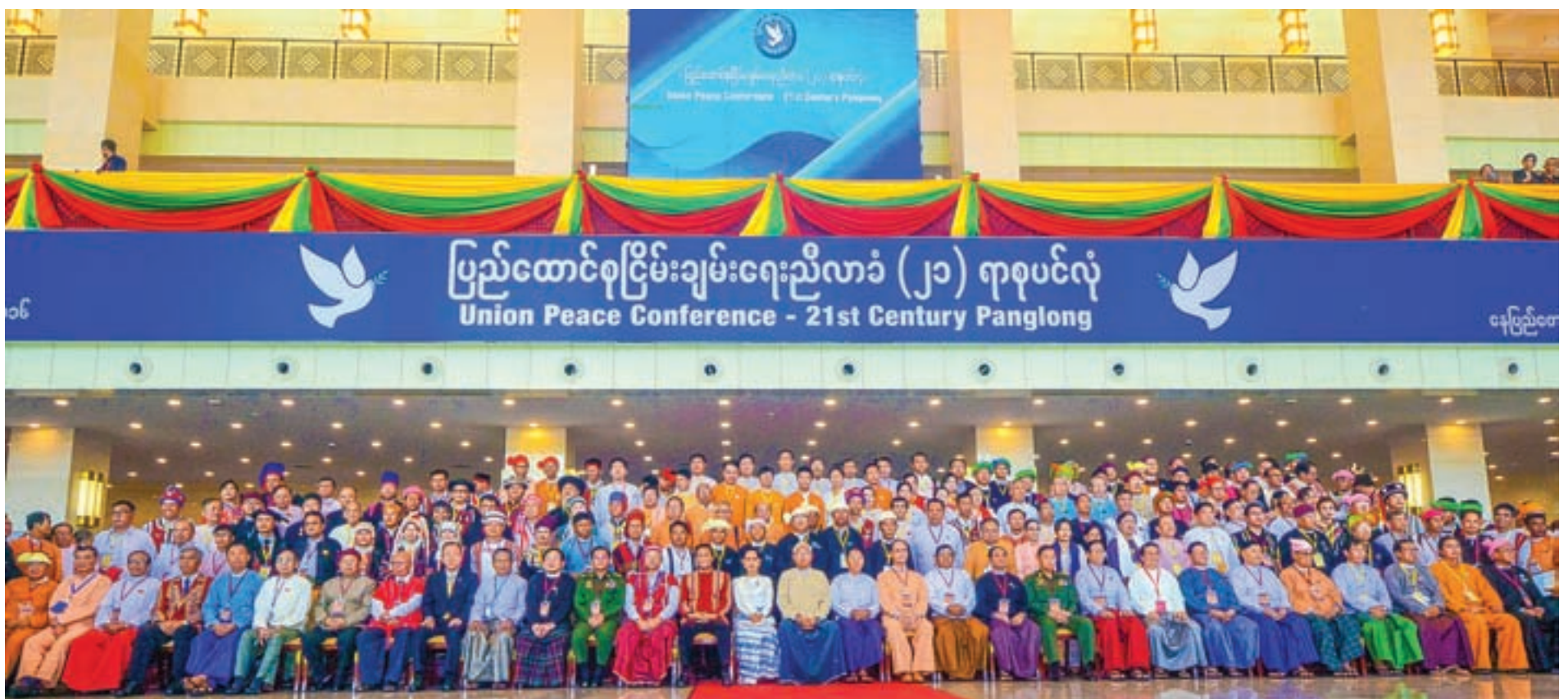
Delegates to the Union Peace Conference—21st Century Panglong pose for documentary photo at the Myanmar International Convention Centre—2 in Nay Pyi Taw.

State Counsellor describes Union Peace Conference—21st Century Panglong as magnificent opportunity for harmony