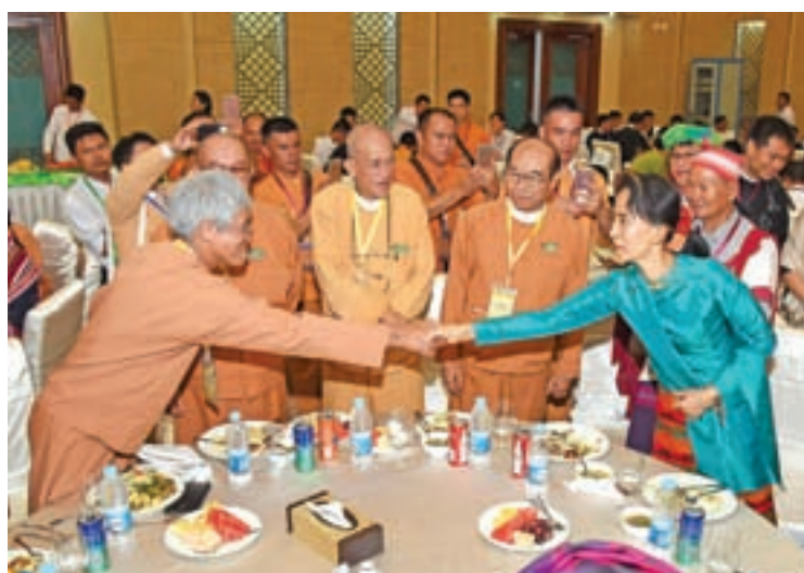
Daw Aung San Suu Kyi welcomes ethnic delegates.