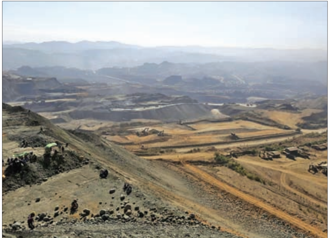
A general view of mine dumps in Hpakant, Kachin State.

The permits that will expire in September are for 38 mining blocks in Lonekhin, Hpakant, 83 blocks in Kannee, 155 blocks in Moenyin, 32 blocks in Mogok and 13 blocks in Mong Hsu, it is learnt.— Mon Mon