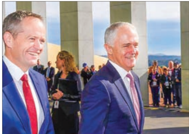
Australian Prime Minister Malcolm Turnbull (R) and Leader of the Opposition Bill Shorten arrive at a traditional smoking ceremony marking the start of Australia's new Parliament session at Parliament House in Canberra, on 30 August, 2016.

SYDNEY — Support for Australia's Prime Minister Malcolm Turnbull has fallen to an all-time low, according to a poll by The Australian newspaper on Tuesday. The poll of 1,696 Australian voters found satisfaction with Turnbull has fallen to 34 per cent, the lowest level since he ousted former Prime Minister Tony Abbott in September 2014.