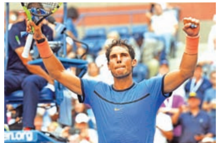
Rafael Nadal of Spain after beating Denis Istomin of Uzbekistan on day one of the 2016 US Open tennis tournament at USTA Billie Jean King National Tennis Centre, New York, NY, USA, on 29 August 2016.

"The most important thing is I'm here in New York and that makes me happy," said Spain's 14-times grand slam winner, who could not continue through the French Open and also missed Wimbledon and the Toronto event due to his wrist injury.—Reuters