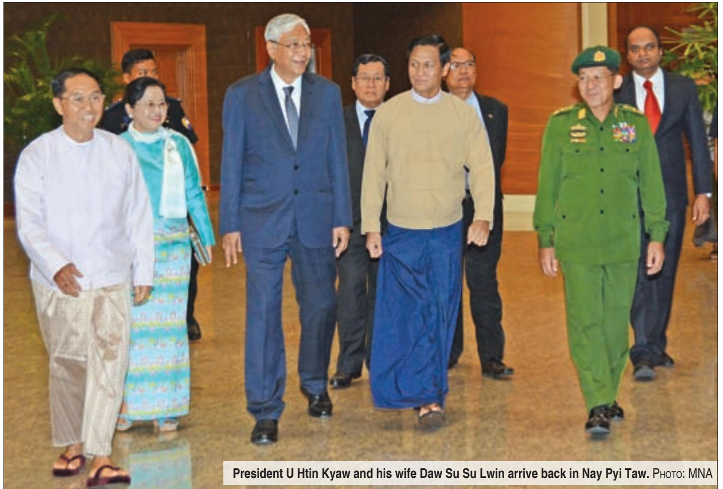
President U Htin Kyaw and his wife Daw Su Su Lwin arrive back in Nay Pyi Taw.

The delegation also visited Akshardham, which is the divine abode of God. It is a Mandir — an abode of God, a Hindu house of worship, and a spiritual and cultural campus dedicated to devotion, learning and harmony.— Myanmar News Agency