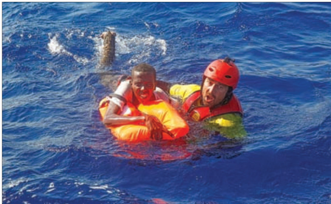
A member of the Spanish NGO Proactiva rescues a Somali migrant that fell from an overcrowded dinghy, during a rescue operation off the Libyan coast in Mediterranean Sea, on 28 August 2016.

ATHENS — More than 460 migrants and refugees arrived on Greek islands from Turkey on Tuesday, the highest in several weeks, despite a European Union deal with Ankara agreed in March to close off that route.