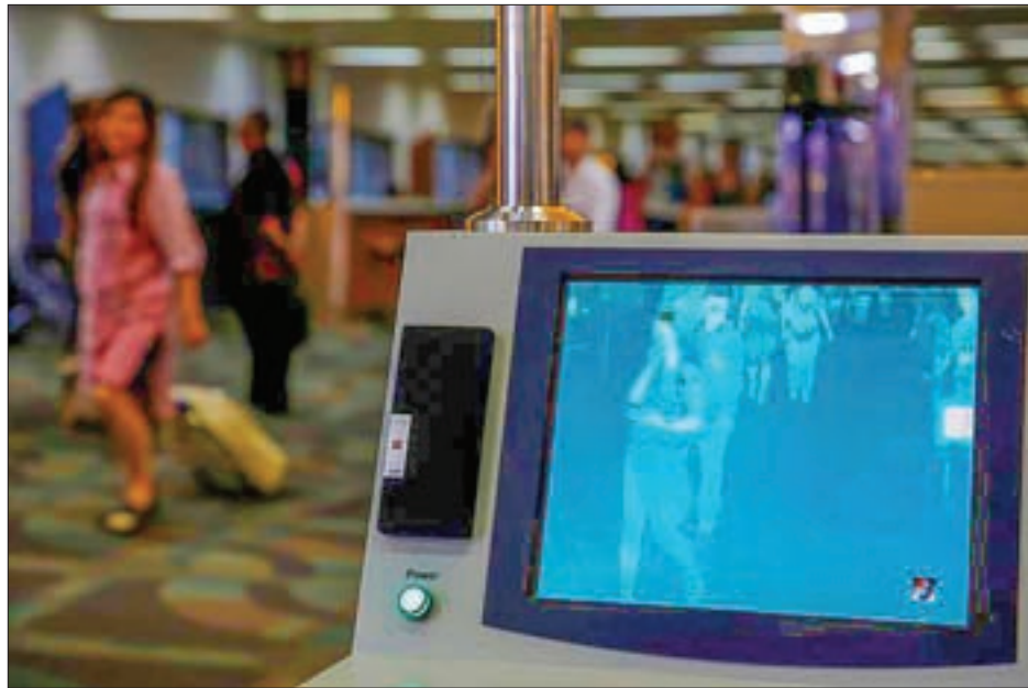
Airplane passengers walk through fever scan camera system used to detect human temperature shortly after arriving from Singapore at the Soekarno-Hatta airport in Jakarta, Indonesia, on 30 August, 2016.

Taiwan, Australia and South Korea advised pregnant women and those plan-