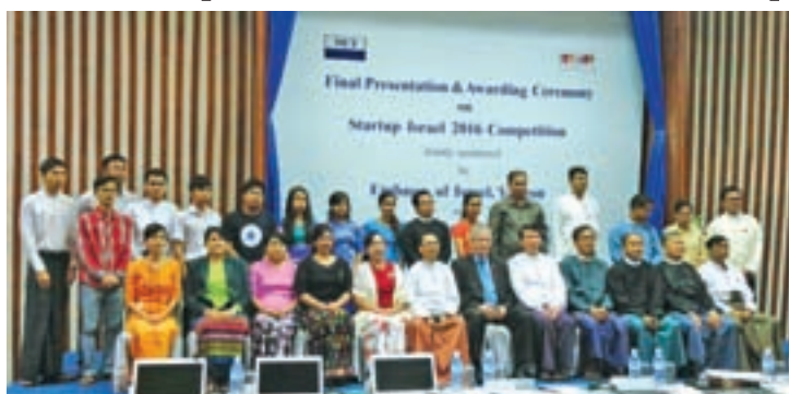
Group photo - Judging Committee, EC of MCF & Contestants.