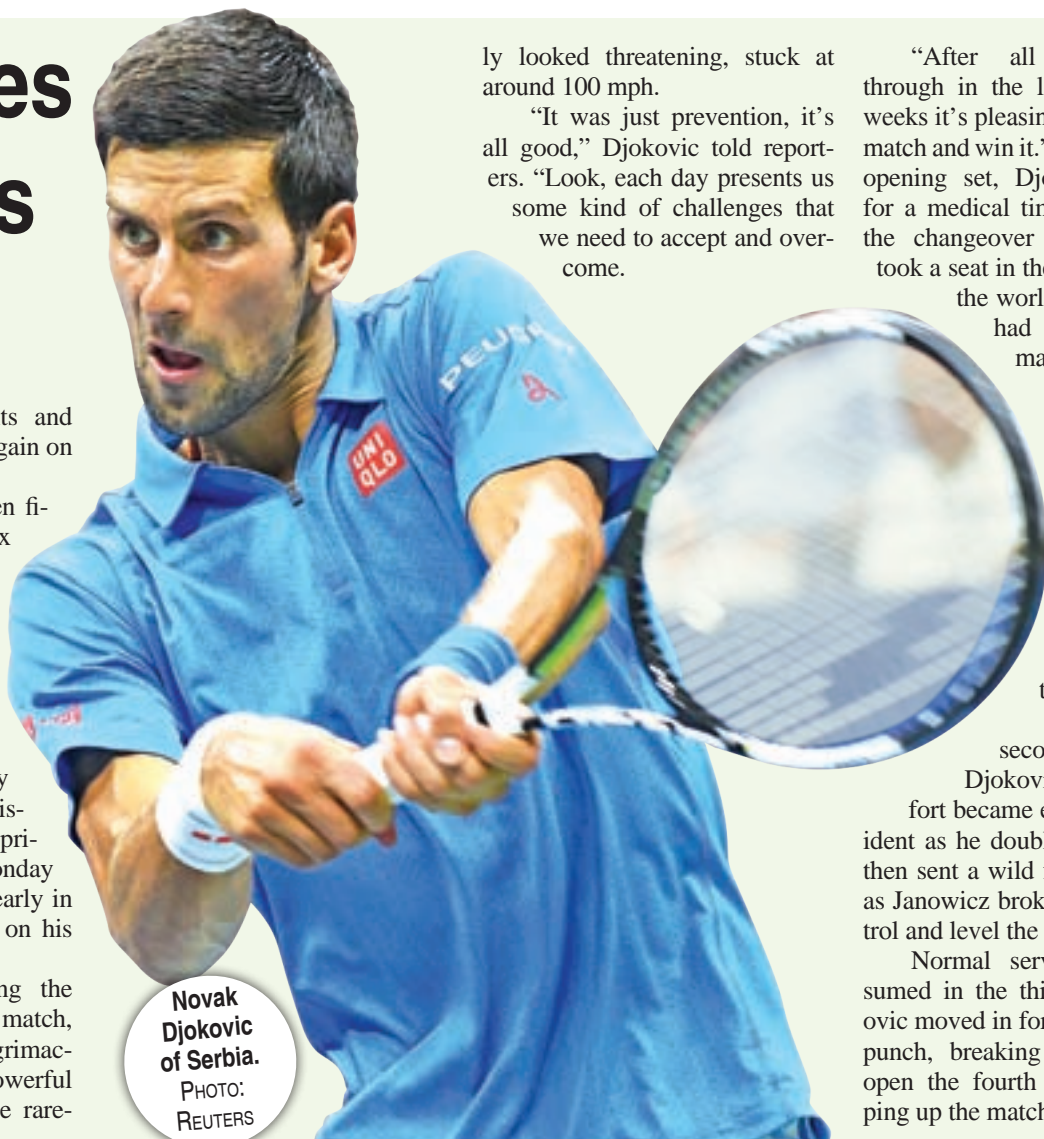
Novak Djokovic of Serbia.

Normal service was resumed in the third and Djokovic moved in for the knockout punch, breaking Janowicz to open the fourth before wrapping up the match.—Reuters