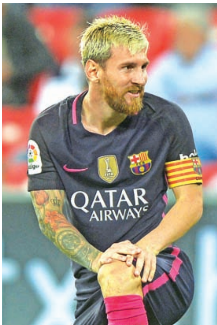
Barcelona's Lionel Messi reacts during match at San Mames, Bilbao, Spain on 28 August 2016.

BARCELONA — Barcelona striker Lionel Messi has returned home to Argentina but remains doubtful for World Cup qualifiers against Uruguay and Venezuela with his club confirming the 29-year-old is struggling with a sore left hamstring.