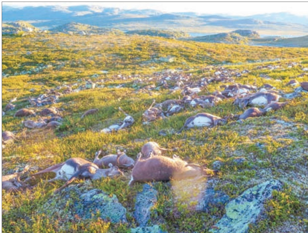
Dead wild reindeer are seen on Hardangervidda in Norway, after lightning struck the central mountain plateau and killed more than 300 of them, in this handout photo received on 28 August 2016.

OSLO — A freak lightning storm has killed 323 reindeer in a remote mountainous area of Norway, officials said on Monday.