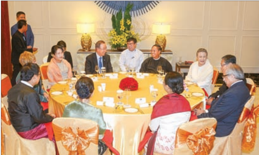
Vice President U Myint Swe hosts dinner in honour of United Nations Secretary General Mr Ban Ki-moon and his wife.