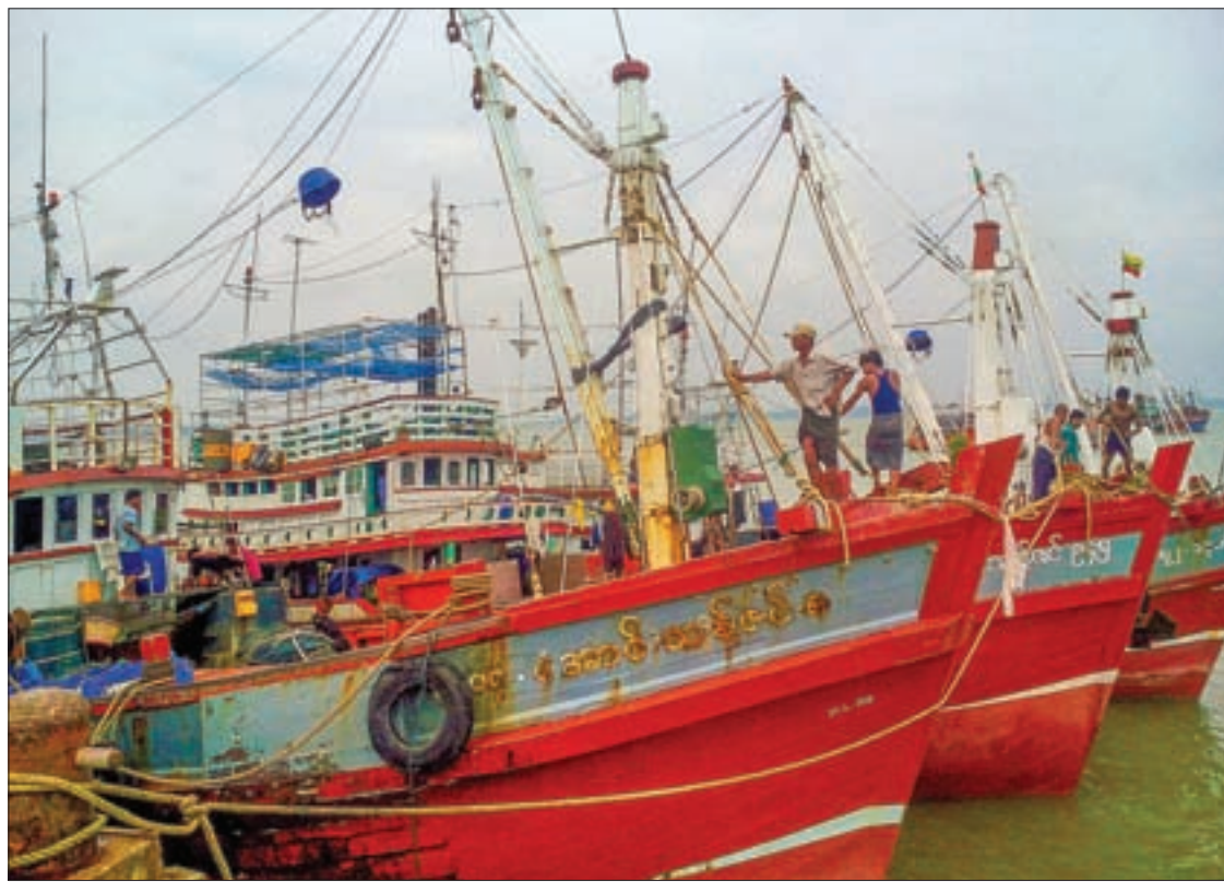
Fishing vessels are seen in Sittwe, Rakhine State.

"In fact, the area within ten-miles from the shore has been demarcated [as a no-fishing zone for off-shore vessels]. Now, though, and we're seeing a large number of local and foreign off-shore fishing vessels enter into this territory to catch fish. Such activities have reduced the size of the area for smaller, near-shore vessels to conduct their fishing activities, as well as causing instances of over fishing. I want some kind of effective scrutiny to be carried out on these trespassers," said U Thein Soe Aung, a near-shore fisherman from Kyaukphyu Township.