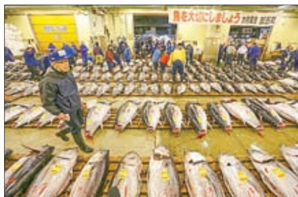
File photo taken in January 2016 shows the year’s first auction of tuna being held at Tokyo’s Tsukiji fish market. Tokyo Gov. Yuriko Koike has decided to postpone the planned relocation of the aging fish market to the capital’s Toyosu waterfront in November and will make a decision about the date of the transfer after assessing in January the results of a groundwater survey conducted in the Toyosu area, a former plant site for gas production where contaminated soil has been found, a metropolitan government source said on 30 August 2016.

that she has big doubts about opening the new market before seeing the results of the water survey.