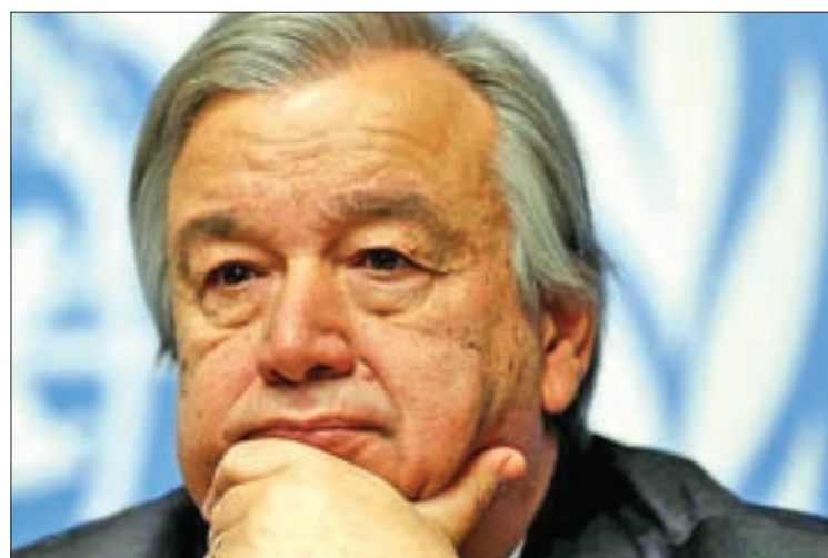
Antonio Guterres, High Commissioner for Refugees, pauses during a news conference for the launch of the Global Humanitarian Appeal 2016 at the United Nations European headquarters in Geneva, Switzerland on 7 December, 2015.