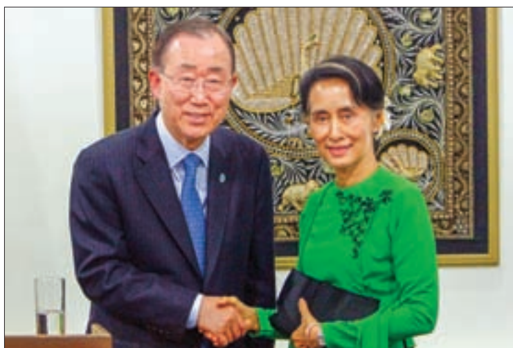
Mr Ban Ki-moon, Secretary - General of the UN, shakes hands with State Counsellor Daw Aung San Suu Kyi.