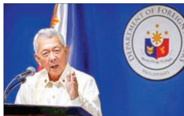
Philippines Foreign Affairs Secretary Perfecto Yasay speaks during a news conference at the Department of Foreign Affairs in Pasay city Metro Manila, Philippines on 27 July, 2016.

"We are trying to make China understand especially when the dust settles that unless they respect and recognise the arbitral tribunal, they will be the losers at the end of that day on this matter," Yasay told a congressional hearing. Prior to