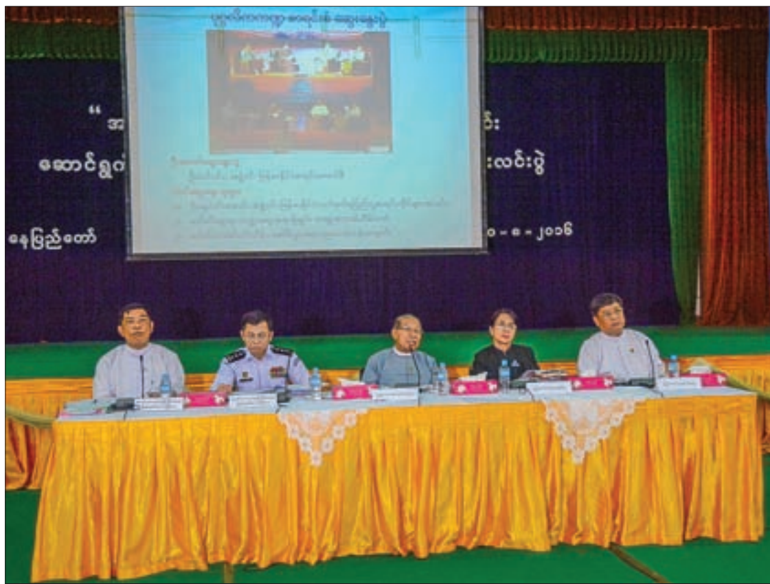
Officials hold the press conference on the government's undertakings in first 100 days.