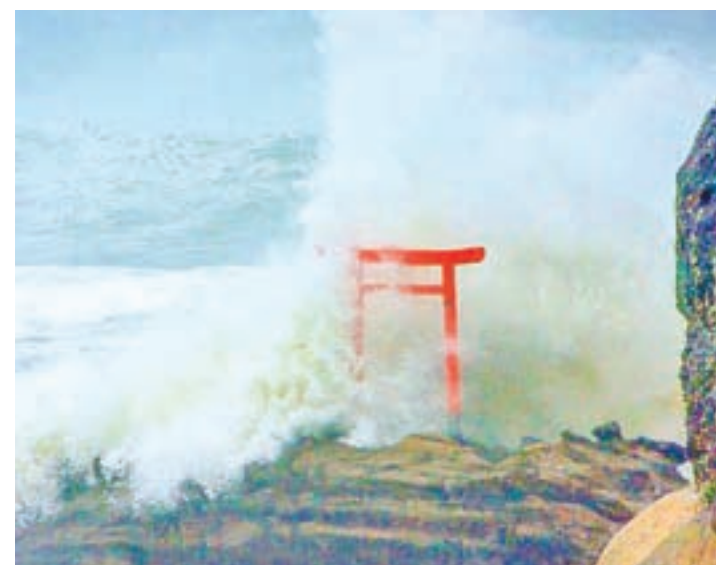
High waves triggered by Typhoon Lionrock crash against a “torii” gate on a coast of the city of Iwaki, Fukushima Prefecture, Japan, in this photo taken by Kyodo on 30 August 2016.

Major carriers canceled more than 100 flights, most of