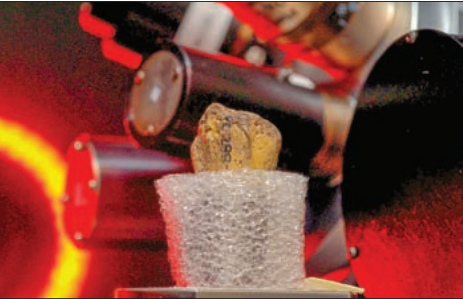
Lucy’s distal radius undergoes computed tomographic scanning. Lucy, one of the best known ancestors of humans to ever roam the earth, may have died after a fall from a tree, University of Texas researchers said on 29 August 2016, after studying her 3.18-million-year-old fossilized remains.