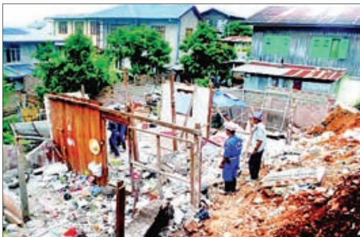
Rescuers clear rubble from the building.

The accident killed Daw Than Tha Myint while U Aung Naing sustained minor injuries. The police still investigating the case.— Maung Maung Than (Taunggyi)