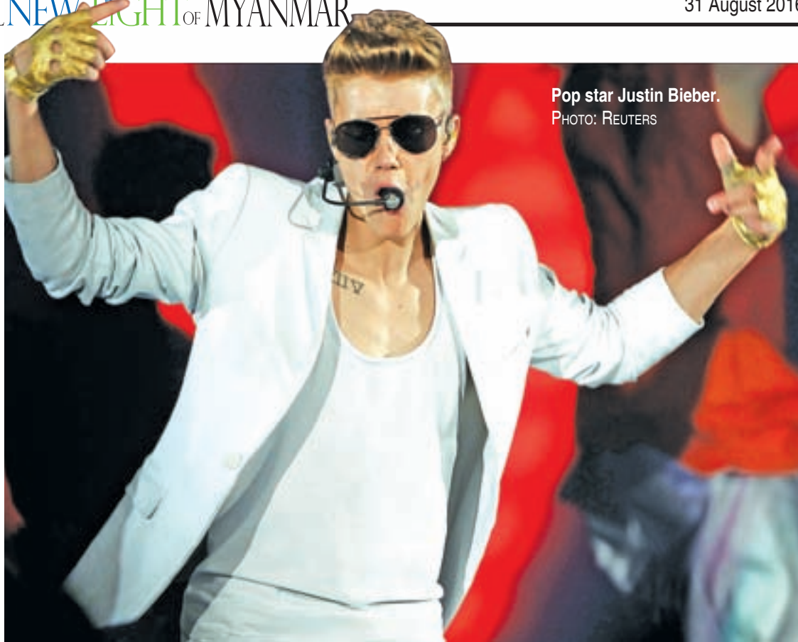
Pop star Justin Bieber.

The Guinness World Records 2017 Edition is due out on 8 September.—PTI