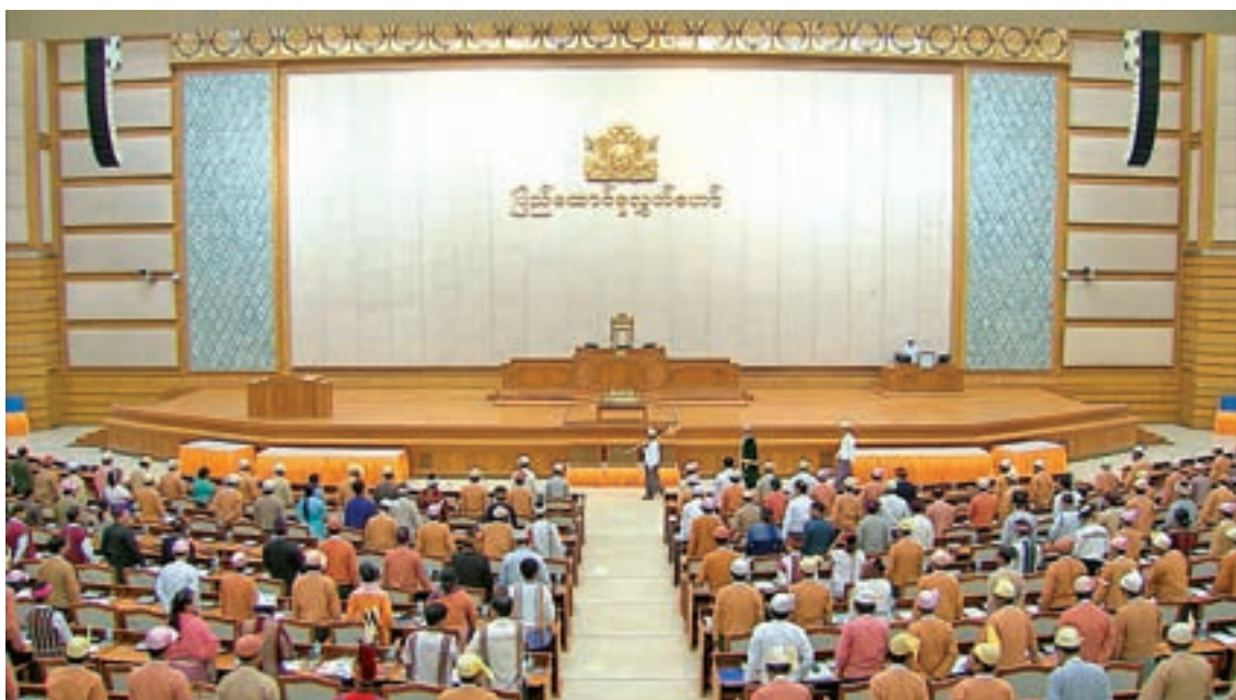
Pyidaungsu Hluttaw Speaker arriving the Pyidaungsu Hluttaw meeting.

Following the discussion, parliament decided to seek out a final decision at the next meeting.— Myanmar News Agency