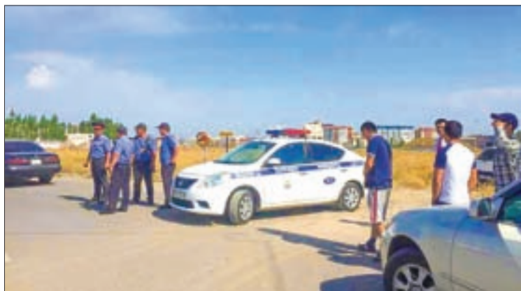
A police car is parked near the place of bombing, near the Chinese embassy in Bishkek, Kyrgyzstan, on 30 August 2016.

An anti-Chinese militant group made up of ethnic Uighurs is also active in the region. In 2014, Kyrgyz border guards killed 11 people believed to be members of that group who had illegally crossed the Chinese-Kyrgyz border.— Reuters