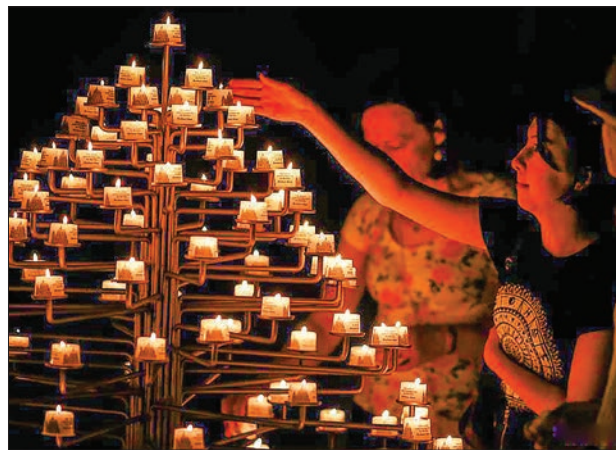
Visitors look at candles during the "Long Night of Museums" at the Berliner Dom in Berlin, capital of Germany, on 27 August 2016. The 38 th "Long Night of Museums" was celebrated in Berlin from Saturday night to Sunday morning.

Berlin has been lightened tonight by these museums' lights, also history, culture and art they represent.—Xinhua