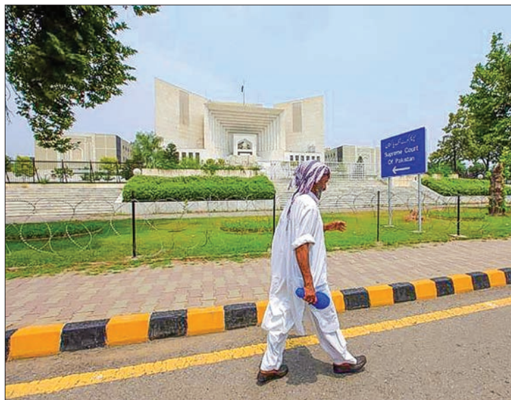
A man walks past the Supreme Court building in Islamabad, Pakistan, on 27 June, 2016.

ISLAMABAD — Pakistan's Supreme Court on Monday upheld verdicts and death sentences in the cases of 16 civilians convicted of terrorism-related offences by military courts, the first time the highest court has ruled on the legality of cases tried by the military.