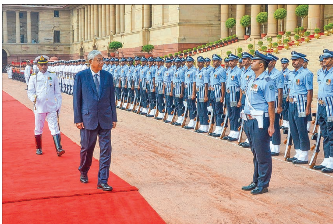
President U Htin Kyaw is accorded a ceremonial welcome at Rashtrapati Bhavan, the presidential palace in New Delhi, India on 29 August 2016.