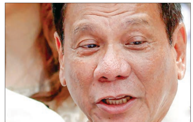
Philippine President Rodrigo Duterte takes part during a National Heroes Day commemoration at the Libingan ng mga Bayani (Heroes' Cemetery) in Taguig city, Metro Manila in the Philippines on 29 August, 2016.

The United States, a close ally of the Philippines, said last week it was “deeply concerned” about the reports of extra-judicial drug killings and it urged Duterte’s government to ensure that law-enforce-