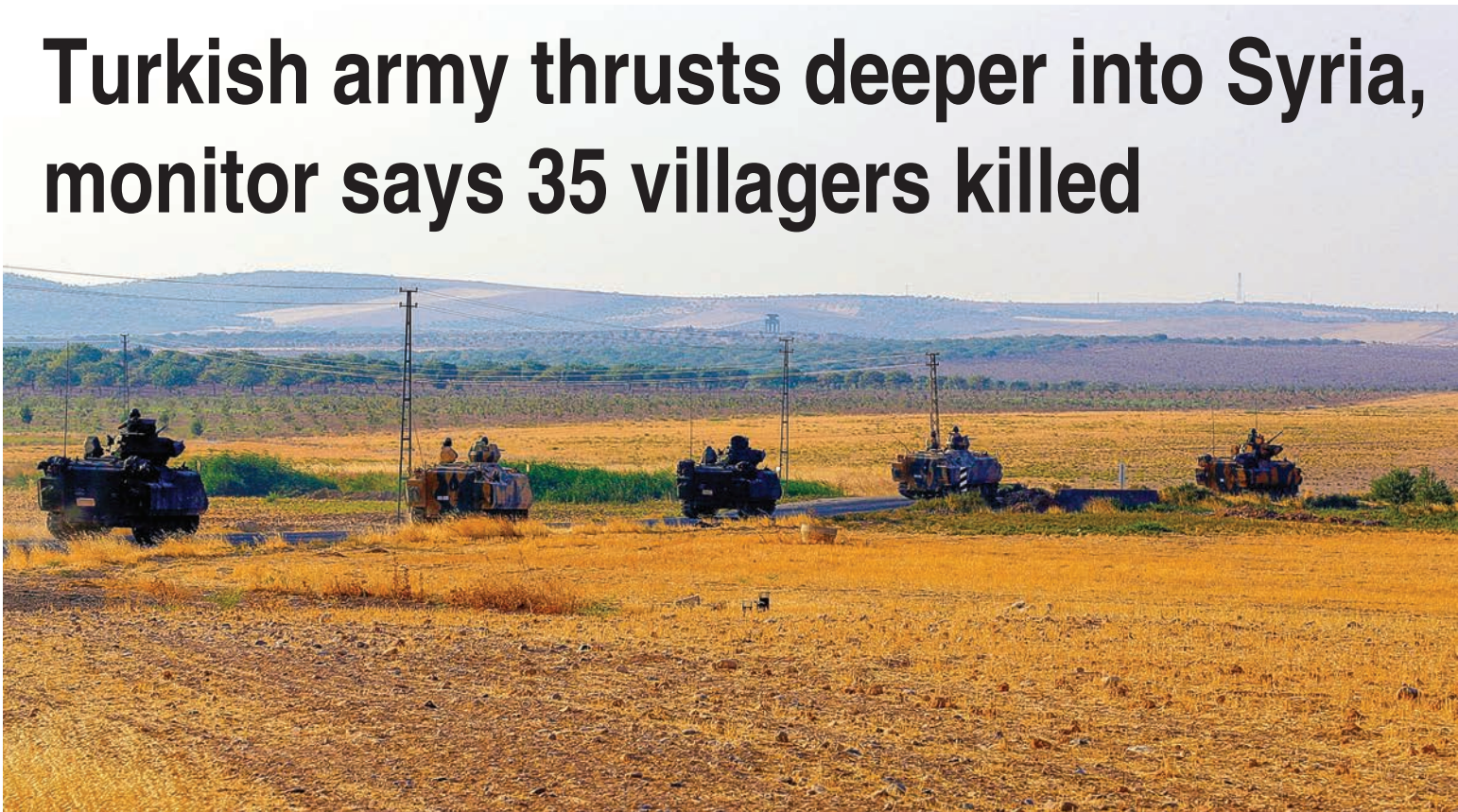
Turkish armoured personnel carriers drive towards the border in Karkamis on the Turkish-Syrian border in the southeastern Gaziantep Province, Turkey, on 27 August 2016.

KARKAMIS, (Turkey) — Turkey’s army and its allies thrust deeper into Syria on Sunday, seizing territory controlled by Kurdish-aligned forces on the fifth day of a cross-border campaign that a monitoring group said had killed at least 35 villagers. Turkish warplanes roared into northern Syria at daybreak and artillery pounded what security sources said were sites held by the Kurdish YPG militia, after the Syrian Observatory for Human Rights reported fierce overnight fighting around two villages. Turkey said 25 Kurdish militants were killed in its air strikes and denied there were civilian casualties. There was no immediate comment from the YPG, but forces aligned with the group have said it had withdrawn from the area prior to the assault. Turkey, which is also battling Kurdish insurgents at home, sent tanks and troops into Syria on