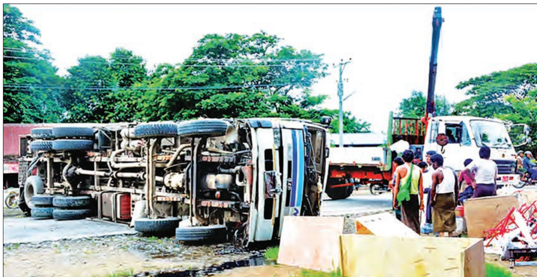
The 12-wheel truck being seen overturned.

A TRUCK driver and conductor escaped injury after a cargo truck skidded off the road between Yangon and Mandalay and overturned on Sunday.