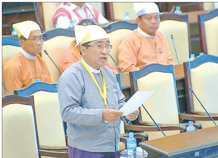
Union Minister for Social Welfare, Relief and Resettlement Dr Win Myat Aye.