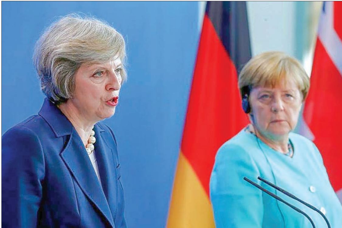
German Chancellor Angela Merkel and British Prime Minister Theresa May address a news conference following talks at the Chancellery in Berlin, Germany on 20 July 2016.