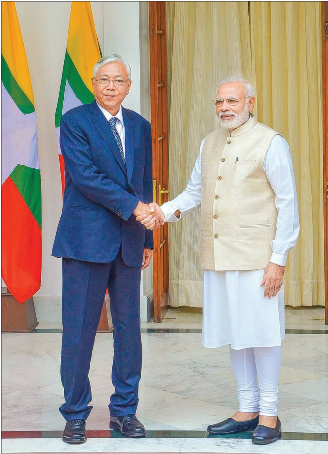
President U Htin Kyaw is welcomed by India's Prime Minister Narendra Modi in New Delhi, India.

Modi said Myanmar holds a unique position in India's neighbourhood, adding that the long-standing cultural and historical linkages between the two countries form a solid foundation of the bilateral relations.