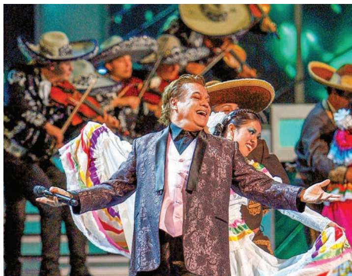
Mexican singer Juan Gabriel performs at the 10th annual Latin Grammy awards in Las Vegas, Nevada in 2009.

Many of pop music’s biggest names, including Justin Bieber, Britain’s Adele and Taylor Swift were absent on Sunday.