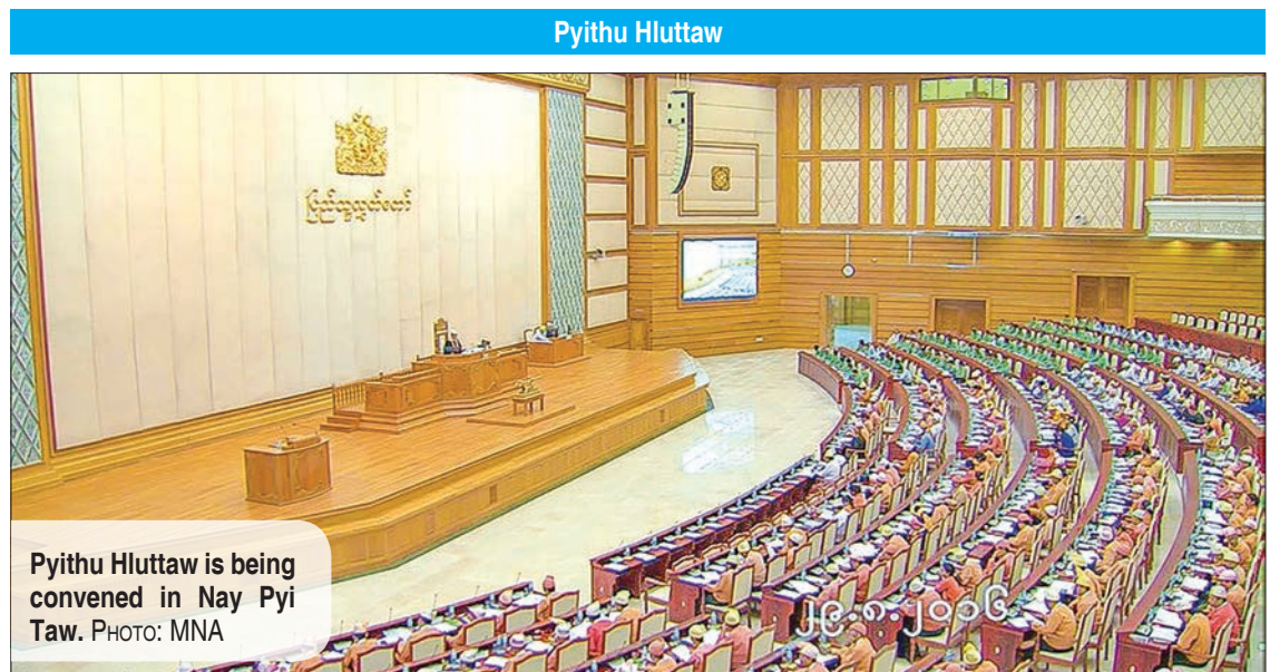
Pyithu Hluttaw is being convened in Nay Pyi Taw.

He also answered a question about Tintate-Padu road in Sagaing Township, pledging that roadwork and repair of box culverts will be carried out by the ministry's rural development de-