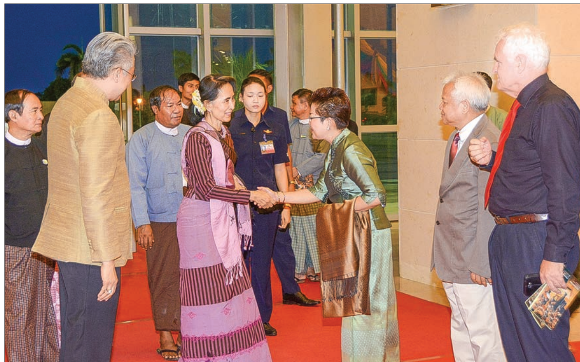
Daw Aung San Suu Kyi is welcomed by diplomats as she arrives to enjoy the music concert.

University, the Royal Thai Embassy, the Embassy of Germany and the Goethe Institute, the German Cultural Center in Myanmar, representing a mission of friendship as well as an activity to celebrate two auspicious occasions: His Majesty King Bhumibol Adulyadej of Thailand's Accession to the Throne and Her Majesty Queen Sirikit's Birthday Anniversary on 12 August 2016.— Myanmar News Agency