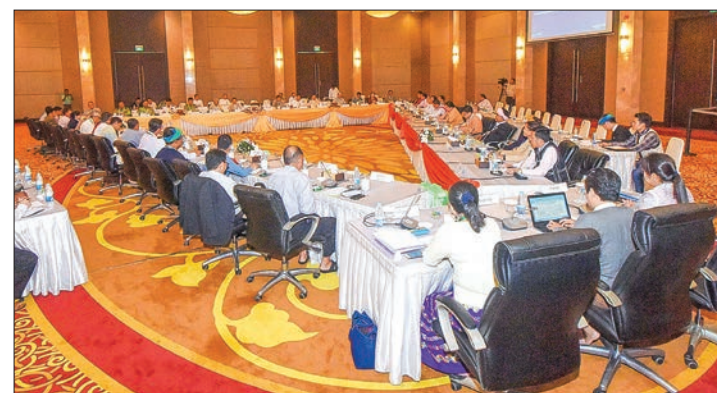
The organizing committee for the Union Peace Conference—21st Century Panglong holds its meeting.

Next, those present held discussions on decisions of the first joint organizing committee and reports presented by the political dialogue organizing working committee.— Myanmar News Agency