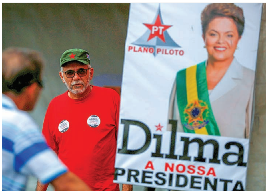
People walk next to an official photo of Brazil's suspended President Dilma Rousseff, at a camp in support of Rousseff, in Brasilia, Brazil, on 28 August 2016.

decided senators to respect democracy and stop the coup that is under way," a spokesman for Rousseff told Reuters. "She is in good spirits."