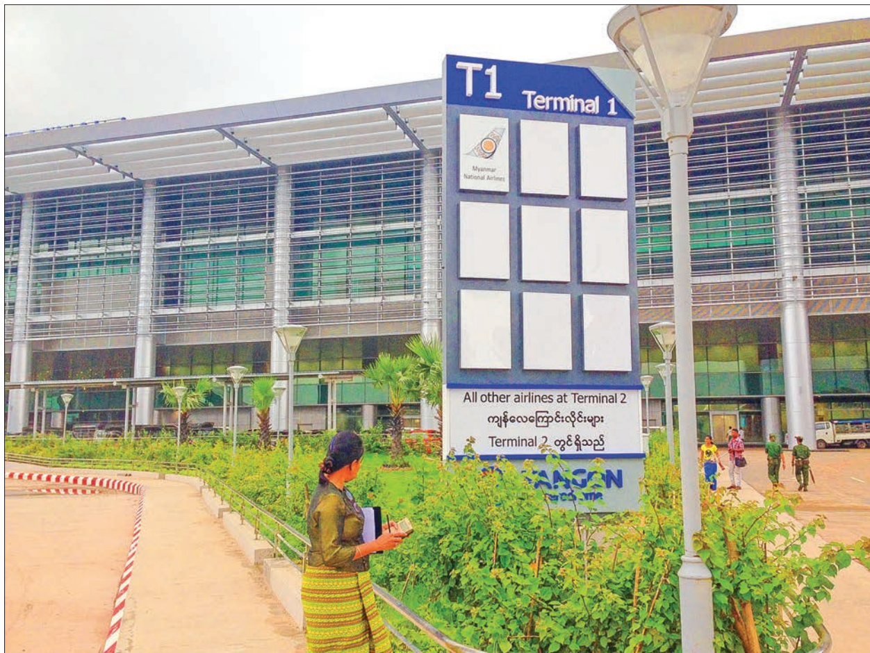
Terminal 1 seen at Yangon International Airport on 13 June 2016.

"CIF values won't change very much. We will set reasonable prices," said an official from the Customs Department. —Mon Mon