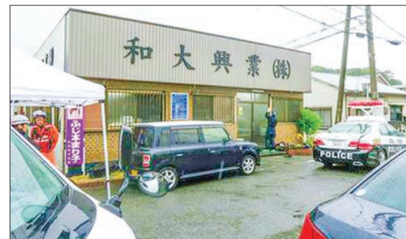
Photo taken on 29 August 2016 shows a construction company in Wakayama, western Japan, where a shooting incident took place earlier in the day. The attacker shot four people, leaving one died and three injured, before fleeing the scene.

The construction company, founded in 1979, has about 10 employees and has received orders for public works projects from the city and prefecture of Wakayama, according to a credit research company.—Kyodo News