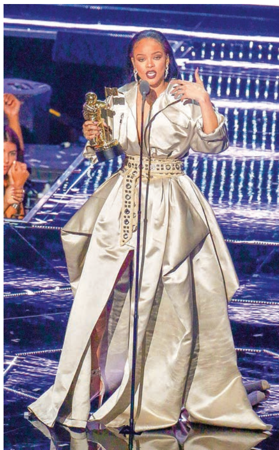
Rihanna accepts the Michael Jackson Video Vanguard Award during the 2016 MTV Video Music Awards in New York, US, on 28 August.

and bold, Spears, 34, dressed in a sparkly gold leotard and matching over the knee boots was slinky retro pop. It was the “Toxic” singer’s first time on the