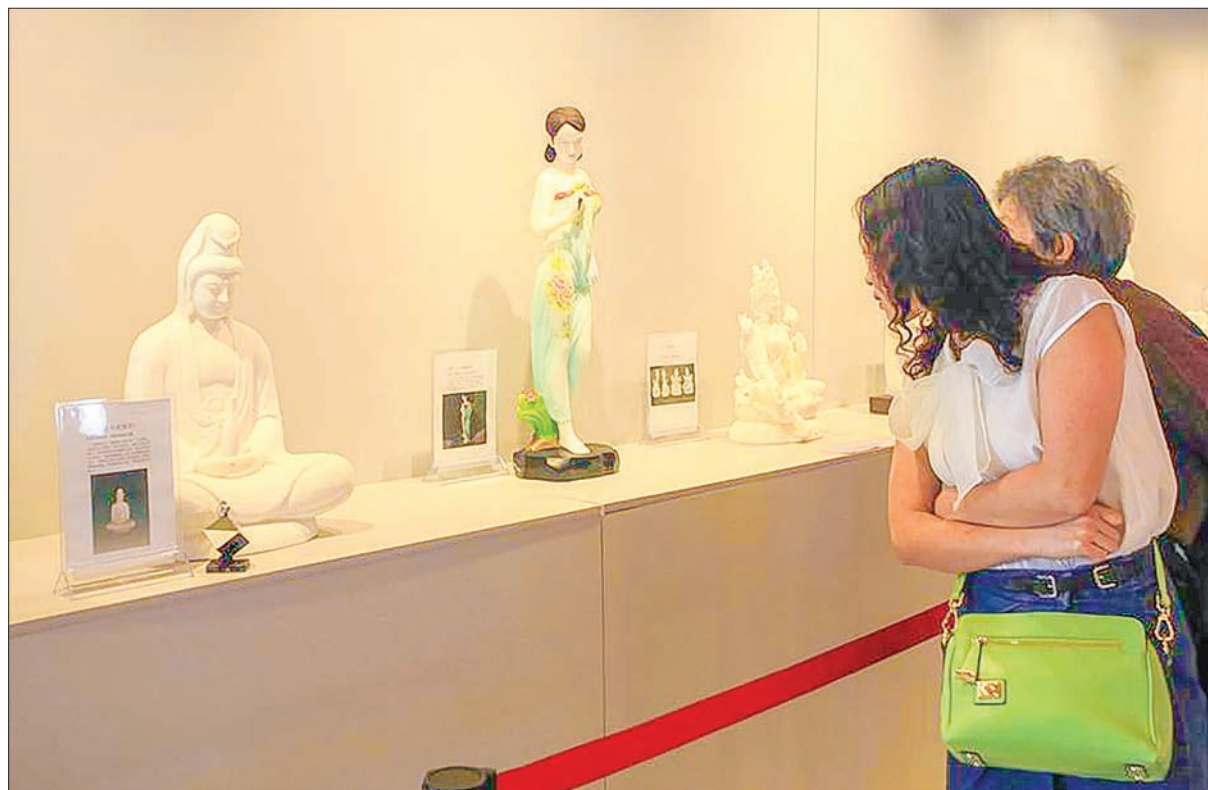
People view stone sculptures during the 2 nd Guizhou (Anshun) International Stone Expo in Anshun, southwest China's Guizhou Province, on 28 August 2016. Exhibitors from 29 countries and regions participated in the stone expo. More than 300 stone sculptures were displayed at the event.