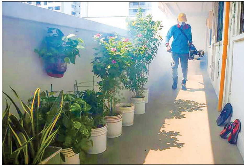
A worker fogs the corridor of a public housing estate in the vicinity where a locally transmitted Zika virus case was discovered, in Singapore on 29 August, 2016.

SINGAPORE — Officials sprayed insecticide and cleared drains of stagnant water in residential areas of Singapore at high risk of further Zika infections on Monday after 41 locally transmitted cases were confirmed in the city state.