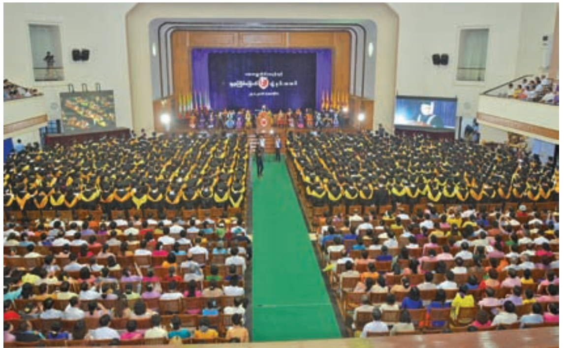
The 53rd graduation in progress at the University of Medicine-1.

University of Medicine-1 is planning to open four post-graduate courses on tropical infectious diseases, mental health, hormone, liver and bladder surgery while giving special attention to the role of doctors who are non-governmental employees.—Zaw Min Latt