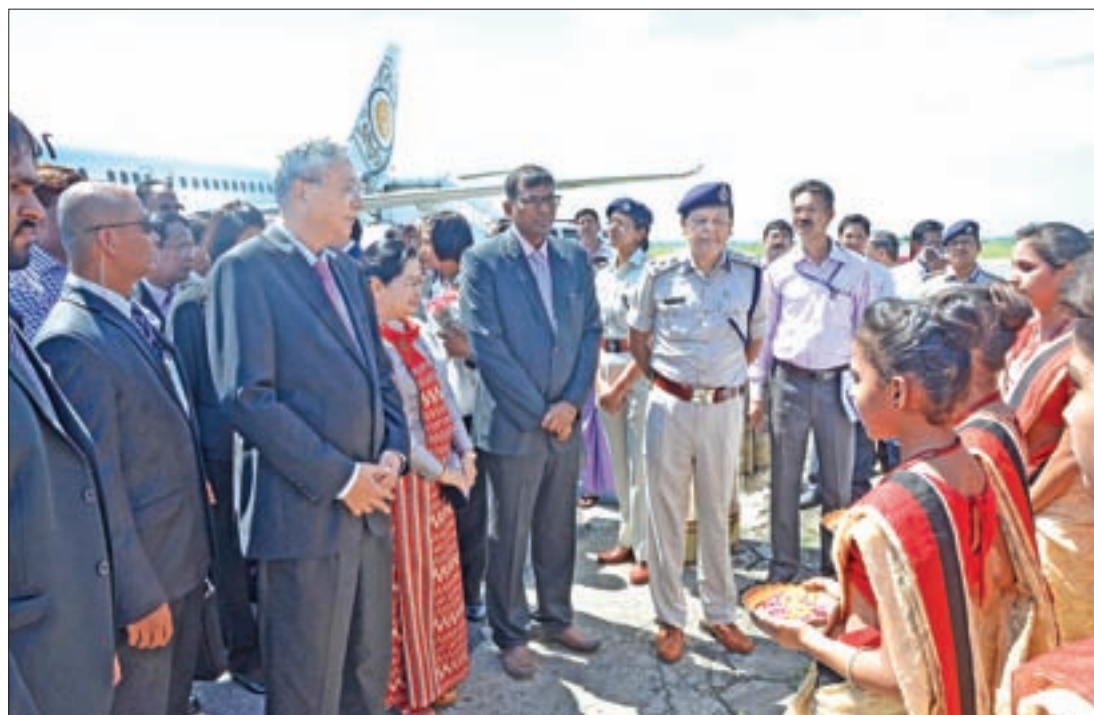
President U Htin Kyaw and wife Daw Su Su Lwin are welcomed by Indian damsels on their arrival at the Gaya International Airport on 17th August, 2016.