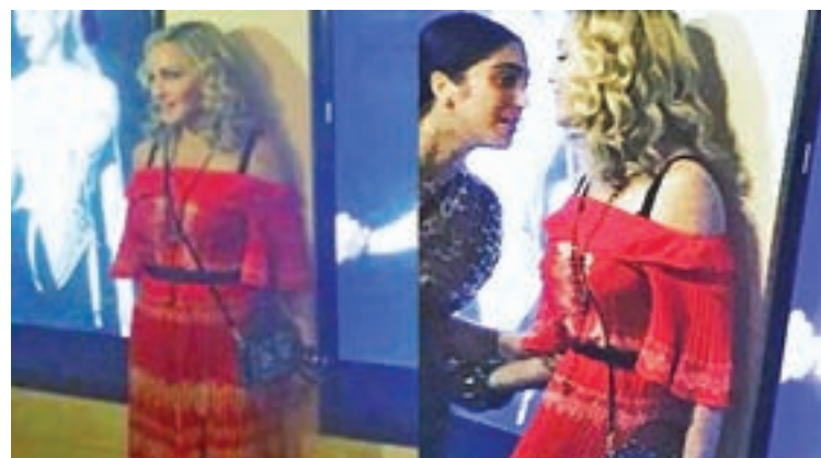
The fans got excited after watching the 58-year-old Madonna at the Museum of Modern Art (MOMA) event in New York City, reported People magazine.