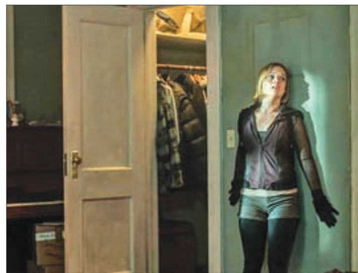
Jane Levy in “Don’t Breathe.”

LOS ANGELES — “Don’t Breathe”, a tense psychological horror-thriller, is expected to topple DC antiheroes “Suicide Squad” at the US box office this weekend.