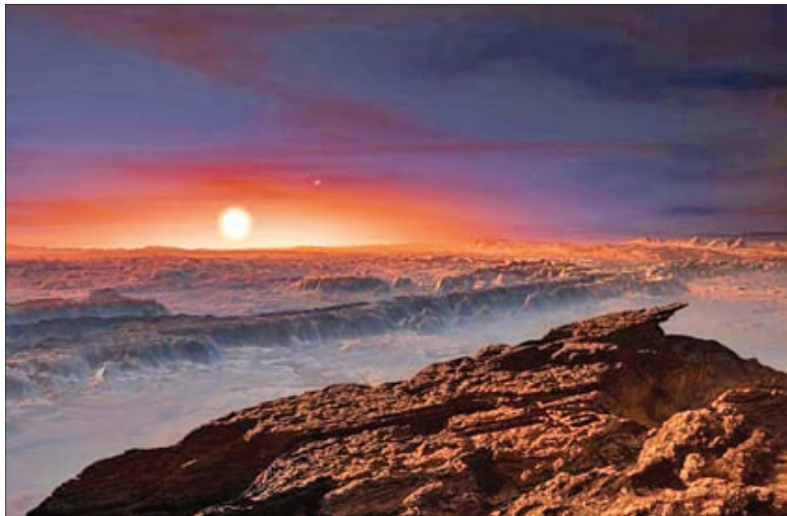
A view of the surface of the planet Proxima b orbiting the red dwarf star Proxima Centauri, the closest star to our Solar System, is seen in an undated artist's impression released by the European Southern Observatory, on 24 August 2016.

An international team of 31 scientists found the planet after