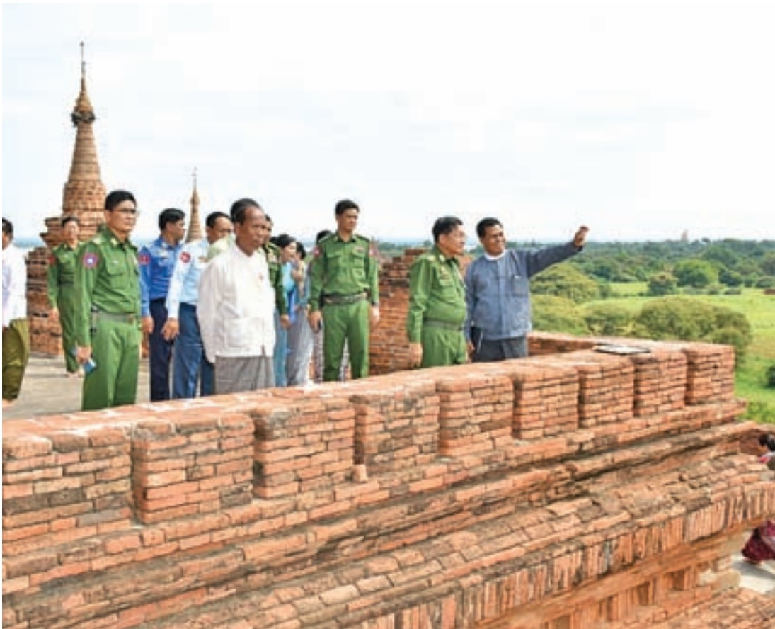
Senior General Min Aung Hlaing visits Bagan to observe quake-damaged pagodas.