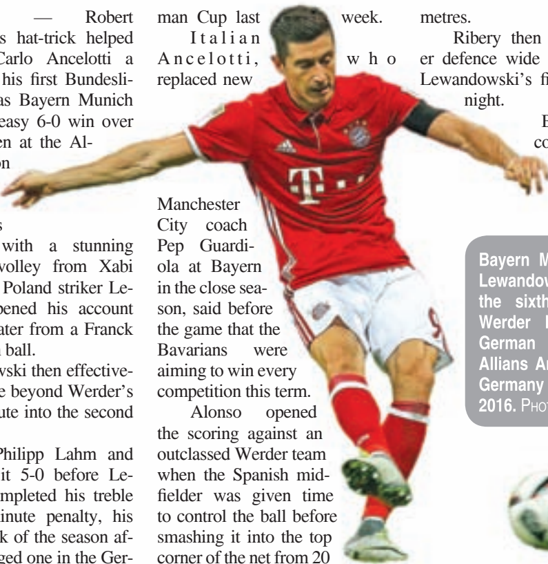
Bayern Munich's Robert Lewandowski scores the sixth goal against Werder Bremen during German Bundesliga at Allianz Arena, in Munich Germany on 26 August 2016.

On Saturday, last season's runners-up Borussia Dortmund start their campaign at home to coach Thomas Tuchel's former club Mainz while Borussia Mönchengladbach entertain Bayer Leverkusen.—Reuters