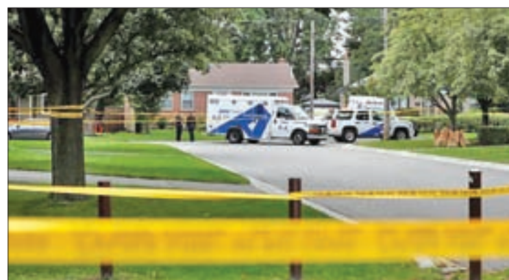
Police are seen at a crime scene in front of a house where three people have died in an incident involving a crossbow in the Scarborough suburb of Toronto, on 25 August 2016.

In another incident on Thursday that police said was related to the killings, police evacuated a downtown building due to a suspicious package. They gave no details on how the cases were related.— Reuters