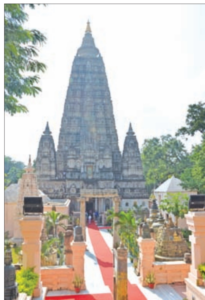
Mahabodhi Temple, which was renovated by King Mindon of the Konbaung Dynasty in 1877, in Bodh Gaya in India, is considered a life time destination for millions of Buddhists across the world.