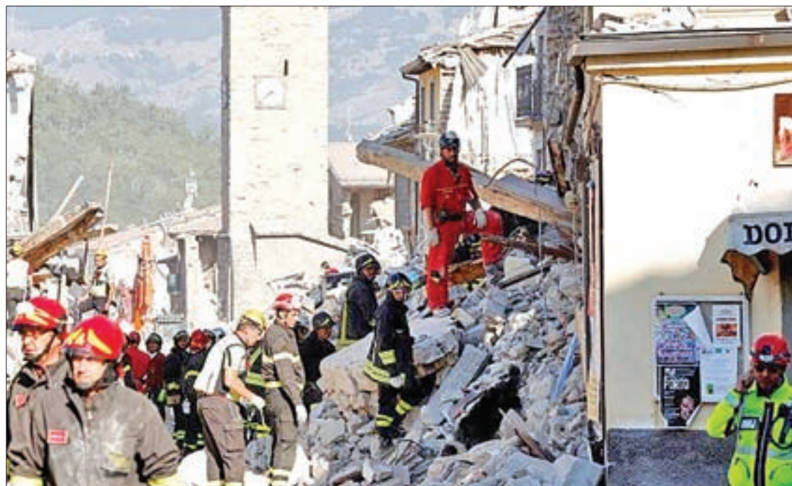
Firefighters and rescuers work following an earthquake in Amatrice, central Italy on 27 August 2016.