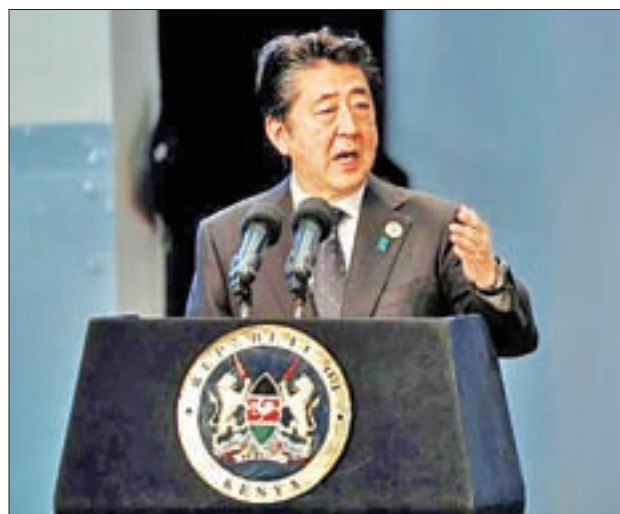
Japan's Prime Minister Shinzo Abe addresses the Sixth Tokyo International Conference on African Development (TICAD VI) in Kenya's capital Nairobi, on 27 August 2016.

NAIROBI — Japan's Prime Minister Shinzo Abe told African leaders on Saturday that his country will commit $30 billion in public and private support for infrastructure development on the continent.