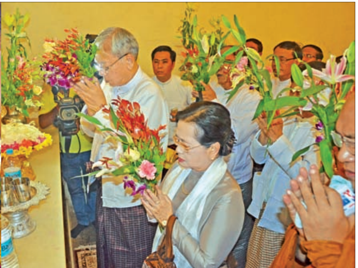
President U Htin Kyaw and wife pay homage to the Buddha Image at the Mahabodhi Temple Bodh Gaya in Biha, India.

PRESIDENT U Htin Kyaw arrived at Bodh Gaya in Bihar yesterday to pay a goodwill visit to India.