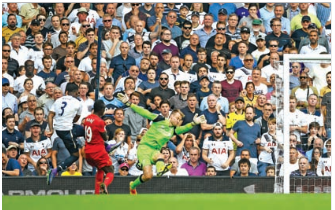
Tottenham's Danny Rose scores their first goal against Liverpool during Premier League at White Hart Lane, on 27 August 2016.

Stand-in goalkeeper Vorm made an excellent save to deny Philippe Coutinho from close range and was twice called out of his area to tackle the outstanding Sadio Mane as the visitors created chance after chance during the first half. Tottenham's Danny Rose scores their first goal against Liverpool during Premier League at White Hart Lane, on 27 August 2016.—Reuters