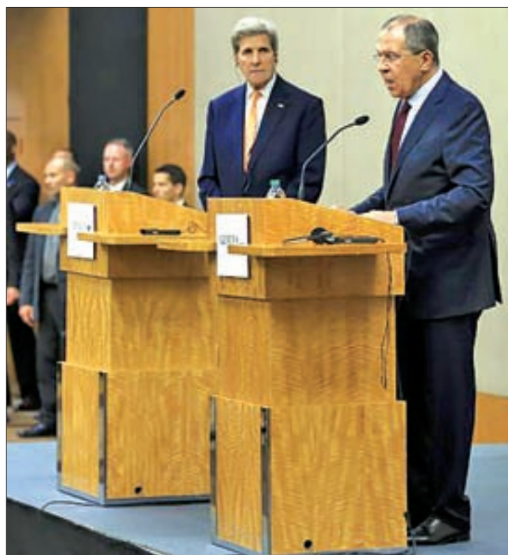
US Secretary of State John Kerry and Russian Foreign Minister Sergei Lavrov attend a news conference after a meeting on Syria in Geneva, Switzerland, on 26 August 2016.

In the days ahead the technical teams, which include U.S. and Russian military and intelligence experts, will try to figure out ways to separate the opposition groups, backed by the United