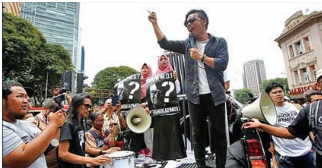
Student activists shout slogans as they prepare to march towards Dataran Merdeka, or Independence Square, to call for the arrest of ‘Malaysian Official 1’ in Kuala Lumpur, Malaysia, on 27 August 2016.

The country’s police chief last week warned the protesters to stay away from the square as they had not been granted permission to gather there. Najib’s supporters had planned to hold a counter-rally, but late on Friday said they decided against competing with “school children”, according to a report by news portal Malaysiakini.— Reuters