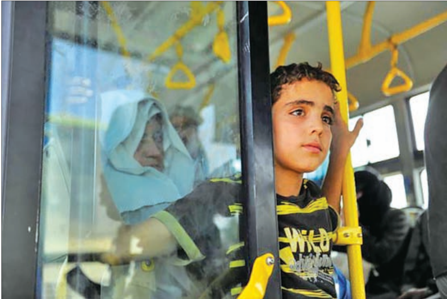
Civilians ride a bus to be evacuated from the besieged Damascus suburb of Daraya, after an agreement reached on Thursday between rebels and Syria's army, Syria, on 26 August 2016.