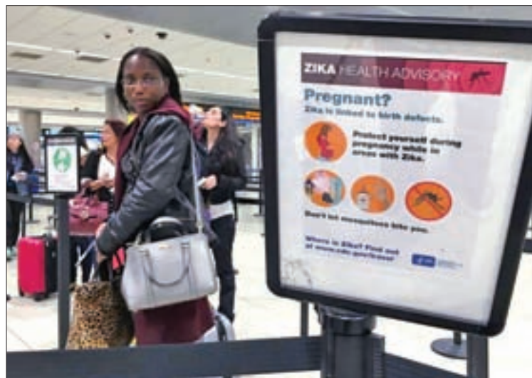
A woman looks at a Center for Disease Control (CDC) health advisory sign about the dangers of the Zika virus as she lines up for a security screening at Miami International Airport in Miami, Florida, US, on 23 May 2016.

MIAMI — Travelers have booked fewer hotel rooms in downtown Miami, and leisure airfares to the greater Miami area have inched down in the weeks since the Zika