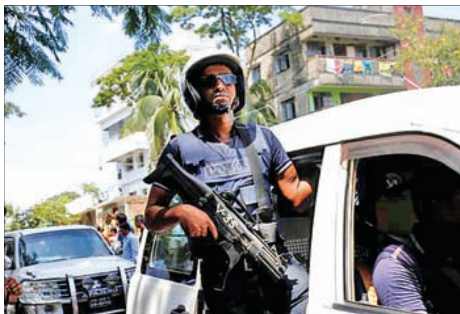
A member of the security personnel stands on the side of a car as he arrives at the site of a gun-battle with militants on the outskirts of Dhaka, Bangladesh, on 27 August 2016.

Islamic State claimed responsibility for the assault on the cafe in a posh neighbourhood of the capital, during which militants sin-