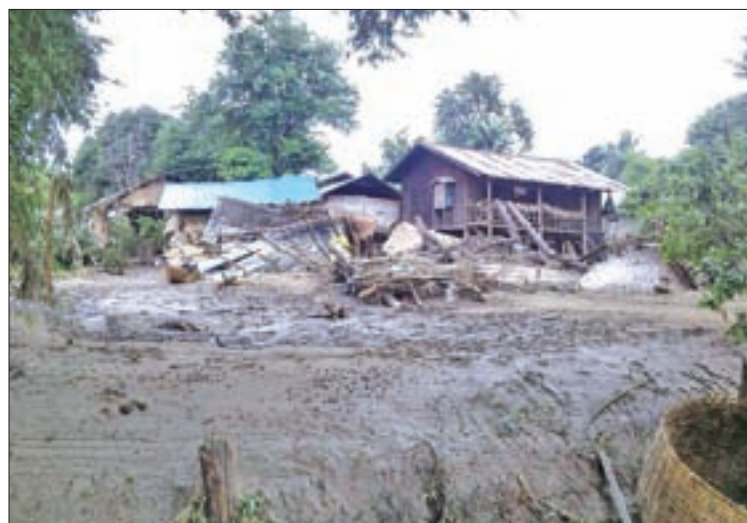
Wreckage of houses seen after the flood recedes in Tatkon Tsp.