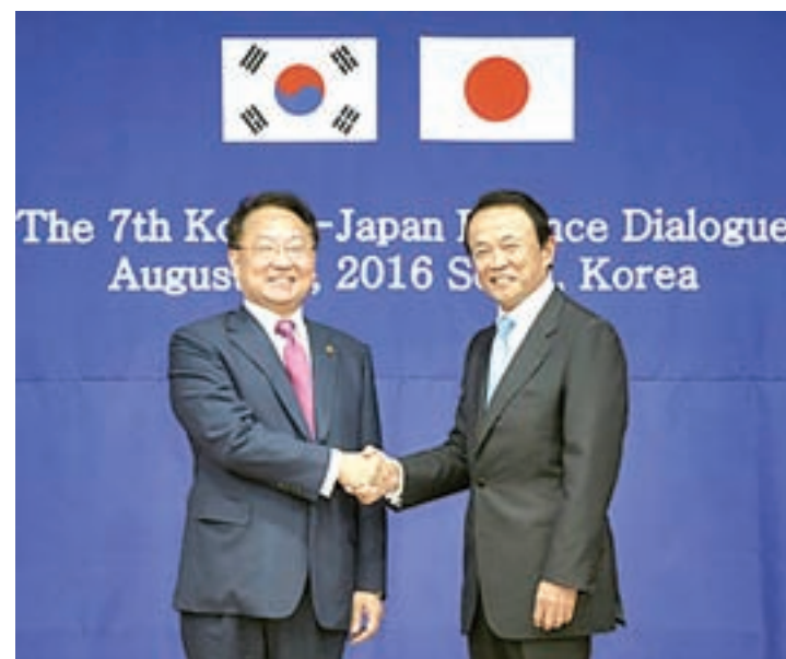
South Korean Strategy and Finance Minister Yoo Il Ho (L) and Japanese Finance Minister Taro Aso shake hands in Seoul, on 27 August 2016, as they meet for the 7th bilateral finance dialogue.

Zika was detected in Brazil last year and has since spread across the Americas. The virus poses a risk to pregnant women because it can cause severe birth defects. It has been linked to more than 1,800 cases of microcephaly in Brazil.— Reuters