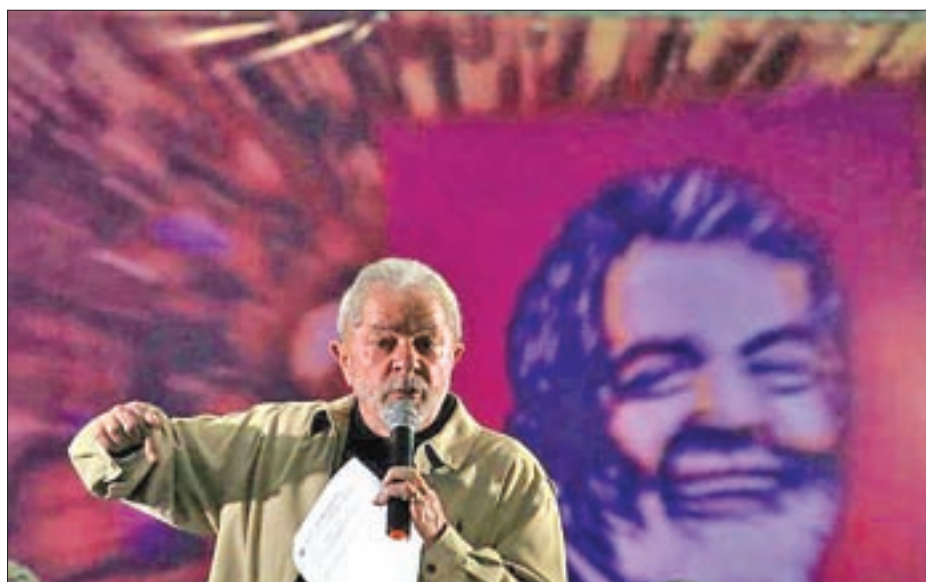
Former Brazilian President Luiz Inacio Lula da Silva gestures as he attends a meeting with women activists in Santo Andre, Brazil, on 15 August 2016.

Federal prosecutors would not comment on Friday on what, if any, action they may take against Lula