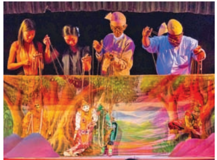
Marionette troupes perform at traditional puppet show in Mandalay.

tertainment around Myanmar, puppetry is now practiced by very few people in the country today. At present, around 20 professionals remain in the field.