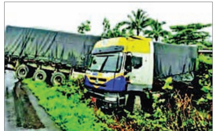
Overturned 22-wheel vehicle being seen on Hpa-an- Thaton road.

The driver has been charged under sections 279 of the penal code.—Tun Tun Htway (Hpa-an)