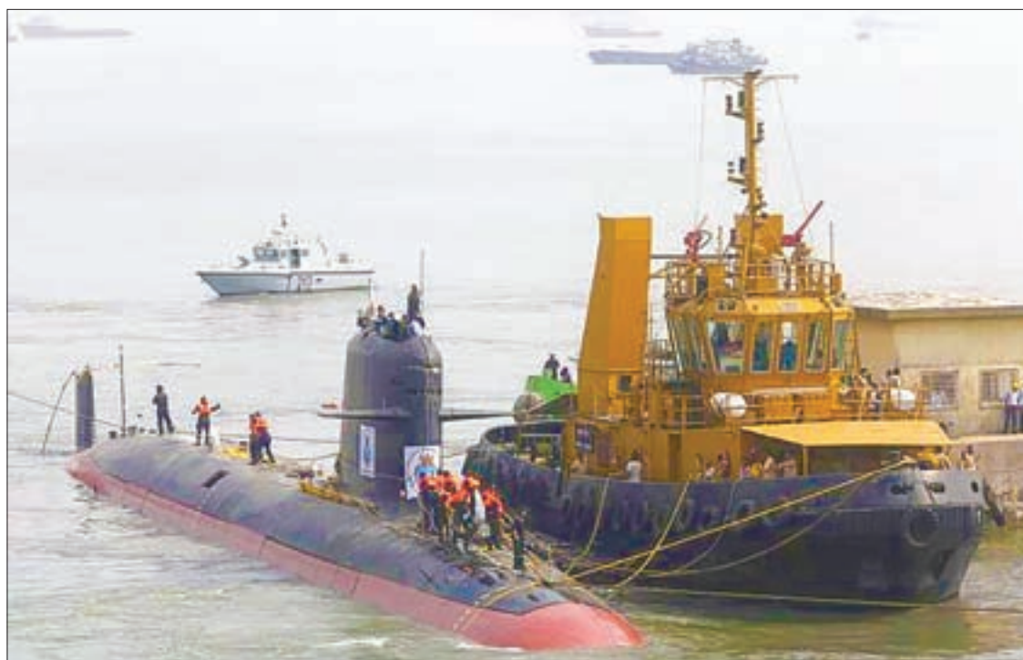
File photo of Indian Navy’s Scorpene submarine INS Kalvari being escorted by tugboats as it arrives at Mazagon Docks Ltd, a naval vessel ship building yard, in Mumbai, India, in 2015.

the Scorpene-class model and do not contain any details of the vessel currently being designed for the Australian fleet.