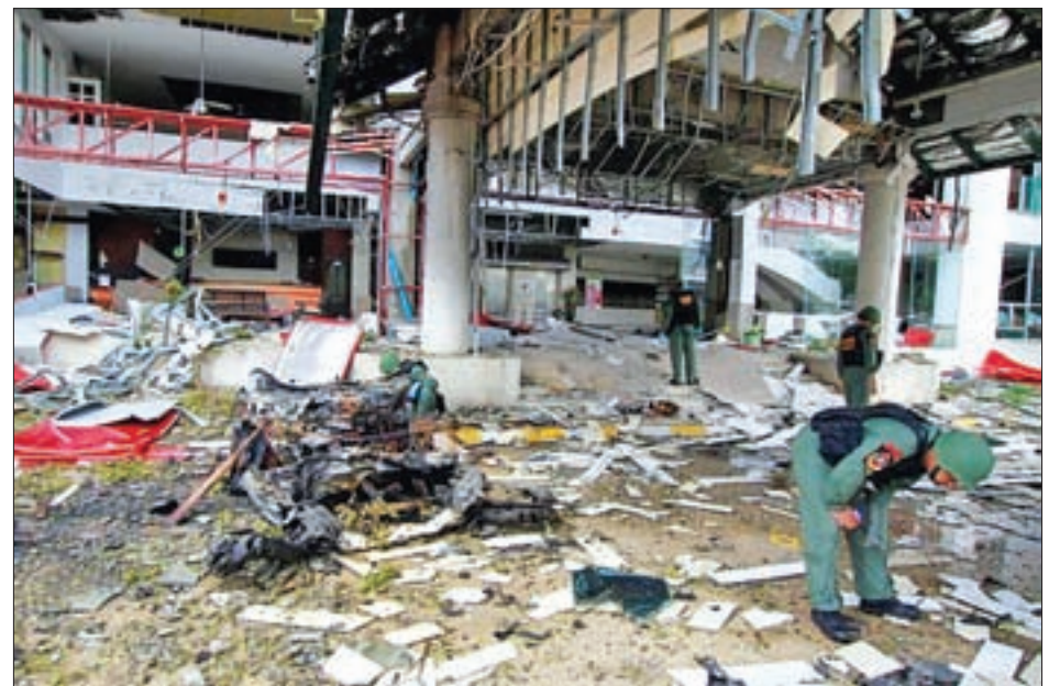
Thai soldiers inspect the scene of a car bomb blast outside a hotel in the southern province of Pattani, Thailand, on 24 August 2016.

No group has claimed responsibility for those bombings, which killed four and wounded dozens, including foreign tourists. Some security experts noted at the time that southern insurgent groups have a track record of carrying out coordinated bombing attacks. Defence Minister Prawit Wongsuwan however quickly ruled out any