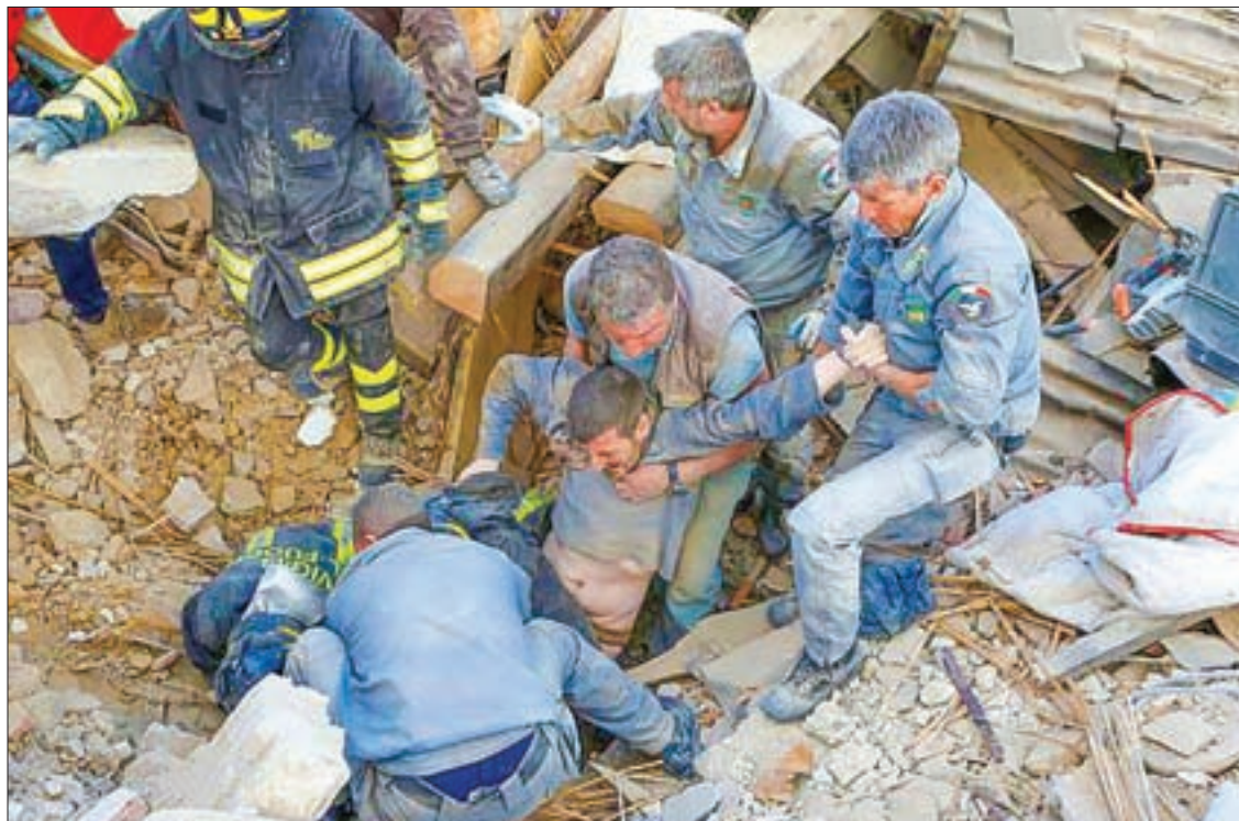
A man is rescued alive from the ruins following an earthquake in Amatrice, central Italy, on 24 August 2016.