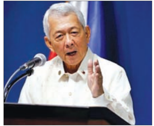
Philippines Foreign Affairs Secretary Perfecto Yasay speaks during a news conference at the Department of Foreign Affairs in Pasay city Metro Manila, Philippines, on 27 July 2016.

"This poses a grave threat to Japan's security, and is an unforgivable act that damages regional peace and stability markedly," Japanese Prime Minister Shinzo Abe told reporters, adding that Japan had lodged a stern protest. —Reuters