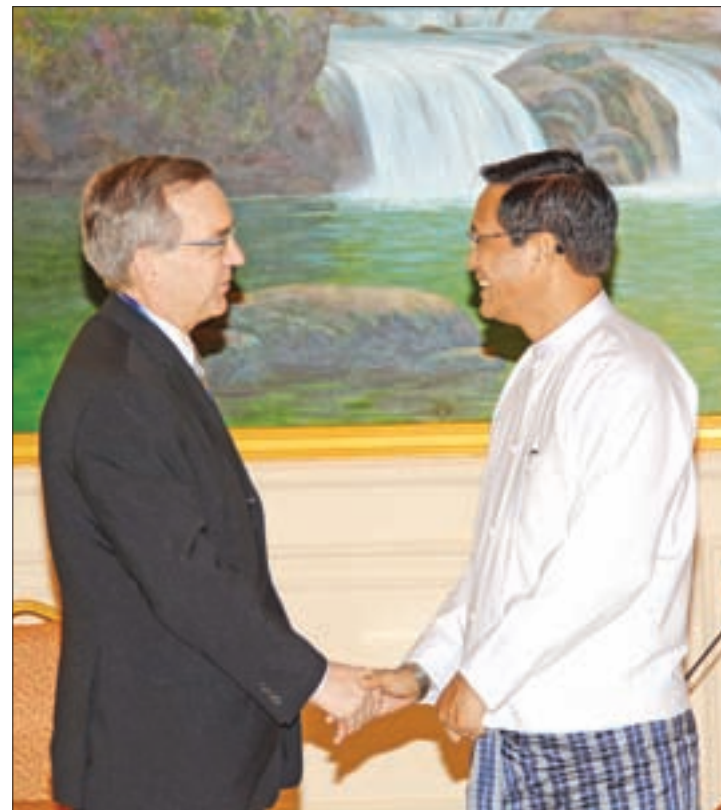
Vice President U Henry Van Thio receives US Ambassador to Myanmar Mr. Scot Marciel in Nay Pyi Taw.