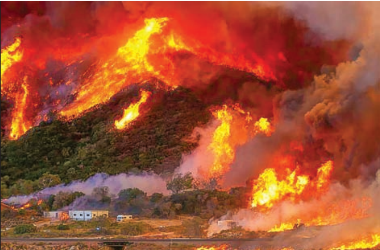
Flames whipped by strong winds burn through a hillside before destroying camper vans during the Blue Cut Fire in San Bernardino County, California, US, on 17 August, 2016.

ed in the county's rugged coastal hills on 13 August, has destroyed 36 homes and continued to threaten nearly 1,900 more, according to the California Department of Forestry and Fire Protection (Cal Fire). Evacuation orders were in effect for about 6,000 residents on Tuesday, according to Cal Fire spokesman Aladdin Morgan, up from just 2,500 on Monday. The historic Hearst Castle, a major tourist attraction on California's central coast, will be closed to the public through the week as a safety precaution due to the blaze. The monumental estate, built in the early 20 th century for publishing tycoon William Randolph Hearst, was no longer in immediate danger, but the Chimney Fire had crept within three miles (5 km) of the castle over the weekend before shifting direction,