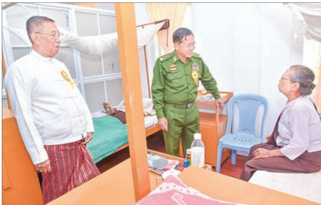
Senior General Min Aung Hlaing gives words of encouragement to the female elderly. PHOTO: MNA

Construction of the home began in October 2015. At this time 35 out of 38 planned buildings have been completed. Upon completion the home will accommodate 180 elderly men, 120 elderly women and 48 elderly couples. — Myanmar News Agency