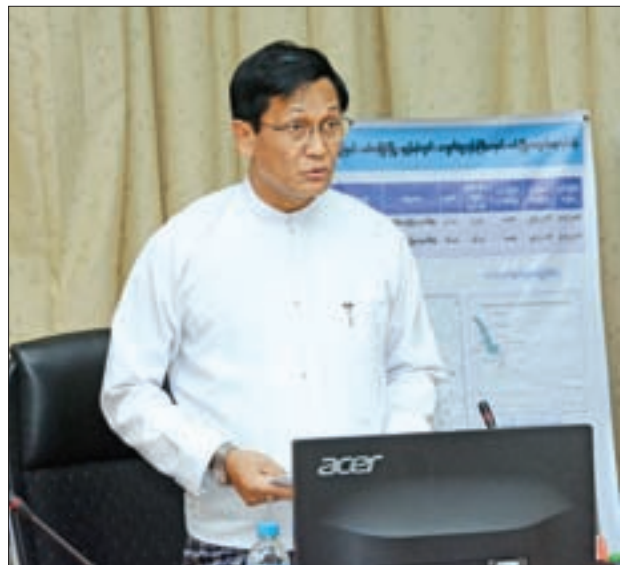
Vice President U Henry Van Thio.