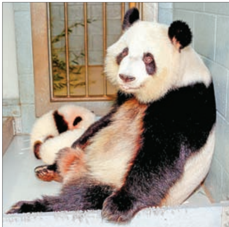
Giant Panda Lun Lun relaxes as her twin panda cubs Mei Lun and Mei Huan sleep at her feet at the Atlanta Zoo in Atlanta, Georgia, US in November 2013.

Panda pregnancies, famously rare in captivity and outside of China, are notoriously hard to establish or predict.