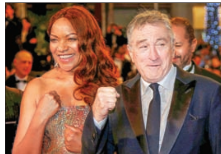
Cast member Robert De Niro and his wife Grace Hightower de Niro pose on the red carpet as they arrive for the screening of the film 'Hands of Stone' out of competition at the 69th Cannes Film Festival in Cannes, France, on 16 May 2016.