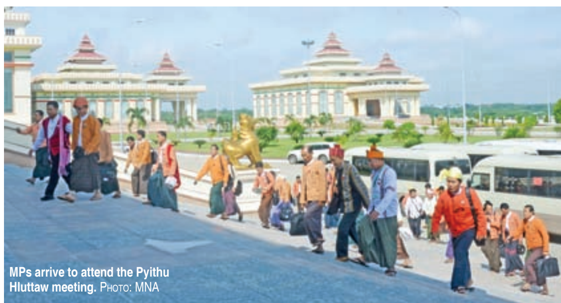
MPs arrive to attend the Pyithu Hluttaw meeting.