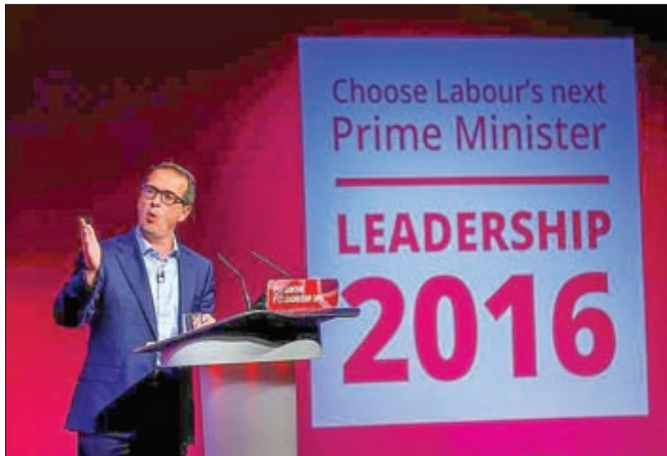
Labour Party leader challenger Owen Smith debates with leader Jeremy Corbyn (not pictured) in a hustings event of the Labour leadership campaign in Birmingham, Britain, on 18 August 2016.

LONDON — A leadership candidate for Britain's opposition Labour party, Owen Smith, said on Wednesday he would try to get parliament to block talks on leaving the European Union unless the government promises a second referendum or election.