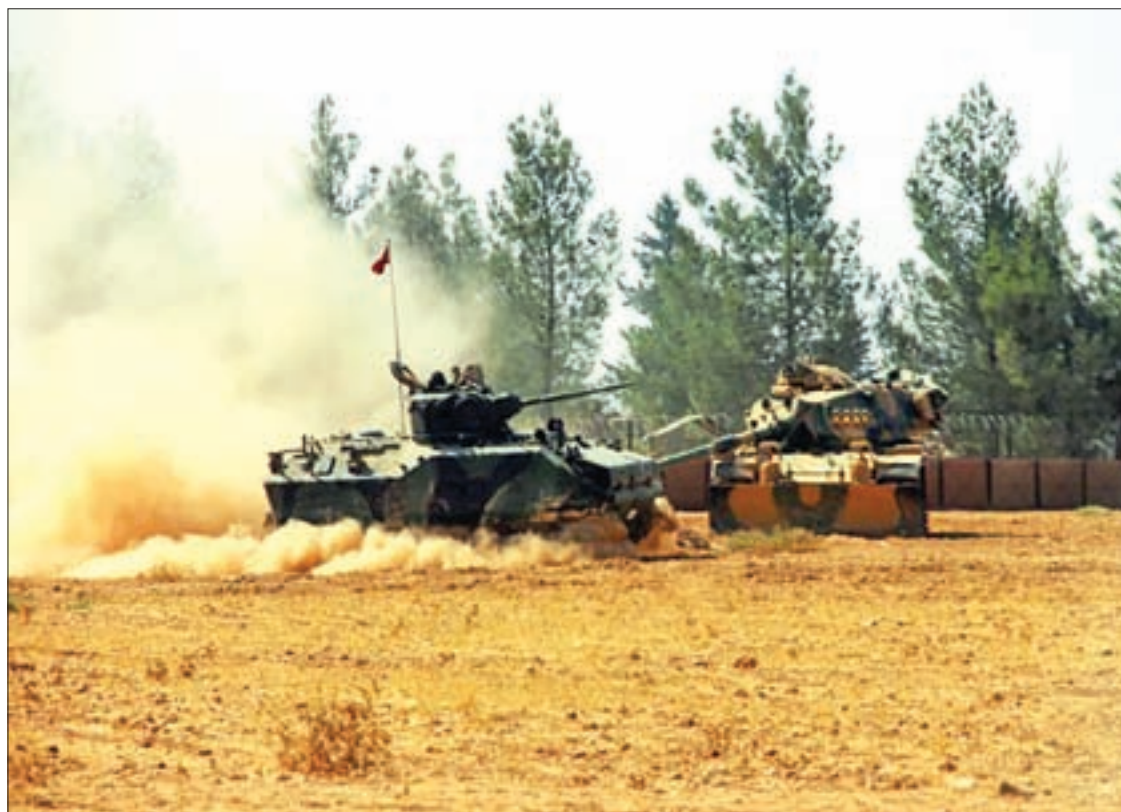
A Turkish army tank and an armoured vehicle are stationed near the Turkish-Syrian border in Karkamis in the southeastern Gaziantep Province, Turkey, on 23 August 2016.

Turkish military sources said a ground incursion had yet to start, but a group of Turkish special forces had entered Syria while Turkish and US-led coalition jets hit four Islamic State targets and Turkish artillery struck more than 60 targets. Tanks were