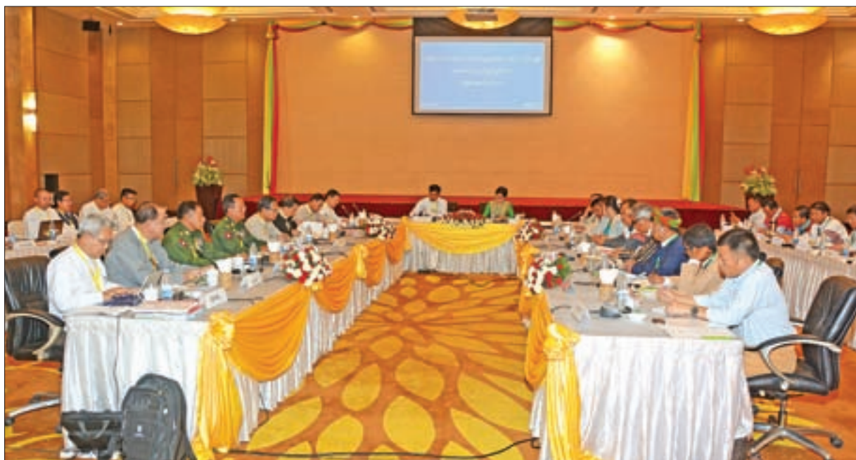
Joint Implementation Coordination Meeting on the Nationwide Ceasefire Agreement is in progress.