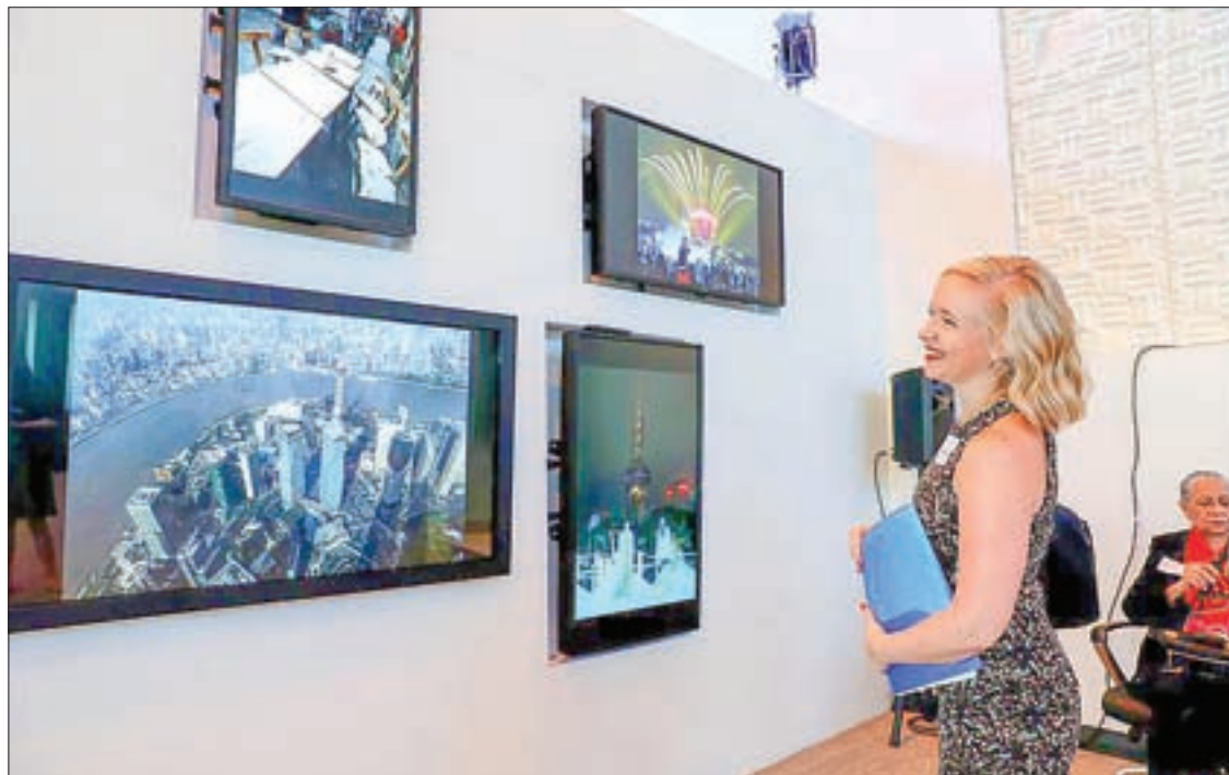
A visitor watches a photo show on China's Shanghai during a tourism promotion event in New York, the United States, on 23 August 2016. China's city of Shanghai launched Tuesday a tourism campaign in New York City with the debut of the first VR promotional video showcasing a panoramic view of the beauty of the metropolitan city.

As a part of the "China-US Tourism Year" programs, Shanghai and New York City had signed