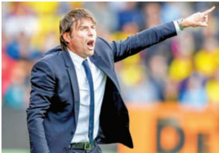
Chelsea manager Antonio Conte.

Chelsea welcome Burnley in their next Premier League fixture on Saturday.— Reuters