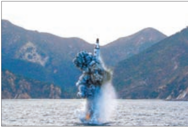
An underwater test-firing of a strategic submarine ballistic missile is seen in this undated photo released by North Korea's Korean Central News Agency (KCNA) in Pyongyang on 24 April 2016.

The projectile reached Japan's air defence identification zone (ADIZ) for the first time, Chief Cabinet Secretary Yoshihide Suga told a briefing, referring to an area of control designated by countries to help maintain air security.