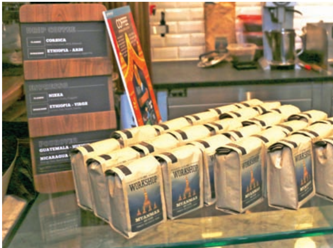
Myanmar specialty coffee makes its debut in the United States during a private tasting with specialty industry professionals at La Colombe Coffee Roasters in Washington, DC, US on 23 August, 2016.

Myanmar exported only modest amounts of coffee in the 1990s and a shipment of 17 60-kg bags in 2015 was the first delivery since 2000, US government