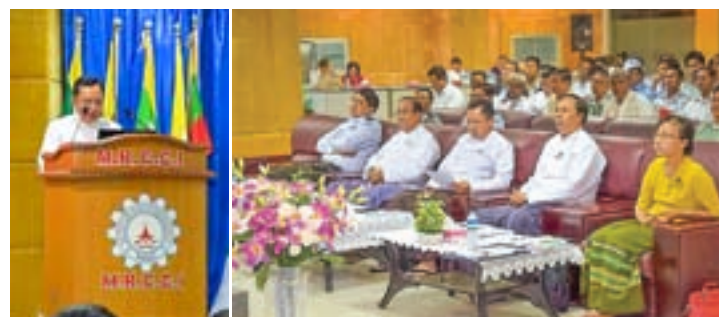
Express and businessman discuss investment opportunities in Myanmar.

Officials then responded to queries from attendees.