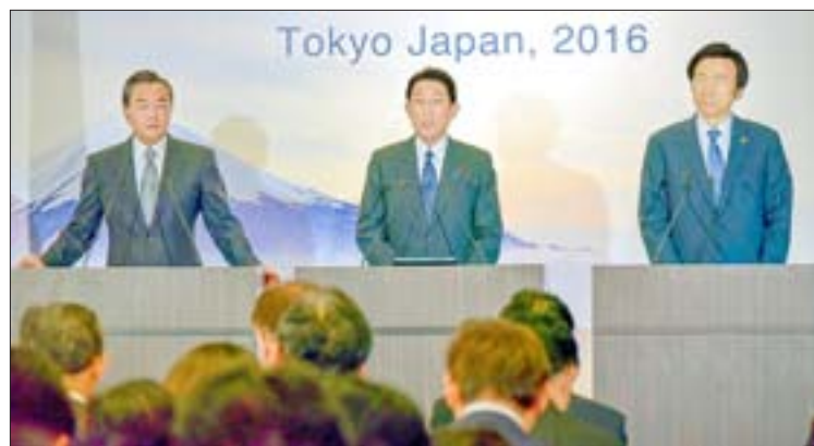
Japanese Foreign Minister Fumio Kishida (C) reads a statement after a trilateral meeting with Chinese Foreign Minister Wang Yi (L) and South Korean Foreign Minister Yun Byung-Se in Tokyo, Japan, on 24 August 2016.

Japanese troops have been part of a UN mission in South Sudan since 2012. Around 350 military engineers in the capital Juba are rebuilding roads and other infrastructure in South Sudan. Renewed fighting in July killed around 300 people, prompting Japan to evacuate some of its government aid workers civilians.—Reuters