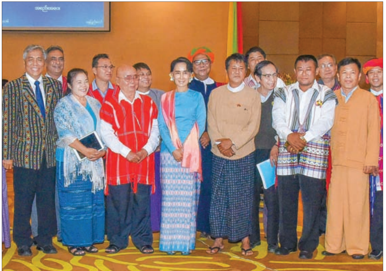
State Counsellor Daw Aung San Suu Kyi and members of the Peace Process Steering Team pose for documentary photos.