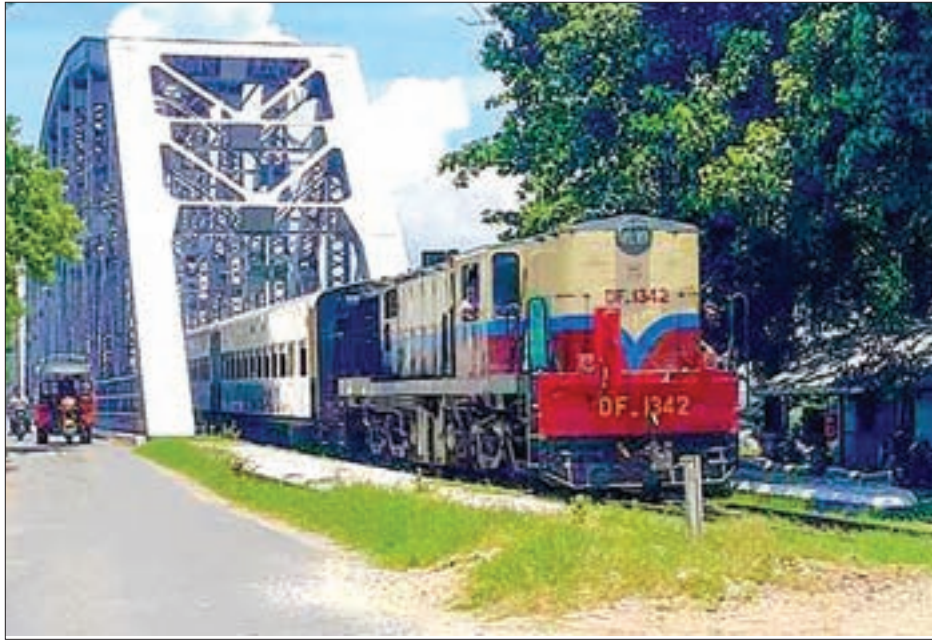
Photo shows a train running on railroad. Railroad upgrade to reduce Yangon-Mandalay travel time by 2023.

Only Myanmar- Japan joint companies will be allowed to offer tender. The first phase of the plan will be the upgrading of the line between Yangon and Taungoo, the second phase will be between