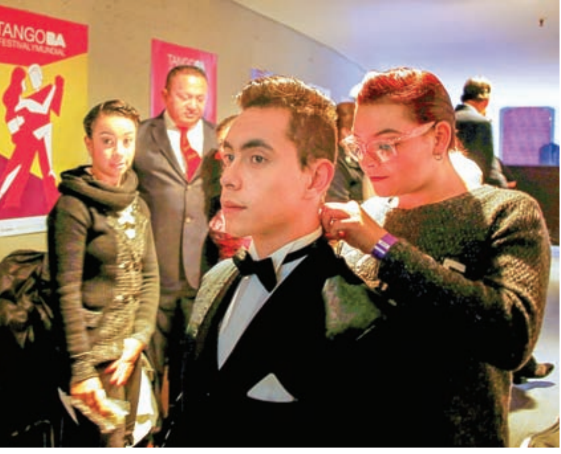
Contestants prepare backstage during the Salon Tango style qualifier round at the Tango World Championship in Buenos Aires, Argentina, on 22 August 2016.