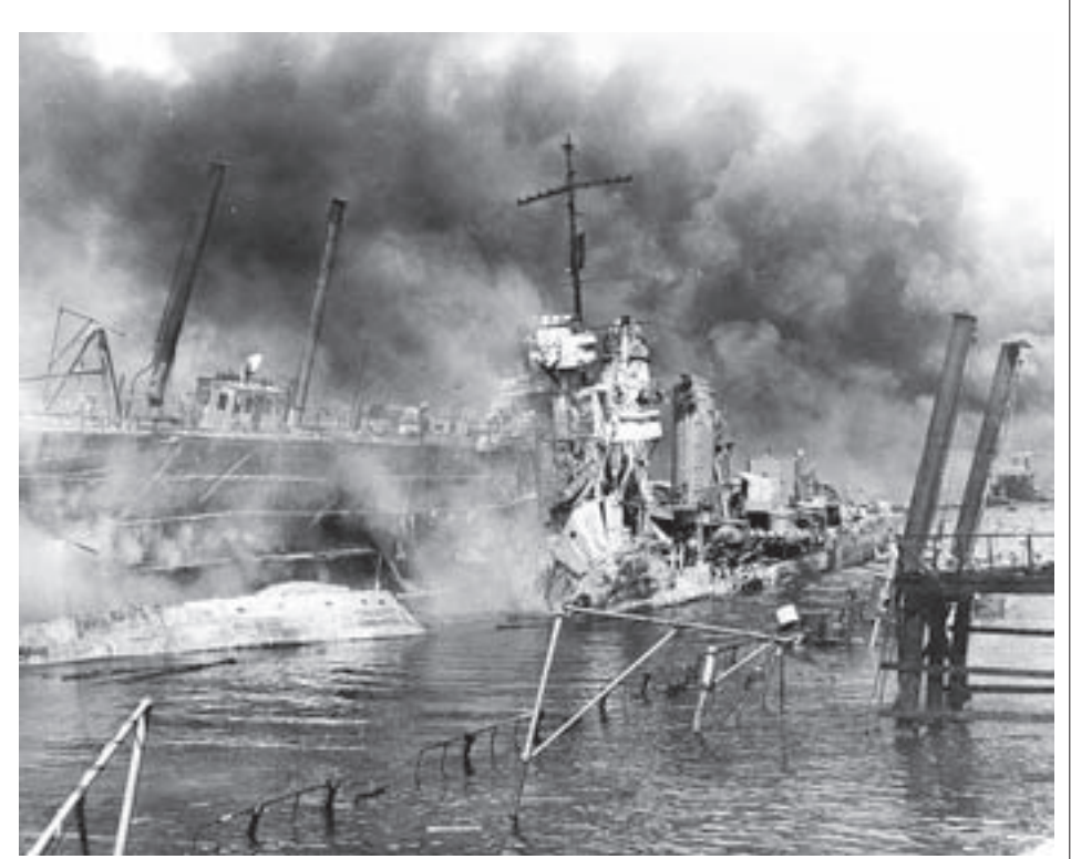
The twisted remains of the destroyer USS SHAW burning in floating drydock at Pearl Harbour after the 'sneak Japanese attack' on Pearl Harbour, Hawaii, on 7 December 1941.

More than 1,100 sailors and Marines were killed on the USArizona in the Japanese attack. The sunken battleship, at Pearl Harbour Abe has gone is a tremen-