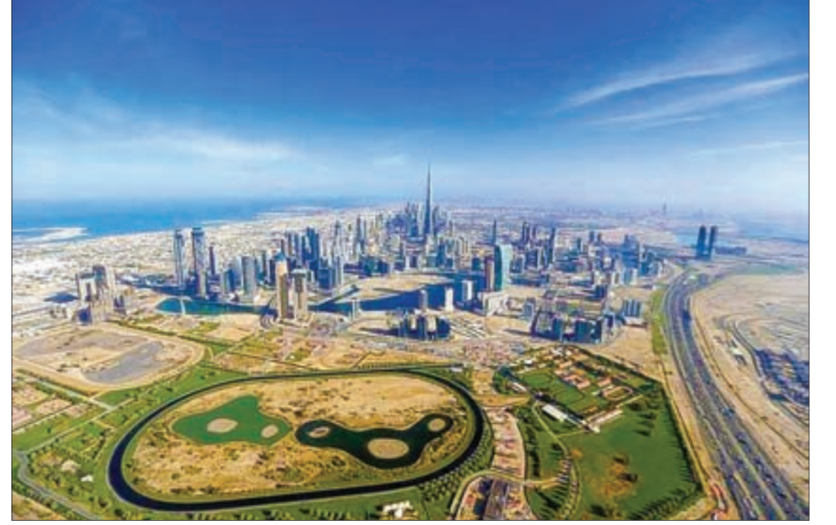
Burj Khalifa, the world's tallest tower, is seen in a general view of Dubai, UAE on 9 December 2015.