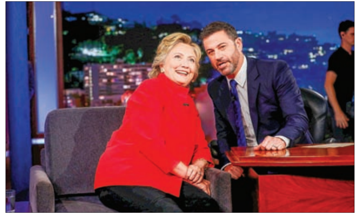
Democratic presidential nominee Hillary Clinton tapes an appearance on the Jimmy Kimmel Show in Los Angeles, California, on 22 August 2016.