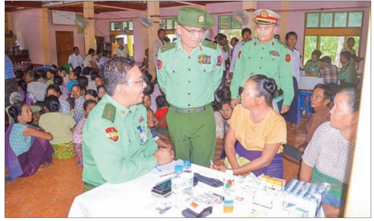
Officers of Northwest Command chatting with local people.

A military mobile medical team of Northwest Command provided medical check-ups for 407 local people in Kanphyar village