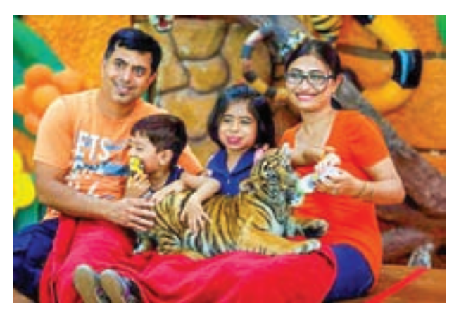
Tourists feed milk to a tiger cub at the Sriracha Tiger Zoo, in Chonburi Province, Thailand, on 7 June 2016.