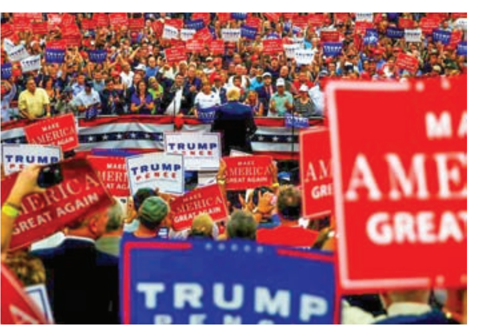
Republican presidential nominee Donald Trump speaks onstage during a campaign rally in Akron, Ohio, US, on 22 August 2016.

Trump faulted both the Justice Department and Federal Bureau of Investigation for not indicting