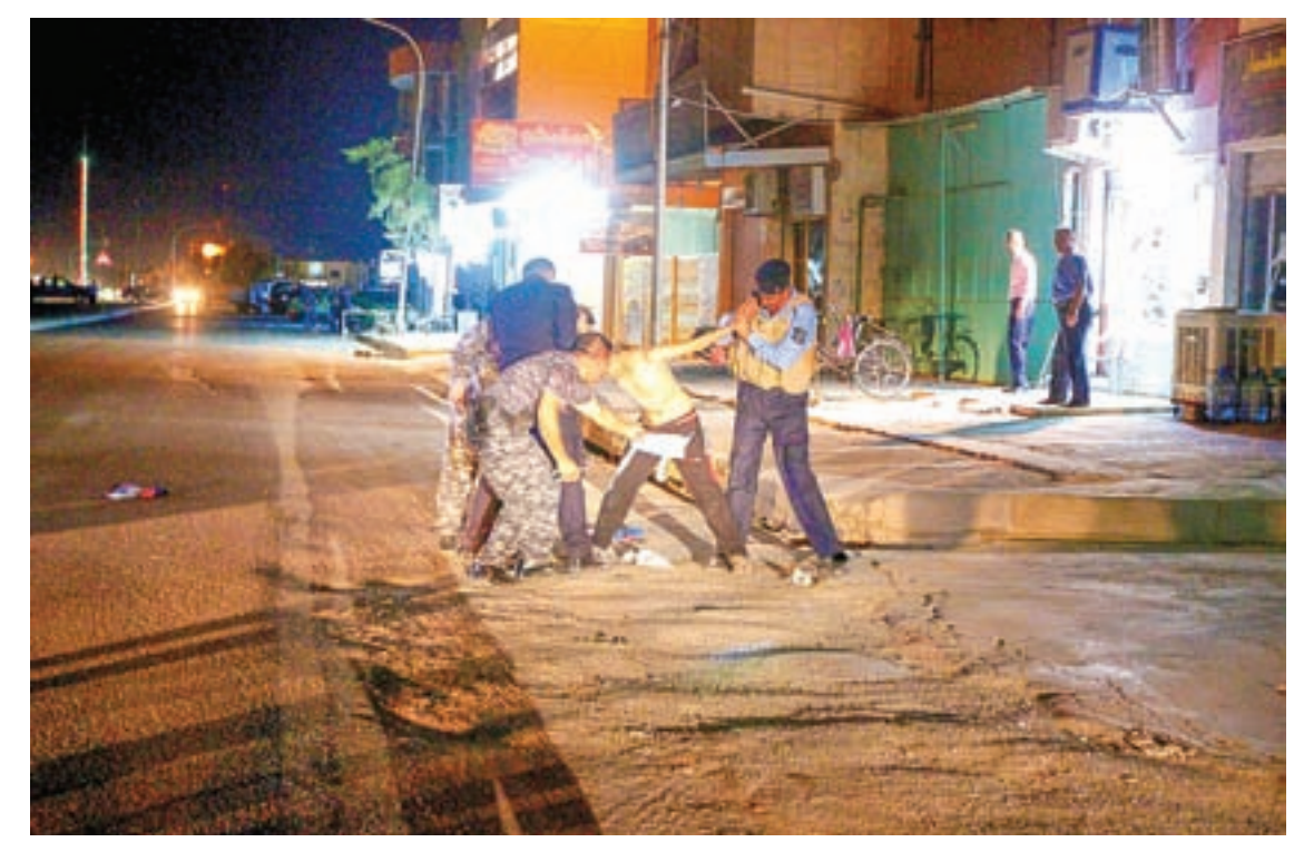
Iraqi security forces remove a suicide vest from a boy in Kirkuk, Iraq, on 21 August 2016.

Islamic State in particular, highlights its child recruits for its "Cubs of the Caliphate" brigades, publishing images and videos on street late at night. As many as 22