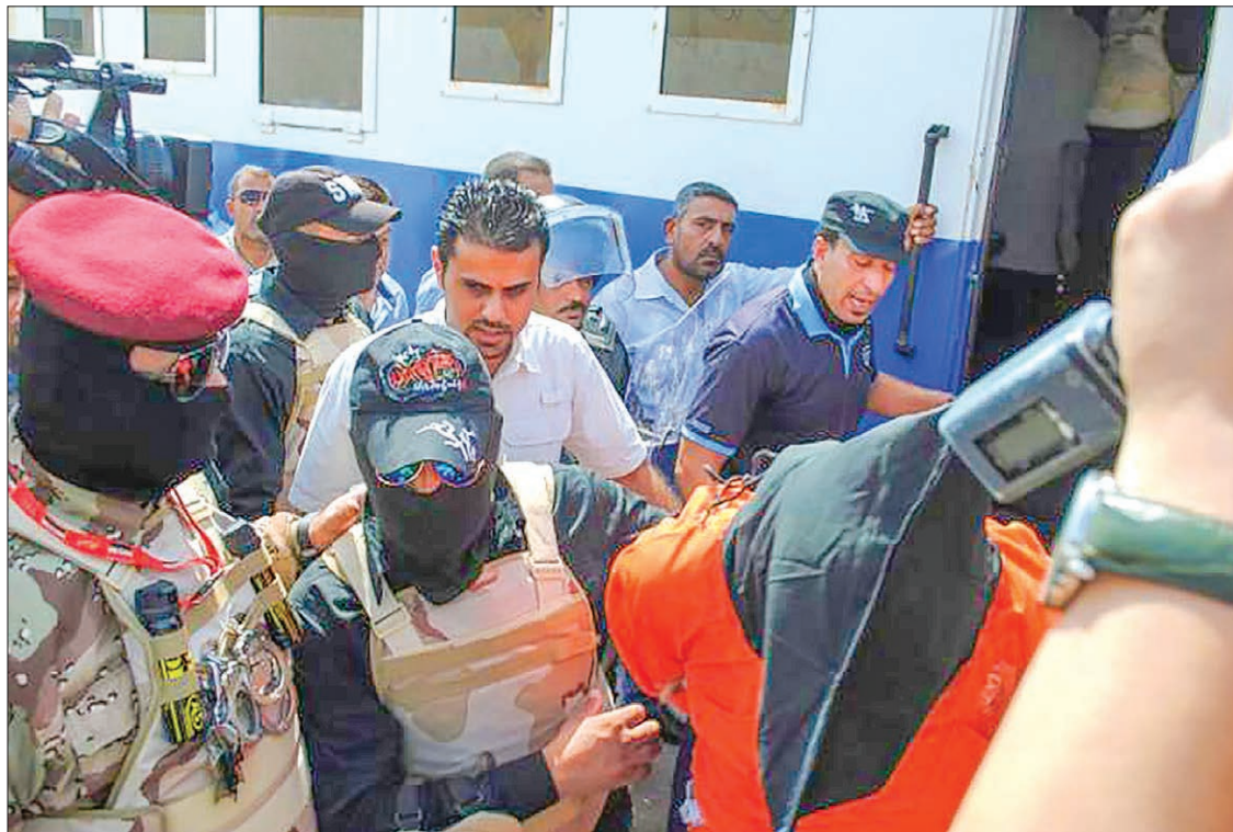
Iraqi security forces escort a man (R), sentenced to death over the mass killing of hundreds of mainly Shi'ite soldiers at a camp north of Baghdad two years ago, at Nasiriya prison in the southern Iraqi city of Nasiriya, on 21 August 2016.

BAGHDAD — Iraq said on Sunday it had hanged 36 militants sentenced to death over the mass killing of hundreds of mainly Shi'ite soldiers at a camp north of Baghdad two years ago.