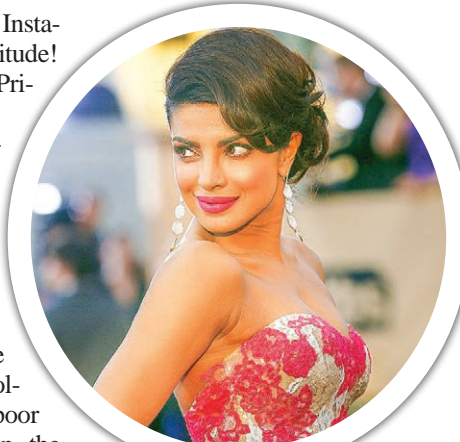
Actress Priyanka Chopra.

Alia Bhatt holds the third spot with 8.5 million followers, whereas Sonam Kapoor and Akshay Kumar are on the fourth and fifth positions with 6.8 million and 6.3 million followers, respectively.—PTI