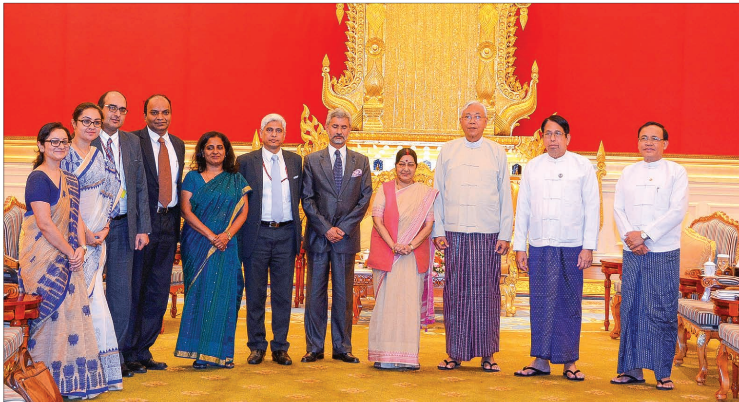
President U Htin Kyaw welcomes the Indian delegation led by External Affairs Minister Ms Sushma Swaraj.

Also present at the call were Union Minister for Information Dr Pe Myint and Minister of State for Foreign Affairs U Kyaw Tin.— Myanmar News Agency