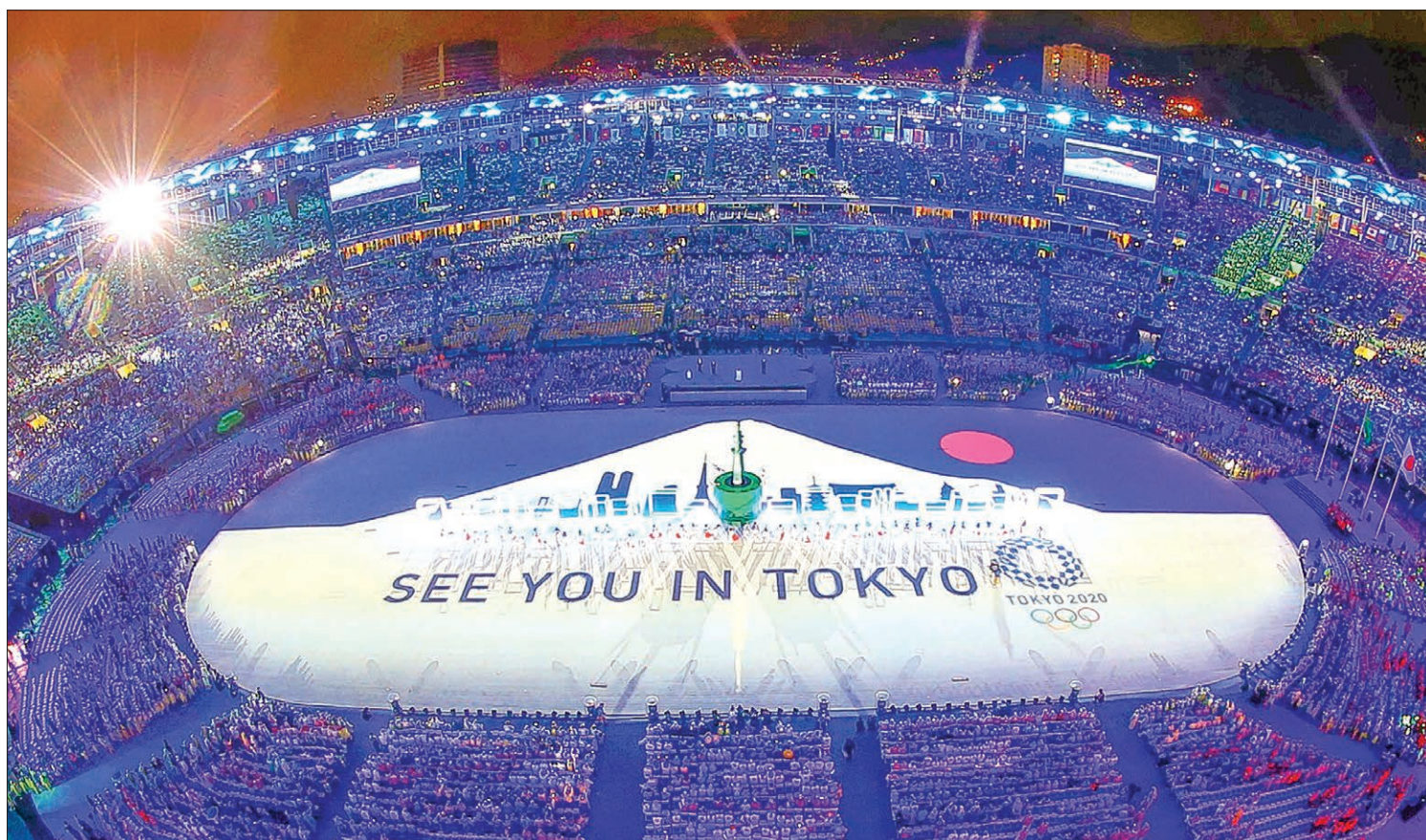
Performers take part in the closing ceremony 2016 Rio Olympics Closing Ceremony at Maracana in Rio de Janeiro, Brazil, on 21 August 2016.

A swampy green diving pool and a bullet whizzing into the equestrian centre were of no