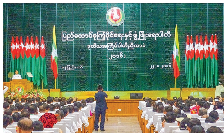
USDP's second conference in progress.

During yesterday's conference, members of the party's central committee, reserve CEC members and members of the central executive committee were re-appointed. — Myanmar News Agency