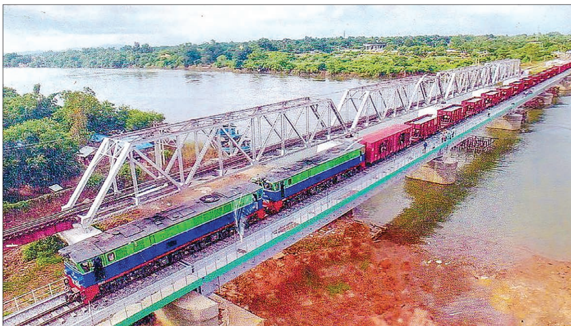
Photo shows a train making the first test run on the new railroad bridge.

The railroad bridge, which is 721 feet long and 12 feet wide, consists of five posts. It was built with the use of a 682 feet long steel frame weighing 800 tonnes. Concrete railway sleepers have been installed at the bridge. — Aung Thant Khaing