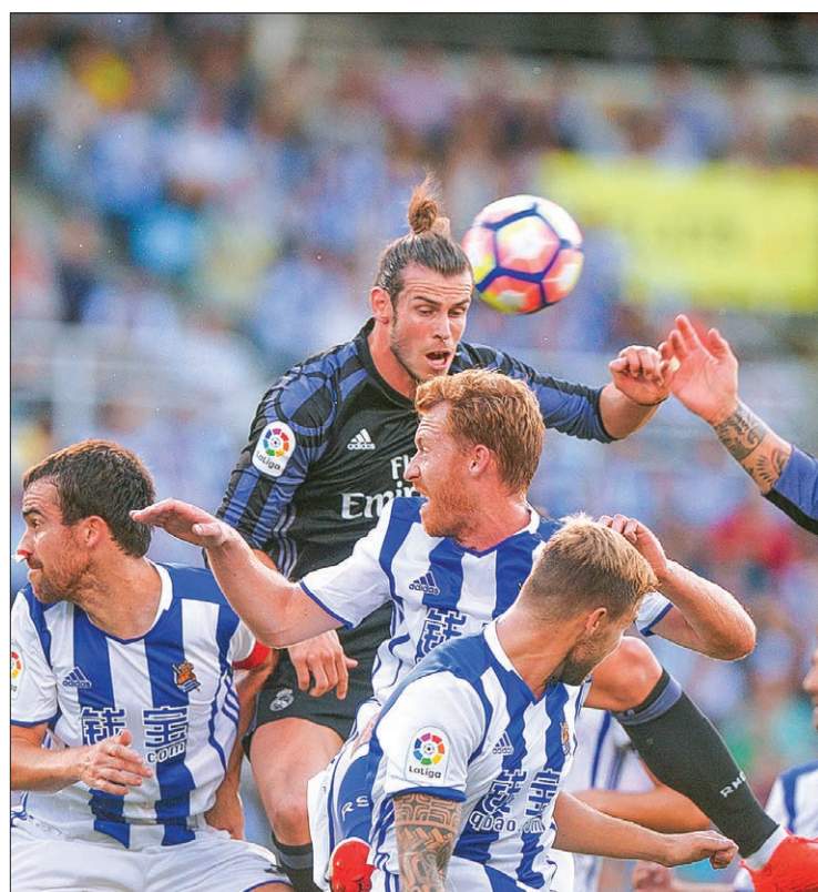
Real Real Madrid's Gareth Bale heads the ball during Spanish Liga Santander at Anoeta, San Sebastian, Spain, on 21 August 2016.

But he was also beatable, as Singapore's Joseph Schooling showed in touching out the legend who had inspired him with a historic victory in the 100m butterfly. Phelps finished in a three-way tie for silver.—Reuters