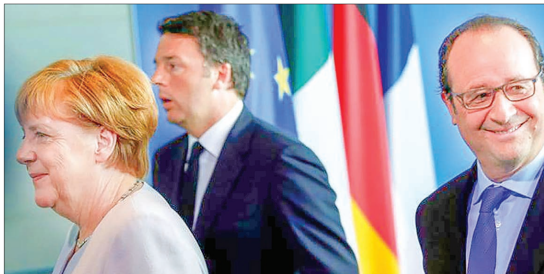
German Chancellor Angela Merkel (L), French President Francois Hollande (R) and Italian Prime Minister Matteo Renzi attend a news conference at the chancellery during discussions on the outcome of the Brexit in Berlin, Germany, on 27 June, 2016.

"He's wrestling with how to do that. People that are here unlawfully, came into the country against our laws, are subject to being removed. That's just plain fact," the Alabama lawmaker said. "He's thinking that through." Trump has also been rebuked by opponents for his proposal to impose a temporary "total and complete shutdown" of Muslims seeking to enter the country, later rolled back to focus on countries with "a proven history of terrorism." —Reuters