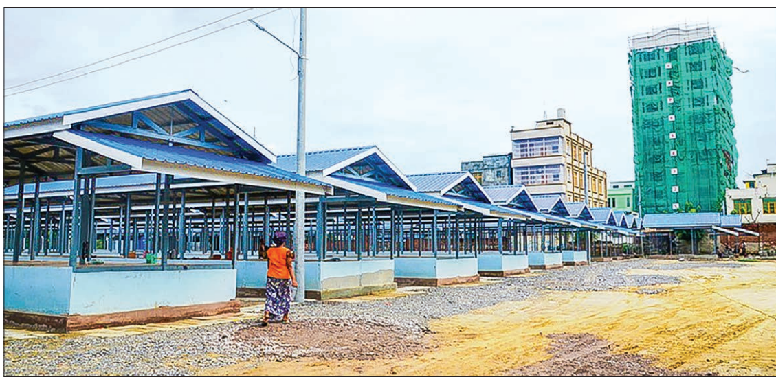
Temporary shops for Mandalay Mingalar market's fire victims are ready to accommodate the shopkeepers.

THE temporary shops for Mandalay Mingalar market's fire victims will be given out through a draw of lots in the second week of September.