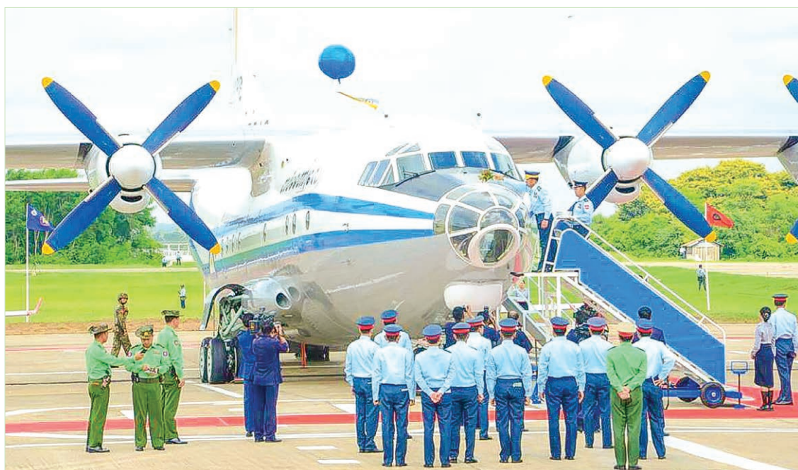
Senior General Min Aung Hlaing sprinkles scented water on the new transport aircraft.

COMMANDER-IN-CHIEF of Defense Services Senior General Min Aung Hlaing attended a ceremony to put new Air Force aircraft into service at the Flying Training Base in Meiktila Station yesterday. In honour of the ceremony, the Command-