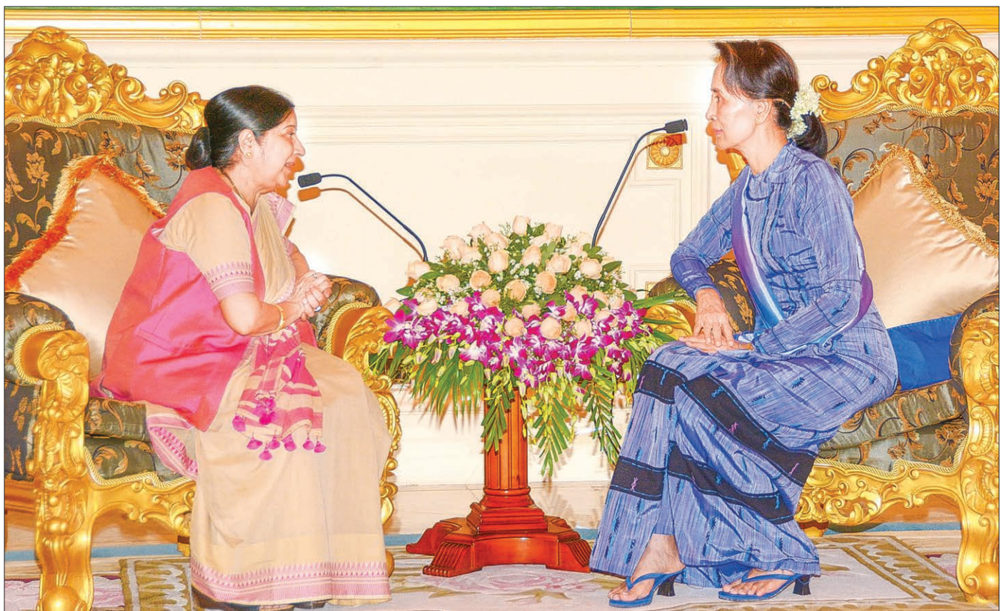
State Counsellor Daw Aung San Suu Kyi holds talks with Indian External Affairs Minister Ms Sushama Swaraj.

Also present at the call were Minister of State for Foreign Affairs U Kyaw Tin and officials.—GNLM with MNA