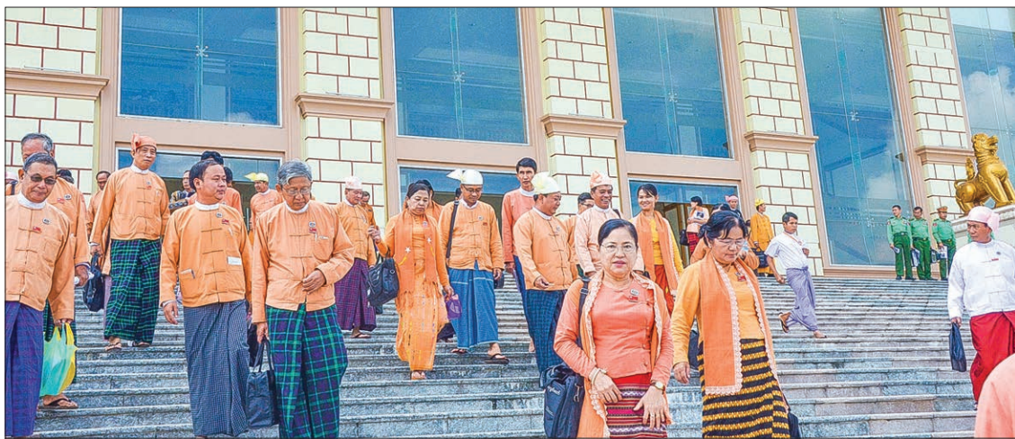
MPs leave Pyithu Hluttaw building after the parliamentary meeting on 22 July.

Despite the proposed fund of K175million for maintenance work of the project, the