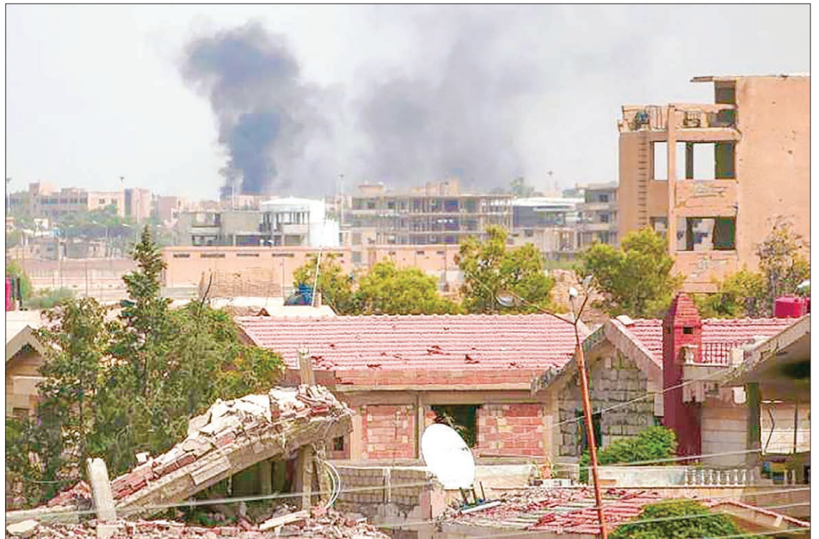
Smoke rises from the northeastern city of Hasaka, Syria, on 21 August, 2016.

The YPG denied it had entered into a truce. It distributed leaflets and made loudspeaker calls across the city asking for