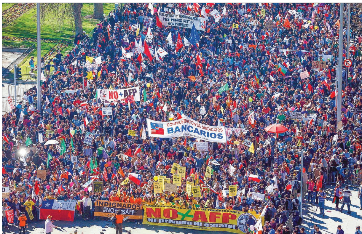
Demonstrators take part in a protest against government to demand changes to the national pension system in Santiago, Chile, on 21 August, 2016. The placards reads: "No more AFP" (Pension Fund Administrators).

Since the coup, more than 17,000 people have been placed under formal arrest, and tens of thousands more suspended from their jobs. Turkish authorities blame the failed putsch on US-based Muslim cleric Fethullah Gulen and his followers. Gulen denies involvement and has condemned the coup attempt.—Reuters