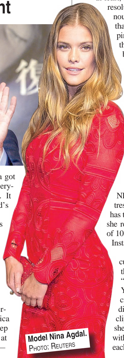
Model Nina Agdal.

Justin Timberlake and wife Jessica Biel eventually step in to host the event at their own house.