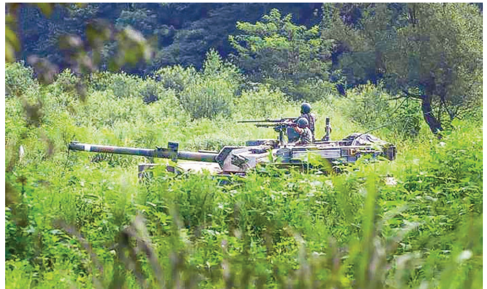
A South Korean army tank takes part in a military exercise near the demilitarized zone separating the two Koreas in Paju, South Korea, on 22 August 2016.

"From this moment, the first-strike combined units of the Ko-