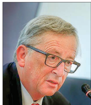
European Commission President Jean-Claude Juncker.

BRUSSELS — European Commission President Jean-Claude Juncker said on Sunday Turks would only be granted visa-free travel to EU countries from October if Ankara meets all the requirements, including reforming anti-terror laws.