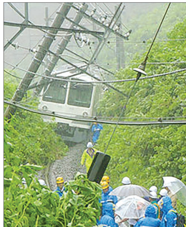
A derailed train on the Seibu Tamako line in Higashimurayama, western Tokyo, on 22 August 2016.

He may have left his vehicle after it became stranded in the middle of the flooded road, the police said.— Kyodo News