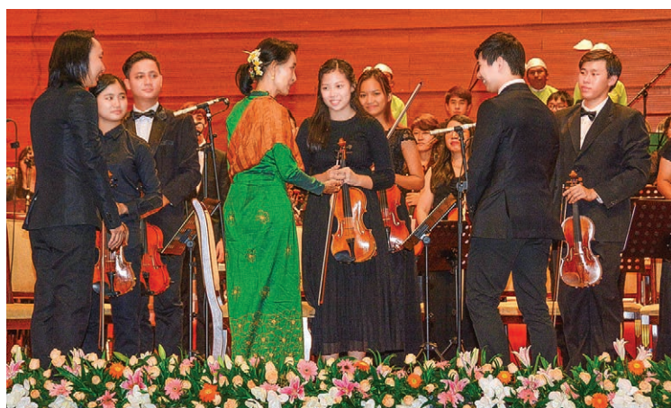
State Counsellor Daw Aung San Suu Kyi extends greetings to musicians in Nay Pyi Taw.

Also present were Pyithu Hluttaw Speaker U Win Myint, Amyotha Hluttaw Speaker Mahn Win Khaing Than, Deputy Commander-in-Chief of Defense Services Commander-in-Chief (Army) Vice-Senior General Soe