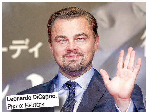
Leonardo DiCaprio.

NEW YORK — "The Revenant" actor Leonardo DiCaprio and his model girlfriend Nina Agdal were reportedly involved in a car crash.