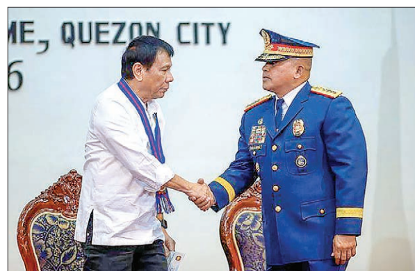
Philippine President Rodrigo Duterte shakes hands with Philippine National Police (PNP) Director General Ronald Dela Rosa (R) upon his arrival to address the 115th Police Service Anniversary at the (PNP) headquarters in Quezon city, metro Manila, Philippines, on 17 August 2016.

MANILA — The number of drug-related killings since President Rodrigo Duterte took power and declared war on drugs in May has doubled to about 1,800, police said on Monday, a day after Duterte lashed out over United Nations criticism of the wave of deaths.