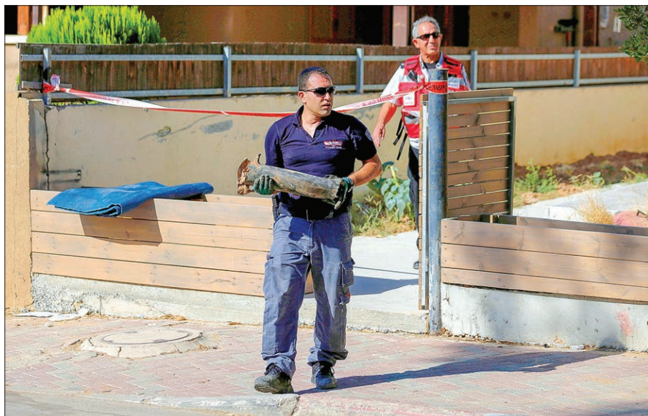
An Israeli policeman carries part of a rocket which the Israeli army and police said was launched from Gaza, landing next to a residential building in the Israeli southern town of Sderot, Israel, on 21 August 2016.

A music festival in Sderot attended by hundreds of Israelis was temporarily disrupted as people sought shelter, television footage showed.