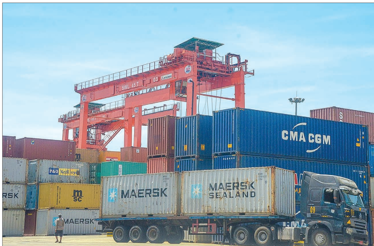
Containers are seen at Asia World Port Terminal in Yangon.

The Yangon port is faced with a struggle to handle the containers arriving at the port when the owners of the goods fail to withdraw their goods in a timely manner. To prevent the ports from being used as godowns, the authorities increased the fines for those who fail to remove their goods on time. This is an attempt for the ports to be able to move cargo quickly and decrease backlogs.—200