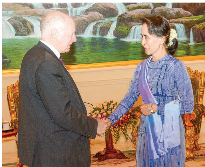
State Counsellor Daw Aung San Suu Kyi shakes hands with Lord Neuberger, the President of the UK Supreme Court.

dential Palace in Nay Pyi Taw at 15:45 hrs on 22 August, 2016, and exchanged views on the promotion of bilateral relations and cooperation between Myanmar and the UK.— Ministry of Foreign Affairs