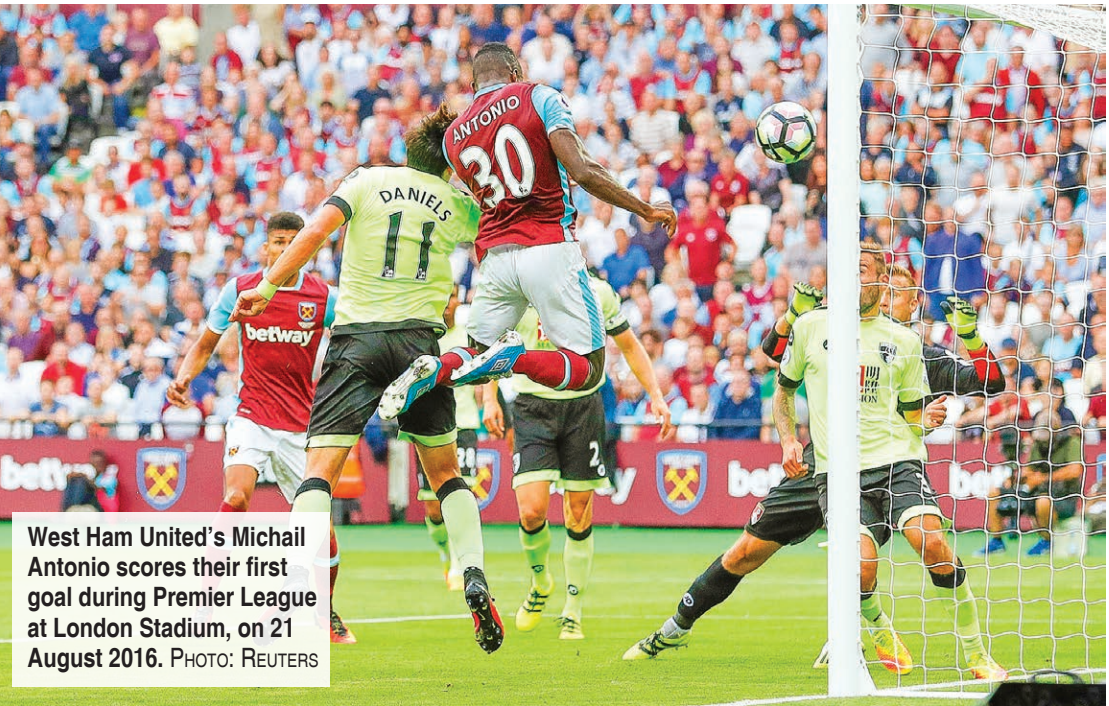
West Ham United's Michail Antonio scores their first goal during Premier League at London Stadium, on 21 August 2016.