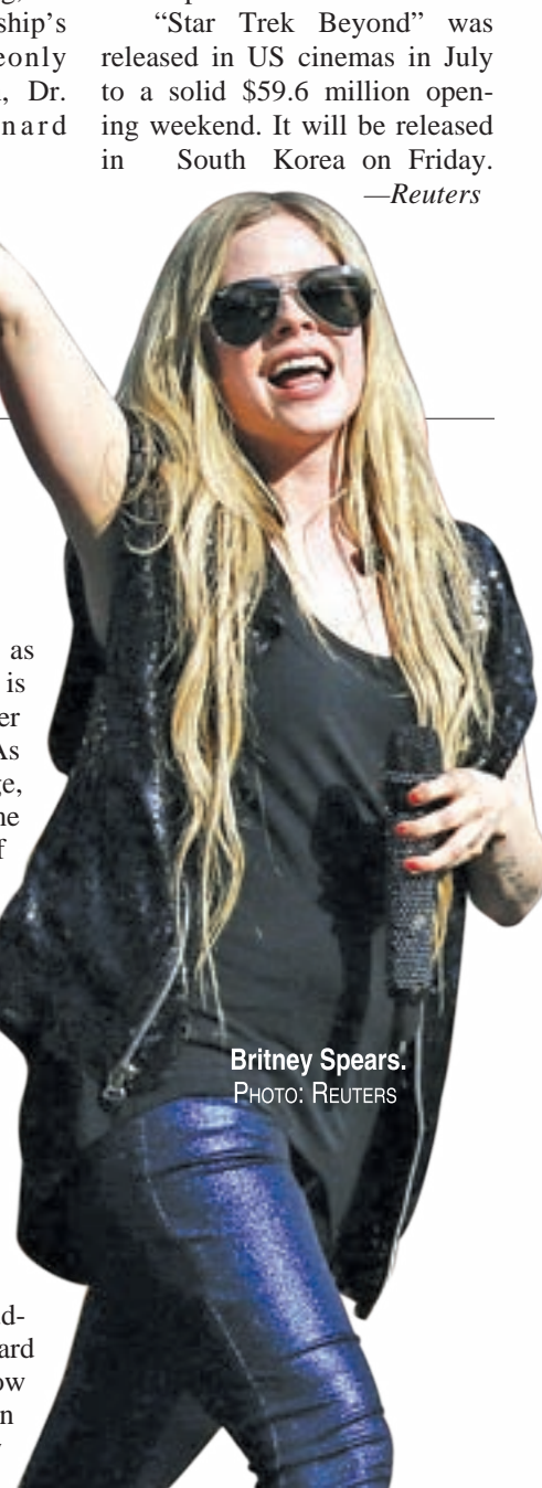
Britney Spears.

singer says in voiceover as an albino Burmese python is seen slithering through her dressing room, "The VMAs don't just give you a stage, they give you a story. Some way of taking a fraction of a second and making it live forever." She adds, "Before you know it, it's history. Before you know it, it's Britney." The snake is a throwback to her 2001 "I'm a Slave 4 U" performance at the annual award show where she danced with a python named Banana. Spears joins other performers billed for the show, including Video Vanguard Award recipient Rihanna. The show will air live from Madison Square Garden in New York City.—PTI