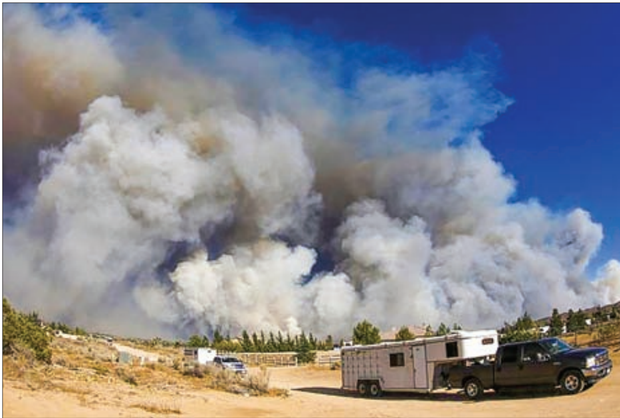
People evacuate their horses as smoke fills the skies in this photo taken with an extreme wide angle lens at the so-called Bluecut Fire in the San Bernardino National Forest in San Bernardino County, California, US, on 16 August 2016.