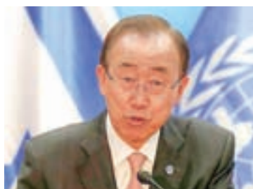
UN Secretary-General Ban Ki-moon.

The secretary-general was "concerned about allegations that UNMISS (the UN peacekeeping