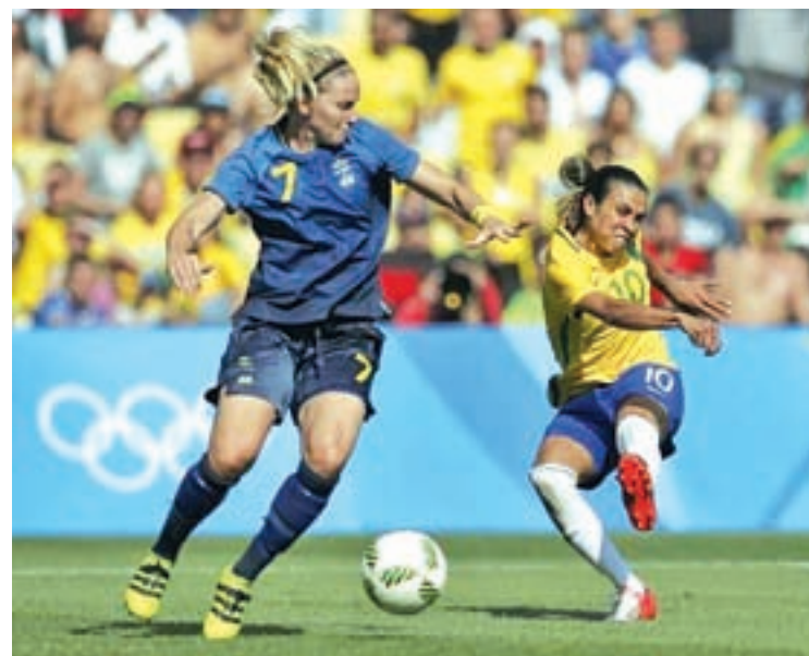
Lisa Dahlkvist (SWE) of Sweden (L) and Marta (BRA) of Brazil compete during 2016 Rio Olympics, Women's Football Tournament Semifinal at Maracana in Rio de Janeiro, Brazil on 16 August 2016.

Even with her skills, major success has eluded the Brazilian women's team. With her in the side, they won silver at the Athens Olympics in 2004 and Beijing in 2008, and were runners-up in the World Cup in China in 2007. But a gold in Rio de Janeiro in the temple of Brazilian soccer would have been particularly sweet — and would have boosted the women's game in Brazil, which has often lacked official support.—Reuters