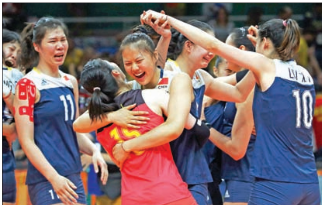
China's players (CHN) celebrate after winning the match during Volleyball Women's Quarterfinals 2016 Rio Olympics, Maracanazinho at Rio de Janeiro, Brazil on 16 August 2016.

Brazil fought back in the fourth but China prevailed