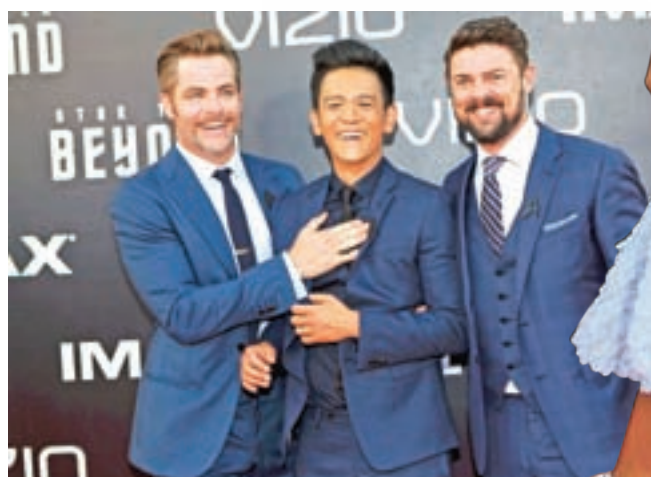
Actors Chris Pine (L), John Cho (C) and Karl Urban arrive for the world premiere of "Star Trek Beyond" at Comic Con in San Diego, California US, on 20 July, 2016.

SEOUL — The cast of "Star Trek Beyond" hit the red carpet in Seoul on Tuesday to meet and greet fans days before the film's release in South Korea.