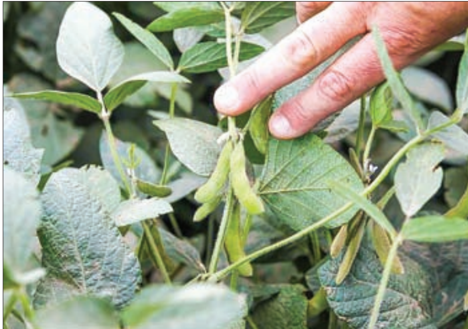
Engineer Juan Elizalde looks at a soybean in a soybean field in the city of Totoras, 360 km (224 miles) north of Buenos Aires, in 2012.

India's overall edible oil imports are expected to rise 1.4 per cent in the 2015/16 marketing year