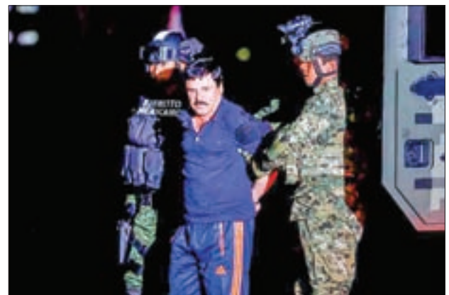
Joaquin "El Chapo" Guzman is escorted by soldiers during a presentation in Mexico City, on 8 January 2016.

Guzman was the head of the Sinaloa cartel and one of the world's most wanted drug kingpins until he was captured in January. Six months earlier, he had