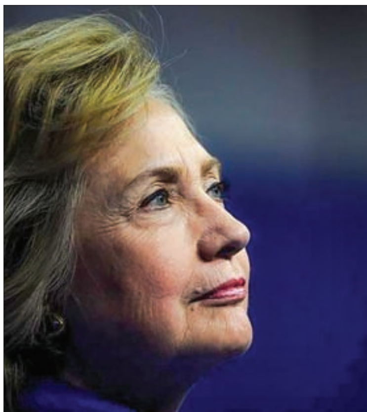
Democratic presidential candidate Hillary Clinton listens to Vice-President Joe Biden speak as they campaign together during an event in Scranton, Pennsylvania, on 15 August, 2016.

A spokeswoman for the House of Representatives Over-