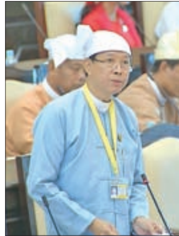
Dr Myo Thein Gyi.