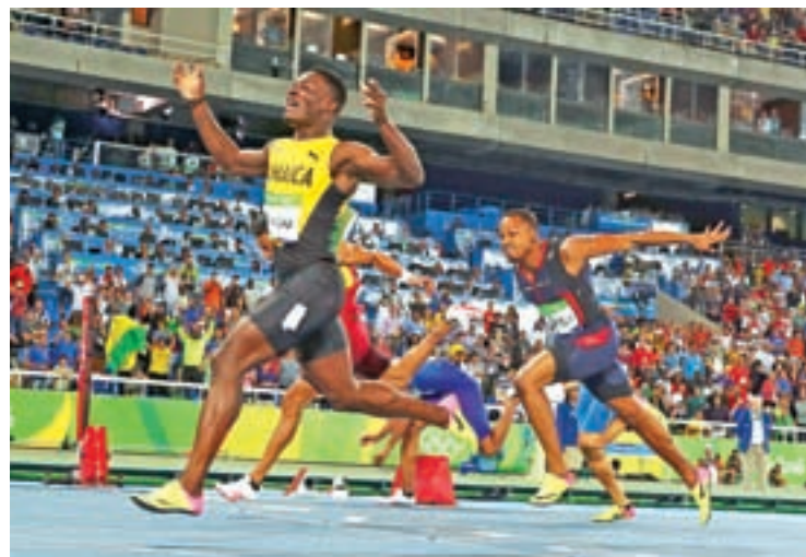
Omar McLeod (JAM) of Jamaica crosses the finish line to win the gold during Men's 110m Hurdles Final at Olympic Stadium, Rio de Janeiro, Brazil, on 16 August.