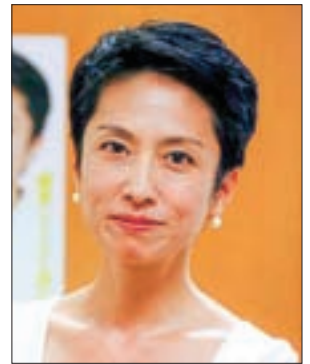
Democratic Party's lawmaker Renho.

"One economic policy solution is to spend money on individuals," she said. Renho, the mother of 19-year-old twins, is an advocate of policies that support working women and cited easing the financial burden of childrearing as an example. She is the only lawmaker to announce candidacy so far for the 15 September leadership race of the Democratic Par-