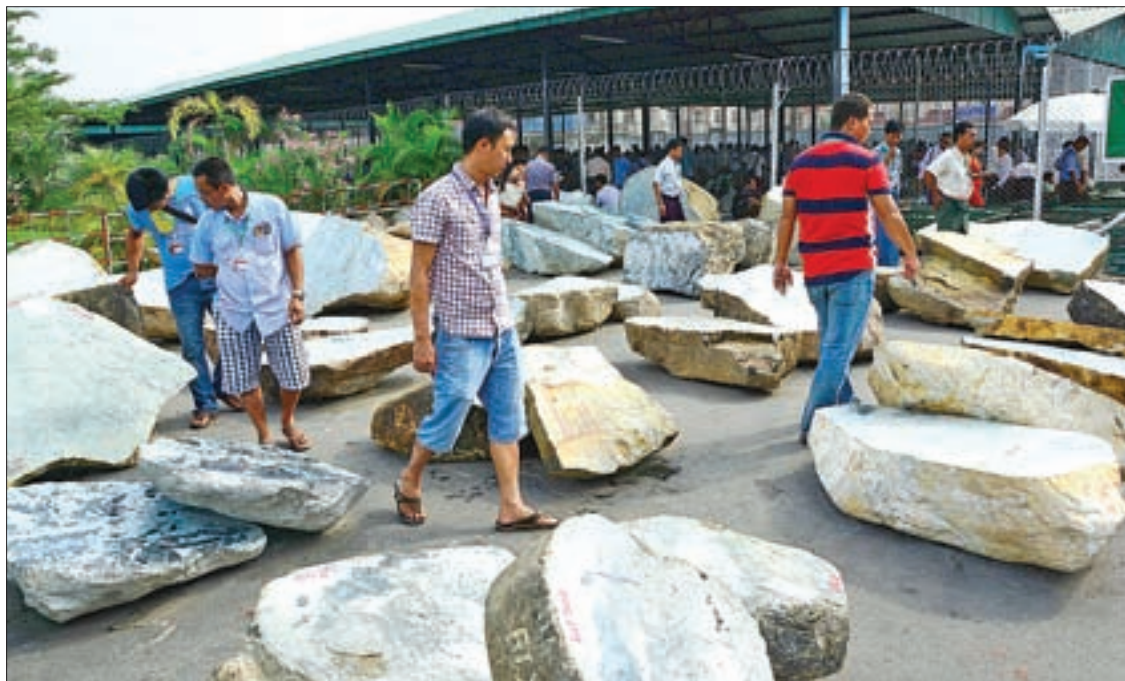
Traders check jade stones at the jade market in Mandalay.

There is a large quantity of Myanmar jade stones in the China market because the raw jade stones are illegally taken into China through Laning zar, Myitkyina. Therefore, the Chinese merchants do not have to come