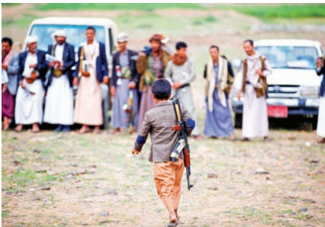
An armed boy walks as he attends a gathering held by tribesmen loyal to the Houthi movement to show support to a political council formed by the movement and the General People's Congress party to unilaterally rule Yemen by both groups in Sanaa, on 14 August 2016.

A survey by Yemen's education ministry cited by the report showed that of 1,671 schools in 20 governorates which suffered damage, 287 need major reconstruction, 544 were serving as shelters for internally displaced persons, and 33 were occupied by armed