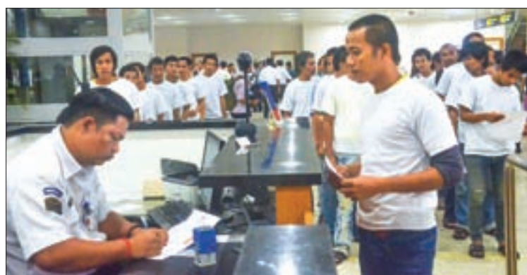
Third batch of detained Myanmar workers check in at Yangon International Airport.