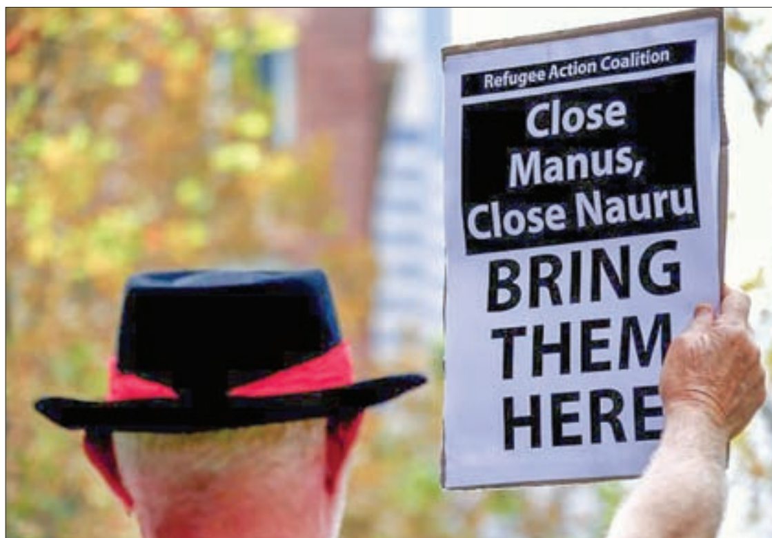
A protester from the Refugee Action Coalition holds a placard during a demonstration outside the offices of the Australian Government Department of Immigration and Border Protection in Sydney, Australia, on 29 April, 2016.

ing advanced and implemented. It is important that this process is not rushed out but carried out in a careful manner.” There was no mention of a closing date.