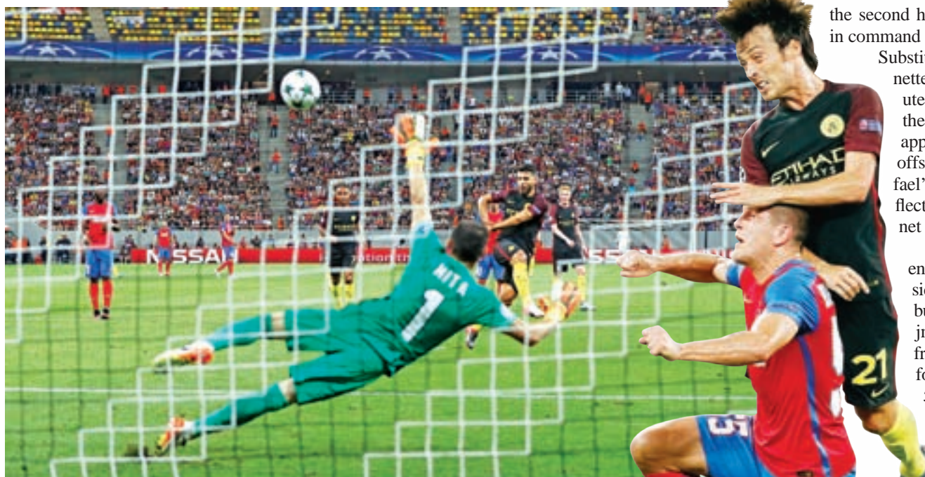
Manchester City's Sergio Aguero misses his second penalty at National Arena, Bucharest, Romania on 16 August 2016.