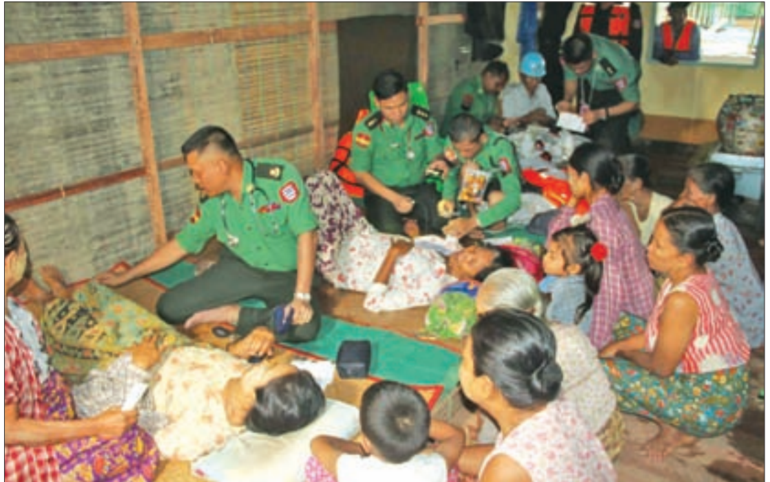
A medical team giving medical treatment to local people.

Similarly, a mobile military medical team of the Region Command gave medical treatments to 123 people within the villages.— C-in-C's Office