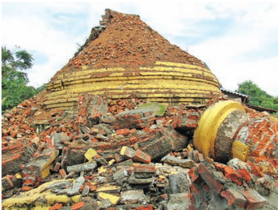
Ancient relics are recovered from remains of a toppled pagoda in Minbya Township, Rakhine State.