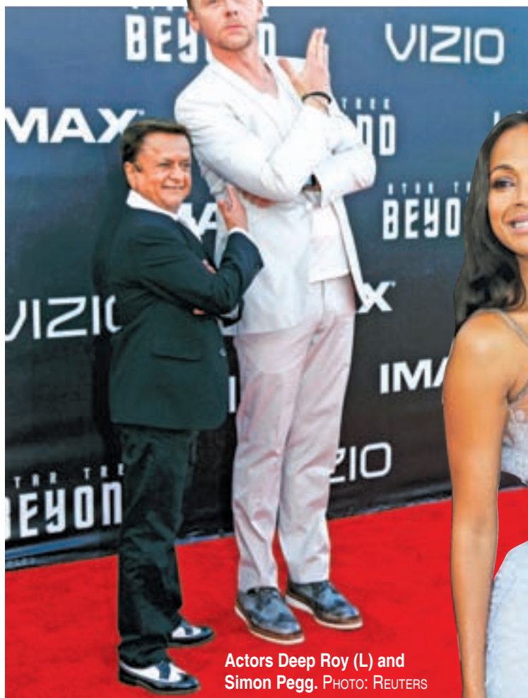
Actors Deep Roy (L) and Simon Pegg.