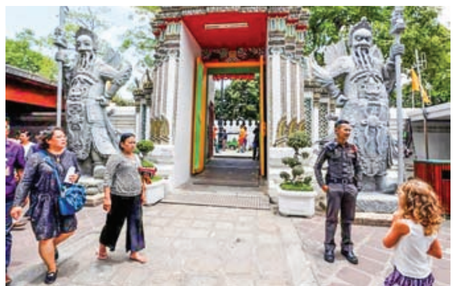
A policeman stand guards among tourists at Wat Pho temple (Wat Phra Chetuphon Vimolmangklararm Rajwaramahaviharn) in Bangkok, Thailand, on 16 August, 2016.

It was the second arrest warrant issued in connection with the wave of attacks. Police on Sunday said they had arrested one suspect for arson. Defence Minister Prawit Wongsuwan on Monday said the attacks might have