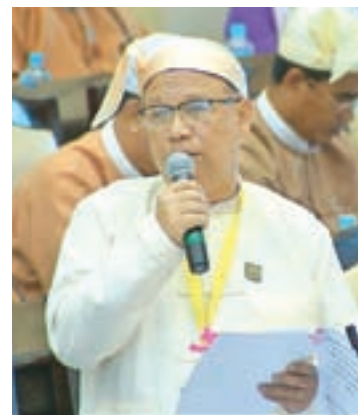
Union Minister for Transport and Communications U Thant Sin Maung. PHOTO: MNA

A total of 144 DVB-T2 relay stations have broadcast digital TV programmes, including National Race channels as well as 78 FM stations have started operations following the third stage completion, said the Union Minister.