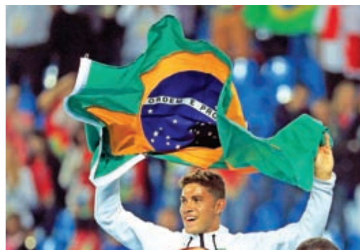
Thiago Braz da Silva (BRA) of Brazil celebrates after winning the gold medal during 2016 Rio Olympics, Athletics Final, Men's Pole Vault Final at Olympic Stadium in Rio de Janeiro, Brazil on 15 August 2016.

"The crowd were cheering me too much. I had to fix my mind on my technique, forget the people."