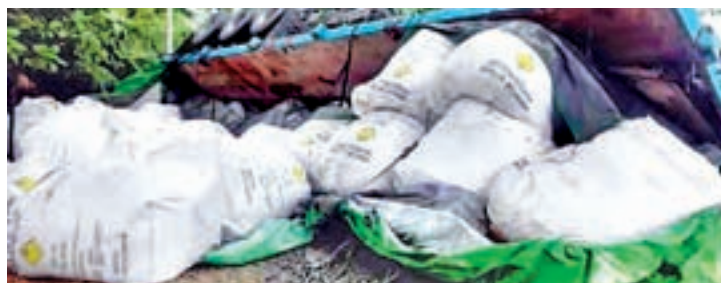
Overturned car being seen.

Police have filed charges against the driver.