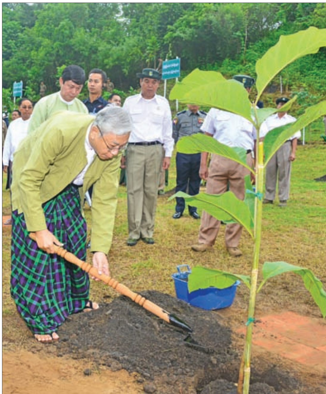
President U Htin Kyaw plants a teak sapling at tree-growing ceremony in Nay Pyi Taw.

So far around 43.5million saplings have been planted during the 2016 National Environmental Greening Campaign that aims to plant 58 million saplings across the country.— Myanmar News Agency