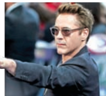
Hollywood star Robert Downey Jr.

LOS ANGELES — Hollywood star Robert Downey Jr is reportedly teaming up with "True Detective" creator Nic Pizzolatto for a drama on HBO.