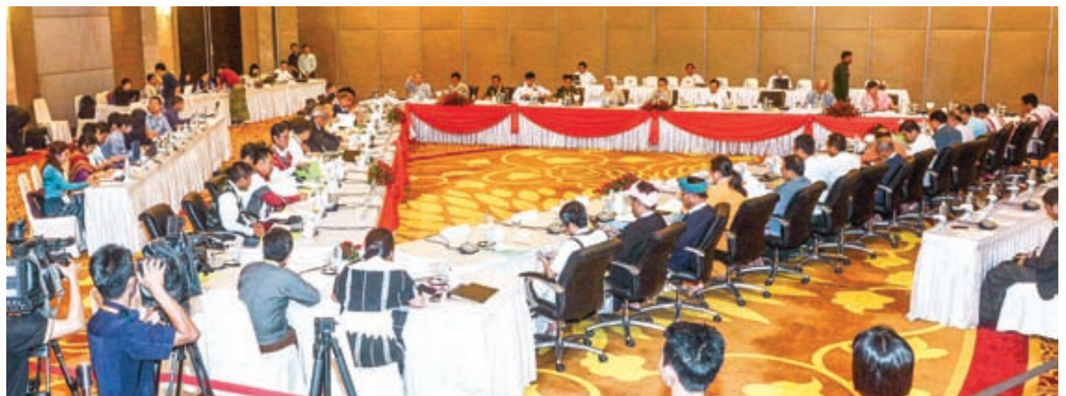
The meeting of Union Peace Dialogue Joint Committee continues for the second day in Nay Pyi Taw.

“Political dialogue framework has not been discussed yet and a framework meeting is set to be held after the conference,” he said, adding that the UPDJC meeting focused on inclusion of all in the planned UPC.