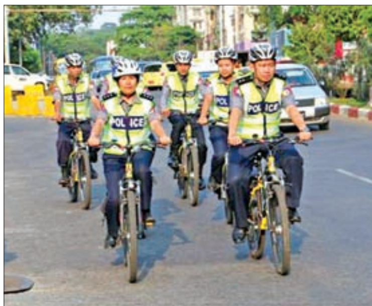
Police patrols to prevent crime.

The minister further claimed that the Myanmar Police Force