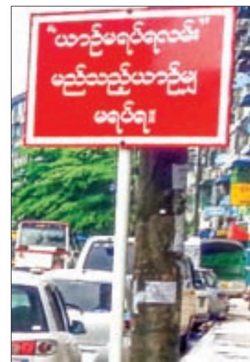
A scene on the Banyardala road.

To cite yet another example of such absurdity, I would like to recall what I had written in an article about two years ago in the GNLM. The title of which was "Reckless Spitting". Though the title was aimed at spitting, I had included indiscriminate peeing and defecating by the roadsides along the road circling the Kandawgyi Lake. I had mentioned about the warning signs posted along that road that read: "NO LITTERING, URINATING OR DEFECATING. WILL BE SUBJECT TO A FINE OF TEN THOUSAND KYATS IF FOUND". On first seeing those signs I was pleased that the authorities had taken some positive actions at last. However, when I