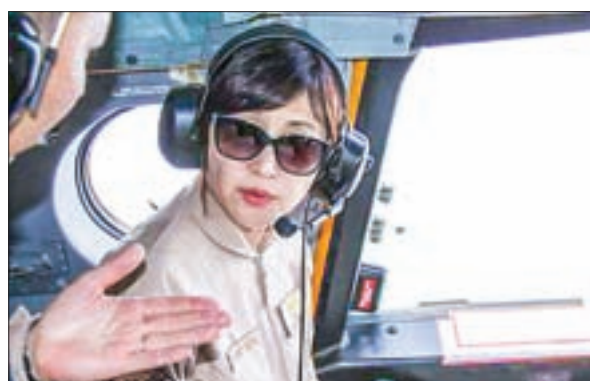
Japanese Defence Minister Tomomi Inada inspects the Maritime Self-Defence Force's antipiracy operations in the Gulf of Aden off Somalia on 15 August.

Japan has sent Maritime Self-Defence Force destroyers and P-3C patrol aircraft to participate in multinational antipiracy operations in the waters off Somalia. It has set up an air base in Djibouti for the mission. Inada told reporters later that SDF members to the far-flung area are playing "a very important role" and that she wants to consider ways to reinforce their activities. Inada chose the tiny African country as