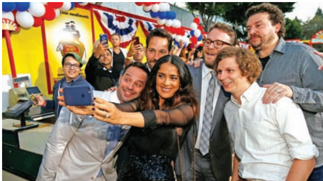
Cast member Salma Hayek takes a selfie with co-stars (L-R) Nick Kroll, Paul Rudd, Seth Rogen, Michael Cera and Danny McBride at the premiere for the movie "Sausage Party" in Los Angeles, California, US, on 9 August 2016.

It's good news for Sony, which has had a bruising period