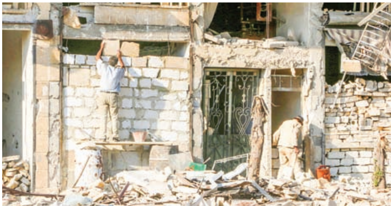
A man rebuilds a wall of a damaged building in the rebel held al-Katerji district in Aleppo, Syria on 13 August.

Senior Russian and US military officials have held Geneva negotiations on Aleppo and on restoring an overall ceasefire, UN Special Envoy for Syria Staffan de Mistura said