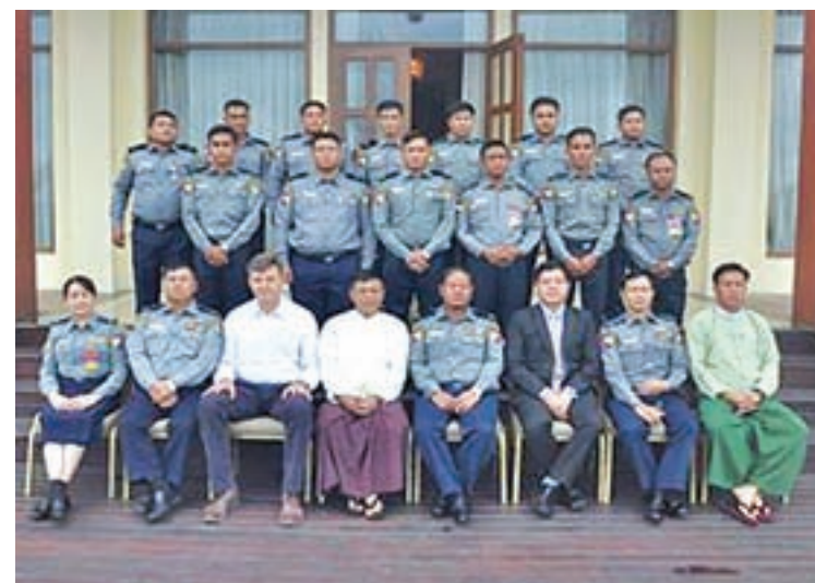
Police officers of MPF and officials of UNODC posing for documentary photo.

The training course will run for twelve days. — Myanmar Police Force