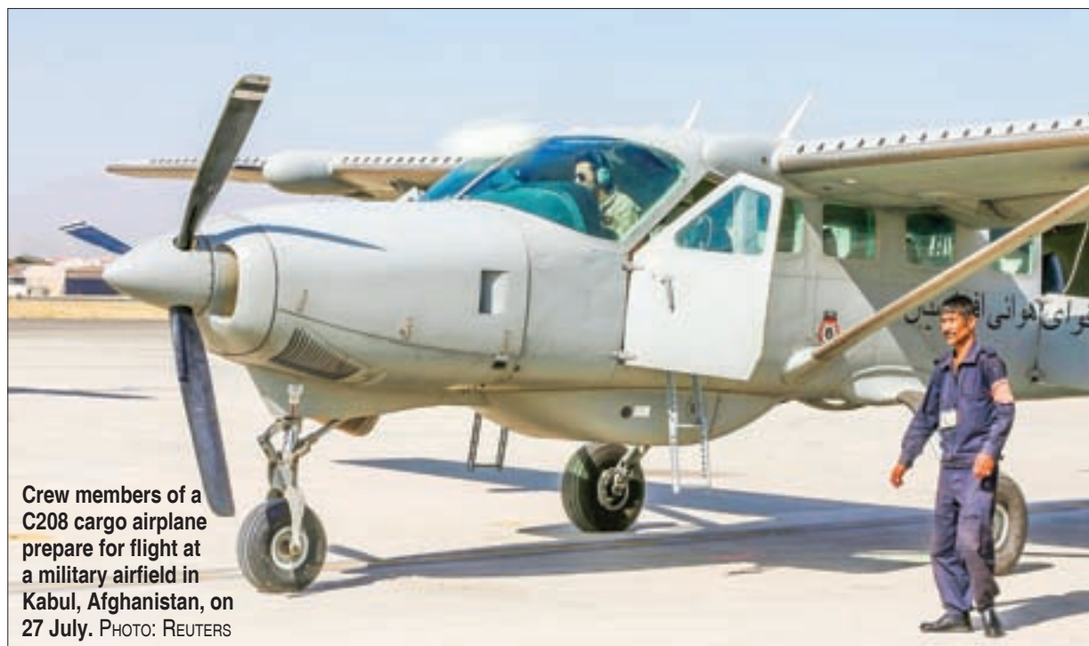
Crew members of a C208 cargo airplane prepare for flight at a military airfield in Kabul, Afghanistan, on 27 July.

Advisers for the US-led NATO coalition, which