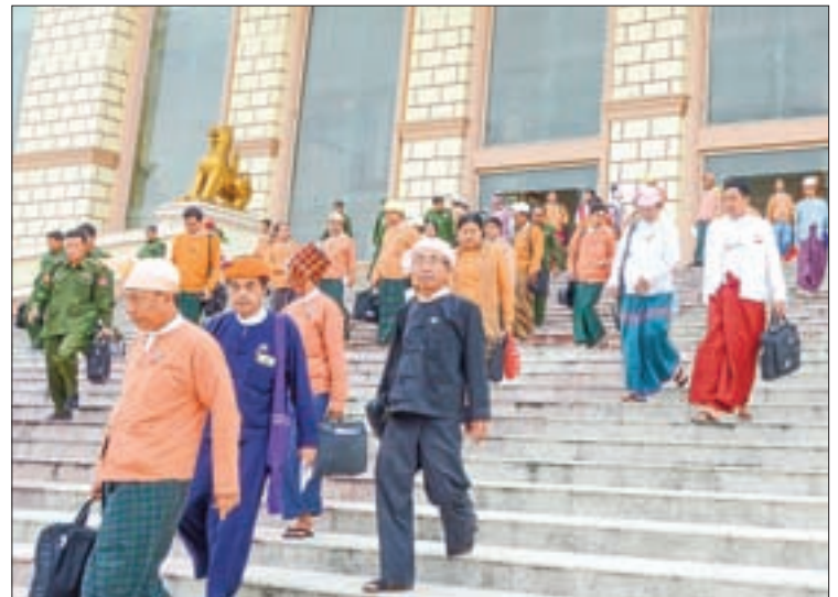
MPs leave Pyidaungsu Hluttaw building after the parliamentary meeting on 16 July.

During the session representatives were invited to debate the establishing of an ASEAN- India Centre and the country's signing of an anti-nuclear test treaty. — Myanmar News Agency