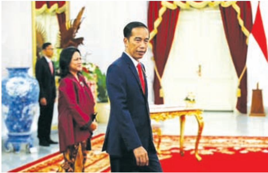
Indonesia's President Joko Widodo (R) and first lady Iriana (L) walk to greet the visiting Sri Lankan Prime Minister Ranil Wickremesinghe at the presidential palace in Jakarta, Indonesia on 3 August, 2016.