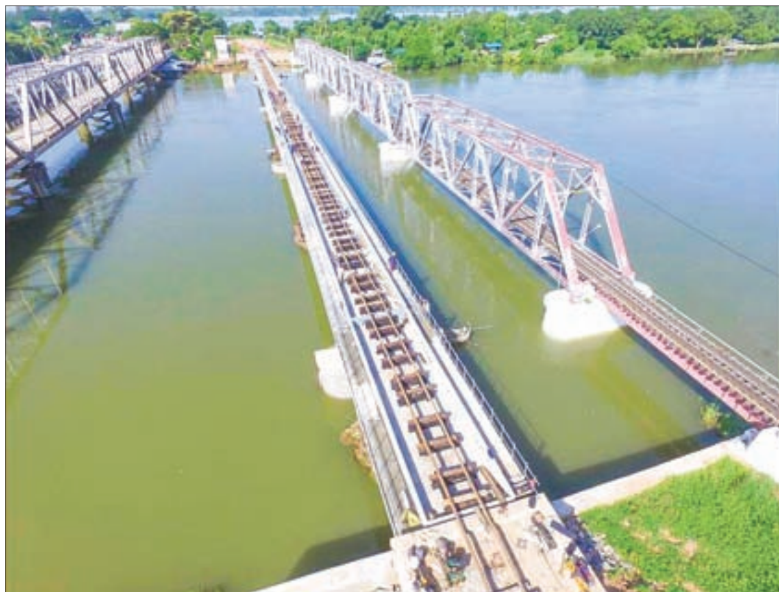
Myitnge dural railroad.

Regarding anti-corruption measures, U Tin Myint, permanent secretary of the Ministry of Home Affairs, said that the Anti-corruption Commission, chaired by U Mya Win, formed under the previous government, has performed its task of combat-