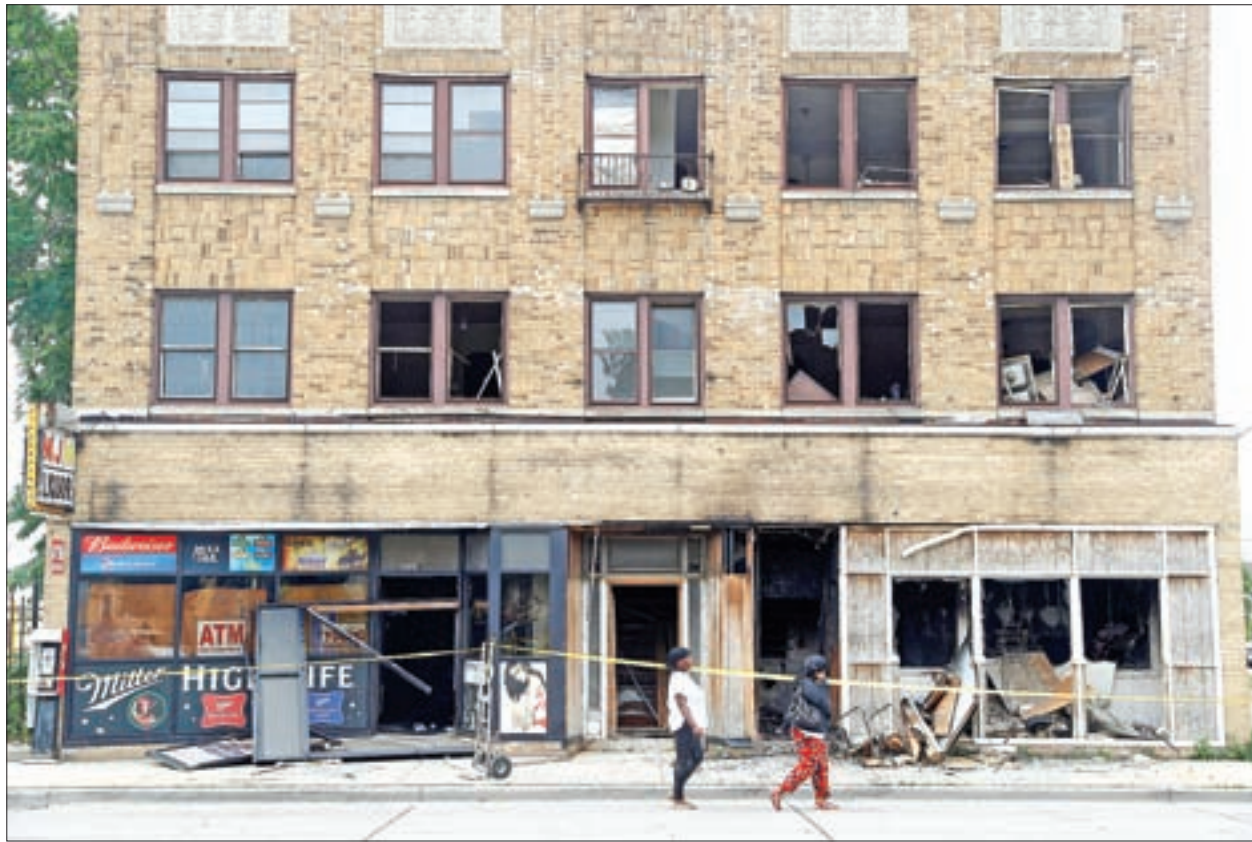
A burned down liquor store is seen after disturbances following the police shooting of a man in Milwaukee, Wisconsin, US on 15 August 2016.

Late on Monday afternoon, dozens of police, some in riot gear, cordoned off Sherman Park, the centre of the neighbourhood where the weekend shooting and subsequent disturbances took place. Nearby, about 100 people held a picnic in a grassy area.