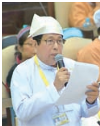
Union Minister for Information Dr Pe Myint.

DIGITAL broadcasting will cover the whole nation by 2020, the Union Minister for Information Dr Pe Myint told Amyotha Hluttaw yesterday, adding that the transition from analogue to digital broadcasting is in progress with completion of third stage in 2015-2016 FY.