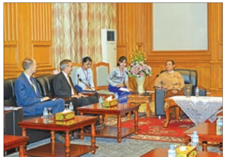
Speaker U Win Myint receives US Ambassador to Myanmar Mr. Scot Marciel in Nay Pyi Taw.