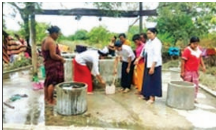
Officials of the regional health department supervising the team in giving healthcare services to local people.

"(Our team) gave urgent treatment to five children who were suffering from flu in Pathe-