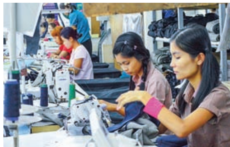
Employees work at a garment factory in Hlaingthayar.

The export volume from garment industry has currently been on the rise. The export value from this sector was US$1.4 billion in 2014 whereas 1.65 billion was earned from the garment industry in 2015.—Zar Zar