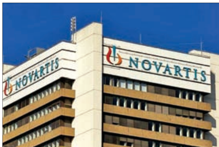
The logo of Swiss pharmaceutical company Novartis is seen on its headquarters building in Basel, Switzerland in 2015.

At the same time, many drugmakers are developing improved asthma inhalers, including "smart" devices with sensors that monitor use.—Reuters