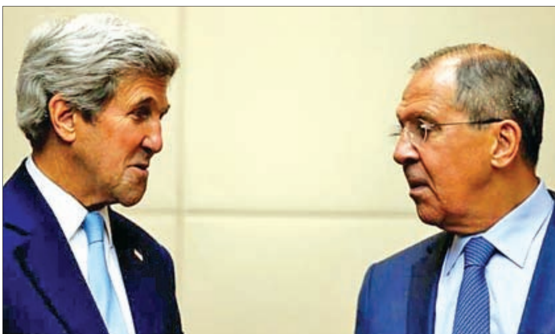
US Secretary of State John Kerry meets Russia's foreign minister Sergey Lavrov during a bilateral meeting at the sidelines of the ASEAN foreign ministers meeting in Vientiane, Laos, on 26 July 2016.