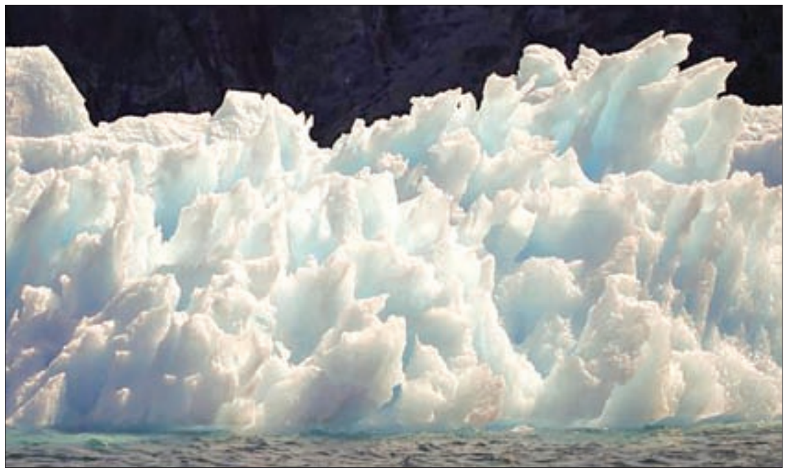
A large iceberg melts into jagged edges as it floats in Eriks Fjord near the town of Narsarsuaq in southern Greenland in 2009.

OSLO — Global warming could release radioactive waste stored in an abandoned Cold War-era US military camp deep under Greenland's ice caps if a thaw continues to spread in coming decades, scientists said on Friday.