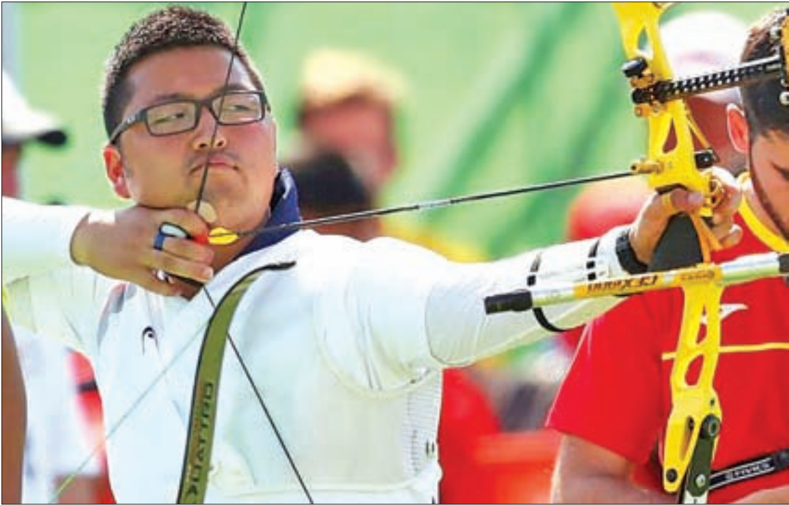
Kim Woo-Jin (KOR) of South Korea competes Archery during Men's Individual Ranking Round at Sambodromo in Rio de Janeiro, Brazil, on 5 August 2016.

RIO DE JANEIRO — South Korea’s stranglehold on Olympic archery showed little sign of easing on Friday as men’s number one Kim Woo-jin fired a 72-arrow world record and the nation’s women dominated the ranking rounds at the Rio de Janeiro Games. The tournament’s first shoot-off on a glorious day at the Sambodromo began with a bang as world champion Kim racked up 700 points out of a maximum 720, beating the 699 his compatriot Im Dong-hyun compiled in the preliminary round in London four years ago. The day ended with all three of South Korea’s women at the top of the standings, led by