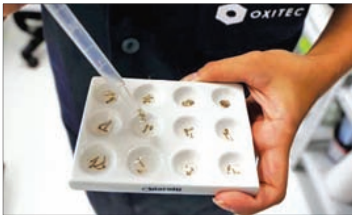
A technician from Oxitec inspects larvae of Aedes aegypti mosquitoes in Campinas, Brazil, in February 2016.

The GM mosquito strain is made by Oxitec, a spin-off company from Oxford University that is now a UK subsidiary of US based Intrexon.—Reuters