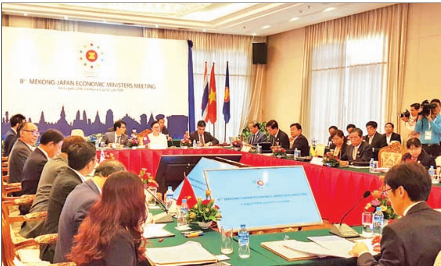
Eighth Mekong-Japan Economic ministers meeting in progress.

Laos concludes 48th AEM meeting and joint meetings