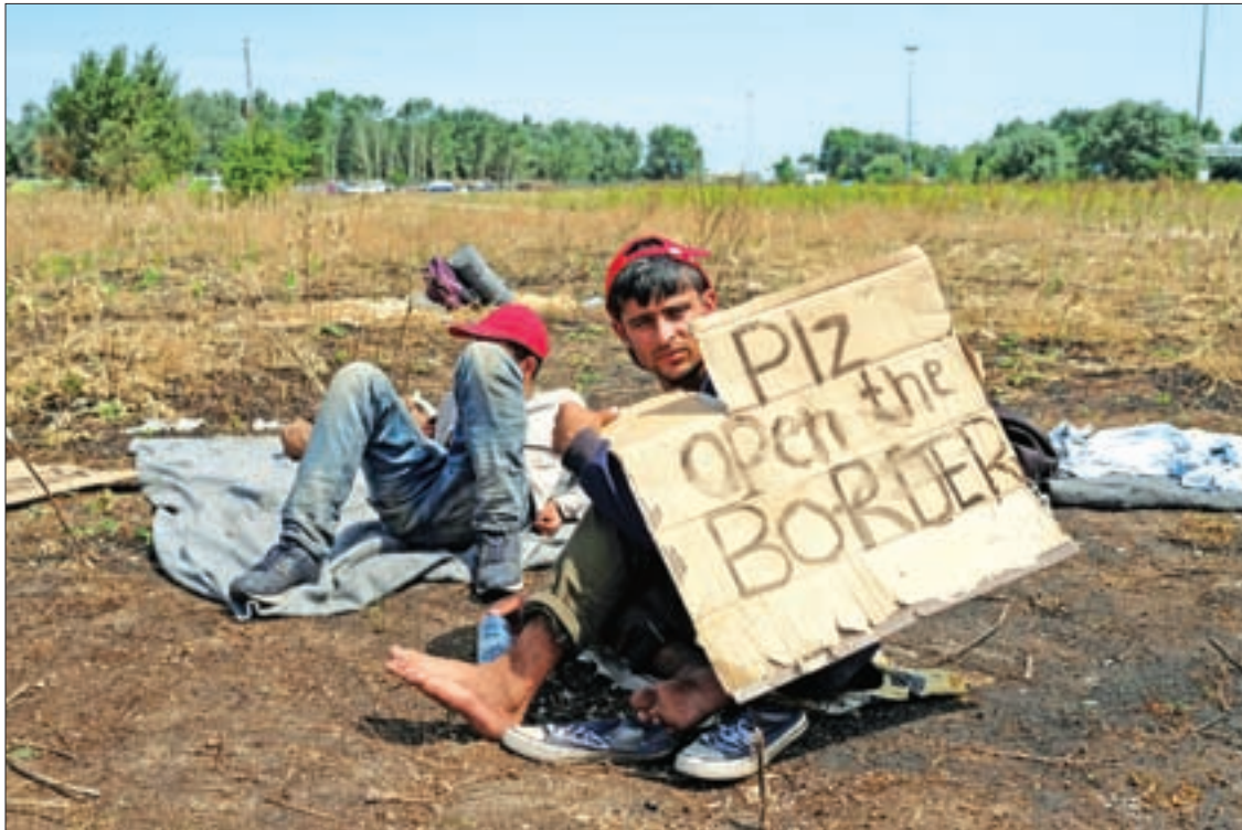
Migrants, mainly from Afghanistan and Pakistan, sit on a field near the Serbian-Hungarian border fence during a hunger strike near the village of Horgos, Serbia, on 25 July 2016.