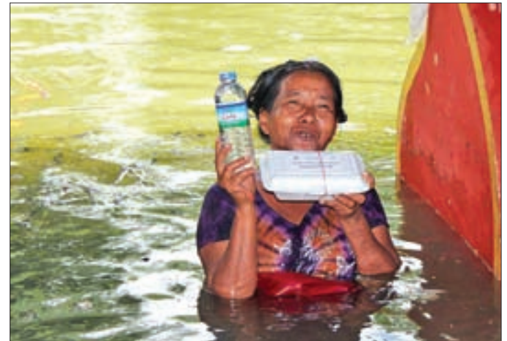
An old woman holding a meal box and a purified drinking water bottle donated by KBZ's Brighter Future Myanmar Foundation.

The meal boxes reached more than 3,000 peoples in Hsinmyay Village in Sagaing, about 700 at shelters in Myan Aung Township, more than 4,000 people at seven camps in Kyangin, Ayeyawady Region, and about 1,500 in Pakokku. —Thura Lwin-Eco