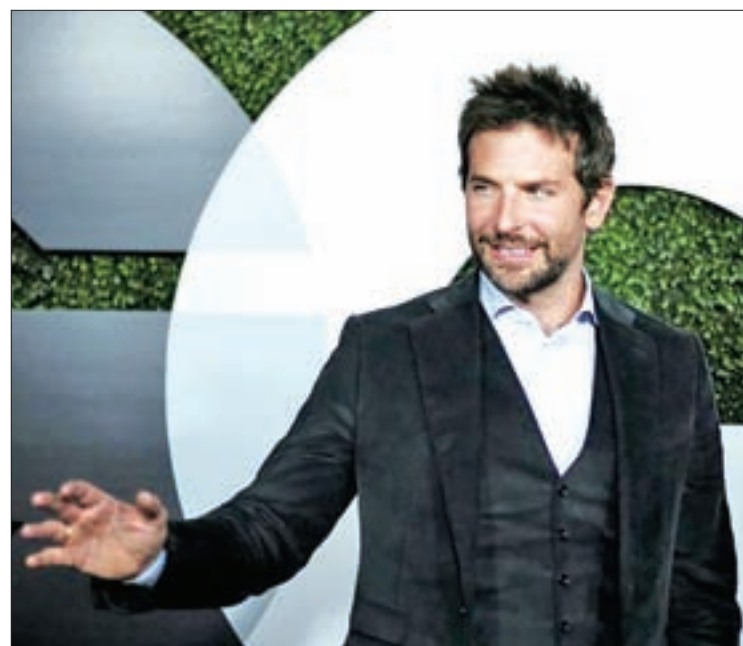
Actor Bradley Cooper poses during the GQ Men of the Year party in West Hollywood, California December 3, 2015.

Cooper and Phillips formed their production company, Joint Effort, in 2014. Their project "War Dogs," a comedy about arms dealers in Afghanistan in which Cooper also stars, will be released 19 August.—Reuters