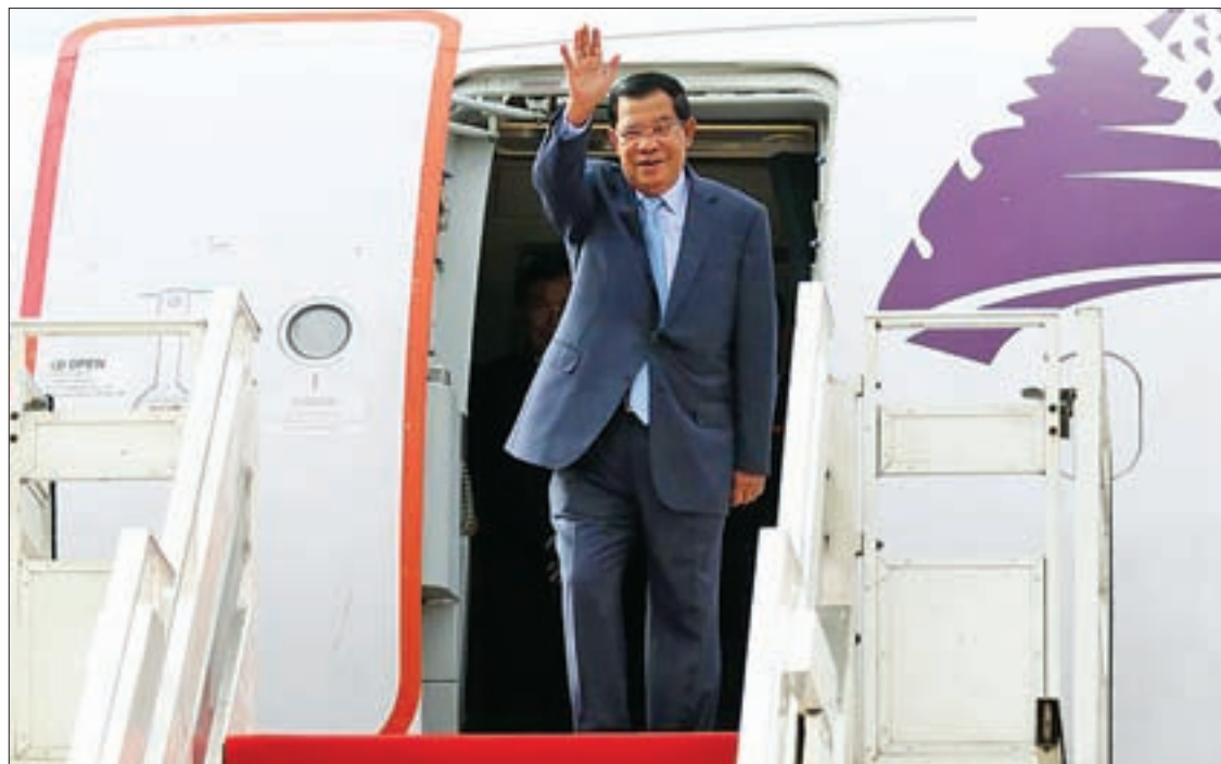
Cambodian Prime Minister Samdech Techo Hun Sen gestures from a plane in Phnom Penh, Cambodia, on 6 August 2016. Cambodian Prime Minister Samdech Techo Hun Sen left here on Saturday morning for Vientiane, the capital of Laos, where he will receive the "ASEAN Lifetime Achievement Award".

"I am the fourth person that receives this award, but if say about the head of government, I am the third person that gets it," he said in a public speech on Tuesday. "I would like to share this with all the Cambodian people who support my policy on international issues." —Xinhua