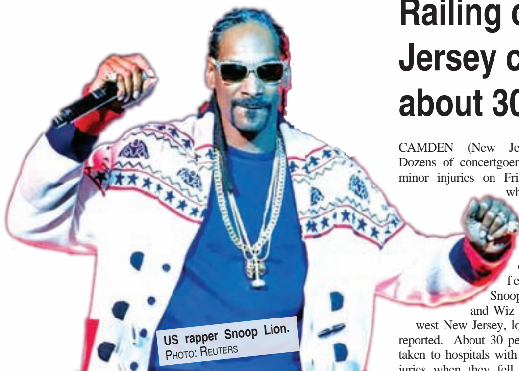
US rapper Snoop Lion.

The newspaper reported that the railing separated the pavilion's lawn from inside seating and collapsed when concertgoers leaned on it. An eyewitness told the paper that about 50 people fell about 10 feet (3 meters) onto concrete. Authorities said that about 30 people, who suffered minor injuries, were taken to hospitals, the Philadelphia Inquirer reported.—Reuters