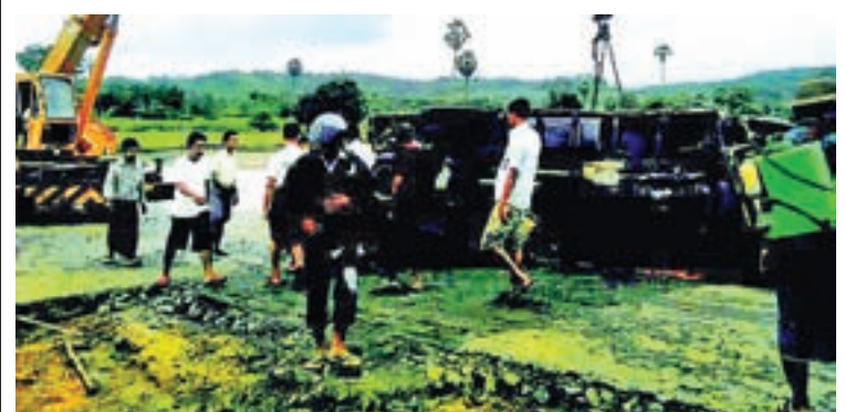
The truck being seen overturned in Minbu.

The government needs to renovate the road which has been steadily eroded by creek water over time, a local villager said. — Tin Tun Oo (Minbu)