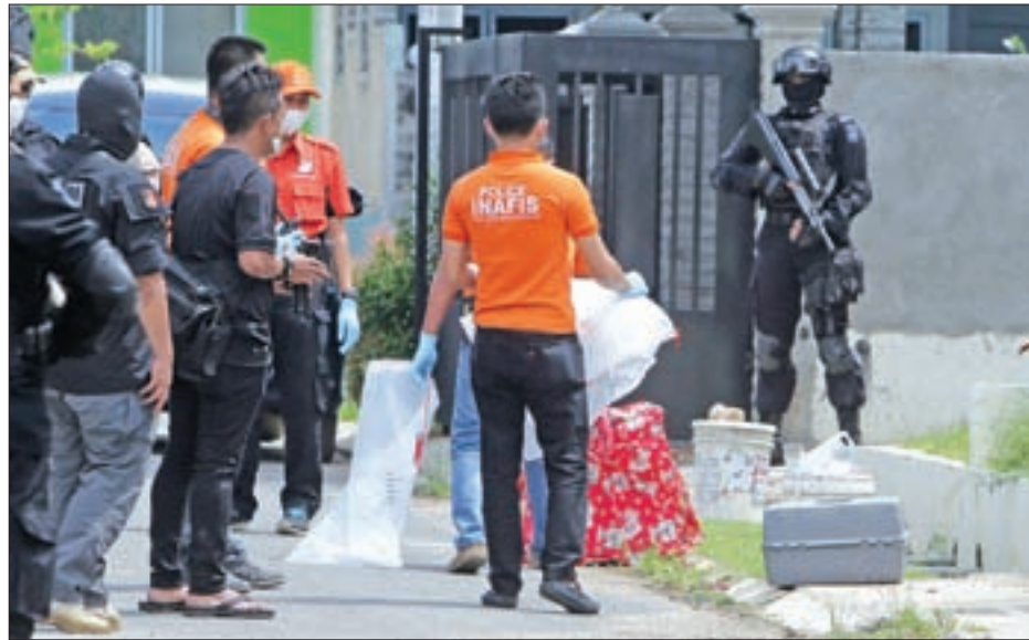
Indonesian anti-terror police and an identification team are seen outside a building during a raid in Batam, Riau Islands, Indonesia, on 5 August 2016.

"Terrorists ... will seek to come in through our checkpoints; they will also try to launch attacks from just outside. And this