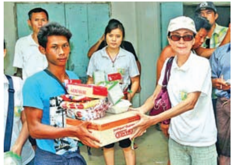
A member of Myat Cetana Mon social assistance association presents food to a flood victim.

The social assistance association provided a torch light, a lamp, a power bank, a 3 in 1 lamp, a pack of readymade instant noodle, soft drinks and other snacks for each family. “Our Myat Cetana Mon social assistance association is not operating with chairman and secretary. But, the association is running in a family type and we donated money from the fund we contribute monthly. We donate the money to orphans, persons who have difficulty in having access to education and health and those who are badly