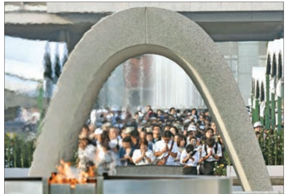
People pray in front of the cenotaph for the victims of the 1945 atomic bombing at Peace Memorial Park in Hiroshima, western Japan, in this photo taken by Kyodo on 6 August 2016.

confirmed in Hiroshima, such visits will surely etch the reality of the atomic bombings in each heart." At the ceremony, Prime Minister Shinzo Abe pledged his determination to work toward a world free of nuclear arms.—Reuters