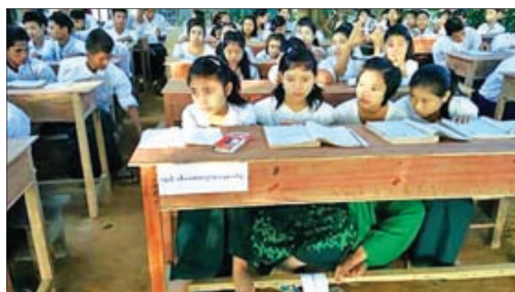
Students seen happy in the class. PHOTO: MYITMAKHA NEWS AGENCY

The Nanthataung Charity School was established to provide ethnic children from remote areas with access to an education in the aftermath of community violence which struck the region in 2012. —Myitmakha News Agency