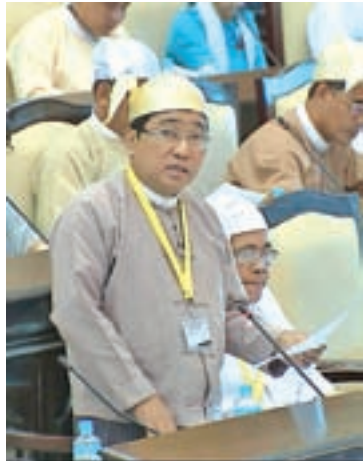
Union Minister Dr. Win Myat Aye.

THE president will declare a state of emergency in accordance with the law when needed, said Union Minister Dr. Win Myat Aye for the Ministry of Social Welfare, Relief and Resettlement.