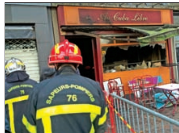
Firemen walk outside the bar in Rouen, France, on 6 August 2016 where a fire killed 13 people and injured another six, according to a statement by the interior ministry.

"We saw the smoke and we saw the flames, the chairs flew up, the window exploded." More than 50 firefighters tackled the blaze, the interior ministry said.—Reuters