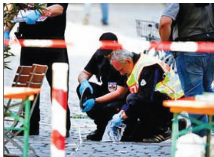
Police secure the area after an explosion in Ansbach, Germany, on 25 July 2016.

27-year-old Syrian who blew himself up in Ansbach, southern Germany on 24 July had pledged allegiance to Islamic State on a video found on his mobile phone, investigators said. Islamic State claimed responsibility for the bombing, which wounded 15 people. Bavaria’s Interior Minister said at the end of July that the Ansbach bomber had been “significantly influenced” in a chat conversation on his mobile phone that ended just before the attack.—Reuters