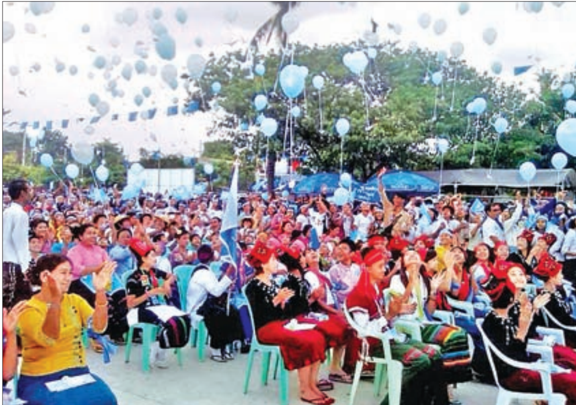
Hailing ceremony of Peace Conference in progress.