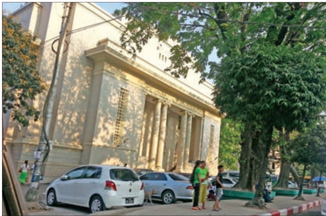
The grand building of Yangon Stock Exchange being seen.

MYANMAR Citizens Bank (MCB), the third company to list on the nascent Yangon Stock Exchange, will go on sale during the last week of this month of August, the bank has made known.