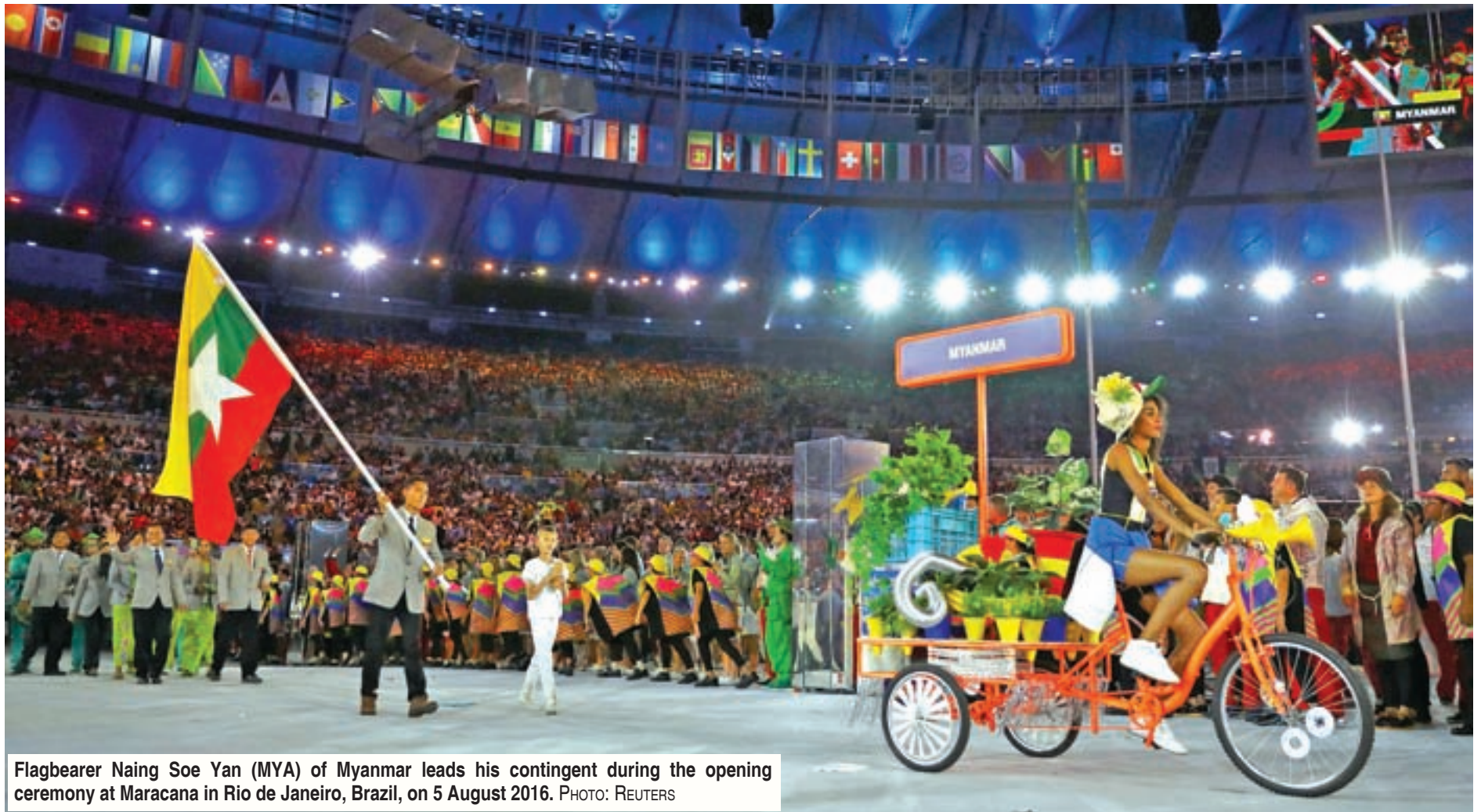
Flagbearer Naing Soe Yan (MYA) of Myanmar leads his contingent during the opening ceremony at Maracana in Rio de Janeiro, Brazil, on 5 August 2016.