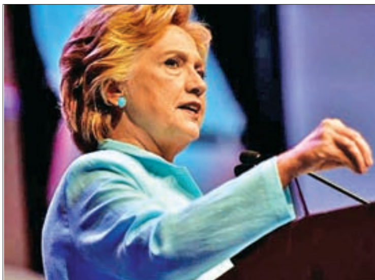
US Democratic presidential candidate Hillary Clinton addresses a joint gathering of the National Association of Black Journalists and the National Association of Hispanic Journalists in Washington, on 5 August 2016.

An average of polls aggregated by Real Clear Politics showed Clinton ahead of Trump by 6.8 percentage points on Friday, up from 3.9 on 1 August.—Reuters