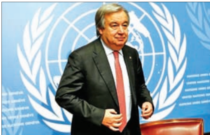
Antonio Guterres, United Nations High Commissioner for Refugees (UNHCR), arrives for a news conference at the United Nations in Geneva, Switzerland in 2015.

The Security Council will hold secret ballots until a consensus is reached on a candidate to replace UN chief Ban Ki-moon of South Korea who steps down at the end of 2016 after serving