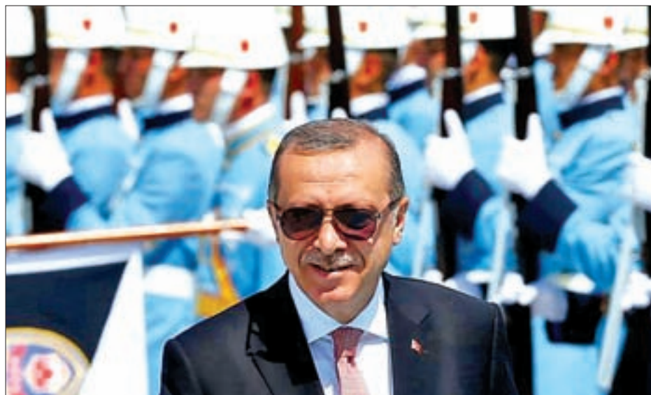
Turkish President Tayyip Erdogan reviews a guard of honour during a welcoming ceremony at the Presidential Palace in Ankara, Turkey, on 5 August 2016.

The Turkish government has blamed the coup on followers of a cleric in self-imposed exile in the United States, and purged tens of thousands of his suspected followers from positions as teachers, police,