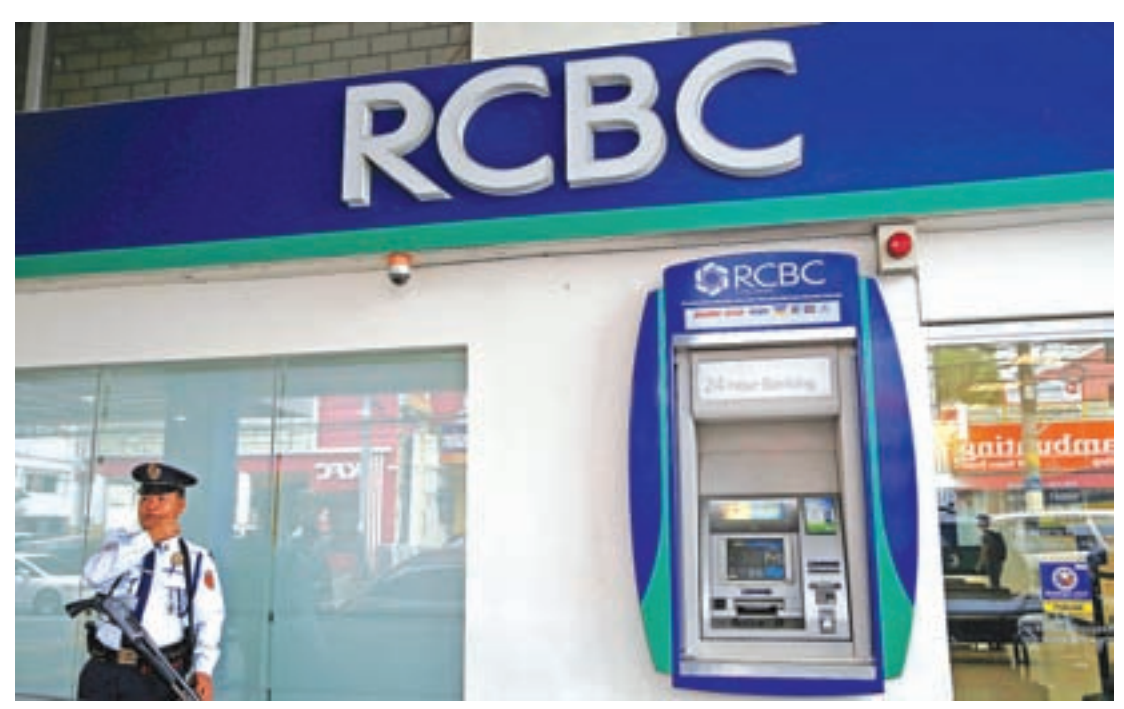
A security guard stands guard outside a branch of Rizal Commercial Banking Corporation (RCBC) in Paranaque city, Metro Manila, Philippines, on 2 August 2016.

The last Philippines Senate hearing into the heist ended in May as a new government came