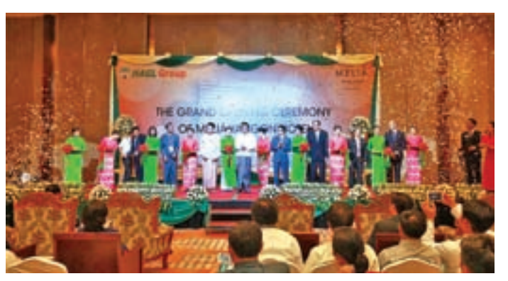
The grand opening ceremony of Hotel Meliá.

The hotel, owned by Viet Gems Museum, and 20 minutes Nam's Hoang Anh Gia Lai (HAGL) Group, has opened 370 hotels in 43 countries.