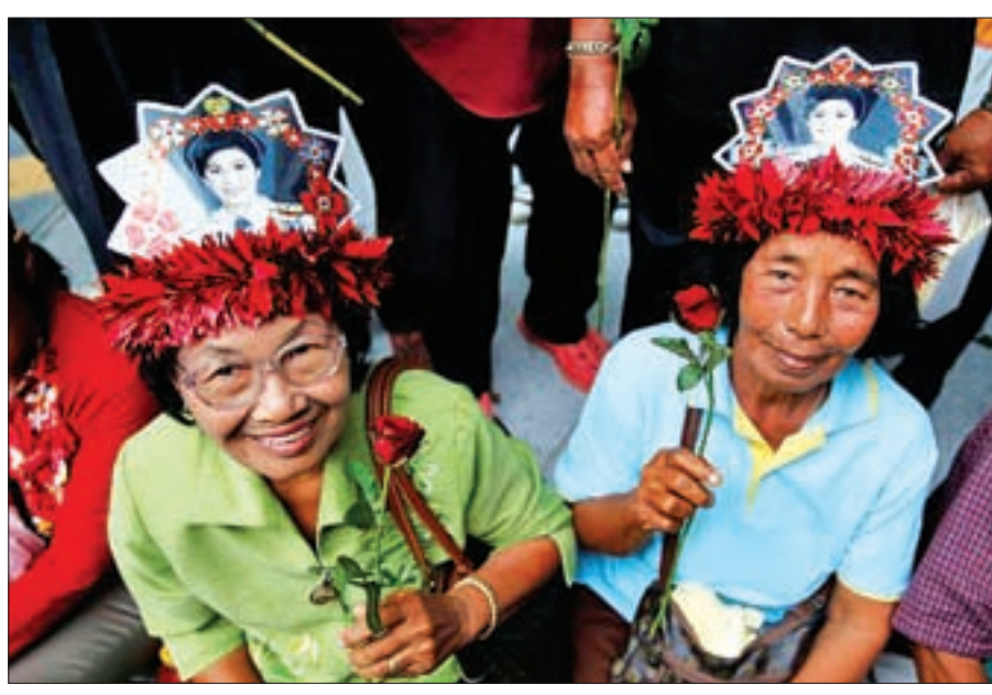
Supporters of ousted former Thai Prime Minister Yingluck Shinawatra wait for her outside the Supreme Court in Bangkok, Thailand, on 5 August 2016.

"It did not distort the market," she said. "We saw that the benefits of the scheme outweighed the monetary losses." Yingluck has been charged with criminal negligence over her management of the rice programme, which was one of the populist policies engineered by her brother, former prime minister Thaksin Shinawatra. Thaksin was also toppled in a 2006 coup.