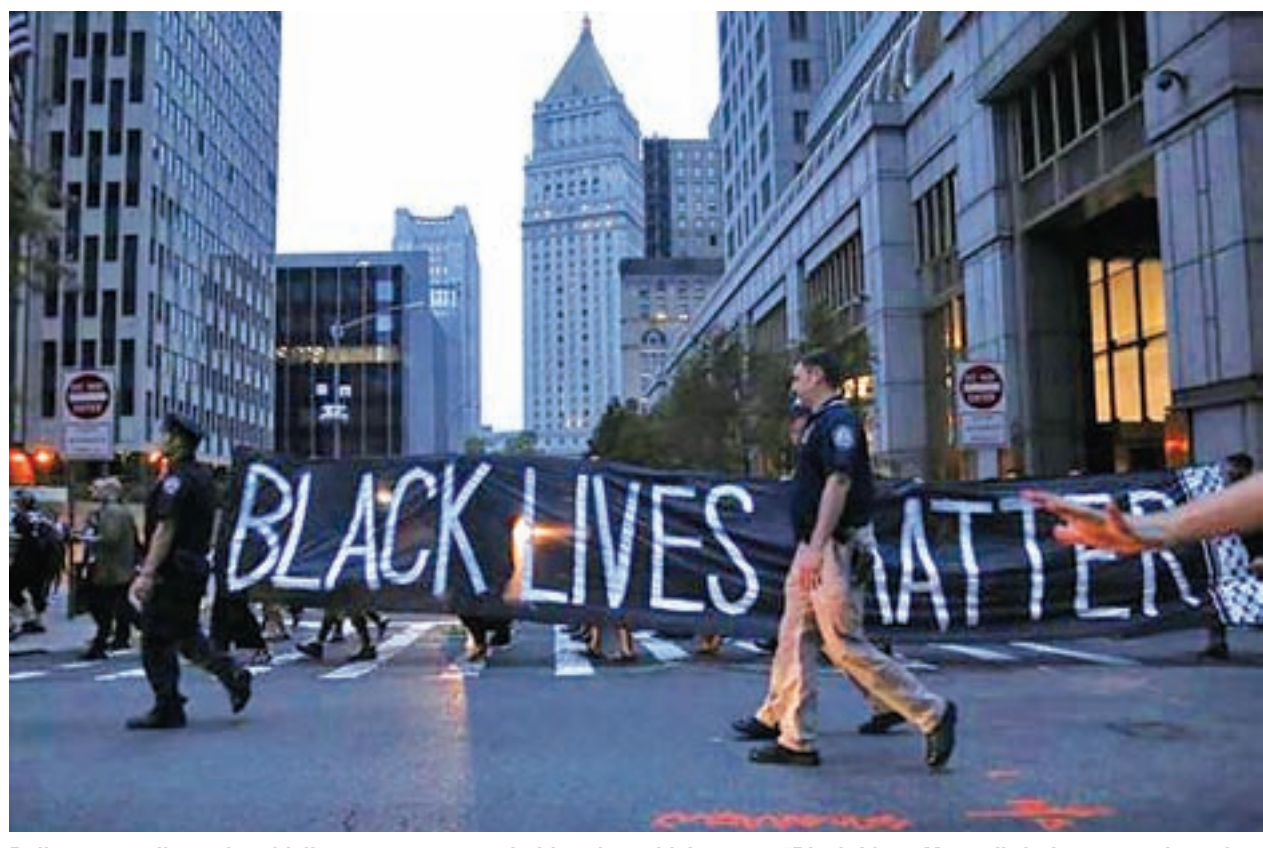
Policemen walk on the sidelines as protesters hold a sign which states "Black Lives Matter," during a march against police brutality in Manhattan, New York, US, on 9 July 2016.

The 23-page complaint said charges of simple obstruction of a highway against nearly 200 protesters who were arrested were ultimately dropped by the local