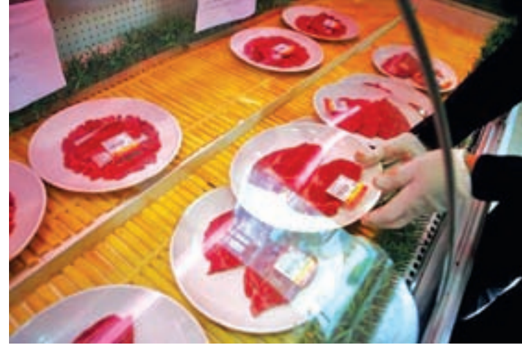
A man displays cuts of beef at a BBQ restaurant in Hongseong, South Korea, in 2015.

Boxed sets of beef, especially the prized domestic hanwoo variety, can cost hundreds of dollars and are a staple of gift-giving during