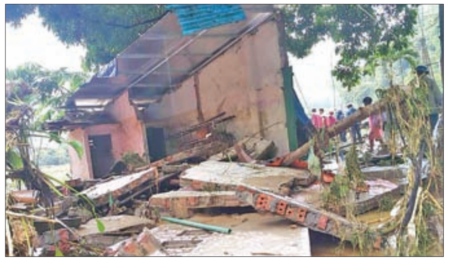
Photo taken on 5 August 2016 shows the collapsed houses in Lao Cai province, northern Viet Nam. Floods triggered by heavy rain due to Typhoon Nida have left three dead while seven others remain missing in northern Viet Nam, according to Central Steering Committee on Natural Disaster Prevention and Control said on Friday.

Typhoon Nida made landfall at the Dapeng Peninsula in the city of Shenzhen, southern China's Guangdong province on Tuesday. Tornado and heavy rain triggered by Typhoon Nida killed two people in Viet Nam's Lao Cai earlier on Tuesday.