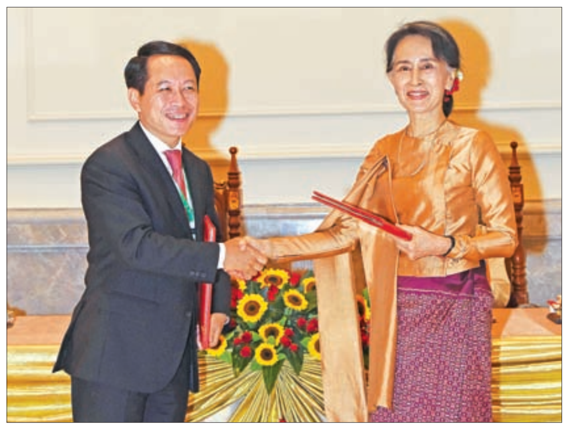
Union Foreign Affairs Minister Daw Aung San Suu Kyi shakes hands with Laotian counterpart Mr Saleumxay Kommasith after exchanging notes of agreement for management of the friendship bridge.

The idea of constructing the 691.6 meter-long Myanmar-Laos Friendship Bridge at a cost of 26 million U.S. dollars was first raised during an earlier visit to Myanmar by Lao Prime Minister Thongsing Thammavong in July 2011. The project begn in February 2013.—GNLM