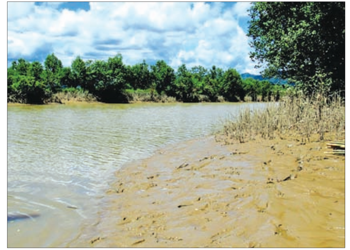
The sandbanks that slop up the rivers.

Residents of Rakhine State have reportedly made overtures to local government for assistance to tackle annual flooding which destroys lives, properties and farm-