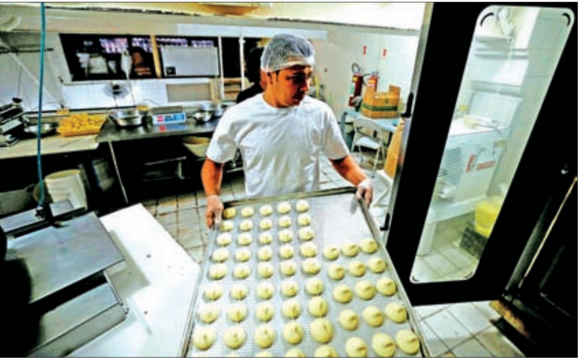
A worker prepares pao de queijo (cheese bread) at the Cultivar cafe and store in Santa Teresa neighbourhood in Rio de Janeiro, Brazil, on 28 July 2016.

grilled linguça, or sausages, brought around on demand. Its the perfect way to open an evening of drinking along the bustling streets and restaurants of one of Rio's most popular nighttime neighborhoods, Baixo Gávea.