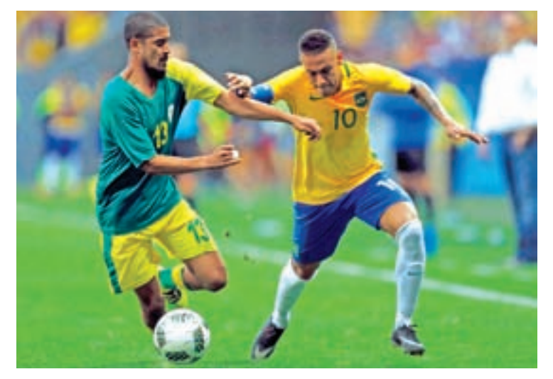
Abbubaker Mobara of South Africa and Neymar of Brazil fight for the ball during their 2016 Rio Olympics Men's First Round at Mane Garrincha Stadium, Brasilia, Brazil, on 4 August 2016.

That result was not the only surprise as their great rivals Argentina lost 2-0 to Portugal. It was the South Americans' first Olympics reverse in 13 games. Argentina were unbeaten in winning gold during their last two appearances in 2004 and 2008.