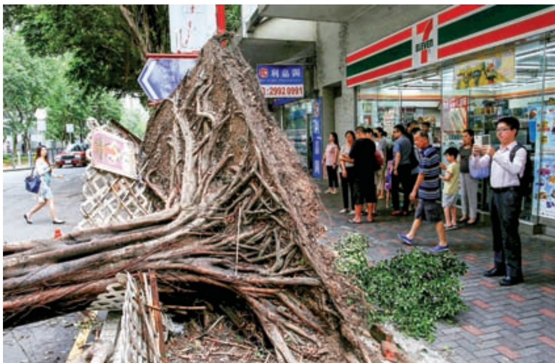
A man takes photo of an uprooted tree after Typhoon Nida hit Hong Kong, China on 2 August.

Streets had been largely deserted and shops shuttered since Monday evening when the typhoon signal 8 was hoisted, prompting many people to leave work early. Nida was moving inland and winds near its centre had showed signs of weakening, the Hong Kong Observatory said. Across the border, part of Guangdong Province closed offices, factories and schools as the typhoon swept across the southern part of the metropolis of Guangzhou.—Reuters