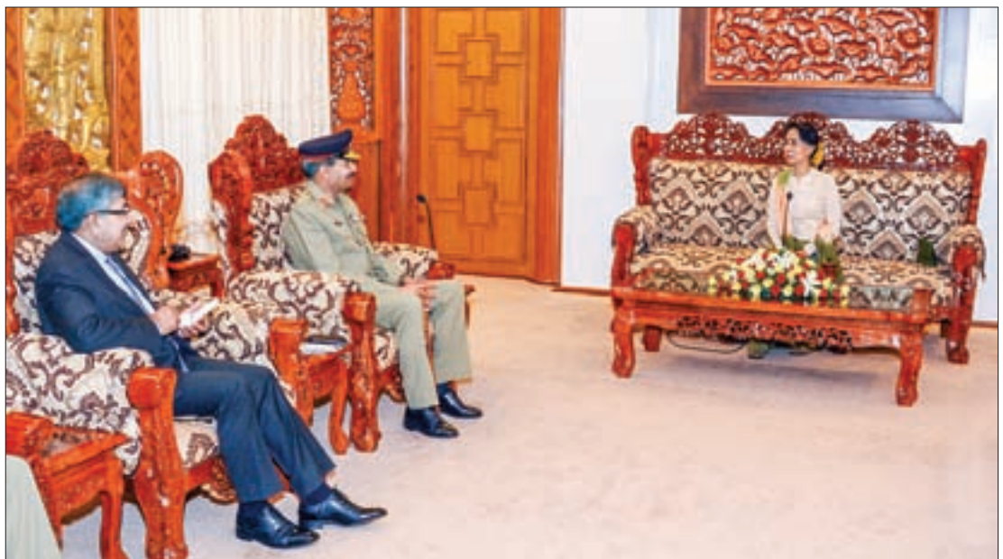
Union Minister for Foreign Affairs Daw Aung San Suu Kyi meets General Rashad Mahmood, Joint Chiefs of Staff Committee of the Islamic Republic of Pakistan.

During the meeting, they cordially exchanged views on strengthening bilateral relations and enhancing cooperation between Myanmar and Pakistan.— MNA