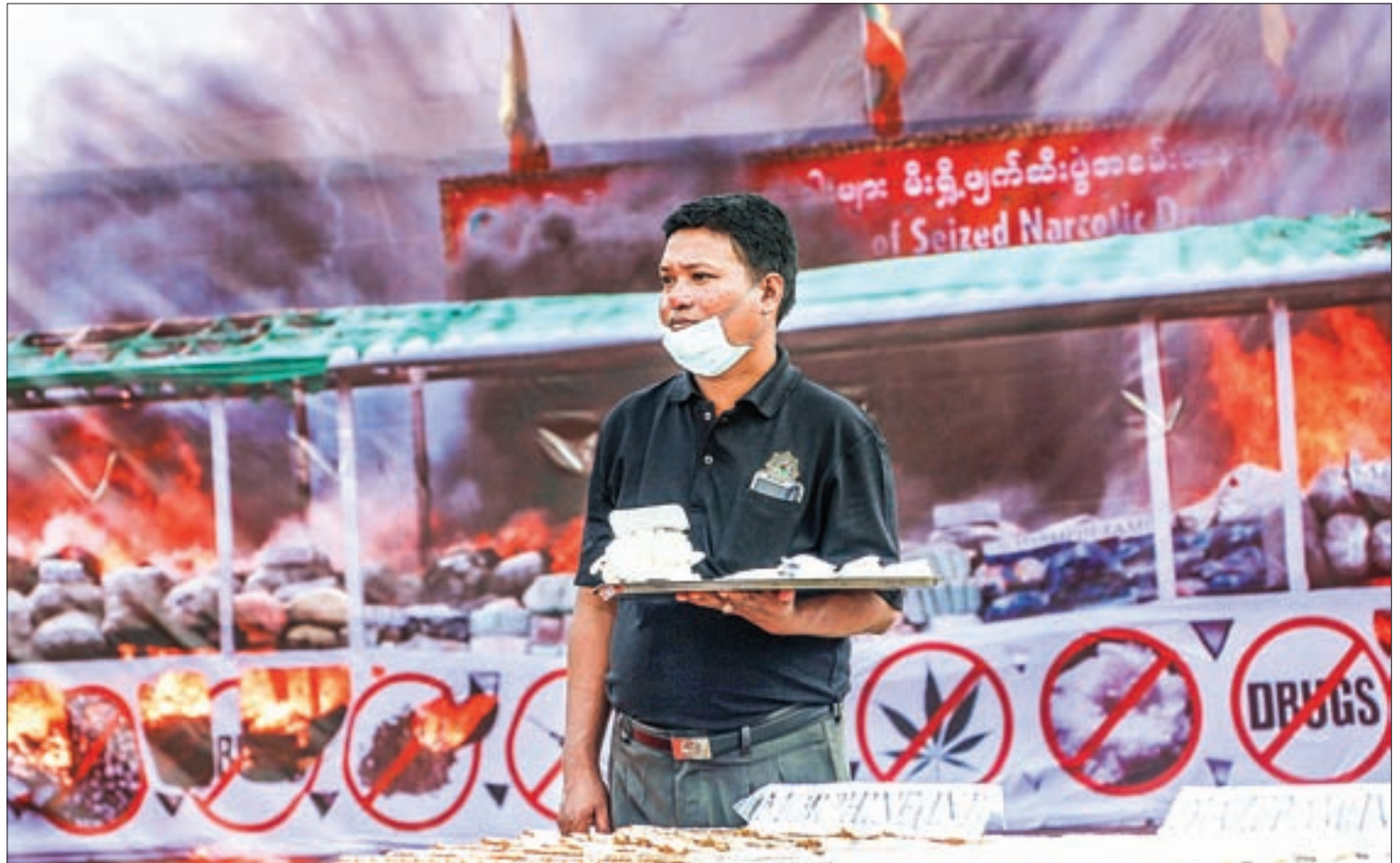
In this file photo, a police officer holds seized drugs before they are destroyed at an event to mark International Day against Drug Abuse and Illicit Trafficking, outside Yangon June 26, 2016.