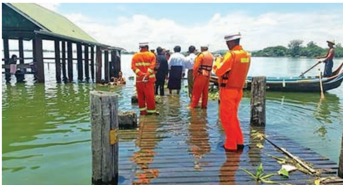
Strolling trip being turned into boat ride.

TRAVEL operators have changed trip plans for globetrotters as flooding that forced temporary closures of U Bein Bridge and Innwa cultural heritage site in Mandalay as of 1 August, said a responsible person of Tour