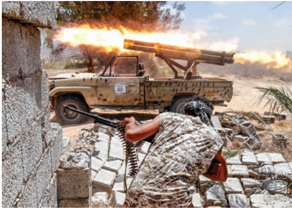
Libyan forces allied with the UN-backed government fire weapons during a battle with IS fighters in Sirte, Libya, on 21 July 2016.

— which were authorised by US President Barack Obama — hit an Islamic State tank and two vehicles that posed a threat to forces aligned with Libya's GNA, Cook said.