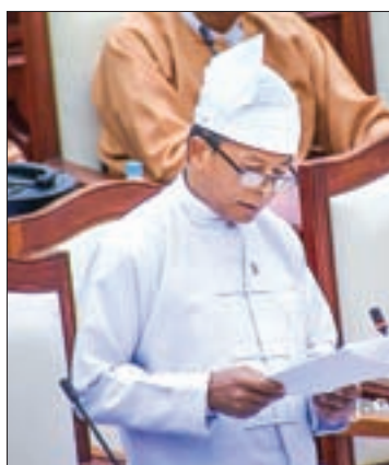
Dr Tun Win.

The deputy minister said that the Farmland Management Central Committee is set to deal with monthly reports of region/state farmland management committees. He added that the committees at various levels have to handle farmland disputes in