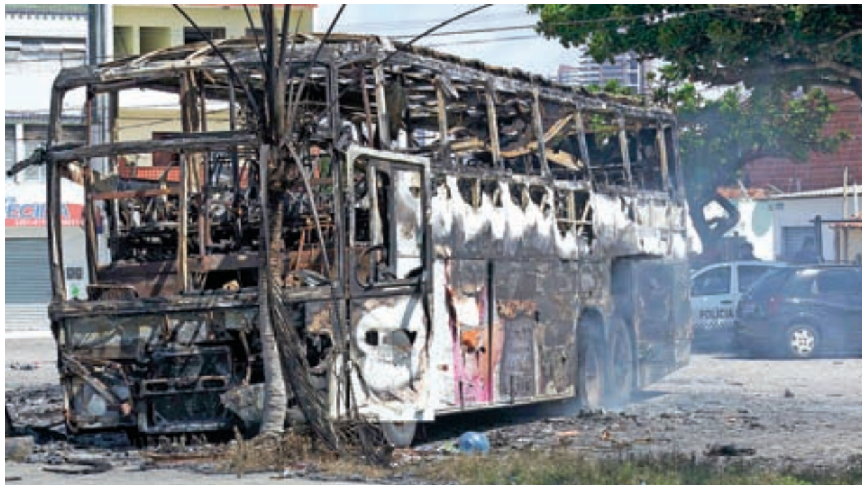
A police vehicle stands behind a smouldering bus after it was set on fire during violent overnight disturbances in Natal, Brazil, on 1 August 2016.