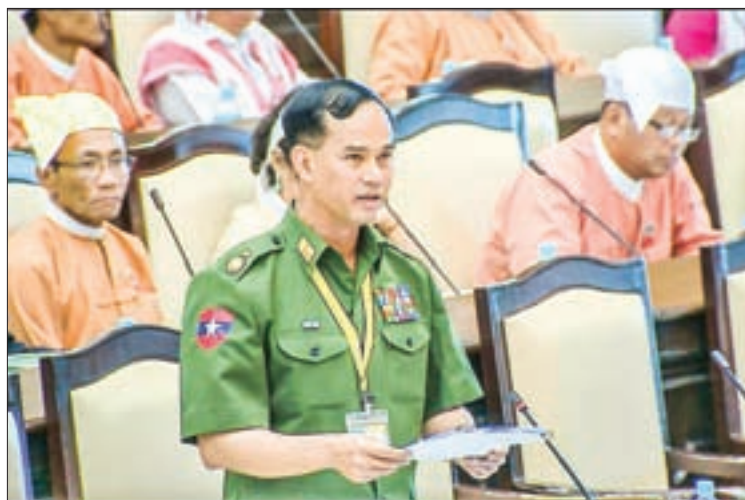
Deputy Minister for Home Affairs Maj-Gen Aung Soe.