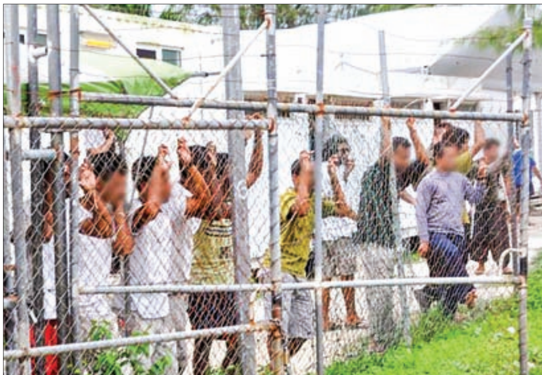
Asylum-seekers look through a fence at the Manus Island detention centre in Papua New Guinea in 2014.