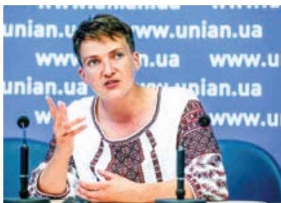
Ukrainian pilot and MP Nadiya Savchenko attends a news conference in Kiev, Ukraine, on 2 August.

She has been campaigning for the release via prisoner swap of the around 25 Ukrainians still held by Russia or pro-Russian separatists in eastern Ukraine, but said the Ukrainian authorities were not committed to securing