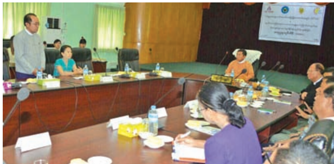
Bago Region receives K100-million fund for disaster preparedness by BFM.

BAGO Region government was provided with a disaster preparedness and response fund yesterday by KBZ's Brighter Future Myanmar Foundation—BFM yesterday.