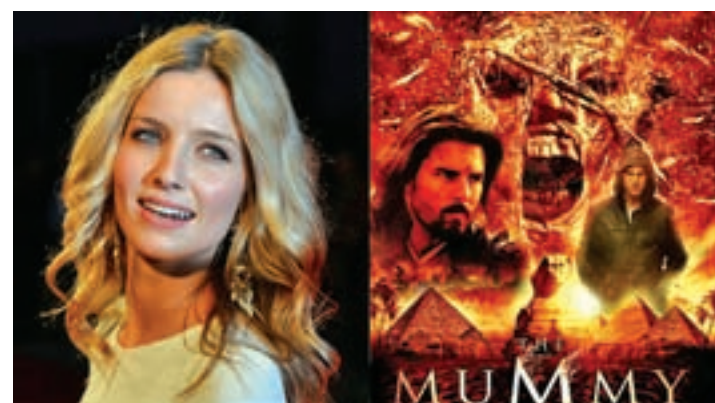
Annabelle Wallis shares picture from the sets of her upcoming movie The Mummy.

Jon Spaihts who has previously wrote the script of films like Prometheus and Doctor Strange is presently working on the script of the film along with JJ Abrams and director Alex Kurtzman.