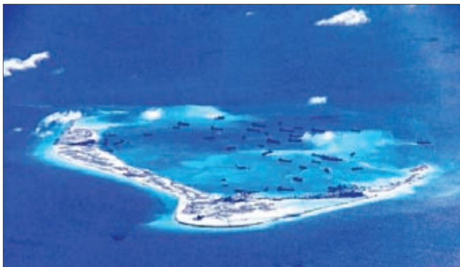
Chinese dredging vessels are purportedly seen in the waters around Mischief Reef in the disputed Spratly Islands in the South China Sea in this still image from video taken by a P-8A Poseidon surveillance aircraft provided by the United States Navy on 21 May 2015.

BEIJING — China's Supreme Court said on Tuesday that people caught illegally fishing in Chinese waters could be jailed for up to a year, issuing a judicial interpretation defining those waters as including China's exclusive economic zones.