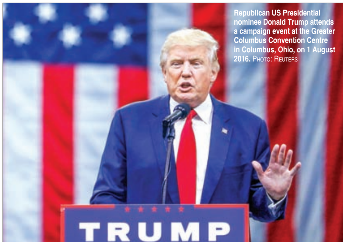
Republican US Presidential nominee Donald Trump attends a campaign event at the Greater Columbus Convention Centre in Columbus, Ohio, on 1 August 2016.