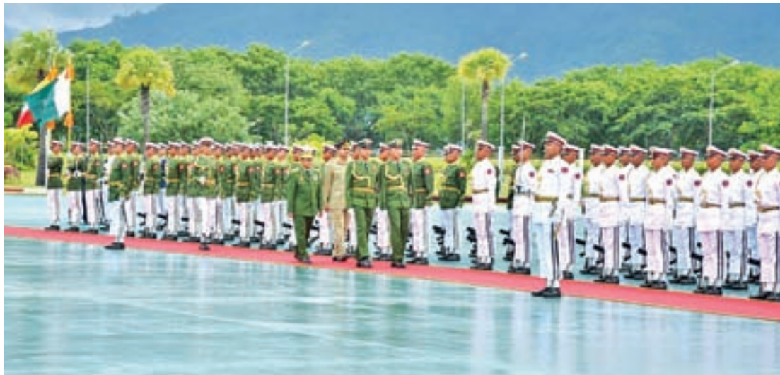
Senior General Min Aung Hlaing and Chairman of Joint Chiefs of Staff Committee of Pakistan General Rashad Mahmood inspect the Guard of Honour.

COMMANDER-IN-CHIEF of Defense Services Senior General Min Aung Hlaing welcomed General Rashad Mahmood, Chairman of the Joint Chiefs of Staff Committee of Pakistan, with a Guard of Honour in Nay Pyi Taw yesterday.