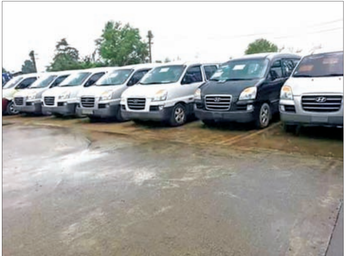
Korean cars on display at a showroom in Mandalay.

“There aren’t that many Korean cars in the market; most are just ordinary vehicle manufac-