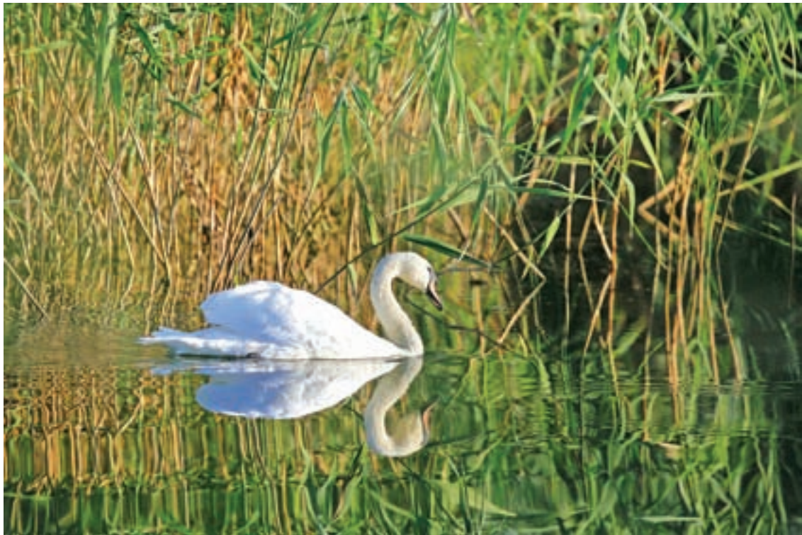
A swan, backdropped by reeds, swims on one of the lakes inside Vacaresti wetlands, in Bucharest, Romania, on 23 July 2016.