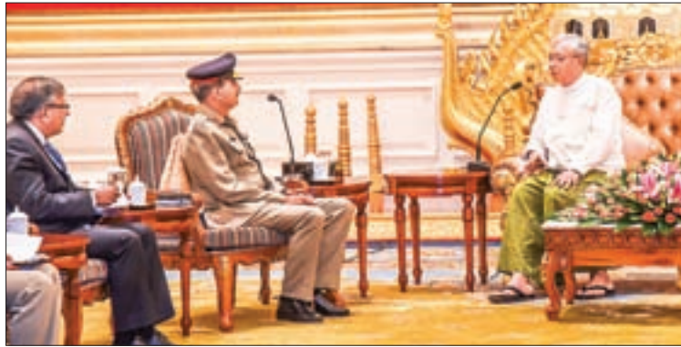
President U Htin Kyaw meets General Rashad Mahmood, Chairman of the Joint Chiefs of Staff Committee of Pakistan.

Also present were Commander-in-Chief of Defence Services Senior General Min Aung Hlaing, Union Minister for Defence Lt-Gen Sein Win, Minister of State for Foreign Affairs U Kyaw Tin and officials.— Myanmar News Agency