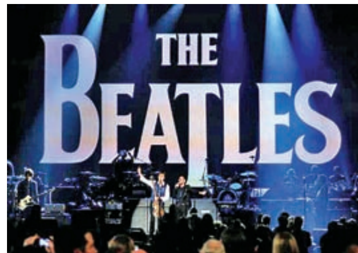
Paul McCartney (L) and Ringo Starr perform during the taping of 'The Night That Changed America: A GRAMMY Salute To The Beatles', which commemorates the 50th anniversary of The Beatles' appearance on the Ed Sullivan Show, in Los Angeles in 1964.

"The transaction will not materially increase Sony's market power vis-a-vis digital music providers compared to the situation prior to the merger," the EU competition enforcer said in a statement. Rival Warner Music Group and independent labels had called the Commission to take a tough line with the deal because they feared it would give Sony too much power.—Reuters