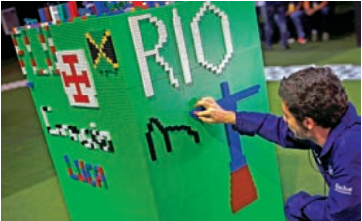
A man arranges LEGO bricks to build a Rio sign during a LEGO presentation of a massive model of the city including the Olympic sites at the Media Centre in Rio de Janeiro, Brazil, on 1 August 2016.

going on. If we did it in one scale the stadium would be that big,” Chrzan said, using his hand to indicate the stadium would be very small. “So, it’s everything that we could fit into the city, in a 5 metre by 6 metre (yard) space.” The structure is composed of roughly 953,000 pieces of Lego, according to Chrzan. Lego, in partnership with the Danish government, created the model as a legacy gift to Rio de Janeiro. —Reuters