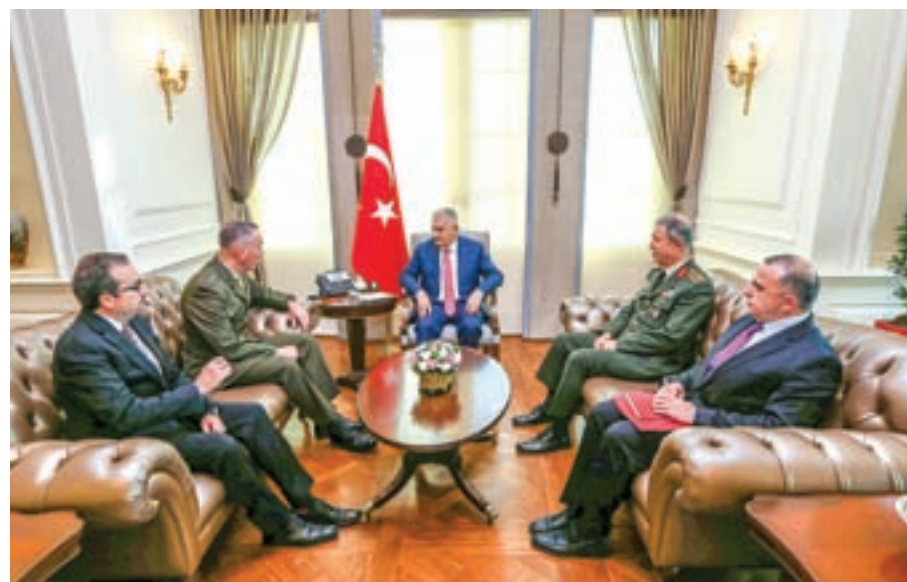
Turkish Prime Minister Binali Yildirim (C), accompanied by Chief of Staff General Hulusi Akar, meets with US Joint Chiefs of Staff General Joseph Dunford in Ankara, Turkey, on 1 August 2016.

More than 60,000 people in the military, judiciary, civil service and education have been detained, suspended or placed under investigation since the coup, prompting fears that Erdogan is cracking down on all