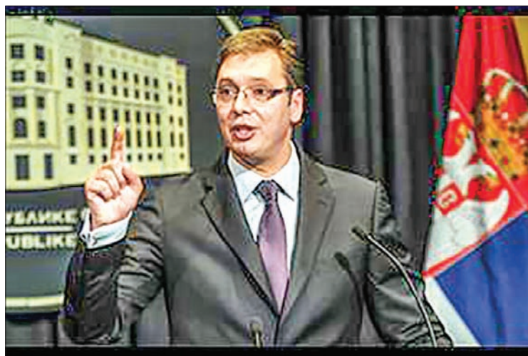
Serbian Prime Minister designate Aleksandar Vucic.

"For me, politics is a matter of results, not love and hate. Whether I love someone or not is not important to me, but whether they are capable of doing something or not. That is because I am not the only one who loves results, everyone loves them. Even more importantly, everyone needs them," Vucic told the Ekspres daily in an