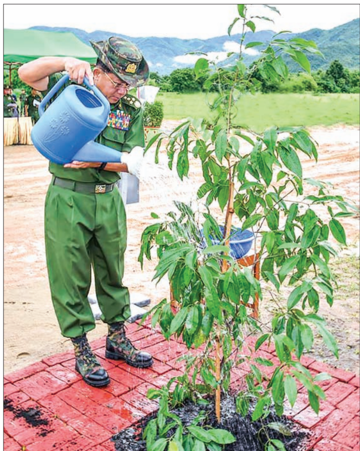
The Senior General pouring water onto a plant.