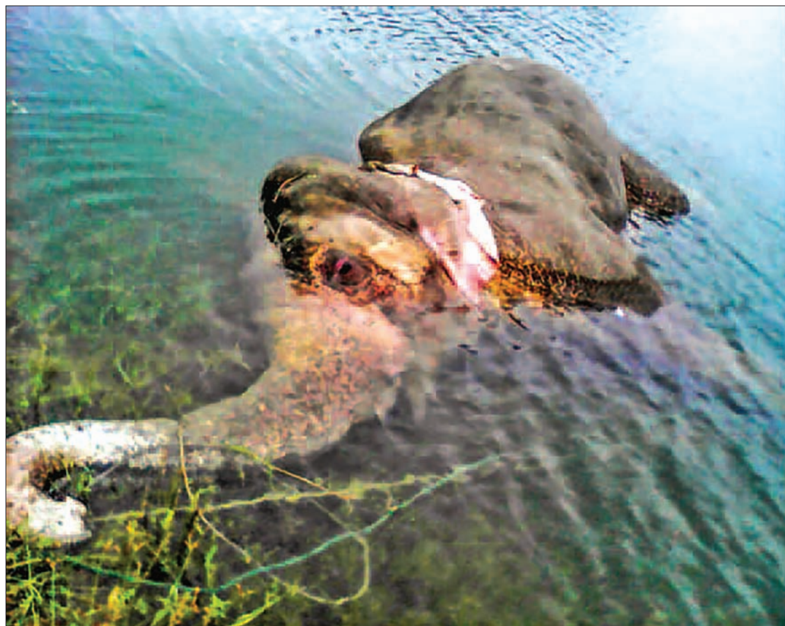
The elephant carcass being seen in the creek.