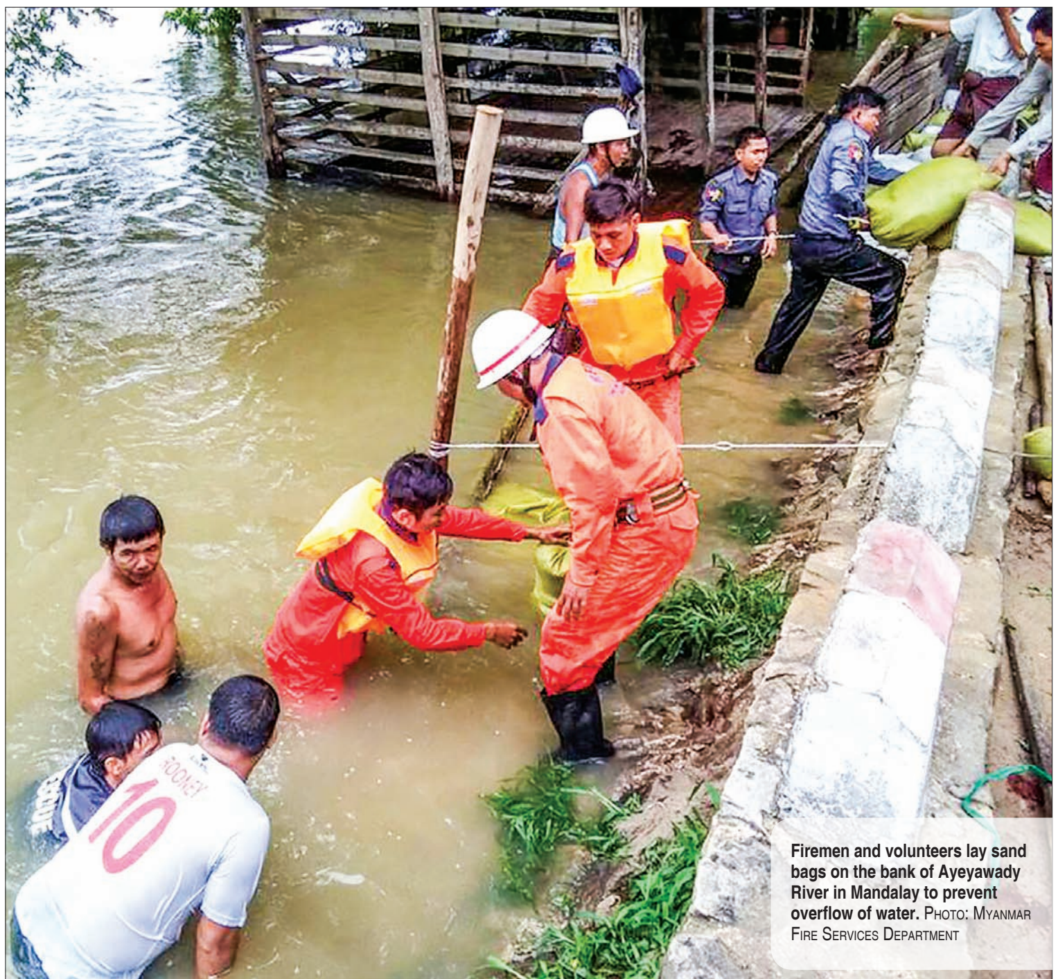
Firemen and volunteers lay sand bags on the bank of Ayeyawady River in Mandalay to prevent overflow of water.