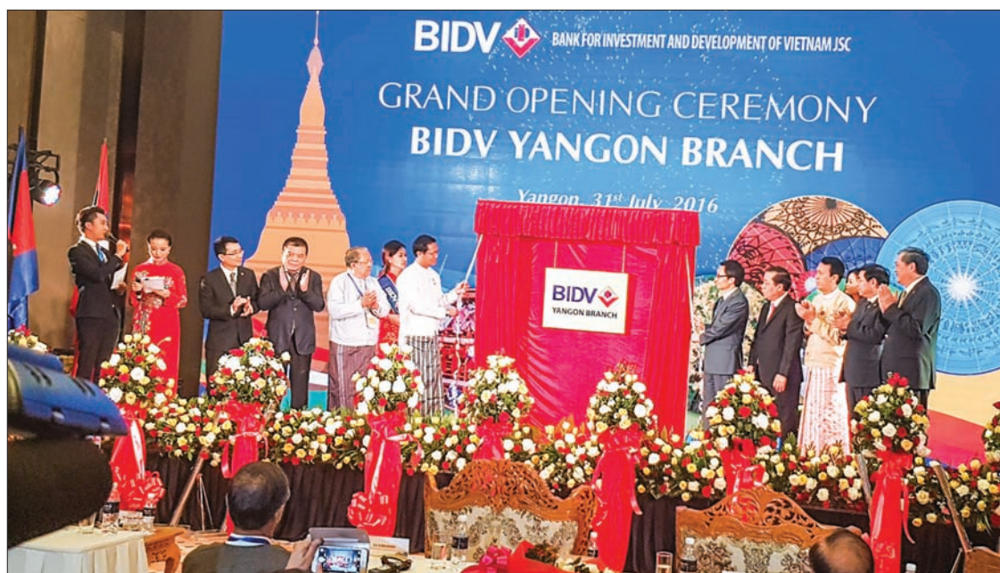
The grand opening ceremony of BIDV Yangon Branch being formally opened by Vice President.