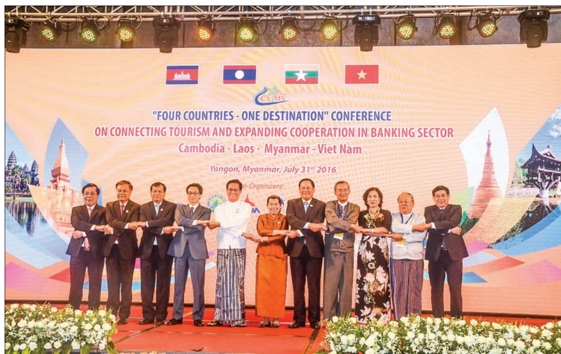
Vice President U Henry Van Thio and representatives from Cambodia, Laos, Myanmar and Viet Nam pose for photos in ASEAN way at “Four Countries, One Destination” conference in Yangon.

Viet Nam has established economic links in trade and tourism with the country for six