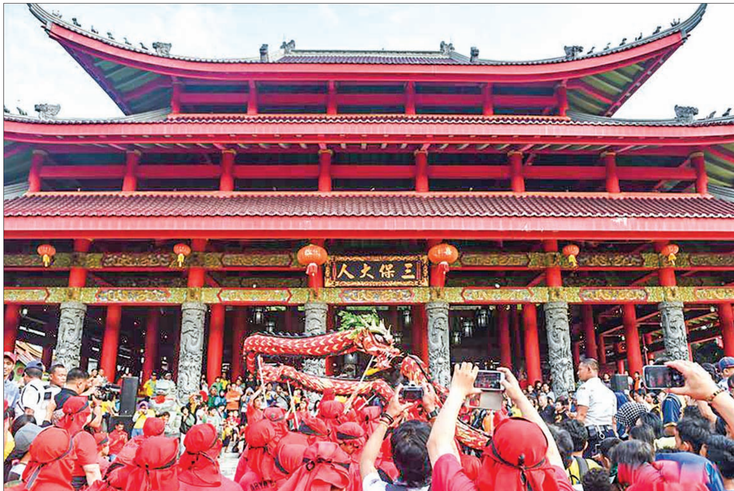
Local people perform dragon dance during a memorial ceremony to commemorate the 611th anniversary of ancient Chinese navigator Zheng He's visit in Semarang, capital city of Central Java Province, Indonesia, on 31 July 2016. Zheng He commanded expeditionary voyages to South-east Asia, South Asia, Western Asia, and East Africa from 1405 to 1433. Semarang is one of several ports in Java visited by him in his seven expeditions to the Western Ocean.