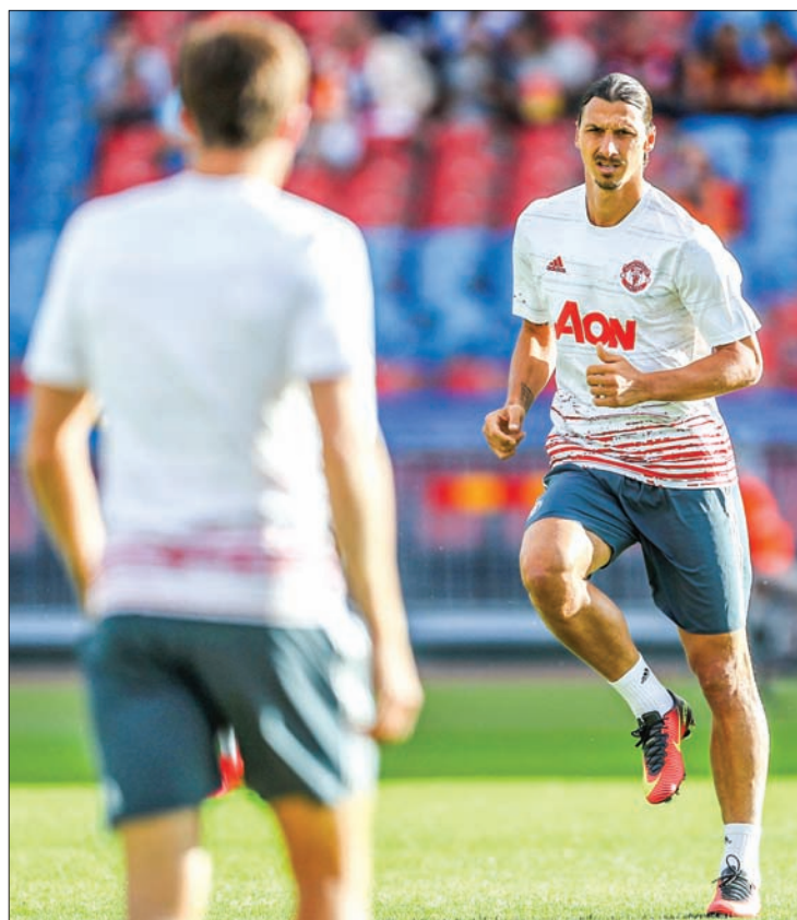
Manchester United's Zlatan Ibrahimovic warms up before the match during Pre Season Friendly at Ullevi Stadium, Goteborg, Sweden on 30 July 2016.

"There is something big on the go, it's going to be very interesting this year. Let us say that if Pogba comes too, it's going to be very interesting," he added with a smile. Galatasaray threatened to spoil Zlatan's party when Sinan Gumus headed the equaliser from