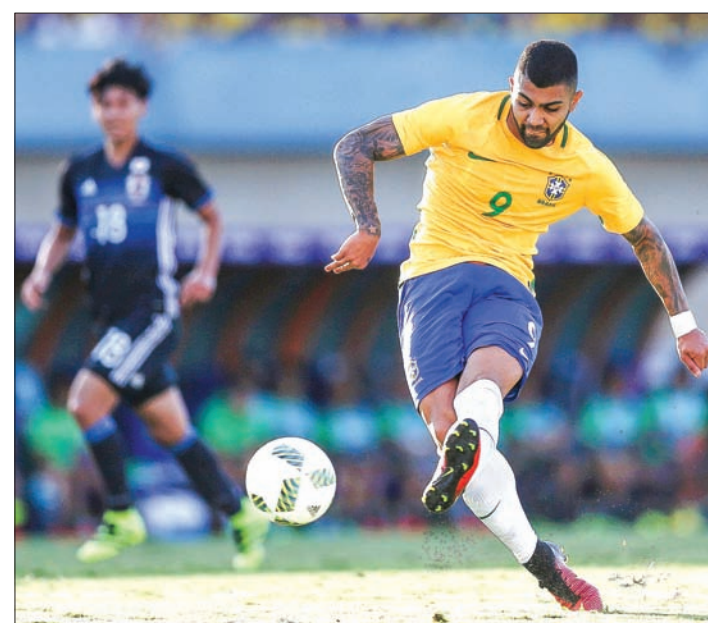
Gabriel Barbosa scores during 2016 Rio Olympics Football friendly at Goiania, Brazil on 30 July 2016.

Brazil face South Africa, Iraq and Denmark in the group stage. —Reuters