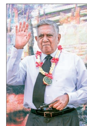
Singapore's President Sellapan Rama Nathan.

After he stepped down as president, he was appointed to senior honorary positions at some local universities.—Kyodo News