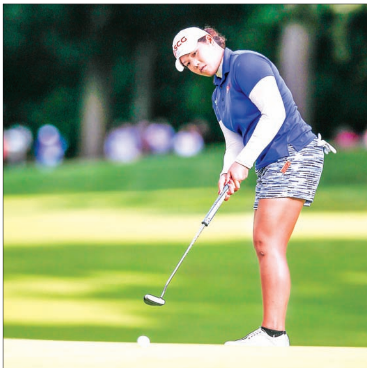
Thailand's Ariya Jutanugarn during her third round during RICOH Women's British Open 2016 at Woburn Golf & Country Club, England on 30 July 2016.

World number one Lydia Ko was down the field on three-under 213. The South Korean-born New Zealander looked as if she might launch a charge with six birdies in nine holes from the eighth but a dou-