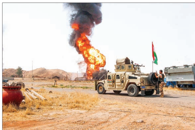
Smoke rises after an attack at Bai Hassan oil station, northwest of Kirkuk, Iraq, on 31 July 2016.

KIRKUK, (Iraq) — Militants stormed two energy facilities in northern Iraq on Sunday, shooting at least four workers and detonating explosives that sent flames into the sky, security sources said.