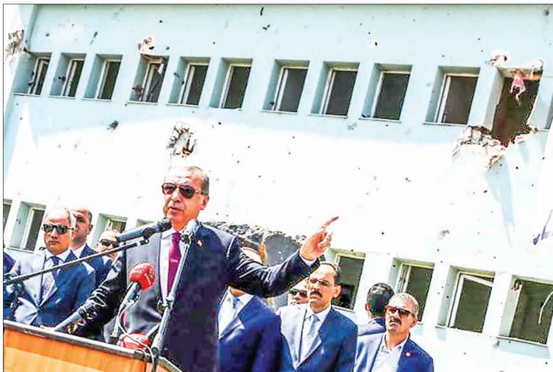
Turkey's President Tayyip Erdogan addresses the audience as he visits the Turkish police special forces base damaged by fighting during a coup attempt in Ankara, Turkey, on 29 July 2016.

ple in the military, judiciary, civil service and schools have been either detained, removed or suspended over suspected links with Gulen. Turkey's Western allies condemned the attempted coup, but have been rattled by the scale