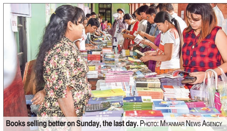
Books selling better on Sunday, the last day.

As the last day coincided with the holiday yesterday, the bookshops saw more visitors than the two previous days.— Myanmar News Agency