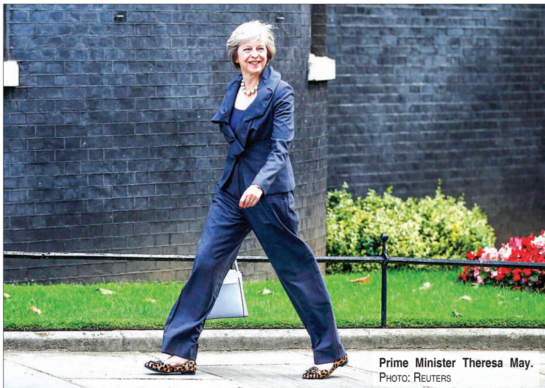
Prime Minister Theresa May.