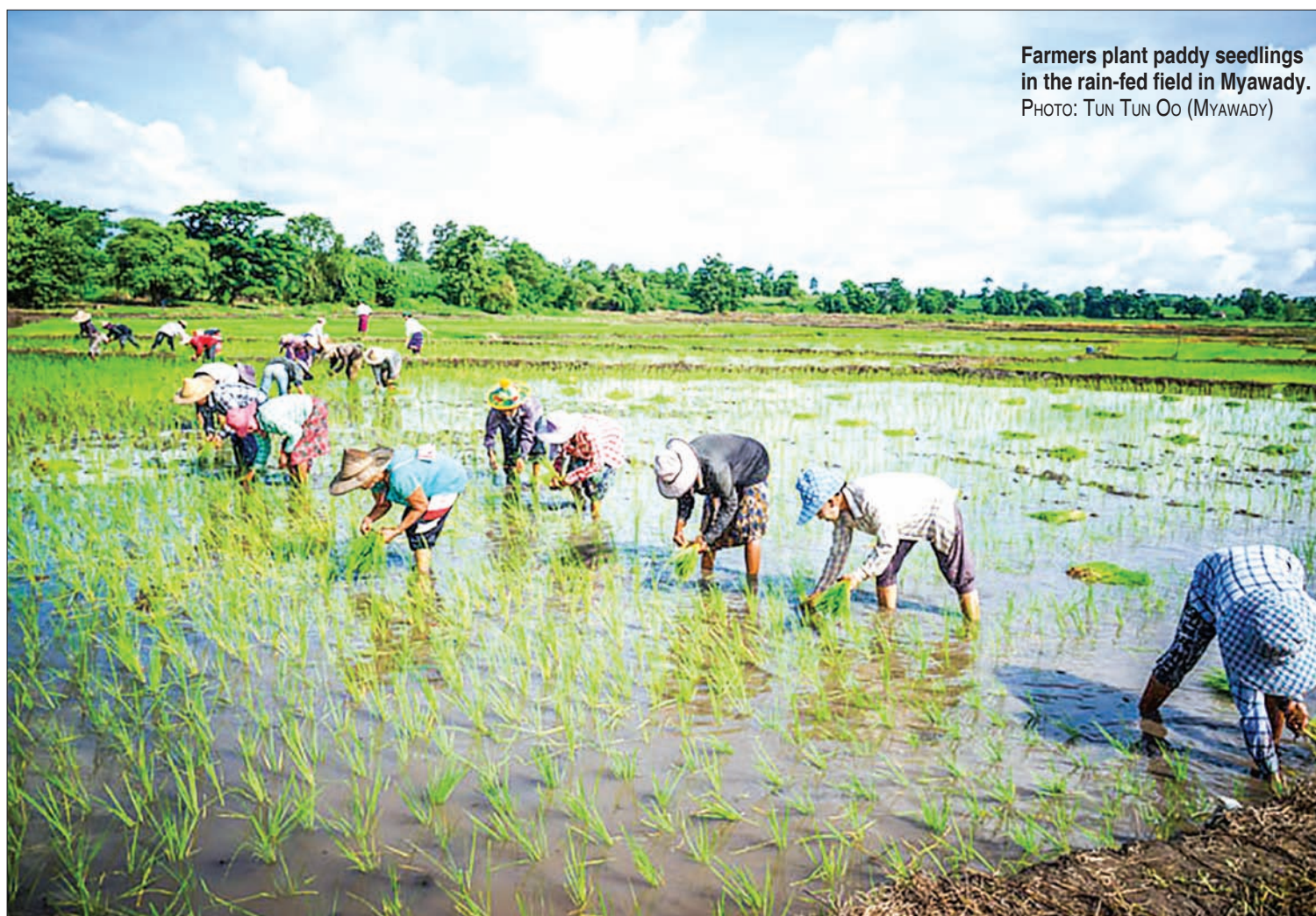
Farmers plant paddy seedlings in the rain-fed field in Myawady.

However, European companies have planned to open car showrooms in Myanmar to penetrate Myanmar's auto market. Only Japan companies will make investment in establishing the auto manufacturing companies starting from 2017. —200