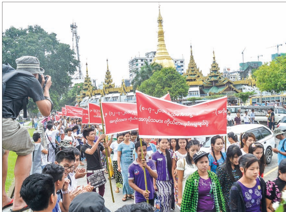
Workers seen participating in a protest against election of representatives to the arbitration council and arbitration body.

The arbitration council was formed in 2012 with five representatives each of the employers, workers and the government. Representatives are elected every two years, with the July election as its third. A total of 500 workers took part in the demonstration.—Myanmar News Agency