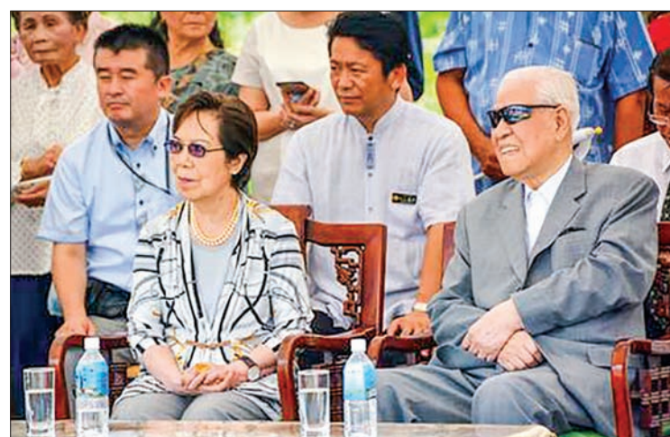
Former Taiwanese President Lee Teng-hui (R front) and his wife Tseng Wen-hui (L front) visit a monument on 30 July, 2016, on the island of Ishigaki in Okinawa Prefecture that honours Taiwanese farmers who emigrated to the island before World War II. Lee, 93, began a five-day visit to Okinawa the same day, making his first overseas trip since suffering a minor stroke in late 2015.

It is Lee's eighth visit to Japan after 12 years as president. As Taiwan's first directly elected president, Lee led the self-governed island from January 1988 to May 2000.—Kyodo News