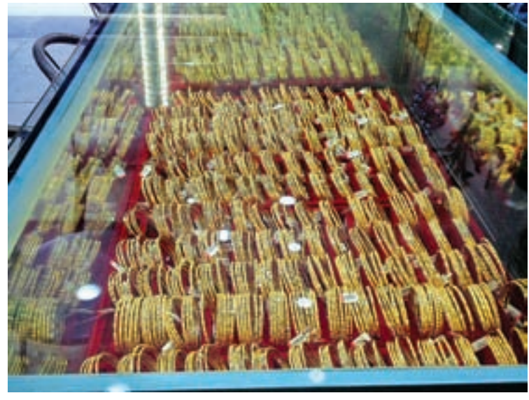
Gold and jewelleries waiting for the buyers.

market, according to the gold merchants.