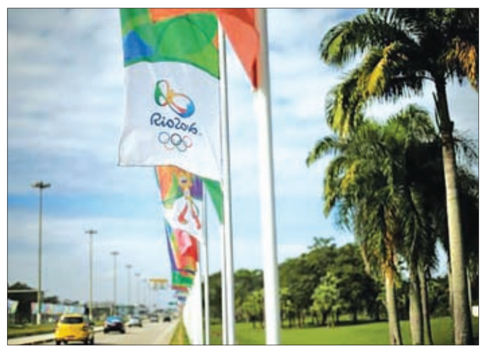
Flags with welcome messages in several languages advertising the 2016 Rio Olympics are pictured on Rio de Janeiro's international airport driveway, Brazil, on 28 June, 2016.

"The company will be fined for its incompetence and irresponsibility," Moraes said. "But the Games