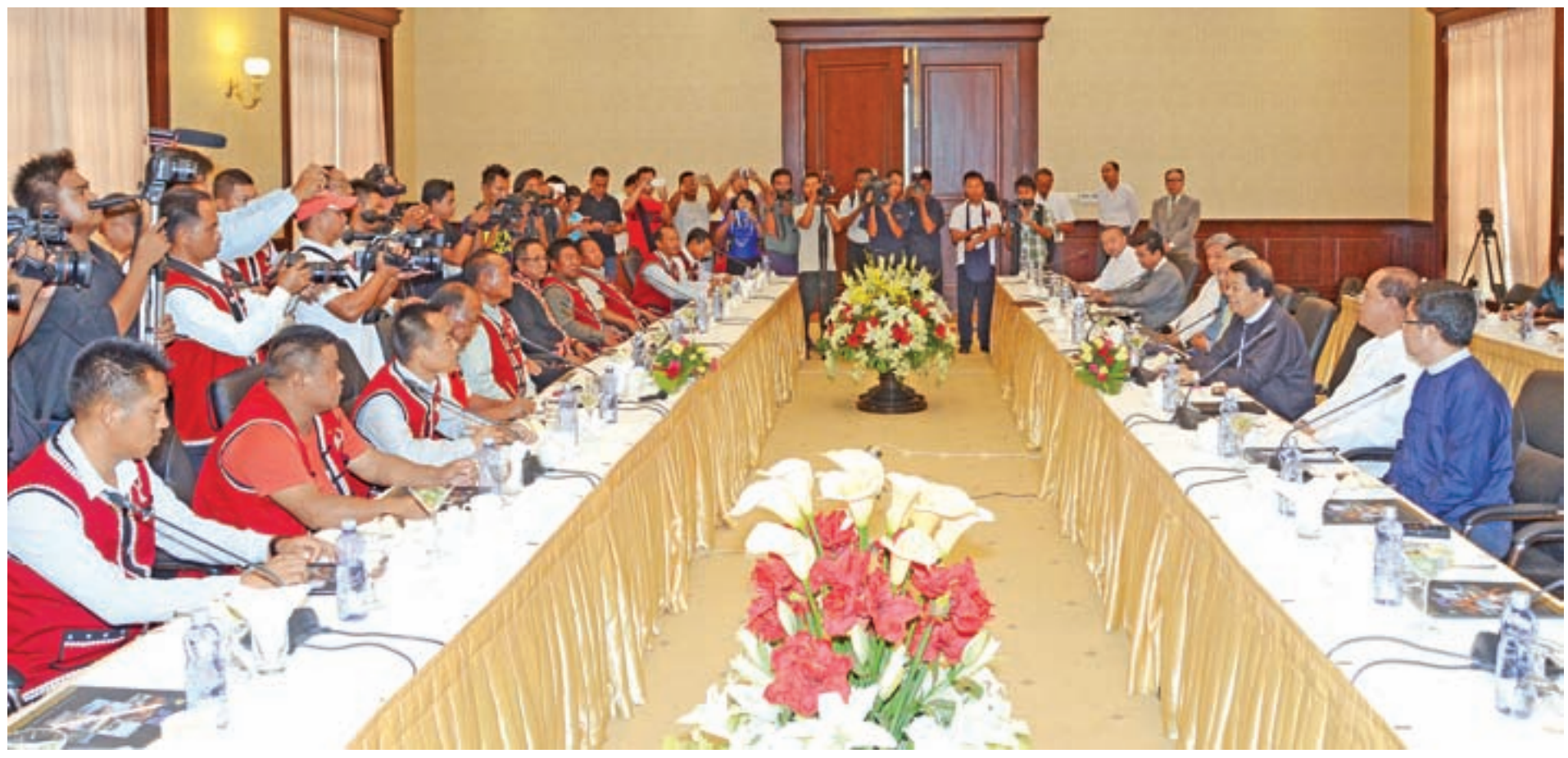
Peace Commission, chaired by Dr Tin Myo Win, meeting members of United Wa State Party in Nay Pyi Taw.

THE Peace Commission, chaired by Dr Tin Myo Win, and the United Wa State Party, led by Deputy Secretary-General U Pao Yu Yi, held a meeting in Nay Pyi Taw yesterday.