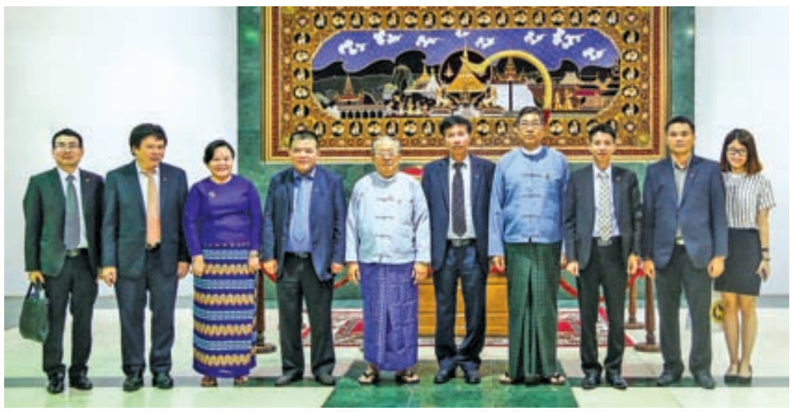
H.E. U Kyaw Kyaw Maung, Governor of the CBM, warmly welcomes Mr. Tran Bac Ha and BIDV Senior Delegation in the CBM's Office in Nay Pyi Taw.

BIDV was honored to be granted the foreign bank branch license by the Central Bank of Myanmar following a preliminary approval announcement dated 4 March 2016. Within only four months from the approval date, BIDV fully completed all the requirements to be granted the license on 30 June 2016 by the Central Bank of Myanmar and commenced the Branch's operation in July this year, setting a record in preparation time among 13 foreign banks licensed in both 2014 and 2016. This achievement was appreciated by the Government and the ASEAN, Japan, Korea, and Tai-