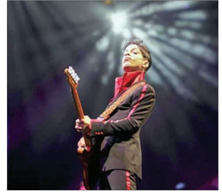
US musician Prince performs on stage at Yas Arena in Yas Island, Abu Dhabi, United Arab Emirates in 2010.

If Prince also left no will and no surviving offspring of his own, as appears to be the case,