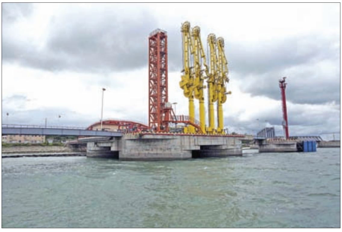
A jetty for oil tankers is seen in Kyaukpyu township, Rakhine state in October 2015.