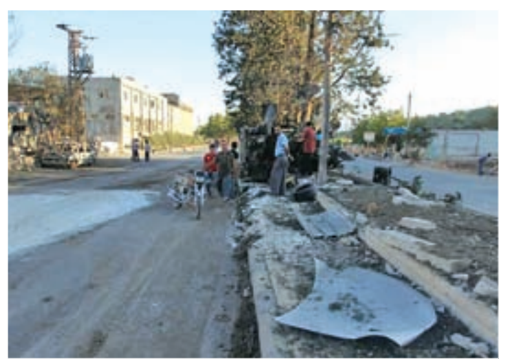
People inspect the damage as they stand near a Save the Children sponsored maternity hospital after an airstrike in the rebel-controlled town of Kafer Takhareem in IdlibProvince, Syria on 29 July, 2016.

The hospital in Kafer Takhareem, the only maternity facility for about 70 miles (110 km), works with around 1,300 women and children a month and delivered some 340 babies last month, the spokesman said. In another part of the northern Idlib countryside, air strikes on Friday killed at least five people and seriously injured more than 25, the Observatory said.—Reuters