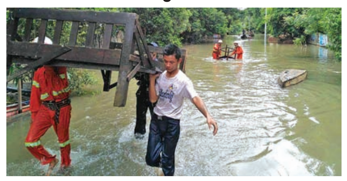
People moving furniture away from the flooded area.

LOCAL authorities, volunteers and the Mandalay Fine Service Department have been teaming up to prevent possible flooding as the water level of the Ayeyawady River exceeded its danger level two days ago.