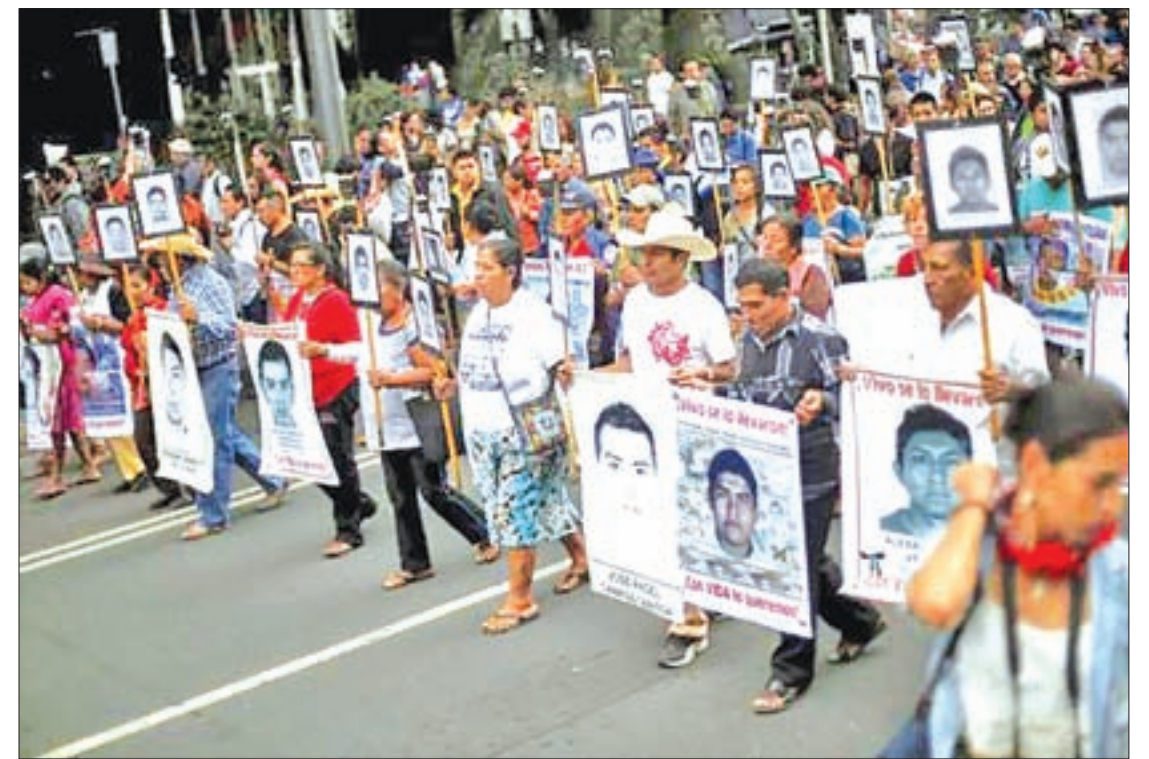
Relatives of the 43 missing students from the Teacher's Training College Ayotzinapa Raul Isidro Burgos take part in a march to protest against the government's handling of the investigation in the case of 43 students, to mark the 19-month anniversary of their disappearance, in Mexico City, Mexico, on 26 April 2016.

MEXICO CITY — Mexico agreed on Friday to let the Inter-American Commission on Human Rights (IACHR) again monitor its widely criticized investigation into the disappearance and probable massacre of 43 students in 2014. After almost three months of dialogue, the government and the IACHR agreed that the commission can send two technical advisers who will visit Mexico as needed to review the investigation, the IACHR said in a statement. Starting last year, a group of international experts backed by the IA-CHR exposed serious flaws in the Mexican attorney general's probe of the students' disappearance in September 2014 in the southern state of Guerrero.