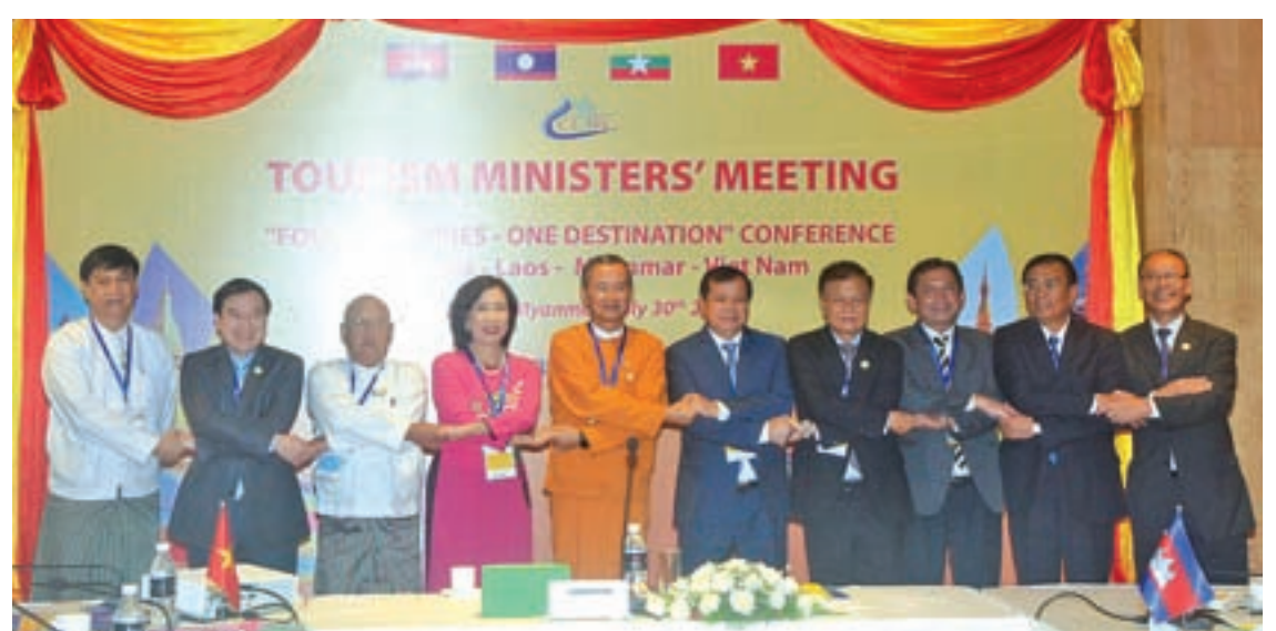
Tourism ministers and senior officials posing for a group photo at the Four Countries, One Destination Conference.

Myanmar hosted the twoday conference with the aim of promoting cooperation in tourism and the banking sectors with an eye to inviting more foreign investment.—Myanmar Agency