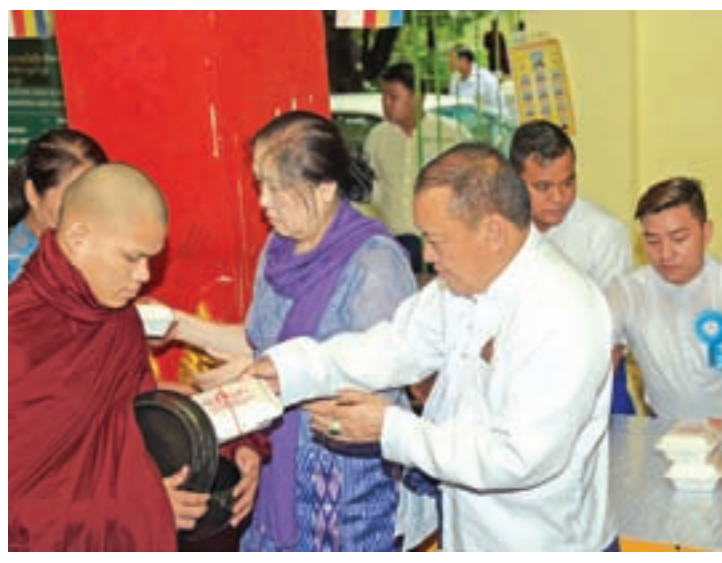
KBZ Bank's 14th Waso robe offering ceremony in progress.

The congregation donated waso robes to the Members of the Sangha and shared the merits thus gained.